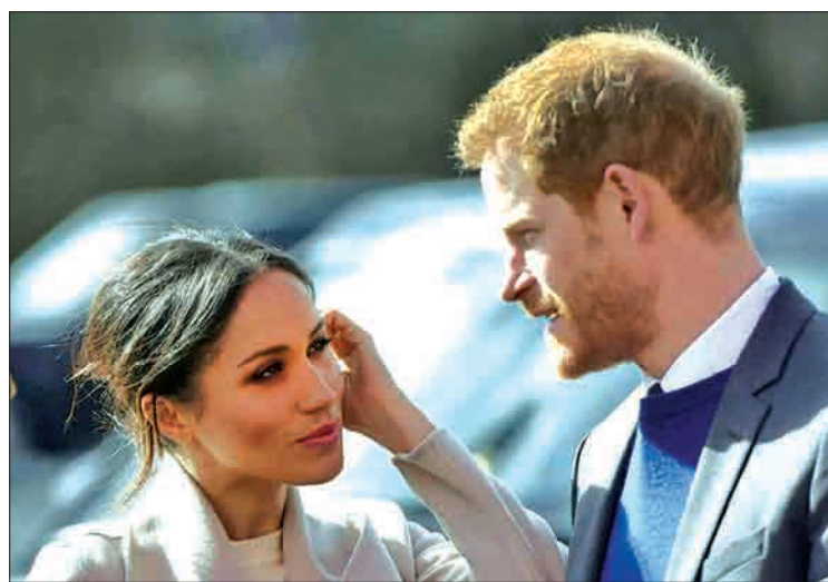
Britain's Prince Harry and Meghan Markle will get married in Windsor on 19 May.

Founded in 1983 as a niche group with only a handful of members, Republic was officially incorporated as a campaign group in 2006. Today they claim a 40,000-strong following which has the forthcoming fuss over