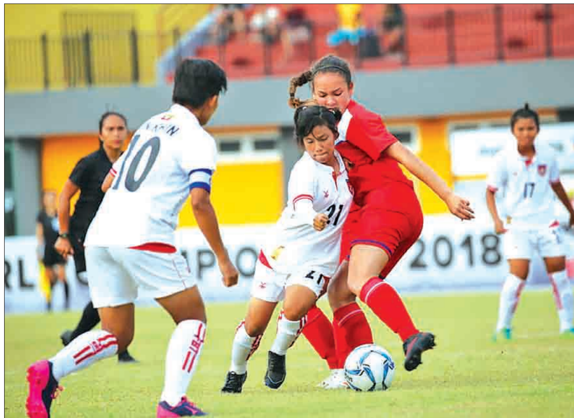
Girls from Myanmar (white), the Philippines (red) vie for the ball in yesterday's Group play of AFF U 16 Championship at Athletic Jaka Baring 1 Stadium in Palembang, Indonesia.

tics in the second half, with the Philippines girls speeding up in wing field play and creating some chances, but the Myanmar defensive line was too clever and blocked every ball.