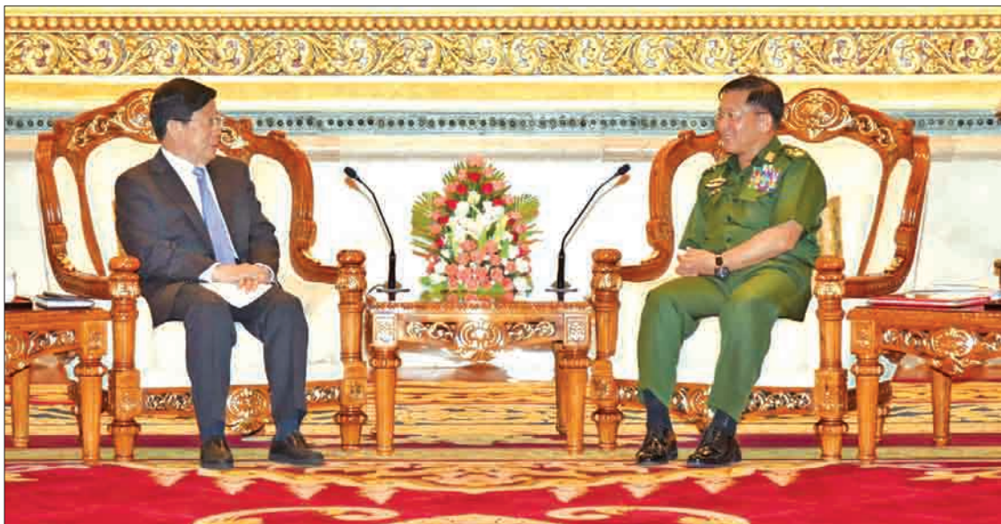
Senior General Min Aung Hlaing holds talks with Zhao Kezhi, member of the CPC Central Committee and Minister of Public Security, in Nay Pyi Taw yesterday.