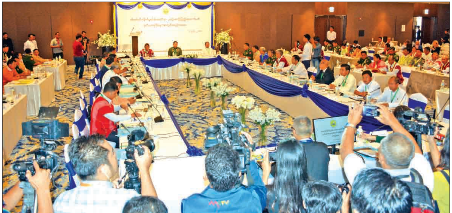
The second day of Joint Monitoring Committee meeting held in Yangon.

tended by chairmen and members of JMC-U, Joint Monitoring Committee at Region and State Levels (JMC-S), JMC-L and members of technical assistance offices of the JMCs,