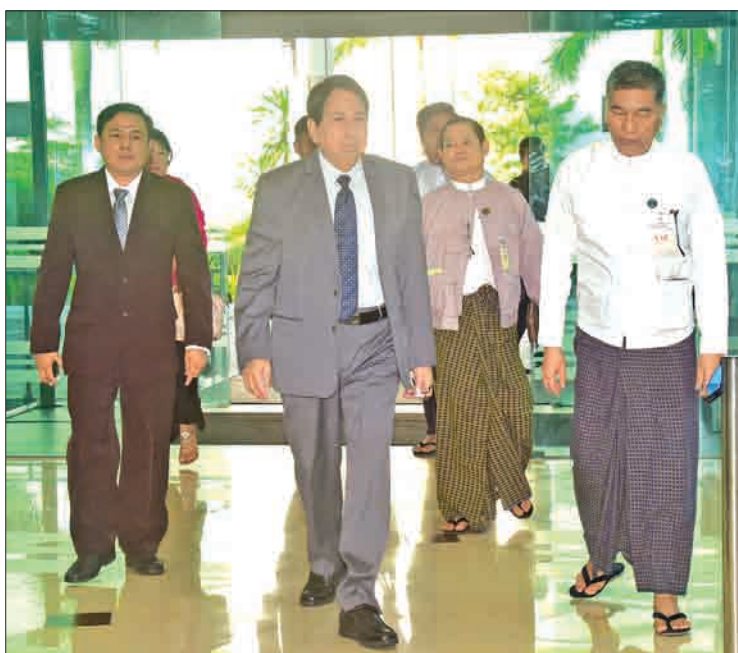
Officials see off Union Minister Dr. Pe Myint at Yangon International Airport yesterday.

The delegation led by the union minister was seen off at Yangon International Airport by officials from the Ministry of Information.—MNA ■