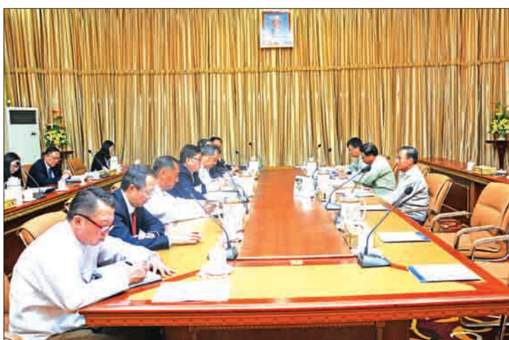
Union Minister U Ohn Win holds talks with China Huaneng Group Co. Ltd. Chairman Yuan Xianghua in Nay Pyi Taw.

During the meeting, they exchanged views and discussed matters related to the hydroelectric production capacity of Myanmar, especially prospects to generate hydroelectric power on Shwe Li River, and the environmental and social impact assessments for the production of hydropower.—MNA ■