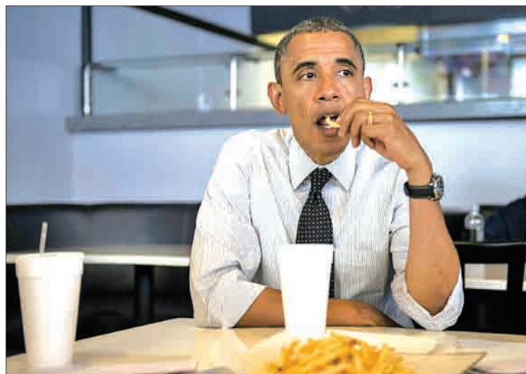
The calorie-labeling rules were a controversial provision of former president Barack Obama's signature 2010 health care law.

A number of public health advocacy groups as well as the National Restaurant Association