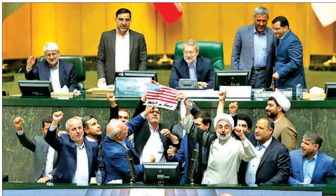
A handout picture from the Iranian Parliament shows MPs preparing to burn a US flag in the parliament’s chamber in Tehran on 9 May, 2018.

Iranian officials have condemned Trump’s decision to pull out of the 2015 deal, which had lifted sanctions in exchange for curbs to Iran’s nuclear programme.—AFP ■