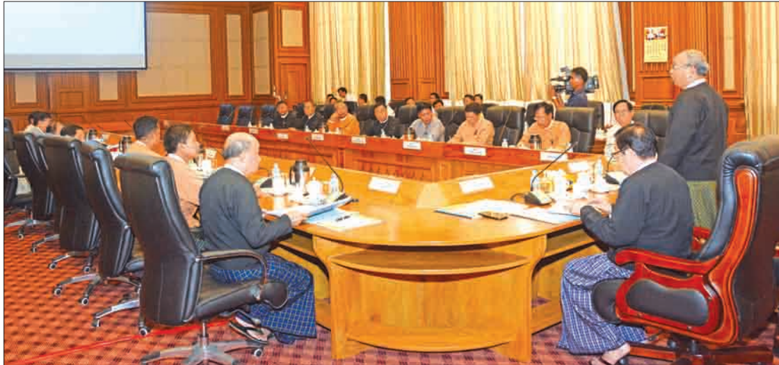
Pyidaungsu Hluttaw Speaker Mahn Win Khaing Than delivers the opening speech at the MPU meeting in Nay Pyi Taw yesterday.

The aim of the formation of the committee is to help region and state Hluttaws, not to influence them, said Speaker Mahn Win Khaing Than.