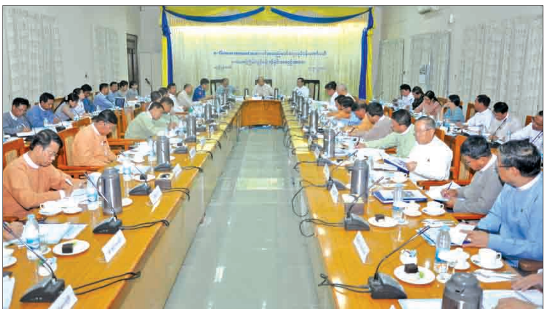
The first coordination meeting for e-Government implementation held in Nay Pyi Taw.

Also present at the meeting were Directors-General, Deputy-Directors General and other officials.—Myanmar News Agency ■