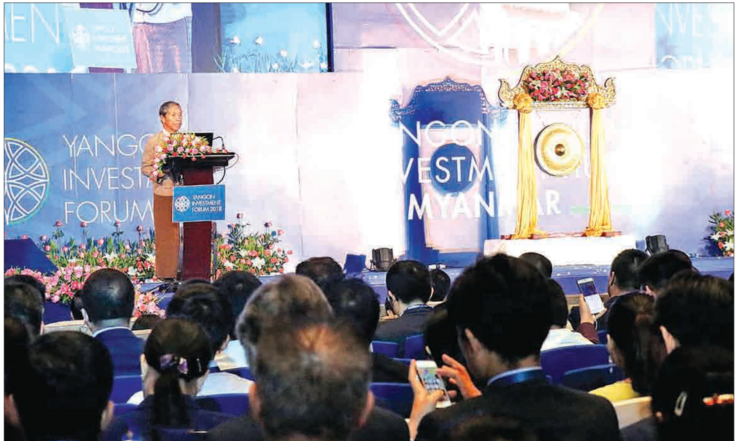
U Kyaw Win, chairman of the Myanmar Investment Commission and Union Minister for Planning and Finance, addresses the Yangon Investment Forum at the Novotel Yangon Max Hotel yesterday.

Due to limitation of space we are only able to publish "Letter to the Editor" that do not exceed 500 words. Should you submit a text longer than 500 words please be aware that your letter will be edited.