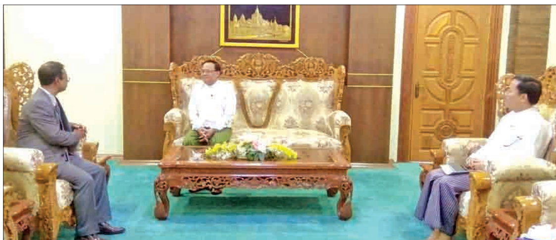
Union Minister U Kyaw Tin receives Mr. Manjurul Karim Khan Chowdhury, Ambassador of People's Republic of Bangladesh to Myanmar, on Tuesday in Nay Pyi Taw.

The Union Minister also informed the Ambassador that a total of 368 people of Rakhine/ Mro / Khami / Daingnet ethnic origin, who are believed to be Bangladeshi citizens, have entered from Bangladesh into Myanmar during the past few