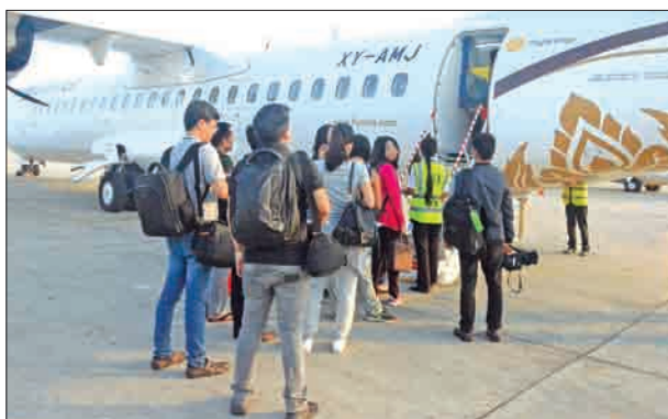
Journalists and officials from the Ministry of Information seen at Yangon International Airport.