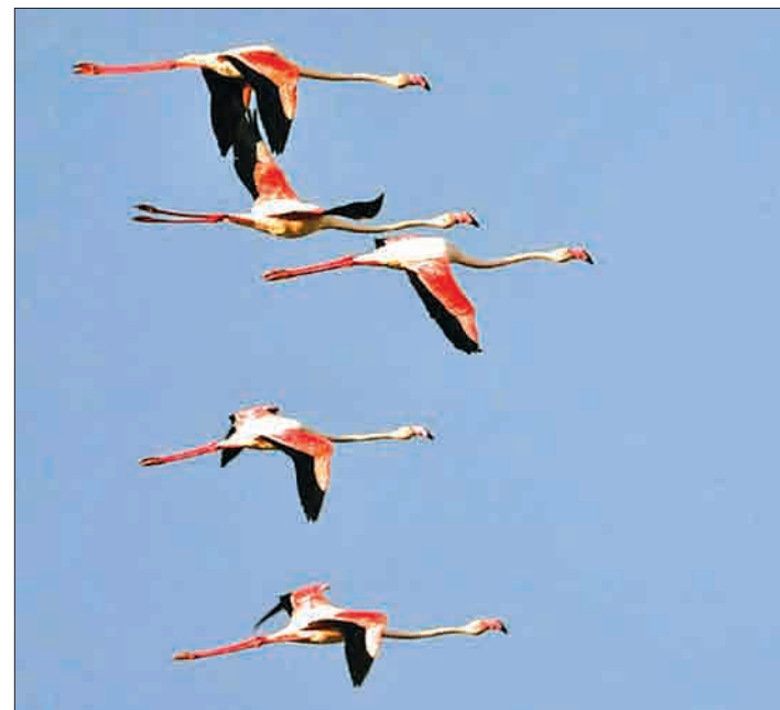
The new study explains the behaviour of not only migratory birds, but also that of sedentary or "resident" ones.

It could also be useful in predicting the future movements of other animals — to determine how they might migrate in response to global warming, for example.—AFP ■