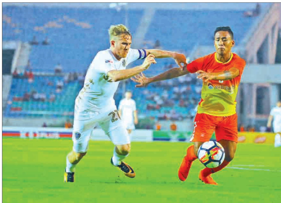
The Leeds United (white) battles for the ball with MNL All Stars (orange) in yesterday's friendly match at Thuwunna Stadium in Yangon.

Leeds United then went on the attack and equalised with a penalty shot goal at the 26-minute mark by its brilliant midfielder