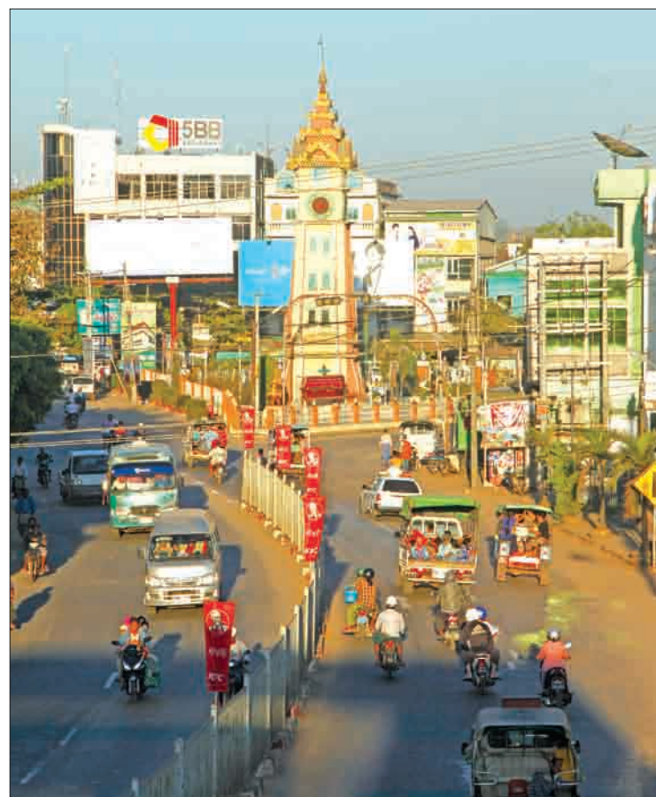
Some 78 foreign businesses are being executed in the Bago Region, with an estimated capital of some $1.58 billion.

According to the new Myanmar Investment Law, region and state DICA offices are authorised to grant approval to investment proposals with capital not exceeding $5 million (Ks6,000 million), with the aim of facilitating the verification process of investment projects.—Tin Soe (Bago) ■