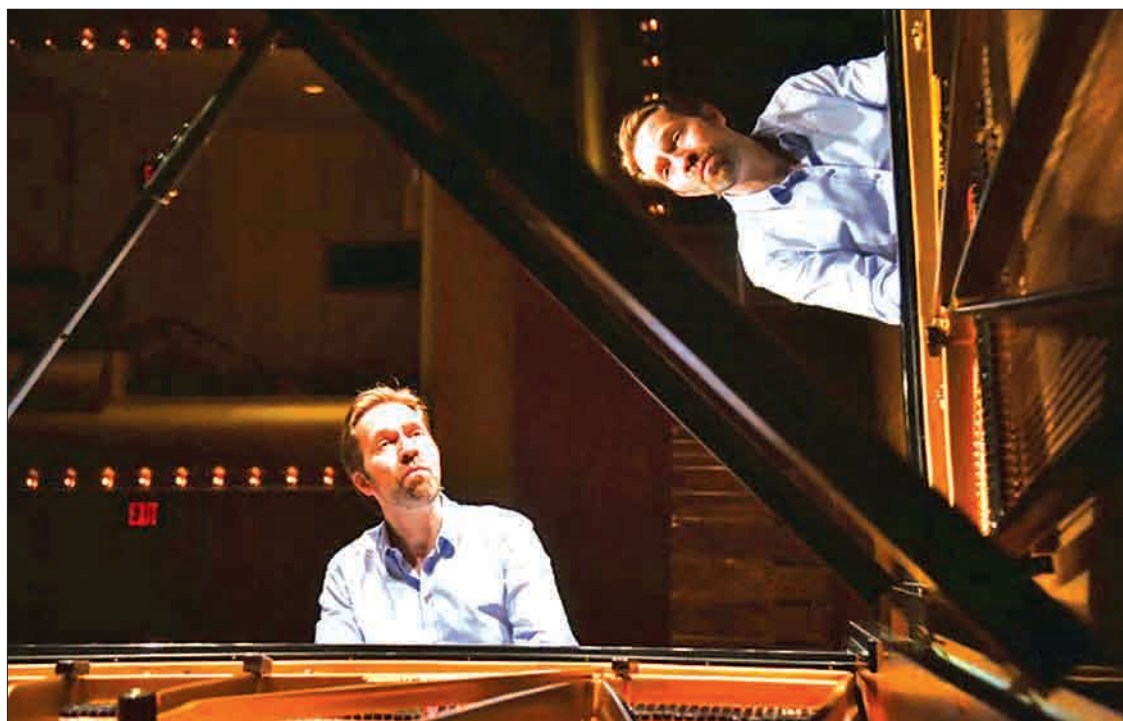
Norwegian virtuoso Leif Ove Andsnes, seen here at the piano in Lincoln Centre's David Geffen Hall on 2 May, 2018, tackles Chopin's famous Ballades in his latest CD.

"The problem with recording is that you're always thinking about how you did things and