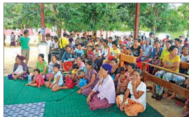
The residents sheltering at the church in Tanphaye Myitson Village who fled their homes.