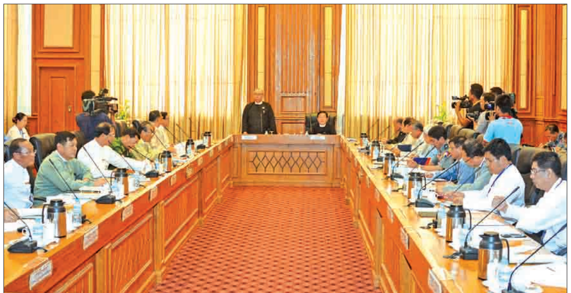
Speaker of Pyidaungsu Hluttaw Mahn Win Khaing Than addresses the coordination meeting of the central committee and work committees of the Hluttaw yesterday in Nay Pyi Taw.

The meeting ended with concluding remarks by the Pyithu Hluttaw Speaker and Pyidaungsu Hluttaw Speaker.—Myanmar News Agency