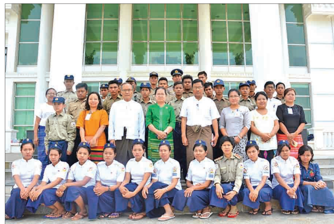
Myanmar Red Cross Society.