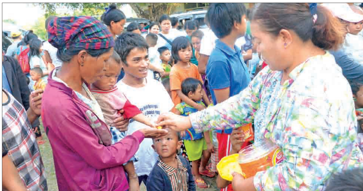
The residents seen at the Kawakha Village in Naungnan Village-tract who fled their homes.