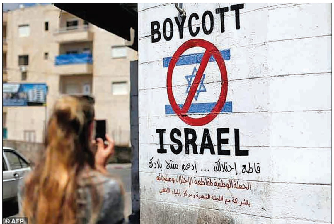
Israel accused Human Rights Watch's local director of supporting the campaign to boycott the country.

Israeli officials have clamped down on groups seen as supporting the global campaign for BDS (boycott, divestment and sanctions), which aims to pressure Israel to end its occupation of the Palestinian territories. HRW has written several critical reports about the Israeli occupation of the Palestinian territories.