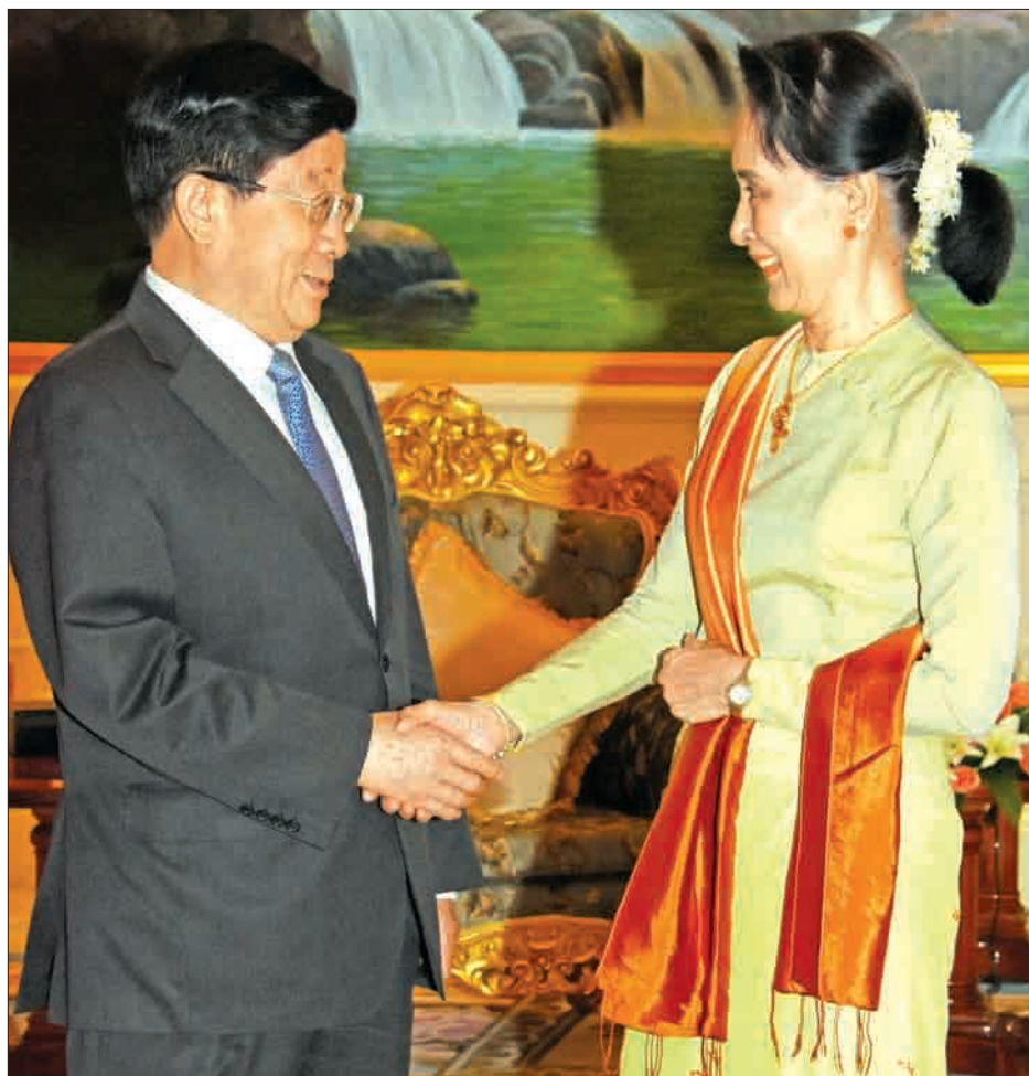
State Counsellor Daw Aung San Suu Kyi welcomes Mr. Zhao Kezhi, Member of the CPC Central Committee and Minister of Public Security of China, in Nay Pyi Taw yesterday. (NEWS ON PAGE-1)