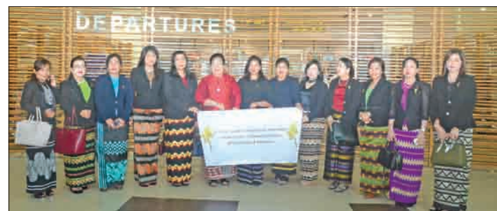
Women entrepreneurs delegation poses for the photo before departure for Bangkok at Yangon International Airport.

The Myanmar women's delegation will attend the annual meeting of AWEN and the ASEAN Outstanding Women Entrepreneurs Award Ceremony, which will be held on 10 and 11 May at the Department of Social Development and Welfare's Building in Bangkok, Thailand, and receive the ASEAN Outstanding Women Entrepreneurs Award.—Myanmar News Agency ■