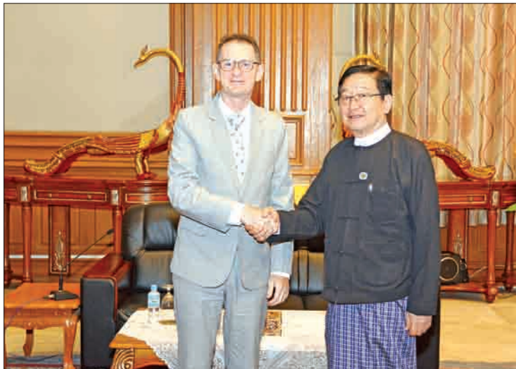
Pyithu Hluttaw Speaker U T Khun Myat welcomes Australian Ambassador in Nay Pyi Taw yesterday.

Present at the meeting were Pyithu Hluttaw Deputy Speak-