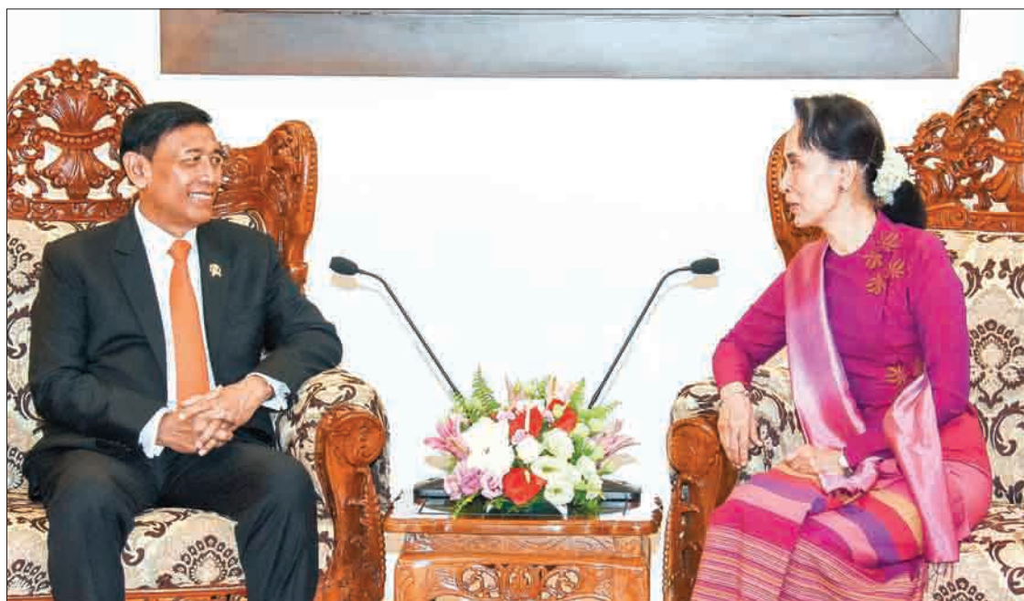
State Counsellor Daw Aung San Suu Kyi meets with Indonesian Coordinating Minister for Political, Legal and Security Affairs Dr. H. Wiranto in Nay Pyi Taw yesterday.