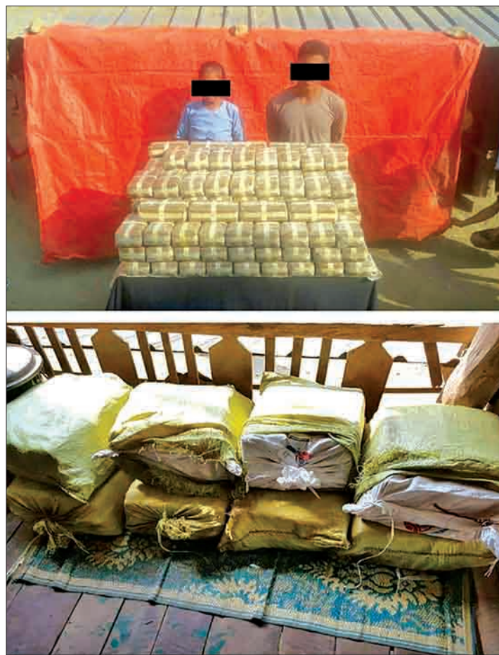
The two suspects and seized stimulant tablets.