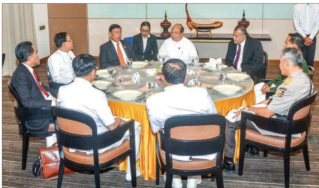
Indonesian Coordinating Minister Dr. H. Wiranto and his delegation attend a working lunch hosted by Union Minister U Thaung Tun in Nay Pyi Taw yesterday.