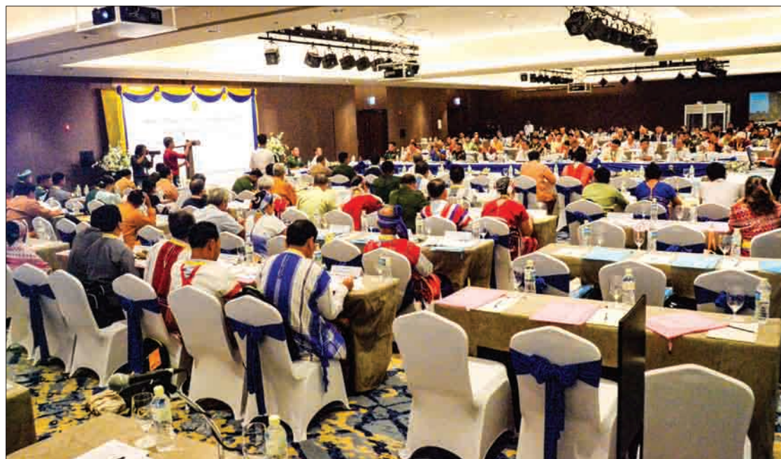
Second general meeting of the Joint Monitoring Committees (JMCs) on Ceasefire held in Yangon yesterday.