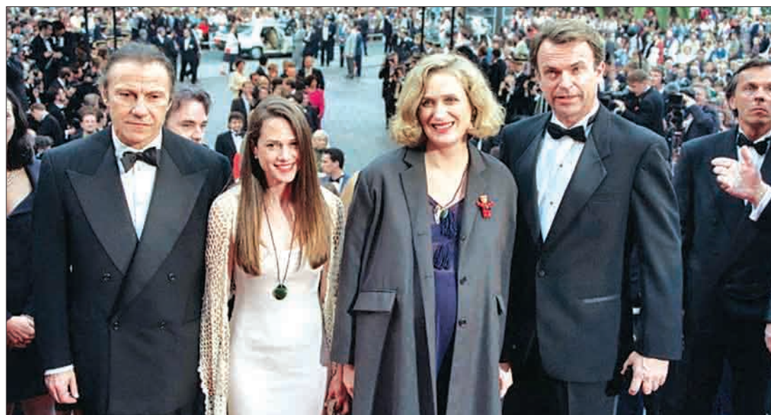
New Zealand film director Jane Campion (2 nd R) accompanied by (from L), Harvey Keitel, Holly Hunter, and Sam Neill, arrives, for the screening of her film "The Piano" at the 1993 Cannes festival.