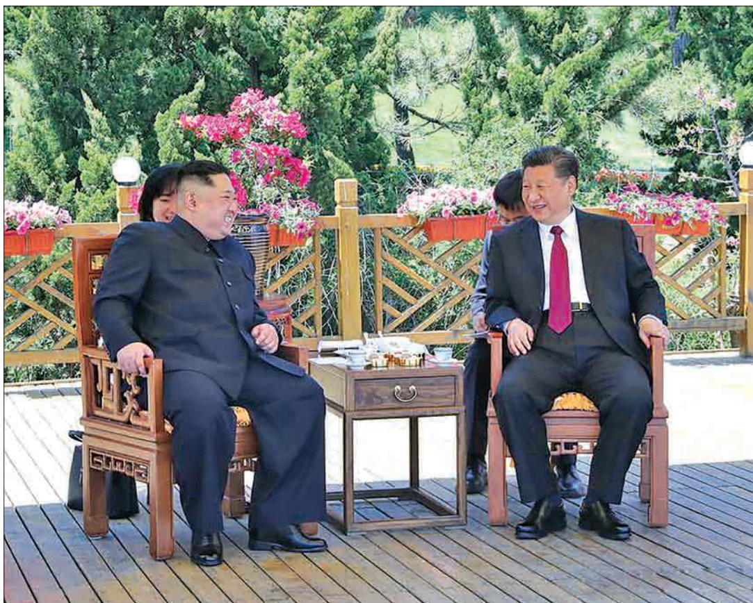
Xi Jinping (R), general secretary of the Central Committee of the Communist Party of China (CPC) and Chinese president, holds talks with Kim Jong Un, chairman of the Workers' Party of Korea (WPK) and chairman of the State Affairs Commission of the Democratic People's Republic of Korea (DPRK), in Dalian, northeast China's Liaoning Province on 7-8 May.

Xi held talks with Kim and hosted a welcome banquet for him. Together, they also took a stroll and attended a luncheon. In a cordial and friendly atmosphere, the top leaders of the two parties and the two countries had an all-round and in-depth exchange of views on China-DPRK relations and major issues of common concern.—Xinhua