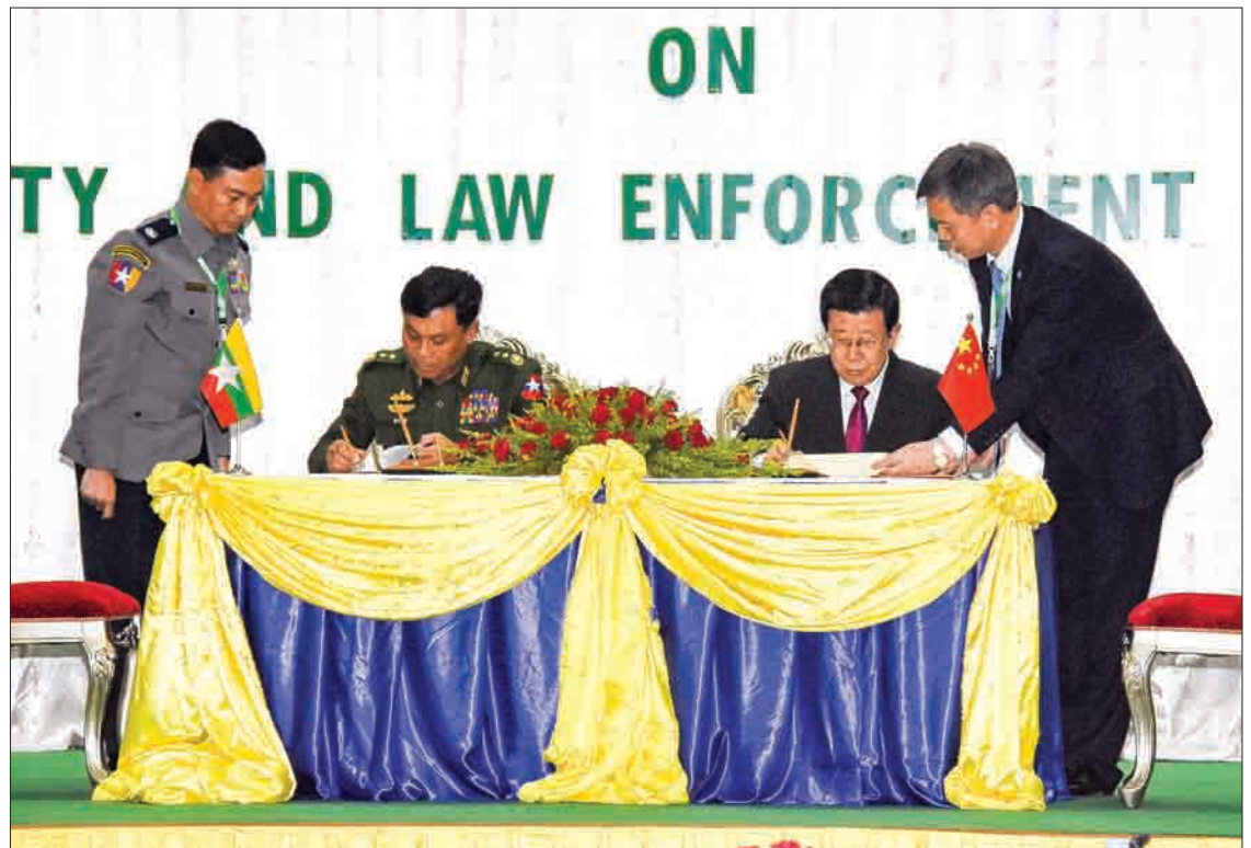
Memorandum of Understanding (MOU) signing ceremony between the Ministry of Home Affairs and China in Nay Pyi Taw yesterday.

Later, Zhao Kezhi donated drug-detecting devices and applications worth 14.4 million yuan, police equipment worth 5 million yuan, and police ve-