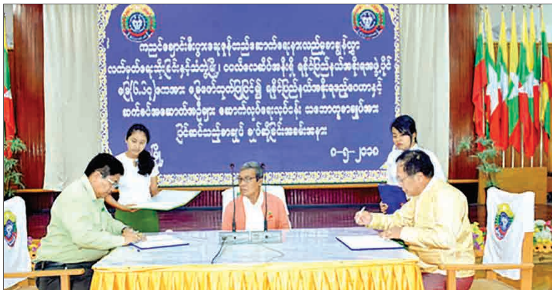
Memorandum of understanding (MoU) signing ceremony for the construction of Kanyinchaung Economic Zone held in Maungtaw yesterday.

Later, the MoU was signed by the secretary of the State government and officials from Kanyinchaung Economic Zone Construction and Su Htoo San Construction Co. Ltd, while being observed by the chief minister. — Tin Tun (District IPRD) ■