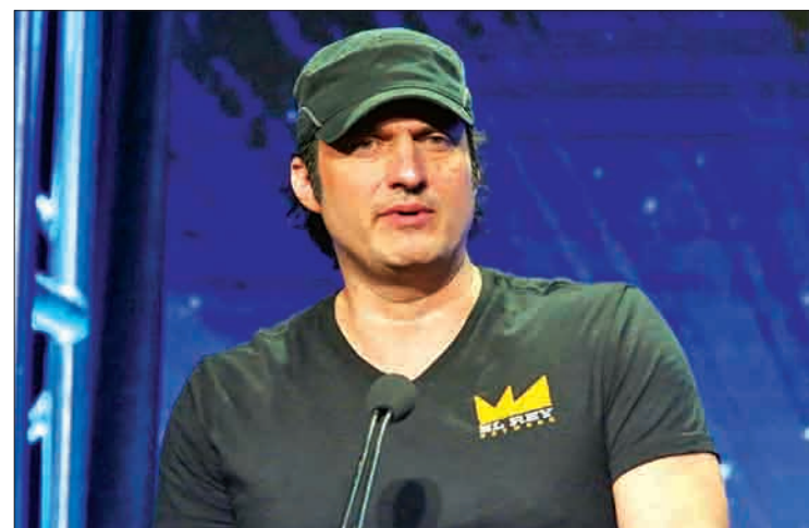
Director Robert Rodriguez, pictured here in 1996, rose to fame with the release of his widely acclaimed 1992 low-budget "El Mariachi," about a Mexican musician who takes up arms against a gang of outlaws.

She has said that Cannes needs to have an all-female jury one day to counter the decades of male domination. Apart from the president, the jury is composed of four women and four men — a parity ratio observed since 2013. Overall women fare slightly better as judges at Cannes, although it is still relative. One in five jury members have been women in its seven-decade history.—AFP ■