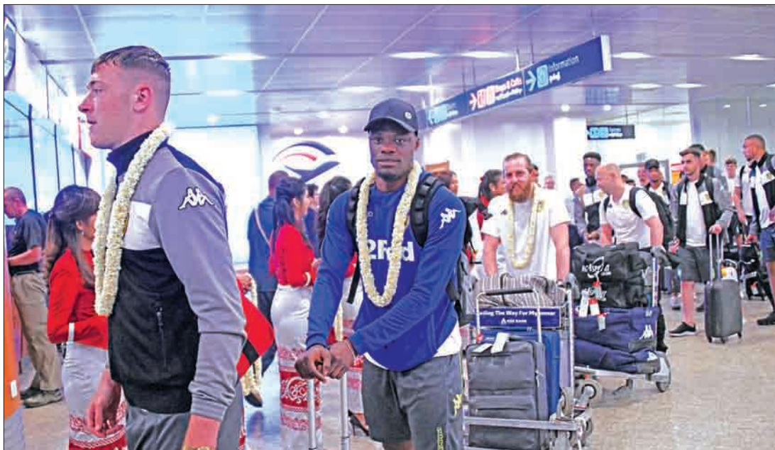
Members of Leeds United FC arrive in Yangon international airport on 8 May 2018.

The 22-man travelling party sees a mixture of first-team players, under-23s and under-18s included for this week's friendly double-header against an Myanmar league all star team on Wednesday and the Myanmar national side on Friday.—GNLM