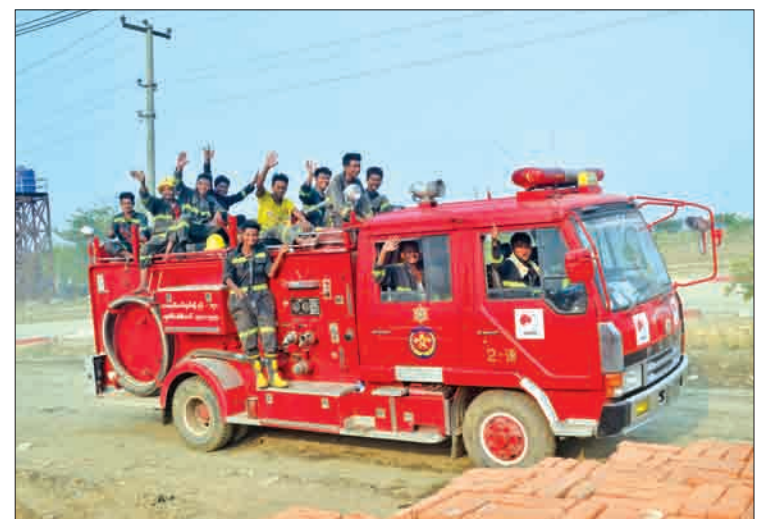
Firefighters celebrate after accomplishing their mission on heat and smoke emissions from Htein Bin garbage dump in Hlinethaya Township.

The YCDC fire department will continue surveillance with four fire engines in the area. Saw Soe Soe Myint, Head of the YCDC fire department, said they will continue surveillance opera-