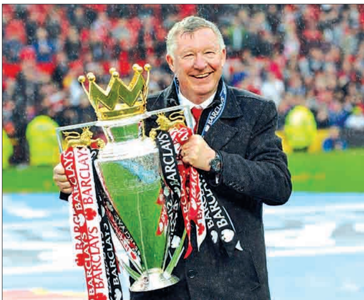
Alex Ferguson won the Premier League 13 times with Manchester United.

"However, they recognise it will still be a slow road to full recovery as he continues to be assessed." "The prognosis is good and his closest friends in football are being kept abreast