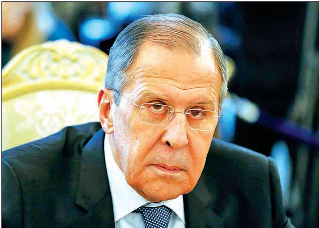
Acting Russian Foreign Minister Sergey Lavrov.

"This is a day of joy and a day of grief for those who remained on the battlefields forever. This year, we are celebrating several jubilees at once: the 75 th anniversary of the Battle of Stal-