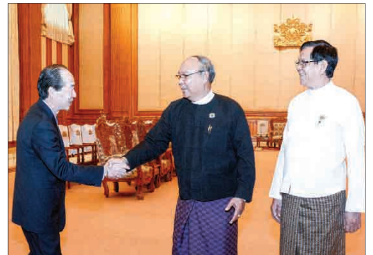
Amyotha Hluttaw Speaker Mahn Win Khaing Than welcomes Japanese Ambassador Mr. Ichiro Maruyama in Nay Pyi Taw.

Amyotha Hluttaw Speaker Mahn Win Khaing Than received Japanese Ambassador H.E. Mr. Ichiro Maruyama at the Amyotha Hluttaw guest hall in Nay Pyi Taw.