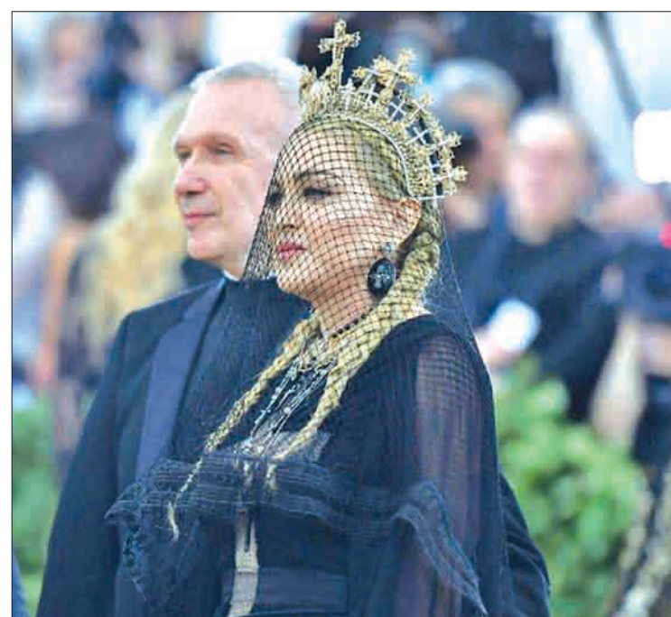
French Designer Jean-Paul Gaultier and Madonna arrive for the 2018 Met Gala at the Metropolitan Museum of Art in New York.

Jennifer Lopez and Alex Rodriguez, the celebrity couple of the moment, also stepped out,