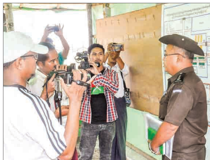
An immigration official answers questions at Nga Khu Ya reception centre in Maungtaw, Rakhine State.