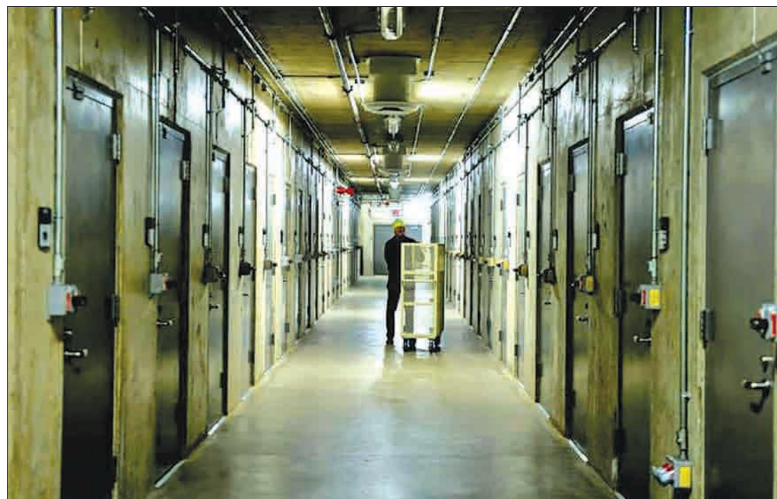
A man pushes a cart through the hallway of the nitrate film vaults at the Library of Congress's National Audio-Visual Conservation Centre in Culpeper, Virginia on 10 February, 2011.

Experts argue, however, that many were likely forgotten for a reason and, even if their identities are restored, would not be held up alongside "Ben-Hur," "The Gold Rush" or "The Ten Commandments." — AFP ■