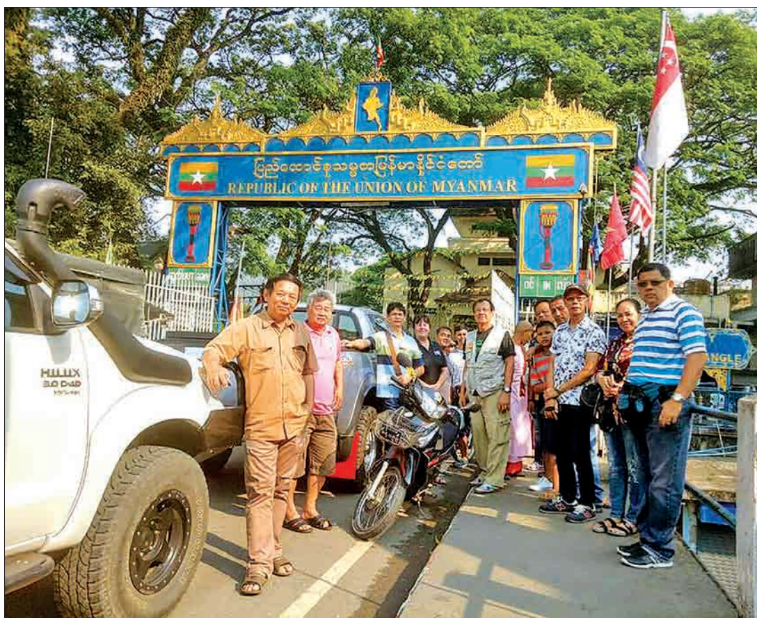
Foreign travellers seen in front of the Tachilek border gate in Shan State.

International tourist arrivals through the borders are