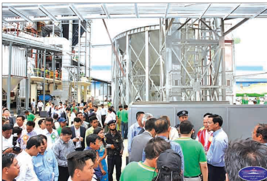
Vice President U Henry Van Thio attends opening of rice husk power plant in Kyaiklat.

Commission (MIC) has approved 17 investments including one LNG power station, three offshore supply bases, and agriculture and production sectors in the Ayeyawady Region.