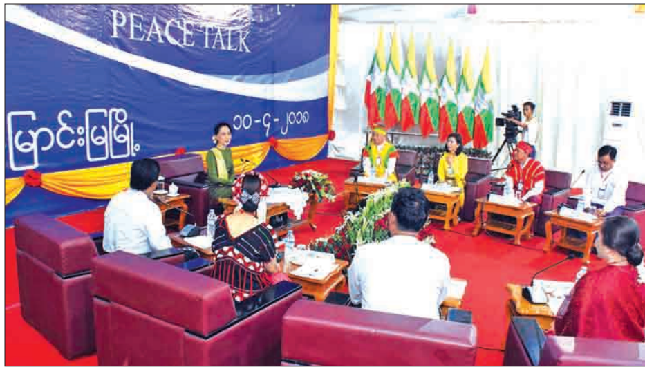
State Counsellor Daw Aung San Suu Kyi at the peace talk with local people in Myaungmya Township, Ayeyawady Region.