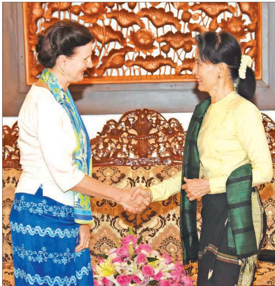
State Counsellor Daw Aung San Suu Kyi welcomes UN Resident Coordinator Ms. Renata Nicola Lok-Dessallien.

dia border, in order to stop disputes between border pillars 145 and 146 due to indistinct delineation, more defined distinct borders pillars were erected jointly on March 2017. The Friendship Bridge that crossed Myanmar-Laos was built and an agreement was reached at the meeting of Foreign Ministers of the two countries to mark and record the border demarcating line of the river on the bridge.