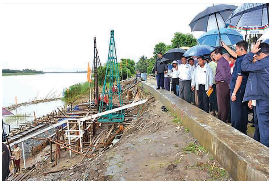
Vice President U Henry Van Thio inspects reinforcement of the banks of the Ayeyawady River during his tour of inspection in Ayeyawady Region.