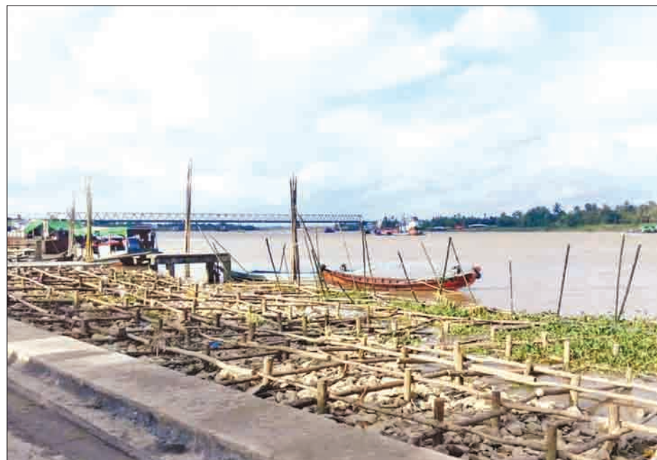
Measures are taken to prevent erosion at Pyapon Strand Road.

To achieve the two objectives of the healthcare sector—increasing life expectancy and reducing the occurrence of diseases, health awareness training was given to rural people, while effective prevention and treatment were provided throughout the nation.