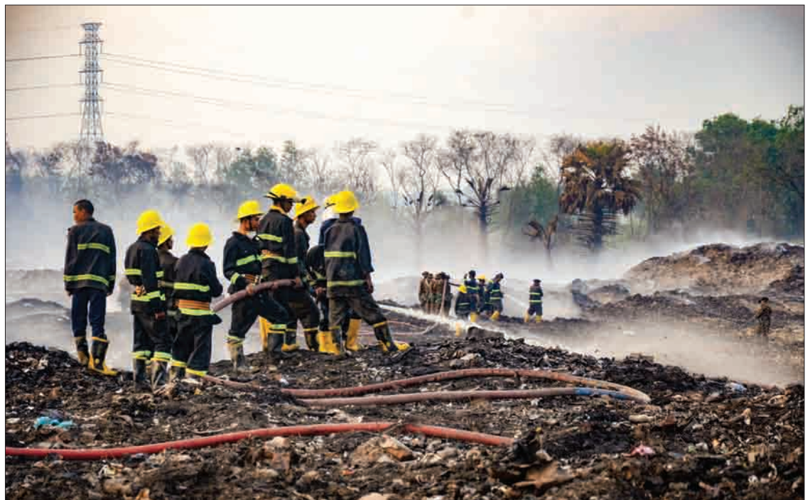
Firefighters work to extinguish the fire at the Htein Bin garbage dump outside Yangon yesterday.

two parts. First is to take out the fire in the target area and the next is to take out any small fires here and there."