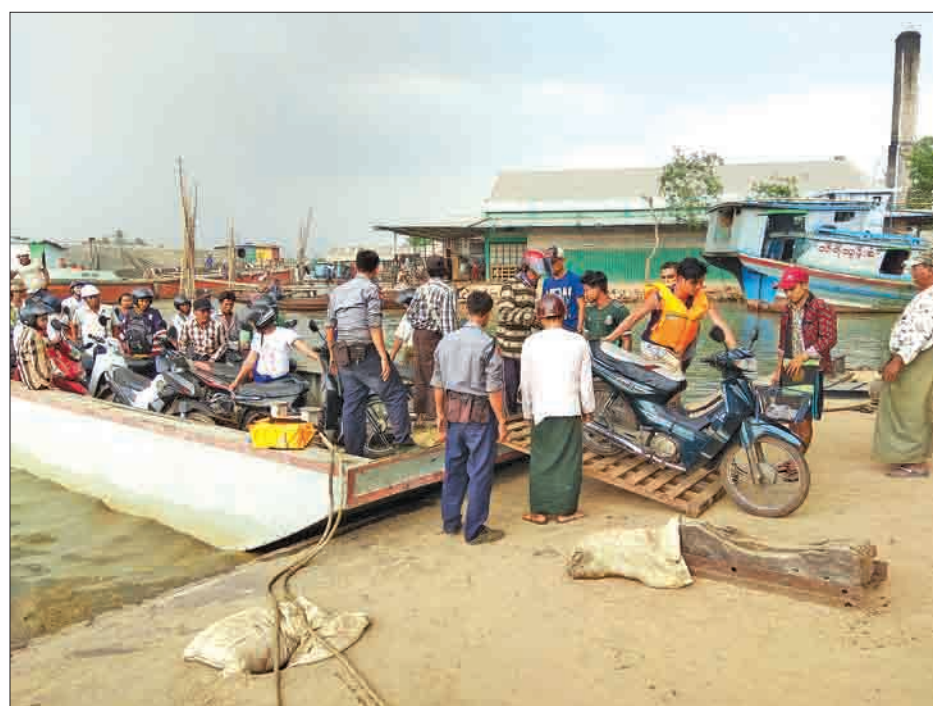
Free ferry service is operating for the travellers after Myaungmya suspension bridge collapse aiming not to delay the flow of commodities and transportation access.