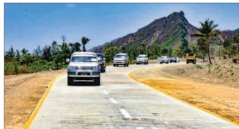
A new Angumaw-Kotankauk section of the Angumaw-Maungta road is expected to ease traffic when it opens in Maungta.

Later in the evening, the delegation left Sittway for Nay Pyi Taw by Myanmar National Airlines.— Myo Myint ■