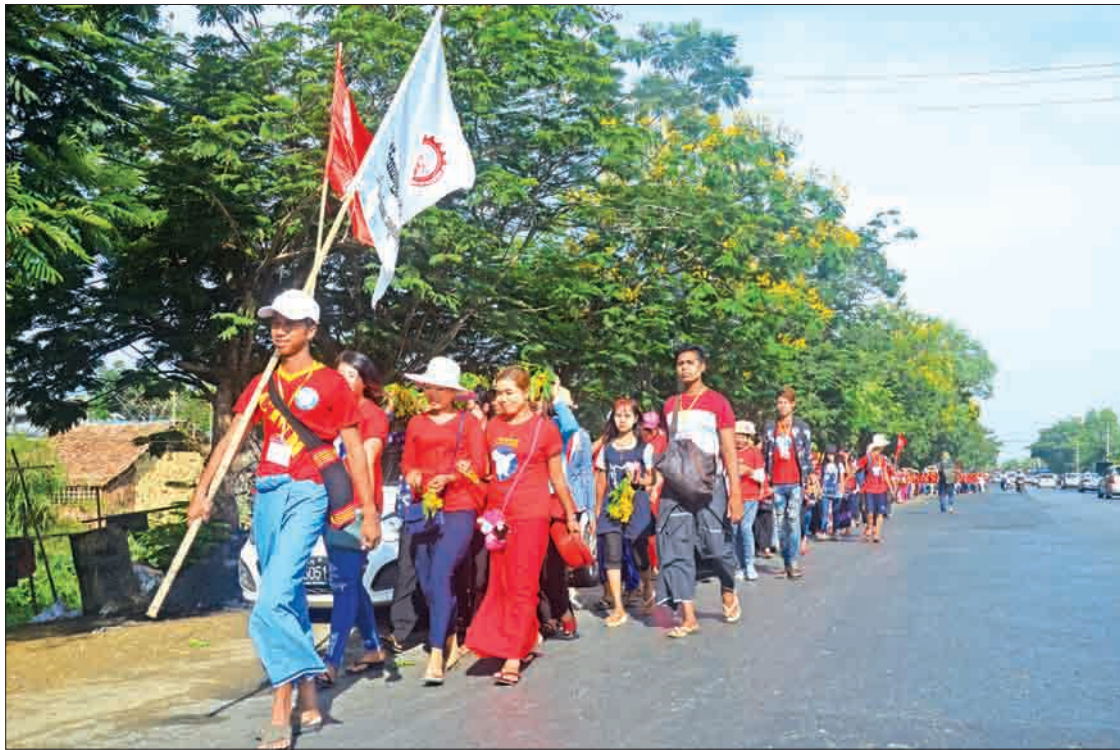
Workers participate in a march in Hlinethaya Township to mark International Workers' Day yesterday.

Next, Union Minister for Labour, Immigration and Population U Thein Swe delivered a speech. This was followed with speeches by Yangon Region Chief Minister U Phyo Min Thein, International Labour Organisation Myanmar head office Liaison Officer Rory Mungoven, Confederation of Trade Unions