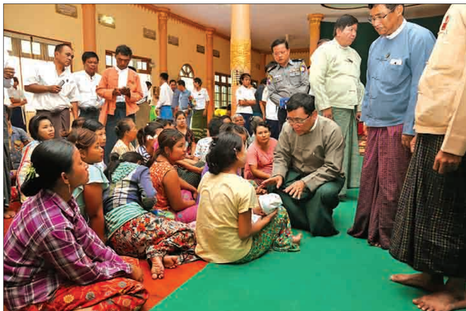
Union Minister gives words of encouragement to flood victims at the Mingalar Yarma monastery in Nwataung village.