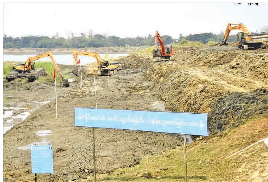
Pan Hlaing River, Nyaungdone Township is being dredged by machinery.