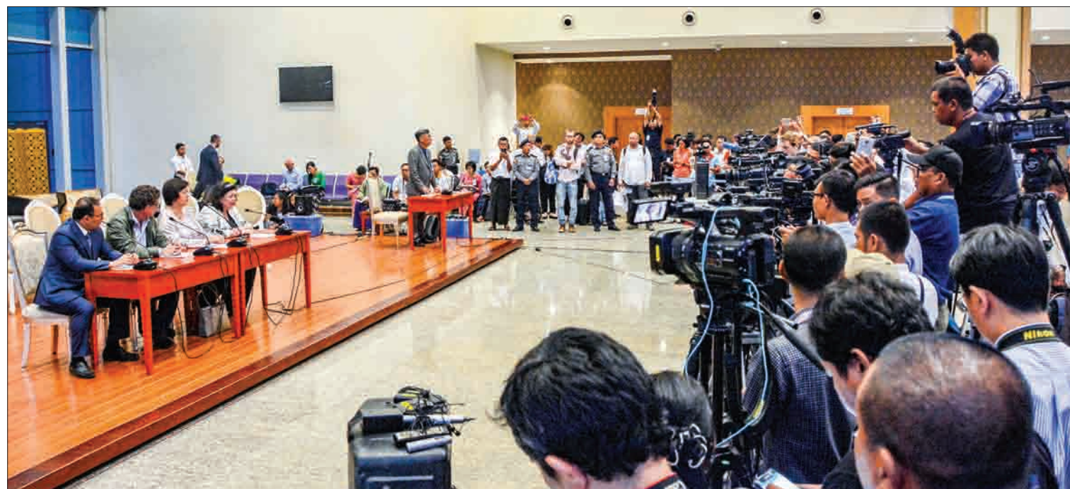
UNSC delegation at the press conference on their visits to Myanmar and Bangladesh in Nay Pyi Taw yesterday.

Representative Mr. Gustavo Meza-Cuadra said during their visit to Rakhine State they visited the area of the displaced persons and had good encounters with the local population.