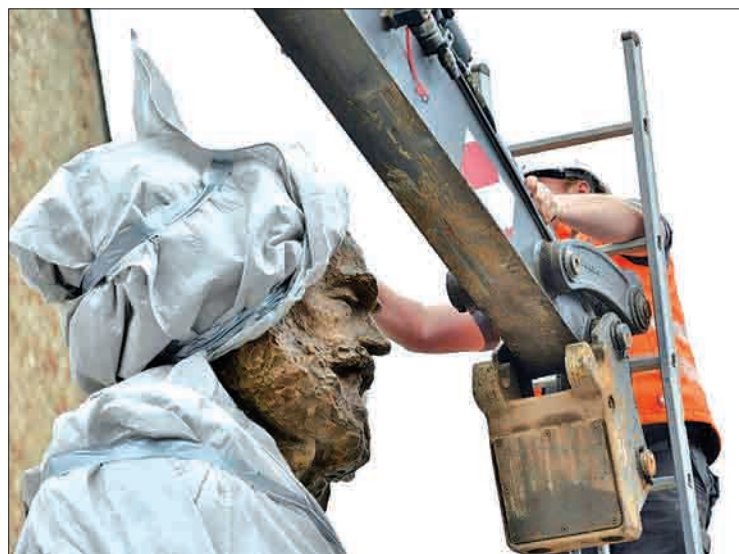
A worker covers the head of a massive Chinese-made statue of revolutionary German philosopher, economist, political theorist and sociologist Karl Marx in the town of Trier ahead of the 200 th anniversary of his birth there on 5 May.