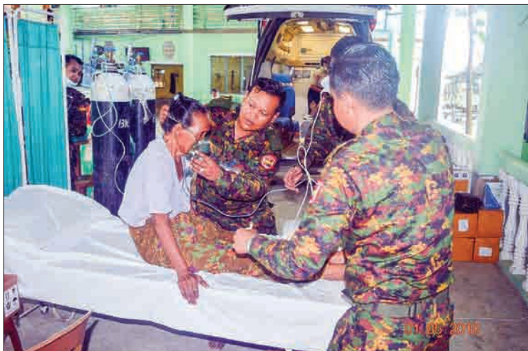
Tatmadaw officers providing medical treatment to local resident affected by garbage dump fire.

"Tomorrow, we'll complete Zone D. As we put out some parts of Zone D today, we'll continue on the remaining parts tomorrow. If the fire in the remaining parts were more than our expectation, we'll use Bio Foam. There'll be