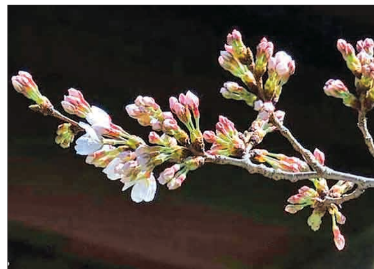
Raw material? Japanese researchers say they have invented a way to produce alcoholic drinks from cherry trees and other types of wood.

"We thought it would be interesting to think that alcohol could be made from something