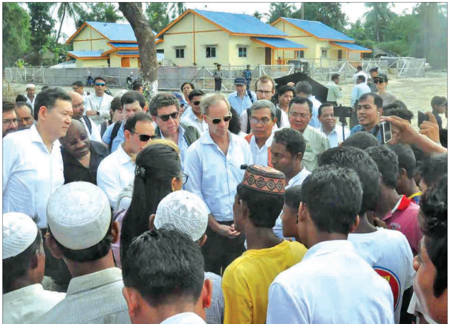
Members of the United Nations Security Council delegation meet with local people from Islamic community in Maungdaw.