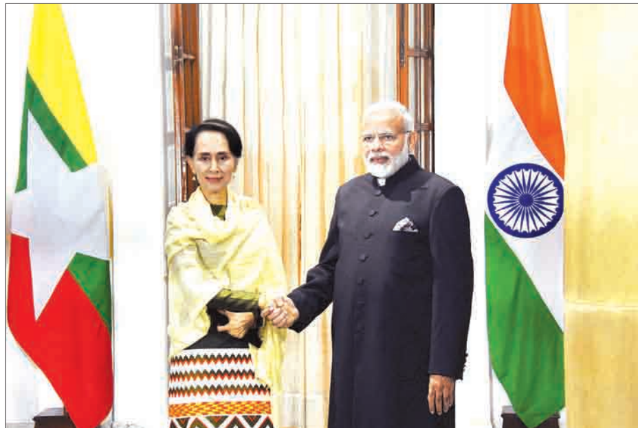
State Counsellor Daw Aung San Suu Kyi is welcomed by Indian Prime Minister Narindara Modi in New Delhi during her visit to India.

endeavours to promote internal peace and national reconciliation processes and matters related to national development were discussed and explained, it resulted in better understanding towards Myanmar. In addition, the establishment of diplomatic relations between Myanmar and the Holy See was announced during the visit to the Vatican City. As a result, Pope Francis paid his first state visit to Myanmar in November 2017 which was a historic milestone.