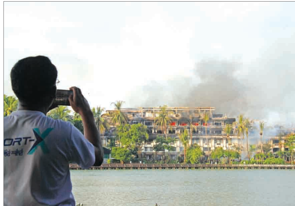
A man takes photos of the fire at Kandawgyi Palace Hotel on 19 October 2017.

It is unusual that more and more vehicles—big or small—get caught fire on the road. They generally use highly inflammable liquids or gas in their cars or motorcycles; they easily catch fire when they go out in very hot environments.