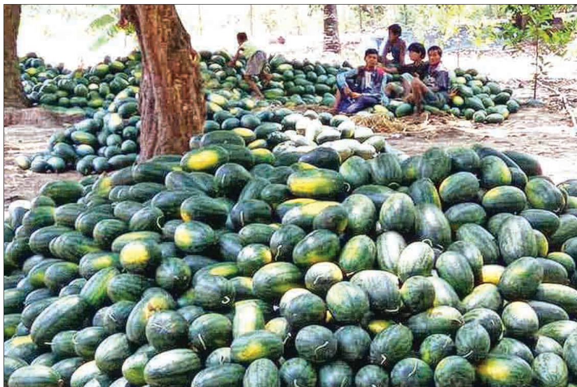
Local farmers earn a good income from Japanese watermelon in Kyaukpadaung Township.

Despite the increase in the value of exports every year, the country's import value is always greater than its exports, causing a trade deficit. In collaboration with private businesspersons, the government is seeking more trade opportunities to reduce the trade gap.—Khine Khant ■