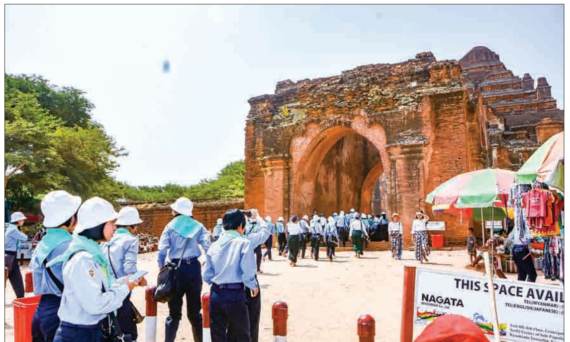
Outstanding students visit famous pagodas in Bagan yesterday.

They also have the responsibility to take a place and must have the will to serve and develop the country. My word to them is, we, the elders have created