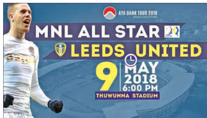
MNL All Star will play against Leeds United on 9 May at Thuwanna Stadium in Yangon.