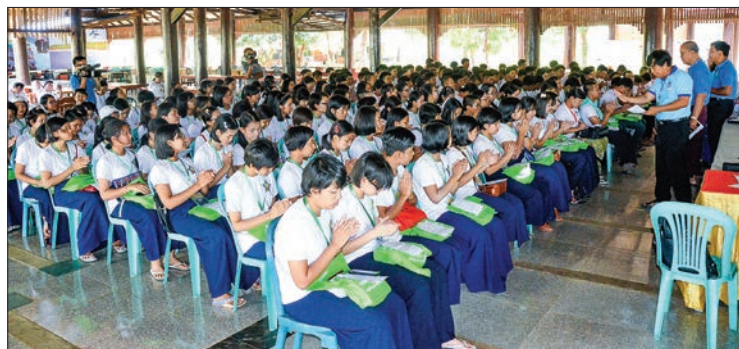
Former Luyechuns meets with outstanding students in Ngwehsaung, Patheingyi District yesterday.