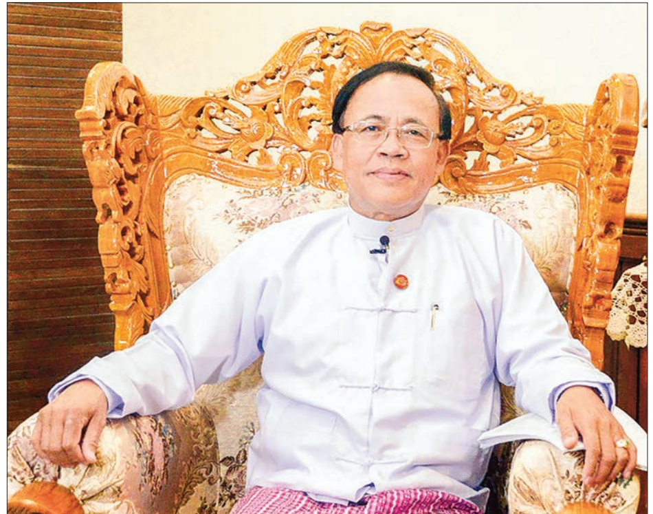
Union Minister for International Cooperation as well as the former Minister of State for Foreign Affairs U Kyaw Tin.

Myanmar nationals and former Myanmar Nationals living abroad.