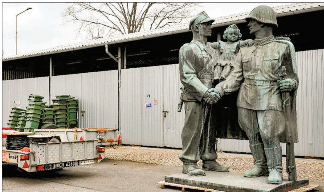
A monument to Soviet Red Army soldiers that had dominated a square in the southwestern Polish town of Legnica for nearly 70 years has been removed and mothballed with dozens of other monuments under a 2016 decommunisation law.

Under the 2016 law, the PiS government put the Institute of National Remembrance (IPN) — responsible for prosecuting Nazi and communist-era crimes — in charge of removing around 300 monuments nationwide.