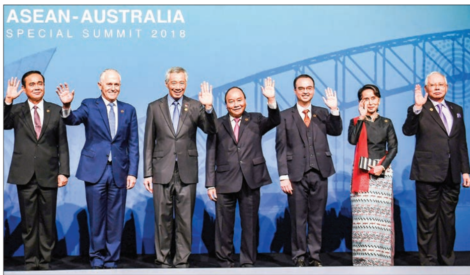
State Counsellor and Union Minister for Foreign Affairs Daw Aung San Suu Kyi attends the ASEAN-Australia Special Summit 2018 along with leaders from ASEAN nations.