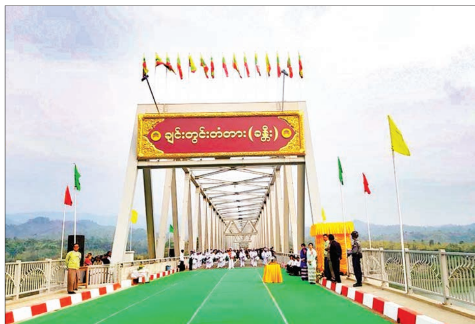
The opening ceremony of Chindwin Bridge (Khamti) on Khamti-Sinthey-Lahe road in Sagaing Region.

One of our most recent projects is the upgrading of two 10-mile sections of the Yangon-Mandalay highway, which we