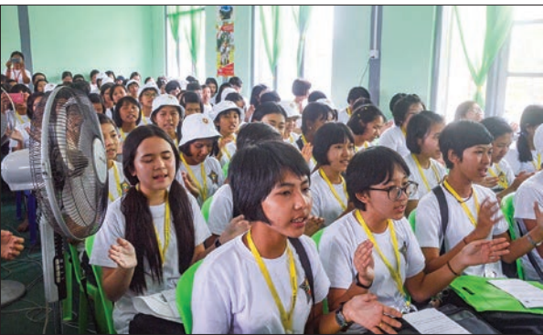
Grade 10 Luyechun students meet former Luyechuns at Khaung Taing high school in Inle.

THE aim of outstanding students or Luyechuns is to be exceptional in education, healthy, fit, ethical, have interest in all-round development works, have the ability to live and be-friend others and obtain regional knowledge. The Luyechun project was started in 1964. After 1988, it was stalled for sometime, but was re-started in 2011 with the aim of training and producing outstanding students in the country. Accordingly, this year, Luyechuns from grades 9, 10 and 11 were identified, and vacation camps were conducted in Inle Khaung Taing, Bagan and Ngwehsaung for them. The Luyechuns from grade 10 arrived at Inle Khaung Taing vacation camp on 29 April. A meeting between these Luyechuns and former Luyechuns was held at Khaung Taing high school, where the Inle Khaung Taing va-