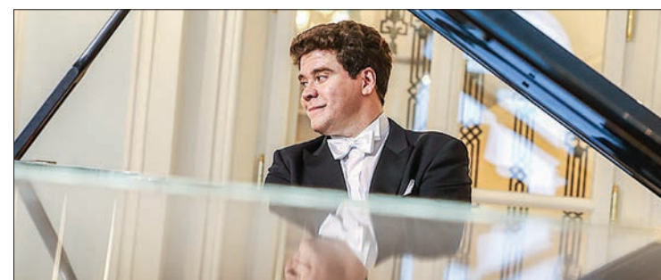
Russian pianist Denis Matsuev.

Round 1 auditions will be held from 30 April to 1 May at the Conservatory Rachmaninoff Hall. Fifteen contestants aged under 16 from Belarus, Kazakhstan, China, Russia, the US and South Korea will take part in the auditions. On 3 and 4 May, the contestants will demonstrate their skills at the finalist auditions with the Svetlanov Symphony Orchestra at the Tchai-