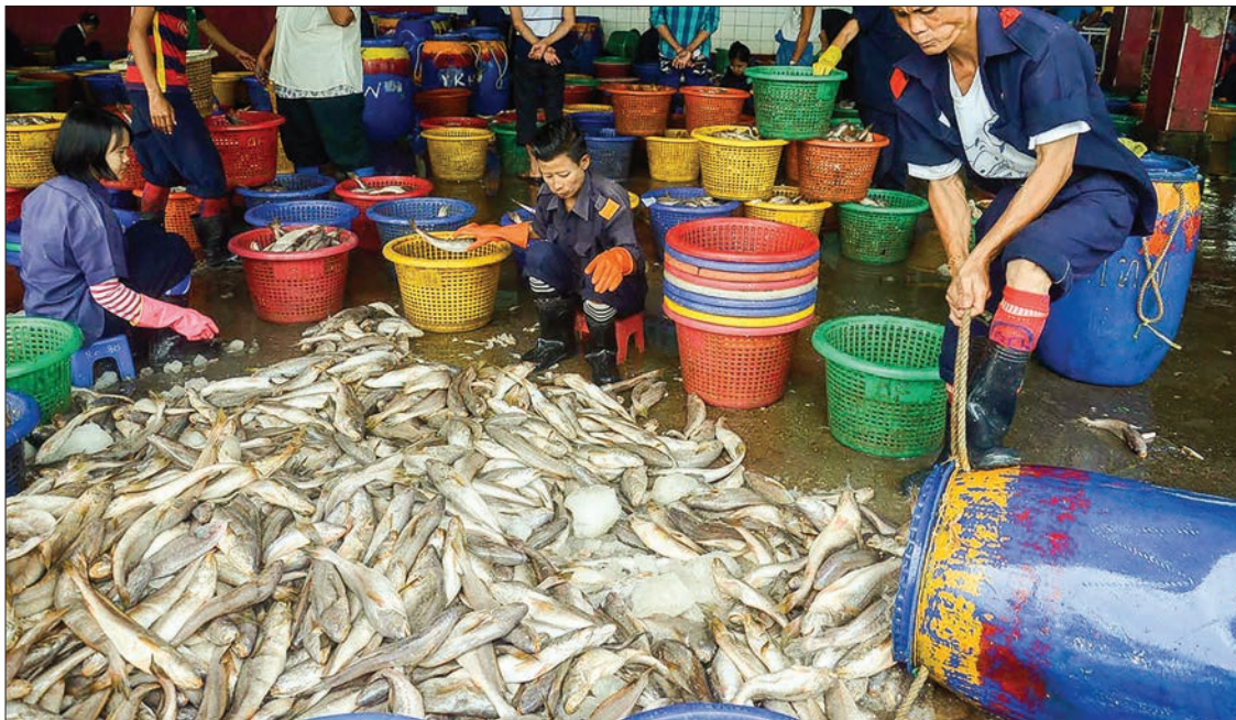
Workers select fishes at the Nyaungtan Jetty in Yangon.