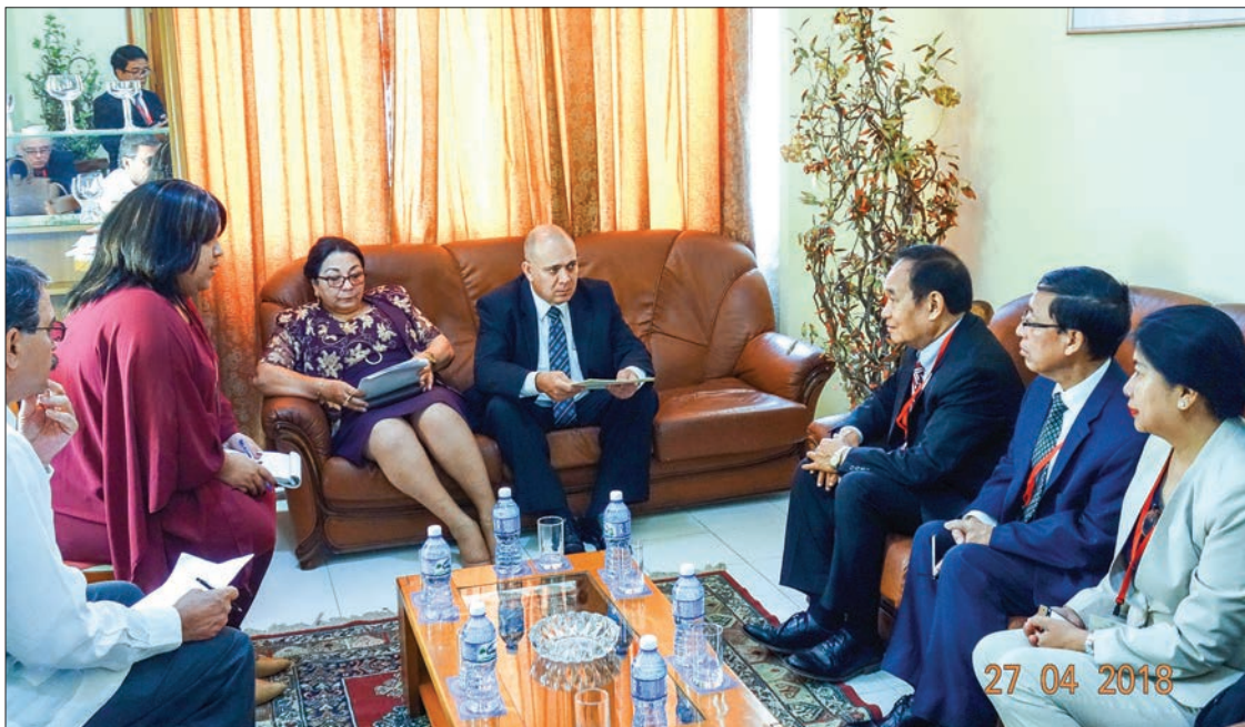
Union Minister Dr Myint Htwe meets with delegation led by Dr. Roberto Morales Ojeda, Vice President and Member of the Politbureau of the Central Committee of the Communist Party of Cuba.