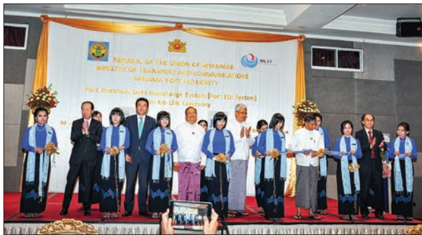
Union Minister U Thant Sin Maung and officials launch the system go-live ceremony for Port EDI system in Yangon.

In his opening speech at the ceremony, Union Minister for Transport and Communications U Thant Sin Maung said the Port EDI system project was one of the important works among the assistance provided to Myanmar by Japan. As an ASEAN member country, Myanmar must establish a