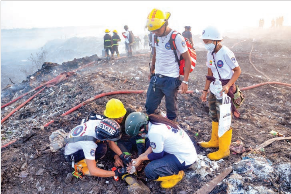
Rescue workers focus on medical treatment of injuries to firefighter.

After reviewing the ground situation, the Fire Services Brigade adopted a new strategy and divided the garbage into four zones. A combined force of firefighters, Tatmadaw men, staff of the Yangon City Development Committee and some 900 volun-