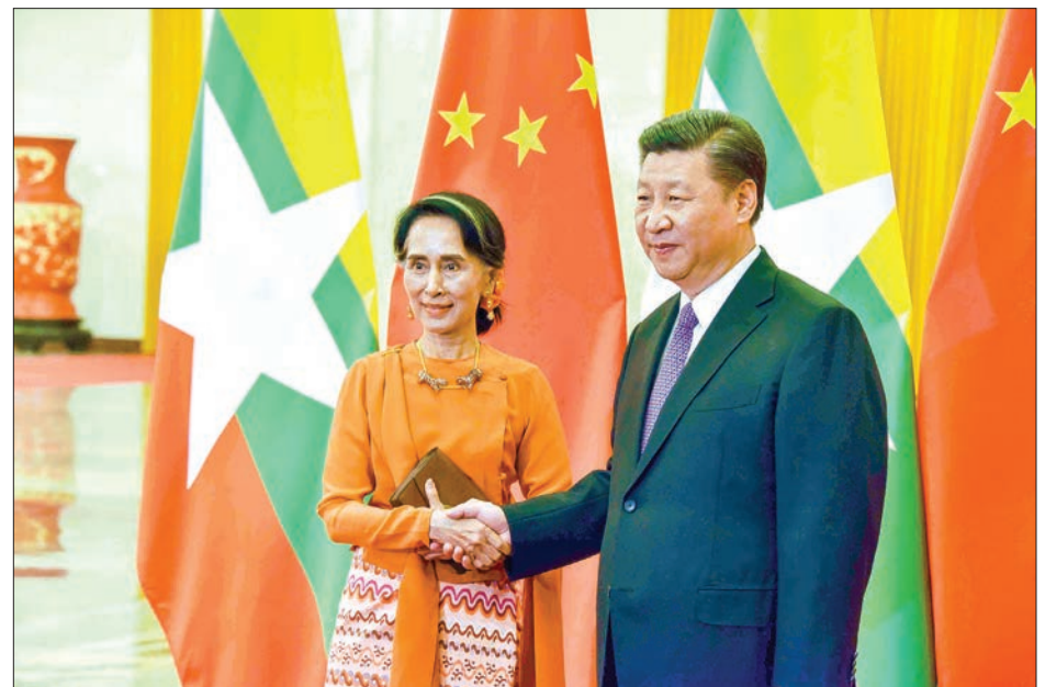
State Counsellor Daw Aung San Suu Kyi shakes hands with Chinese President Mr. Xi Jinping as they meet at the Great Hall of the People in Beijing, China.

Q: Please also tell us about the visits of foreign dignitaries to Myanmar.