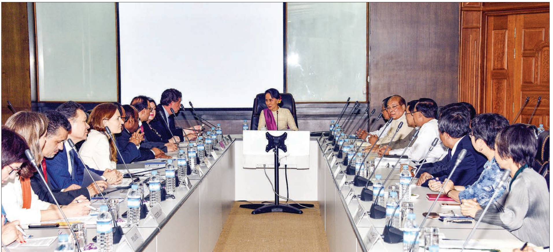
Daw Aung San Suu Kyi holds talks with the delegation composed of Permanent Representatives to UN and representatives from immediate neighbours of Myanmar.