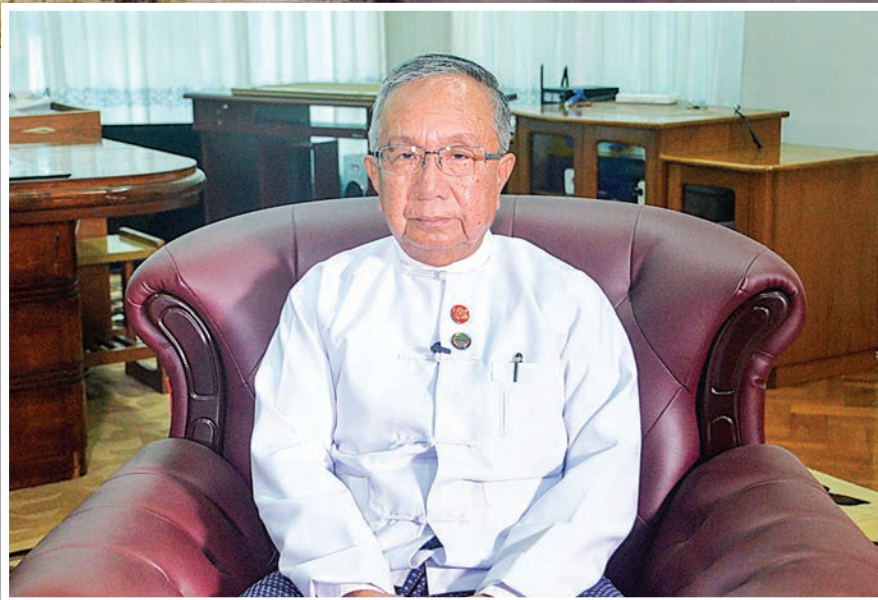
Union Minister for Construction U Han Zaw.