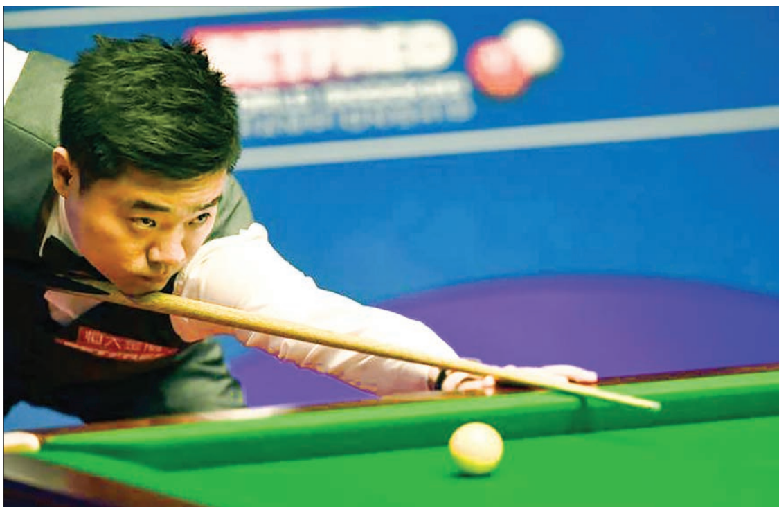
Ding Junhui is closing in on a second appearance in the world snooker championships in three years.

That was no mean feat given Lisowski — who only just avoided becoming the second player in the tournament’s history to fail to win a frame — had ousted 2015 world champi-