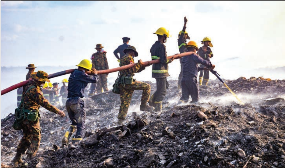
Firefighters douse the garbage dump with bio foam and water to extinguish the underground fire.

teers will participate in the fight against the poisonous smoke from the garbage fire with the use of biofoam and water. More 1 million gallons of water is used daily to control the under-garbage fire releasing poisonous smoke. Authorities have adopted a new strategy to control the smoke from the