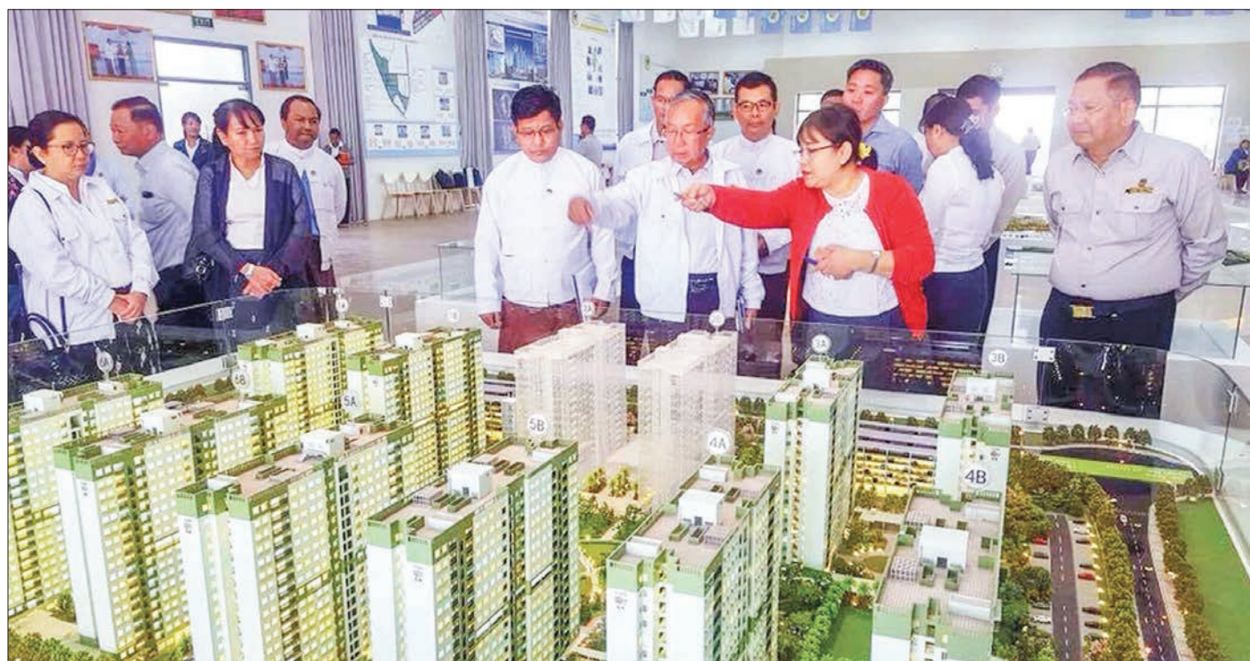
Union Minister for Construction U Han Zaw inspects model design of rural and urban development in Yangon Region.

In the previous fiscal year, blueprints for urban development in 24 cities in various states and regions were drawn while urban development plans for Mandalay, Mawlamyine and Patheingyi were drawn in collaboration with Japan International Cooperation Agency.