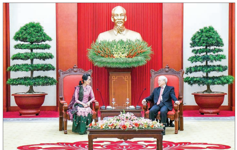
State Counsellor Daw Aung San Suu Kyi meets with Mr. Nguyen Phu Trong, General Secretary of the Communist Party of Viet Nam.

A: Heads of State from Singapore, India, Lao PDR, the Philippines, Mongolia, Cambodia and Vietnam, and His Holiness Pope Francis visited Myanmar. Foreign Ministers from China, Italy, Canada, Japan, India, Thailand, Singapore, Indonesia, Cambodia, Britain, Hungary, US, Norway, Ukraine, Luxembourg, Netherlands, France, Czech and Turkey also visited Myanmar. Other visits included