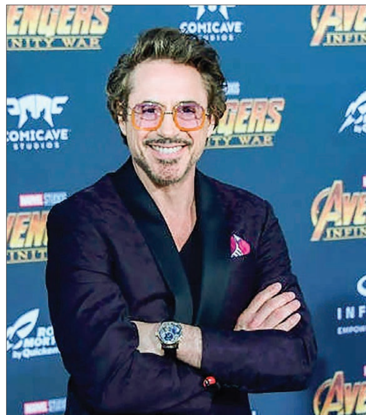
Actor Robert Downey Jr arrives for the world premiere of "Avengers: Infinity War," which has smashed North American and global box office records.

"It's a North Star for us as we lead these giant productions