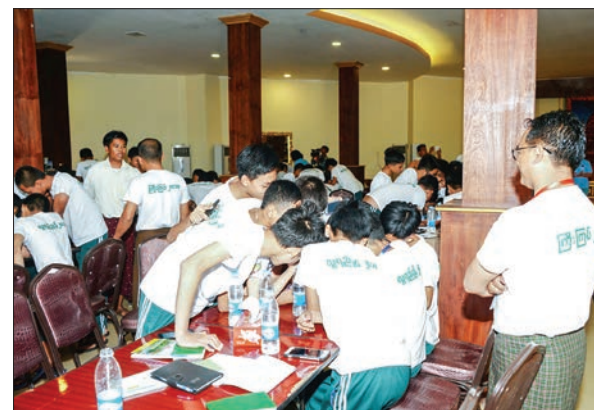
Outstanding students answering quiz questions.

The opening ceremony of Bagan Luyechun Vacation Camp will be held on the morning of 1 May, while the rehearsals for the opening ceremony were held yesterday morning. After the opening ceremony on the morning of 1 May, the Luyechuns in Bagan Luyechun Vacation Camp will visit and pay homage to ancient pagodas in the Bagan region. ■