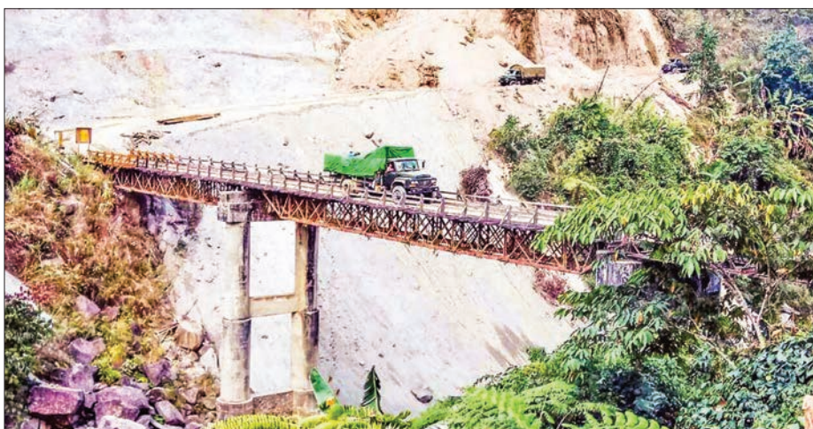
Vehicles crossing the bridge after upgrading Myitkyina-Sumprabum-Putao road.

To achieve its targets, the ministry will work together with private companies under the Public Private Partnership-PPP Program and also with development partners such as JICA, ADB, WB, KOICA and TICA.