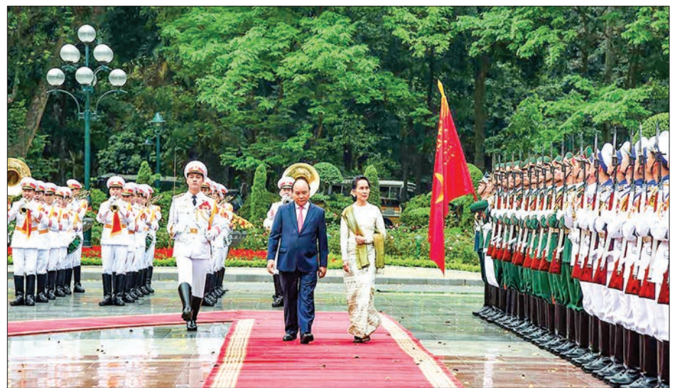
State Counsellor Daw Aung San Suu Kyi, accompanied by Vietnamese Prime Minister Mr. Nguyen Xuan Phuc, inspects the Guard of Honour in Viet Nam.