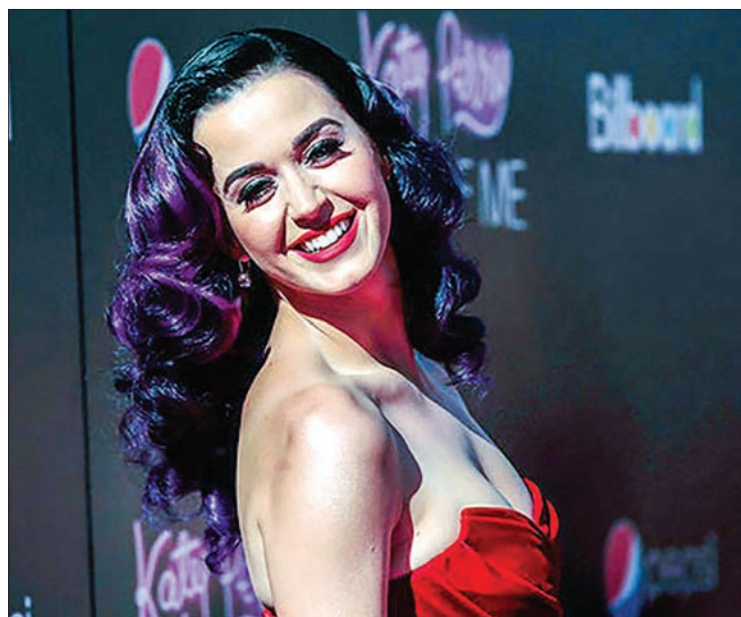
Katy Perry. PHOTO: PTI

The "American Idol" judge also shared a photograph with the Pope, along with Bloom on Instagram.