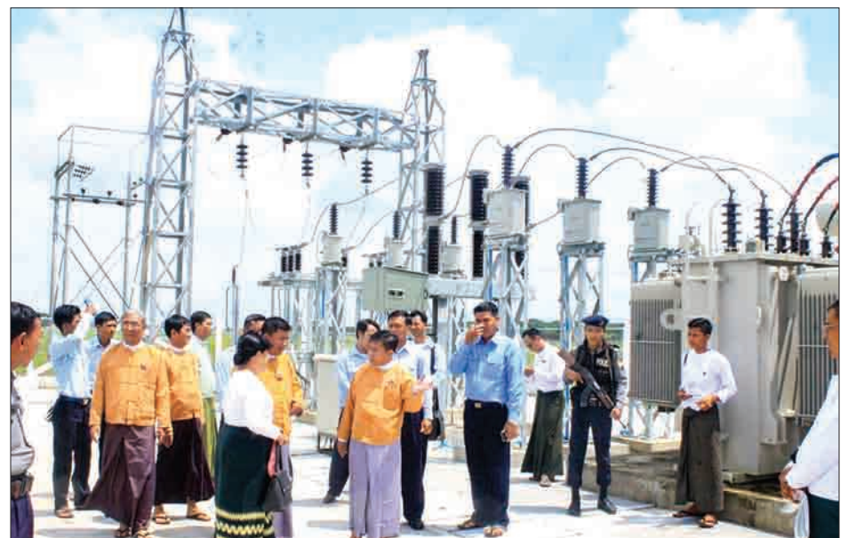
Chief Minister U Win Thein and officials inspects Myitkyoe 33 KVA sub-power supply station.

During the period of two year, the Bago Region government has made an effort to improve the transportation systems in the region. All the roads constructed by the Road Department under the Ministry of Construction are tarred roads. Roads in towns are now in the process of covering Asphalt Concrete.