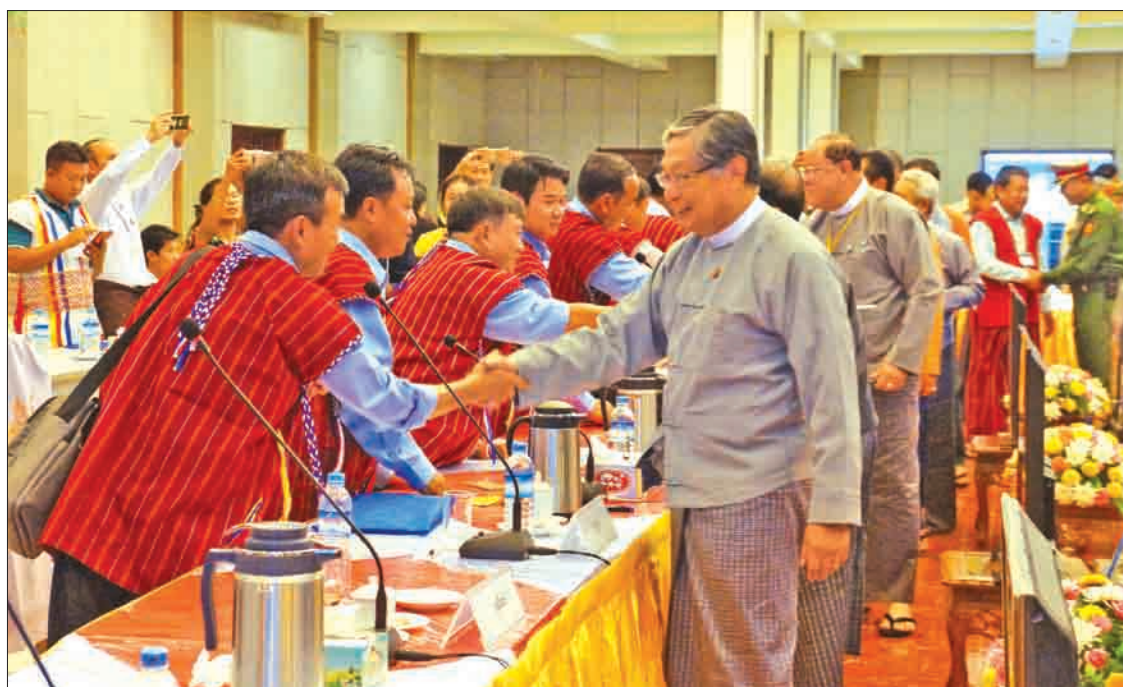
Union Minister U Kyaw Tint Swe shakes hands with representatives from the Karenni National Progressive Party at the Peace Talks in Loikaw, Kayah State.

"The outcome of the peace talks is considered a constructive result for the ongoing peace and development of Kayah State," he added.