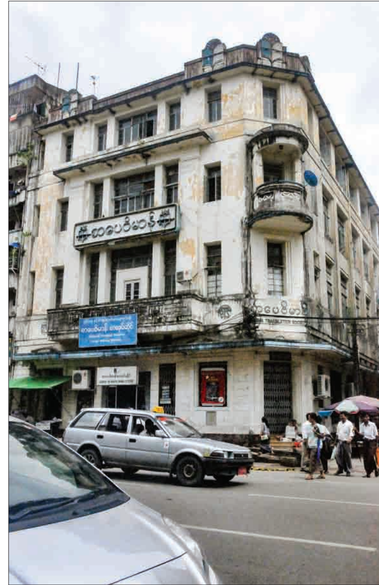
Sarpay Beikman Building in downtown Yangon.

In the late 1950s, another important aid to the Editorial Department was the Editorial Reference Library which provides both reference and general material for the various divisions. In those days, there were approximately 7,500 books in English, 4,000 books in Myanmar, 4,000 issues of magazines and journals, and twenty-one general and specialized sets of encyclopaedias in English. The Library subscribed to 58 magazines published in English and 20 in Myanmar.