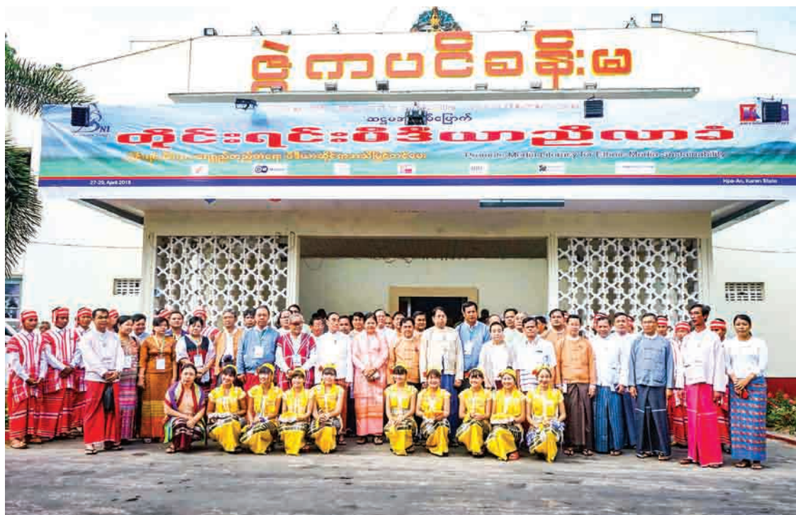
Union Ministers Dr. Pe Myint and Nai Thet Lwin pose for a documentary photo together with dignitaries at the 6th ethnic media conference in Hpa-An, Kayin State.

The Union Minister said that when the Media Amendment Bill is approved, they will draft new bylaws for community radios to emerge. He said that collaboration with the Myanmar Press Council will ensure ethnic people's media and other media agencies in Myanmar will have smoother news gathering soon. He added that this will also