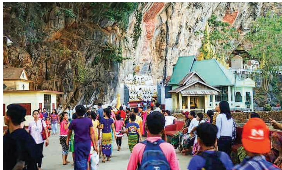
Bayintnyi Cave in Hpa-an has attracted local and foreign visitors.