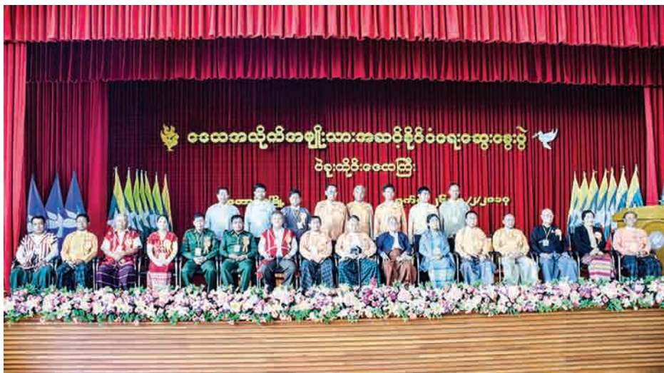
Regional level national political talk held in Toungoo Township.