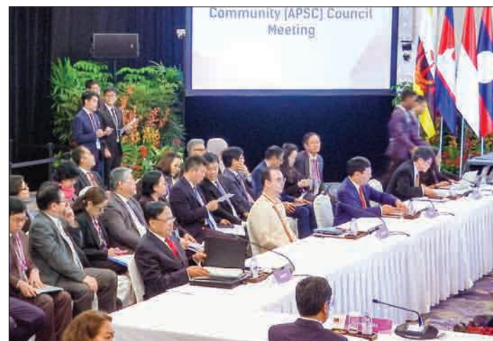
Union Minister U Kyaw Tin attends the ASEAN Foreign Ministers' Meeting at Shangri-La Hotel in Singapore.

After the ceremony, the deputy minister took commemorative group photos with the ceremony attendees. The ceremony was attended by officials and employees from departments and enterprises under the ministry, chief editors and editors of newspapers, litterateurs, award winners and invited guests.—MNA ■