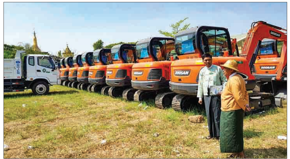
Chief Minister U Win Thein inspect second batch of agricultural machinery to be distributed to twenty-eight townships in Bago Region

During the period of two year, the Bago Region government has made an effort to improve the transportation systems in the region. All the roads constructed by the Road Department under the Ministry of Construction are tarred roads. Roads in towns are now in the process of covering Asphalt Concrete.