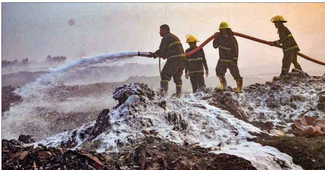
Fire fighters douse bio foam over the garbage dump to control poisonous smoke in Hlinethaya.

Sports conducted a coordination meeting with the related departments and organisations at Hlinethaya People's Hospital on 27 April.