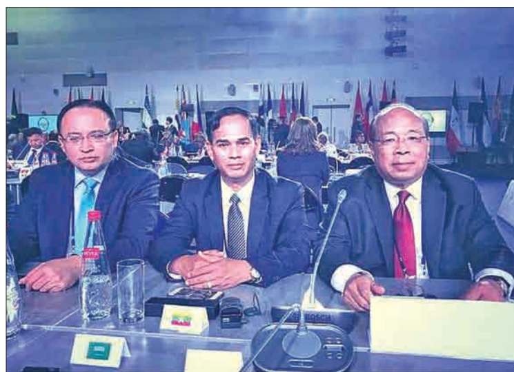
The Myanmar delegation led by Union Minister U Thaung Tun (Right) attends the IX International Meeting of High-Ranking Officials Responsible for Security Matters, in Sochi, Russia.

ers of both sides could sign the NCA at the Union Peace Conference, the signing would become a historic milestone, said Dr. Tin Myo Win.—Myanmar News Agency ■