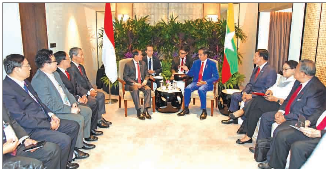
President U Win Myint holds talks with Indonesia President Joko Widodo in Singapore.