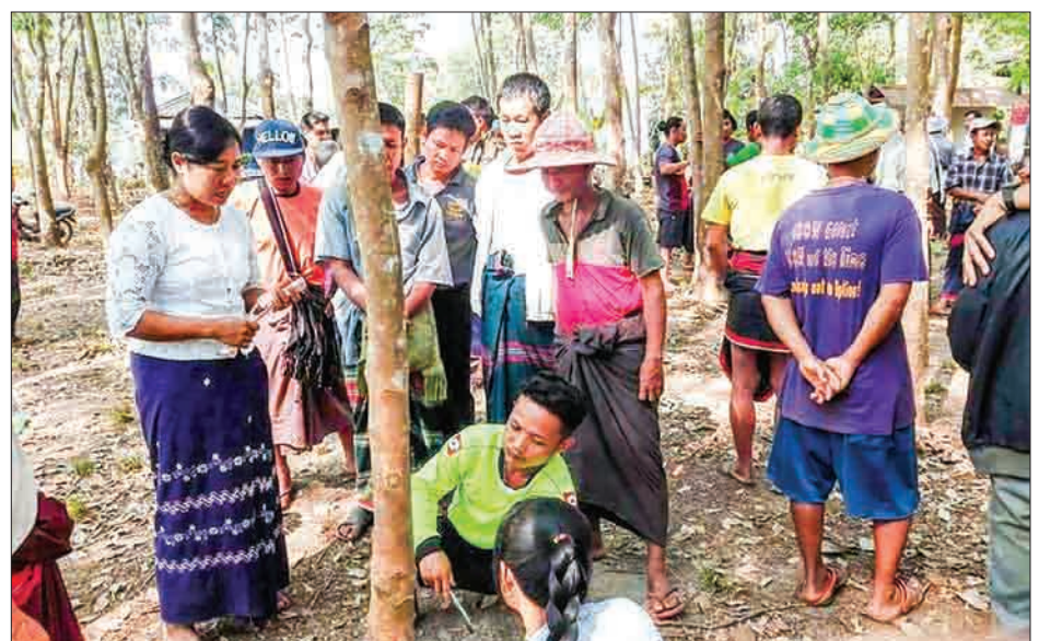
Agricultural experts conducts rubber farming training to create job opportunities.