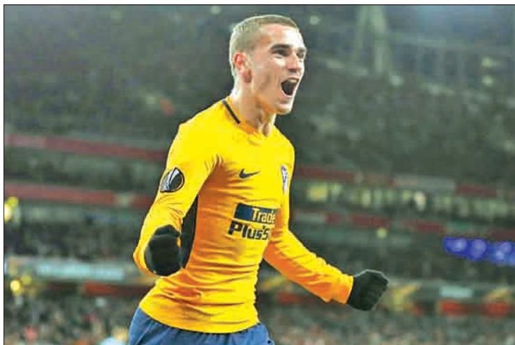
Antoine Griezmann celebrates his late goal for Atletico.

Sime Vrsaljko's early red card handed the Gunners the initiative, however, they were made to rue a host of missed chances before and after Alex-