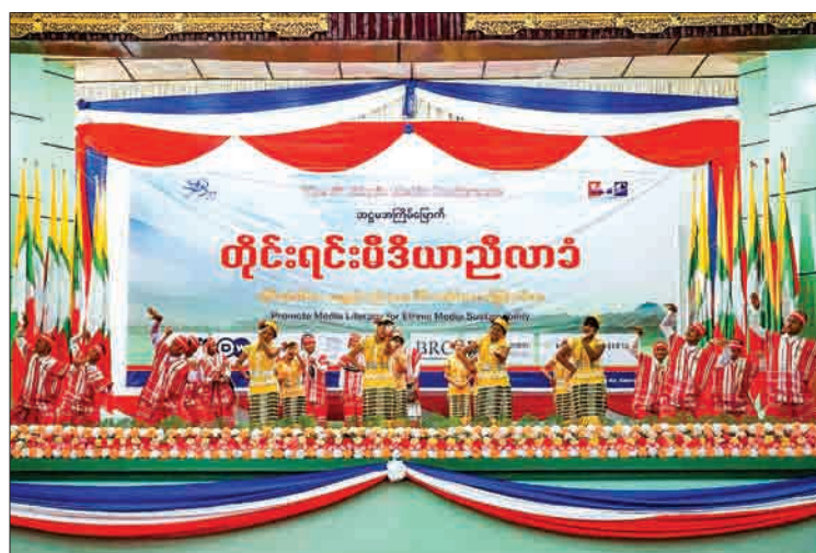
Traditional dancers performing on stage at the ethnic media conference.

help media agencies to contact and work closely with the three branches of government.