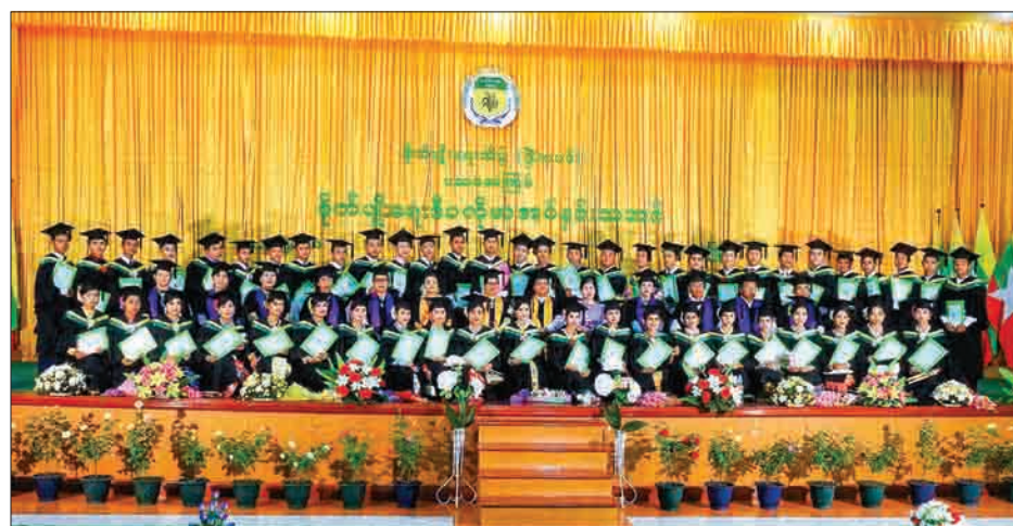
Zwekabin Agricultural Diploma graduation ceremony in Hpa-an.