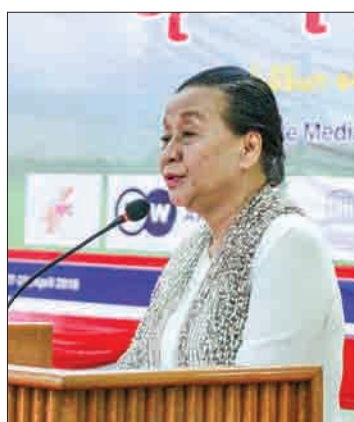
Kayin State Chief Minister Daw Nan Khin Htwe.