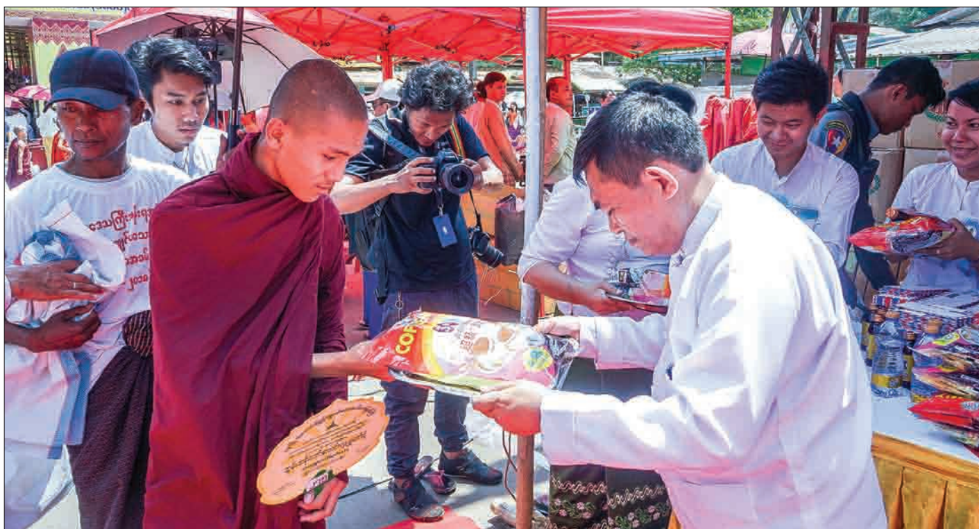
Chief Minister U Win Thein donates provision to a monk at a ceremony to donate provision to 1,800 monks in Bago.

In order to make sustainable development, plans are under way to support and encourage the small and medium scale enterprises, the development of health and education sectors, and conservation of natural environment.