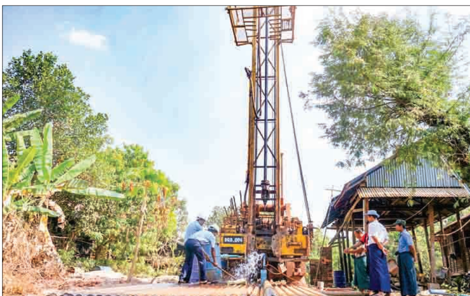
A tubewell is drilled at Htilon Village in Hlinebwe Township.

“Another priority set by the state government is power supply. Previously, only 4 out of 7 townships enjoyed electricity. Now, people living in Kyainseikkyi and Kawkareik townships are enjoying electricity round the clock. Only Hpa-pun Township left to be supplied electricity but measures are being taken to supply power to the township. Moreover, over 900 villages are enjoying electricity. We'll try our best for the people enabling them to enjoy electricity the whole state.” the chief minister said.