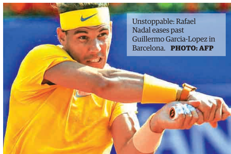
Unstoppable: Rafael Nadal eases past Guillermo Garcia-Lopez in Barcelona.

Lacazette volleyed off the outside of the post and forced Jan Oblak into the first of a series of fine saves with a header from close range.—AFP ■