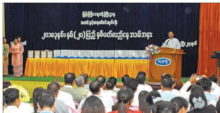
Deputy Minister U Aung Hla Tun delivers the address at the 20 th Anniversary celebration of the NPE.

Next, Union Election Commission member U Myint Naing (Maung Saga) and Myanmar Anti-Corruption Commission member U Han Nyunt (Han Nyunt Law) presented awards and documents of honour to outstanding news article writers, while Road Transportation Administration