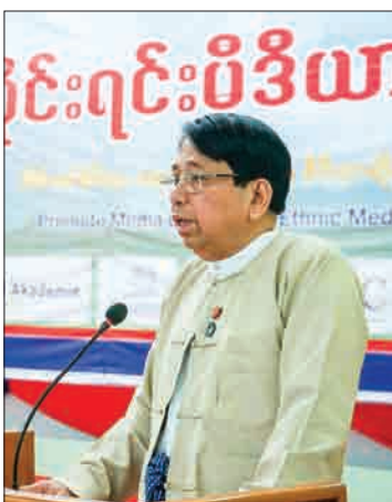
Union Minister for Information Dr. Pe Myint.