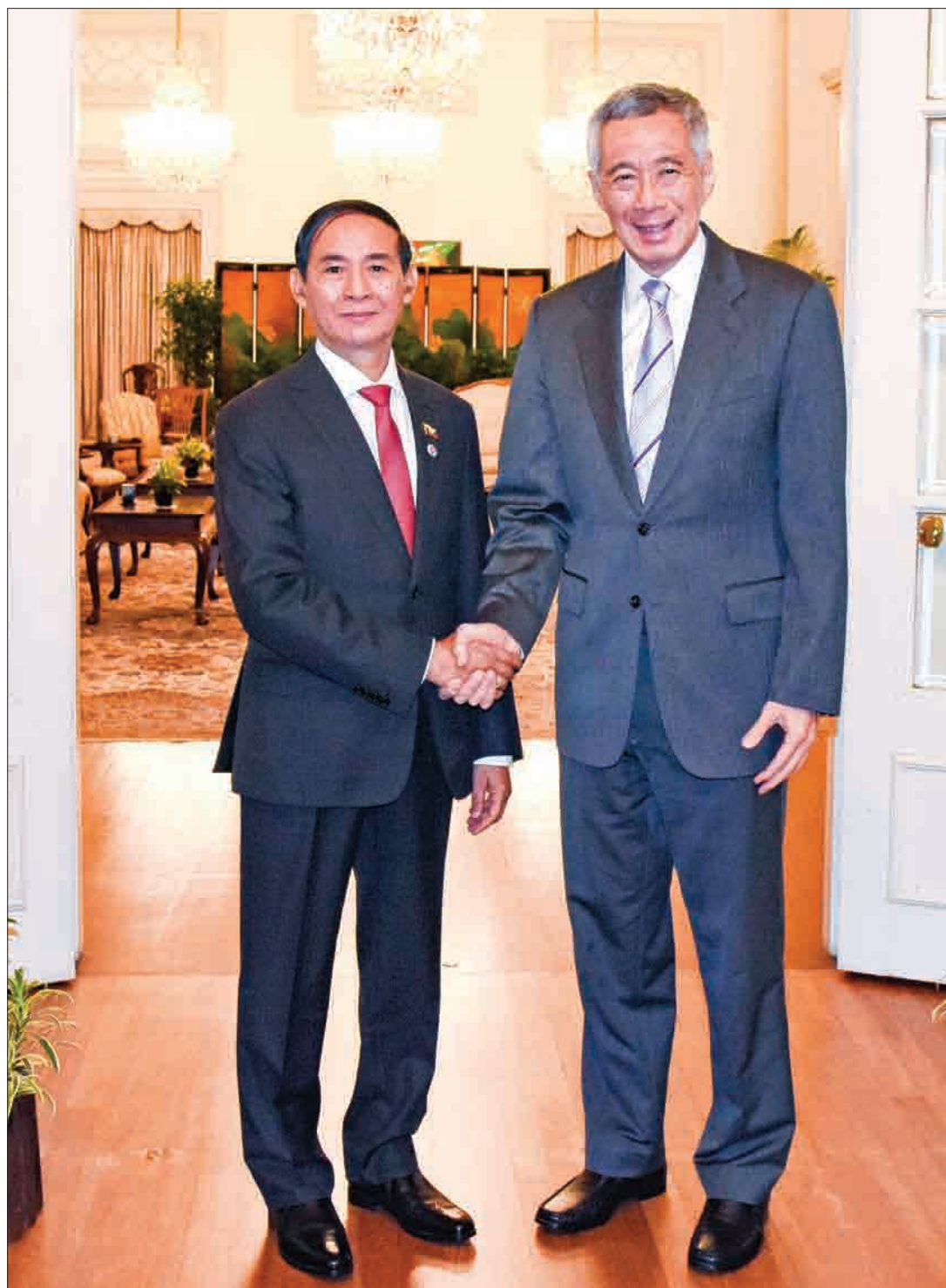
President U Win Myint is welcomed by Singapore Prime Minister Mr. Lee Hsien Loong in Singapore.

Encouraging results from talks between government and KNPP