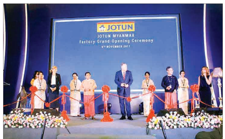
Opening ceremony of Jotun Factory in Bago City.

ble for 44 per cent of the regional taxes. Other taxes include fishery tax and forestry product tax.