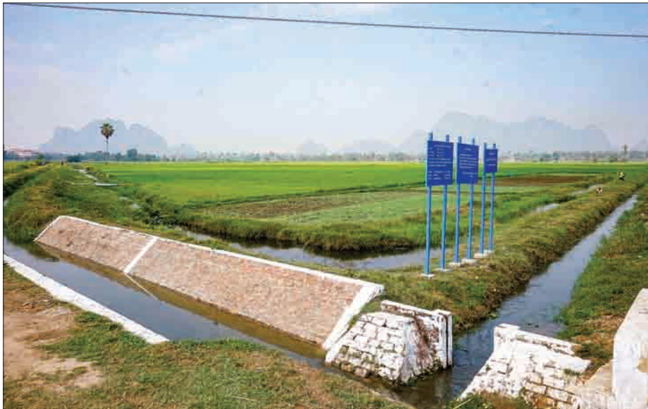
Barcap river water pumping project irrigates water to farmland in summer.