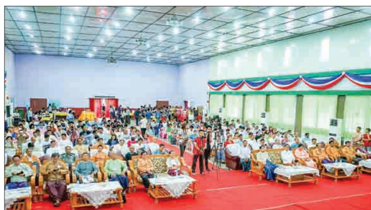
The 6th ethnic media conference taking place in Kayin State.