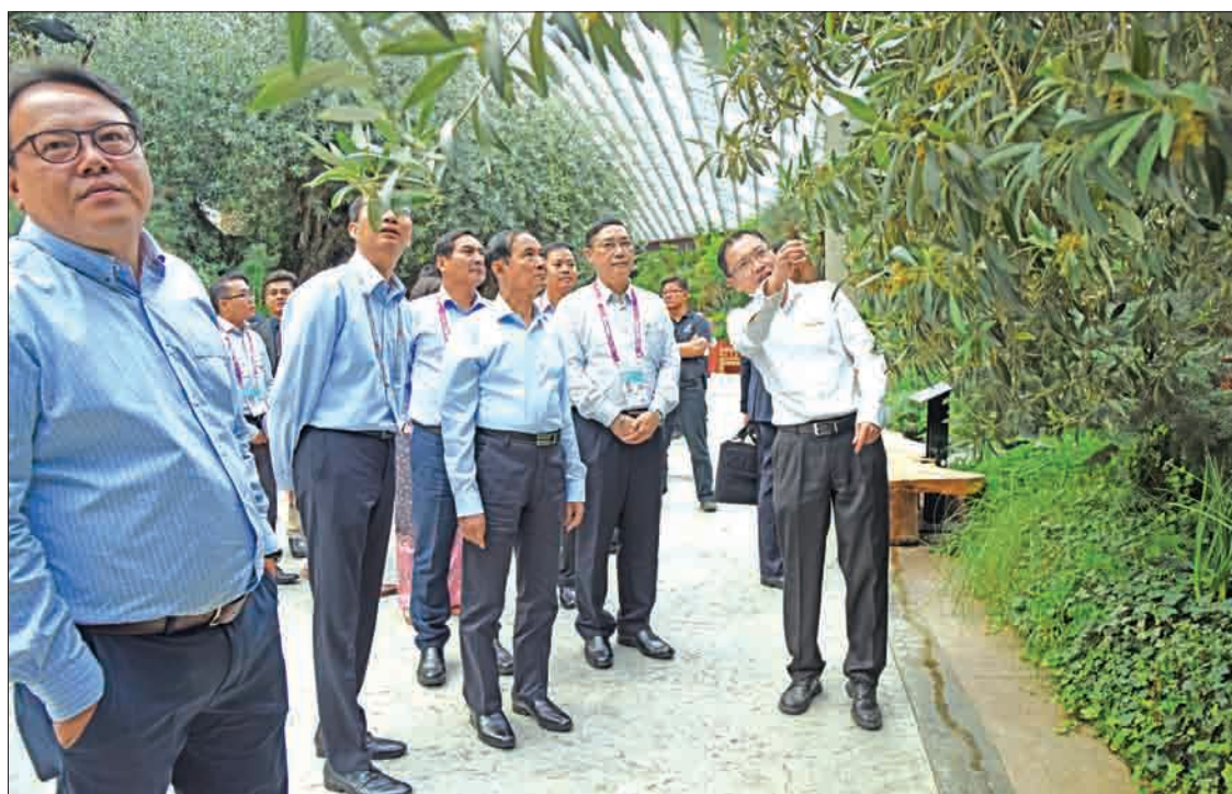
President U Win Myint and his delegation visit the Gardens by the Bay in Singapore yesterday.