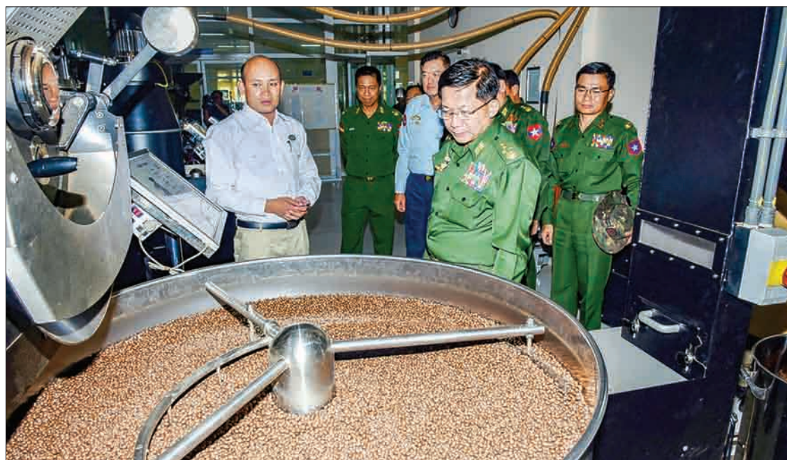
Senior General Min Aung Hlaing visits a coffee plant in Pyin Oo Lwin.