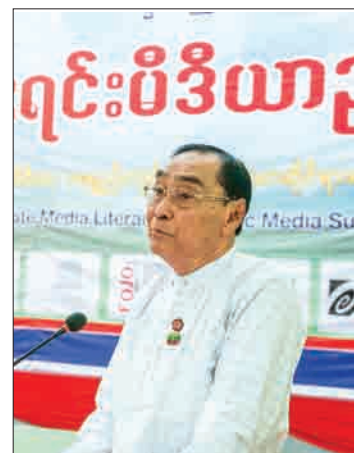
Union Minister for Ethnic Affairs Nai Thet Lwin.