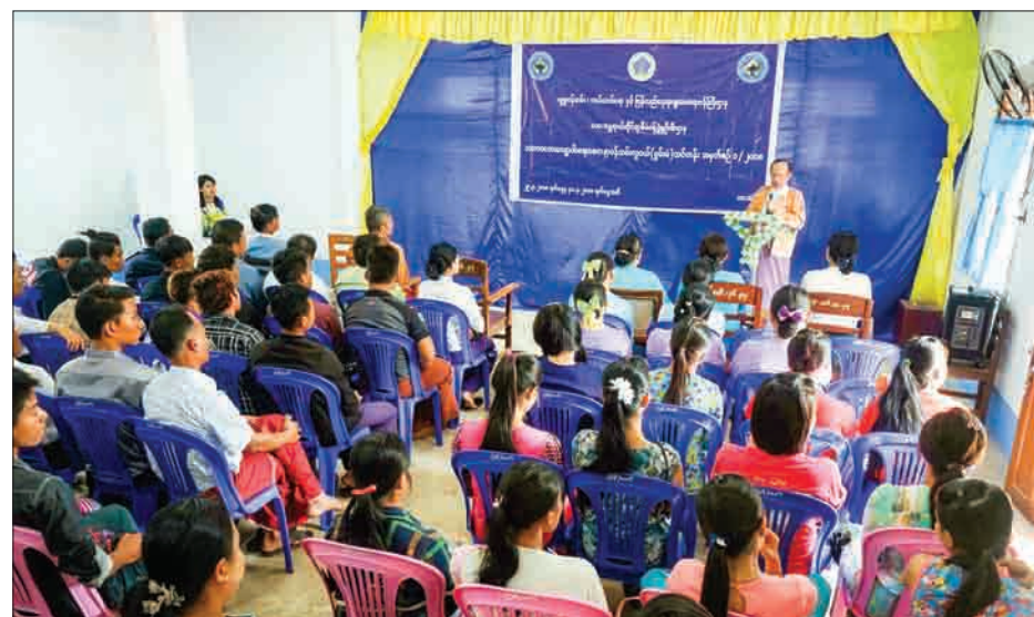
Volunteers attend training for disaster preparedness.