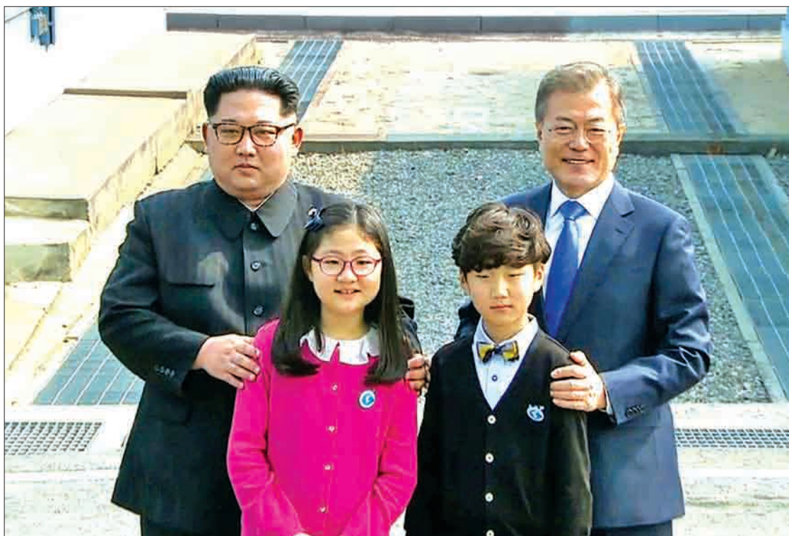
North Korea's leader Kim Jong Un and South Korea's President Moon Jae-in (R) stand with children as they meet at the Military Demarcation Line that divides their countries at Panmunjom.

It is the highest-level encounter yet in a whirlwind of nuclear diplomacy, and intended to pave the way for a much-anticipated encounter between Kim and US President Donald Trump. The North's official