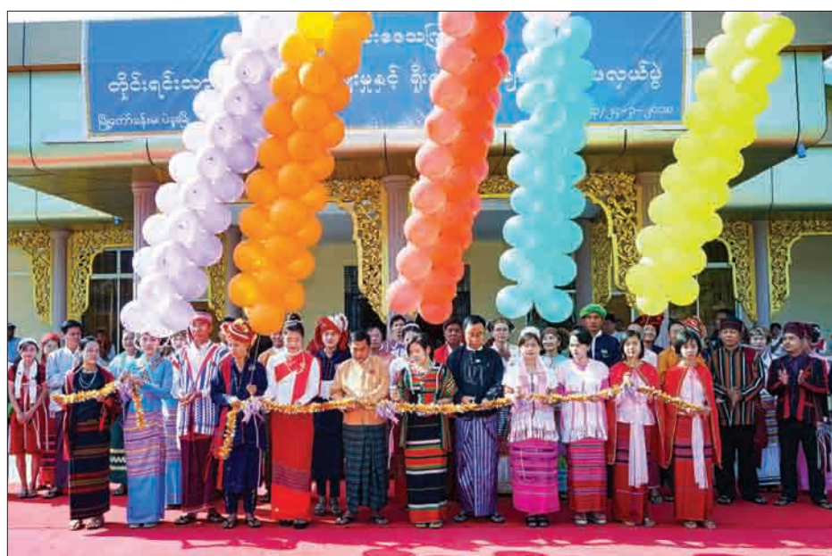
The opening of an ethnic literature and traditions exchange festival in Bago Township.

In the power supply section, the Bago Region has implemented 236 tasks with the aim of meeting electricity demand and upgrading the cables and installation of new cables under the electrification plan for the whole region.