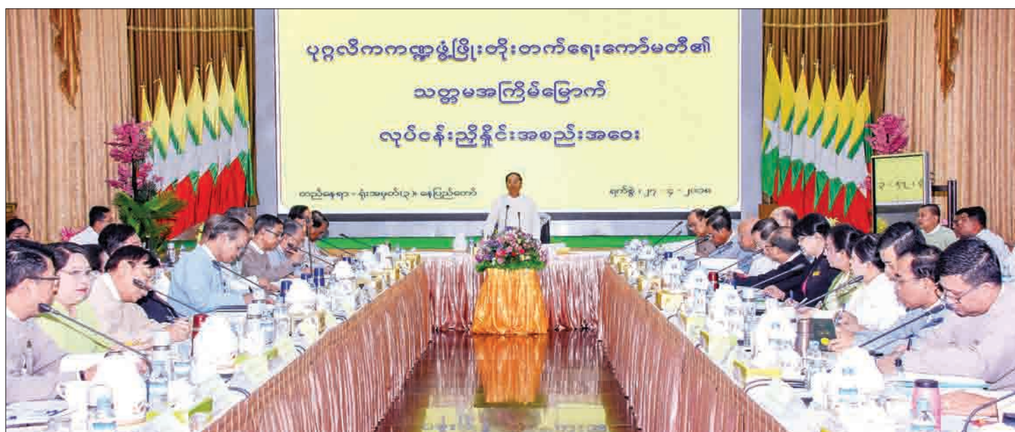
Vice President U Myint Swe addresses the 7 th coordination meeting of the Private Sector Development Committee yesterday.

Due to limitation of space we are only able to publish "Letter to the Editor" that do not exceed 500 words. Should you submit a text longer than 500 words please be aware that your letter will be edited.