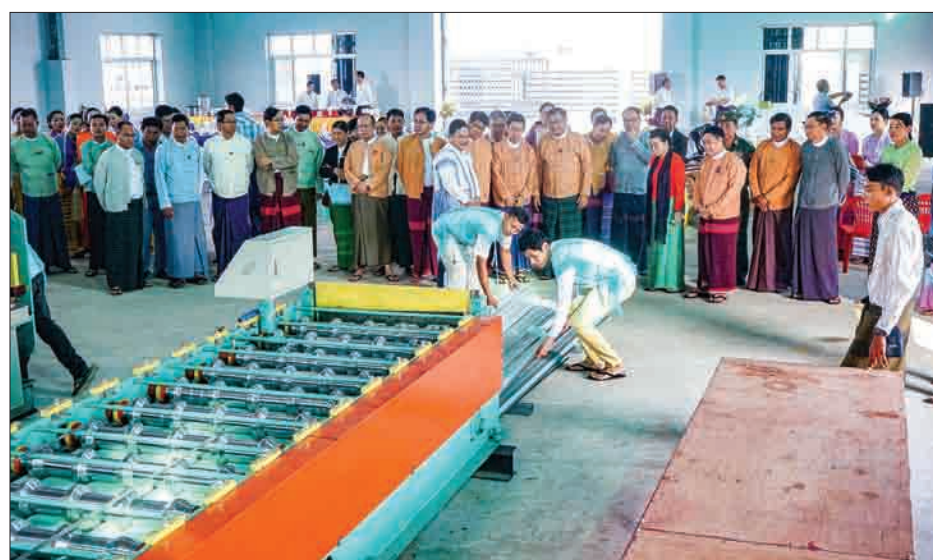
Chief Minister Daw Nan Khin Htwe Myint and officials visit Hpa-an Industrial Zone.