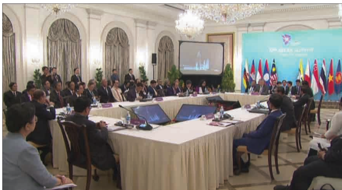
President U Win Myint attends the 32nd ASEAN Summit Plenary Session in Singapore.

The dinner and the plenary session were attended by Heads of State and Heads of Government, as well as representatives from the ASEAN member countries such as Brunei, Cambodia, Laos, Malaysia, Myanmar, Indonesia, the Philippines, Singapore, Thailand, Vietnam, and the ASEAN Secretary General. —Myanmar News Agency