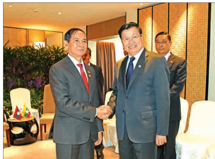
President U Win Myint meets with Prime Minister of Laos Thongloun Sisoulith in Singapore's Shangri La Hotel yesterday.