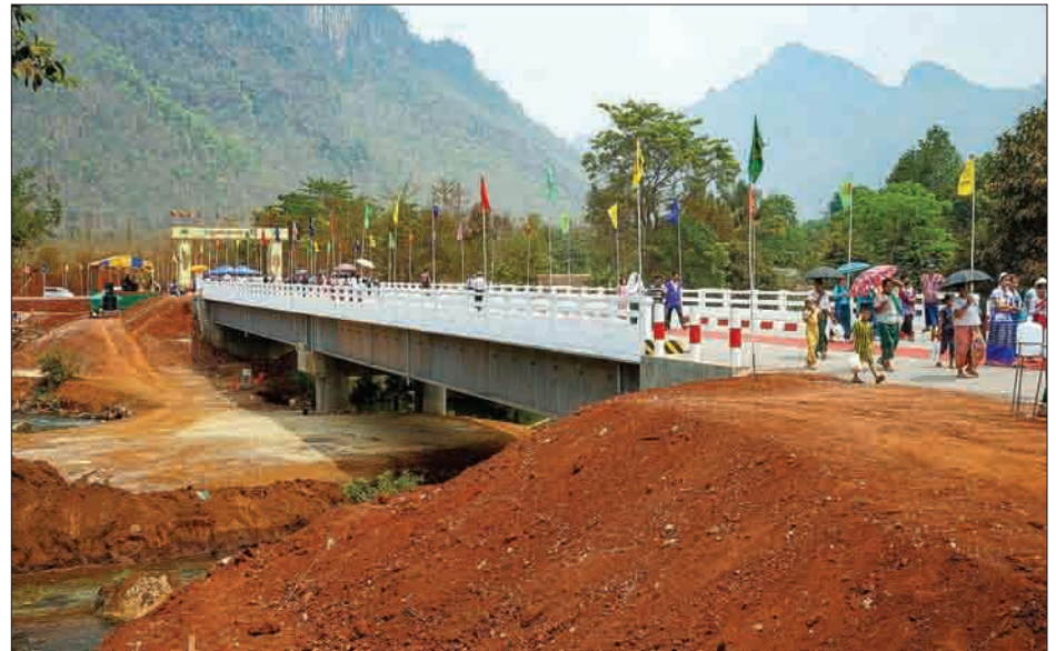
Makkatha Bridge on the Kyainseikkyi-Chaungson (Phayathonsu) Road.