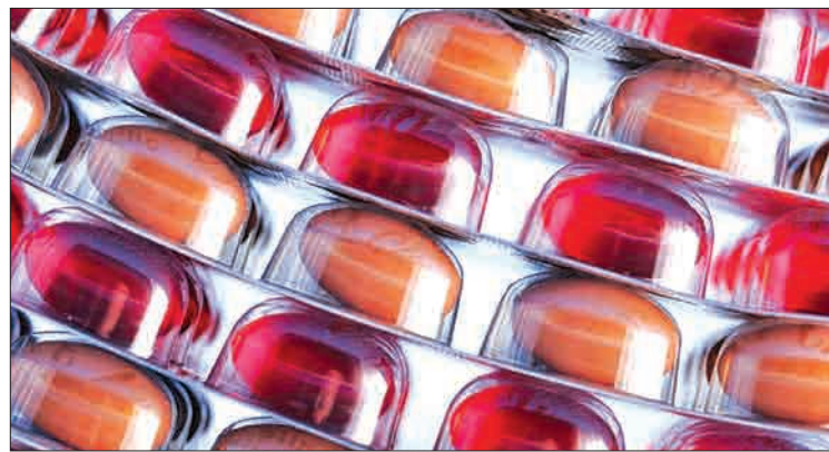
The study in more than 300,000 people in Britain found that those diagnosed with dementia were almost a third more likely to have been prescribed so-called anticholinergic medicines.

PARIS— Long-term use of certain anti-depressants have been linked to dementia in a large British study, researchers said Thursday, though they could not definitively conclude that the drugs were the cause.