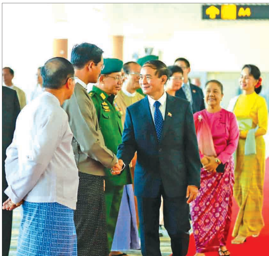
President U Win Myint is seen off by vice presidents and dignitaries at Nay Pyi Taw International Airport as he departs for Singapore.

The quarter tical gold coins can be bought at the Myanma Gem Enterprise sales centres (Nay Pyi Taw, Yangon, Mandalay) at the prevailing gold rate of the day, along with a payment of the casting fee of Ks12,500, according to the Central Bank of Myanmar.— Myanmar News Agency ■