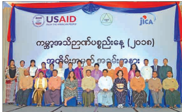
Union Minister Dr Myo Thein Gyi and attendees pose for the photo at the World Intellectual Property Day (2018) in Nay Pyi Taw.

WIPO holds the World Intellectual Property Day event annually by designating a theme. The theme for 2018 is "Powering Change: Women in Innovation and Creativity." WIPO highlighted this theme to encourage women in creative and technological fields. It also wants to prove that the intellectual property rights system