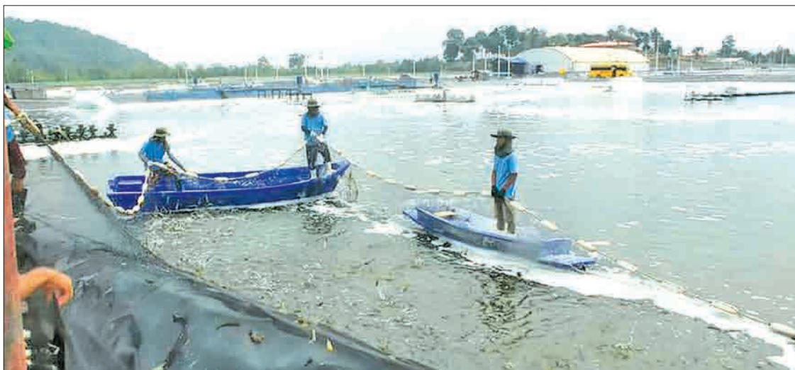
Workers seen at seawater prawn breeding plant in Myeik, Taninthayi Region.

may take time. Therefore it is quite difficult to guess how long it will take as the move will change the whole market.