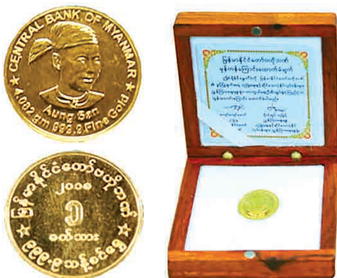
Quarter tical gold coin.

The Central Bank of Myanmar has been issuing quality tical, half tical and quarter tical gold coins since 1991.