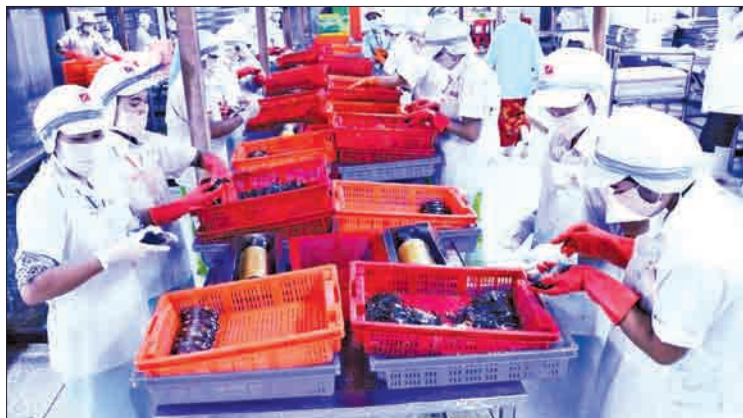
Workers processing crabs at a cold storage factory in Kyunsu Township.