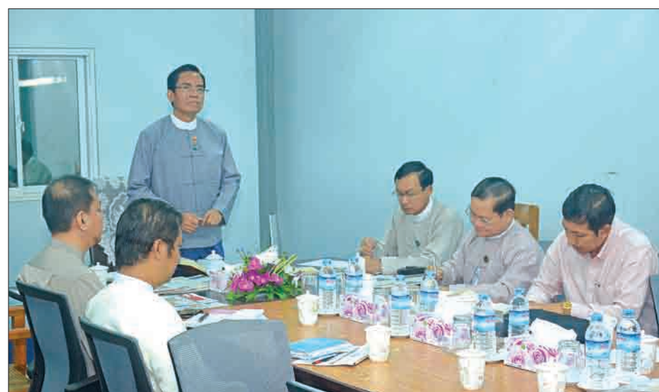
Deputy Minister for Information U Aung Hla Tun addresses the meeting with editors from state-run print media at the Global New Light of Myanmar.

When a policy related to a certain country is adopted in the international community, this policy is based much on the image of that country portrayed by international media. Therefore, it is important to deal systematically with international media. Both state- and private-owned media in the country have lagged far behind for half a century, Myanmar had to face and is facing difficulties in reporting its news to the world.