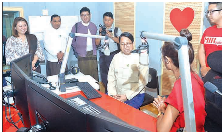
Union Minister for Information Dr Pe Myint visits the news broadcasting room of Myanmar International Radio (MIRadio) in Yangon on 21 October 2017.