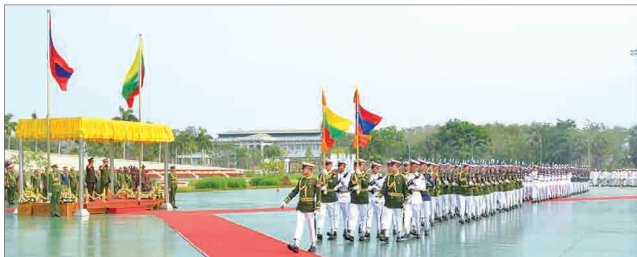
Senior General Min Aung Hlaing and Lt. Gen Souvone Leuangbounmy take the salute from the Guard of Honour in Nay Pyi Taw yesterday.

ing I-11 in Nay Pyi Taw yesterday afternoon. During the meeting, they openly exchanged views and discussed matters related to the increasing bilateral relation and cooperation.—Myanmar News Agency ■