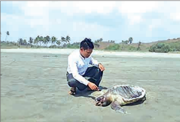
Dead sea turtle found along the seaside of Kyarkan village, Hainggyikyun, Ayeyawady.

The fisheries department from Hainggyikyun is checking the turtle size, its species and the cause of death, in cooperation with officials from the tur-