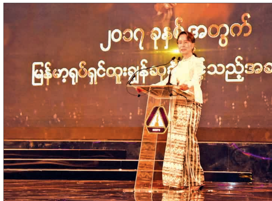
State Counsellor Daw Aung San Suu Kyi delivers the speech at the Myanmar Motion Picture Academy Awards Presentation Ceremony for 2017 at Myanmar Event Park in Yangon.

A: Literature development including Myanmar literature development and increase in the number of readers in our country are the main factors for knowledge