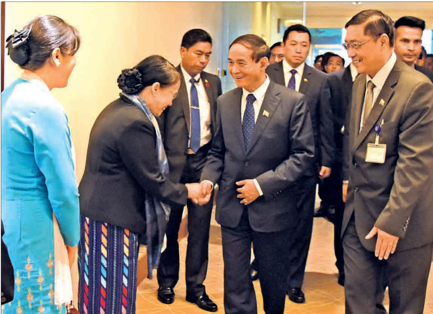
President U Win Myint is welcomed by dignitaries at Singapore's Changi International Airport yesterday.