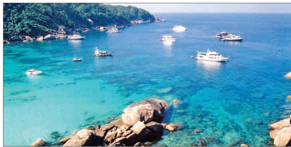
Cruise ships in the Myeik Archipelago.

To sell fish and other marine produce or seafood, Myanmar traders currently have to travel specific trading sites and we need to have a strong local market in Myanmar and Thailand.