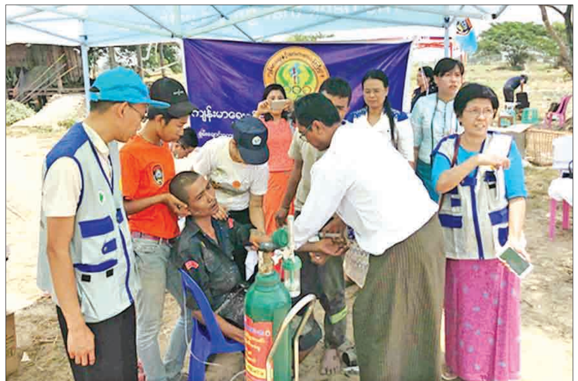
Medical team providing medical treatment to a fire fighter at a temporary emergency healthcare clinic in Hlinethaya Township, Yangon.

The central field group members from the Department of Public Health and Department of Medical Services joined the existing field groups on site and the Yangon Region Public Health Department officials, and formed three smaller groups to reinforce the firefighting works conducted in Hlinethaya Township ward (6), ward