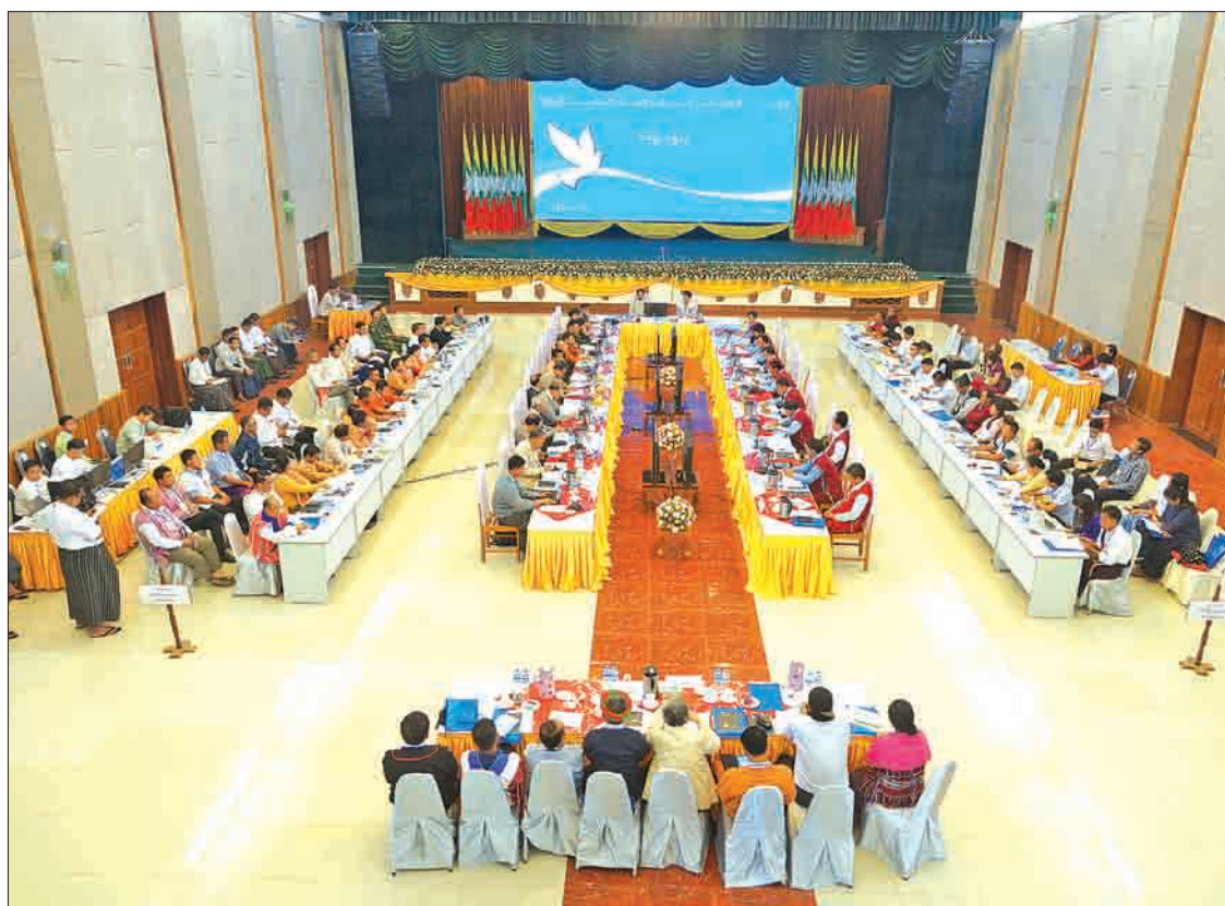
Representatives sit down for holding peace talks for signing NCA in Loikaw.

self-administration, and a basic constitution for each state is something all ethnic people want. He said he wishes for the voice of the Karreni National Progressive Party (KNPP) and the Kayah People to be heard during the meeting.