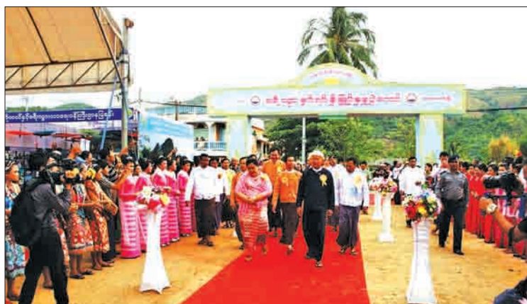
The opening ceremony of Tourism and Investment Festival held in Kawthoung in February 2018.