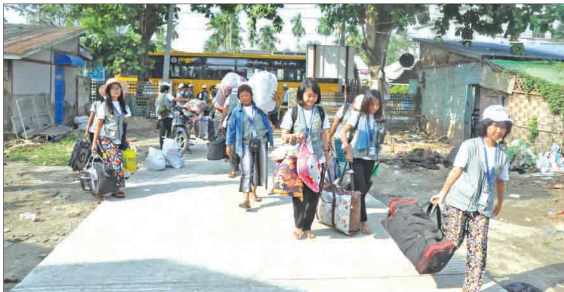
UEHRD youth volunteers arrive Sittway to provide food and collect data in Rakhine State.

discussed and exchanged views on matters related to increase bilateral friendship between Myanmar and Singapore, and courses that could be conducted to raise the quality of the Myanmar parliament staff. —Myanmar News Agency ■