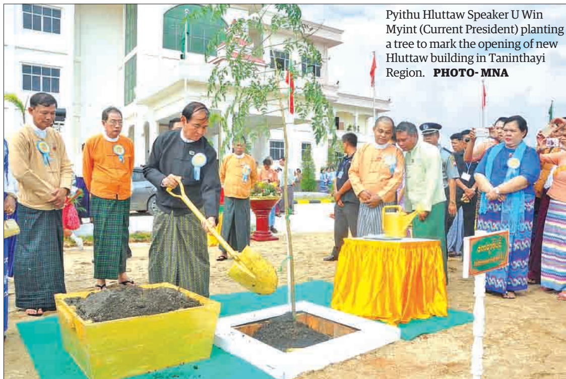
Pyithu Hluttaw Speaker U Win Myint (Current President) planting a tree to mark the opening of new Hluttaw building in Taninthayi Region.