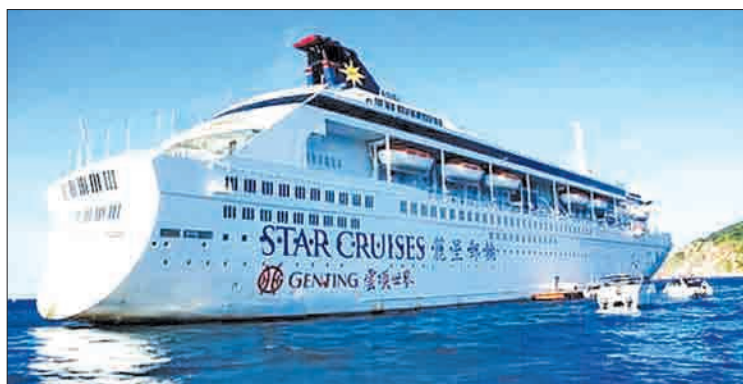
Star Cruises luxury ship docks.