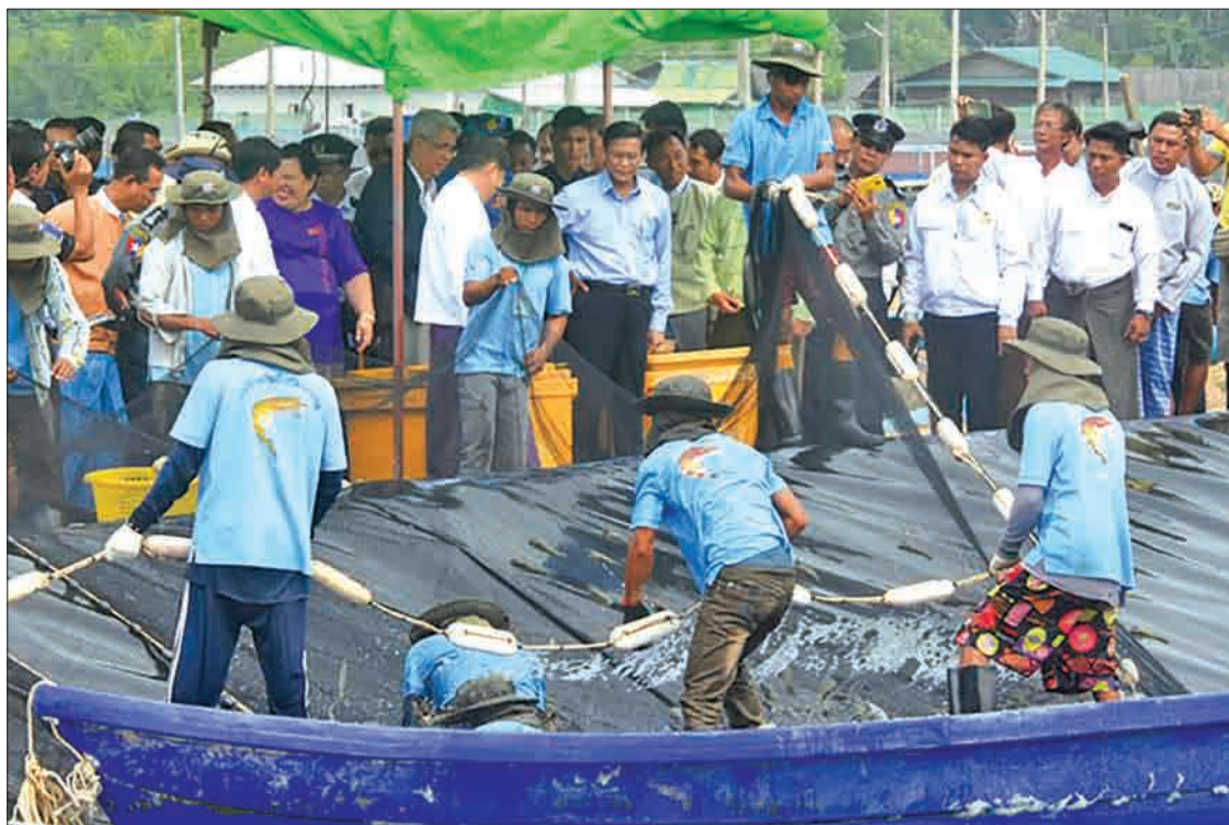
Vice President U Henry Van Thio visits seawater prawn breeding plant in Myeik, Taninthayi Region.

In 2015, Myanmar, Thailand and Japan signed a memorandum of intent (MOI) which allows the three countries to use Dawei SEZ Development Co. Ltd as a