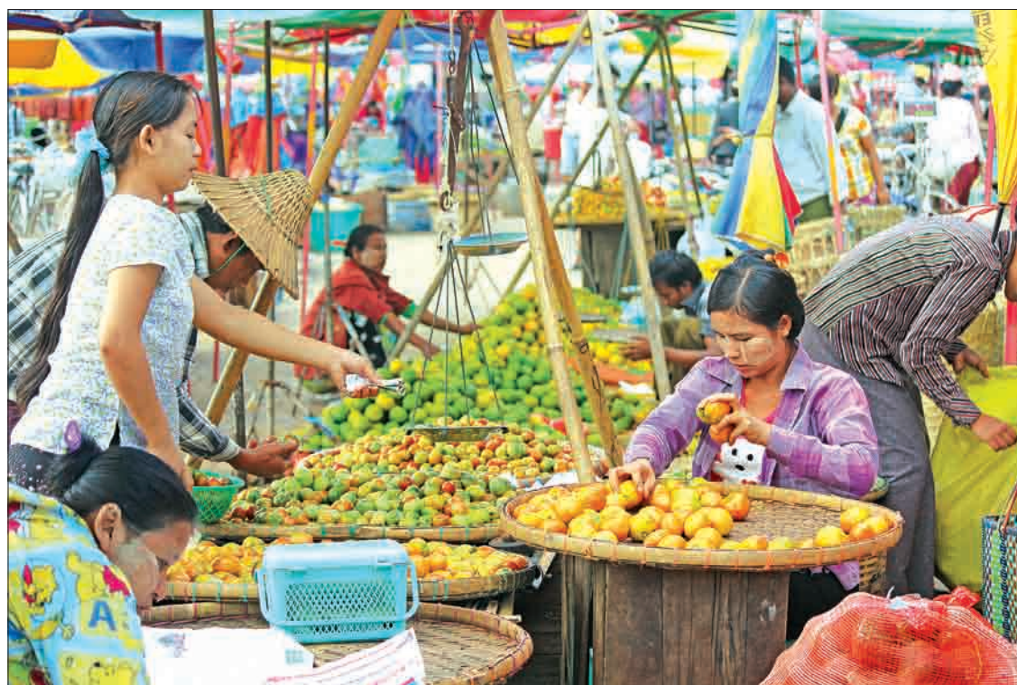
Woman selling tomatoes on the street market.

Tomatoes are selling well in Mongyawng Township in eastern Shan State, with farmers seeing high yields this year.