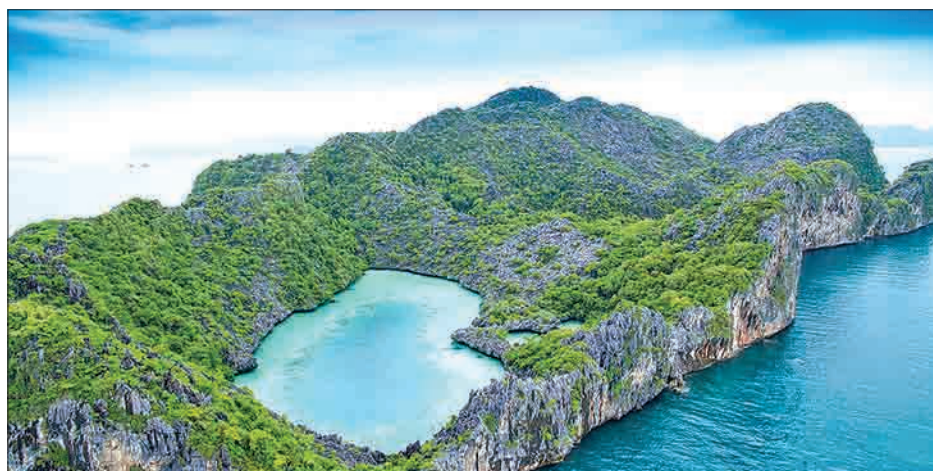
Cocks Comb Island in Myeik Archipelago.