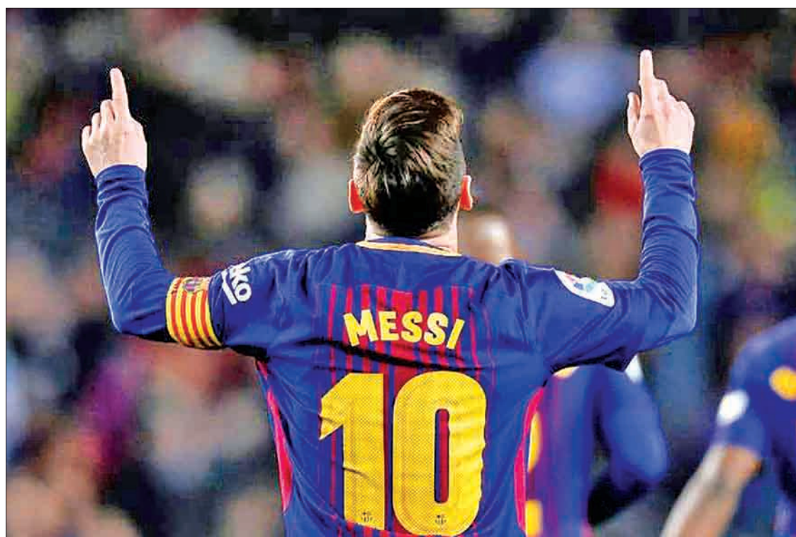
A court rules that Lionel Messi is too famous to be confused with a company with a similar name.

cling goods company filed an appeal the same year, saying there was a "likelihood of confusion" with its own trademark, and the trademark office agreed.