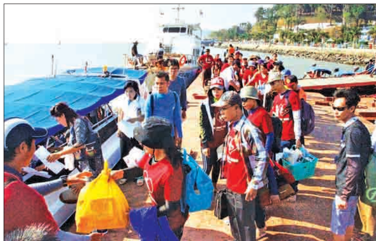
Local and foreign visitors visit Kawthoung on Thai-Myanmar Border.