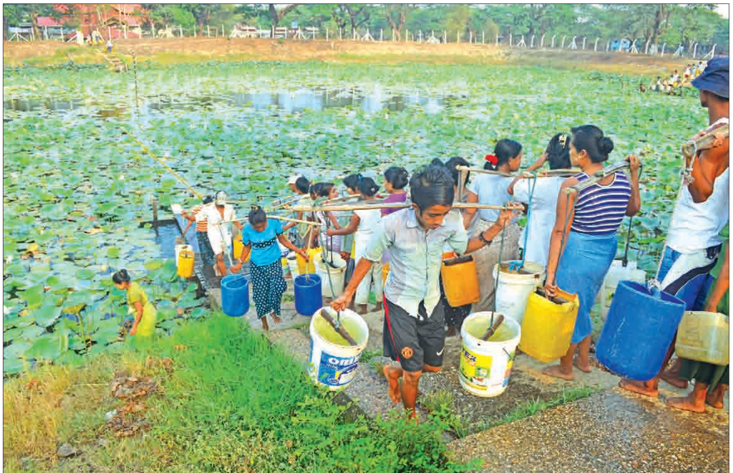
Residents collect drinking water from a lake in Dala Township located outside Yangon city.

Due to limitation of space we are only able to publish "Letter to the Editor" that do not exceed 500 words. Should you submit a text longer than 500 words please be aware that your letter will be edited.