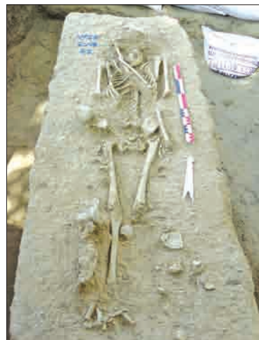
A Bronze Age skeleton uncovered by archaeologists in Sagaing Division.