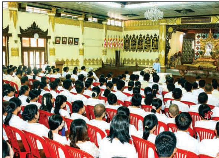
Union Minister Thura U Aung Ko meets with the staff from Department for the Promotion and Propagation of Sasana and International Theravada Buddhist Missionary University.

UNION Minister for Religious Affairs and Culture Thura U Aung Ko yesterday afternoon urged the departmental staff of the Religious Affairs and Culture Ministry to follow the New Year messages of the heads of state in his meeting with the staff.