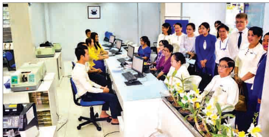
CB Bank opens new SME centre in South Dagon Township in Yangon Region.