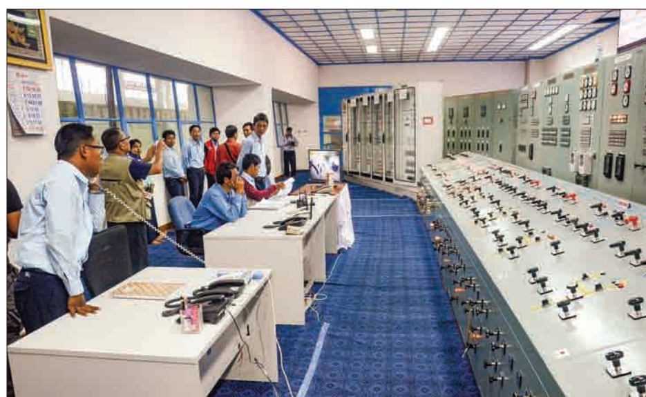
Officials seen at the Lawpita Hydroelectric Power Plant control station in Kayah State.