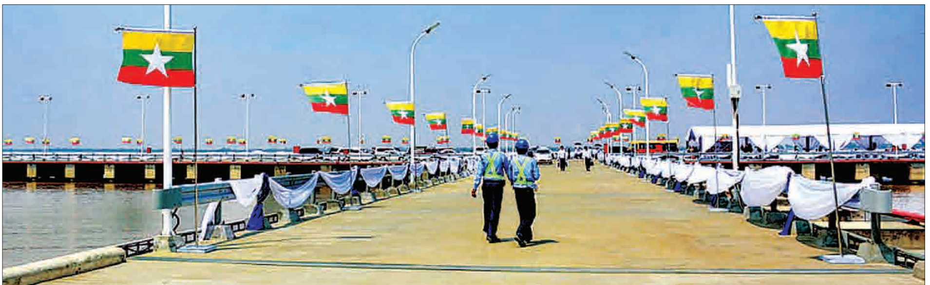
Thilawa storage tanks and jetty opened on 25 March 2018 in Yangon.

This is the first priority for the immediate future and it is important to grant access to credit as well as to create a new division in the administration to work with companies and assist them whenever they require guidance. The second point is education; it is important to lead these companies in terms of business development and show them how to put in practice a viable business plan. For this reason, we have decided to create an education plan for the SMEs sector.