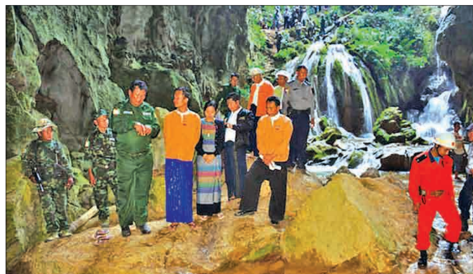
Kayah State Chief Minister inspects Htiparu Cave in Pruso Township as the Kayah State is promoting tourism in the state.