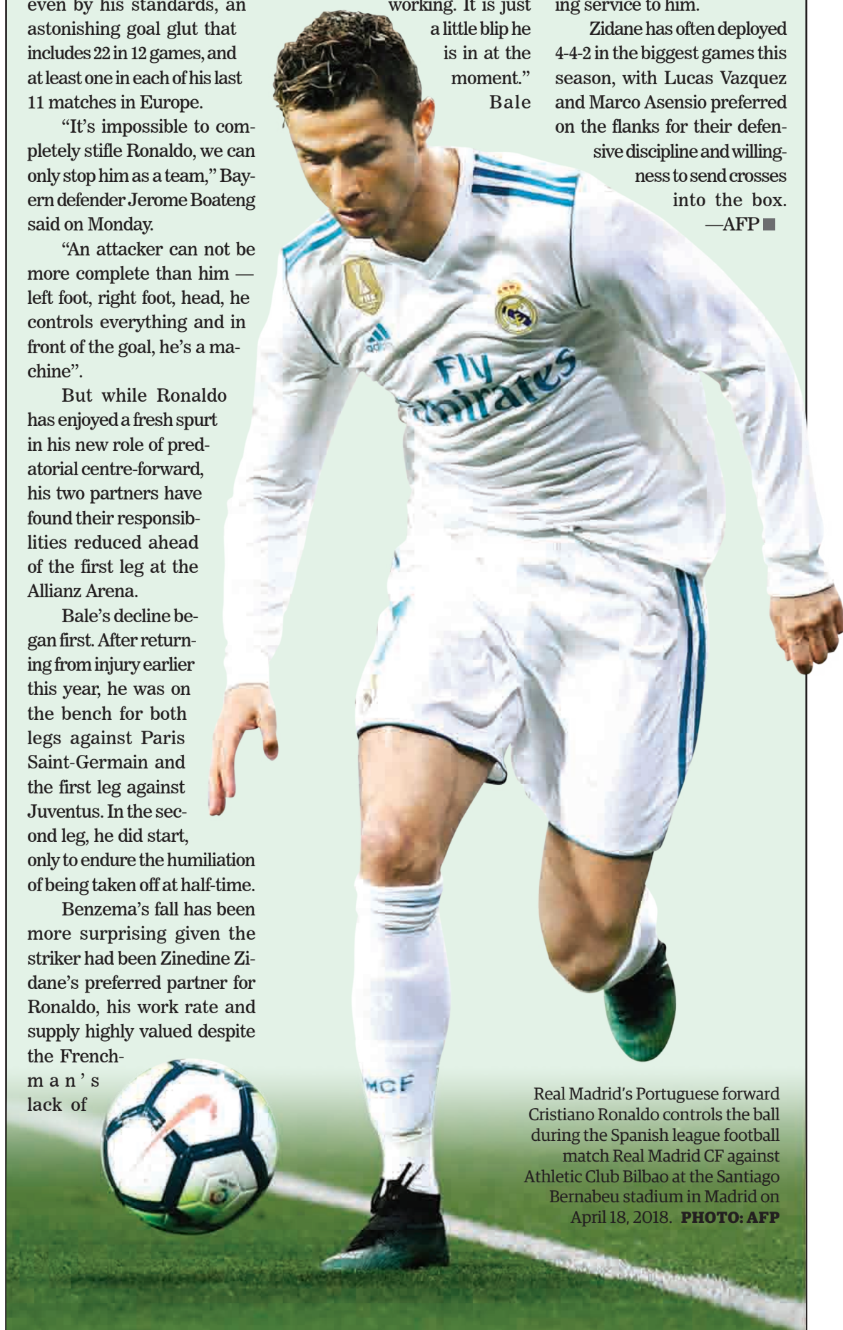
Real Madrid's Portuguese forward Cristiano Ronaldo controls the ball during the Spanish league football match Real Madrid CF against Athletic Club Bilbao at the Santiago Bernabeu stadium in Madrid on April 18, 2018.