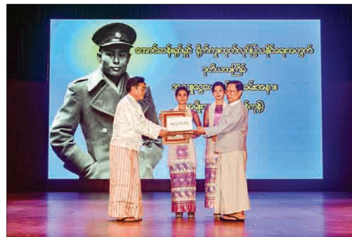
Union Minister Thura U Aung Ko accepts cash donation from donors and presents the documents of honour to donors.

The production of the documentary will be completed in 2019, and it will be screened in 2020. For the successful com-