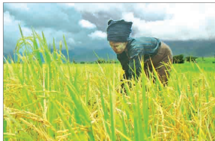
A farmer harvests rice in central Myanmar.

Some 3.5 million tonnes of rice were exported in the 2017-2018 fiscal year via sea, as well as through the border gates, according to the Myanmar Rice Federation. — GNLM ■