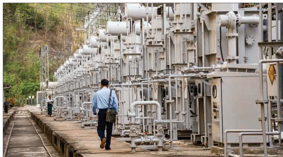
Lawpita Hydroelectric Power Plant located in Kayah State. It is operated by Electric Power Generation Enterprise.