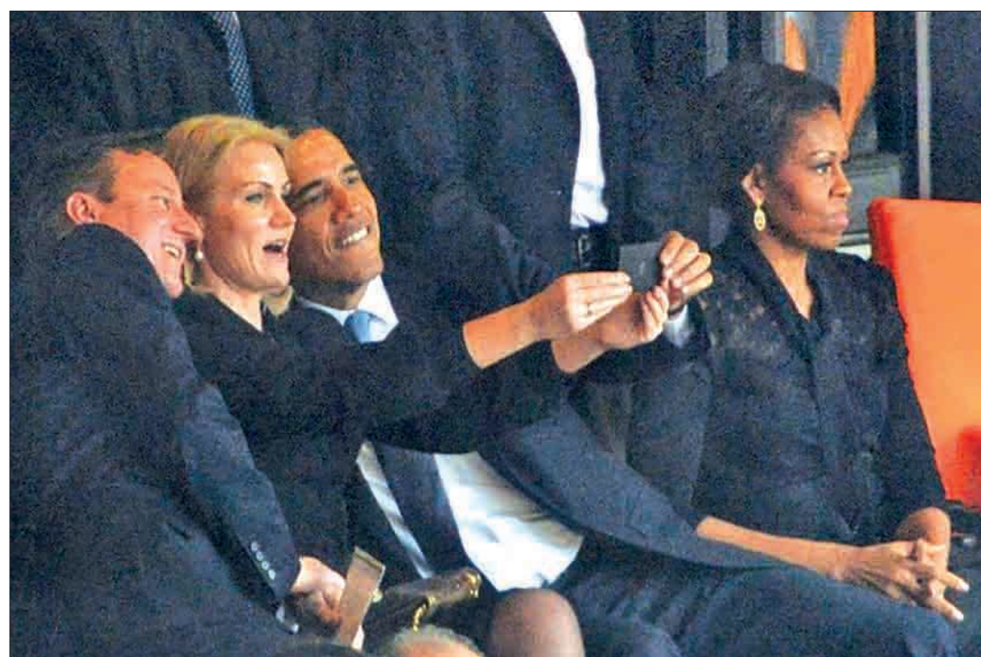
Obama and former prime ministers David Cameron of Britain and Denmark's Helle Thorning Schmidt pose for a selfie at Mandela's memorial service.

In his funeral address, Obama said Mandela “makes me want to be a better man” and hailed him as “the last great liberator of the 20 th century”. ■