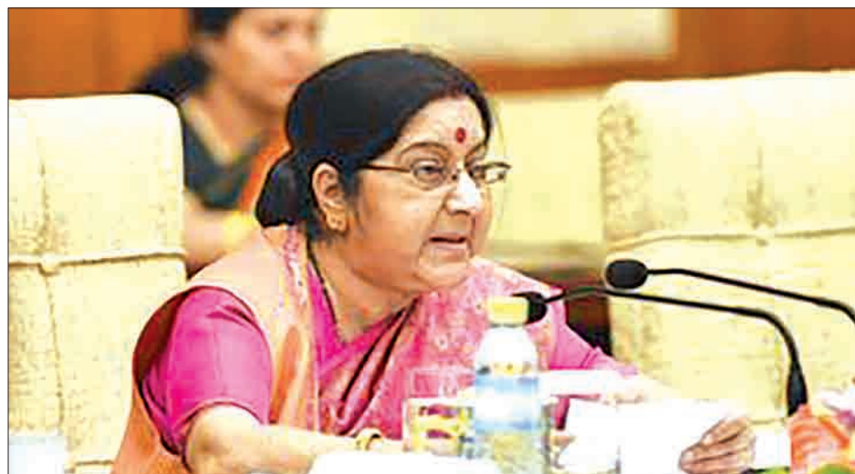
External Affairs Minister Sushma Swaraj.

BEIJING — External Affairs Minister Sushma Swaraj on Tuesday said that terrorism is an enemy of the basic human rights and the fight against it should also identify States that encourage, support and finance the menace and provide sanctuary to terror groups.