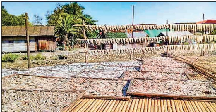
Dried fish baked in the sun.

From 2013, the Fisheries Department, under the Ministry of Agriculture, Livestock and Irrigation, has been closing the fishing area and fixing the breeding season. This year, the season will close from 16 May to 15 August. Earlier, fishing was totally restricted during the prescribed closed season. However, the fishery department relaxed this rule, allowing 20 per cent of the fishing vessels to operate during the season in response to a request made by Myanmar