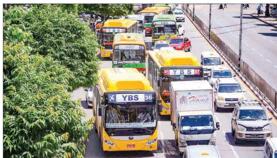
YBS buses seen in downtown Yangon.