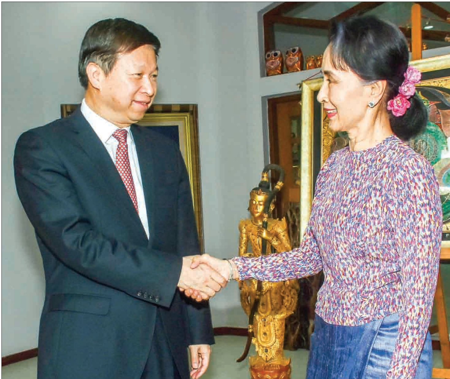
State Counsellor Daw Aung San Suu Kyi greets Mr. Song Tao, Minister of the International Department of the Communist Party of the People's Republic of China, in Nay Pyi Taw yesterday.