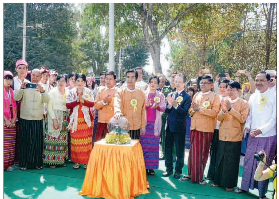
Kayah State Chief Minister U L Phaung Sho opens the new building of Kayah General Hospital in Loikaw, Kayah State.

According to state government, Loilimlay and Nanthpekhone villages were upgraded into a town levels during the second year of its in office.