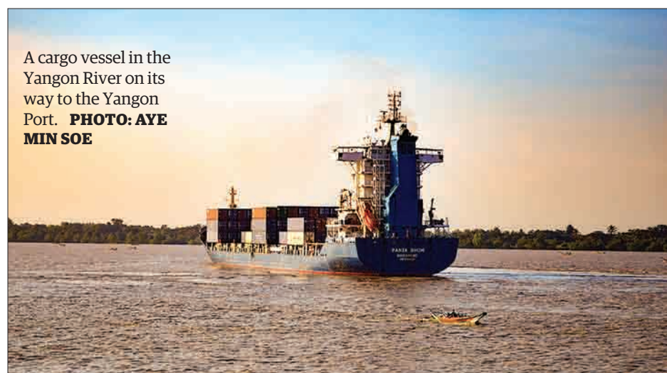
A cargo vessel in the Yangon River on its way to the Yangon Port.