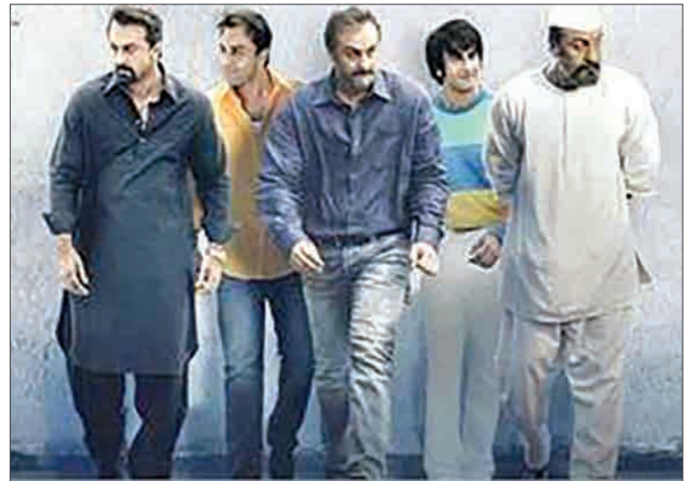
"Sanju" poster.

Also starring Dia Mirza, Sonam Kapoor, Anushka Sharma, Manisha Koirala, Paresh Rawal and Vicky Kaushal among others, the film releases on 29 June. —PTI ■