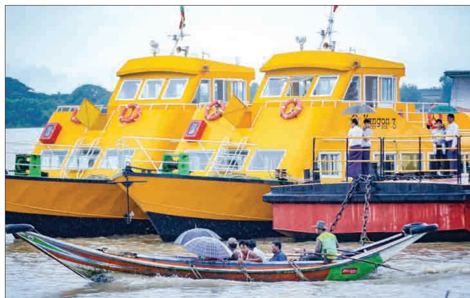
Two water buses are seen in the Yangon River at the ceremony before they are commissioned into service.

Many factories and workshops including 40 kinds of business are being operated currently. Among them, some four factories export goods at the moment.