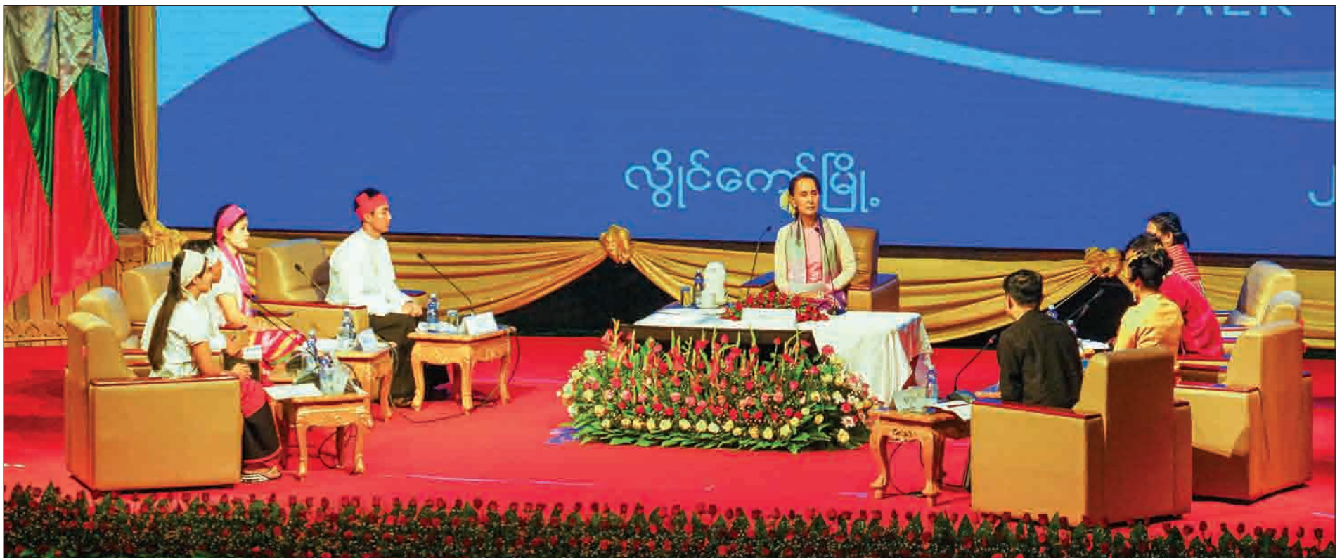
State Counsellor Daw Aung San Suu Kyi and youths in Kayah State discuss several issues including peace and development at the Peace Talk in Loikaw, Kayah State.