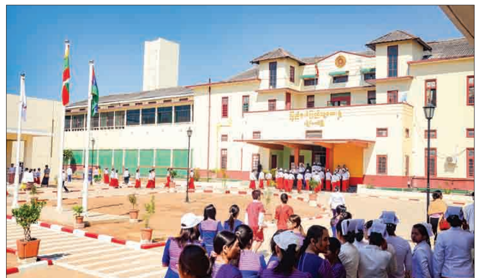
The new building of Kayah General Hospital in Loikaw.