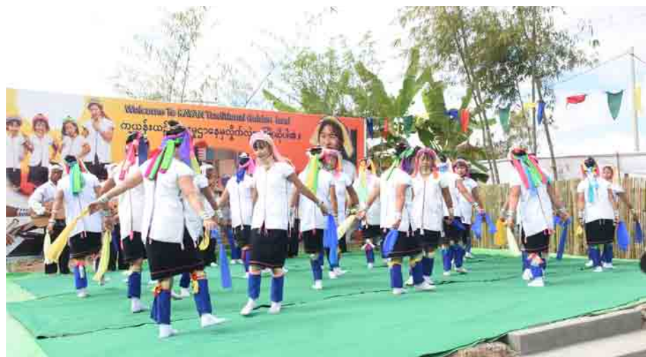
Traditional dance troupe of Kayan people performs to welcome visitors on 29 December, 2017, in Loikaw.