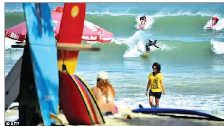
The boy, who ran away from his Sydney home after a row with his mother, had previously visited Bali on holiday with his family.

Children between five and 11 must be booked on an unaccompanied minor ticket while those from 12-15 are required to have a permission slip from their parent or guardian.—AFP ■