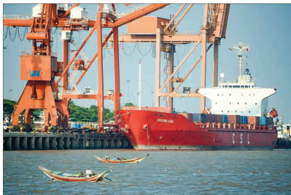
A cargo vessel moors at the banks of the Hlaing River in Yangon.