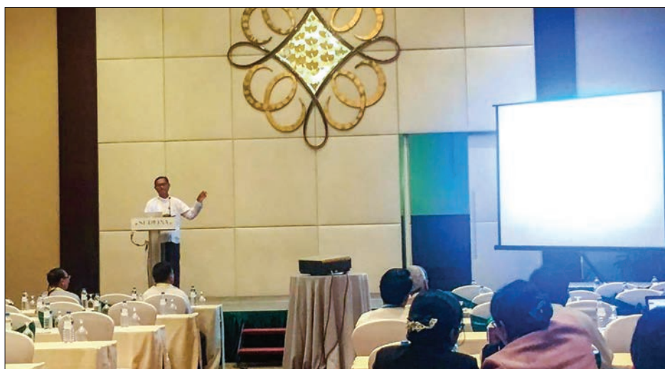
Director-General Dr Myint Soe reading the paper titled "The Inventory of Preliminary Geological Sites Assessment in Myanmar" at the 3th International Congress on Geology, Resources, Geo- hazards of Myanmar and Surrounding Regions Seminar.