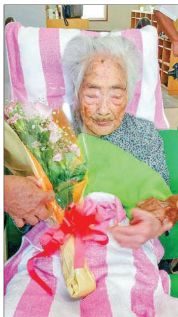
File photo taken in 2015 in Kikai, Kagoshima Prefecture, southwestern Japan, shows Nabi Tajima, who died at 117 at a hospital in Kagoshima, on 21 April 2018. The Japanese woman born in 1900 is believed to have been the world’s oldest woman.

US-based Gerontology Research Group recognized Tajima as the world’s oldest person last September after the death