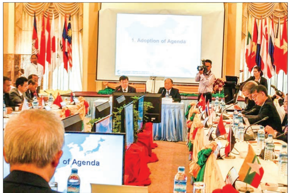
The CCOP Steering Committee Meeting is held in 2017.