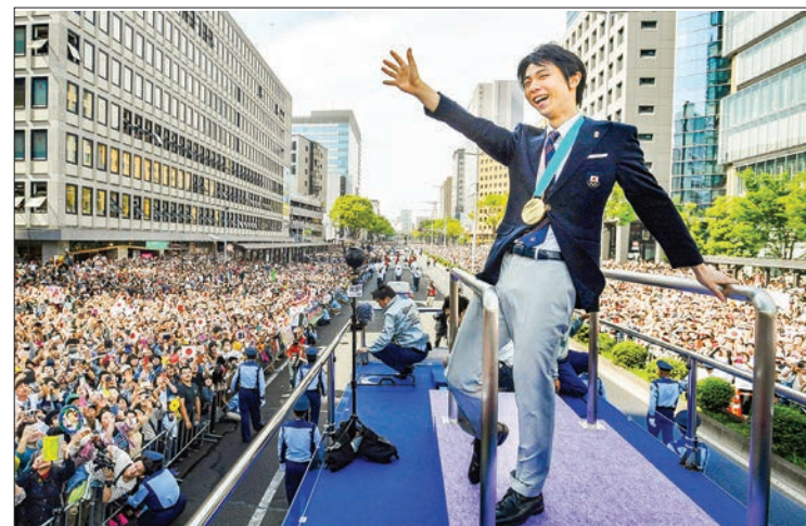
Pyeongchang Olympic figure skating champion Yuzuru Hanyu parades in his hometown Sendai in northeastern Japan on 22 April 2018.

The 23-year-old was given the prefecture’s award in 2014 when some 92,000 people gathered in the northeastern Japan city to celebrate his gold medal in the Sochi Olympics. “I’m so happy to be able to come back here with this gold medal and say ‘I’m home’ to people in Sendai,” Hanyu said. — Kyodo News ■