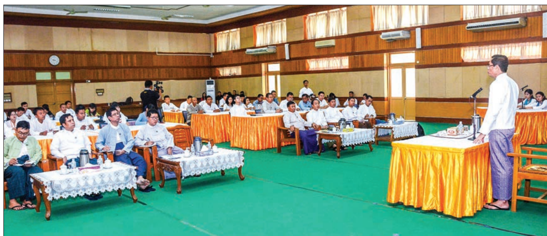
Deputy Minister for Information U Aung Hla Tun gives the opening speech at the opening ceremony for news writing course in Nay Pyi Taw yesterday.

To conduct news releases systematically, the departments