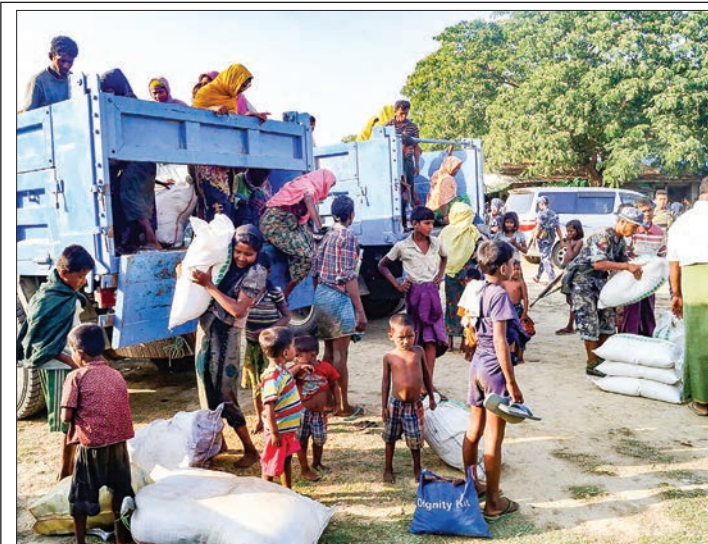
Displaced persons receive sacks of rice before returning home. PHOTO: DISTRICT IPRD (NEWS ON PAGE 1)

other Supreme Court judges, to pass judgments on six special civil appeal cases and hear six special civil appeal cases. —MNA ■