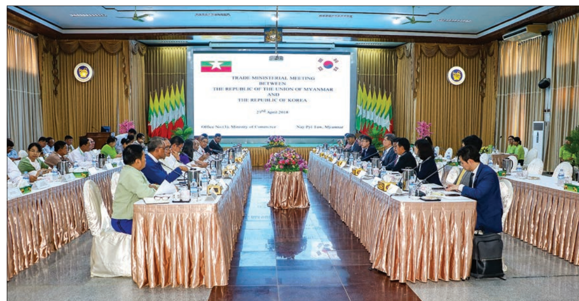
Trade Minister-level Meeting between Myanmar and South Korea held at the Ministry of Commerce, Nay Pyi Taw yesterday.

After the meeting, the delegation, led by Kim Hyun-chong, was hosted with a luncheon at Park Royal Hotel, Nay Pyi Taw. —Myanmar News Agency ■