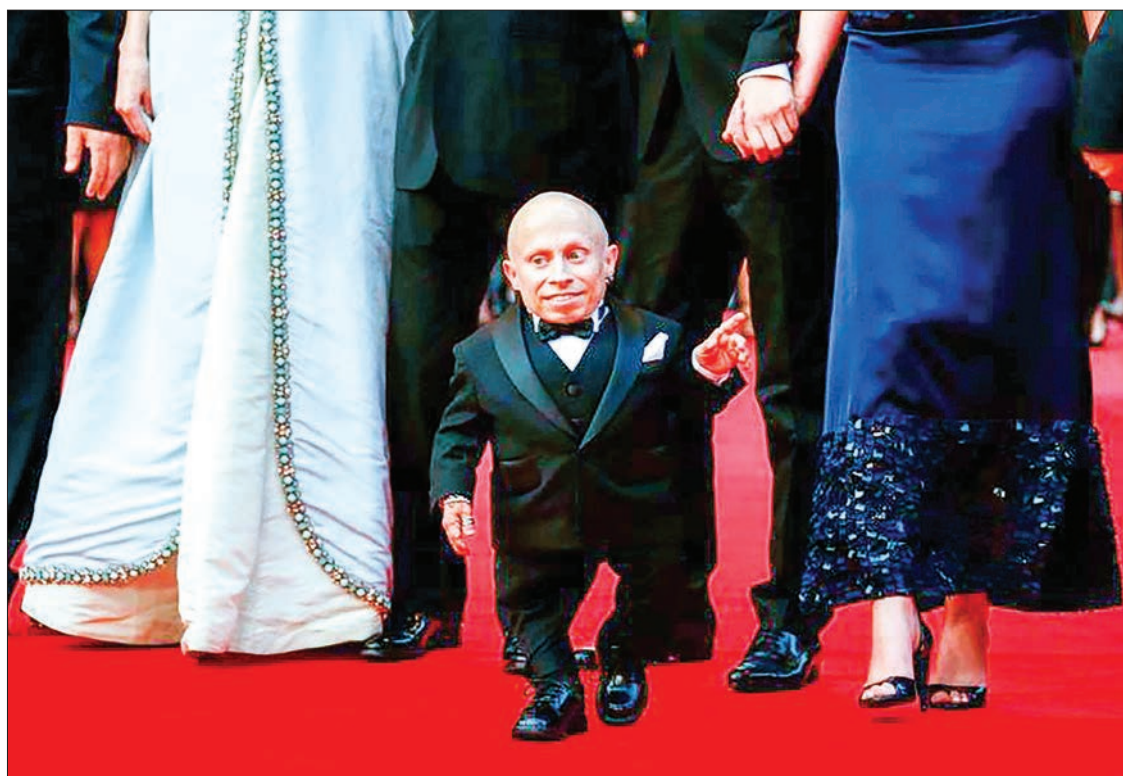
Verne Troyer was best known for his role as Mini-Me in the “Austin Powers” movies and as Griphook in “Harry Potter”

“Verne was the consummate professional and a beacon of positivity for those of us who had the honor of working with him,” Mike Myers, his “Austin Powers” co-star said in a state-