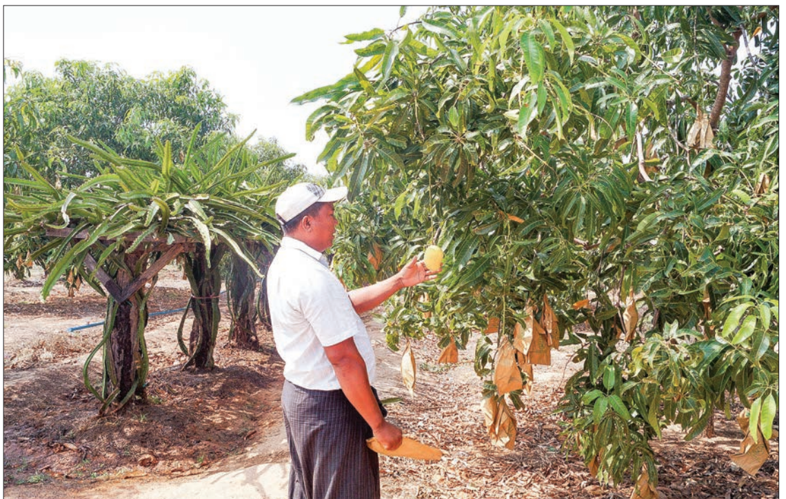
Mango stands at the top of the list of exported agricultural products. Four GAP-certified mango plantations in Kanbalu Township.