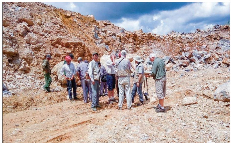
Officials from SEG group and Hteiktankyal Selzu company analyzing the lead mining in Bawsaq region, southern Shan State in 2017.

Union Minister : We have drawn up National Environmental Policy, Myanmar National Climate Change Policy, Myanmar Climate Change Strategy and Action Plan in accordance with the changes of