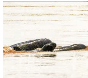
Conservationists have fresh hope for the future of the critically endangered Irrawaddy dolphin.

Cambodia is home to the largest population of Irrawaddy dolphins, which can also be found in rivers and lakes in Myanmar, Indonesia, India and Thailand.—AFP ■