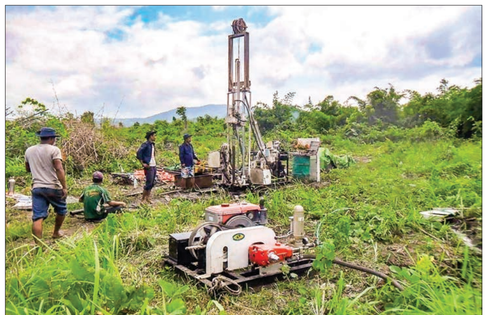
Geologists carry out field studies in Thebeikkyin Township, Mandalay Region.

development, there are three major panels under the ministry—social, economic and natural environment sectors. Among them, panel of natural environment conservation plays an important role.