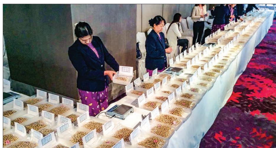
The 4 th International Myanmar Pearl Auction held in Hong Kong from 24-2-2016 to 26-2-2016.