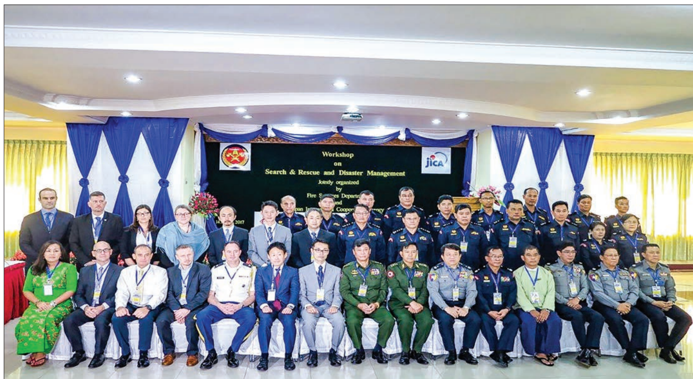
Union Minister for Home Affairs Lt-Gen Kyaw Swe and dignitaries pose for the documentary photo at the workshop on Search & Rescue and Disaster Management jointly conducted by Japan International Cooperation Agency (JICA).

Prisons Department build new jails spending Union Government's budget. The cells for the inmates are set at 18 square feet for one inmate. Water purifiers were also installed at 94 prisons spending 854.63 million kyat. With the loans from