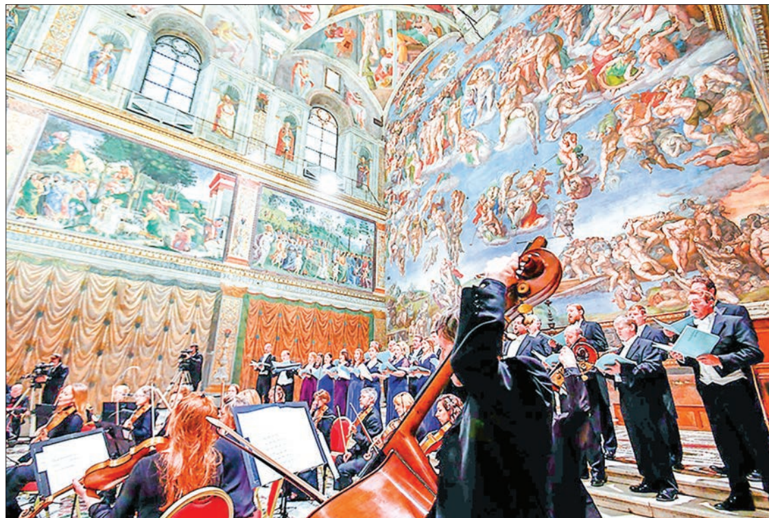
The British choir perform the sir James MacMillan's Stabat Mater conduct by British composer Harry Christophers, in a concert live streamed for the first time from the Sistine Chapel at the Vatican on 22 April, 2018.

MacMillan, 58, who has composed many pieces of sacred music, was commissioned by