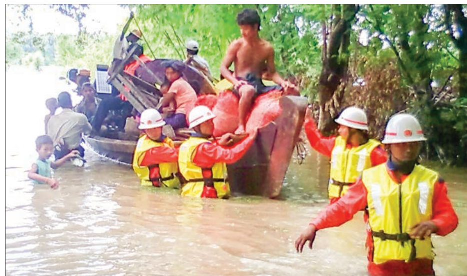
Firefighters are rescuing the villagers who are trapped in flood.