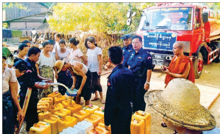
Local villagers carrying water which is their main source of usable water donated by the Fire Services Department.

To curb danger posed by narcotic drugs, Narcotic Drugs and Psychotropic Substances Law was amended to be in line with the international standard.