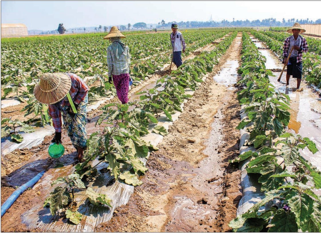
Farmers work in the organic farm in Nay Pyi Taw.