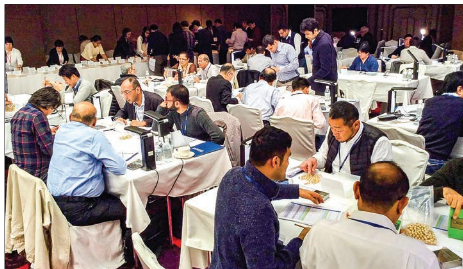
Merchants evaluate pearls at the 4th International Myanmar Pearl Auction in Hong Kong.