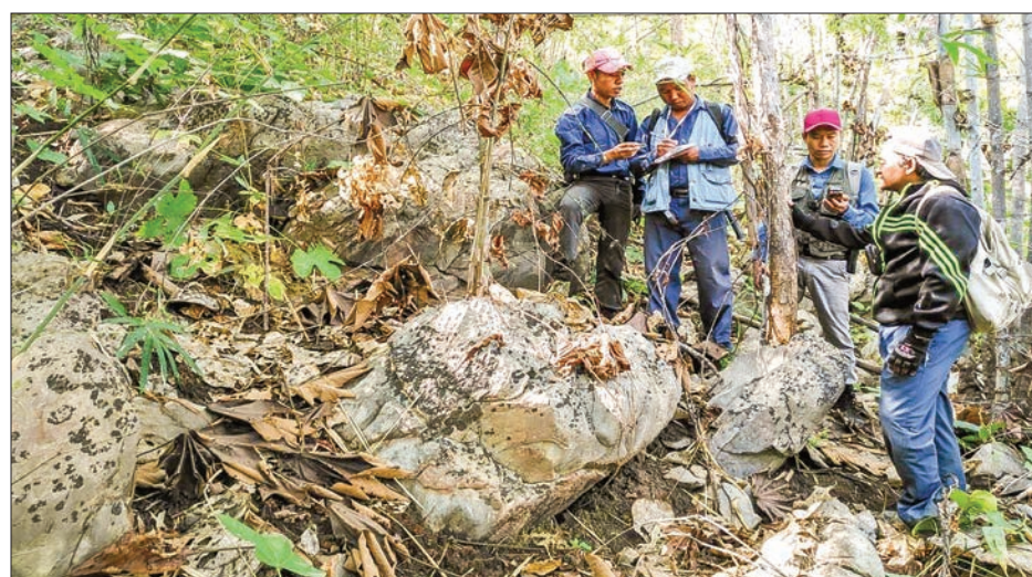
A mining survey team measures a limestone in Haka Township.