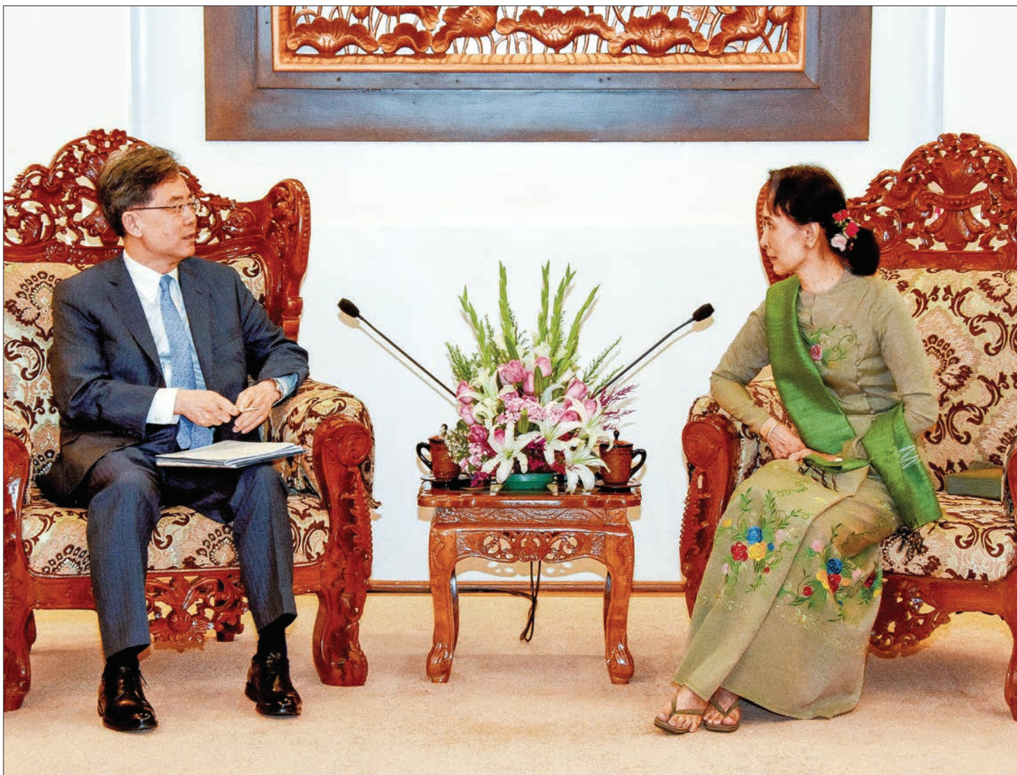
State Counsellor Daw Aung San Suu Kyi (Right) receives Mr. Kim Hyun-chong, Trade Minister of ROK in Nay Pyi Taw.