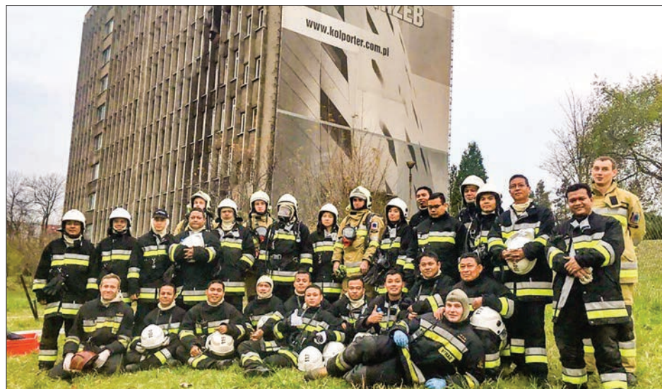
Firefighters received training course as part of ODA programme in Poland.