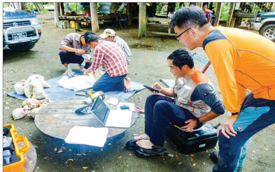
Experts observing chromium minerals using a portable XRF instrument in Bopebon mountain in 2017.

Union Minister : As regards the long-term development, the Ministry has the department of conserving natural environment. It is a major department which carries out the conservation of natural environment. For sustainable