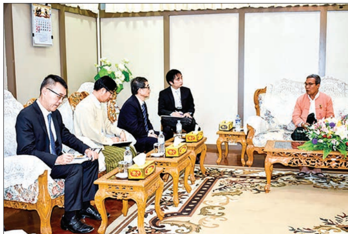
Rakhine State Chief Minister holds talks with the delegation led by representative of Taipei Economic and Cultural Office in Myanmar Chun-Fu Chang at the State Chief Minister's Office.

During the meeting, they discussed matters related to cooperation and participation in agriculture and livestock breeding works for Rakhine State development, upgrading the libraries in the district and township offices of the Information and Public Relations Department (IPRD) into community centres through co-operation between the IPRD and Daw Khin Kyi Foundation, conducting computer training courses and cooperating with the state government in provid-