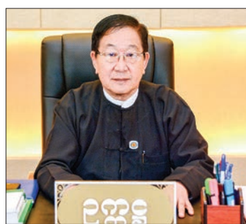
Pyithu Hluttaw Speaker U T Khun Myat.

Our policy is to carry out our duties in accord with the constitution and be free of ethnic, racial, or ideological bias.