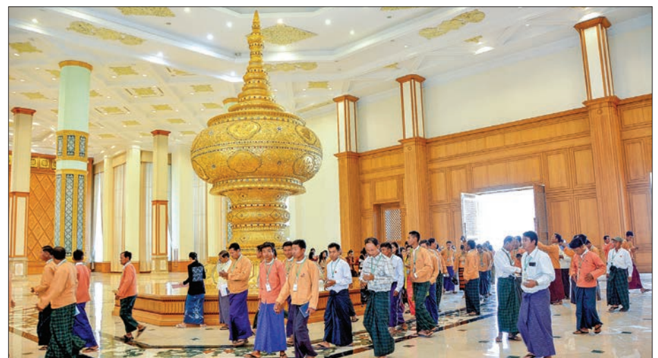
Members of the National League for Democracy visit Pyithu Hluttaw.