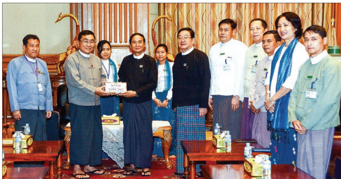
The then Pyithu Hluttaw Speaker U Win Myint (current President) presents cash assistance for UEHRD to Union Minister Dr Win Myat Aye in Nay Pyi Taw on 26 October 2017.

Q: Were there other significant processes?