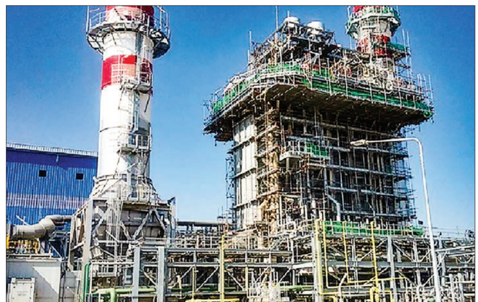
Photo shows 255-megawatt Sembcorp Myingyan gas-fired power plant in Mandalay Region.