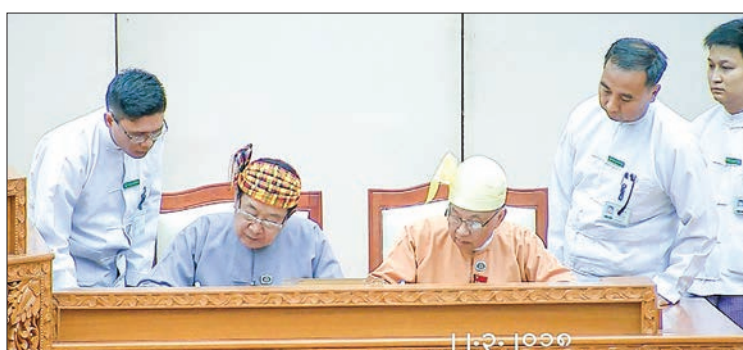
Pyithu Hluttaw Speaker U T Khun Myat and Deputy Speaker U Tun Aung @ U Tun Tun Hein signing their oath documents.