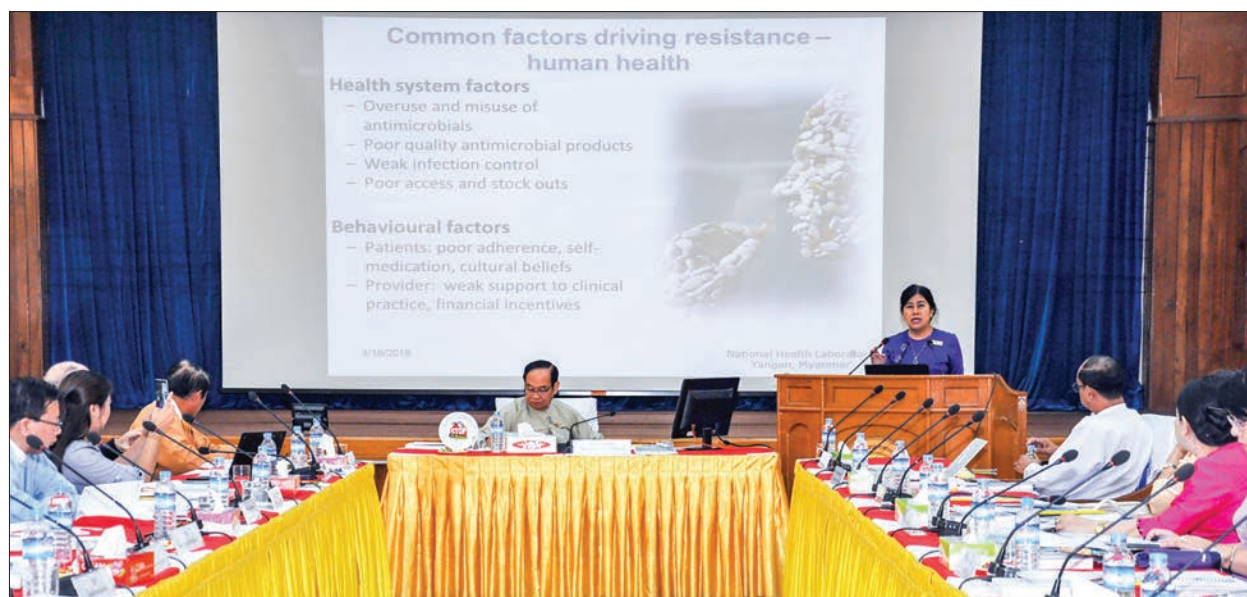
Union Minister Dr Myint Htwe attends the National Antimicrobial Resistance Counteracting Committee meeting in Nay Pyi Taw on 18 April.

The World Health Organisation (WHO) has published the WHO Global Strategy for Containment of Antimicrobial Resistance, and Myanmar has