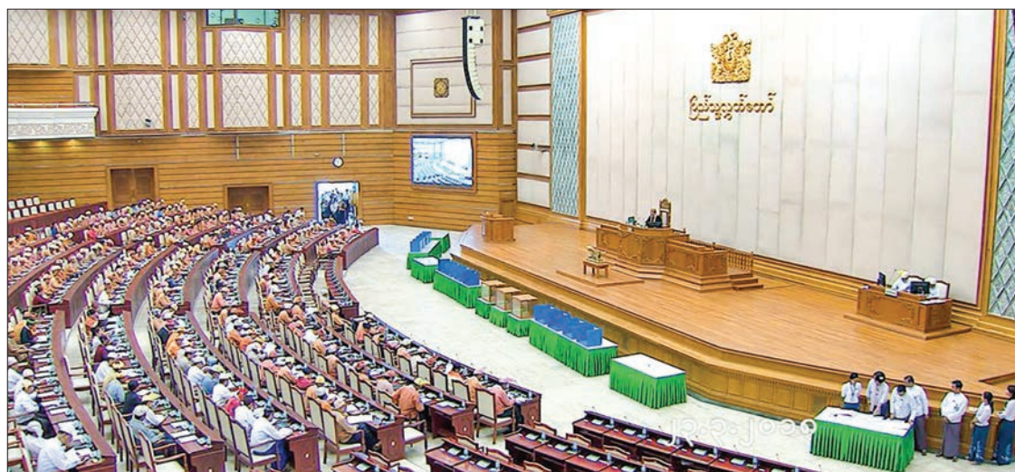
Pyithu Hluttaw is being convened in Nay Pyi Taw.

A: Throughout the second Pyithu Hluttaw up till 30 March 2018, seven new laws were approved, ten existing laws were revoked and replaced, twenty-four laws were amended, nine laws were revoked, and eight laws pertaining to the national plan, budget and tax were approved, bringing the total to 58 laws that