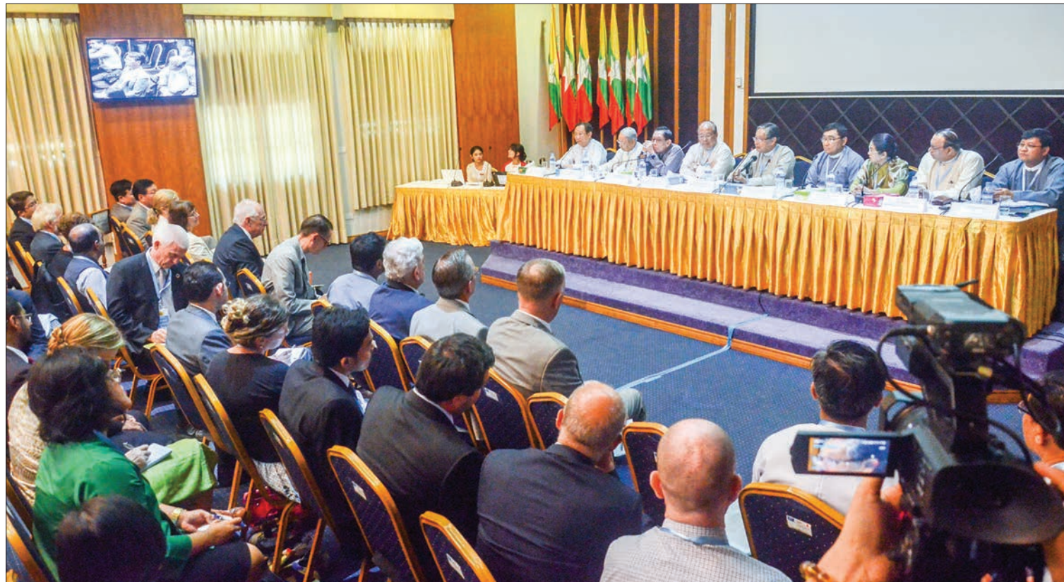
A Press Conference on the visit of Myanmar Delegation led by Dr. Win Myat Aye, Union Minister for Social Welfare, Relief and Resettlement of Myanmar, to Cox's Bazar and Dhaka, Bangladesh on 11-13 April held at National Reconciliation and Peace Centre (NRPC), Yangon.

During the visit of the Minister for Home Affairs of Myanmar to Bangladesh, the delegation was provided with another list of forms of 8032 displaced persons from Rakhine State. However, the Myanmar side proceeded to verify them immediately. The forms were found to be different from prescribed forms agreed in the Physical Arrangement for Repatriation. In particular, they did not contain signatures, finger prints and proper photographs necessary for proper identification. The situation made the verification process most difficult. He said that Myanmar had requested the Bangladesh side on three separate occasions through diplomatic channels to forward duly-filled prescribed