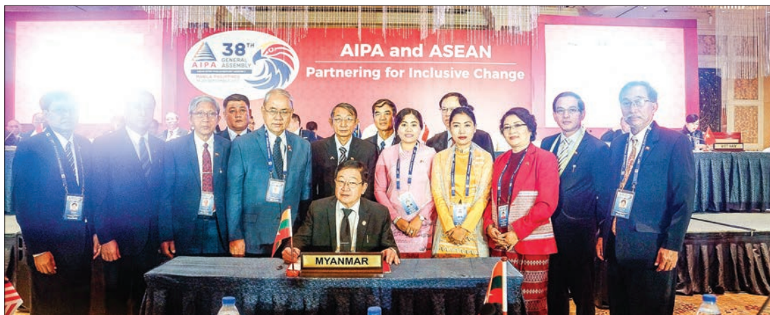
Pyithu Hluttaw Deputy Speaker U T Khun Myat (Now Pyithu Hluttaw Speaker) attends the 38 th AIPA General Assembly held in Manila, the Philippines, in 2017.

Our policy is to carry out our duties in accord with the constitution and be free of ethnic, racial, or ideological bias.