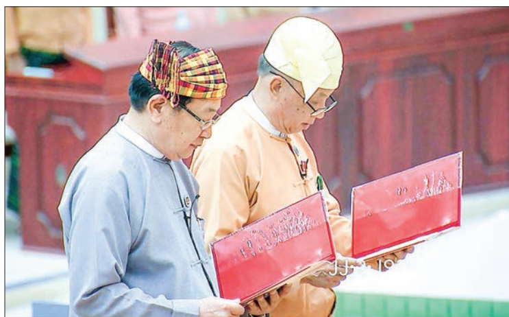
Pyithu Hluttaw Speaker U T Khun Myat and Deputy Speaker U Tun Aung @ U Tun Tun Hein take their oaths of office at the Hluttaw.