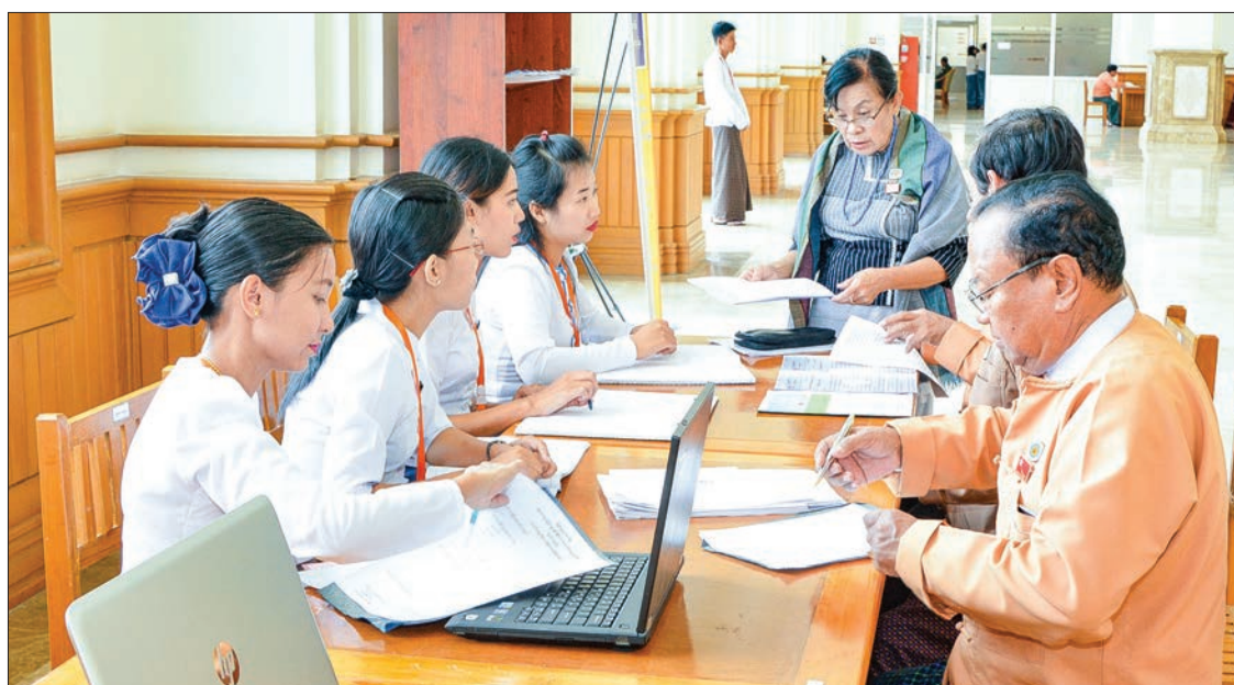
Pyithu Hluttaw MPs register to attend the Hluttaw meeting.

A: I'd like to share some things Myanmar Hluttaws did in the ASEAN parliament and international parliament conferences.