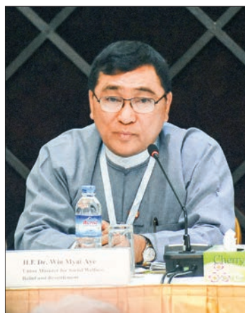
Union Minister Dr Win Myat Aye