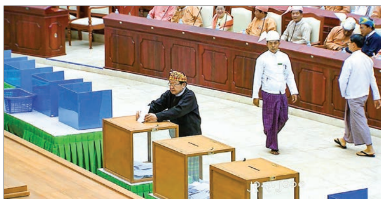
Pyithu Hluttaw Deputy Speaker U T Khun Myat casts his ballot during the voting.