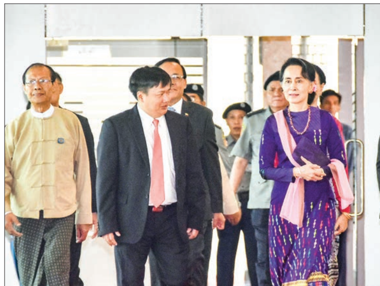
State Counsellor Daw Aung San Suu Kyi (Right) arrives the Nay Pyi Taw International Airport to depart for Viet Nam yesterday.