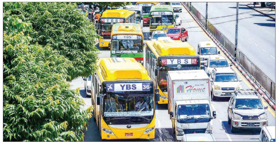
YBS buses seen in downtown Yangon.

Some 568,227.327 metric tonnes worth US$717.7 million were exported to foreign trade partners in the 2017-2018 fiscal year, which is the highest in the past 20 years, according to an official release of the Agriculture, Livestock and Irrigation Ministry. ■