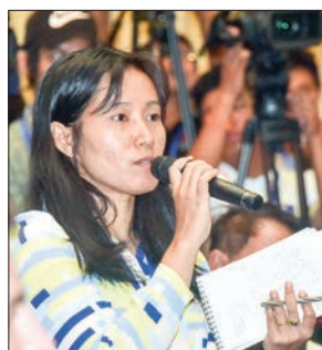
Journalist from AFP

The delegation was not able to meet the requested displaced persons despite meeting with some from the camps in Cox's Bazar including some who spoke Myanmar language fluently. He learnt that the displaced persons were no knowledge of the forms to be filled for repatriation and no one had explained to them about the forms. He stated that the meeting with the Minister of Foreign Affairs and Minister of Home Affairs of Bangladesh in Dhaka was fruitful. He mentioned that the Minister of Foreign Affairs of Bangladesh found out that the forms that they sent to Myanmar were not the prescribed forms agreed upon between the two governments. The Minister of Foreign Affairs assured the delegation that agreed forms would be sent soon.