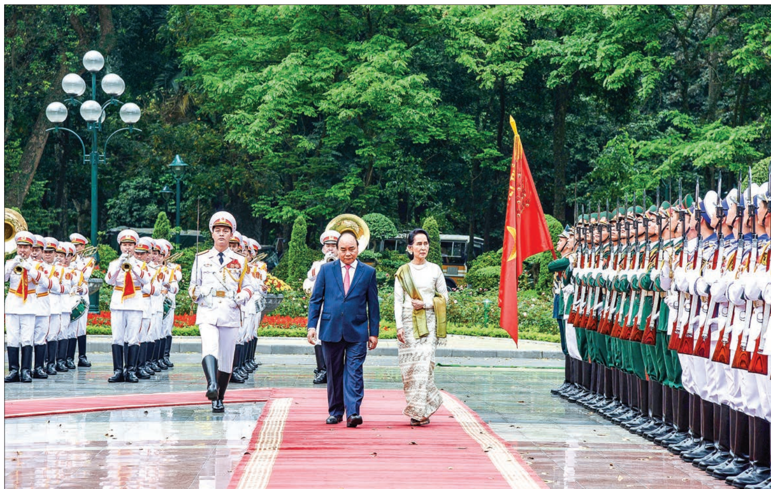
State Counsellor Daw Aung San Suu Kyi, accompanied by Vietnamese Prime Minister Nguyen Xuan Phuc, inspect the Guard of Honour in Viet Nam.

At the meeting, the leaders of the two countries discussed bilateral relations and cooperation started by national leaders Bogyoke Aung San and President Ho Chi Minh and maintained by subsequent leaders of the two countries, the positive developments in the bilateral cooperation during the recent