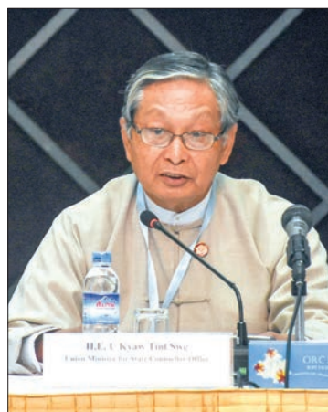
Union Minister U Kyaw Tint Swe