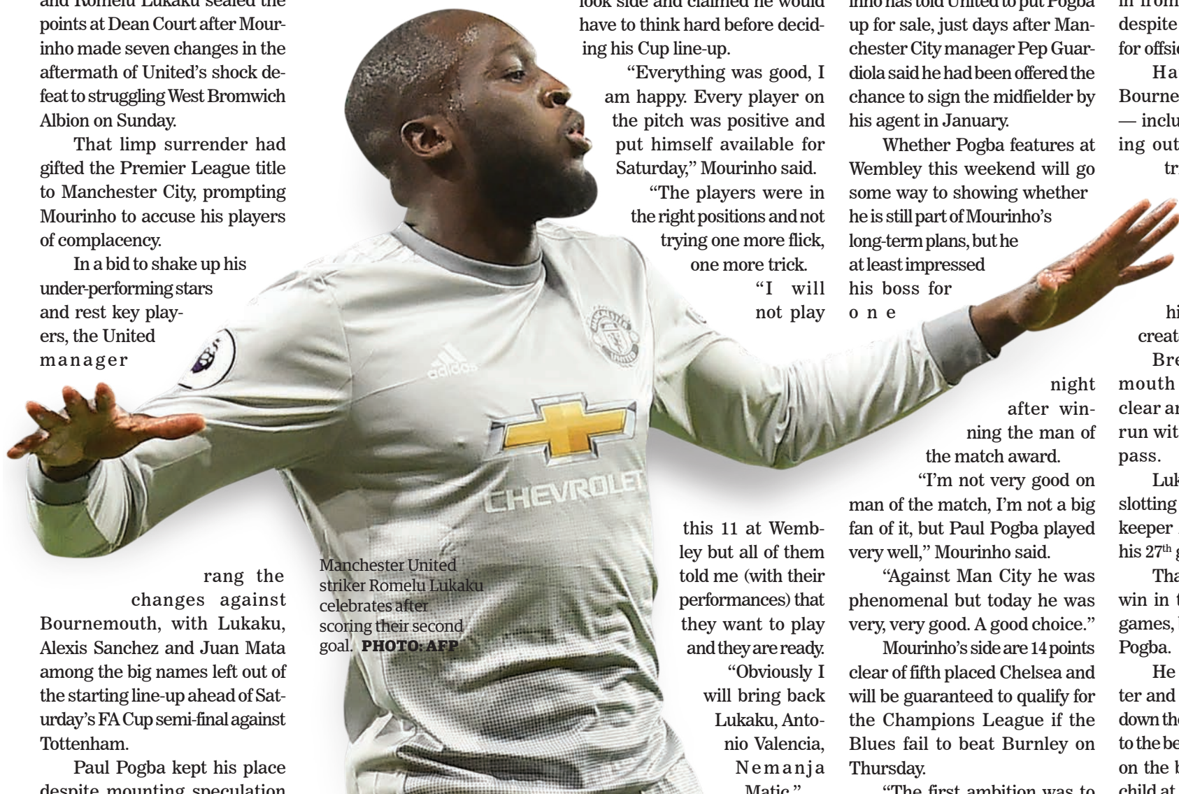
Manchester United striker Romelu Lukaku celebrates after scoring their second goal.

He was substituted soon after and initially headed straight down the tunnel, but was directed to the bench, where he took a seat on the back row like a naughty child at school.—AFP ■