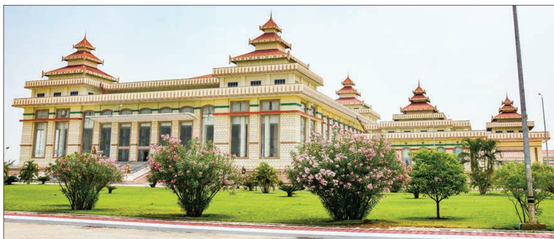
Pyithu Hluttaw Building.