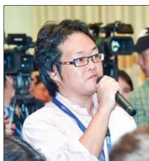
Journalist from NIKKEI