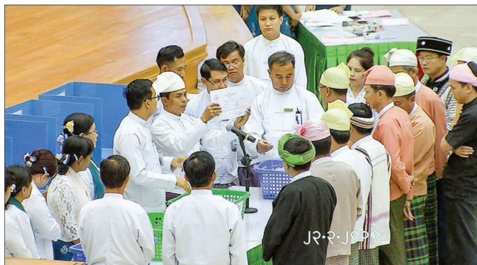
Officials of Pyithu Hluttaw Office are counting ballots in the presence of Pyithu Hluttaw representatives during a voting at the Pyithu Hluttaw.

Q: Can you tell us about the proposals submitted to the Pyithu Hluttaw and the ones