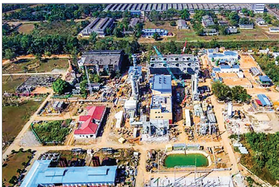
Photo shows 118.9 MW Thaton gas power plant in Mon State.