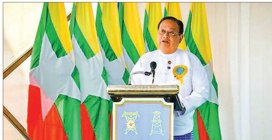
Union Minister for Electricity and Energy U Win Khaing.

As the Yadanar Project will be completed in 2021 and its production will decrease, measures are being taken to produce natural gas from Block A-6 as much as possible in five years. To meet this goal the ministry formed joint ventures with economic firms. In 2016, Shweyeetun 1, in 2017, Pyithit 1 and Pyitharyar 1 were drilled