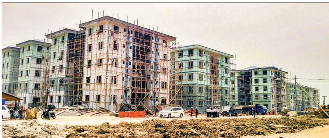
The Mandalay region Urban and Housing Development Department plans to implement the employee apartments in Mandalay.

Due to limitation of space we are only able to publish "Letter to the Editor" that do not exceed 500 words. Should you submit a text longer than 500 words please be aware that your letter will be edited.