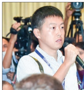
Journalist from the Asahi Shinbum.