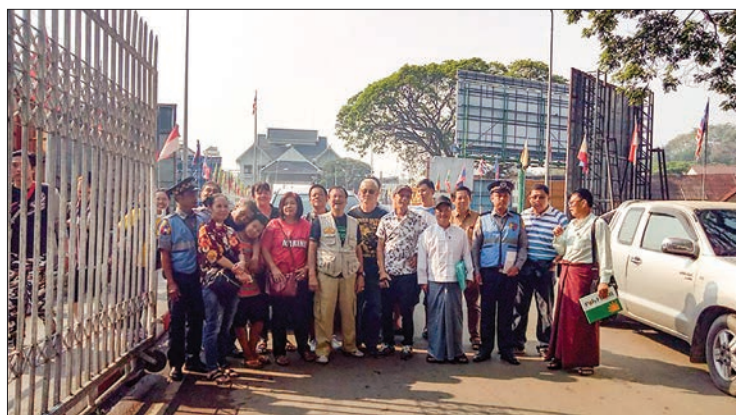
Tourists being seen near the Tachilek border entrance.

Some 193 visitors entered via the Tachilek border gate on a day's return trip from 6 to 12 April 2018. Some 241 tourists, including from Thailand and other countries arrived in