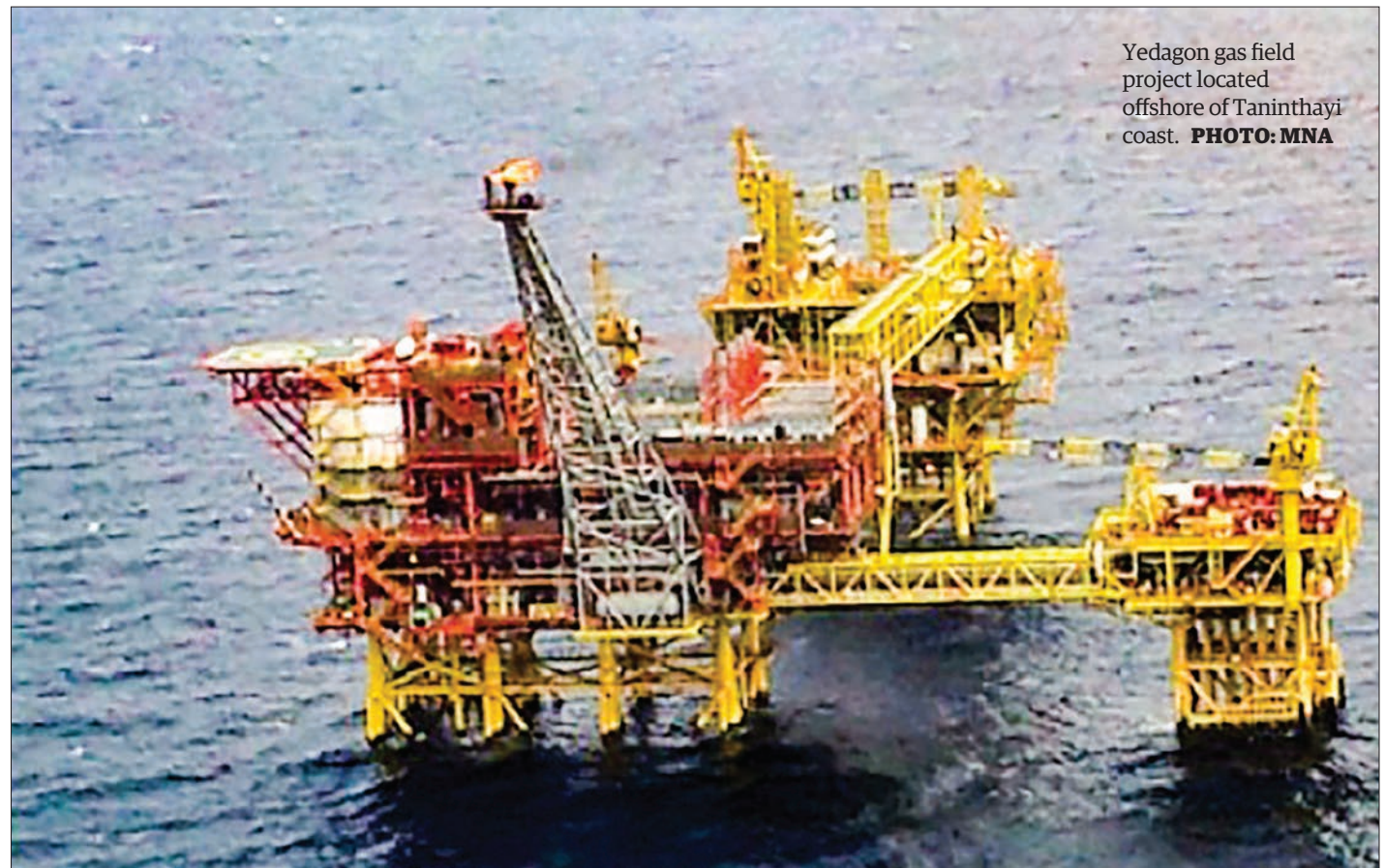
Yedagon gas field project located offshore of Taninthayi coast.

In the sector of power distribution also, 230, 132 and 66 KV power lines are