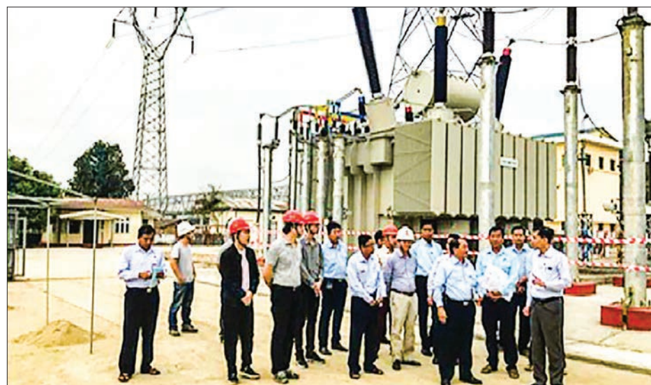
Union Minister for Electricity and Energy U Win Khaing inspects Bayintnaung electrical substation.

and it is hope that these wells will produce natural gas in 2030, according to MOGE.