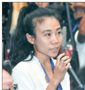
Journalist Wall Street Journal