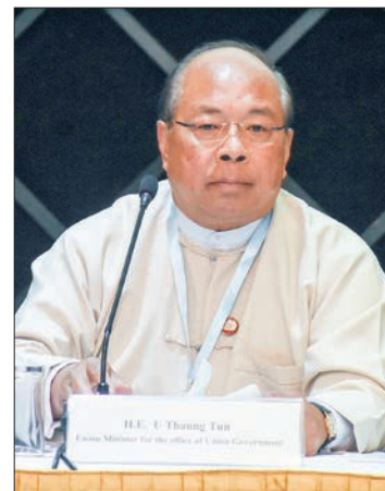
Union Minister U Thaung Tun