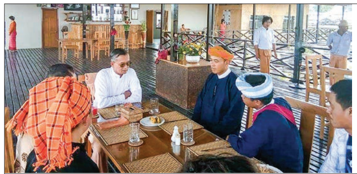
Union Minister U Ohn Maung meeting with local ethnic Pa-O people in Nyaung Shwe.