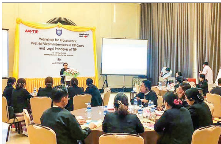
Workshop for prosecutors held in Nay Pyi Taw.