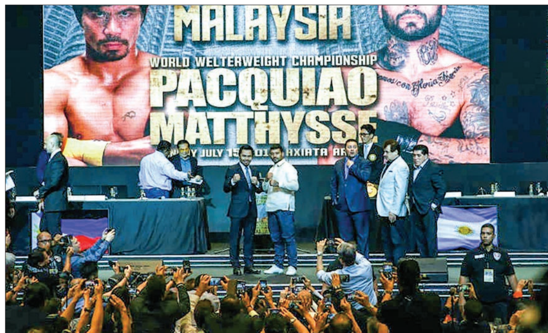
Manny Pacquiao (centre L) will fight Lucas Matthysse (centre R) for the WBA welterweight title in July.

"That is what I am trying to prove this coming 15 July that Manny Pacquiao is not done yet in boxing," he said. "I keep on fighting because boxing is my passion and I love raising the flag of the Philippines." After the Matthysse fight, Pacquiao has said he wants to take on Vasyl Lomachenko, the Ukrainian superfeatherweight WBO champion currently considered by many to be the world's top "pound-for-pound" fighter, an unofficial honour Pacquiao once held.—AFP ■