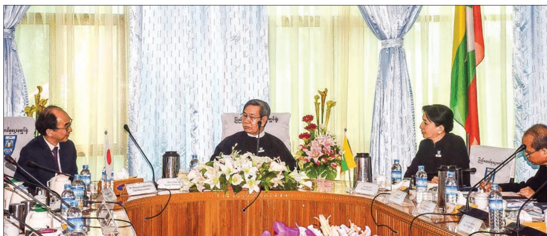
The signing ceremony of the Memorandum of Understanding (MoU) between Union Attorney-General's Office and Supreme Court of Japan.