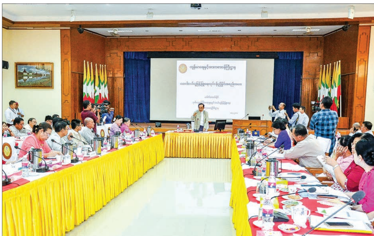
Union Minister for Health and Sports Dr. Myint Htwe addresses the coordination meeting on pharmaceutical distribution in Nay Pyi Taw yesterday.

(Excerpt from the speech by State Counsellor Daw Aung San Suu Kyi on the 2 nd Anniversary of NLD Government on 1 st April 2018)