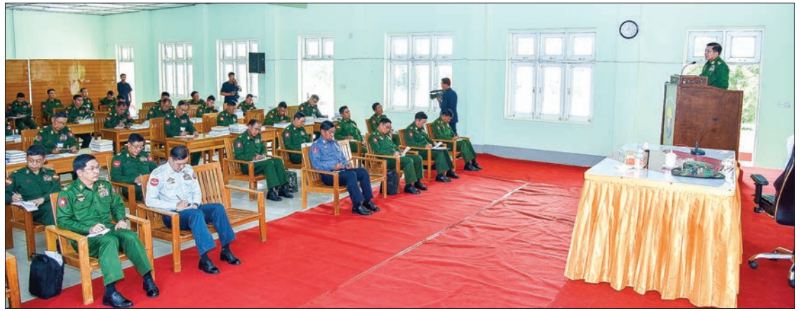
Senior General Min Aung Hlaing delivers the speech at the Defence Service Administration School in Pyin Oo Lwin.

The Tatmadaw has been criticised severely by some international organizations, he noted.—Myanmar News Agency ■