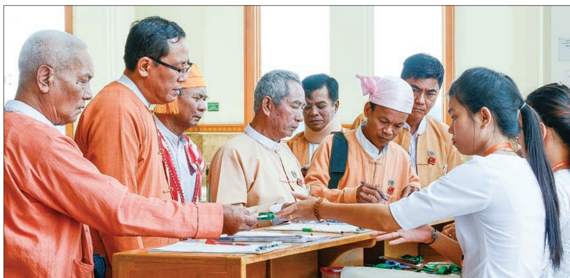
Pyidaungsu Hluttaw representatives arrive to attend the Hluttaw meeting.