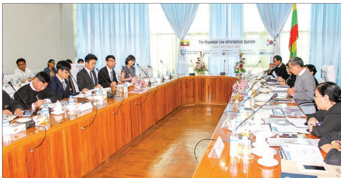
Members of Union Attorney-General's Office discuss matters project on establishment of Law Information System in Myanmar with KOICA's members.