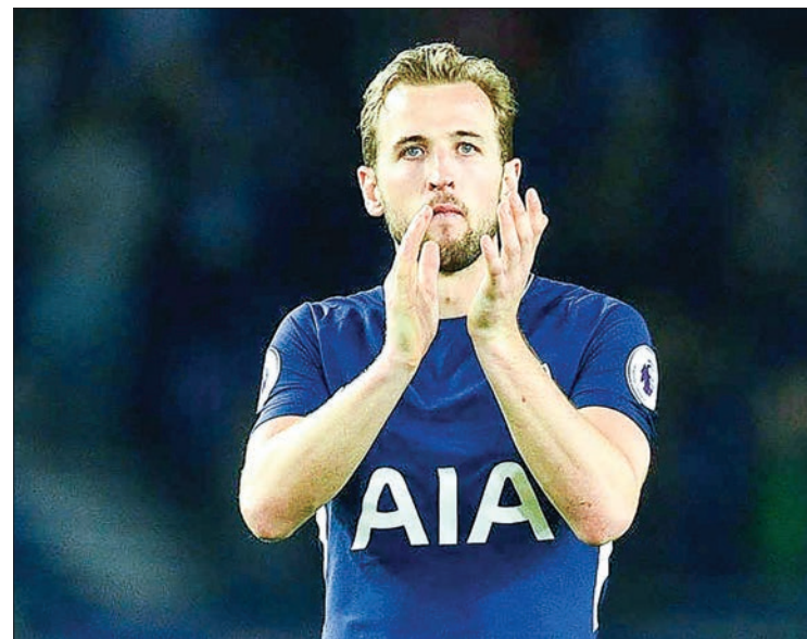
Tottenham striker Harry Kane applauds the fans following the Premier League match against Brighton on 17 April, 2018.

Brighton are now eight points clear of the relegation zone with just four games to go but manager Chris Hughton said the side were not yet safe.—AFP ■