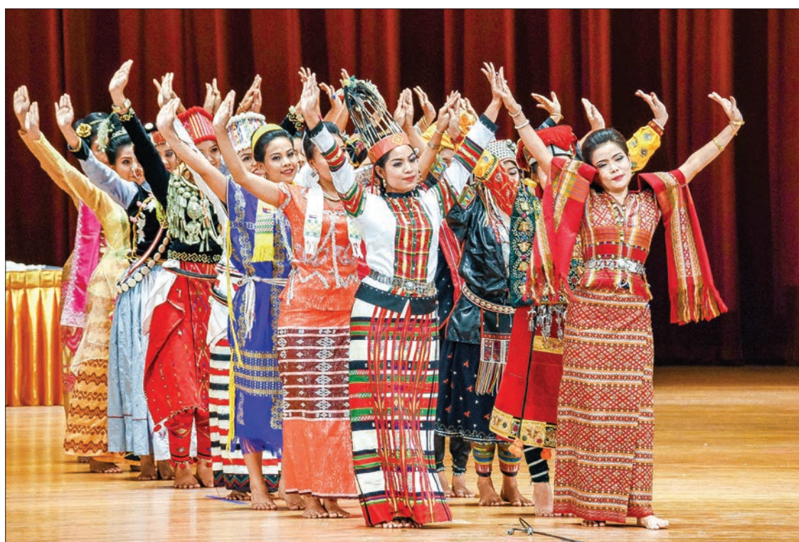
A cultural troupe performs a dance depicting “Panglong Truth” at Pyidaungsu Hluttaw.