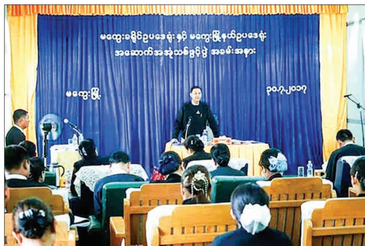
Union Attorney-General U Tun Tun Oo delivers the address at the opening ceremony of Magway District and Township Court in Magway.