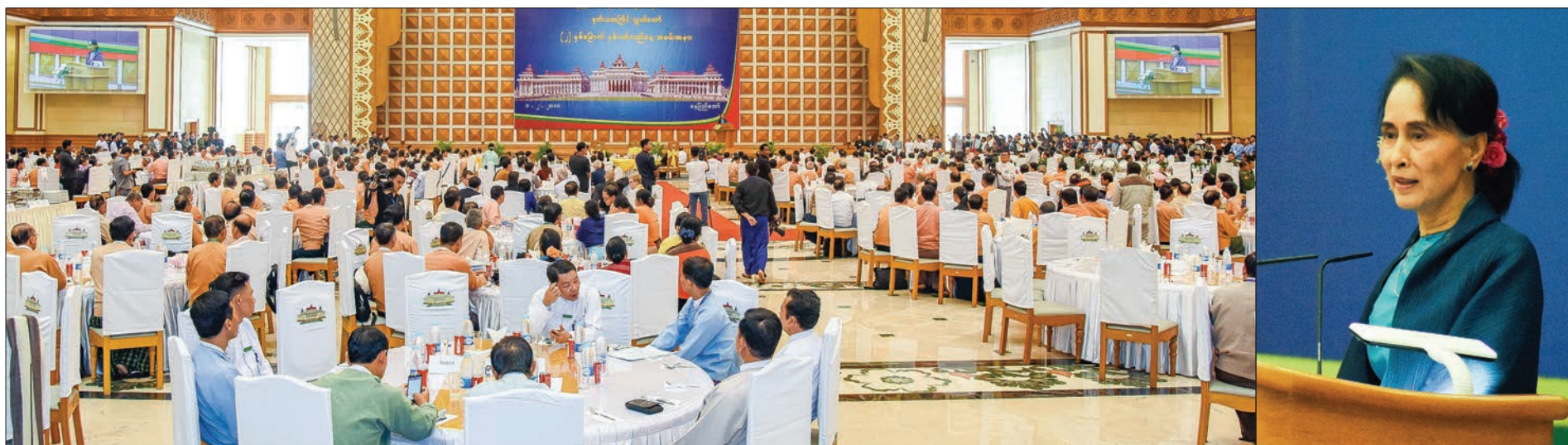
State Counsellor Daw Aung San Suu Kyi delivers a speech at the ceremony to celebrate the 2 nd anniversary of the 2 nd Hluttaw held in Nay Pyi Taw.

In exercising the legislative powers entrusted to it, the Hluttaw had been enacting new laws, amending existing laws and removing outdated laws for the benefit of the country and the people.