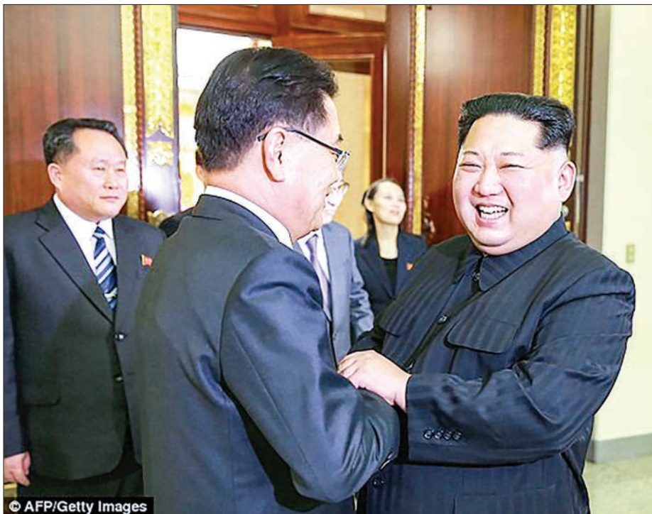
The comments came after US President Donald Trump said the summit between North Korean leader Kim Jong Un and the South's President Moon Jae-in could include a discussion about a peace treaty. Pictured: Kim meeting South Korean chief delegator Chung Eui-yong on 5 March during a meeting to defuse tensions between the Koreas.