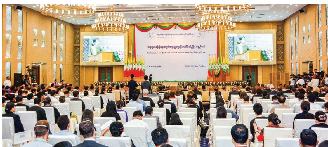
State Counsellor Daw Aung San Suu Kyi delivers the address at the Conference on Justice Sector Coordinating for Rule of Law at the MICC-II in Nay Pyi Taw on 7 March 2018.

During the second year we gave 745 advices in connection with international and regional agreements and MoUs and 31 advices to region and state governments.