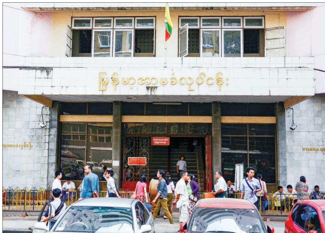
Photo shows the Myanmar Insurance Building in Yangon.