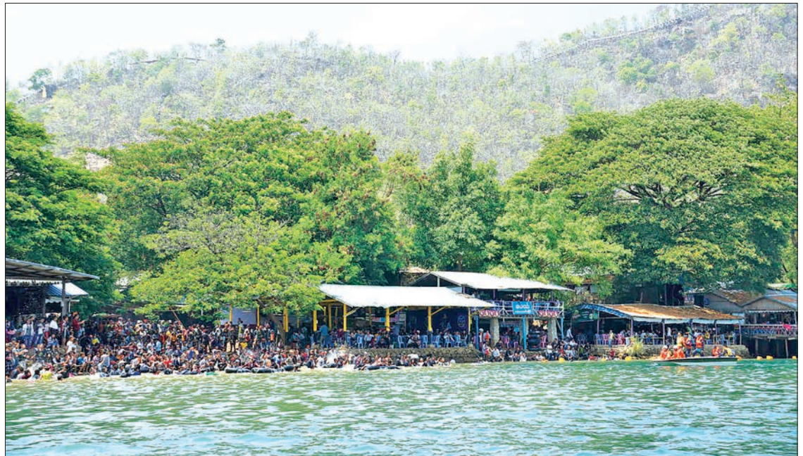
Several people enjoying Paung Laung river on the first day of Myanmar New Year in Zeyathiri Township, Nay Pyi Taw.