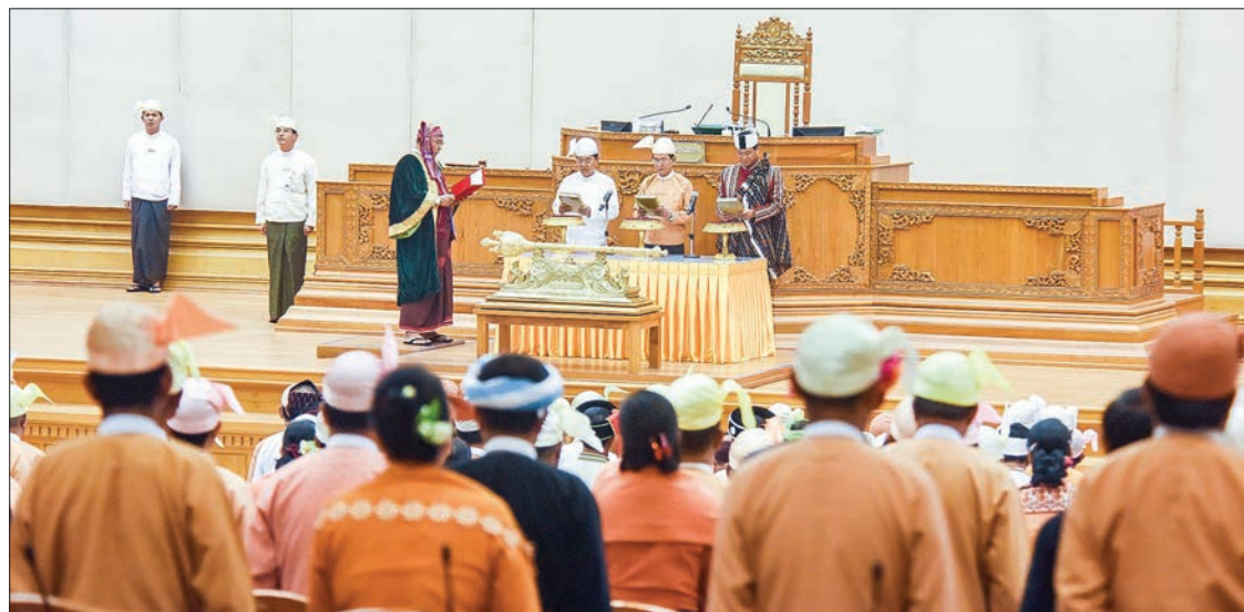
President U Win Myint, centre, flanked by vice presidents U Myint Swe, left, and U Henry Van Thio, right, take their oaths of office at the Pyidaungsu Hluttaw.