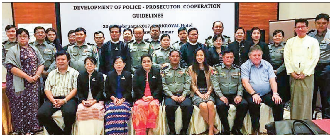
Participants pose for the documentary photo at workshop on Development of Police-Prosecutor Cooperation Guidelines at Parkroyal Hotel in Yangon.