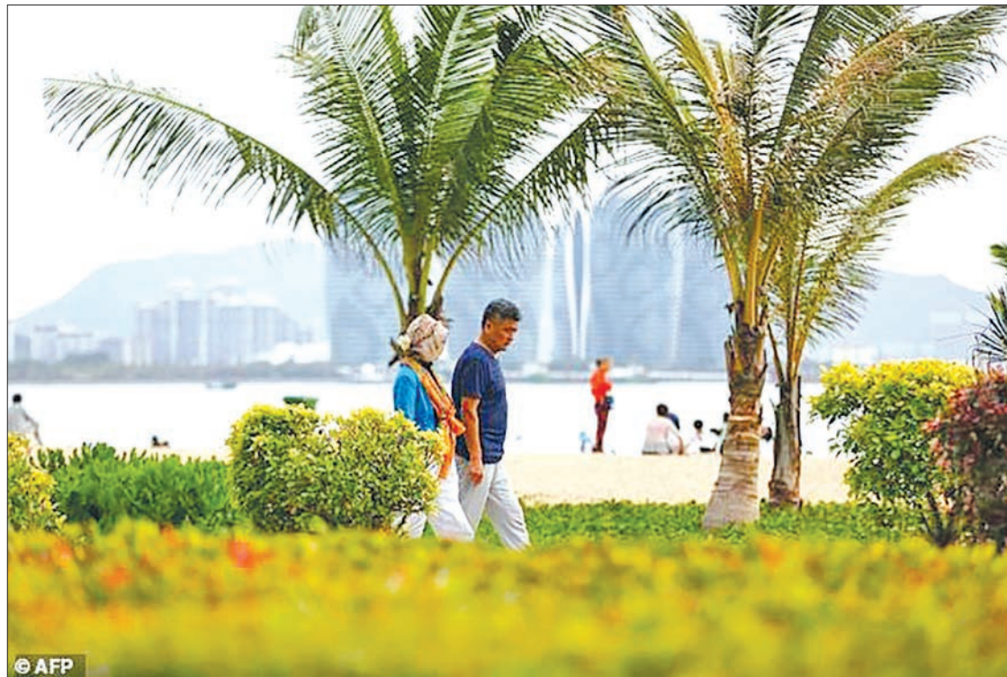
Hainan has not proven an international draw so far, attracting fewer than a million foreign visitors in 2016.

an, an island off China's southern coast, a "trial free trade zone" to try out the reforms Beijing has pledged to bring to the mainland for years with few tangible successes.