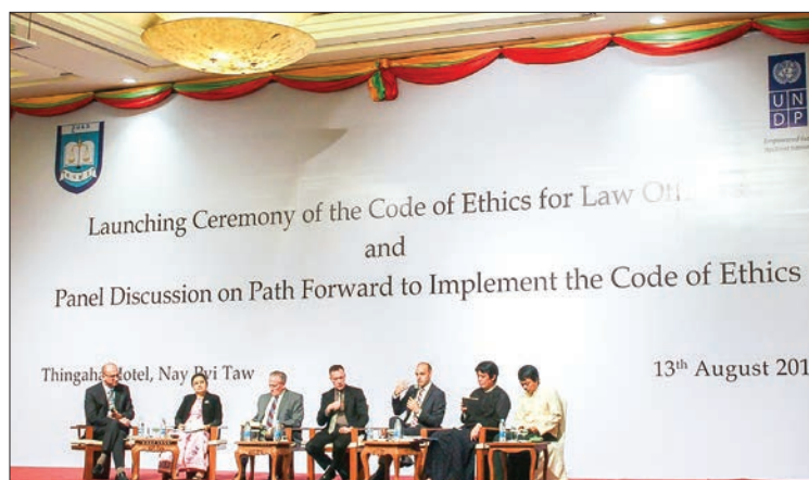
Participants speaking at the panel discussion on Path Forward to Implement the Code of Ethics in Nay Pyi Taw.