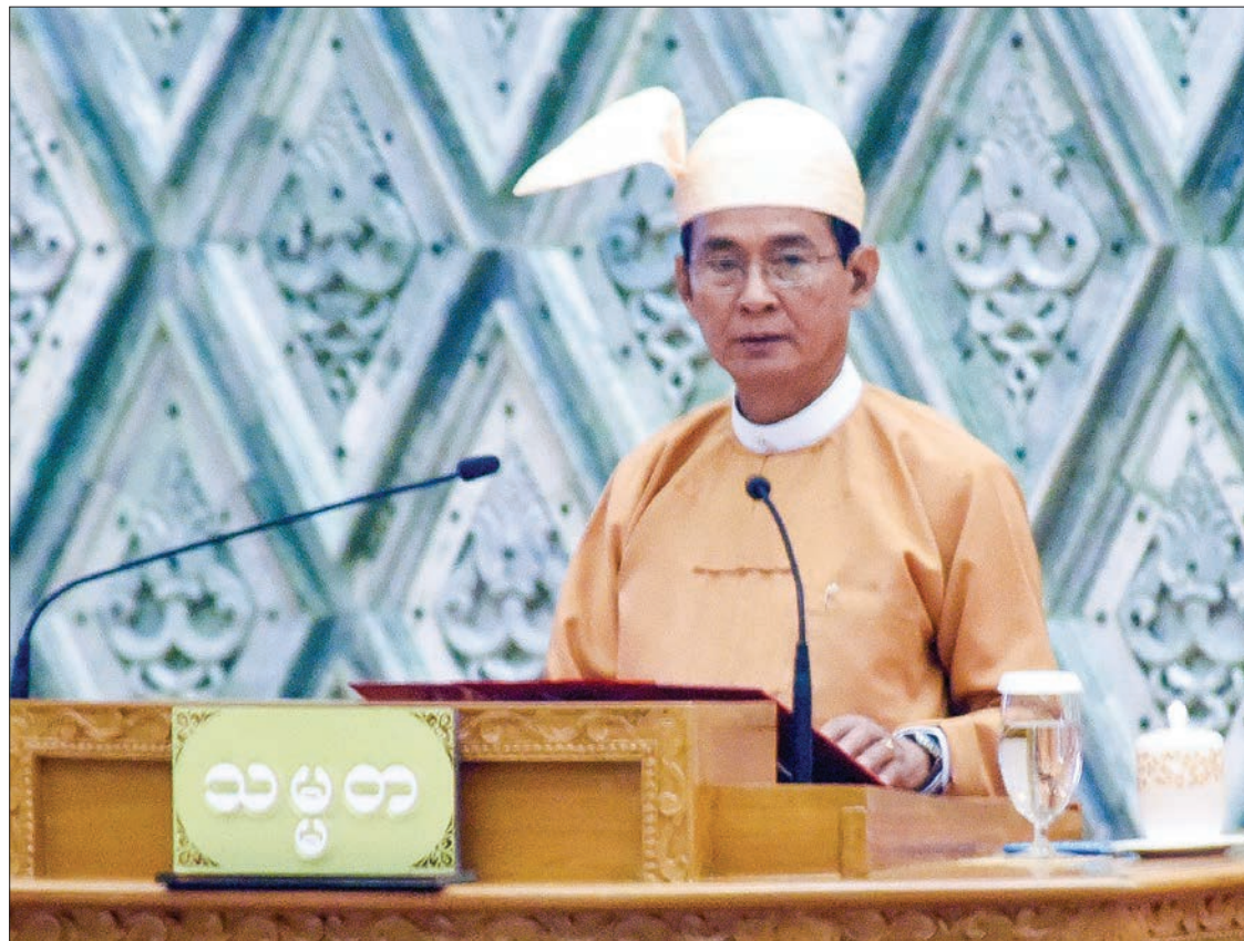
President U Win Myint delivers the inaugural speech after taking the oath of office at Pyidaungsu Hluttaw.

People are relying on the Hluttaw as an institution that