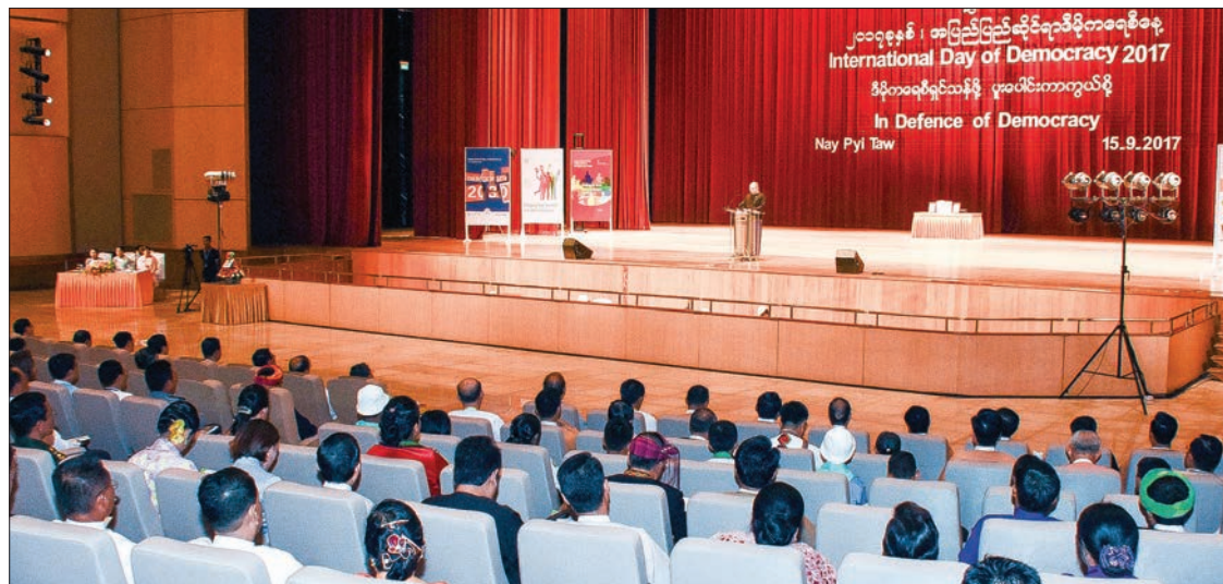
Pyidaungsu Hluttaw Speaker Mahn Win Khaing Than addresses the ceremony of the International Day of Democracy 2017.

will enact laws for the interests of the people. A country's development, strength and power depend much upon peace and stability. Peace and stability is sustainable