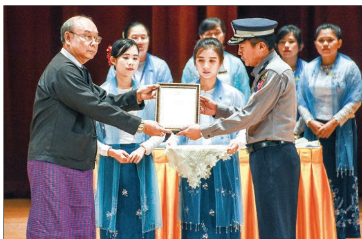
Pyidaungsu Hluttaw Speaker Mahn Win Khaing Than presents a certificate of honour to a police officer.