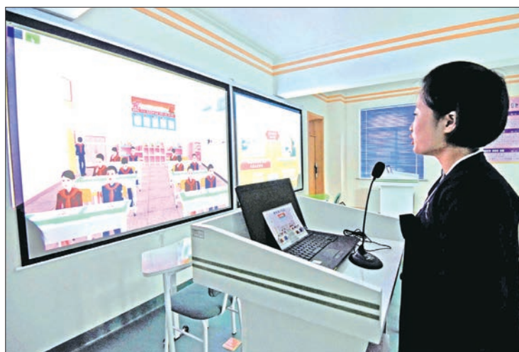
A student at North Korea's Pyongyang Teacher Training College speaks to virtual students during a training program powered by artificial intelligence on 13 April, 2018.

The college said it has developed a curriculum that can