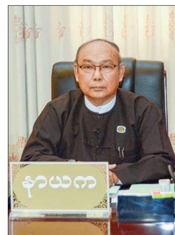
Pyidaungsu Hluttaw Speaker Mahn Win Khaing Than.