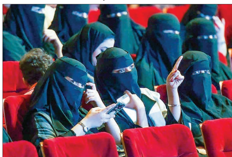
Saudi women enjoy a rare trip to the movies on October 20, 2017 at a cultural centre in Riyadh.

“It will be the first in a series of test screenings, attended by industry specialists, that will be held... to support final preparations for the opening of the cinema to the wider public,” said the information ministry’s