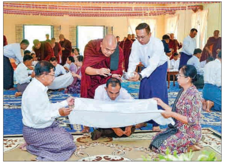
Senior General Min Aung Hlaing attends ordination, novitiation ceremony in Nay Pyi Taw.

The Ministry of Health and Sports has treated 26 million out-patients and 5.6 million in-patients during 2016 and 2017. As for the field trip medication, these were administered 21.3 million times and efforts are being made to effectively support the government's healthcare system and provide necessary healthcare to the public, and try to cut medical waste.—Ministry of Health and Sports ■