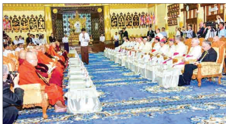
The Sangha Maha Nayaka Sayasaws meet with Pope Francis during his visit to Myanmar on 29 November 2017.