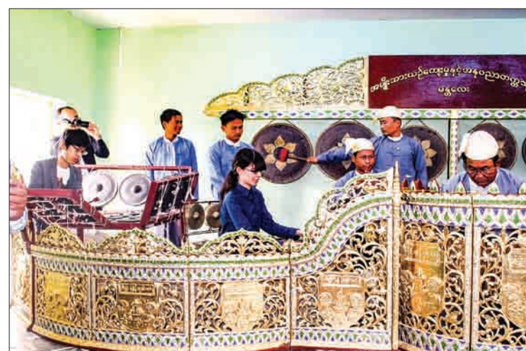
National University of Arts and Culture, Mandalay collaborates with the Tokyo University of Arts.