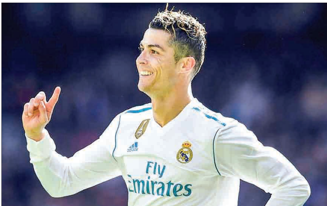
Real Madrid's forward Cristiano Ronaldo stands just three goals short of his best ever tally in a single European campaign.

When he posted 16 goals in the 2015-16 tournament and his personal best of 17 in 2013-14, both times Real were crowned champions. "Cristiano is Cristiano, it's always been like that," coach Zin-