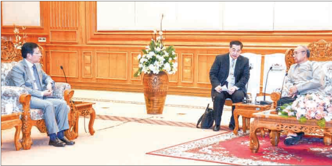
Amyotha Hluttaw Speaker Mahn Win Khaing Than holds talks with Chinese Ambassador Hong Liang in Nay Pyi Taw.