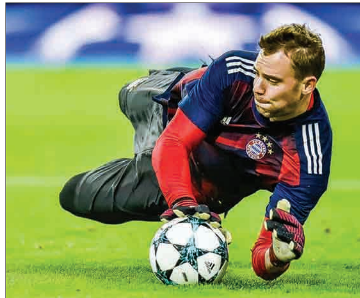
Bayern's first-choice goalkeeper, World Cup winner Manuel Neuer, has been out of action since September.

While the likes of Thomas Mueller and Robert Le-