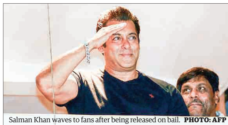
Salman Khan waves to fans after being released on bail.