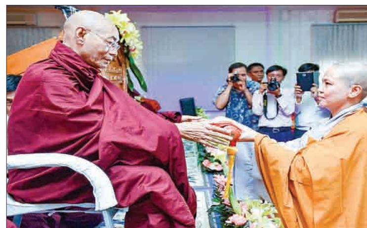
The Rector of the International Theravāda Buddhist Missionary University confers the diploma to a graduate.