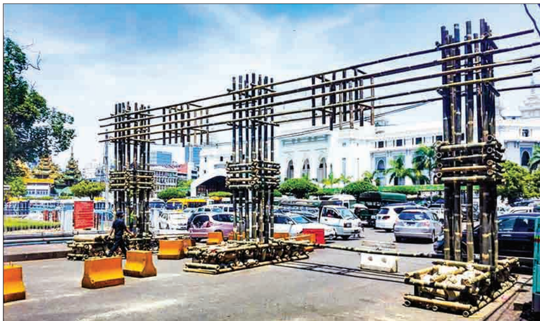
YCDC constructing pandal to celebrate Yangon Walking Thingyan Festival at Maha Bandula Park.

Due to limitation of space we are only able to publish "Letter to the Editor" that do not exceed 500 words. Should you submit a text longer than 500 words please be aware that your letter will be edited.