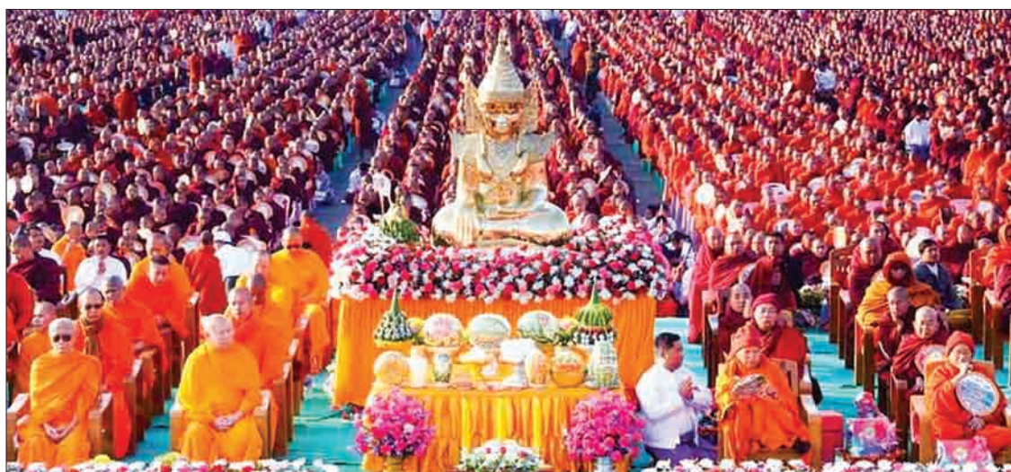
Ceremony for paying respect to 20,000 monks in Chanmya Thazi Airport, Mandalay Region.