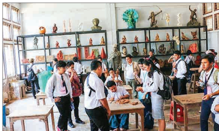
International students visit Yangon University as part of the ASEAN Cultural and Language Learning Programme in May 2017.