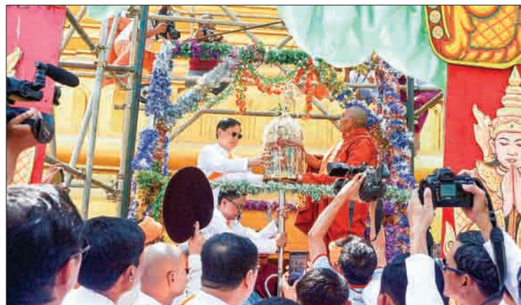
The Religious Affairs and Culture Minister at a ceremony in Shwebonthamuni Pagoda in Padaung Township, Bago Region.

members of the Sangha passed the examination in various categories. At the Dhammacariya examinations 3455 monks passed the examination in different subjects. Under the patronage of the ministry the Shwedagon Pagoda in Yangon was consecrated with 18000 members of the Sangha on 1 January 2018, the Uppatasanti Pagoda in Nay Pyi Taw was consecrated with 10000 members of the Sangha on 20 January 2018,