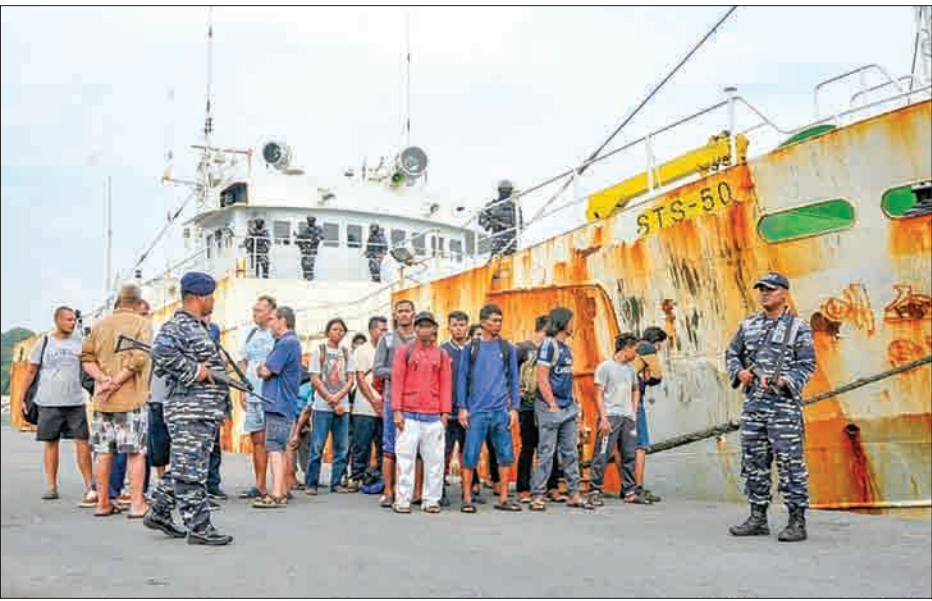
Indonesian military guarding the crew next to a seized alleged “slave ship” at the naval port of Sabang.

The Indonesian sailors said they were not paid and that their passports and other documents had been taken away as soon as they boarded the ship nearly a year ago, the navy