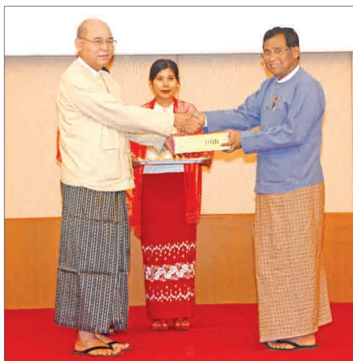
Deputy Minister U Khin Maung Tin donates cash for the two 20-KVA generators to Deputy Minister U Soe Aung in Nay Pyi Taw.