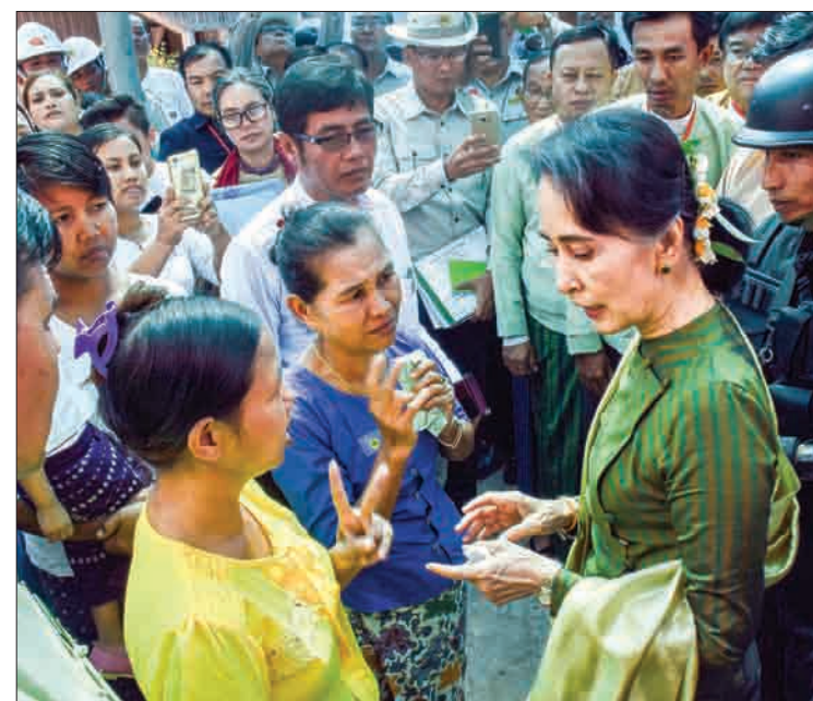
State Counsellor Daw Aung San Suu Kyi meets with the bereaved family members of the two people who died when a bridge in Myaungmya collapsed early this April.

State Counsellor said the Union Government would find an independent quality control body to oversee the quality of the new bridge.