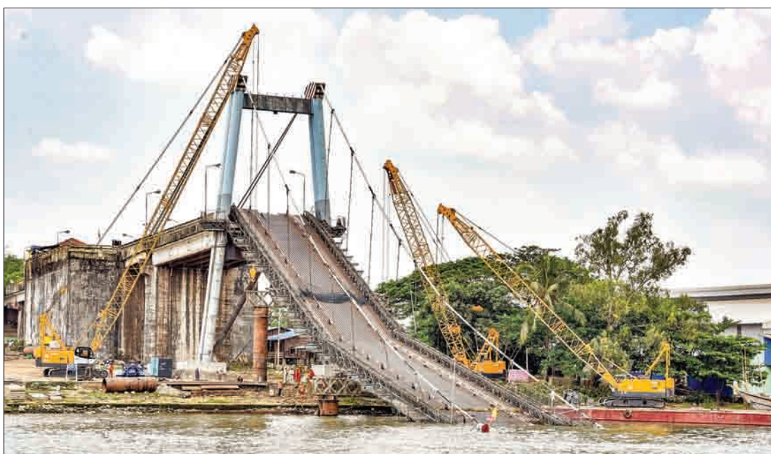
Collapsed bridge linking Myaungmya and Labutta townships, Ayeyawady Region.

Daw Aung San Suu Kyi gave instructions on providing free ferry services systematically with three barges and one two-decker ship to solve the transport difficulties in the short term, and urged the local authorities to launch La-