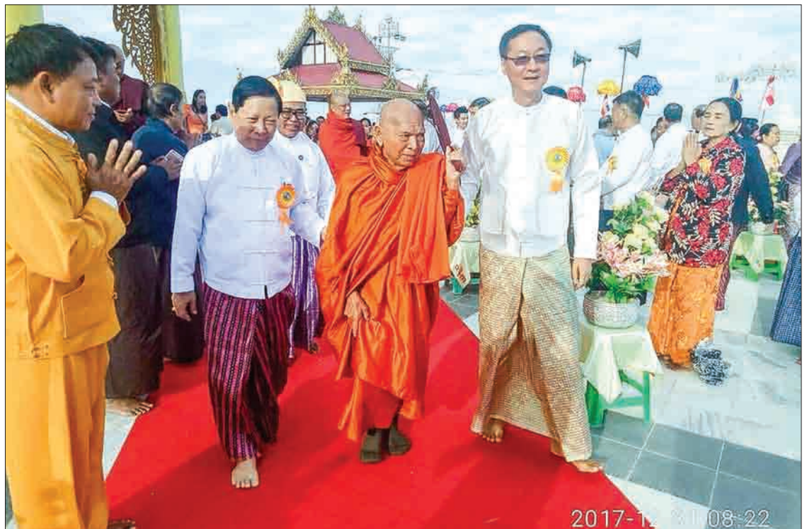
The Union Minister for Religious Affairs and Culture, left, Bhamo Sayadaw, centre, visit the Maha Lokha Pala Sutaung Pyae Pagoda in Pyinsa Sanpya Village, Mandalay Region on 31 December 2017.

and provisions were offered to 20000 monks in Mandalay on 21 January 2018.