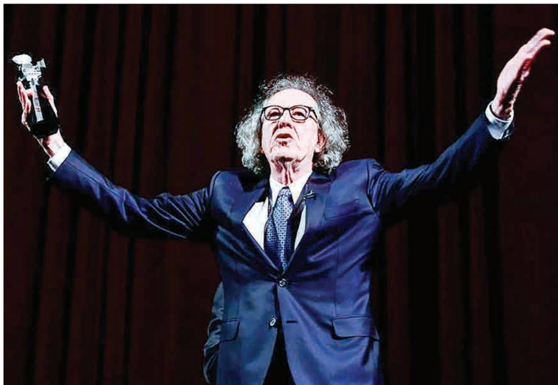
Oscar-winner Geoffrey Rush is “virtually housebound” and “barely eats” after a Sydney newspaper claimed he engaged in inappropriate behaviour at a theatre, his lawyer said Monday during a defamation case.

The Telegraph has said previously it had accurately reported the alleged complaint against Rush and would defend the case in court.—AFP ■