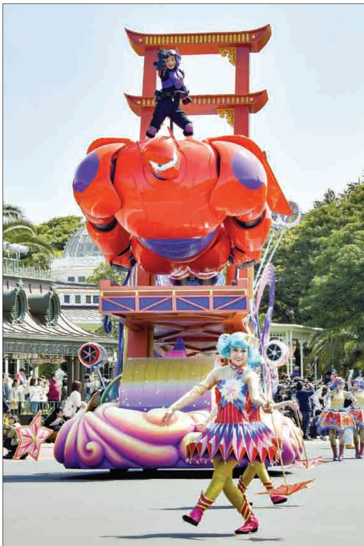
Tokyo Disneyland performers show the press a new parade attraction titled "Dreaming Up!" on 10 April, 2018, at the theme park in Urayasu, east of Tokyo.

Baymax, a key character from popular Disney movie "Big Hero 6," made his first appearance at the amusement park, joining the parade with his best friend Hiro on his back. ■