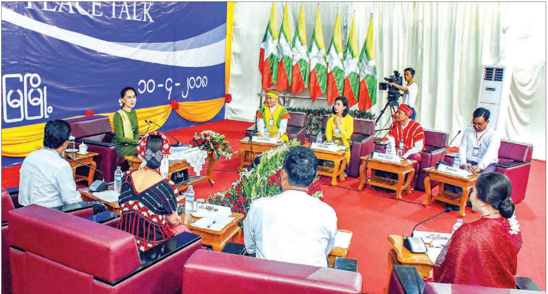
State Counsellor Daw Aung San Suu Kyi at the peace talk with local people in Myaungmya Township, Ayeyawady Region.