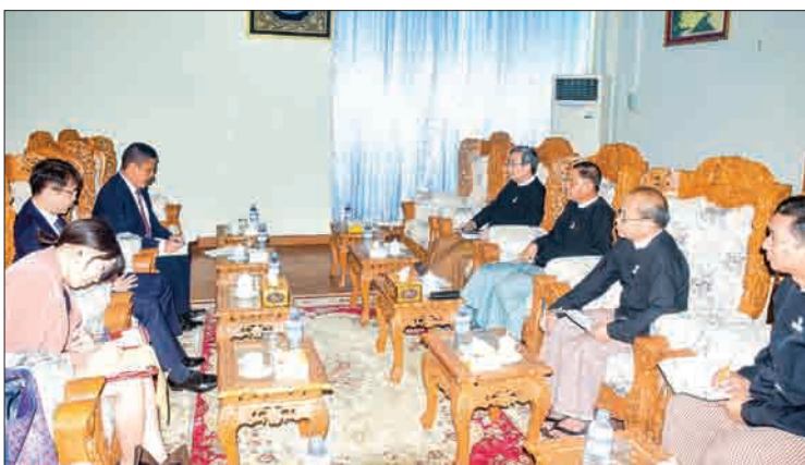
Union Attorney-General U Tun Tun Oo meets with ROK Ambassador Lee Sang-hwa in Nay Pyi Taw yesterday.