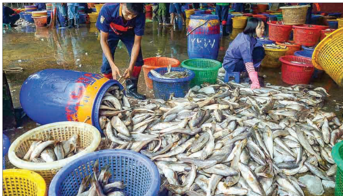
A workers select fish at the Nyaungtan Jetty in Yangon.

“Myanmar exports only raw fish materials, but value-added