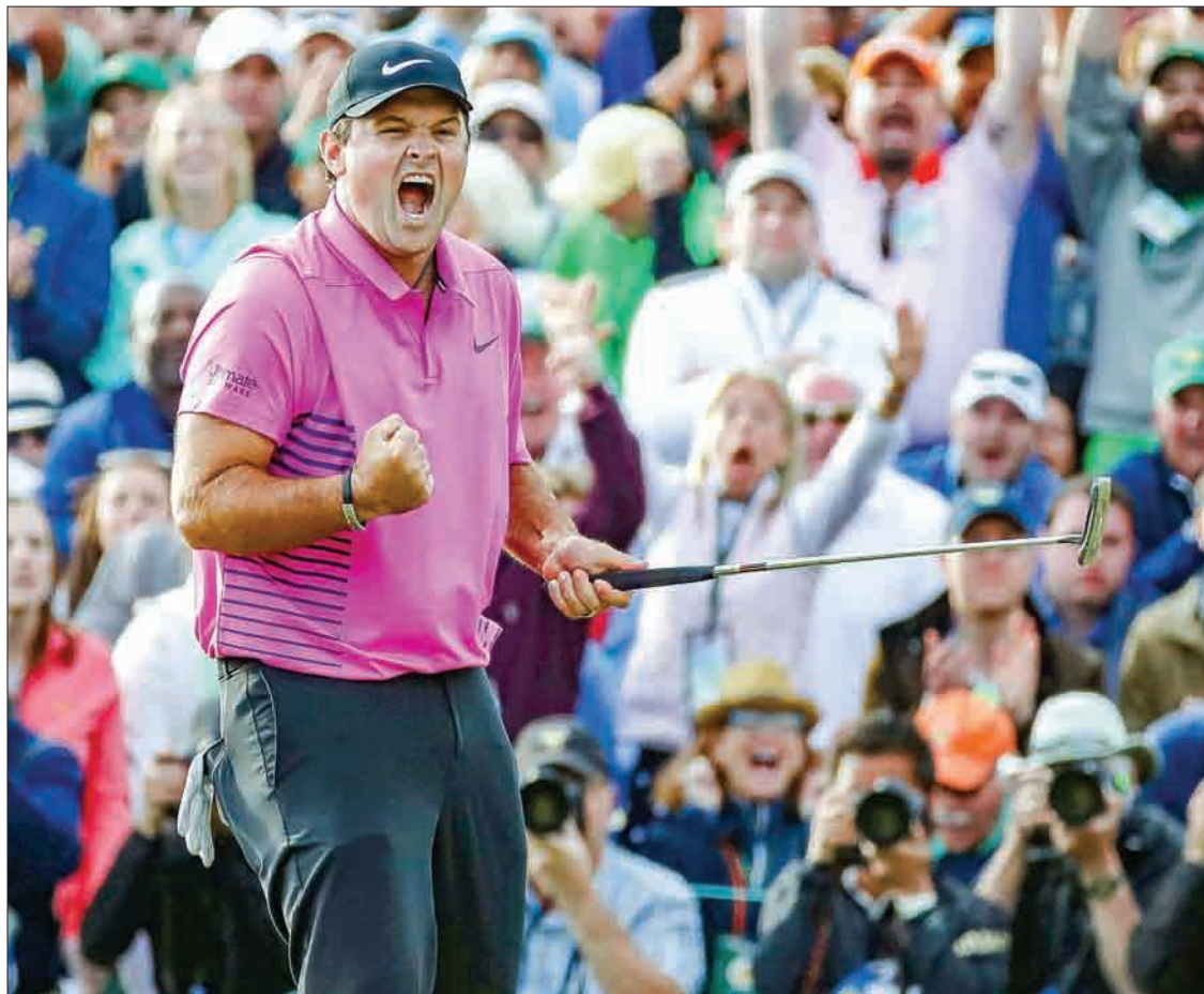
Patrick Reed of the United States pumps his fist after winning the Masters Tournament for his first major title in Augusta, Georgia, on April 8, 2018.