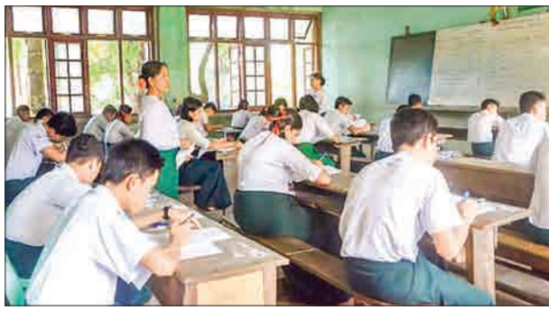
Teachers supervise students sitting in the exam in Lewe and Thawutthi Townships.