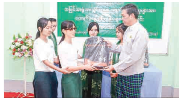
Union Minister Dr Myo Thein Gyi presents education accessories to students.