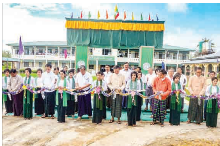
Officials cut ribbon to open upgraded Kani Basic Education High School in Pyapon Township, Ayeyawady Region.

attending ages, no one is left out and no drop-out from schools.