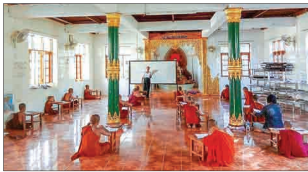
Students sitting for the NFPE Level 1-2 pre-examination for primary school at Zaytawun camp in Kyauktan Township.