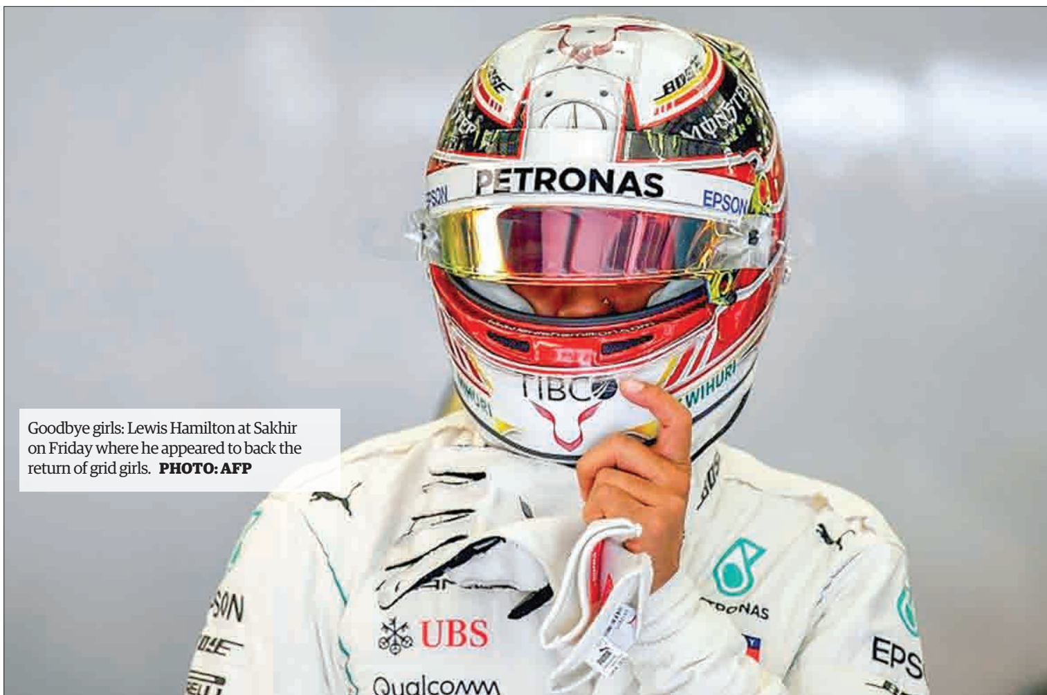
Goodbye girls: Lewis Hamilton at Sakhir on Friday where he appeared to back the return of grid girls.

The picture-story was in support of the Monaco and Russian Grands Prix indicating they plan to defy Formula One's decision to use 'grid kids' instead of girls this year.—AFP ■