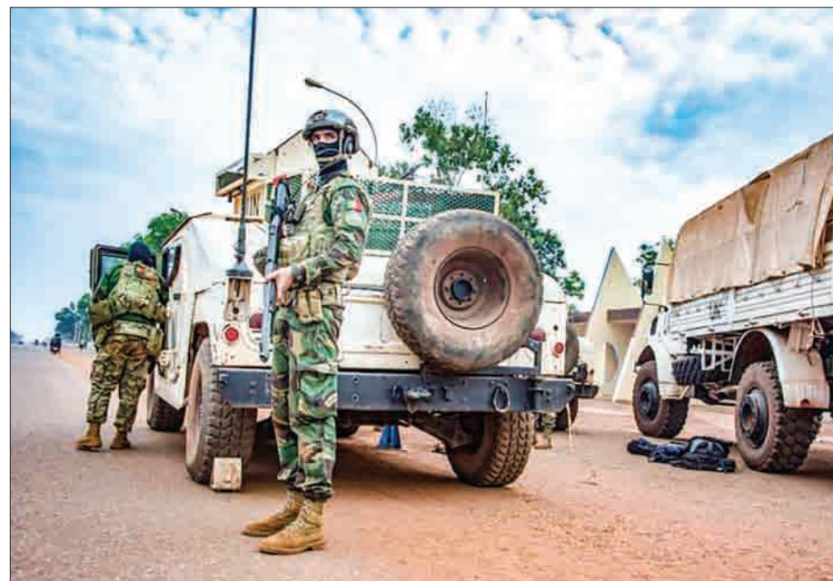
UN and Central African forces have launched a joint operation targeting armed groups in a mainly Muslim district of the capital Bangui.

The operation follows a resurgence in violence in the flashpoint PK5 neigh-