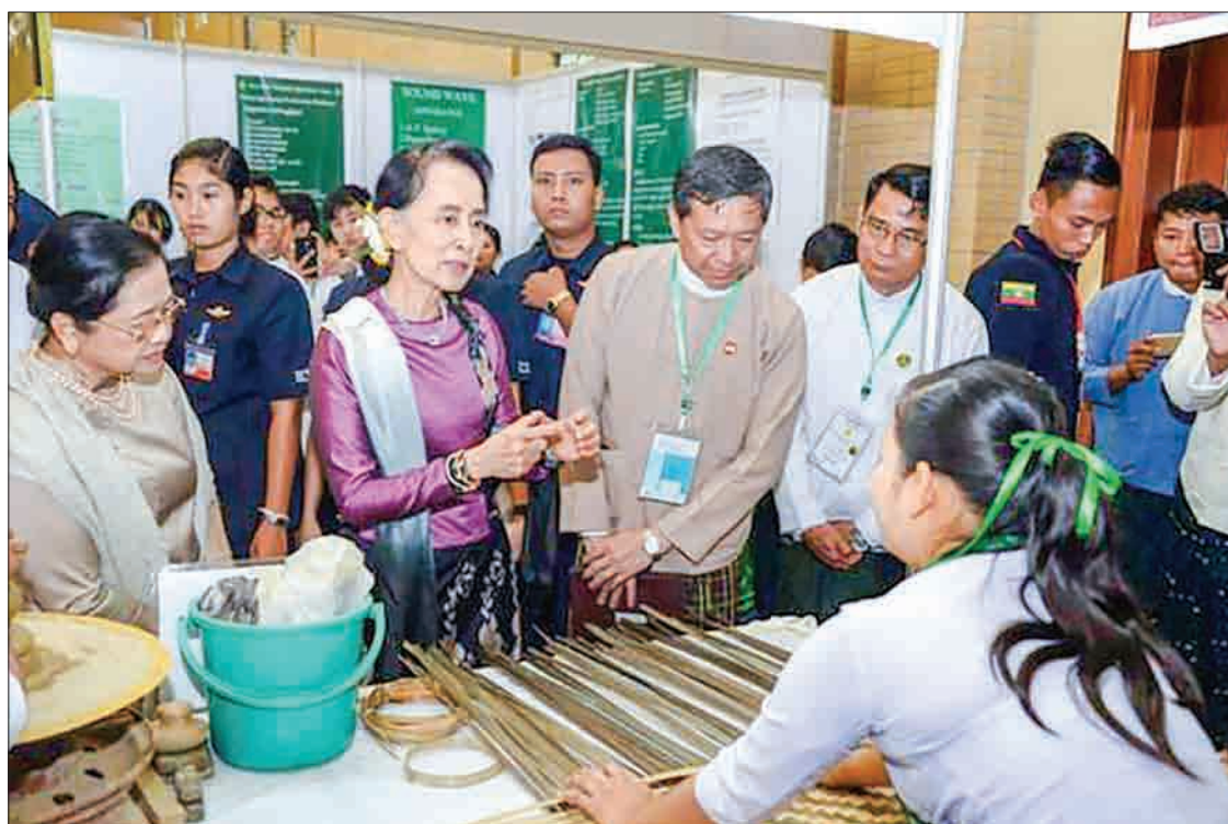
State Counsellor Daw Aung San Suu Kyi observes the booth of vocational skills at the Seminar on Educational Development Implementation in Nay Pyi Taw.

A. Ministry of Education has formed a commission and committees for the national education sector development. According to National Education Law and with the consent of the Pyidaungsu Hluttaw a 21-member National Education Policy Commission was formed in 28 September 2016, a National Curriculum Committee was formed in 9 November and a National Quality Assurance Assessment Committee was formed in January 2017. The Ministry of Education is training and producing good human resource who cooperates and work together, are dutiful and responsible, are capable of being inventive and entrepreneurial with a policies of no discrimination at all education level and at all school