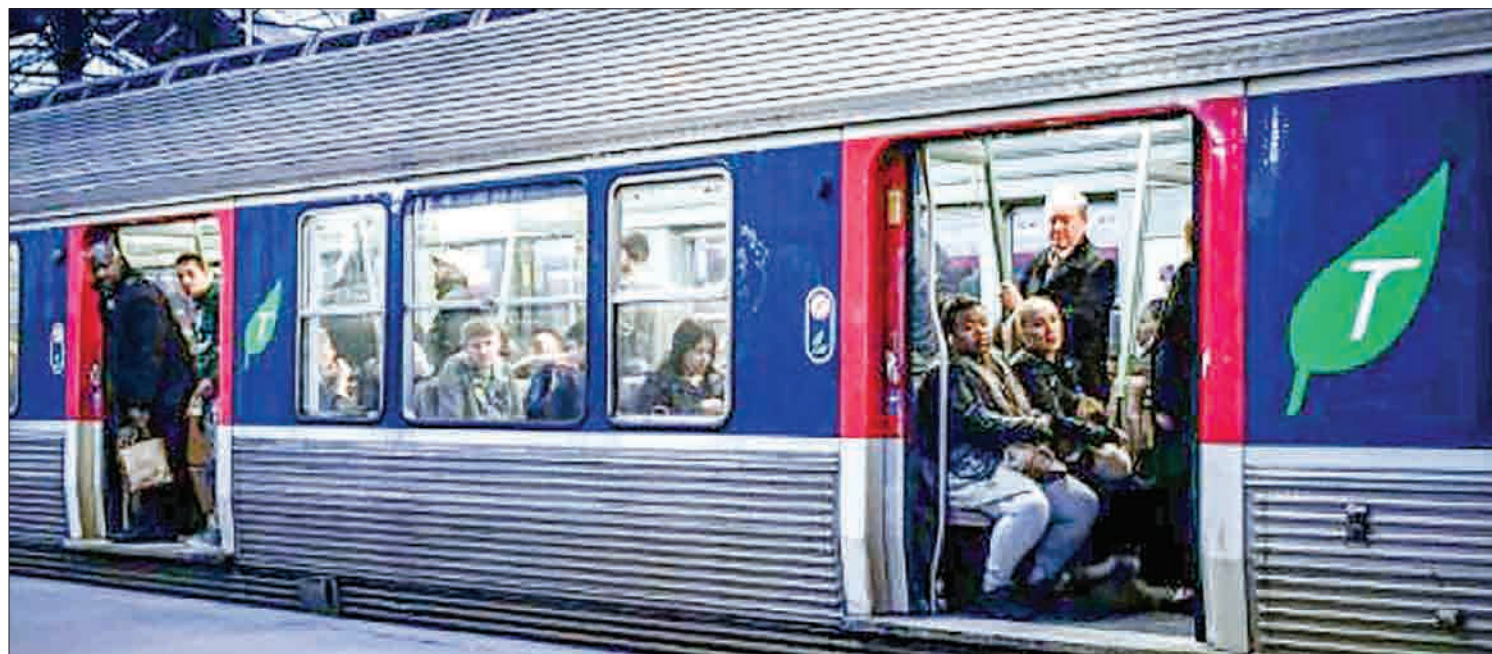
Rail workers began their strikes on two out of every five working days last week to protest the government's planned overhaul of the operator.

PARIS (France) — The head of French railway operator SNCF said on Monday that rolling strikes that began last week have cost the company around 100 million euros ($123 million) as staff carried out further stoppages.