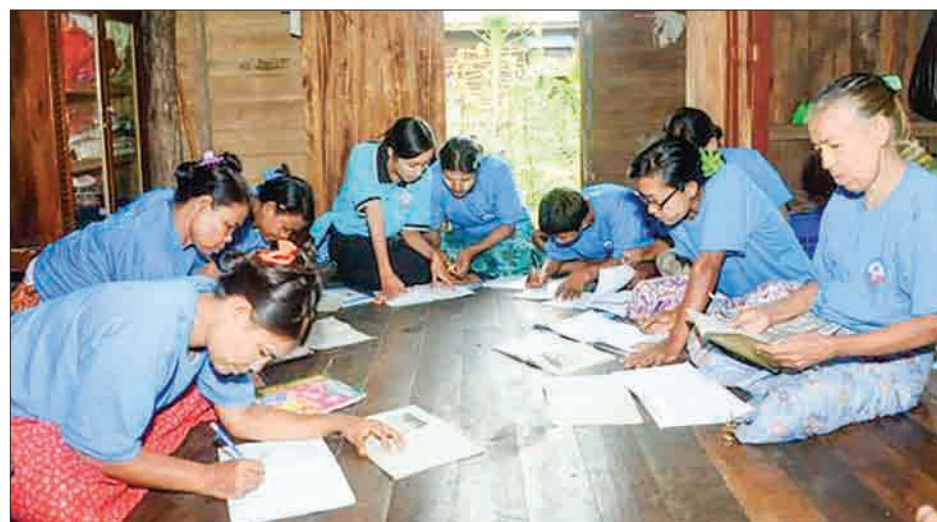
Literacy volunteers participating in literacy programmes in Rakhine State.