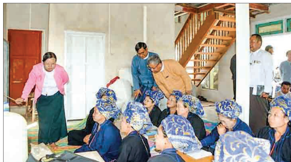
Teachers participating in literacy programmes in Taunggyi District.