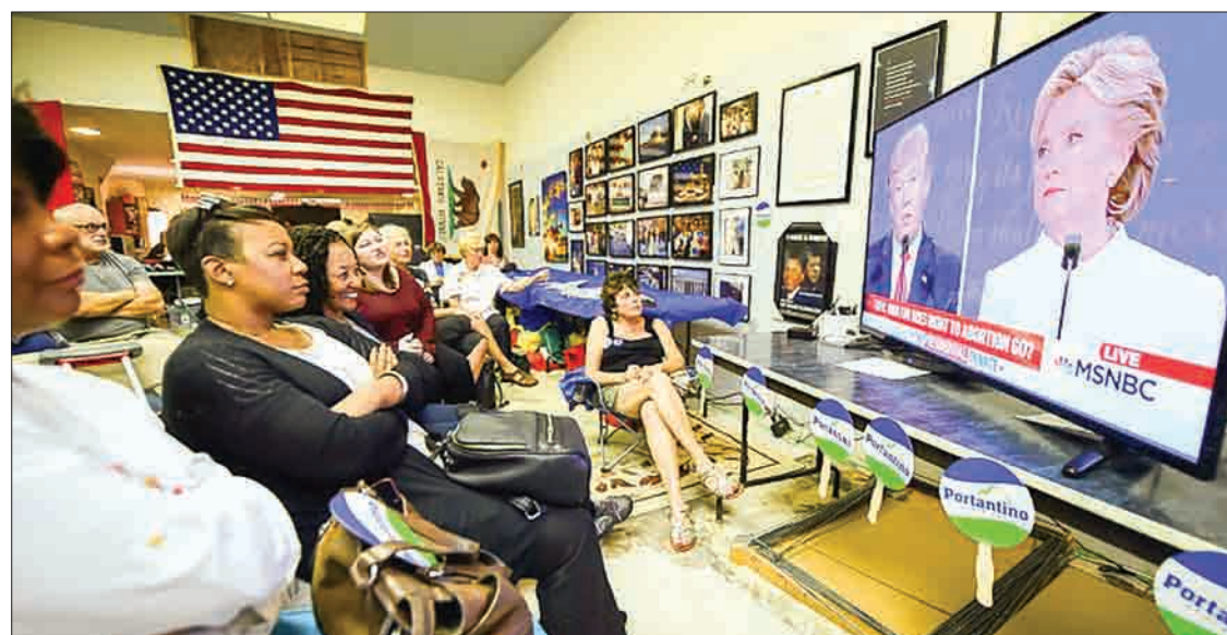
Americans gathered to watch the final presidential debate ahead of 2016 US election that Donald Trump went on to win.