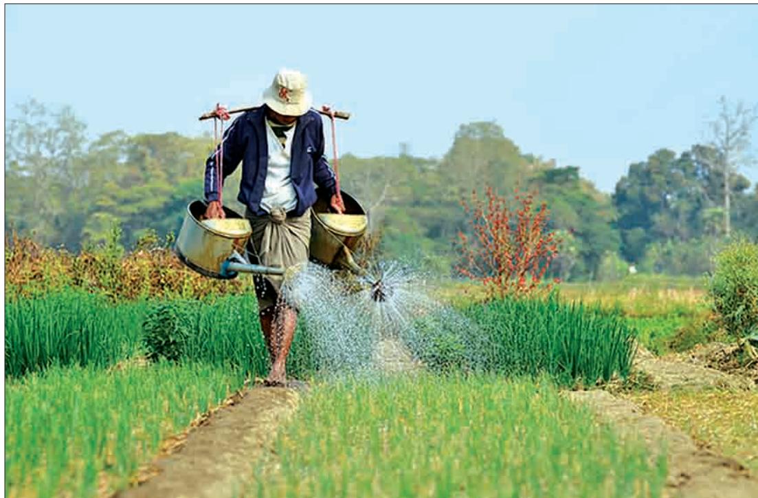
A farmer waters onions on a field in Padigon Township, Bago Region.