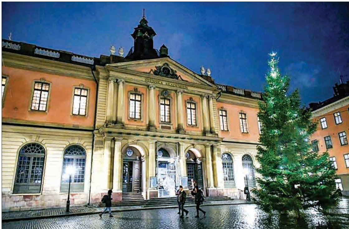
The prestigious Academy has been reeling since it was revealed as part of the #MeToo campaign in November that several members, as well as members' wives and daughters, had allegedly been assaulted by the well-known figure at the centre of the scandal.

peared has continued to grow," he said in a letter to the Aftonbladet newspaper, adding that the Academy's permanent secretary Sara Danius had been subject to "unjustified" criticism.