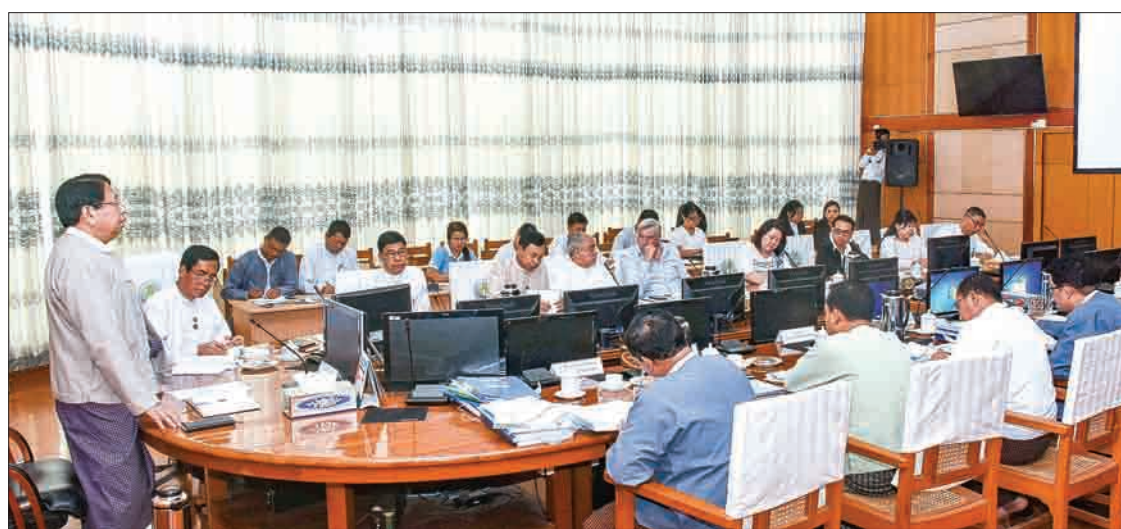
Union Minister Dr Pe Myint delivers the address at the coordination meeting for movie studio, skills training school in Nay Pyi Taw yesterday.

The Union Minister said the Ministry of Information