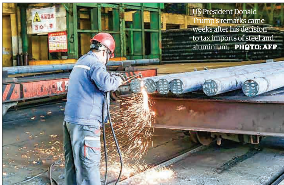
US President Donald Trump’s remarks came weeks after his decision to tax imports of steel and aluminium.

Asian markets rose earlier in the day as fears