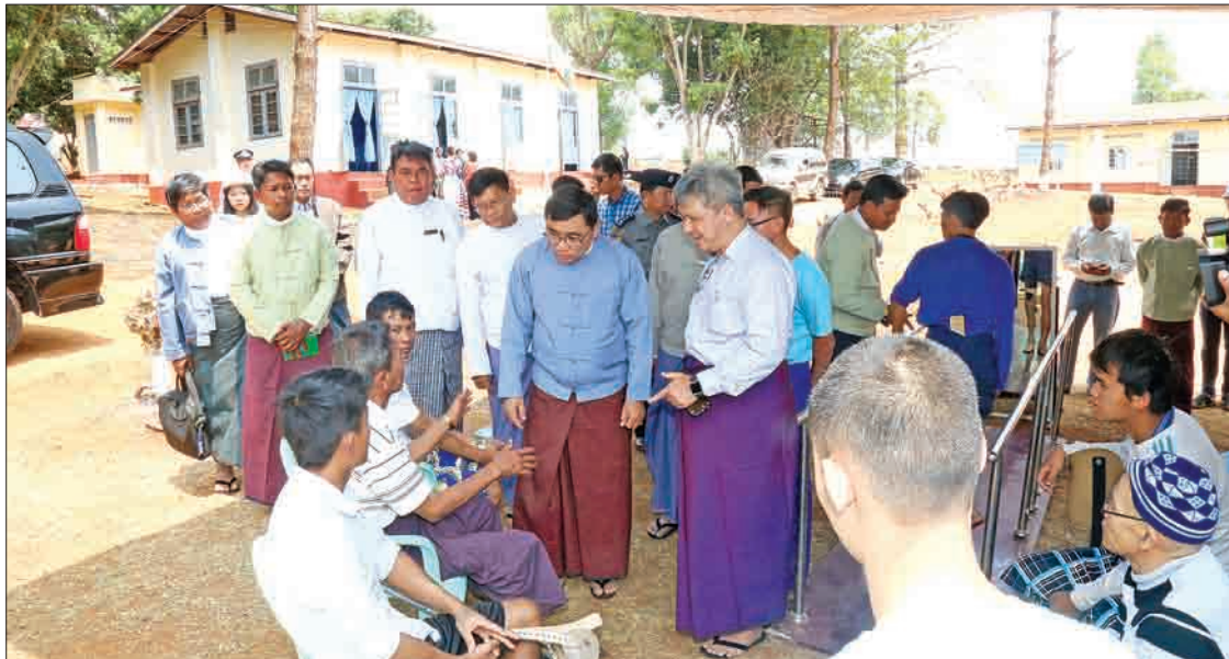
Union Minister Dr Win Myat Aye meets with the staff of the Ministry of Social Welfare, Relief and Resettlement at the Lashio District Office in northern Shan State.

At the meeting, the Union Minister said the government was striving to ensure the rule of law in the entire country, the development of socio-economic conditions, national reconciliation, internal peace and the establishment of a federal democracy union. The ministry is attempting to achieve peace, basic socio-economic development and equality in Shan State and other states, where many ethnic nationals live together. The ministry is cooperating and assessing the strengths of the departments, civil society organisations and the public. The ministry is in Lashio to assist and care for people displaced by armed conflicts, expectant mothers and children who need care, handicapped persons and women-led