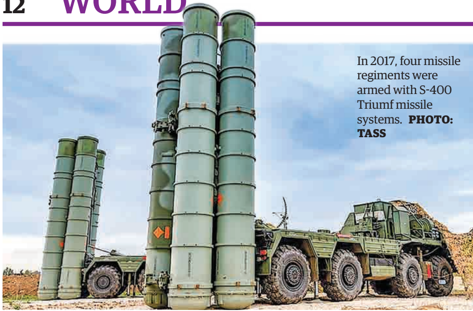
In 2017, four missile regiments were armed with S-400 Triumph missile systems.