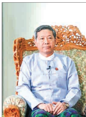
Union Minister Dr. Myo Thein Gyi.