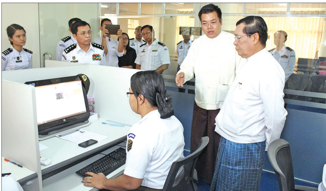
Union Minister U Thein Swe inspects the immigration office.

A: All in all, I am sure that Ministry of Labour, Immigration and Population has been made dramatic changes during the two years of taking office, and we are planning to set up Population Policy for future activities of taking census in order to be more effective. As such the process is gaining momentum. Therefore I am determined to serve the interest of the people to the best of my abilities.—Translated by Win Ko Ko Aung