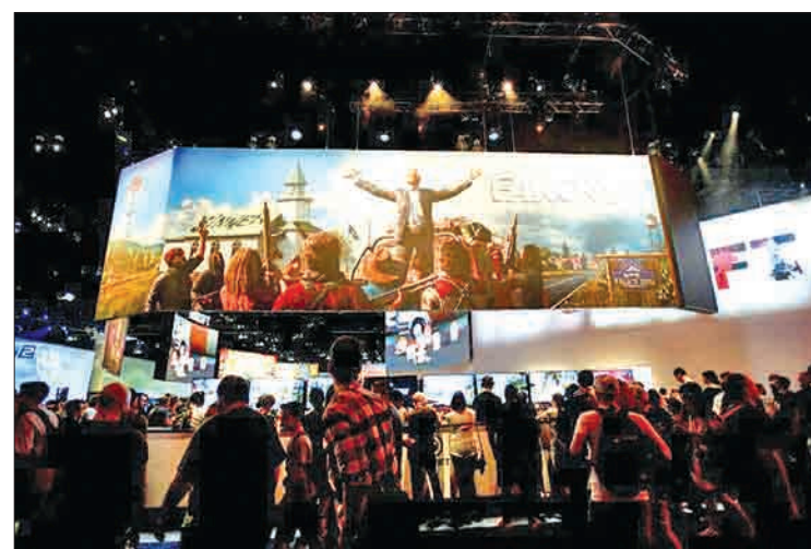
"Far Cry 5" sees players pitted against a dangerous cult in the US.

On Wednesday, the group said "Far Cry 5" had become