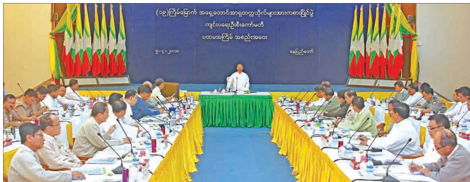
Vice President U Myint Swe addresses the first meeting for holding the 19 th ASEAN University Games (AUG) in Nay Pyi Taw.

The objective of the ASEAN University Games is to strengthen friendship among ASEAN nations through sports, and exchange experiences and culture among students studying