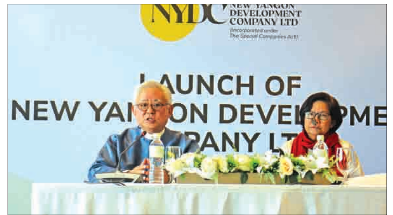
Serge Pun (L), CEO and vice chairman of New Yangon Development Co., and Nilar Kyaw, the firm's chairperson and Yangon Region Electricity, Industry and Transport Minister, talk about a plan to expand Yangon, Myanmar's commercial capital, in the city on 31 March 2018.

THE regional government administering Myanmar's major commercial capital Yangon and its vicinity is giving life to a stalled expansion plan aimed at eventually transforming the country's largest city into the next Southeast Asian economic hub, twice the size of Singapore.