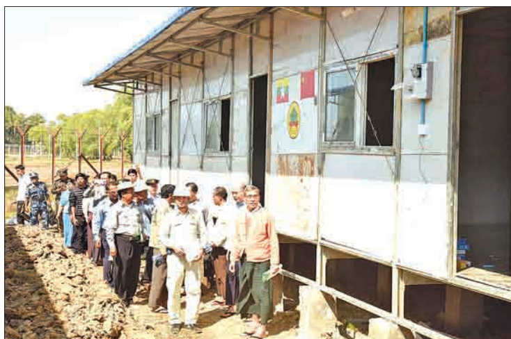
Authorities inspect houses to be used for repatriation of returnees in Taung Pyo Letwe, Maungdaw, Rakhine State.