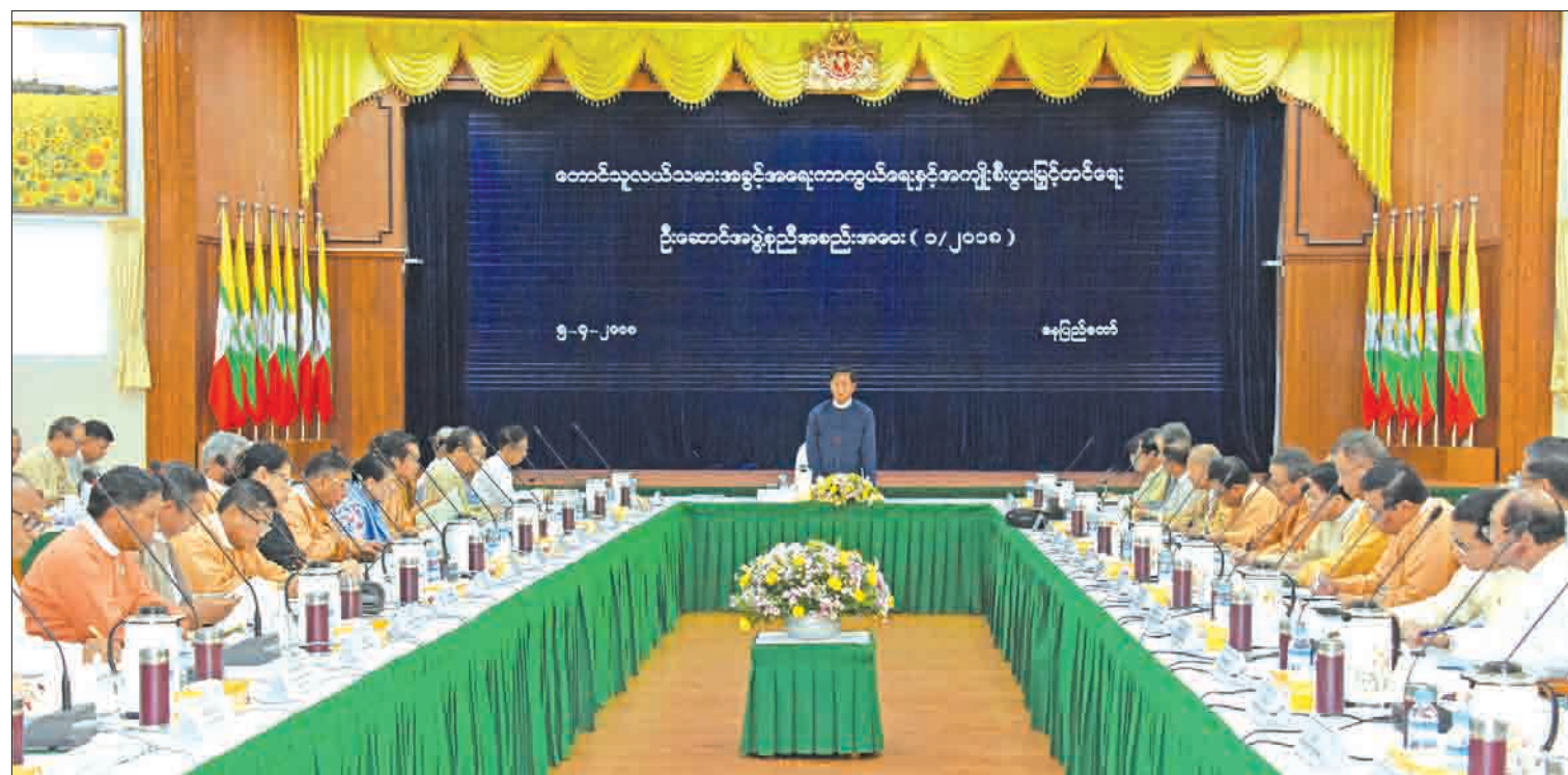
Vice President U Henry Van Thio delivers a speech at a meeting to promote and protect the rights of farmers and their businesses, in Nay Pyi Taw yesterday.

Farmers who suffered losses in the 2016 natural disasters were given Ks4.67 billion for crop substitution, Ks4.19 billion for the maintenance of dams and Ks2.47 billion for the maintenance of roads and bridges by