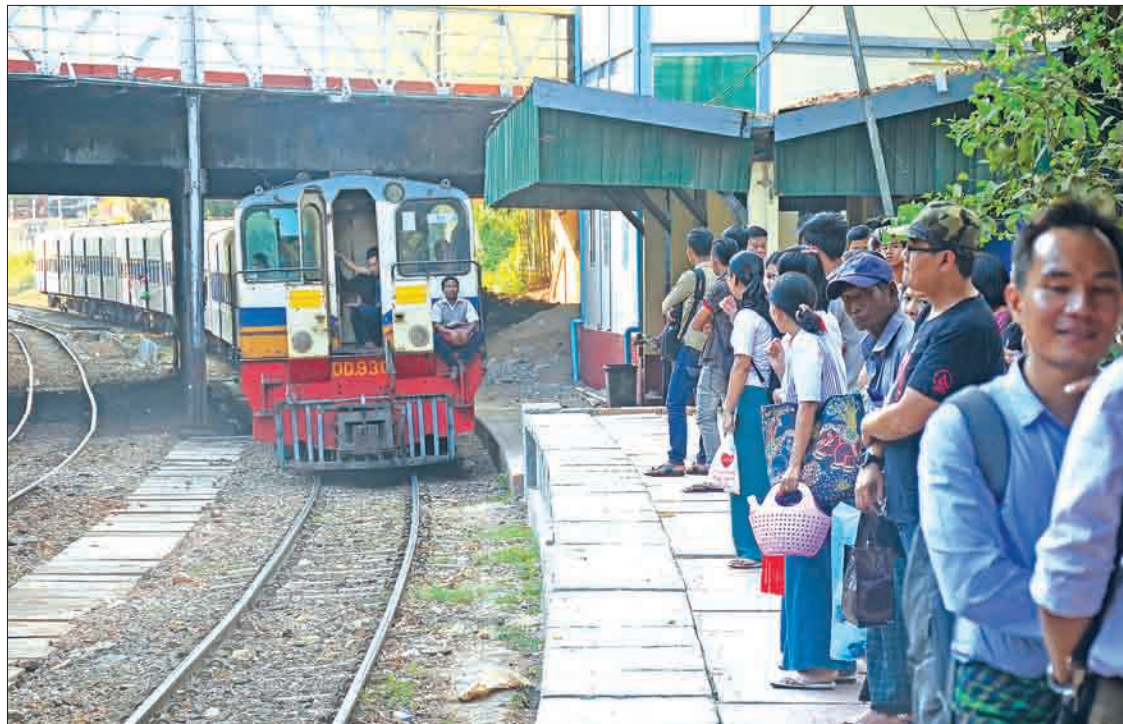
Passengers waiting to take a circular train on the rail route. Myanma Railways will stop some train services during Myanmar Traditional Thingyan Festival.

reduced by half on the festival holidays owing to a decline in the number of passengers dur-