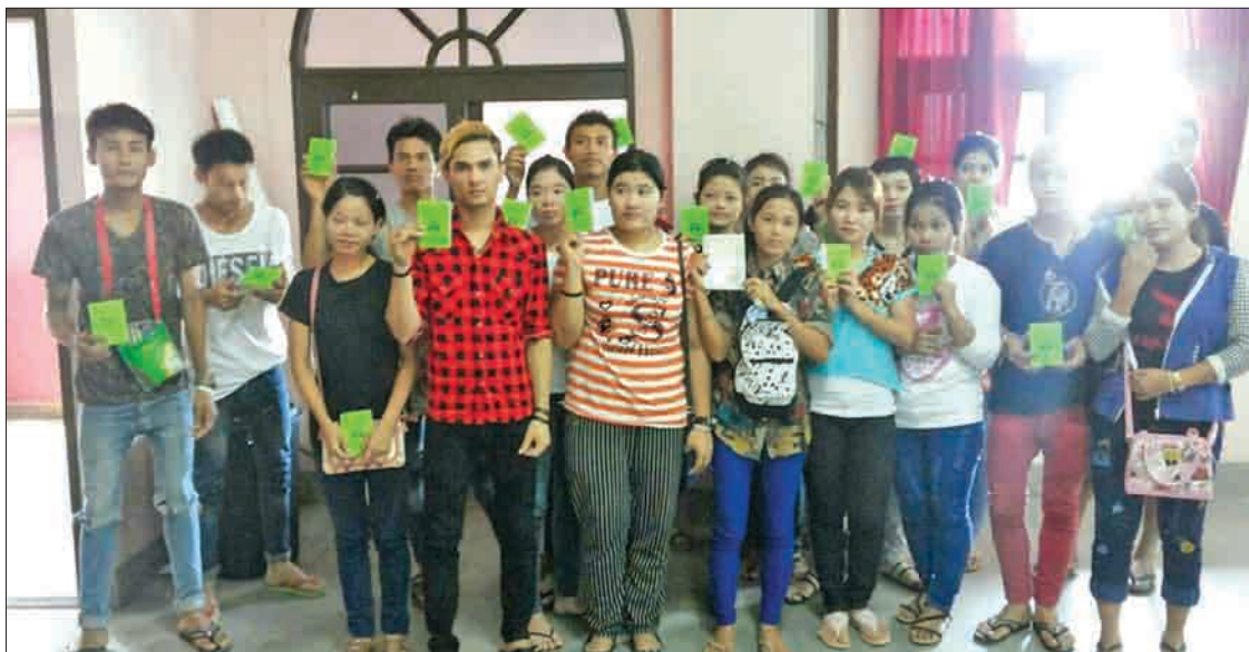
Ministry of Labour, Immigration and Population provides documents to Myanmar migrant workers.