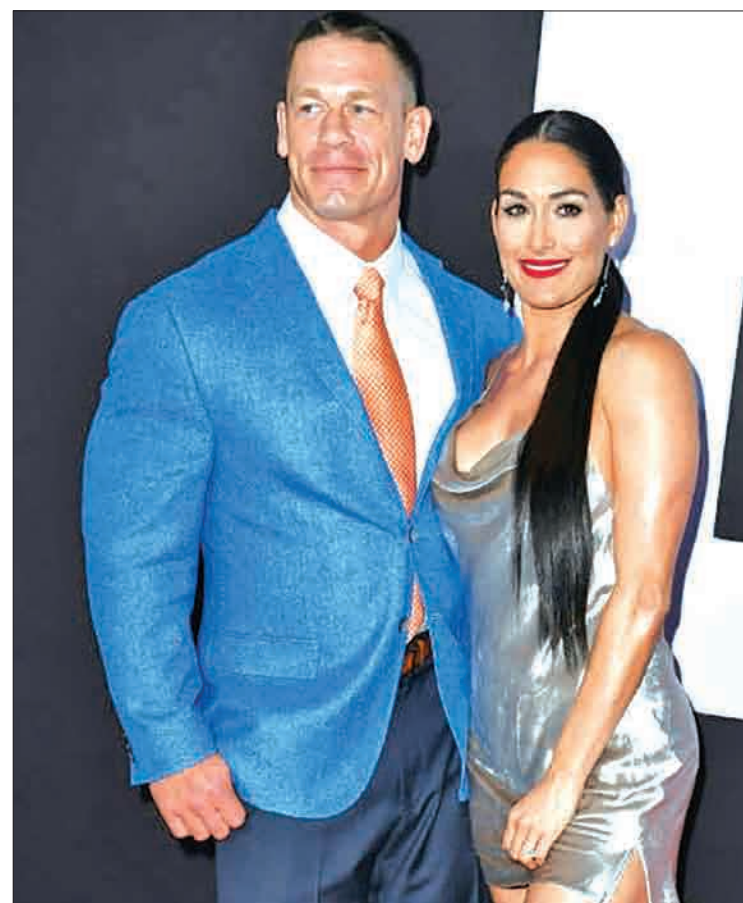
Actor and wrestler John Cena — here with his wrestler friend Nikki Bella — is one of three parents who stumble upon their daughters’ pact to lose their virginity on prom night in ‘Blockers’.