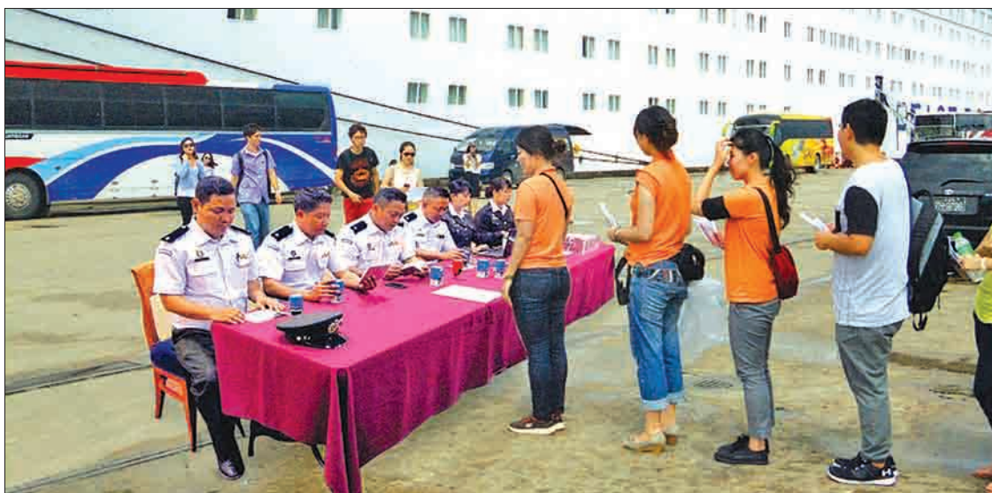
Immigration officers check passports of the cross border tourists.