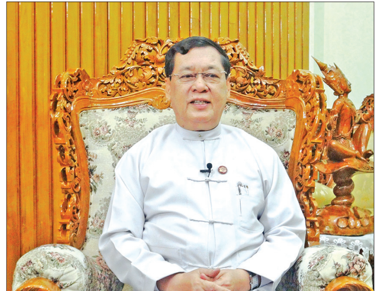
Union Minister for Labour, Immigration and Population U Thein Swe.

A: We have granted some 258 employment agencies for them, as a result we can send some 307767 worker to nine