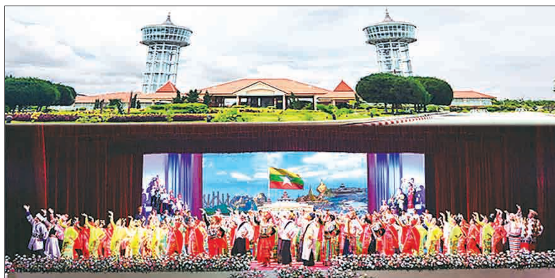
Traditional dance troupes from regions and states perform at the National Landmarks Garden in Nay Pyi Taw on 11 February to mark the 8 th anniversary of the founding of the garden.

The garden has seen an increasing number of visitors since the performance of the Fine Arts Department of the Ministry of Religious Affairs and Culture in January.