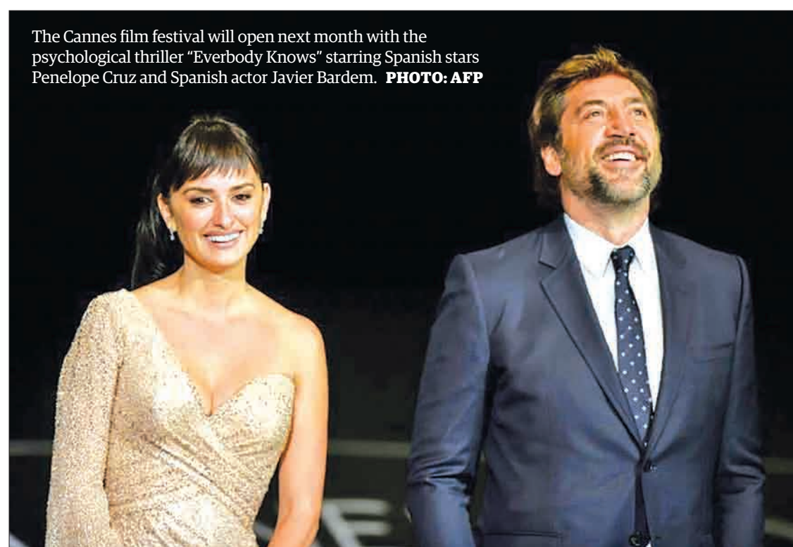
The Cannes film festival will open next month with the psychological thriller “Everybody Knows” starring Spanish stars Penelope Cruz and Spanish actor Javier Bardem.