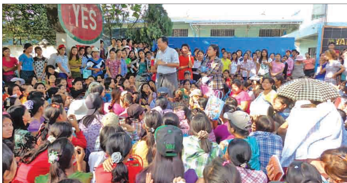
A labour official meeting with workers for labour arbitration.