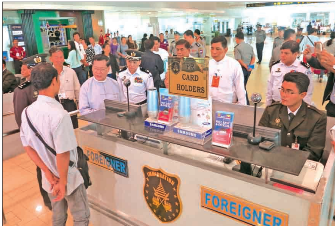
U Thein Swe inspects the immigration counter at the Yangon International Airport.