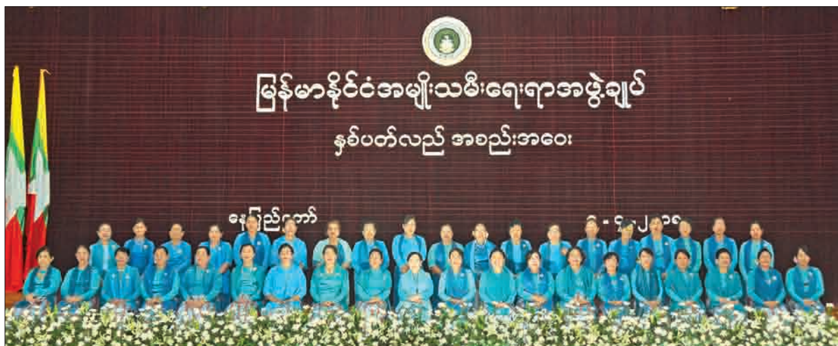
Members of Myanmar Women's Affairs Federation pose for the documentary photo at their annual meeting in Nay Pyi Taw on 5 April 2018.

The tug boat was pulling a container of gravel which was 115 feet in length and 38 feet wide. When the tug boat and the vessel transporting fuel hit each other the container of gravel sank in the river. Fortunately no casualties were reported.—MDN ■