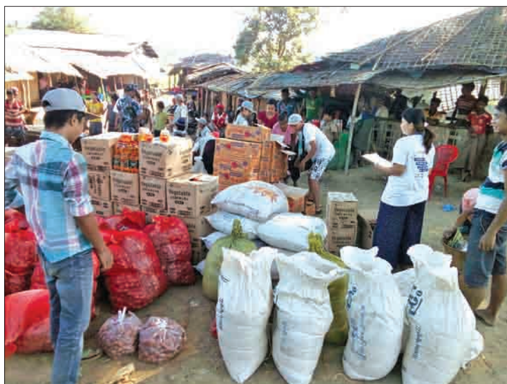
Humanitarian aids provided by voluntary youths in Buthidaung, Rakhine State, on 14 November 2017.

I'm personally delighted that civilian organisations like the Myanmar Engineers Society and the Myanmar Medical Association are helping with the various works in Rakhine. They do not view the situation as not concerning them. It's also encouraging seeing the youth of the country helping out in humanitarian projects.