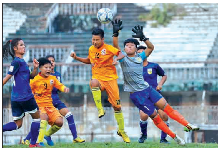
Zwekapin's striker tries to headbutt while University team's Goalie intervenes in yesterday's KBZ Bank's Women League match at Aung San Stadium.