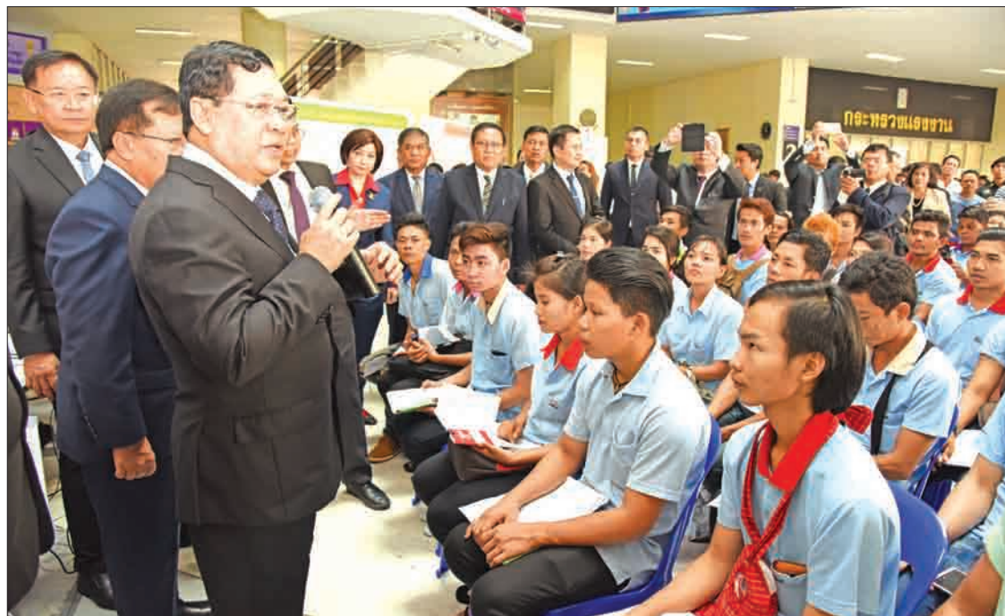
Union Minister U Thein Swe meeting with Myanmar migrant workers in Thailand.

countries during a period of two years. We also assist many workers who cannot show valid documents in Thailand. We have formed two committees as a mobile team which can issue Certificate of Identity _CI for some 1033174 worker in Thailand.