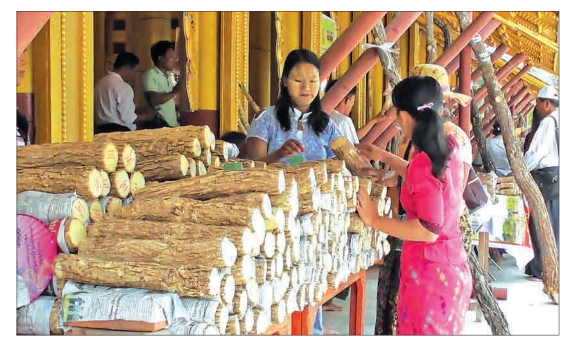
Piles of Myanmar thanakha bark being sold in the market. Thanakha is used as traditional cosmetics.

Although Thanakha based cosmetics have entered Myanmar, there are no official pur-