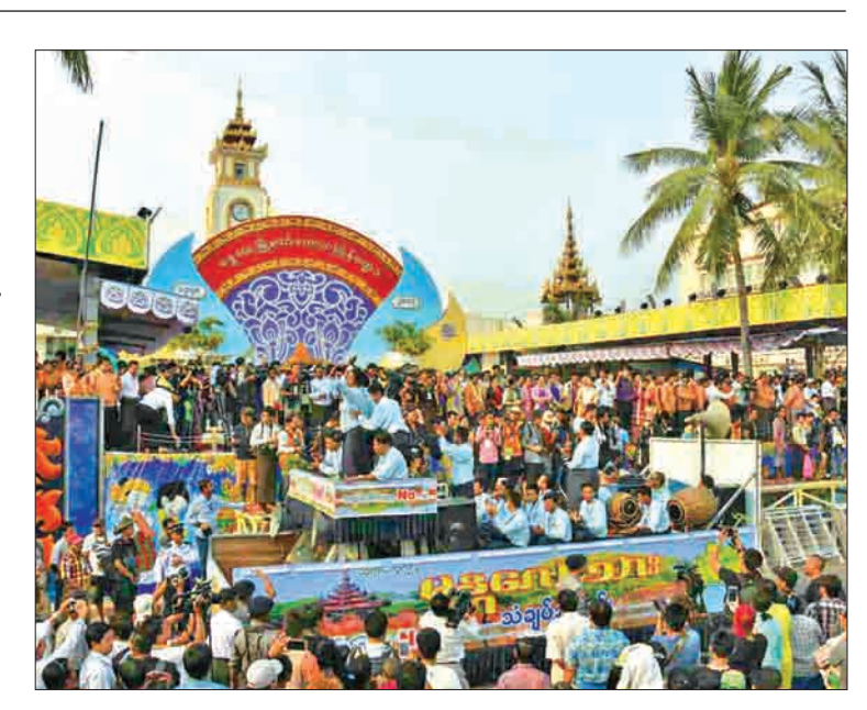
Traditional Thingyan Festival celebrated at Mandalay City Mahar Thingyan pandal in Mandalay in 2017.

Although hiring artists for entertainment was reduced, the Myoma Amateur Musical Instrument Association, the Myanma traditional Hsaing professional Sein Twint Lwin and the modern orchestra Dream Lover will entertain during the four-day Thingyan festival.—MDN ■