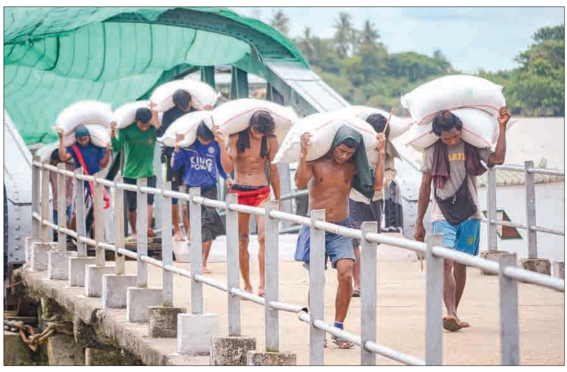
Workers carry rice bags at a jetty in Yangon.

The department has already vaccinated 1.95 million cattle against common diseases, such as the foot-and-mouth disease.—Myat Thu (AMIA) ■