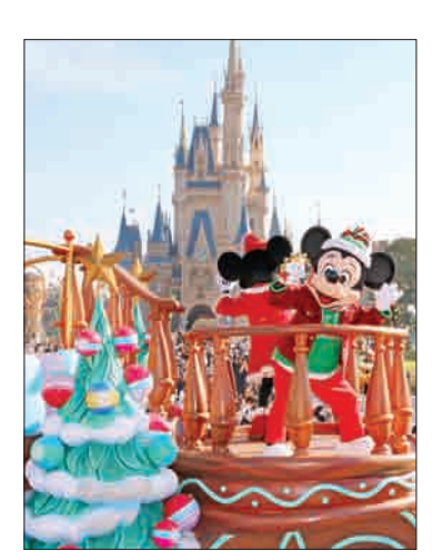
The Christmas parade begins as part of the special event called. 'Christmas Fantasy," at Tokyo Disneyland on 7 November, 2017. The event will run through 25 December.

A Christmas event to light up the Cinderella Castle at Tokyo Disneyland with projection map-