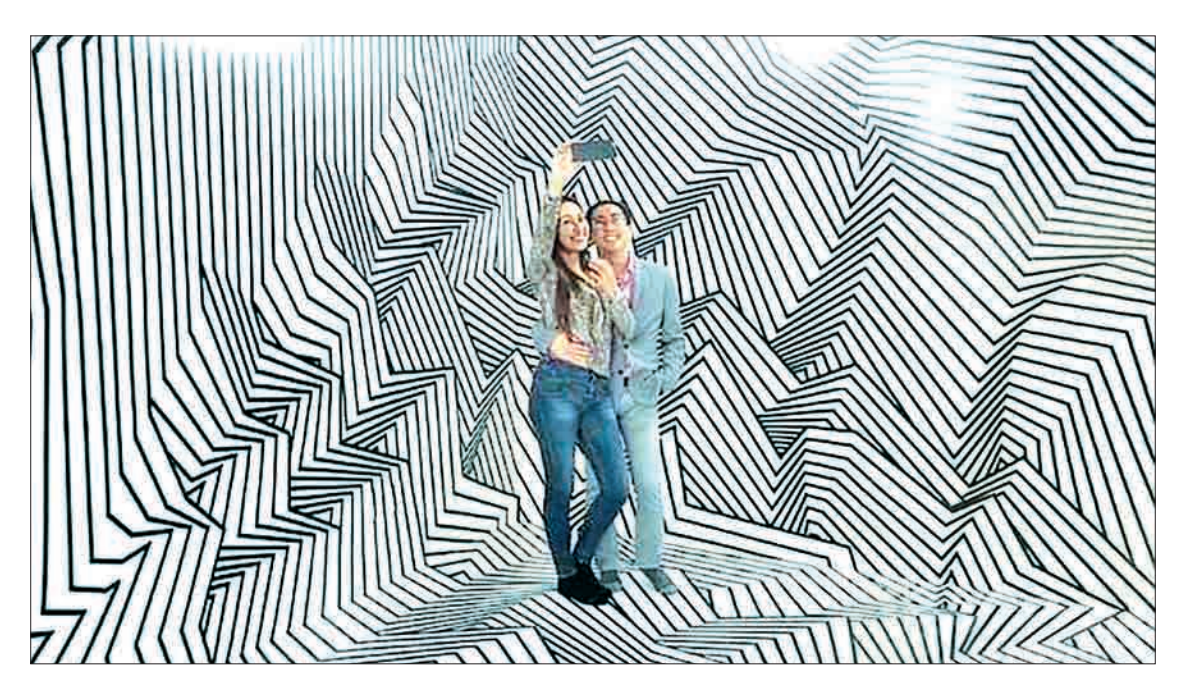
Visitors snap a self-portrait featuring a work by Darel Carey at the Museum of Selfies.

In reality there's a backdrop photograph of the "ground below" printed on a small platform, from which sprouts a tube that looks like the building's antenna complete with a red signaling