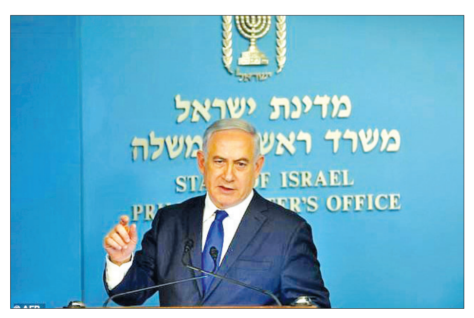
Israeli Prime Minister Benjamin Netanyahu speaks to the press at the MP's Jerusalem office on 2 April, 2018.

JERUSALEM — Israeli Prime Minister Benjamin Netanyahu said on Tuesday he was cancelling an agreement with the UN refugee agency on resettling thousands of African migrants after facing mounting pressure from his right-wing base.