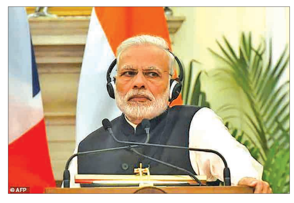
India's Prime Minister Narendra Modi has withdrawn an order clamping down on "fake news".

About 2,000 journalists with leading Indian media have a Press Information Bureau card from the in-