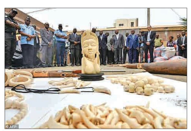
Britain said the international illegal wildlife trade was estimated to be worth up to £17 billion ($24 billion, 19.5 billion euros).

The number of elephants has declined by almost a third in the last decade and around 20,000 a year are still being slaughtered due to the