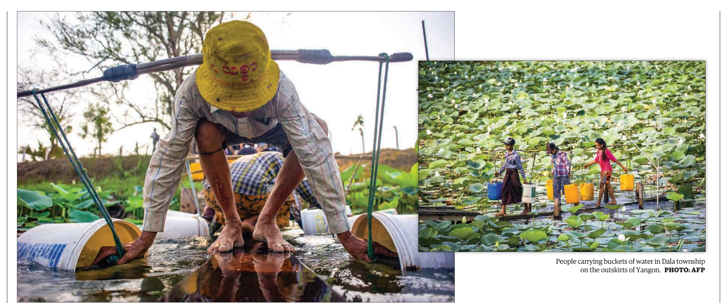
Residents collect drinking water from a lake in Dala township located outside Yangon city.

Cooperation between government and the private sector is sine qua non for country-wide private sector development.