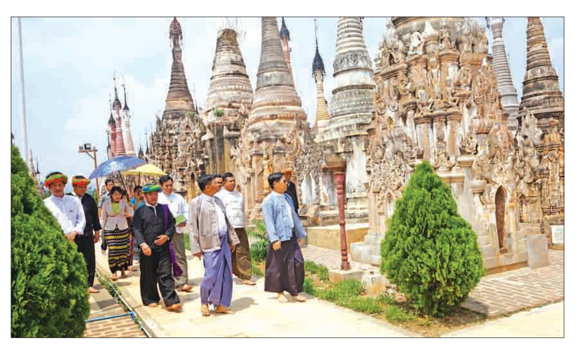
Union Minister Thura U Aung Ko visits Mway Taw Kakku Pagoda (complex) in Kakku Village Tract, near Inle Lake yesterday.

10 NATIONAL 4 APRIL 2018 THE GLOBAL NEW LIGHT OF MYANMAR