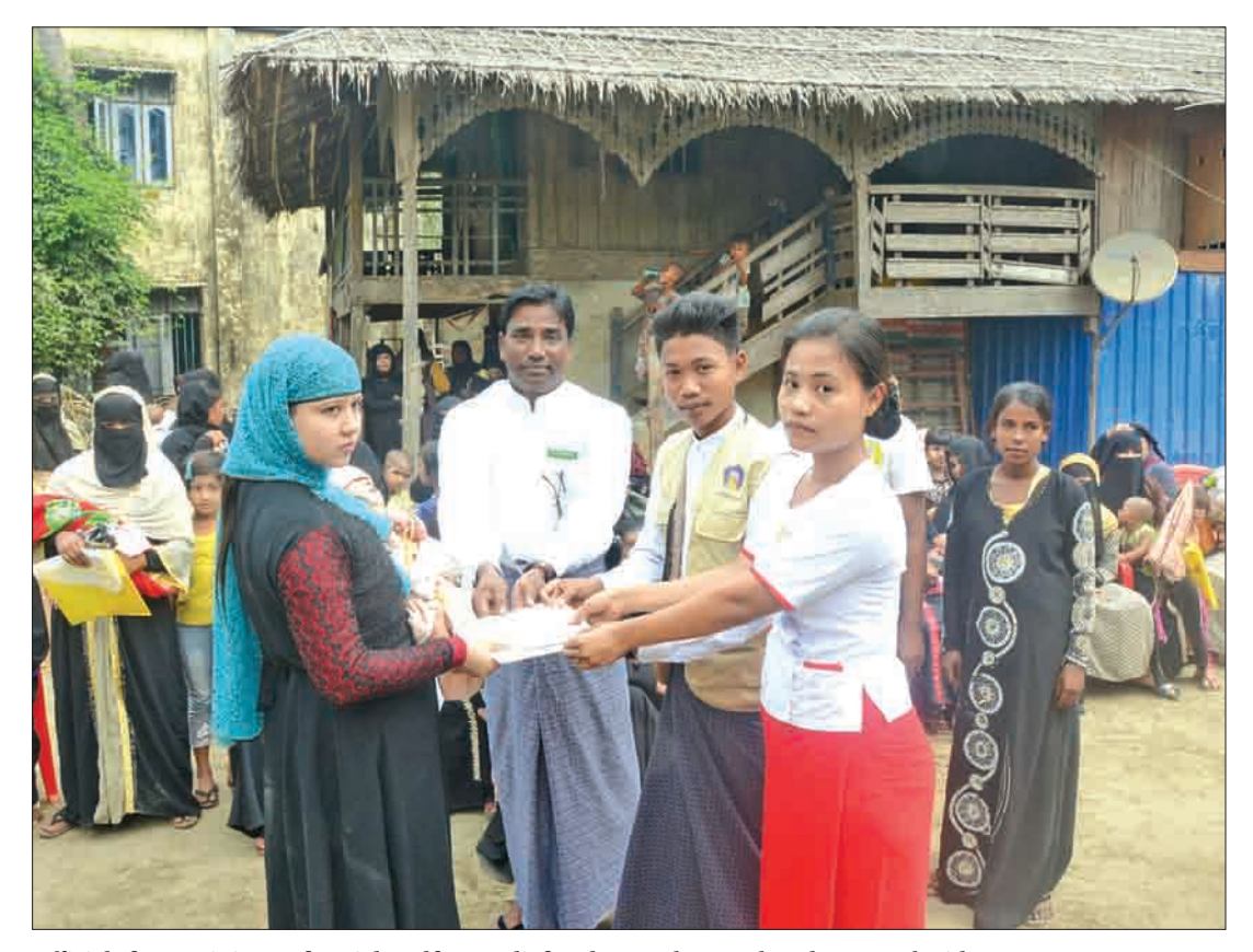
Officials from Ministry of Social Welfare, Relief and Resettlement hand over cash aid to pregnant women, children below two years in Maungtaw yesterday.