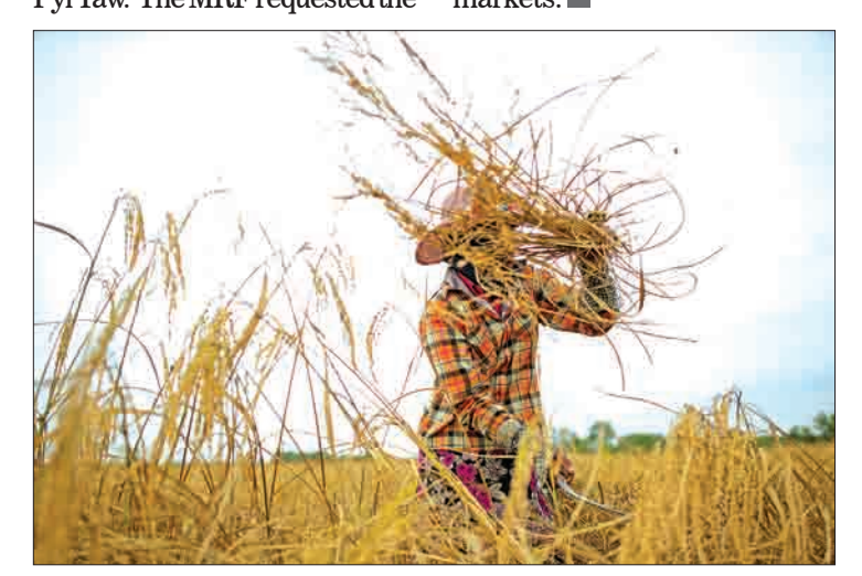
This photo taken on 27 December, 2017 shows a farmer working in a rice field on the outskirts of Yangon.

"We have requested the government to clamp down on illegal rice trading. The country will incur tax losses if illegal rice trading continues," said U Ye Min Aung. Myanmar exported 3.2 million tonnes of rice, as of 19 March. Myanmar has also intended to export four million tonnes in 2020. Further, it plans to increase rice exports to new markets.