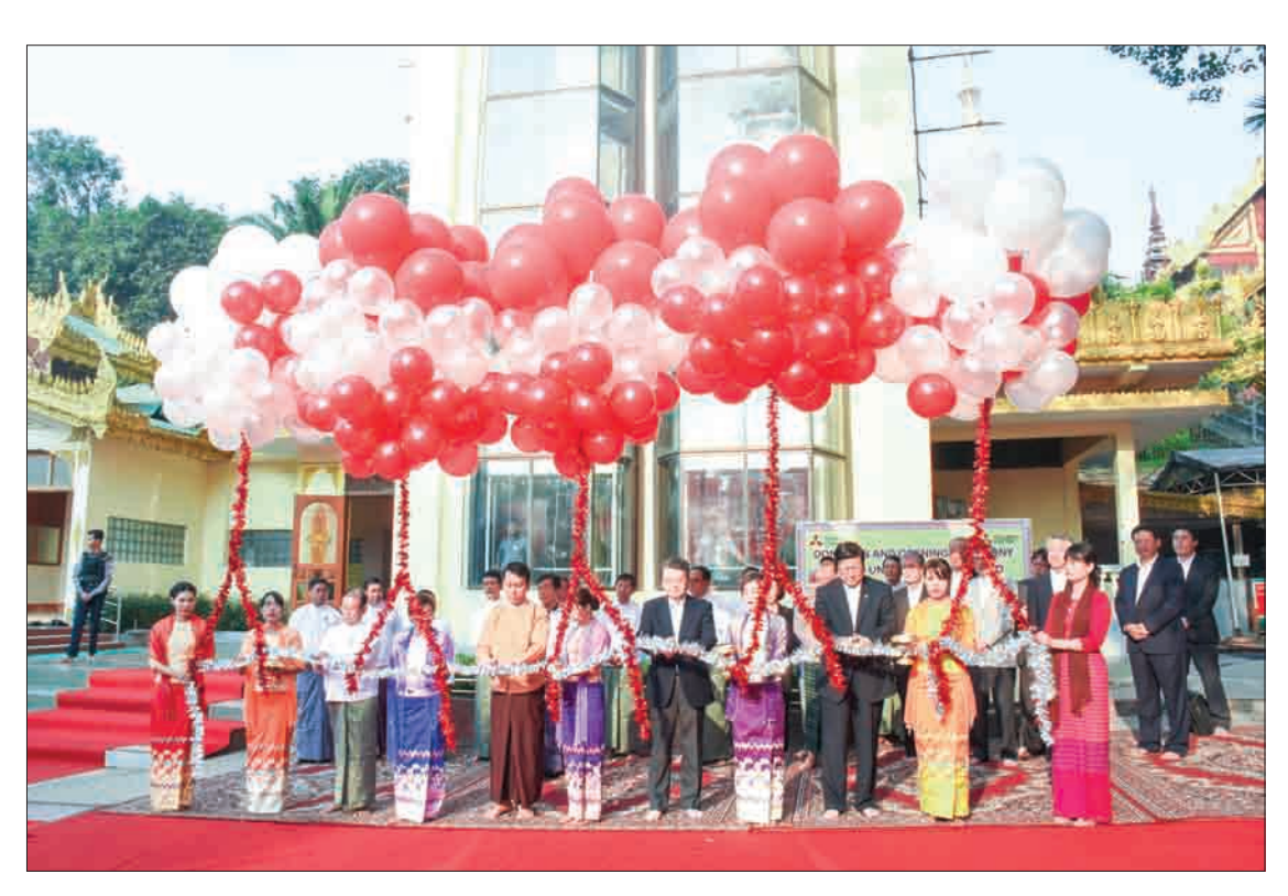
Yangon Region Chief Minister U Phyo Min Thein and Shwedagon Pagoda Board of Trustees cut ribbons to open two lifts at the East Gate of Shwedagon Pagoda in Yangon yesterday.

Shwedagon Pagoda is a must see location for local and foreigner visitors in Myanmar there are about 80,000 visitors a day on normal days. On days of religious significance, the number of visitors to the pagoda has reached around 200,000.—MDN