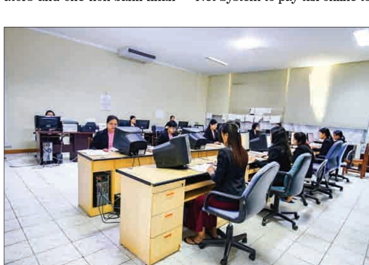
The Audit Department of Central Bank of Myanmar.