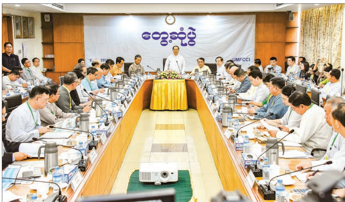
Vice President U Myint Swe addresses the assembled Myanmar entrepreneurs at the 16 th regular meeting for private sector development at UMFCCI in Yangon.

The meetings between PSDC and Myanmar entrepreneurs started in December 2016 and the 15 th meeting