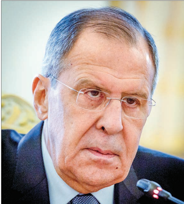
Russian Foreign Minister Sergei Lavrov.

MOSCOW, Russia — Russian Foreign Minister Sergei Lavrov on Monday suggested that the poisoning of a former double agent could benefit the British government by distracting attention from problems around Brexit.