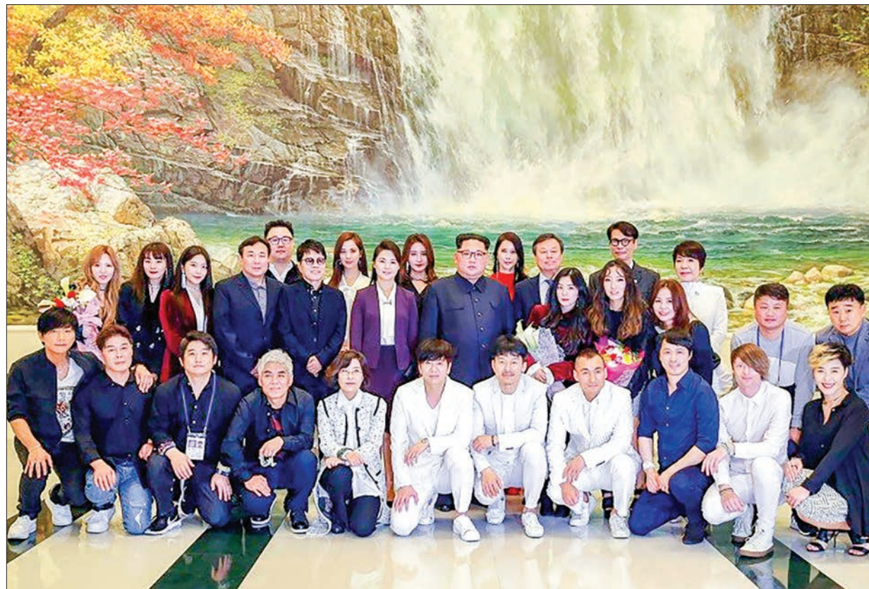
The high profile appearance of Kim and his wife, former singer Ri Sol Ju, at the concert was unusual as his authoritarian regime typically struggles to prevent any infiltration of the South's pop culture among his isolated people.

Kim said he was likely to be busy "because of his complicated political program early in April," so he was glad to make it to the concert which he