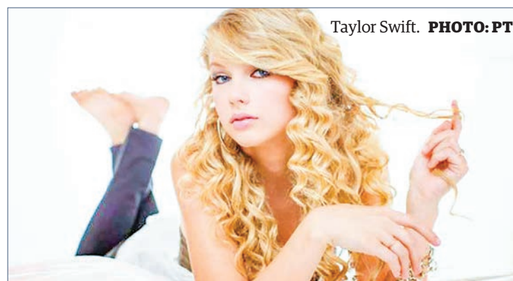
Taylor Swift.

His comments come after Donald, in a fit of rage, shared a 15-page fake script for the show after its cancellation was announced.—PTI ■