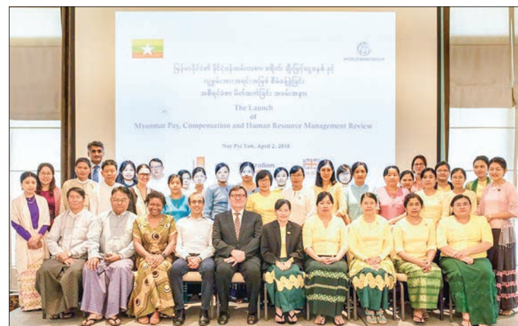
Participants pose for the documentary photo at the launching ceremony of Myanmar Pay, Compensation and Human Resource Management Review in Nay Pyi Taw on 2 April.

request for the World Bank's advice on compensation and human resource policies that reflect country-specific circumstances.—GNLM ■