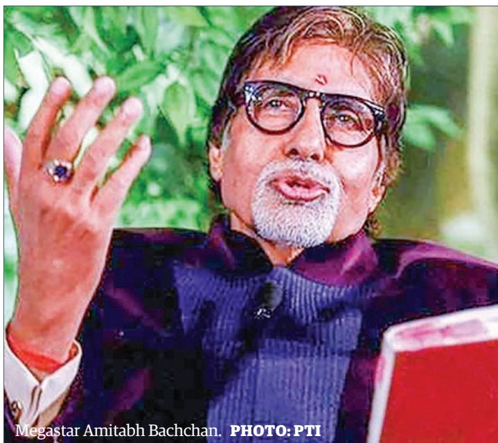
Megastar Amitabh Bachchan.

Film is the original, digital format is not and in time to come this format may retire too,” he added. Bachchan also shared few pictures from the round table event, which was attended by Shah Rukh Khan and Kamal Haasan among others.—PTI ■