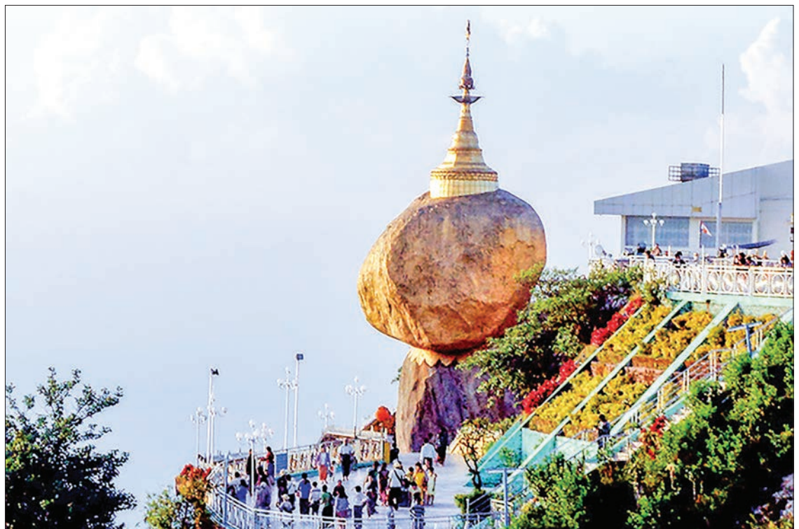
Kyaiktiyo pagoda is seen precariously located on a stone.

through February this year, the Kyaiktiyo Pagoda hosted some 1.7 million local visitors, as well as 70,000 foreign travellers. The majority of tourists were from Thailand.