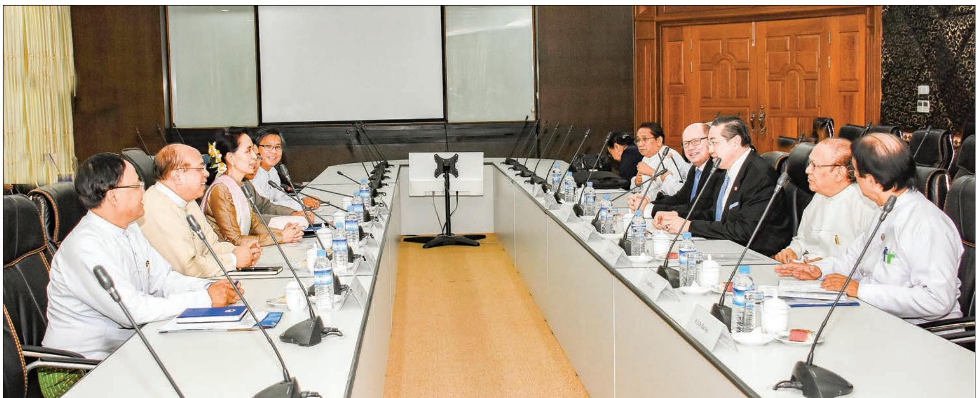
Daw Aung San Suu Kyi meeting with Dr. Surakiart Sathirathai, Chairman of the Advisory Board of Committee for Implementation of Recommendations on Rakhine State.

State Counsellor holds talks with Advisory Board of Committee for Implementation of Recommendations on Rakhine State