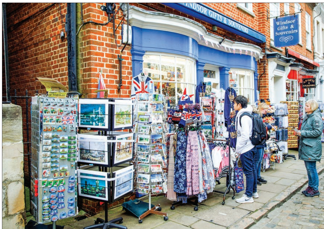
Tourists look at souvenirs featuring Britain’s Prince Harry and his fiancée US actress Meghan Markle in a gift shop in Windsor, west of London on April 1, 2018. Britain’s Prince Harry and US actress Meghan Markle will marry on May 19 at St George’s Chapel in Windsor Castle.

Some 600 people have been invited to the wedding, with 200 going on to a private evening party thrown by Harry’s father Prince Charles, the heir to the throne.—AFP ■