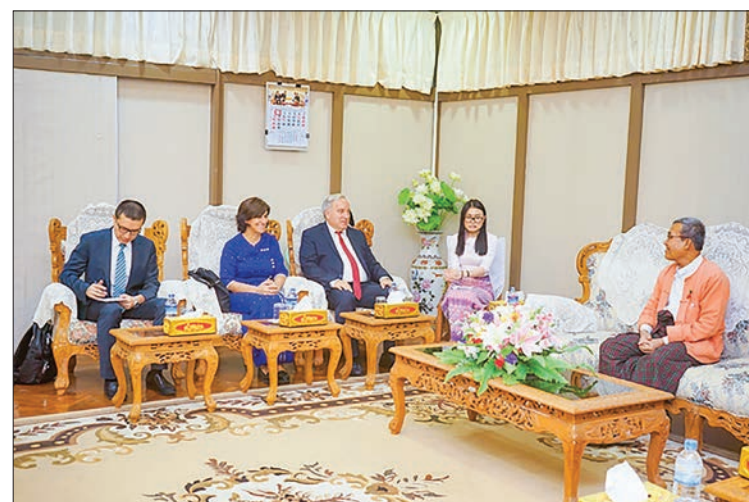
Rakhine State Chief Minister U Nyi Pu meets with Ambassador of Turkey Mr. Kerem Divanlioglu yesterday.

transit camp, the returnees will be settled in their original place or a place nearest to where they previously stay. This is according to the bilateral agreement. Income generation measures are arranged so that returnees earn income while building their own houses. The government has formed a committee to receive and resettle returnees and Deputy Minister for Ministry of State Counsellor's Office is organizing this by basing in Rakhine State. Arrangements are made for the long term existence of the returnees as well as for the long term existence and socio-economic development of ethnic nationals. If such development works are conducted, there wouldn't be conflicts anymore and the two societies can live for long said the Chief Minister. —Tin Tun (IPRD) ■