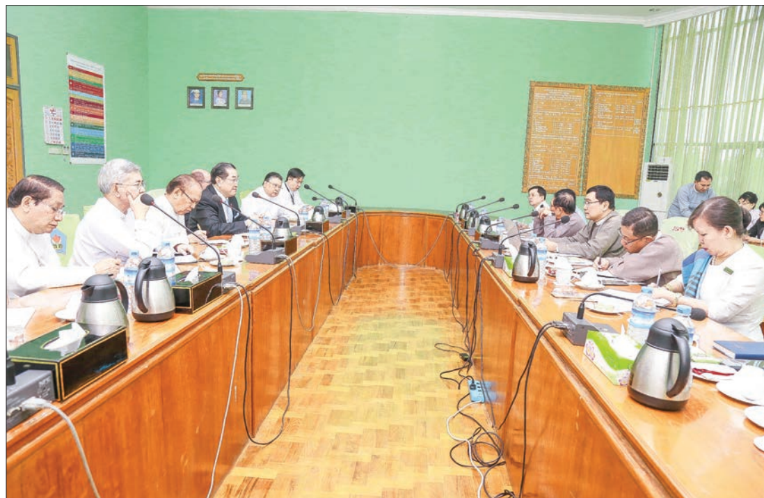
Union Minister Dr Win Myat Aye holds talks with the Advisory Board of the Committee for Implementation of the Recommendations on Rakhine State in Nay Pyi Taw.

UNION Minister for Social Welfare, Relief and Resettlement Dr. Win Myat Aye and the Advisory Board of the Committee for Implementation of the Recommendations on Rakhine State held talks yesterday in Nay Pyi Taw over several issues for Rakhine State.