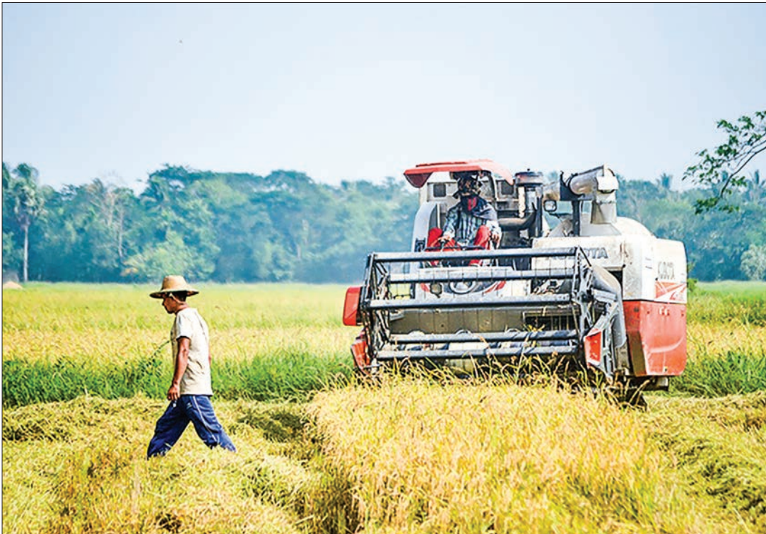
A farmer walks past the harvester in a paddy field in Kangyidauk, Ayeyawady.