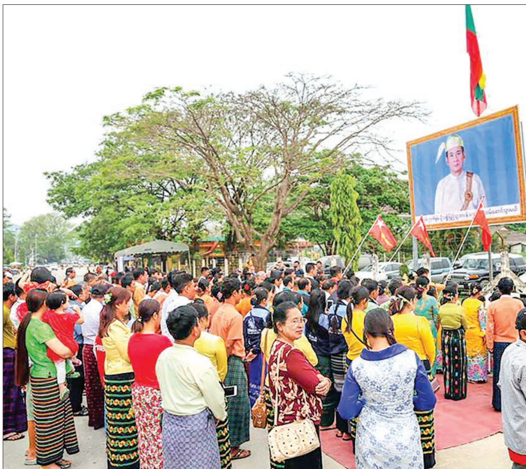
Local people rally to show support for the newly elected President U Win Myint in Tachilek, Eastern Shan State on 1 April.