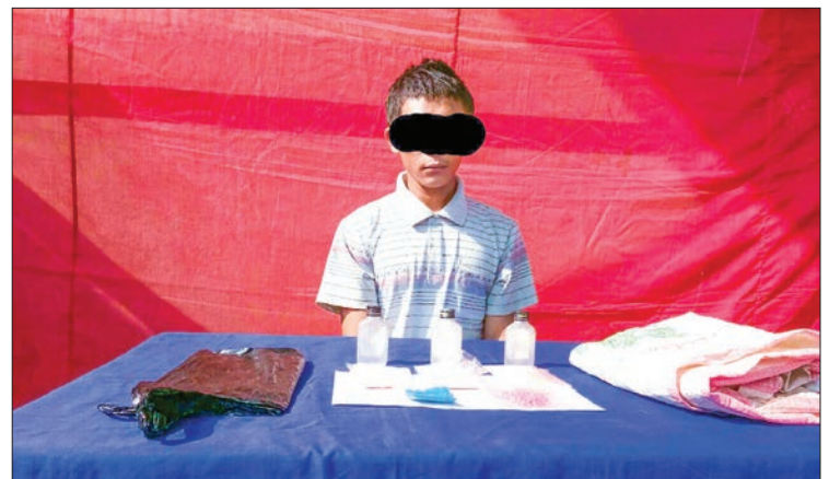
Man in Mohnyin Town arrested for possessing illegal drugs.

The police have filed charges against three persons under the Narcotic Drugs and Psychotropic Substances Law. Further investigations are being conducted by the police to arrest others involved in the case.—GNLM ■