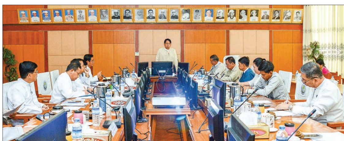
Union Minister Dr Pe Myint delivers the speech at the meeting to establish a movie studio and skill training in Nay Pyi Taw yesterday.