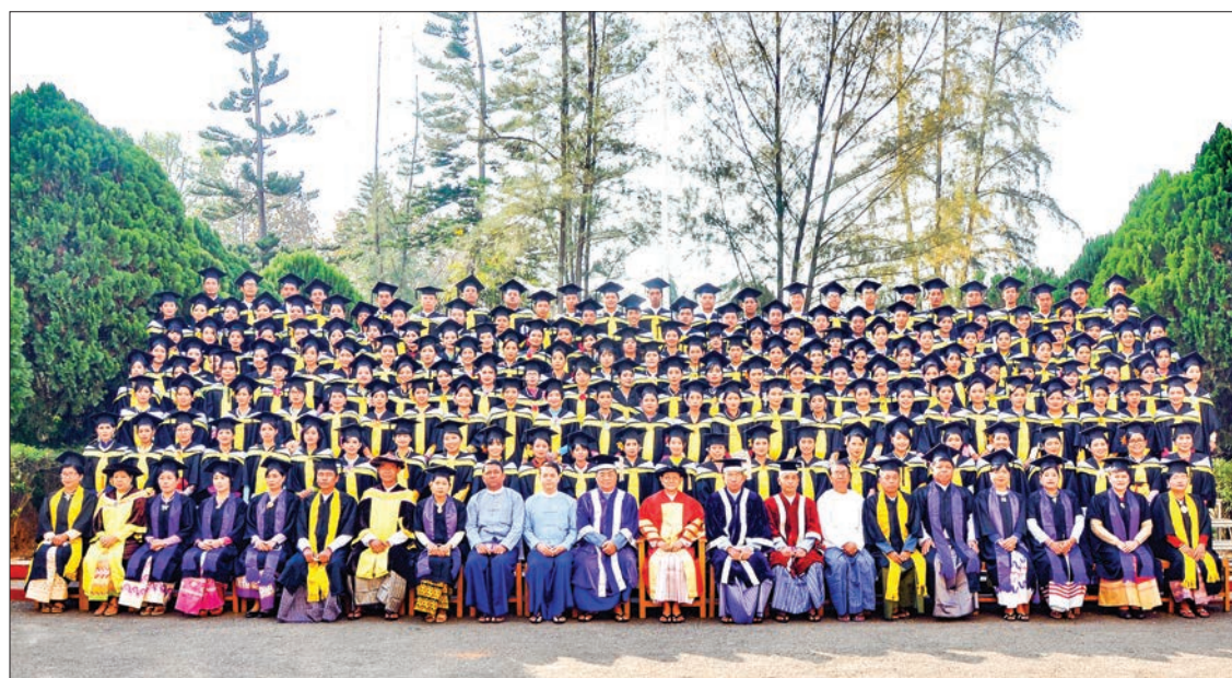
The third batch of the Post Graduate Diploma in Public Administration, faculties and officials of the Union Civil Service Board pose for documentary photo.

The first thing I noticed when I sat for the examination was that we had to resort to our knowledge and wisdom rather than using our memory. I want to say that this type of question is really effective for everyone. ■