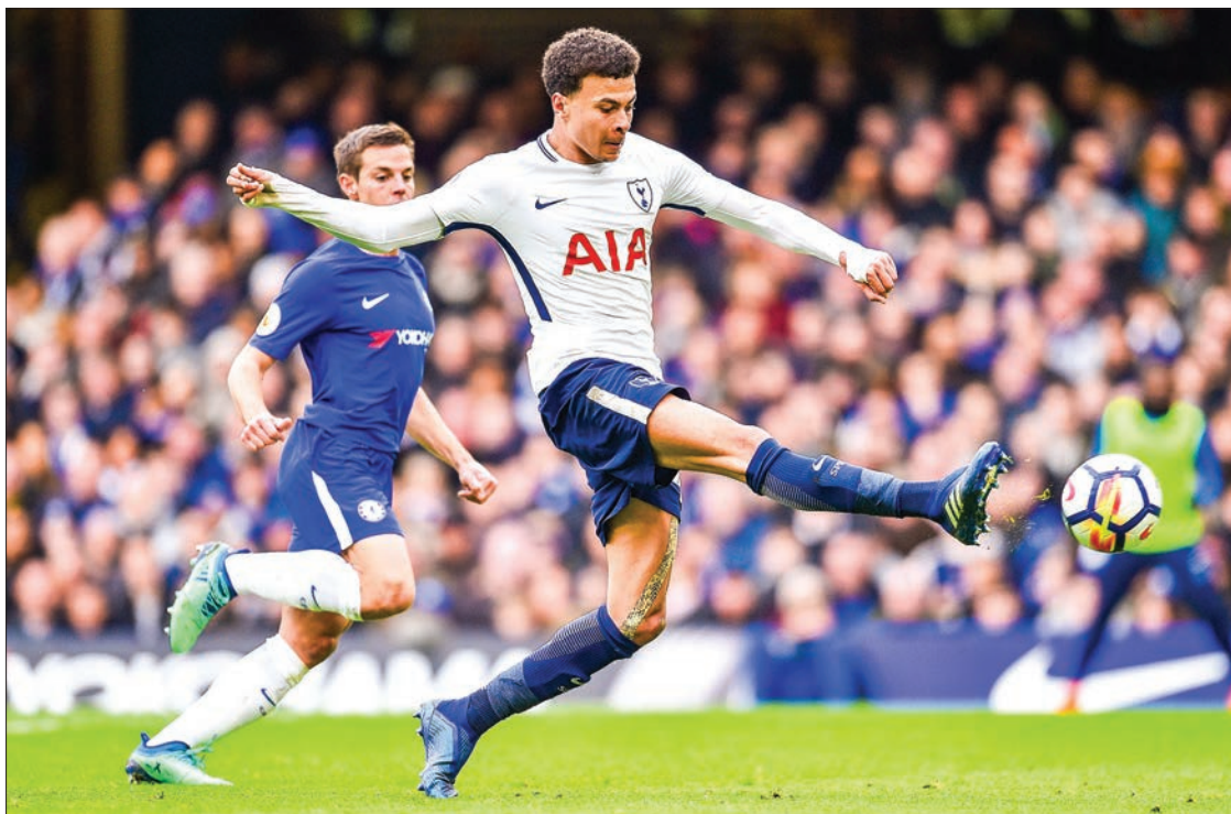
Tottenham Hotspur's English midfielder Dele Alli (C) shoots to score their second goal during the English Premier League football match between Chelsea and Tottenham Hotspur at Stamford Bridge in London on 1 April, 2018.

Alli was pushed into a more advanced role than his usual roving role behind Kane and had the