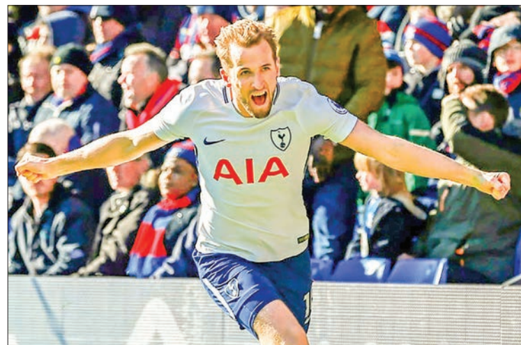
Tottenham striker Harry Kane has been sidelined for three weeks since suffering an ankle injury in a 4-1 win at Bournemouth.

Son Heung-min takes Kane's place up front hoping to continue his hot streak of seven goals in his last five games for Spurs.