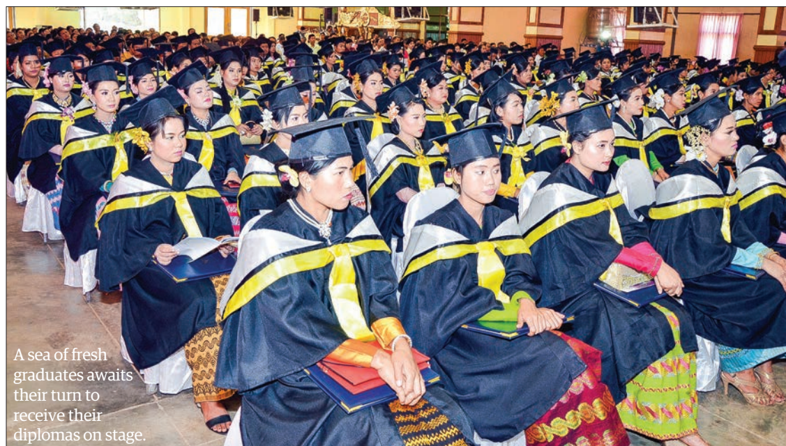
A sea of fresh graduates awaits their turn to receive their diplomas on stage.