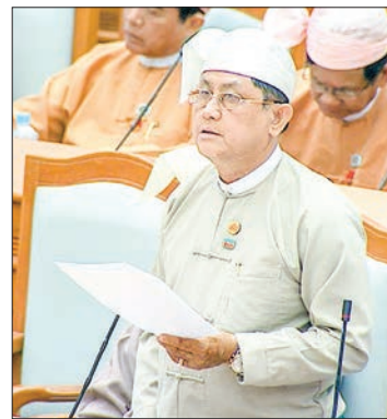
Deputy Minister for Planning and Finance U Maung Maung Win.

fore, the Yangon-Bawnetkyi road section is definitely becoming part of the east-west economic corridor and this 40-mile road section should be a fully owned concession of the nation. That is why the upgrade of this road section using the ADB loan was explained by the Deputy Minister.