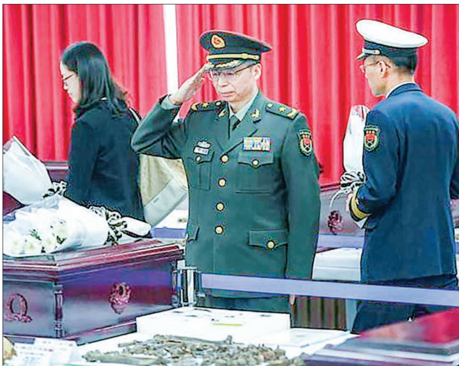
A Chinese military officer salutes near the remains of Chinese soldiers who fought during the Korean War.

lions of troops to intervene as US-led United Nations forces drove Kim Il Sung's army back towards the Chinese frontier in late 1950,