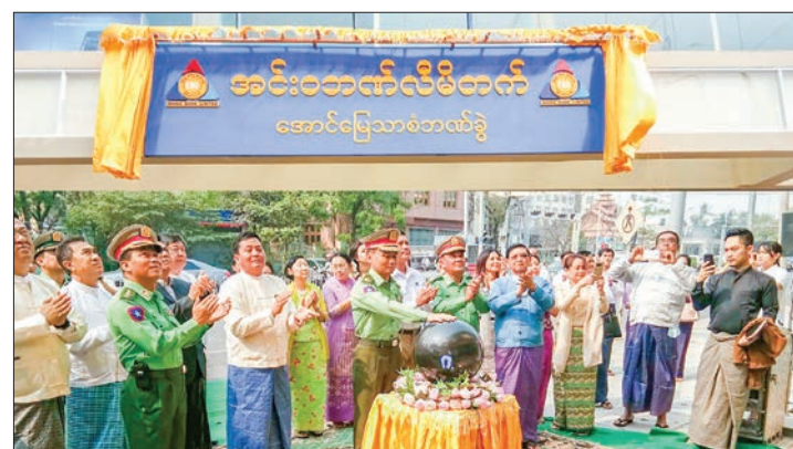
The opening ceremony of Innwa Bank's new branch in Mandalay.

The 48 th Innwa Bank branch is ready to offer financial services for local people and beyond. The bank is located at the first floor of Mandalay Call Center at the corner of 26 th street and 66 th street in Mandalay Region.—Myanmar News Agency ■