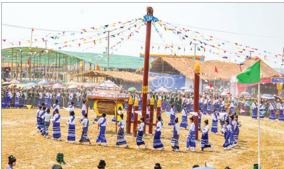
Kadu ethnic women taking part at the ethnic traditional festival.