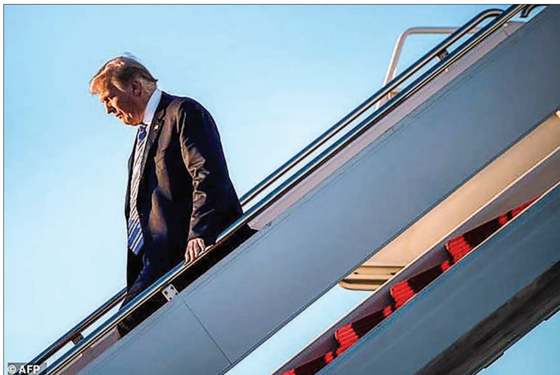
Writing on Twitter on Sunday, Trump denounced any suggestion that he was struggling to attract top legal talent as "fake news".

"Problem is that a new lawyer or law firm will take months to get up to speed (if for no other reason than they can bill more),