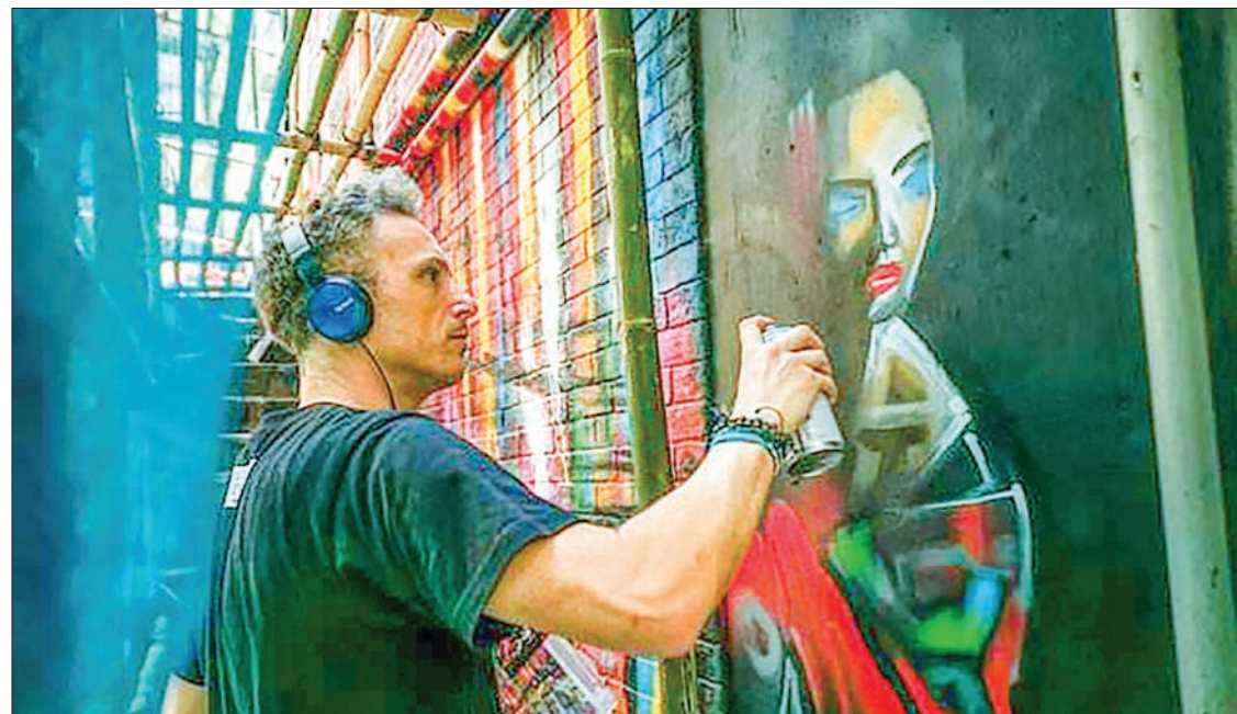
British artist Dan Kitchener made his third visit to Hong Kong this month to depict atmospheric urban scenes with spray paint in its narrow and steep streets.

The popular piece of street art had been destroyed by the city's authorities, infuriating residents, and was later recreated for sale.—AFP ■