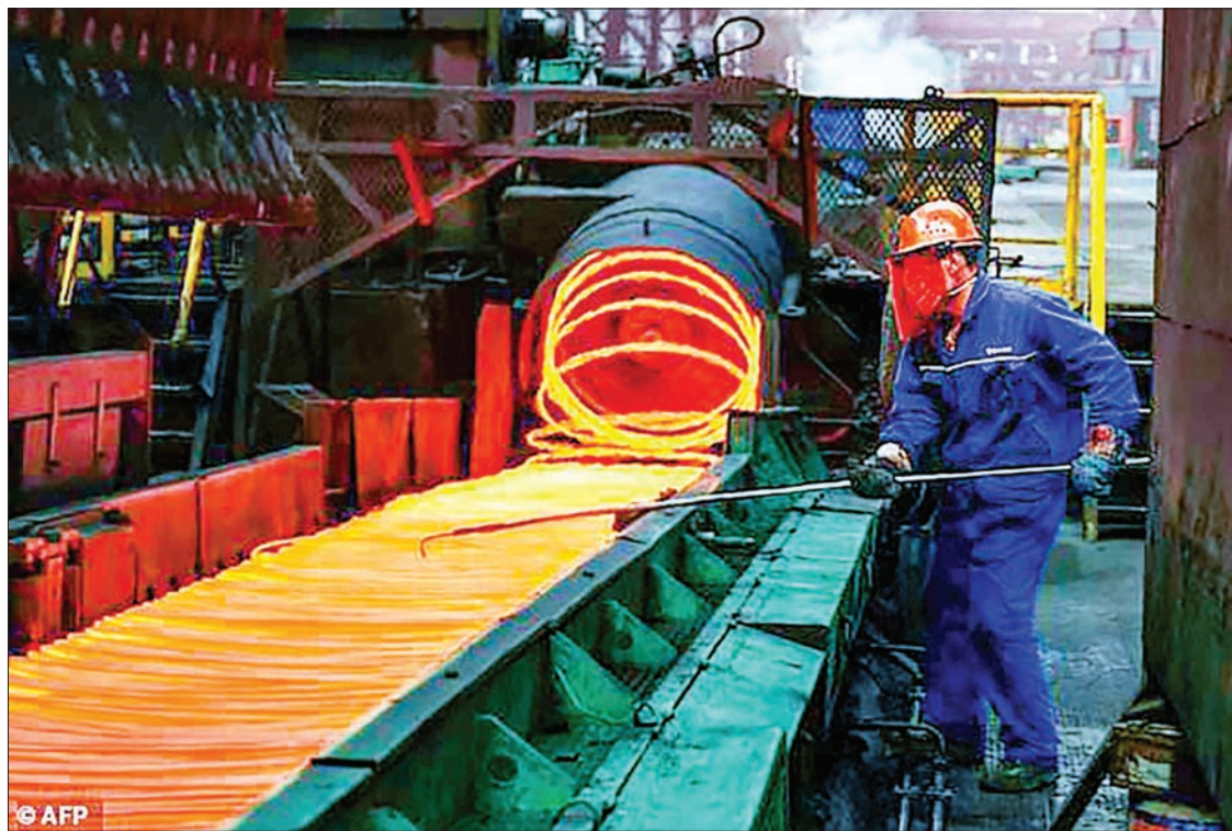
China has unveiled a list of $3 billion worth of US goods, including pork, fruits and wine, that could be targeted with tariffs in retaliation for steel and aluminium tariffs — if negotiations fail.

While the two sides have traded barbs in public, US and