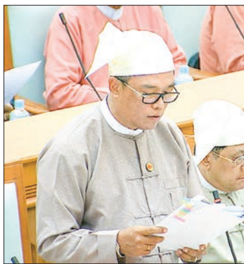
Deputy Minister for Construction U Kyaw Lin.