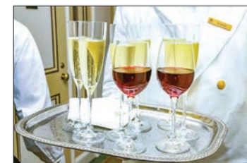
A French waiter fired for being "aggressive, rude and disrespectful" says his behaviour wasn't out of line — he's simply, well, French.