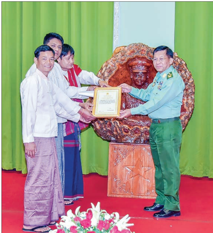
Senior General Min Aung Hlaing gives the certificate of honour to donors.

The wood portrait sculpture was carved from more than a 100-year-old Padauk tree in Myaingyingu area near the Myanmar-Thailand border. The wood was donated by U Saw Hla