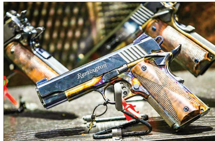
US gunmaker Remington has filed for bankruptcy, as the more than 200-year-old firearms manufacturer vies to restructure its massive debts.

Instead, they got a period of political dominance for the powerful National Rifle Association gun lobby — with Republicans controlling Congress and the White house — that was nonetheless accompanied by financial fragility for gunmakers. The company has also been hit with lawsuits by families of victims of the Sandy Hook school shooting that killed 20 small children and six adults in 2012. The families say 20-year-old killer Adam Lanza would never have been able to carry out his 264-second attack if he had not had access to a high-capacity weapon which had been "specifically engineered" for military use in combat. More than a million Americans flooded streets of cities nationwide on Saturday demanding tighter gun control on Saturday, marches that were spearheaded by teenagers from Parkland who survived the shooting.—AFP ■