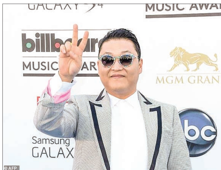
Psy has in the past stripped topless on stage in the South and his lyrics include Korean swearwords.

singer became an international sensation in 2012 when his wacky but catchy "Gangnam Style" mu-