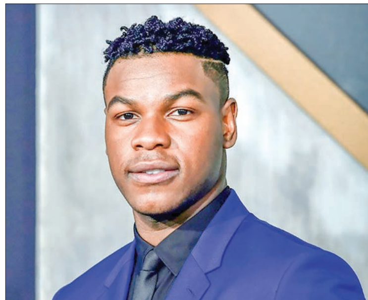
John Boyega attends Universal's "Pacific Rim: Uprising" premiere in Hollywood, California.

The movie, also starring Dominic West and Kristin Scott Thomas, netted an estimated