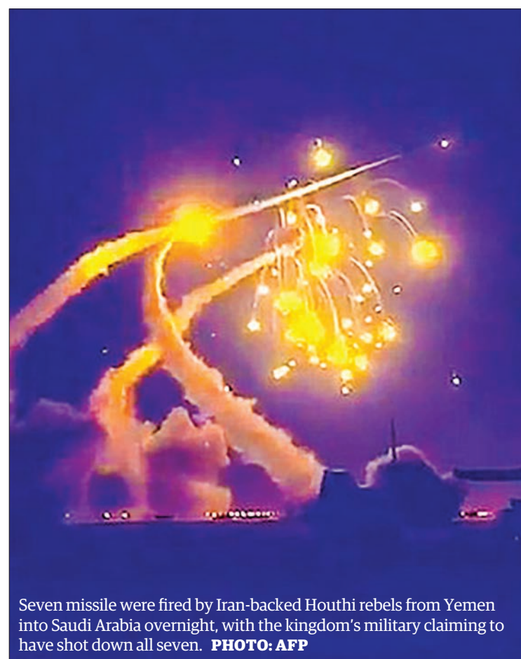
Seven missile were fired by Iran-backed Houthi rebels from Yemen into Saudi Arabia overnight, with the kingdom's military claiming to have shot down all seven.

This prompted a military coalition led by Saudi Arabia to intervene in Yemen on March 26, 2015, to help the government push back the Shiite rebels.—AFP ■