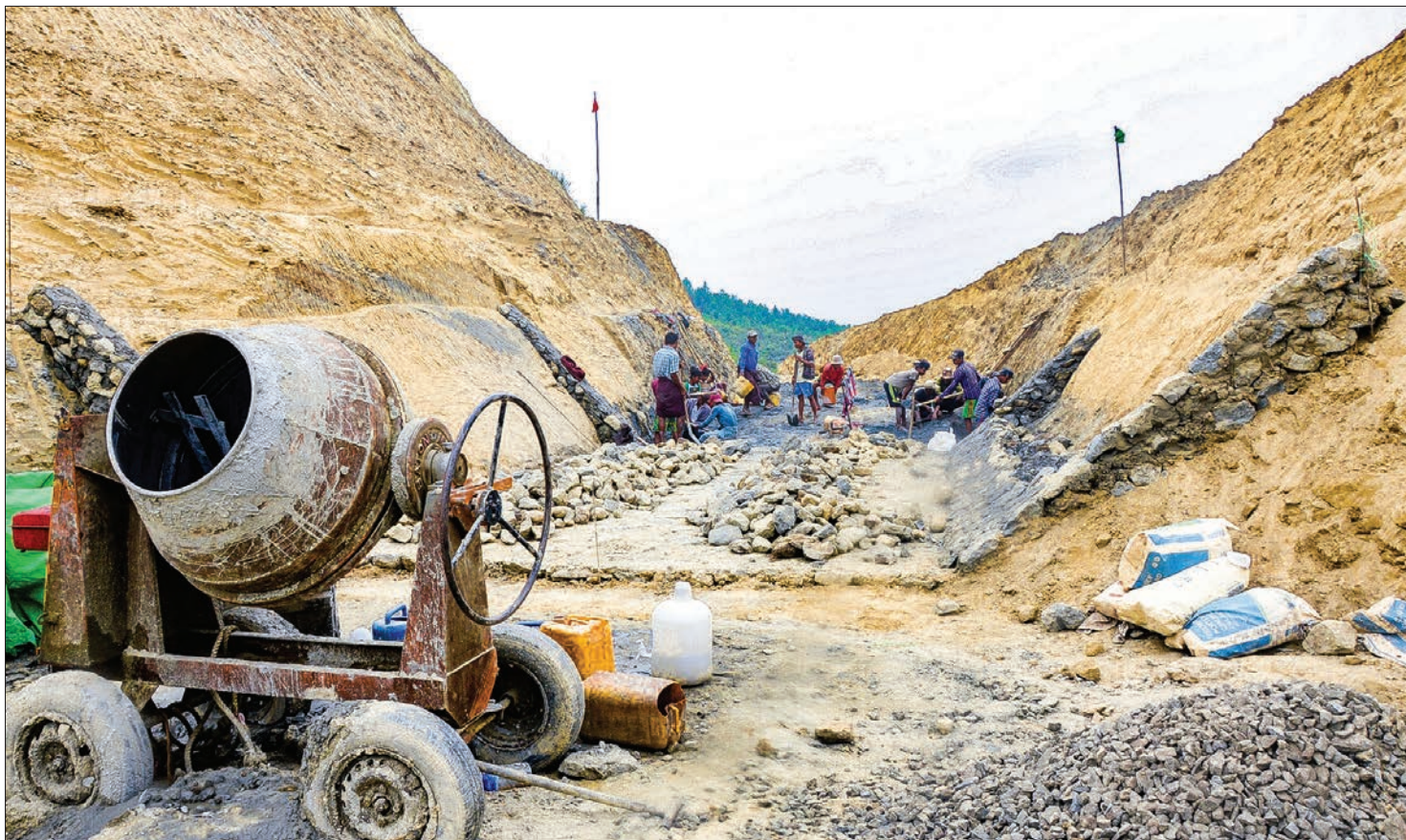
Kainggyi Dam in Maungtau Township, Rakhine State, is expected to complete by April.