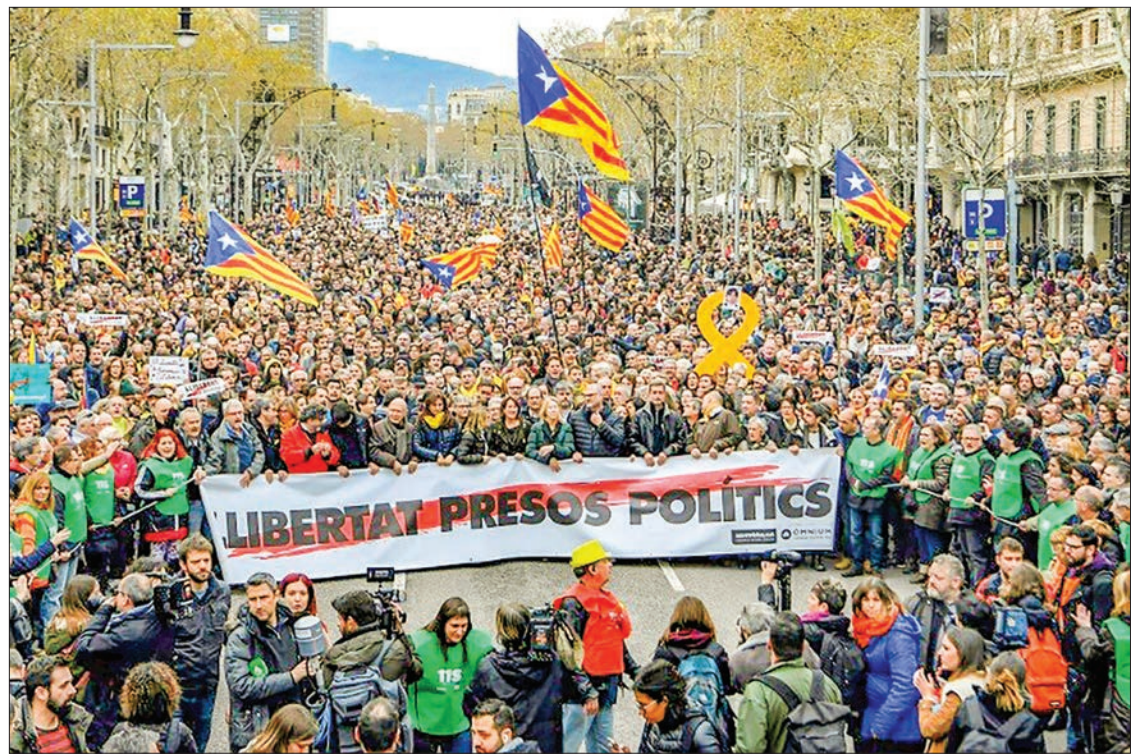
Protesters held a banner reading "Freedom to political prisoners" during a demonstration in Barcelona after Catalonia's former president was arrested in Germany.

"Spain is a democratic state based on the rule of law. The German government is convinced that a solution to the Catalonia conflict has to be found within Spain's legal and constitutional order," he said.