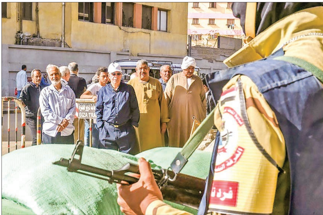
An Egyptian soldier stands guard outside a Cairo polling station as voters prepare to cast ballots in a presidential election on 26 March, 2018.

The Islamic State group’s Egyptian affiliate, which has killed hundreds of soldiers and civilians, has threatened attacks on election infrastructure.