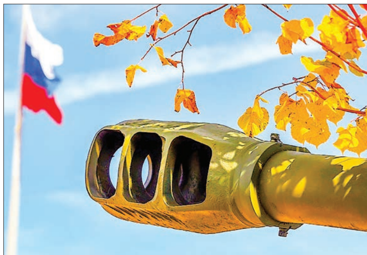
Russians have chosen names for the country's newest weapons by participating in a poll on the Defence Ministry's website.

While separatist parties won Catalonia's regional elections in December called by Madrid, they have been unable to elect a president and form a government as they have picked candidates who are now either in exile, in jail or facing prosecution. After Puigdemont was forced to withdraw his bid for the presidency as he could not return to Spain without facing arrest, another pro-independence leader Jordi Sanchez followed suit when a judge refused to let him out of jail to be sworn in. The third candidate, Turull, was placed in custody on Friday.—AFP ■