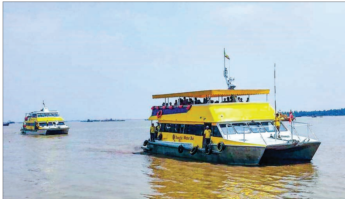
Yangon water buses are moving along the Yangon River in Yangon.

lunch box, coffee and bottled water, is Ks6,000 for a local traveller and US$15 for a foreign traveller.