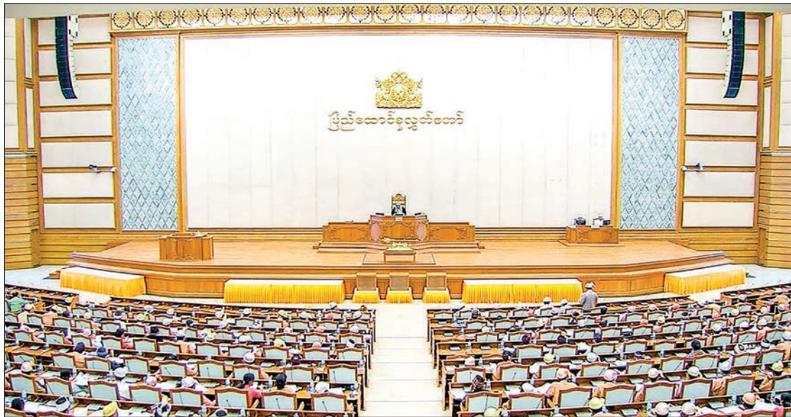
Pyidaungsu Hluttaw is being convened in Nay Pyi Taw.

According to the Yangon City Development Project, the development of Yangon is to be expanded northward. South Korea is also planning an industrial zone and a green city in the vicinity of the Yangon-Bawnetkyi road. Thaton-Hpa An-Myawady can be assessed through the Yangon-Bawnetkyi road. There-