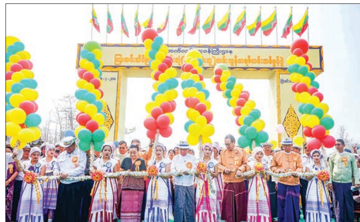
Union Minister for Construction U Han Zaw attends the opening ceremony of the new concrete road section in Kyain Seikgyi Township.

The 40 mile and 5 furlong long newly inaugurated road was 18 ft wide and 8 inches thick and was constructed at a cost of more than Ks. 12 billion from the state budget in the fiscal year 2017-2018. The road connecting Kyain Seikgyi Township and Phayathonezu Town linking with Thanbyu-zayet-Phayathonezu Road and Mudon-Myawady Road plays a crucial role in Kayin State. As peace and stability is restored in Kayin State, the road becomes an important corridor for the development of the economy, trade and the social interaction between