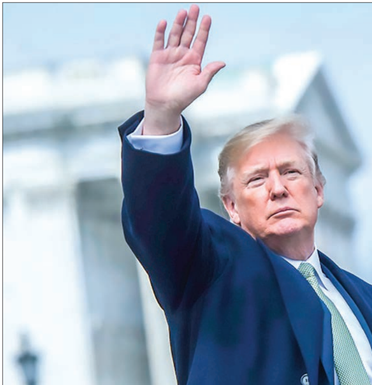
US President Donald Trump .

they give you life, they give you the death penalty. These people [who sell drugs] can kill 2,000, 3,000 people and nothing happens to them,” he said.