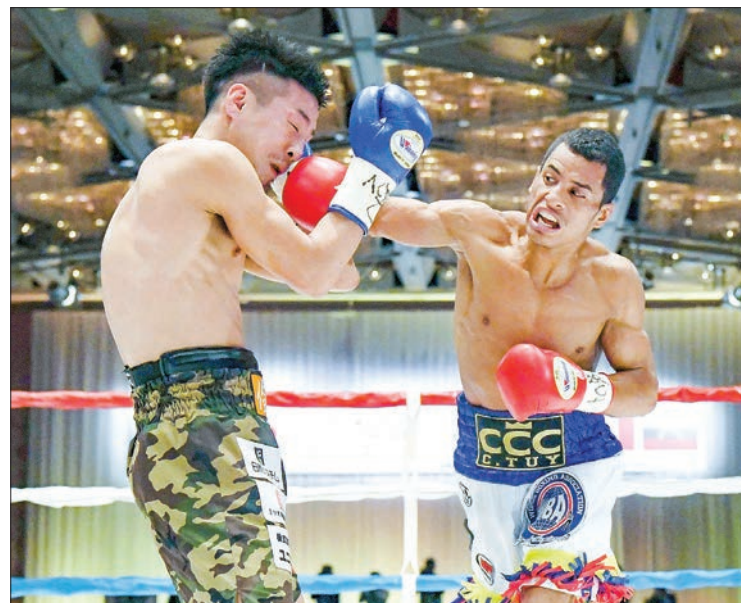
Japan's Reiya Konishi (L) takes a punch from Venezuela's Carlos Canizales in their fight for the WBA vacant light flyweight title in Kobe on 18 March, 2018.

Fighting for the WBA's vacant light flyweight title, Konishi,