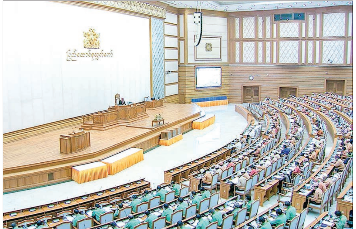
Yesterday's Pyidaungsu Hluttaw discusses procuring loans and income taxes of private businesses.