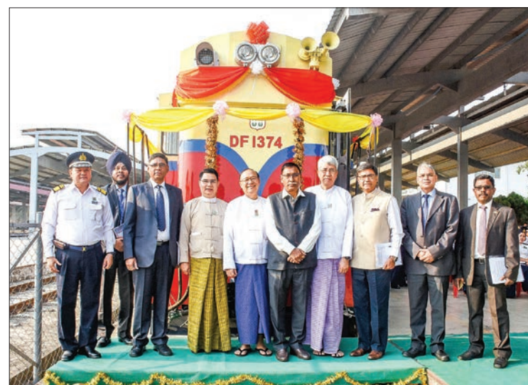
Officials from Myanma Railways and India's railway ministry pose in front of YDM-4 locomotive.