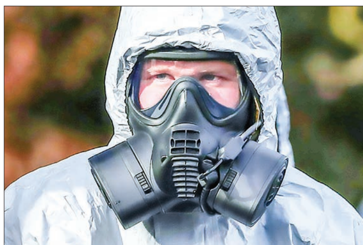
Since the poisoning, the English city of Salisbury has been filled with investigators garbed in protective equipment.

“And Porton Down, as we now all know, is the largest military facility in the UK that has been dealing with chemical weapons research — and it’s actually only eight miles from Salisbury,” Johnson called the accusation “satirical”, adding it was “not the response of a country that really believes itself to be innocent.”—AFP ■