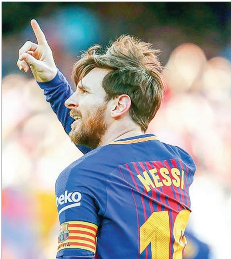
Masterful Lionel Messi.

A dominant start from Barca yielded the opening goal after just eight minutes as Messi found Jordi Alba out on the left, his pull back neatly side-footed into the far corner by Paco Al-