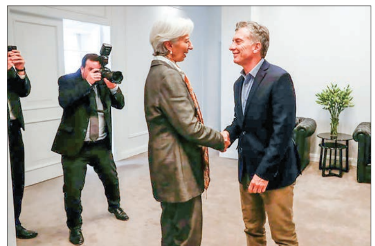
Argentina's President Mauricio Macri (R) meets with IMF Managing Director Christine Lagarde at Olivos presidential residence in Olivos, Buenos Aires on 16 March, 2018.

But the European Union has threatened retaliatory tariffs on US goods unless it is exempted. South Korea also