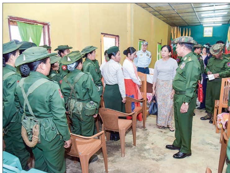
Senior General Min Aung Hlaing greeting with Tatmadaw members and attendees.

In December 2017, the KIA armed group attacked the cantonment headquarters but were repulsed by officers, troops and families, who defended the headquarters courageously. A ceremony to hoist and install a diamond bud, vane and golden umbrella atop the Thousand Yahanda Shin Pin Myat Pagoda on Shwemoe Mountain, Mainar Village, Waingmaw Township, Kachin State, was held yesterday morning.