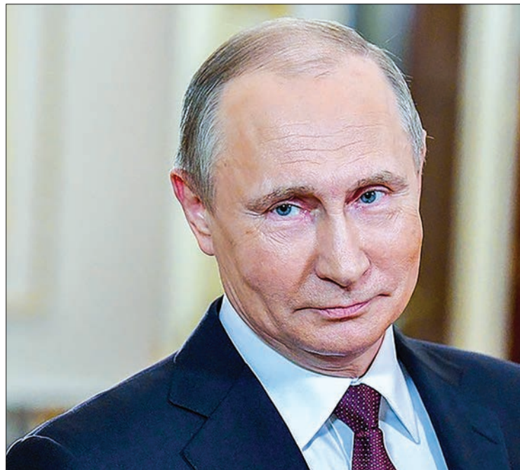
Vladimir Putin.

After the results proving Putin's election win were announced, he addressed a concert rally dubbed Russia. Sevastopol. Crimea, which was taking place at Manezhnaya Square in downtown Moscow,