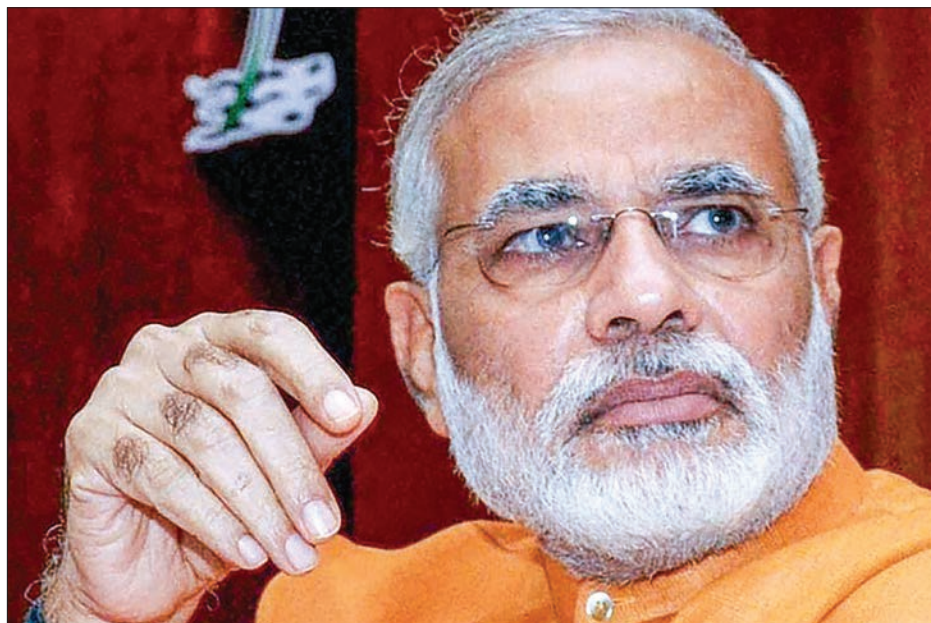
Prime Minister Narendra Modi.

Peace, unity and harmony is at core of various philosophies in the country, Sufism is also one of them. When we talk of