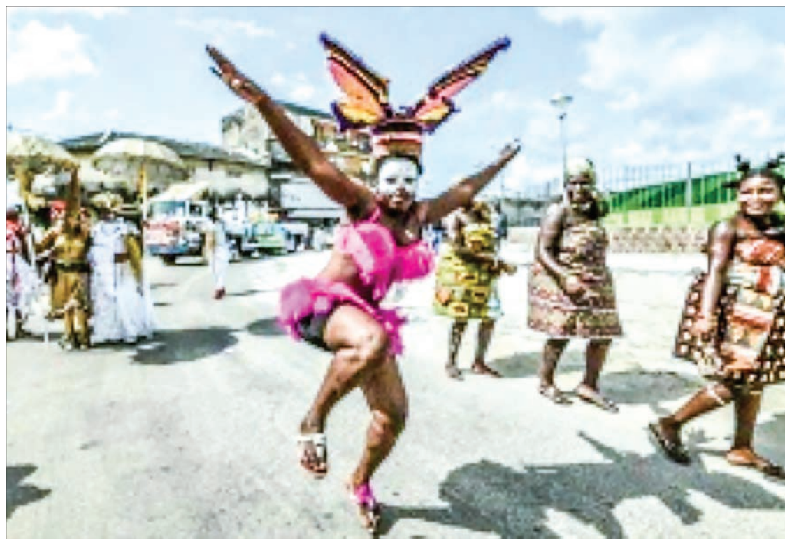
Story-telling had top-billing this week at the 10th edition of the biannual Market for African Performing Arts. A thousand artists from over 50 countries gathered in Ivory coast for a week-long festival.

“Every family has stories similar to mine in which my father was a Muslim before becoming