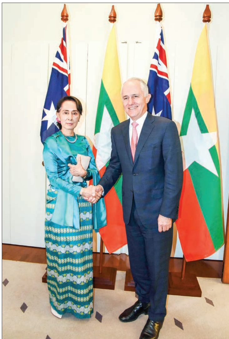
State Counsellor Daw Aung San Suu Kyi is welcomed by Australian Prime Minister Malcolm Turnbull in the Australian Parliament.

Later that night, Union Minister for the Office of the Union Government U Thaung Tun, and Union Minister for International Cooperation U Kyaw Tin attended a dinner hosted by Aust-Cham (Australia Chamber of Commerce) member companies, which are investing in the various sectors in Myanmar, at the Hyatt Hotel. At the event, the Union Ministers explained about Myanmar's political and socio-economic development and then answered questions posed by Australian companies —Myanmar News Agency ■