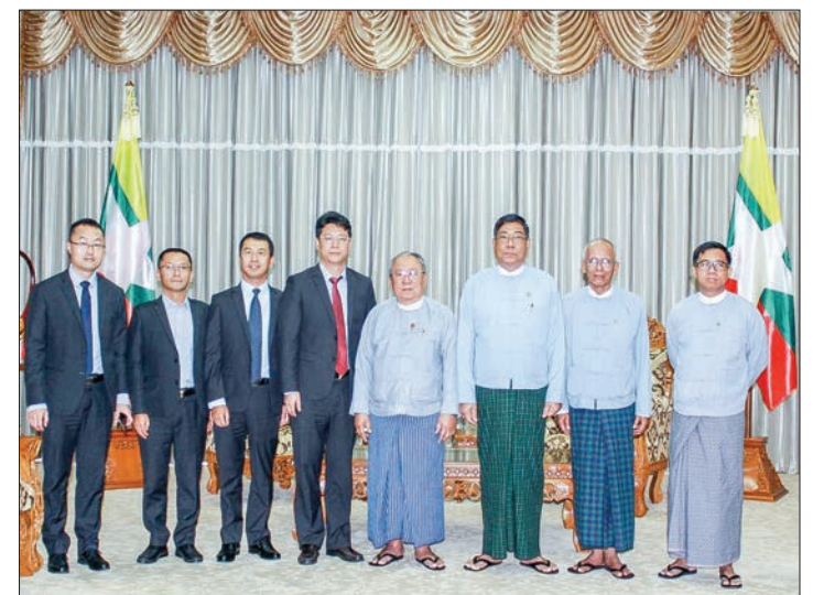
Central Bank of Myanmar Governor U Kyaw Kyaw Maung poses for the documentary photo together with ICBC Yangon Branch CEO He Bi Qing in Nay Pyi Taw.

Yangon Branch, the work done in 2017 and its progress, the works conducted to strengthen the AML/CFT, cooperation with private banks in Myanmar and clearing of cross border accounts with the RMB were discussed. Also present at the meeting were deputy governors U Soe Min, U Soe Thein and U Bo Bo Nge. — Myanmar News Agency ■