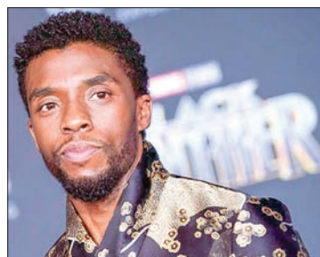
Chadwick Boseman, seen here in a file photo from January, plays the titular superhero in ‘Black Panther,’ which is continuing to dominate in North American theaters.

“Black Panther,” starring Chadwick Boseman as the superhero king of a utopian African country, has almost singlehandedly kept the year’s box office total slightly above the same period last year. It is only days away from overtaking another Marvel film, “The Avengers,” as the all-time