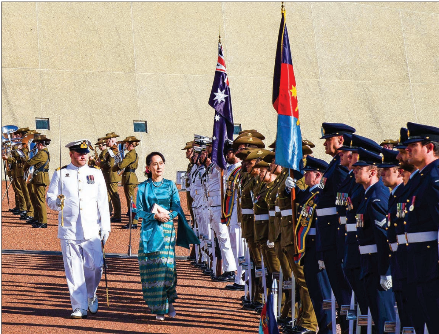
State Counsellor Daw Aung San Suu Kyi inspects the Honour Guard as she arrives in Canberra, Australia.