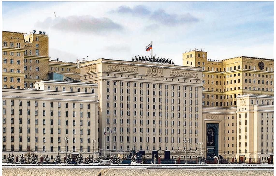
Russia's Defence Ministry.

According to unofficial data, the tests of the "object 4202" had been held since 2004 at the