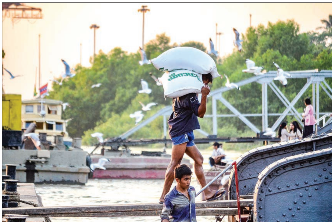
A labourer unloading rice from a ship at Botahtaung Jetty.

Ethnic entrepreneurs will execute the businesses with the help of related state and regional entrepreneurs’ associations, UMFCCI and the officials concerned. ■