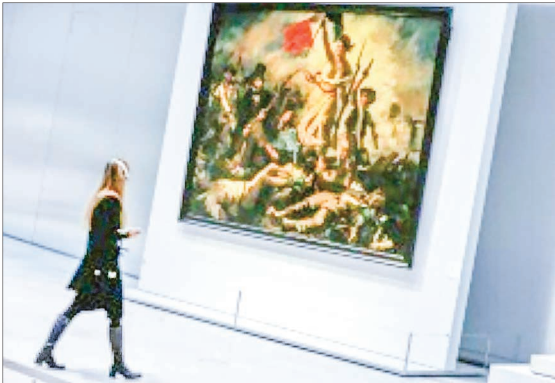
Eugene Delacroix's famous painting, "Liberty Leading the People", was temporarily banned on Facebook because it depicts a bare-breasted woman.

Delacroix's subject who brandishes a French flag in the painting is not just any woman — she's Marianne, a national