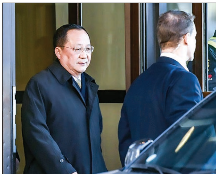
North Korean Foreign Minister Ri Yong Ho leaves a Swedish government building in Stockholm on March 16, where the issue of three Americans held in the North was raised, according to reports.

The negotiation was held through the North's mission to