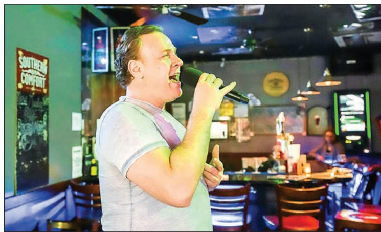
Operatic baritone Lucas Meachem is one of opera's rising stars, recently completing a stint as a male lead in "La Boheme" at New York's Metropolitan Opera.

"There's a lot of life imitating art in that opera for me personally." —AFP ■