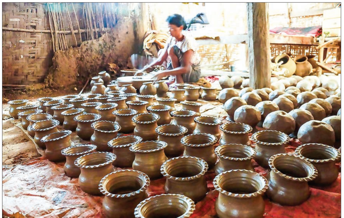
A woman prepares for making earthen pot.

During these days, hand-made earthen pots produced from the village are in high demand in the domestic mar-