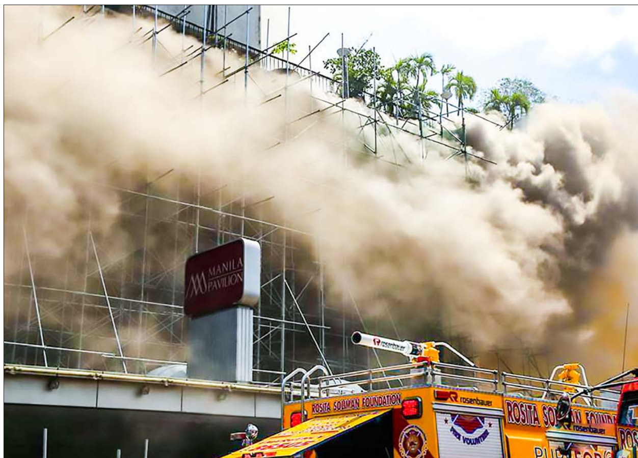
Smoke rises from Pavilion Hotel and Casino in Manila, the Philippines on 18 March 2018. A fire broke out Sunday morning at the hotel in Manila, the Bureau of Fire Protection said.