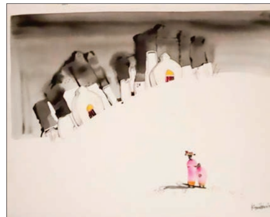
Works by artist Kyaw Thu Win.