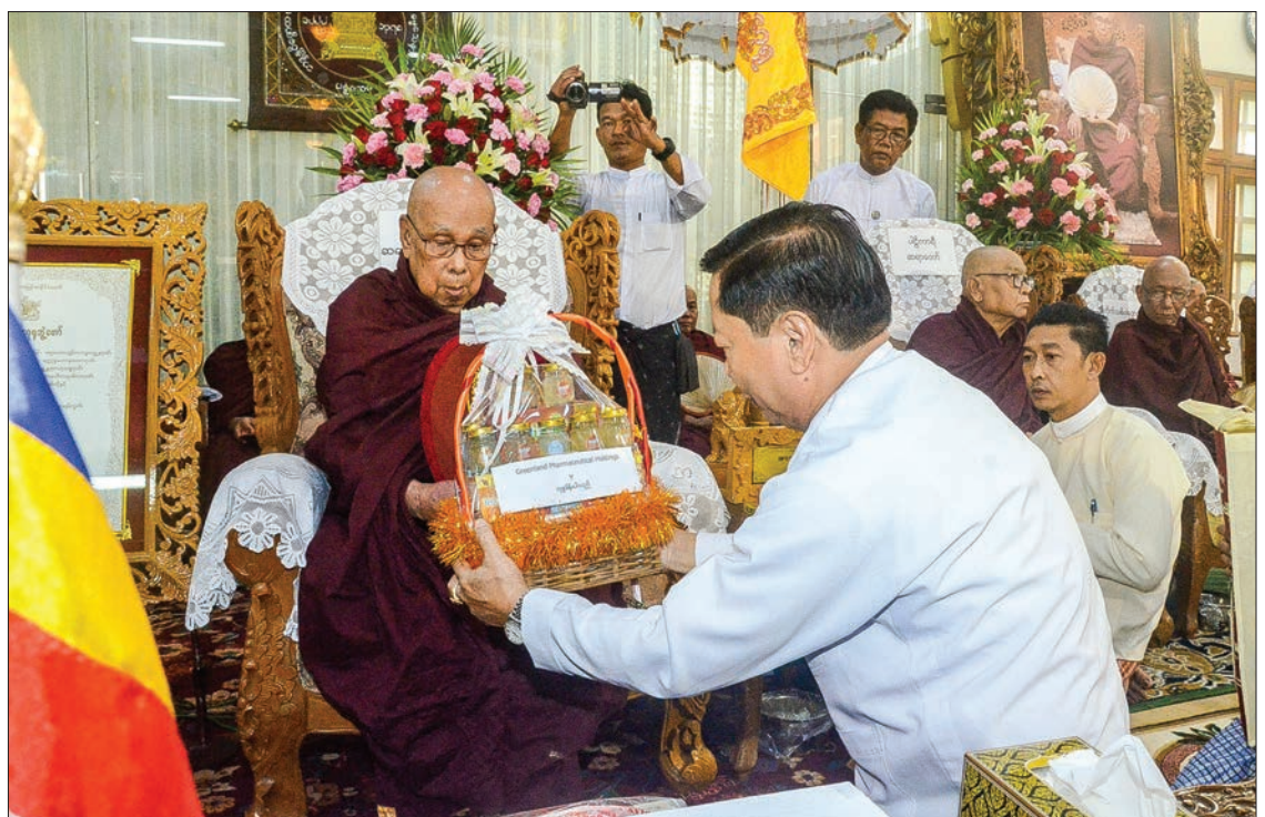
Union Minister Thura U Aung Ko offers donations to Sayadaw Bhaddanta Vijjota in a Yangon monastery.