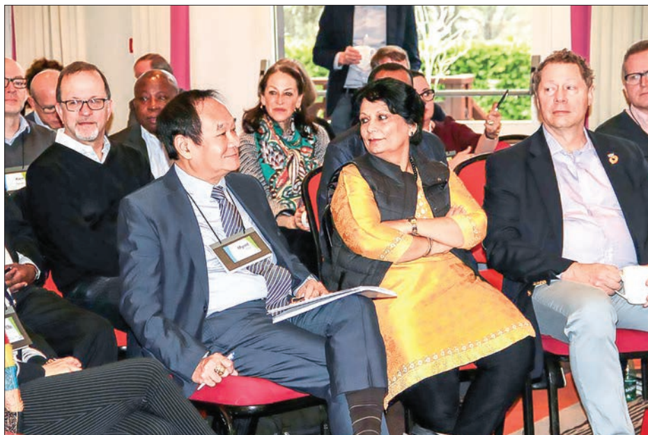
Union Minister for Health and Sports Dr. Myint Htwe at the Vaccine Alliance Board Retreat Meeting in France.

At the meeting the Union Minister discussed provision of effective aids of vaccinations along with effective management to developing countries from the Gavi, the strategic thinking over 5-year plan of the Gavi to solve the difficulties and requirements from the develop-