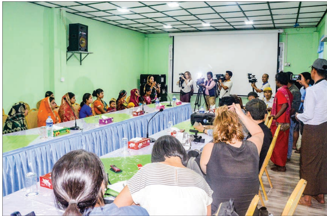
Hindu women, left, answering to questions from local and foreign media about their escape from ARSA terrorists who abducted them to Bangladesh.

The terrorists ordered us to discard our clothes and wear those worn by women of their faith. They then took us to Bangladesh. We reached the other bank at about 11 a.m. the next day. We faced torture and insults from the women of their faith in the other country. To stop them from harassing us, we told