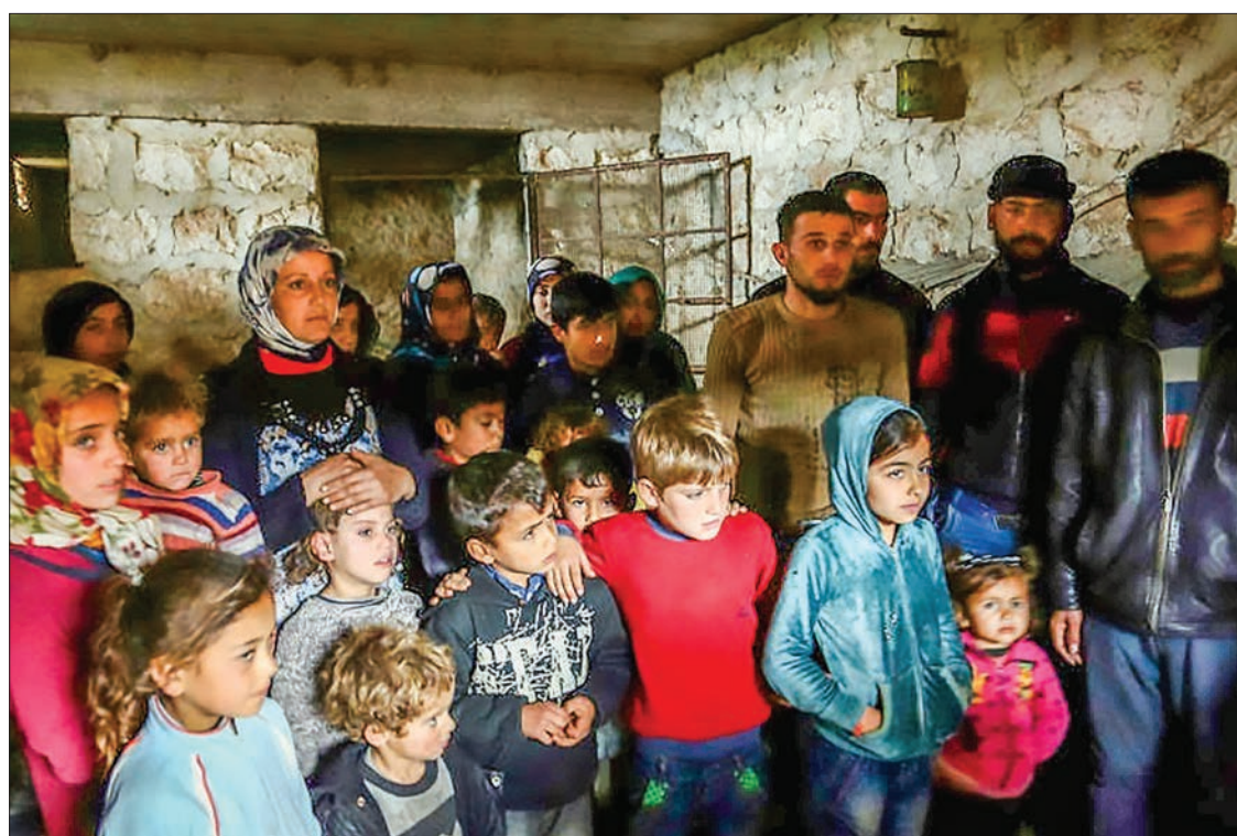
People shelter in a cellar in the village of Qastal Koshk, north of Afrin, as Turkish-backed forces clash with Kurdish fighters on 16 March 2018.

Civilians hiding in basements could hear fighting out-