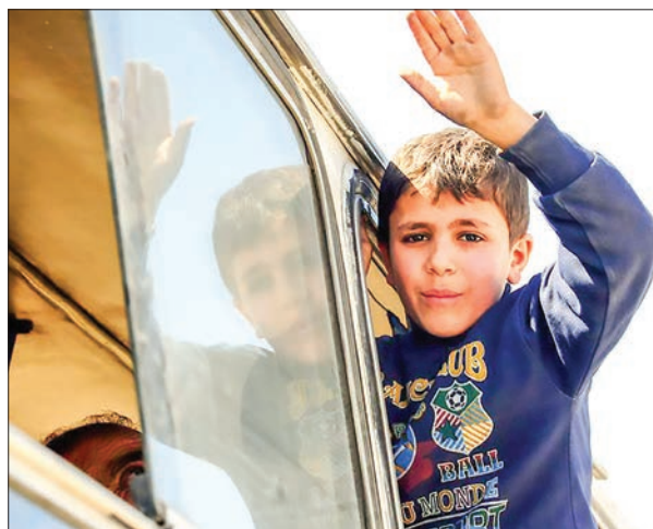
A boy waves as he waits to be transferred to a safe shelter from Hamouriyyeh area in Eastern Ghouta of Damascus, Syria, on 17 March 2018. As many as 30,000 civilians evacuated from rebel-held areas in the Syrian capital Damascus' Eastern Ghouta area on Saturday, state news agency SANA reported.

The UN humanitarian agencies have sounded the alarm about the worsening humanitarian situation for 400,000 people in that region, where activists said around 1,000 people have been killed since late last month by the heavy bombardment and military showdown. — Xinhua ■