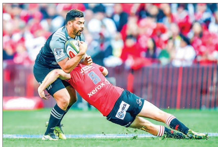
Canterbury Crusaders have been hamstrung by an alarming injury toll which has put seven All Blacks out of action including Richie Mo'unga with a broken jaw.

The most successful franchise in Super Rugby history have been hamstrung by an alarming injury toll which has put seven All Blacks out of ac-