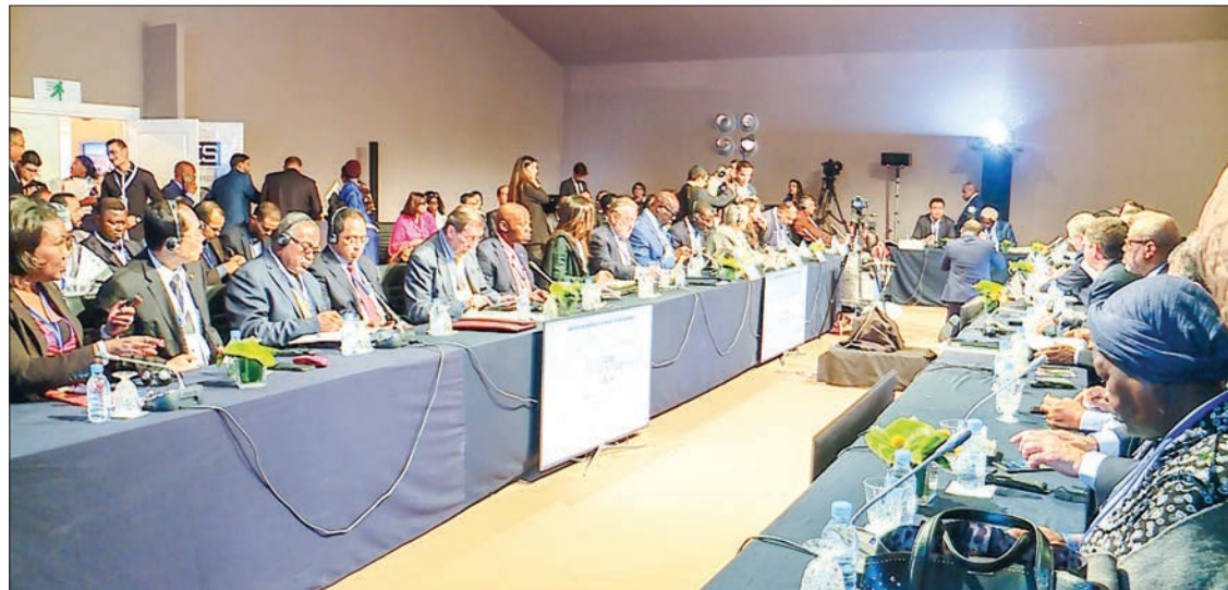
The Crans Montana Forum on Africa and South-South Cooperation in Dakhla, Morocco.

DEPUTY Minister for Planning and Finance U Set Aung attended the Crans Montana Forum on Africa and South-South Cooperation in Dakhla, Morocco, on 17 March.