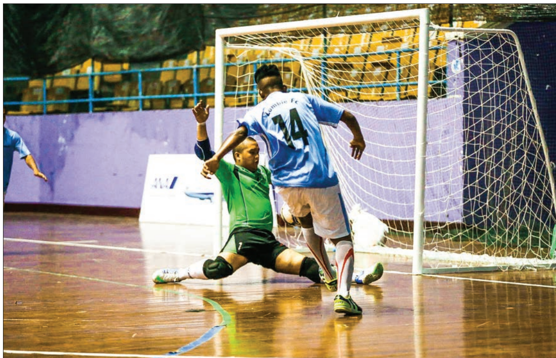
A Player from Zombie Futsal team kicks the ball into the net in yesterday's Futsal tourney at Thuwunna National Indoor Stadium.