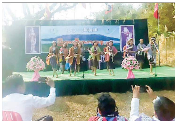
Mro ethnic youths entertained the audiences with the performances.