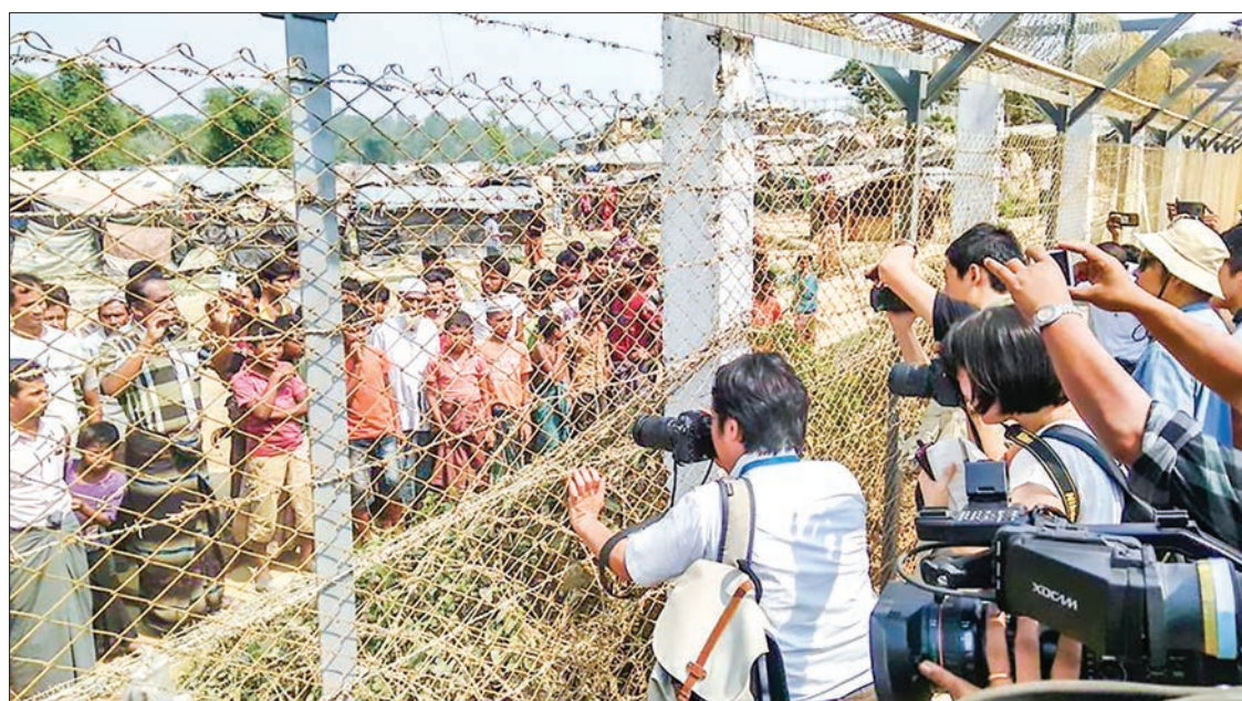
Local and foreign reporters interacting with people at the border in Rakhine State.

Then, they also met with people living at Myanmar-Bangladesh border area and inter-