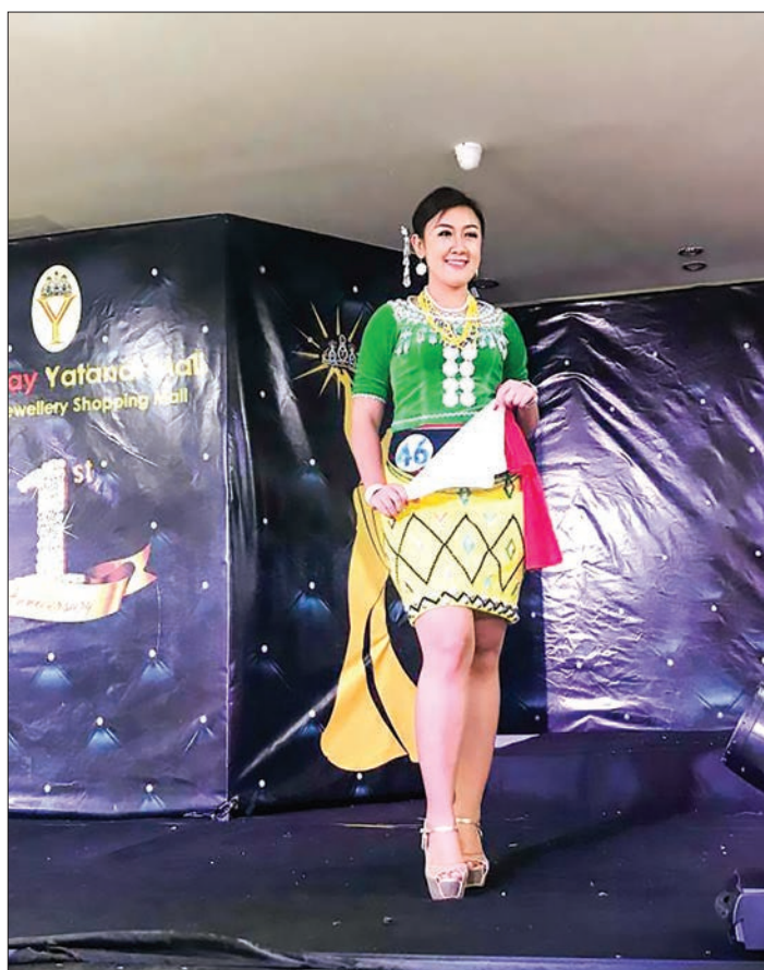
A lady dress in the ethnic costume on the stage at the Jewelry Trade Fair and Miss Competition in Mandalay.

AN event of Jewelry Trade Fair and Miss Competition, marking the first anniversary of Mandalay Yatanar Mall was held on Saturday evening at the second floor, promotion areas of Yadanarbon Super Centre, Mandalay.