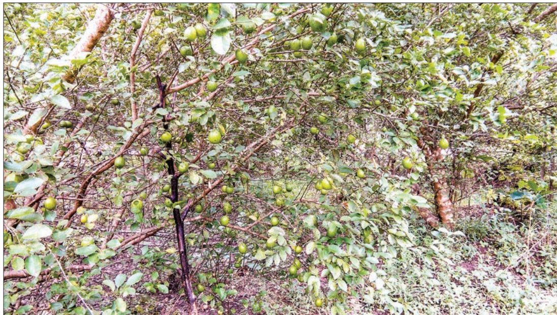
Lime trees see with lime.