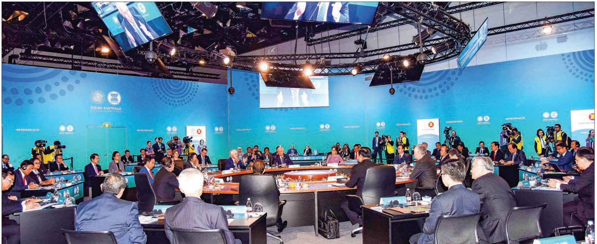
State Counsellor Daw Aung San Suu Kyi attends the ASEAN-Australia summit.