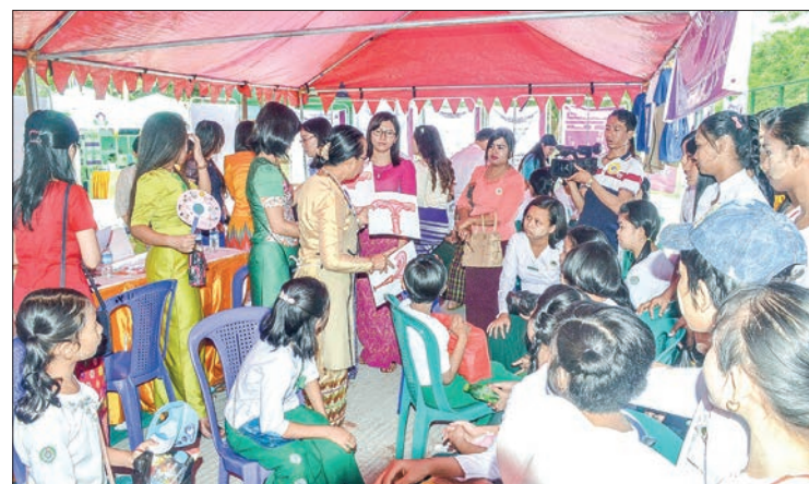
Attendants at the 2018 International Women’s Day ceremony in People’s Park in Yangon yesterday.

At noon, the Ministry of Health and Sports gave educational talks on health and held musical shows to entertain the various orphanage groups. — Myanmar News Agency ■