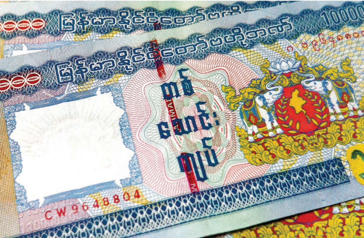
Myanmar's ten thousand kyat notes.

Further, clients benefit from appropriately designed products and services, when coupled with respectable treatment of clients and data privacy. When financial service providers inspire confidence among their clients, they gain institutional resiliency, and can grow, while contributing to overall financial inclusion and economic development of the country.