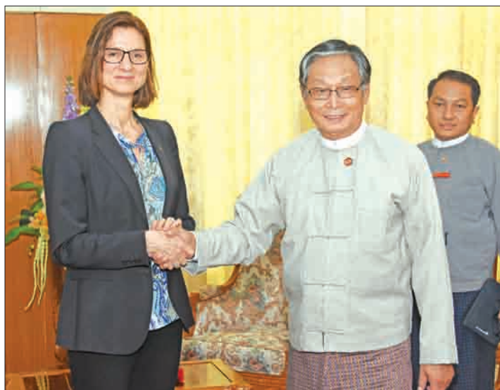
Union Minister for the Office of the State Counsellor U Kyaw Tint Swe welcomes Ms Marianne Hagen, Norwegian State Secretary of Foreign Affairs, yesterday in Nay Pyi Taw.

UNION Minister for the Office of the State Counsellor U Kyaw Tint Swe received Ms Marianne Hagen, Norwegian State Secretary of Foreign Affairs, yesterday at the meeting hall of the State Counsellor's Office in Nay Pyi Taw. During the meeting, they exchanged views and discussed Rakhine State affairs, the peace process and humanitarian assistance.—Myanmar News Agency ■