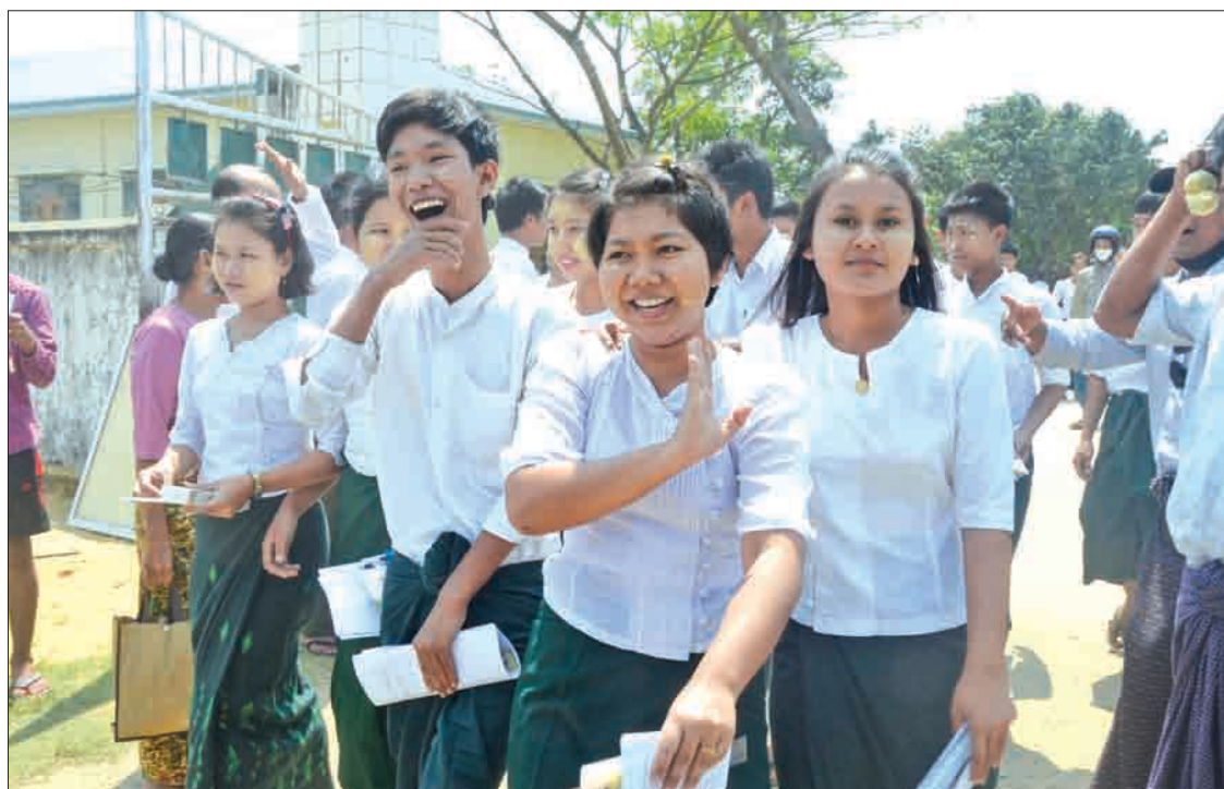
Students return home after sitting for the matriculation examination in Maungtau, Rakhine.