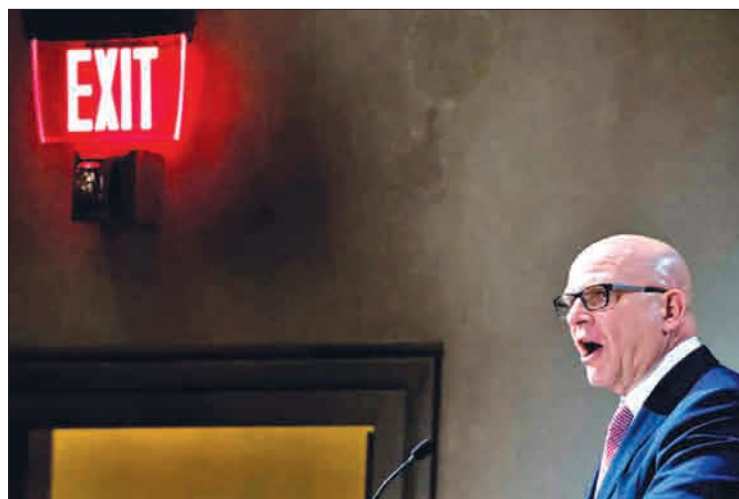
The Washington Post reports that President Donald Trump has decided to fire White House National Security Adviser H.R. McMaster.

The Post said that some in the White House were hesitant