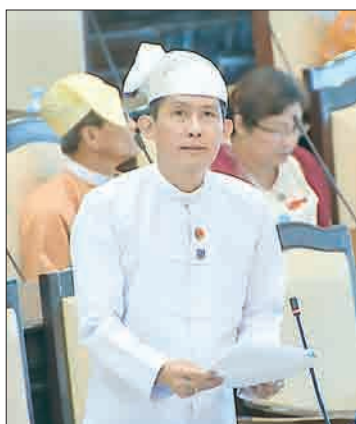
Deputy Minister for Electricity and Energy Dr. Tun Naing.

The funds for the construction of the Kalay-Tamu power line