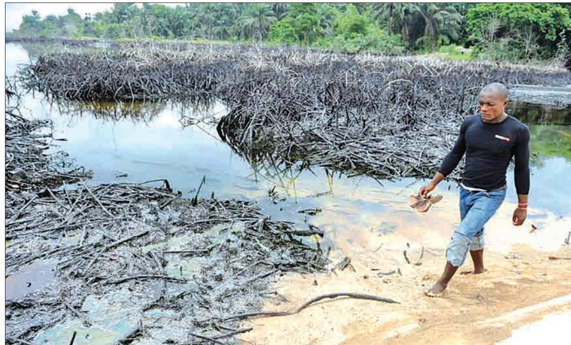
The Nigerian region of Ogoniland has experienced a spike in oil spills in recent years.

Activists who pored over reports found that since Shell began publishing details in January 2011, it had 1,010 spills amounting to 110,535 barrels or 17.5 million