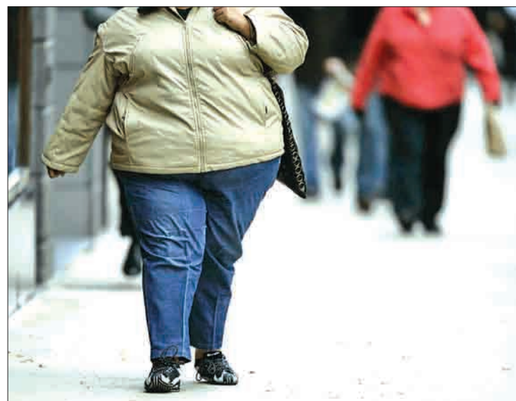
European Heart Journal study says being overweight or obese poses a risk of heart disease.

"Furthermore, the risk also increases steadily the more fat a person carries around their waist," said a press statement summarising the findings.—AFP ■