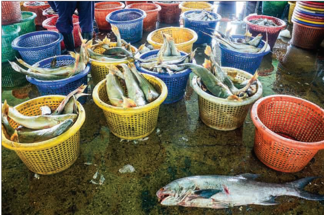
A worker selects fish at the Nyaungtan Jetty in Yangon.