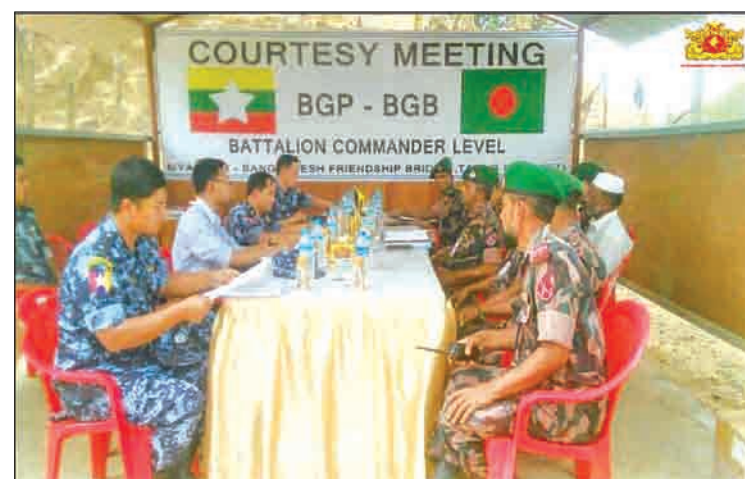
The meeting between two border guard forces of Myanmar and Bangladesh.

At the meeting, matters relating to movement and activities of the Arakan Rohingya Salvation Army (ARSA) extremist terrorist group, an ethnic Mro national from Myanmar wounded by a landmine between mile post 55/56 on the