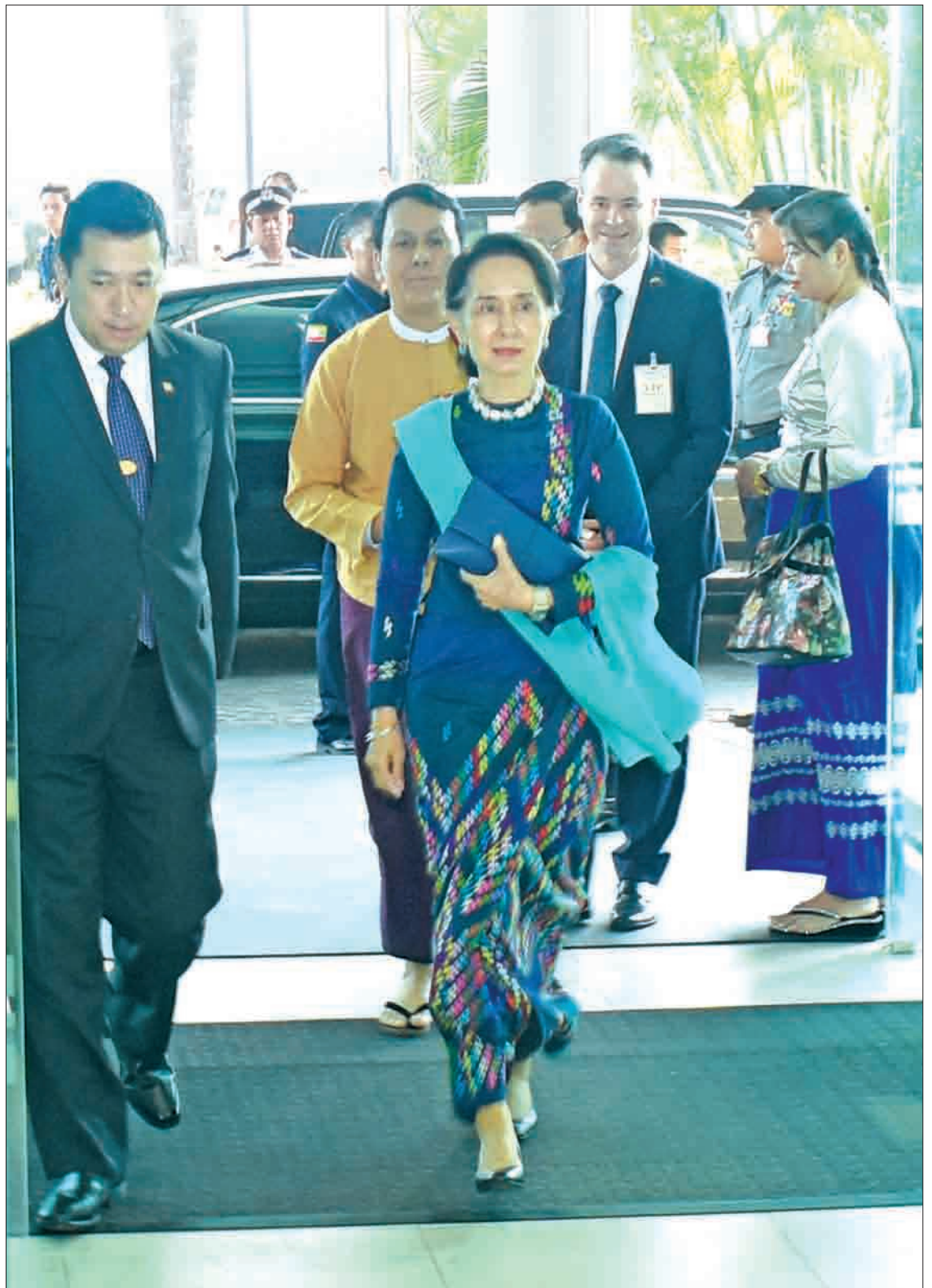
State Counsellor Daw Aung San Suu Kyi arrives at Yangon International Airport on her way to Sydney yesterday to pay an official visit and to attend the ASEAN-Australia Special Summit.

State Counsellor Daw Aung San Suu Kyi is accompanied by Union Minister for International Cooperation U Kyaw Tin and departmental officials.—MNA ■