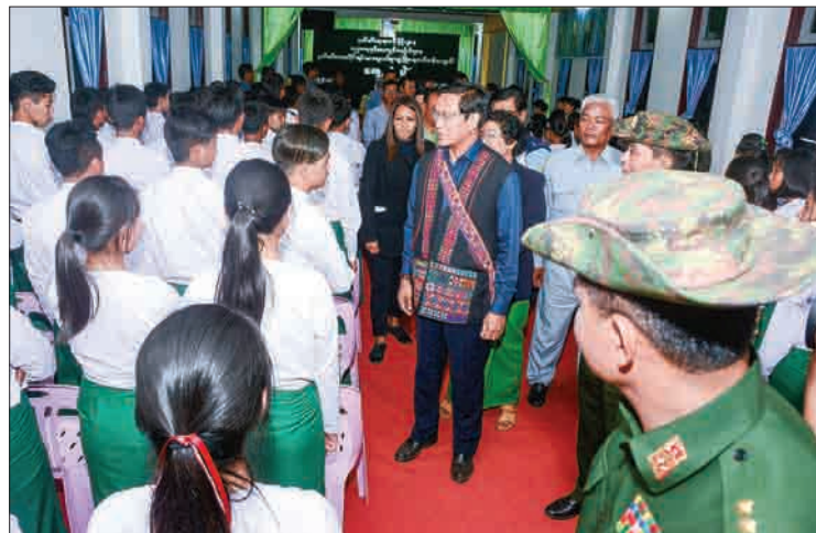
Vice President U Henry Van Thio meets youths of border area ethnic national development training school in Kengtung.