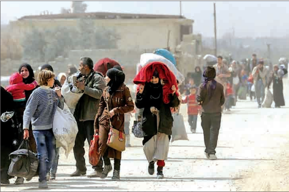
Syrians fleeing rebel-held Eastern Ghouta arrive at a regime checkpoint on the outskirts of Damascus on 15 March 2018.

Eastern Ghouta had been the main rebel bastion on the outskirts of Damas-