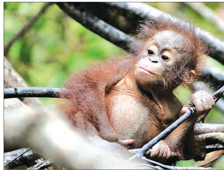
Orangutans in Borneo are just one of the world’s many threatened species as Earth faces a biodiversity crisis.

The reports are not prescriptive, but “we hope that this will help inform policy decisions to stem the loss of biodiversity and the fundamental services it