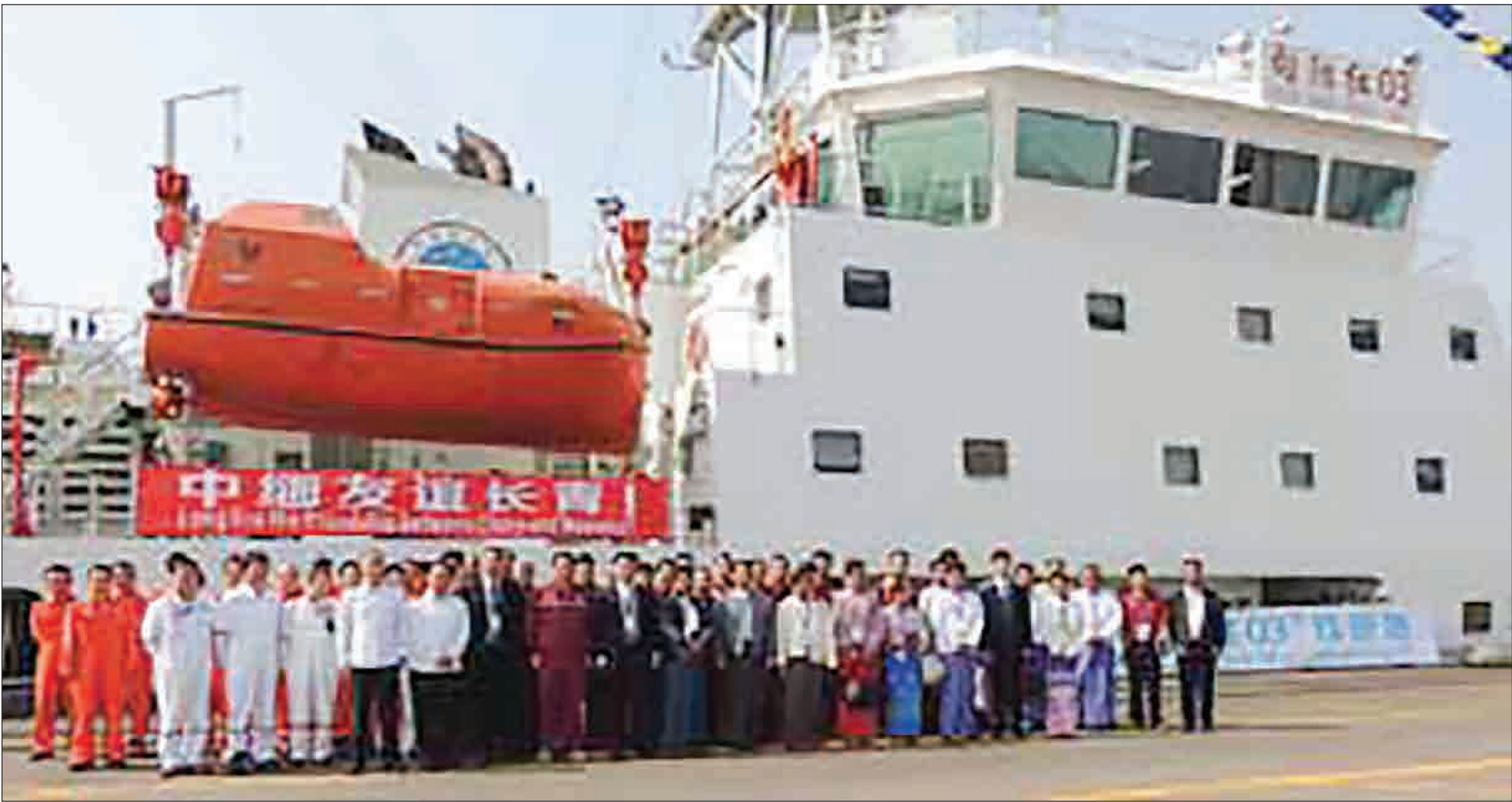
Officials takes a documentary photo in front of the Xiang Yang Hong 03 Ship.

ed. It boils down to three basics: food, water and a livable habitat. The ocean is responsible for a stable climate that provides a livable habitat. Water vapor from evaporation provides the precipitation that allows food to grow and water to drink. From the ocean currents to weather patterns and the climate, the ocean is indispensable to life in the water or on land. The ocean is at the foundation of the natural capital that supports life on Earth. Today the oceans in the world are under threat and the global ocean is largely without laws or international protections. It is being depleted, polluted and staked out by nations laying claim to marine resources. High tides and storm surges riding on ever-higher seas are more dangerous to people and coastal infrastructure. Natural protections against damaging storm surges are increasingly threatened. Myanmar geography Myanmar is bordered by