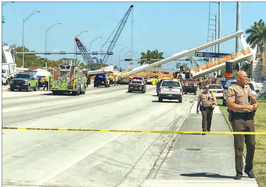
Police block a road near a newly installed pedestrian bridge that collapsed in Miami.

"Miami-Dade county and our partner agencies... have been working feverishly in the search and rescue mode to ascertain how many victims there