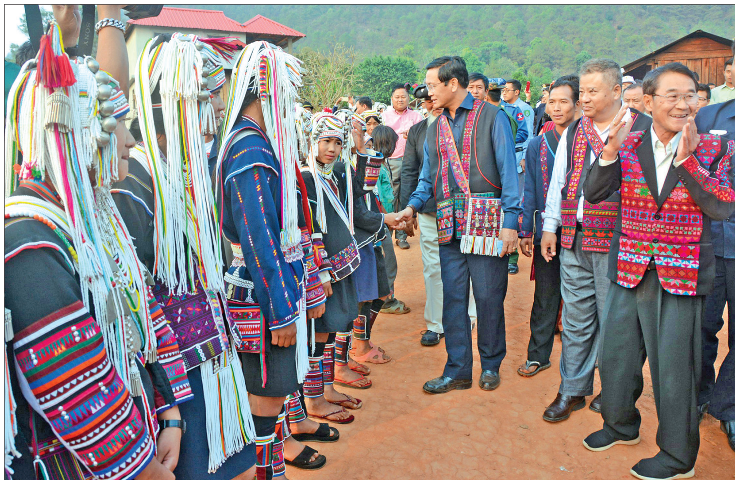
Vice President U Henry Van Thio is welcomed by Akha ethnic women as he arrives in Hokyin Village (Akha village).

The Vice President and party then went to Tachilek town public service one stop shop and inspected the services provided to the public. The Vice President provided cash support to the staff on duty and then toured the Myanmar-Thailand Friendship