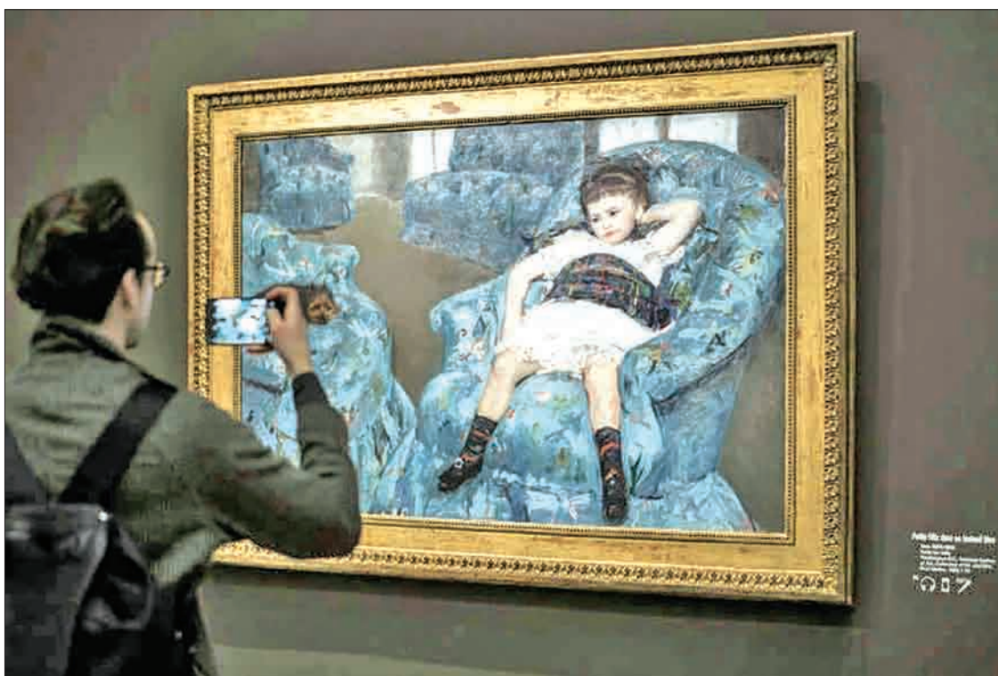
The first major retrospective of Mary Cassatt's work in Paris is at the Musee Jacquemart-Andre.

And when men patronised her, Cassatt loved proving them wrong -- producing some of the best prints of the period when others claimed that Japanese woodblock prints could not be matched in the West.