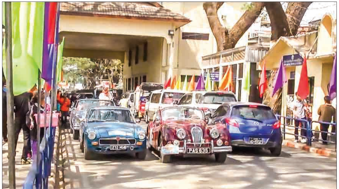
Tourists are visiting Myanmar by old fashioned vehicles near a cross-border gateway.

Their travel itinerary was arranged by Essence of Myanmar Travels and Tours Co.,Ltd, under the supervision of the Ministry of Hotels and Tourism. Their trip started on 20 February and ended 28 Feb-