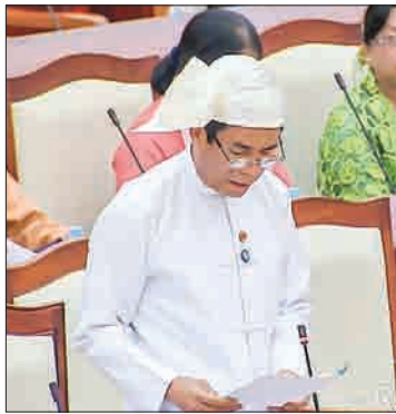
Deputy Minister for Information U Aung Hla Tun.

The organisational structure of the university has been redrawn, and once this is approved, new subjects that can help create job opportunities and develop the socio-economic conditions of the people will be introduced. Also, the university's cooperation with foreign universities will be expanded. At the moment, memorandums of