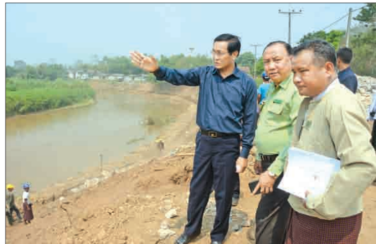
Vice President U Henry Van Thio inspects works to prevent the bank erosion of Maehoung Creek.