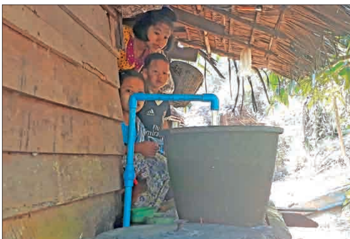
Water supply system is installed in villages in Rakhine.

More than Ks205 million was spent on 52 water facilities including sinking tube wells and lake upgrades in the 2017-2018 fiscal year. More than Ks240 million funded by the State were spent on building 44 water facilities in the same fiscal year.—Kyaw Thu Htet ■