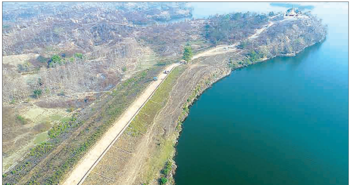
The successfully upgraded Taung Nyo dam in Nattalin Township, Bago Region supplies water to farmlands.