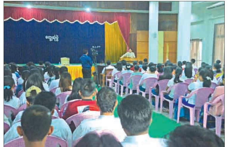
Union Minister for Information Dr. Pe Myint addresses the meeting with employees from newspaper houses under the News and Periodicals Enterprise in Nay Pyi Taw.

Deputy Minister U Aung Hla Tun said technology is advancing in the world and digital media and online media need to be established. Sooner or later, digital transformation and practices need to be done. However, print media is in existence to date and it can be expected to be around for a certain amount of time. State-owned newspapers should exist as the people's newspaper and deliver information the government want to provide and people would like to know. Efforts must be made to use technology to distribute and provide better information. Those working in the newsroom need to know the depth of the news, usages in the title or heading, colors to use and