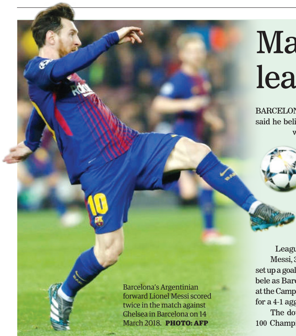
Barcelona's Argentinian forward Lionel Messi scored twice in the match against Chelsea in Barcelona on 14 March 2018.

"Obviously on both matches I regret the posts or bars that we could have. You have to have some success, a little luck," Giroud said.—AFP ■