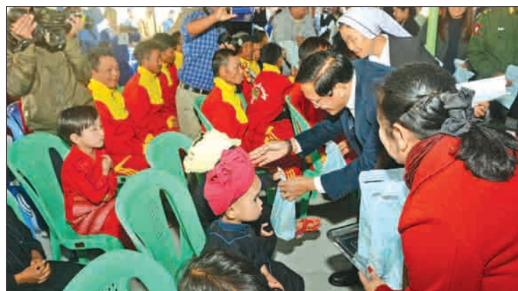
Vice President U Henry Van Thio visits the home for the disabled and developmentally challenged children in Taunggyi.

Myanmar saw a record export of rice in the 2017-2018 year, with 3.2 million tons of rice, the