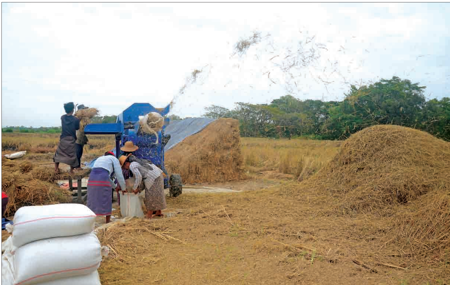
Farmers thresh crops using an automated machine. Not many farmlands have access to modern technology meaning farmers cannot keep up with the high demand for rice in Myanmar and Southeast Asia.

value of US$ 2.332 billion. Up to 2 March 2018 Myanmar exported over 500,000 tons of marine products valued at US$ 634 million. It could export about 60000 more tons than the previous fiscal, earning US$ 114 million more. The main items are over 350,000 tons of fishery products valued at US$ 360 million, over 18,000 tons of prawns valued at US$ 67 million, over 18,000 tons of crabs valued at US$ 69 million, over 9000 tons of eels valued at US$ 28 million, and about 100,000 tons of other marine products valued at US$ 108 million. This fiscal year's rise in the marine exports came alongside the surge in livestock products. This fiscal saw livestock product exports reaching over US$ 44 million, which is US$ 35 million more than the previous fiscal. The rise in the livestock exports is a result of the ministry's announcement released on 9-10-2017. The announcement permits buffalo and cow owners to export their goods through legal channel with the aim of replacing the illegal trade with legal trade, ensuring income generation for