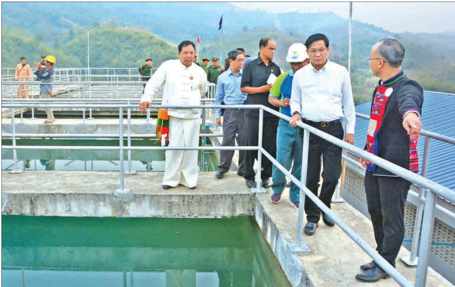
Vice President U Henry Van Thio, second from right, inspects a water supply system in Tachilek, Shan State yesterday.