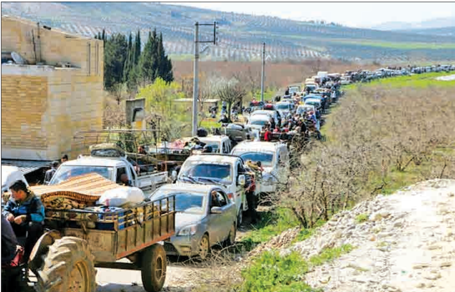
Civilians have fled Afrin city in recent days as battles rage between Turkish-backed forces and Kurdish fighters.

BEIRUT — Syria’s lacerating conflict entered its eighth year Thursday with the country riven by international power struggles, as Turkey encircled a besieged northern Kurdish enclave, while Russian-backed regime forces pounded into shrinking rebel areas near Damascus. The bloodshed, which has devastated huge swathes of the country since it started on 15 March, 2011 when the government of President Bashar al-Assad cracked down on mostly peaceful protests, has splintered into ever more complicated conflicts. In the latest fighting, Ankara-backed forces launched a bombardment of Afrin and closed in on the main city, in an offensive that could redraw the map in northern Syria. The development came as regime forces, backed by Moscow, broke into a key town in the beleaguered rebel enclave of Eastern Ghouta late Wednesday, driving further into the last opposition bastion outside Damascus.