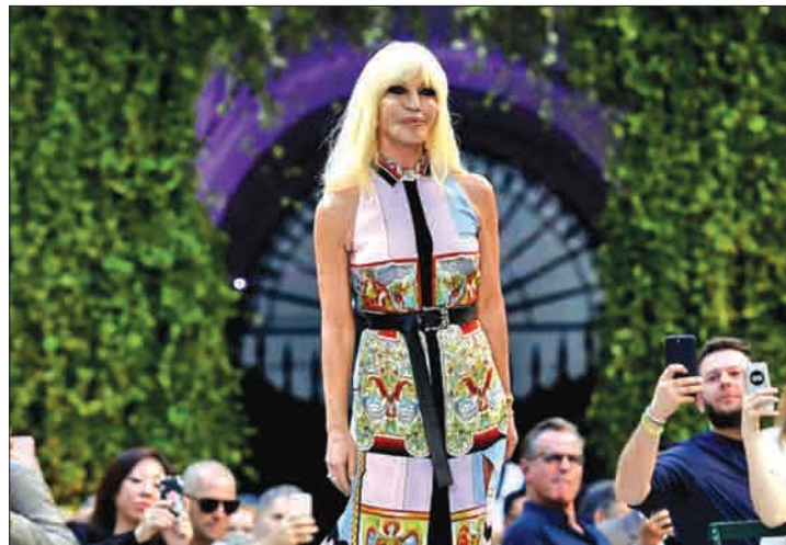
Designer Donatella Versace greets the audience at the end of the show for fashion house Versace during the Men's Spring/Summer 2018 fashion shows in Milan, on 17 June 2017.

Versace had previously resisted pressure to join a host of other fashion brands, including Armani, Calvin Klein, Hugo Boss and Ralph Lauren which had all already ditched furs from their collections. The luxury label has