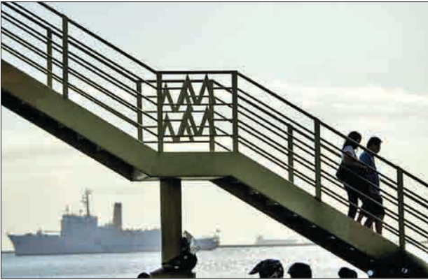
Surveys show a majority of Filipinos have backed legalising divorce since 2014.

The bill has been propelled forward by Alvarez, who is speaker in the lower