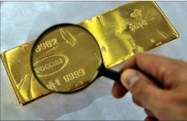
An An-12 cargo plane carrying some 9 tonnes of gold has lost a third of its cargo during takeoff.

The airport's press service said that technicians who were preparing the plane for takeoff could have failed to properly fix the gold cargo. The plane safely landed at an airfield in the village of Magan, 12 kilometers from Yakutsk. — Tass ■