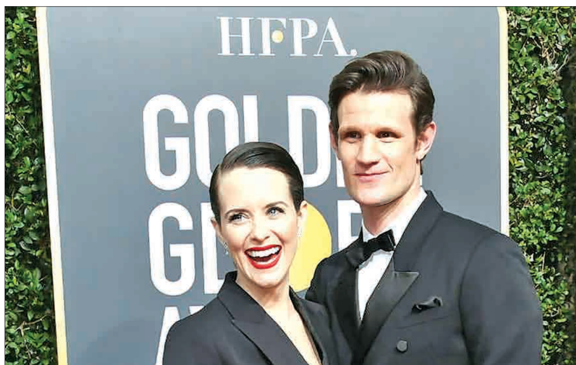
Producers of “The Crown” admitted that Matt Smith, Prince Philip on the hit Netflix drama, had negotiated a better deal than Claire Foy -- the star of the show as Queen Elizabeth II.

Oscar-nominated “All the Money in the World” hit the headlines in January when Mark Wahlberg and Michelle Williams were called back to reshoot scenes expunging Kevin Spacey, who was sacked over