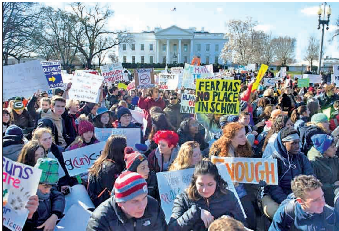
Thousands of students sat for 17 minutes outside the White House in honor of the victims of last month's high school shooting in Florida.

The House of Representatives voted 407-10 to fund violence prevention measures at schools including boosting security, mental health screening and