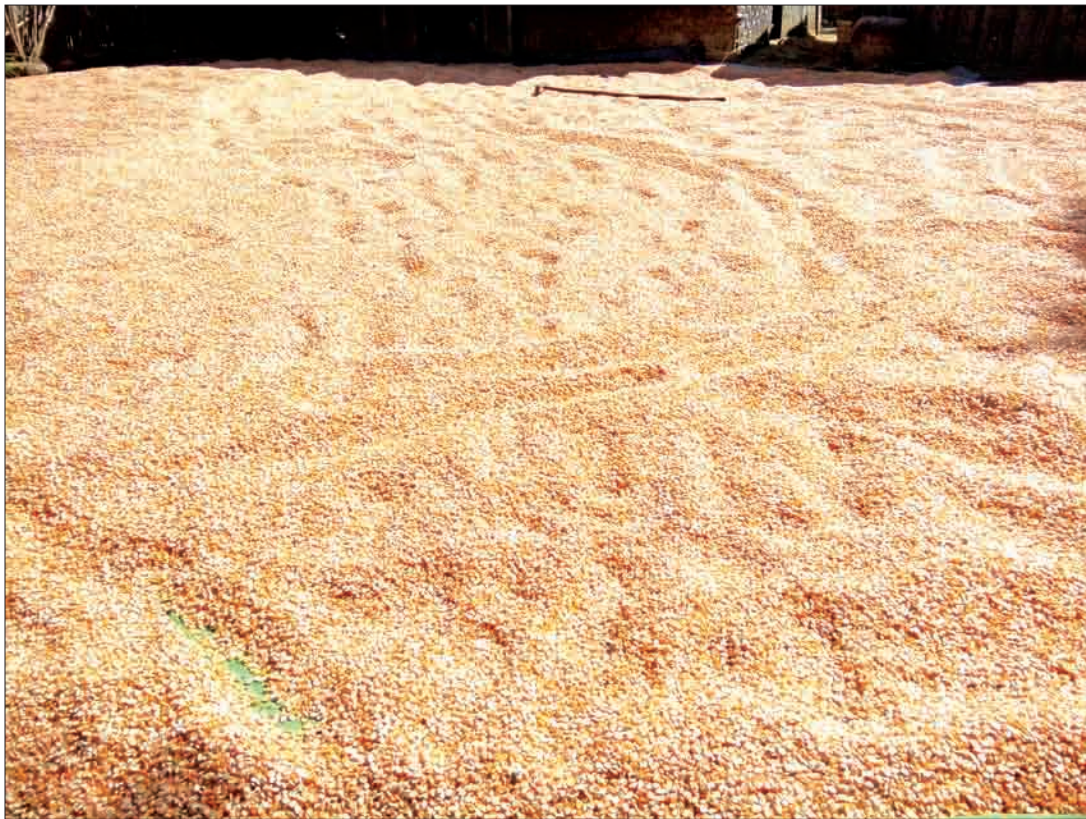
A storehouse for a huge supply of hybrid corn will have difficulty entering the market as prices rise due to low production.