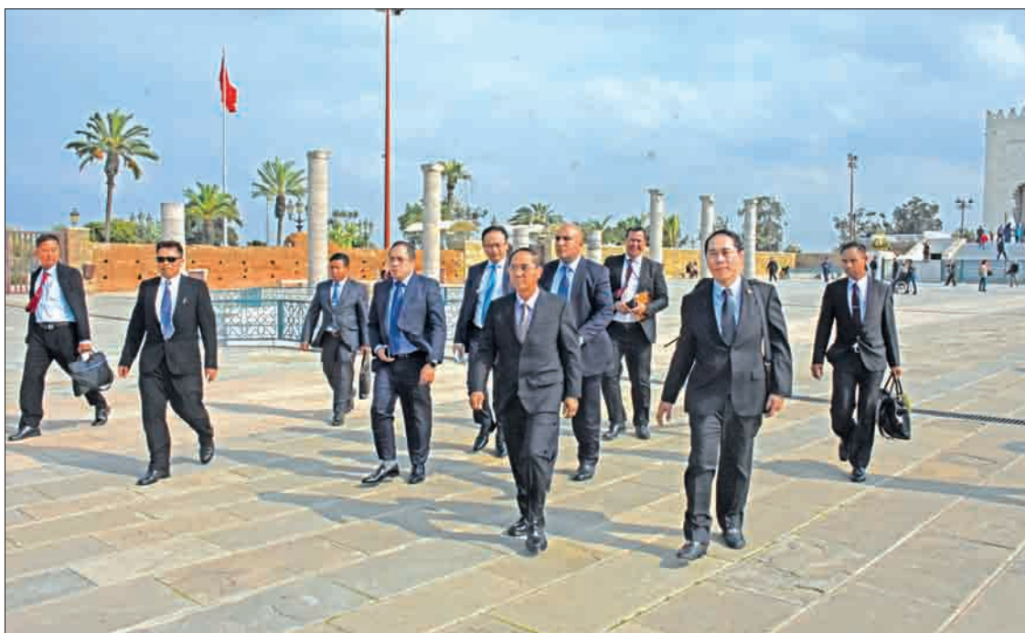
Vice President U Myint Swe visits the Museum of King Hassan II in the capital city of Rabat in Morocco yesterday.

The Vice President and his entourage then arrived at Bateau Hotel on the cruise ship, Rhapsody. The second part of the Crans Montana Forum on Africa and South-South Cooperation will be held onboard the cruise ship.—Myanmar News Agency ■