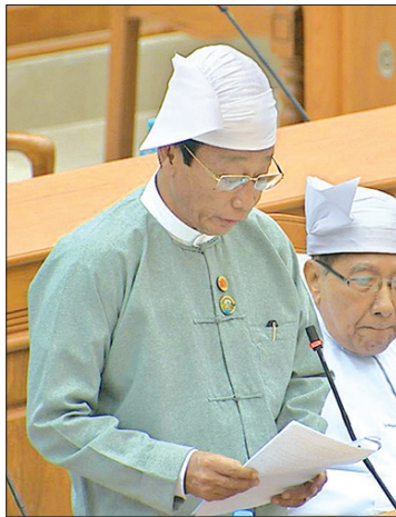
U Hla Kyaw.

This was followed by Deputy Minister for Transport and Communications U Tha Oo explaining the 56.622 billion yen loan for the Yangon-Mandalay Railway Improvement Project Phase II (I). The Deputy Minister said the Yangon-Mandalay Railway Improvement Project Phase I was on the 166-mile Yangon-Toungoo section and Phase II would be on the 220-mile Toungoo-Mandalay section. The project aims to repair and maintain the deteriorating condition of the railway line's basic infrastructure and related parts, raise the speed of the train from 64 km/hr (40 mph) to 100 km/hr (62 mph), ensure safe and secure travel, as well as improve the punctuality of train services. When the project is completed, travel for people living along the rail tracks extending to the Bago Region, Nay Pyi Taw Union area and the Mandalay Region will be more convenient, while the flow of commodities will increase, raising the income, as well as the capacity of Myanmar Railways. It will also upgrade the railway system on the main Yangon-Mandalay route with modern tracks and signalling systems. Once the project is completed, with modern DEMU (Diesel Electric Multiple Unit) trains, speeds up to 100 km/hr can be achieved, ensuring the travel period does not exceed eight hours. The benefits will be safe and convenient travel for people, and speedy transport of