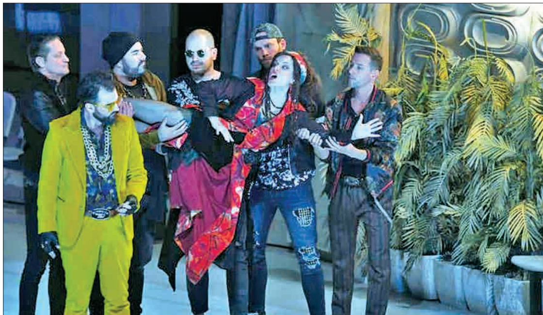
Dancers of the Hungarian National Ballet rehearse for an adaptation of George Gershwin’s “Porgy and Bess” in Budapest, Hungary in January.

The company will also perform the more recent “Mario and the Magician,” based on the Thomas Mann novella, and