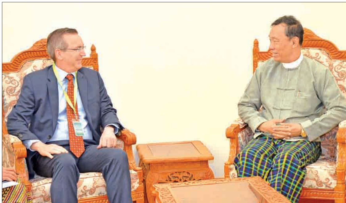
Thura U Shwe Mann in a meeting with US Ambassador Scot Marciel in Nay Pyi Taw yesterday.