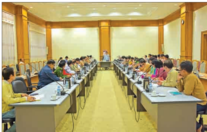
The coordination meeting being held on 2018 Union Tax Bill in Nay Pyi Taw yesterday.

atives who discussed the bill in the Pyidaungsu Hluttaw, Legal Affairs and Special Cases Assessment commission members, officials from Ministry of Agriculture, Livestock and Irrigation, Ministry of Transport and Communications, Ministry of Natural Resources and Environmental Conservation, Ministry of Commerce, Union Attorney-General Office and Central Bank of Myanmar, business persons from Union of Myanmar Federation of Chambers of Commerce and Industry and officials from Pyidaungsu Hluttaw Office. —Myanmar News Agency■