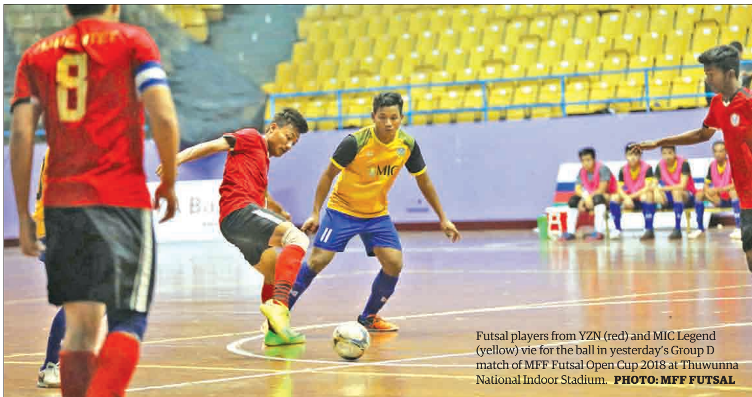
Futsal players from YZN (red) and MIC Legend (yellow) vie for the ball in yesterday's Group D match of MFF Futsal Open Cup 2018 at Thuwunna National Indoor Stadium.