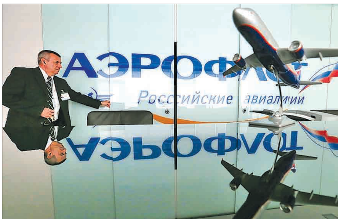
Russian President Vladimir Putin attended a demo flight of an upgraded supersonic strategic bomber Tu-160 in January.

It said the tremor was felt strongest in Iligan City, Cagayan de Oro City and Kailangan town, all in the southern Philippines. The institute said it does not expect the quake to cause damage.—Xinhua ■