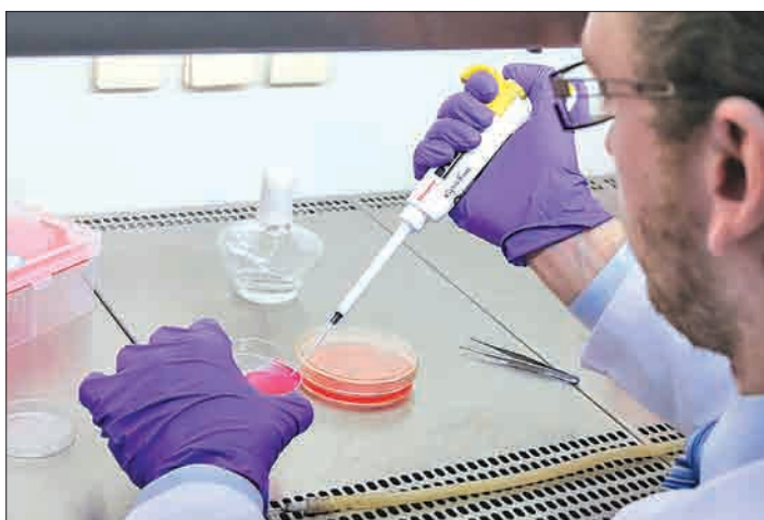
The results obtained testify to the possible multifunctionality of enzymes, which were considered before to be extremely specialized

E. coli tends to routinely feed on glucose, but in the absence of this substance, the bacteria could switch to other substances,