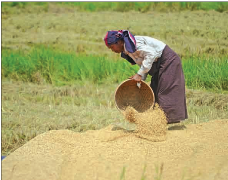
Sifting and sorting the grain is still done manually in many farms in Myanmar.

items were imported in line with the national requirement. More Oil products including diesel, petrol and airplane fuel, airplane parts, machines and parts, chemical fibers and medicines were imported this year than the previous year. In fact, these items are essential requirements for the nation, important raw materials of SMEs, and healthcare requirements for the people.