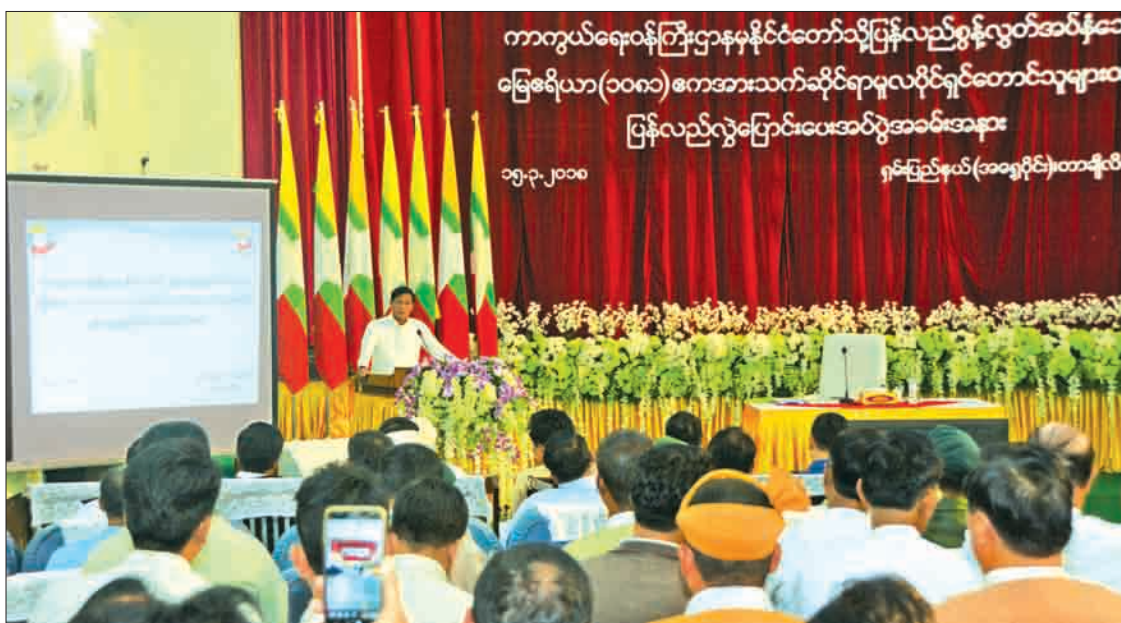
Vice President U Henry Van Thio addresses the ceremony to return the confiscated land to farmers in Tachilek, Shan State yesterday.