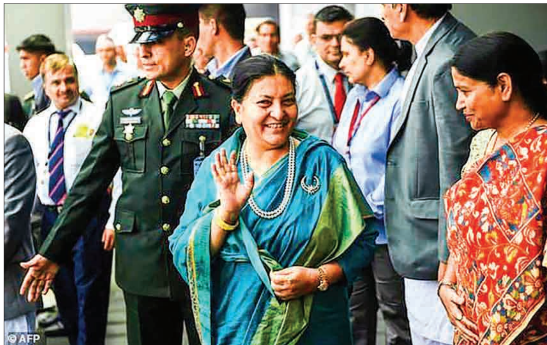
President Bidya Bhandari (C, pictured on a visit to India), Nepal's first female head of state, has won a second five-year term.

death in a mysterious car accident in 1993 that the mother of two became a prominent voice, riding a wave of sympathy to win a seat in parliament.