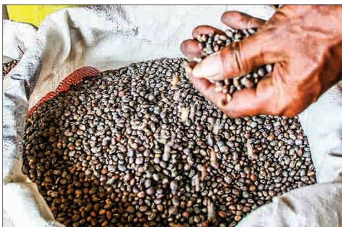
Pigeon pea prices decline in the market due to fresh supplies.

low yield during harvest time. Pigeon pea growers have been battered by the drastic plunge in pigeon pea prices, which is not enough to cover the cultivation cost," said U Than Tun Aung, a grower from Meethwaykan Village, Pakokku District, Magway Region.