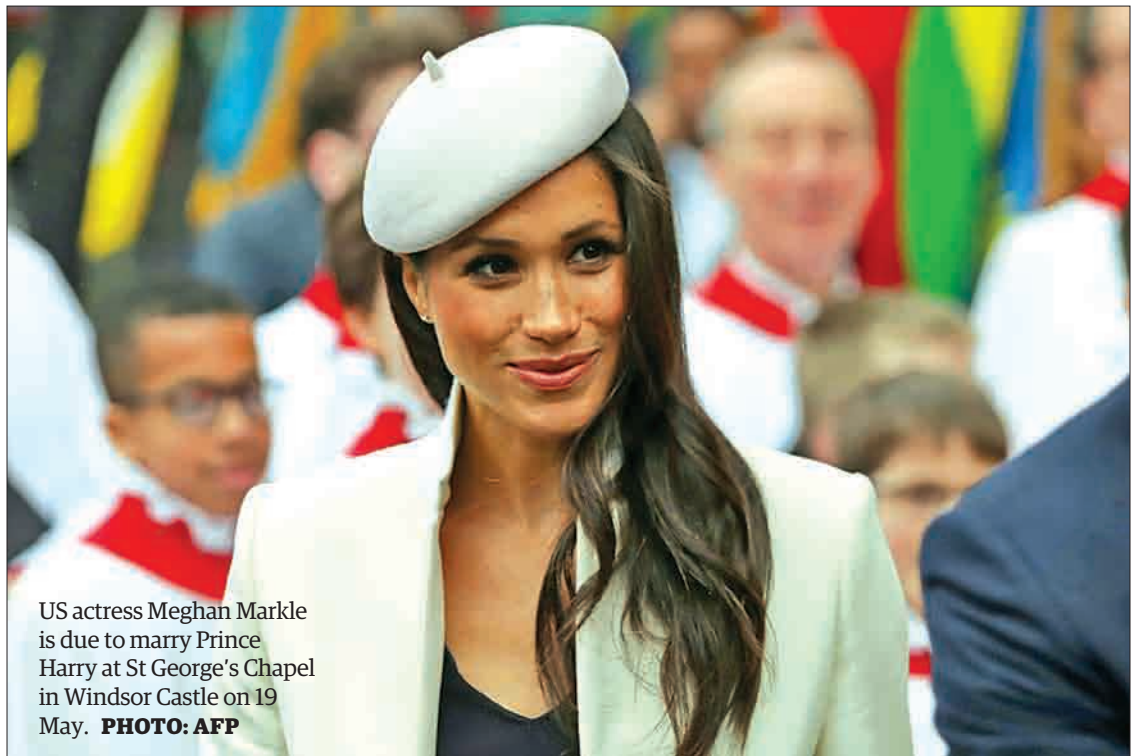
US actress Meghan Markle is due to marry Prince Harry at St George's Chapel in Windsor Castle on 19 May.

In preparation for the ceremony Markle was reportedly baptised last week by the Archbishop of Canterbury, Justin Welby, leader of the Church of England.—AFP ■