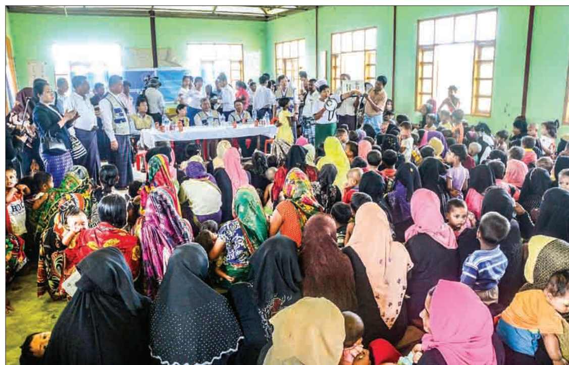
Mothers gather to receive aid for nutrition and health care.

Officials have provided financial support to 1,158 pregnant mothers and 1,026 infants under 2 years of age in Maungtaw District.