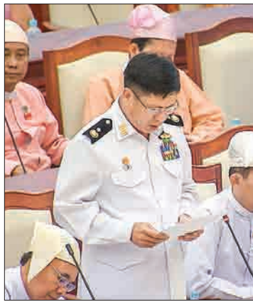
Deputy Minister for Defence Rear Admiral Myint Nwe.

At the meeting, U Sai Aung Kyaw of Kehsi constituency asked if there was a plan to release to the public the Namt Tone Pond and the catchment area of 31 acres, as well as 165 acres of farmlands to the original owners, after the lands were confiscated by infantry battalion 131 in Kehsi Township. Deputy Minister for Defence Rear Admiral Myint Nwe said the lands were included in the 580 acres of armed force land under infantry battalion 131, and the land was granted to the battalion by the order of the Ministry of Home Affairs dated 15 January 2004. In the question, it was stated that 165 acres are farmlands, but when the infantry battalion took over the land, there