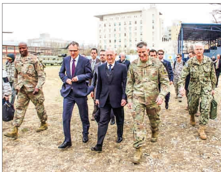
Palestinian prime minister Rami Hamdallah arrives in Gaza City on 13 March, 2018 for a rare visit that was cut short after an explosion near his convoy.

The two major Palestinian factions signed a reconciliation agreement in October that was supposed to see the Islamists hand over power, but it has all but collapsed.—AFP ■