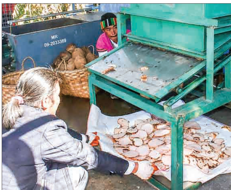
Workers prepare elephant foot yam to dry at a factory in Kanpetlet township, Chin State.