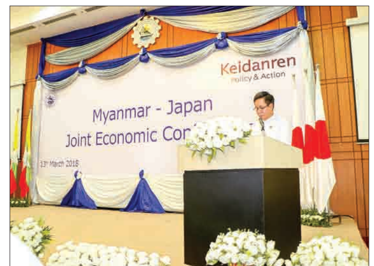
Deputy Minister U Aung Htoo reads the message sent from President U Htin Kyaw to Myanmar-Japan Joint Economic Conference.

MYANMAR-Japan Joint Economic Conference was held at the Republic of the Union of Myanmar Federation of Chambers of Commerce and Industry in Yangon yesterday.