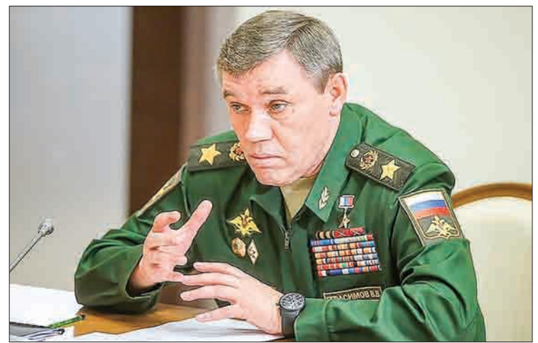
Chief of Russia's General Staff Valery Gerasimov.

"At the same time, Russian military advisors, members of the Russian Reconciliation Centre for the Conflicting Sides and military policemen are staying in the Syrian Defence Ministry's facilities in Damascus. In case there is a threat to the lives of