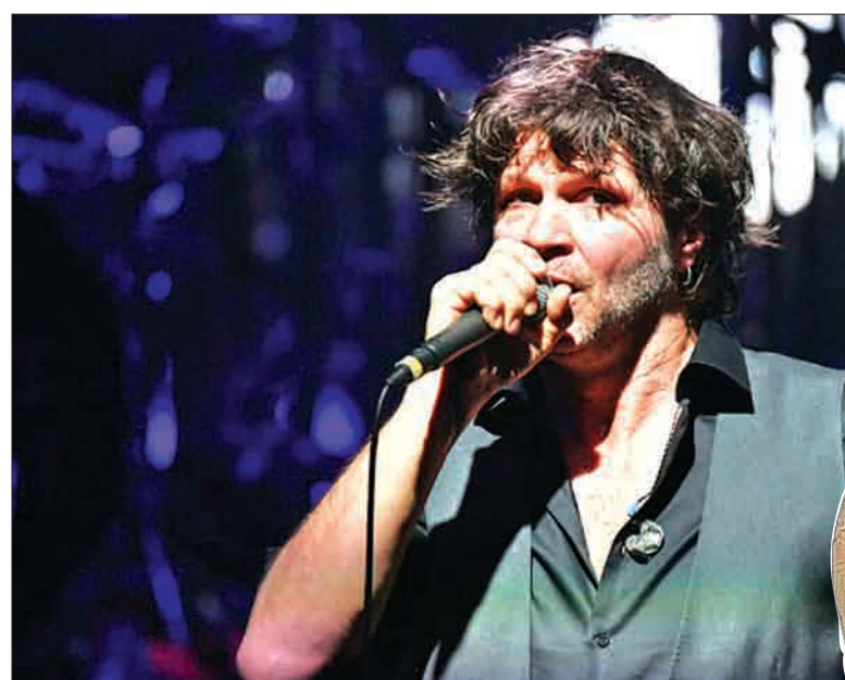
French singer Bertrand Cantat.