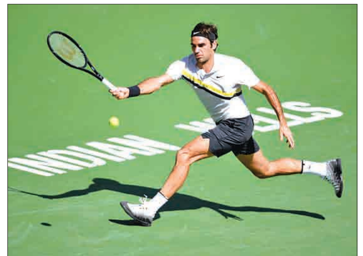
Roger Federer of Switzerland hits a backhand in his match against Filip Krajinovic of Serbia during the BNP Paribas Open at the Indian Wells Tennis Garden.