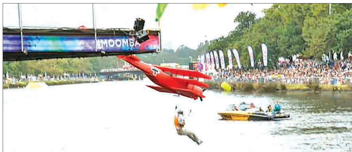
A contestant takes part in the annual Birdman Rally in Australia.

Megalodon, which can grow up to 15 metres long, are believed to have become extinct 1.6 million years ago.—AFP ■