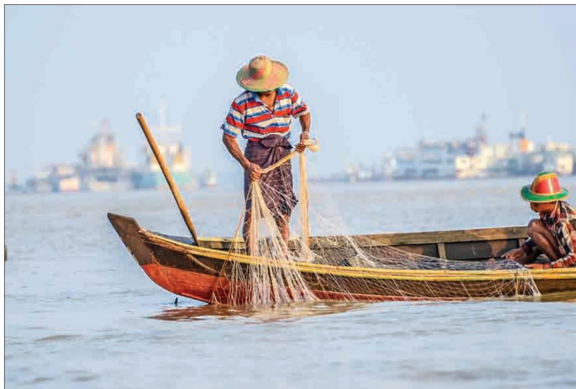
On receiving the government’s approval, fish and prawn farming zones will be established, in cooperation with the related regional and state governments.

ture, Livestock and Irrigation Dr Aung Thu said on 8 March that the fishery sector will be given second priority after rice. The agriculture ministry will also establish plantations of export-marketable crops.