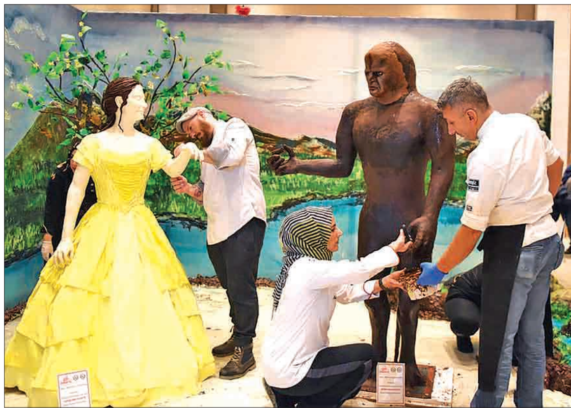
Pastry chefs make pastry work "Beauty and the Beast" in Istanbul, Turkey on 10 March, 2018. Pastry festival in Istanbul has displayed a colorful world of pastries and cakes, mostly in the forms of human figures, animals, flowers, and social lives.

In a market with different kinds of vegetables and fruits, about three dozens of traders and customers were busy with business, no different from real