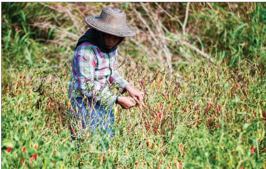
A farmer harvests chillies at the field in Kangyidauk, Ayeyawady Region.

Chillies distributed in the domestic market are locally produced. However, businessmen said the locally produced crops contain alpha toxin, which is found in chilli powder. As a result, a few chilli powder enterprises are importing the raw materials from India.