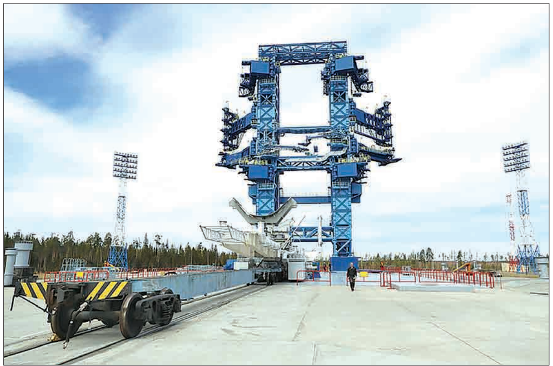
Plesetsk cosmodrome.

the Plesetsk cosmodrome for another pop-up test." He recalled that Sarmat's parameters surpassed those of all existing types of inter-continental ballistic missiles. "With a mass of more than 200 tonnes it has a shorter active phase of flight and better ability to penetrate missile defences and can carry warheads of larger mass and enormous yield," he said.—Tass ■