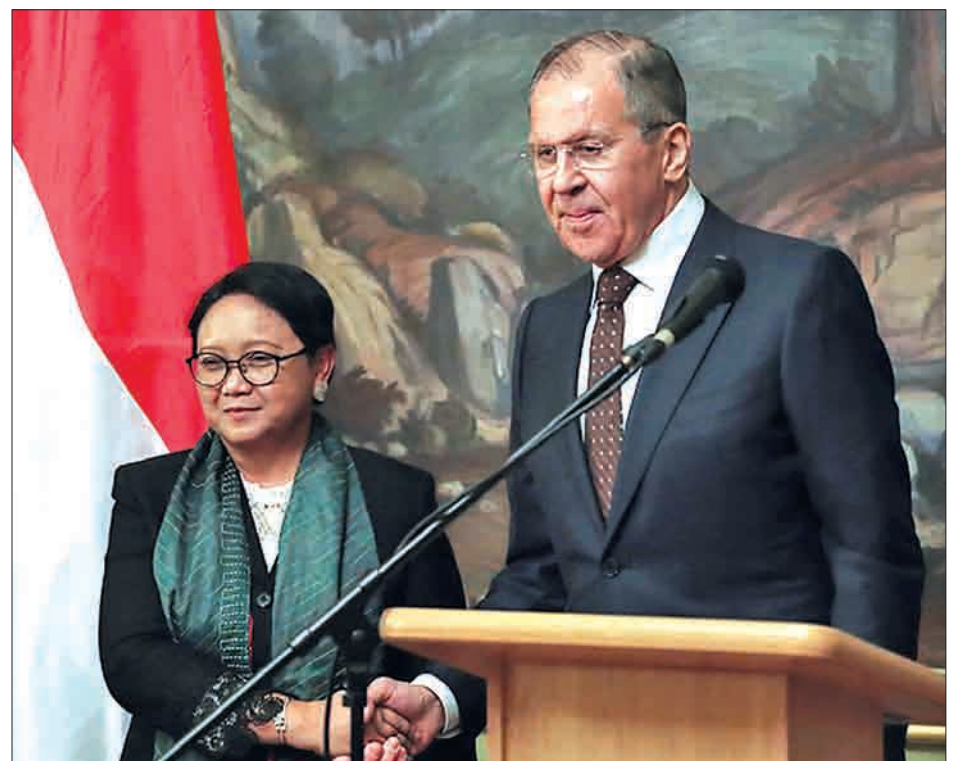
Indonesian and Russian Foreign Ministers, Retno Marsudi and Sergey Lavrov.

She said that the main goal of these negotiations is discussion of economic cooperation. “We are very happy because relations are developing, and this visit is chiefly aimed at bolstering economic relations between our countries, because our country is one of the largest economies in the East Asian region,” the Indonesian foreign minister said.—Tass ■