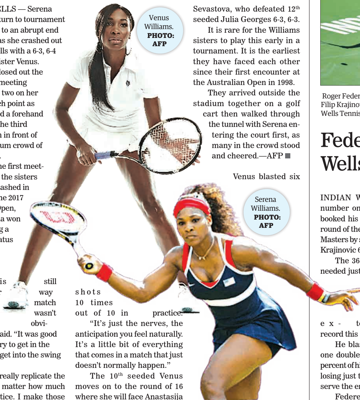
Venus Williams.

"I can't really replicate the situation no matter how much I do in practice. I make those