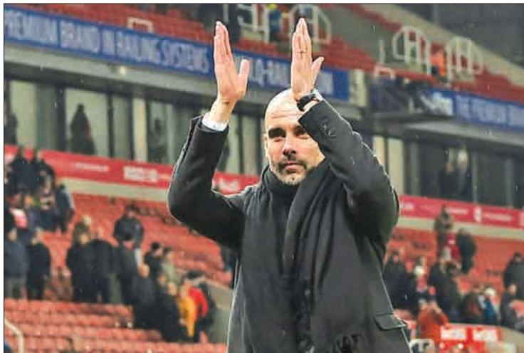
Manchester City manager Pep Guardiola.

First, City must win their visit to mid-table Everton but, should they do so, Guardiola will win his first league title in English football with victory over his old rival Mourinho at the Etihad.