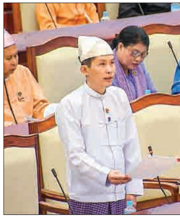
Deputy Minister for Electricity and Energy Dr. Tun Naing.

The Namt Tone Pond fills up through groundwater seepage, and the town people are using it as a source of water supply, as well as for electricity supply by setting up a small mini hy-