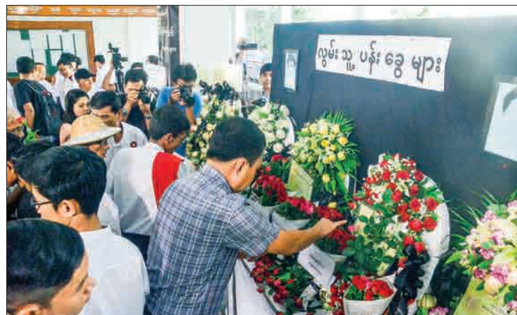
People pay tribute to the fallen students in 1988.

A photographic record of the event, as described in the union news journals and the foreign media at the time, was displayed during the ceremony. ■