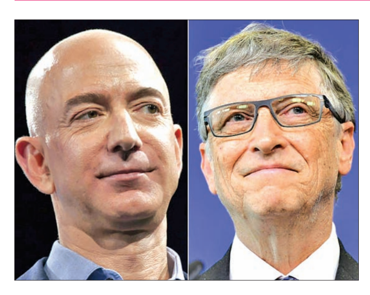
Bezos sailed past Gates to top the Forbes billionaires list for the first time

SOCIAL 8 MARCH 2018 THE GLOBAL NEW LIGHT OF MYANMAR