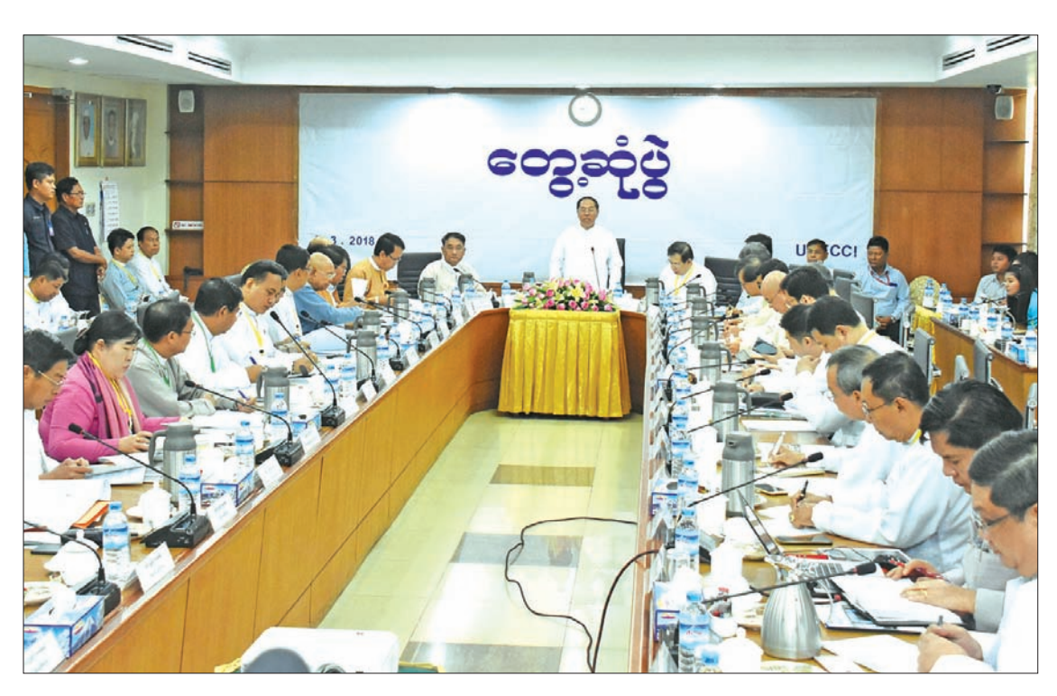
Vice President U Myint Swe addresses at the meeting with entrepreneurs in Yangon.

10 NATIONAL 8 MARCH 2018 THE GLOBAL NEW LIGHT OF MYANMAR