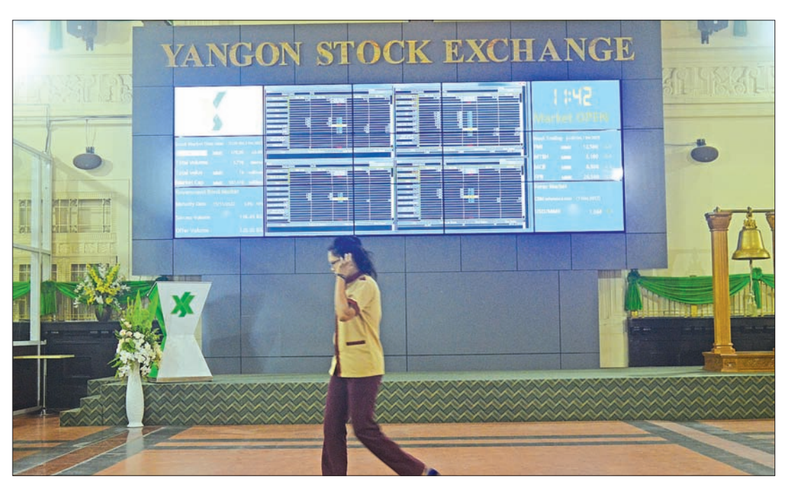
A staff seen in front of the electronic board showing the stock exchange rates in YSX.

Some 3,825 shares were traded by the five listed companies yesterday at an estimated value of Ks26 million. The share prices were below the base price at Ks11,500 for FMI, Ks2,850 for MTSH, Ks7,900 for MCB, Ks27,500 for FPB and Ks2,900 for TMH during closing time. ■