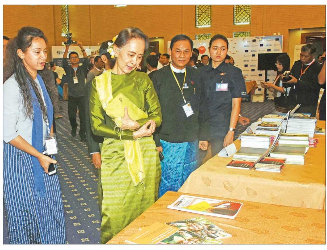
State Counsellor Daw Aung San Suu Kyi checks the periodicals displayed at the Conference on Justice Sector Coordinating for Rule of Law at the MICC-II in Nay Pyi Taw yesterday.