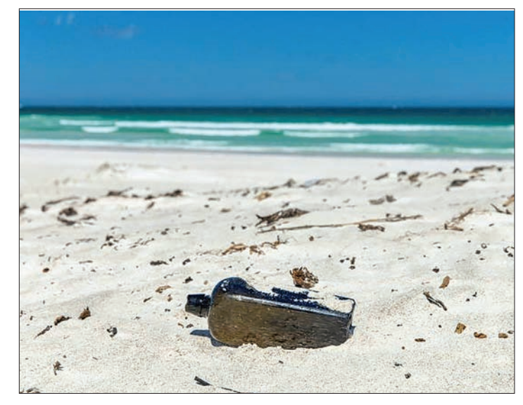
It took weeks of sleuthing to verify the unusual find as the world's oldest known message in a bottle.

The previous oldest known message in a bottle was found in Germany 108 years and 138 days after it was thrown into the North Sea by a marine biologist in 1906.—AFP■