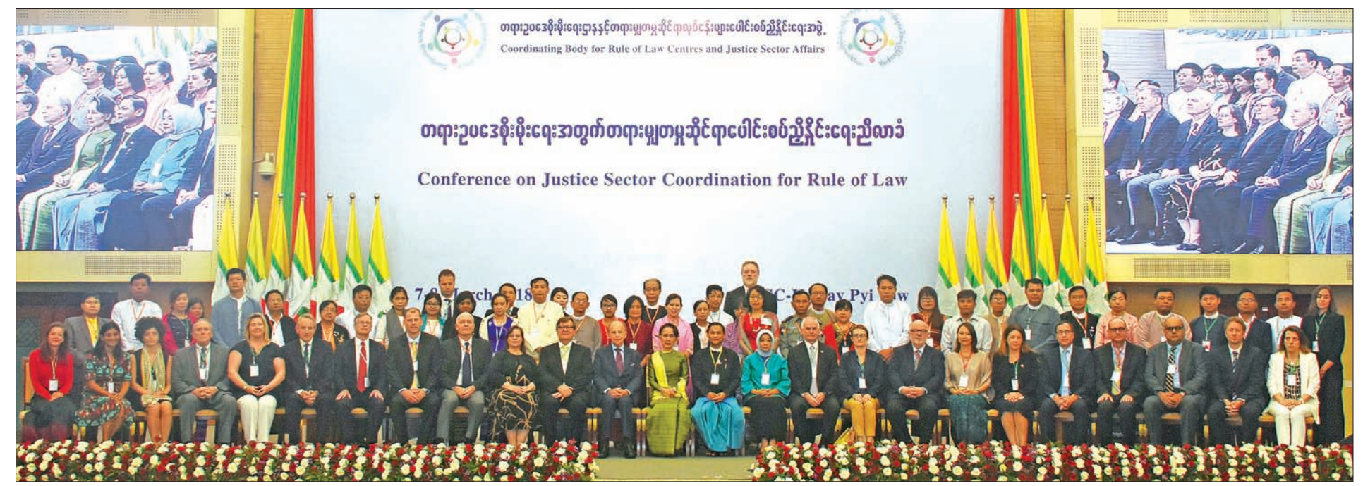
State Counsellor Daw Aung San Suu Kyi and dignataries have the documentary photo taken at the Conference on Justice Sector Coordination for Rule of Law.