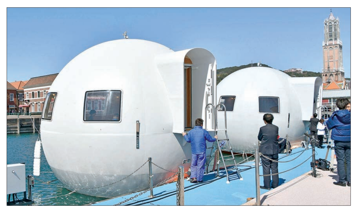
Futuristic floating spherical capsule hotels are unveiled to the press at the Huis Ten Bosch theme park in Nagasaki Prefecture, southwestern Japan on 6 March, 2018, ahead of the official launch.

8 MARCH 2018 THE GLOBAL NEW LIGHT OF MYANMAR SOCIAL 15