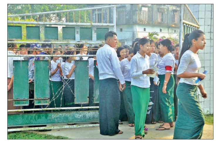
Students return home following the end of the first day of matriculation examination in Maungtaw.

U Khin Aung, the township education officer, said that a total of 78 per cent of students in the township have taken the