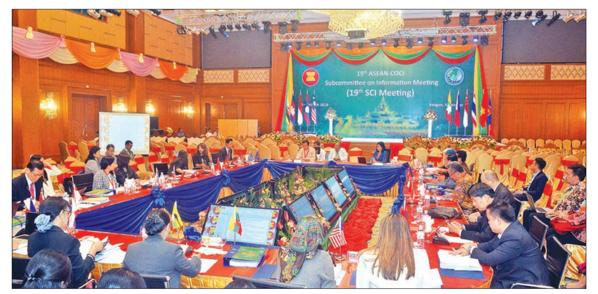
The second day meeting of the 19th ASEAN-COCI Subcommittee on Information Meeting held at Sky Star Hotel in Yangon yesterday.

THE second day meeting of the 19<sup>th</sup> ASEAN-COCI Subcommittee on Information Meeting was held at Sky Star Hotel in Yangon yesterday morning.