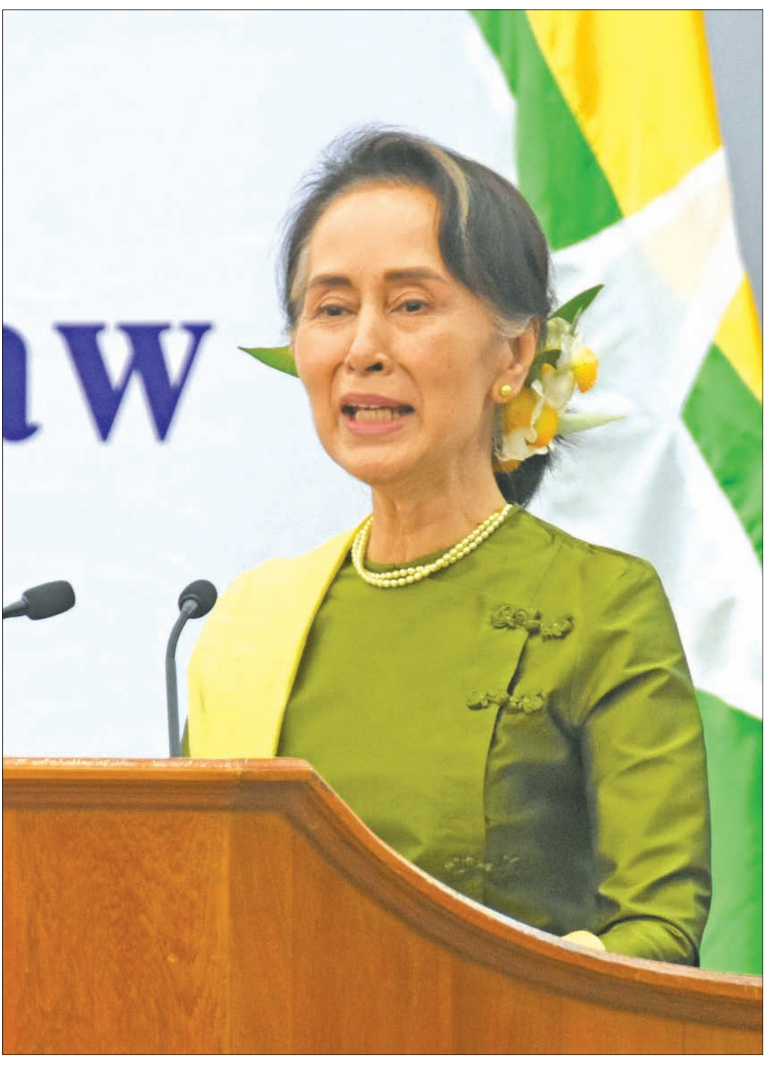
State Counsellor Daw Aung San Suu Kyi delivers the address at the Conference on the Justice Sector Coordination for Rule of Law at the MICC-II in Nay Pyi Taw yesterday.