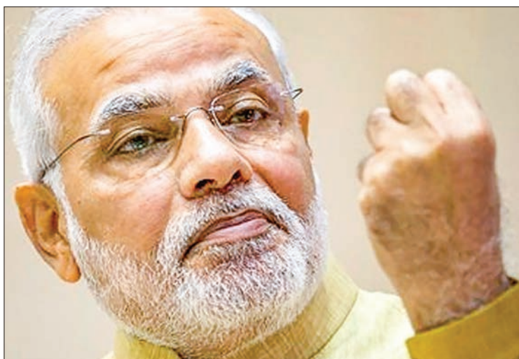
Prime Minister Narendra Modi.