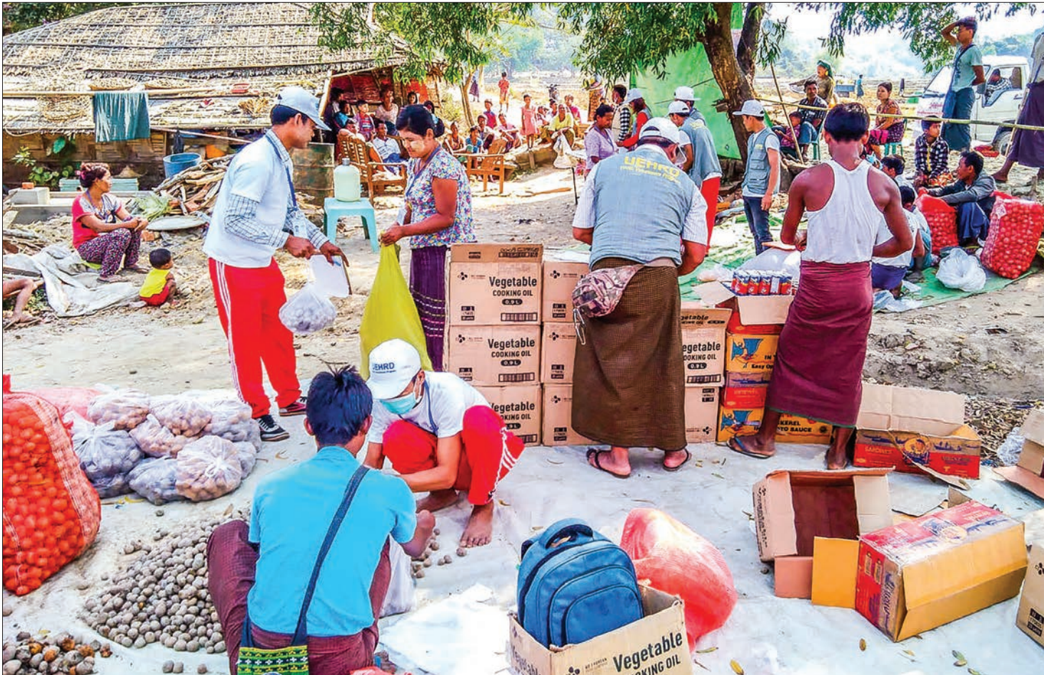
Youth volunteers prepare to deliver the aid to local people in villages in Maungtaw.