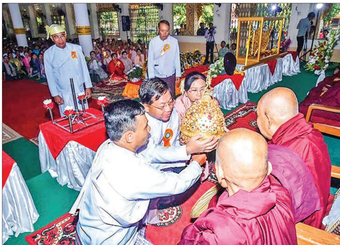
Senior General Min Aung Hlaing and wife present the Diamond orb to the Sayadaws before it is fixed atop the Shwetaungsar Pagoda in Dawei.