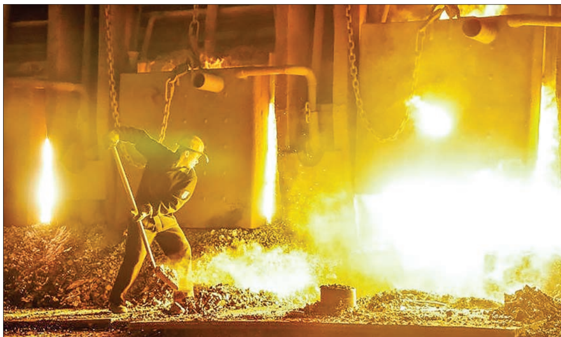
Trump's plans to introduce tariffs on steel and aluminium imports has angered major producing nations.

Trump ratcheted up the rhetoric on Saturday, threatening a tax on cars from the European Union if it takes retaliatory measures. On Friday European Commission chief Jean-Claude Juncker said the EU was drawing up measures against leading US brands such as Levi's and Harley-Davidson.—AFP ■