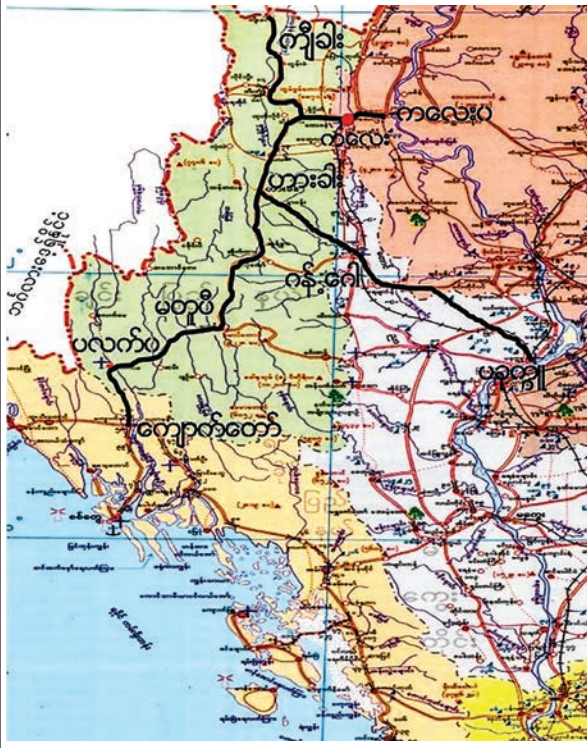
Kyauktaw-Paletwa-Matupi-Hakah- Kyikha road

The northern part of Rakhine State including towns of Buthidaung,