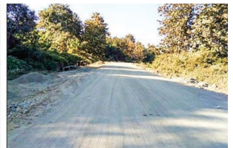
After construction of gravel road between (32.8km-33km)