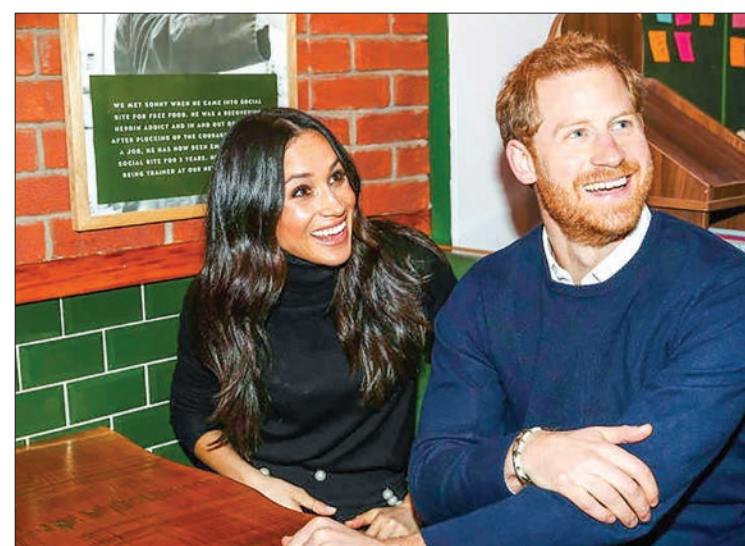
Britain's Prince Harry (R) and his fiancée US actress Meghan Markle will marry at St George's Chapel, Windsor Castle on 19 May, 2018.

The law has already been used for royal events including the 2011 wedding of Prince