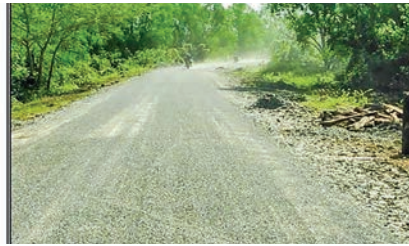
After construction at mile post (68/0-68/5)