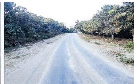
After construction of bituminous road between (53.6km-53.8km)