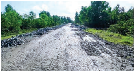
Before construction at mile post (68/0-68/5)