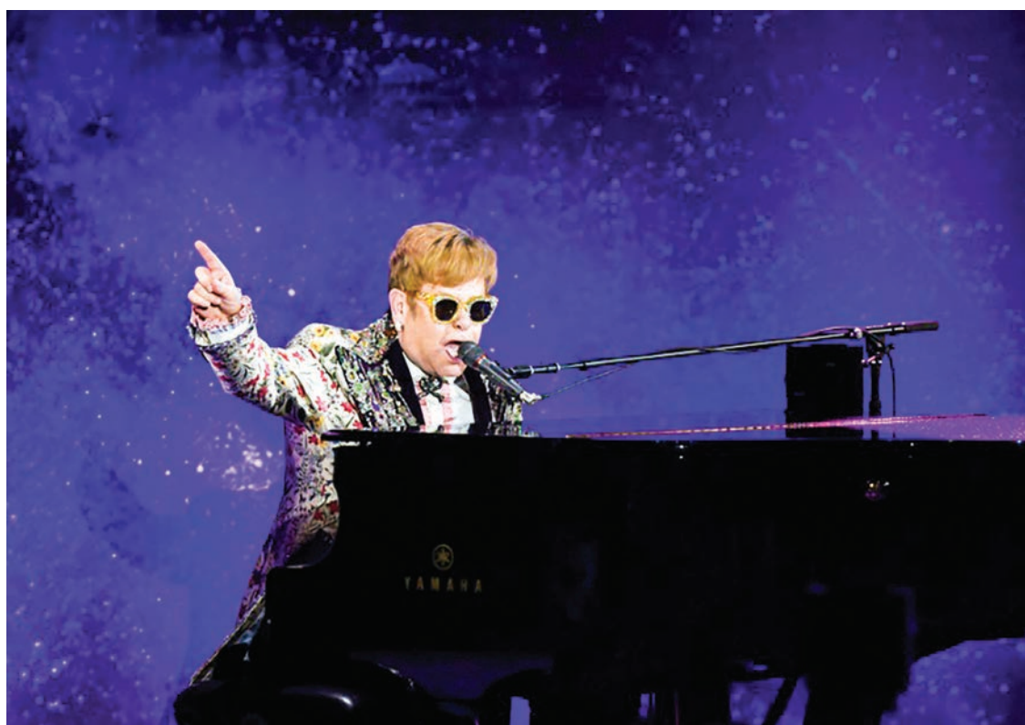
Elton John said a “rude” and “disruptive” fan caused him to leave the stage during a performance in Las Vegas.

He later returned to the stage, but the group of fans did not. John, who in the 1980s became one of the first openly gay major celebrities, announced earlier this week that he plans “go out with a bang” with a global tour that will open on September 8 and last through 2021. —AFP ■