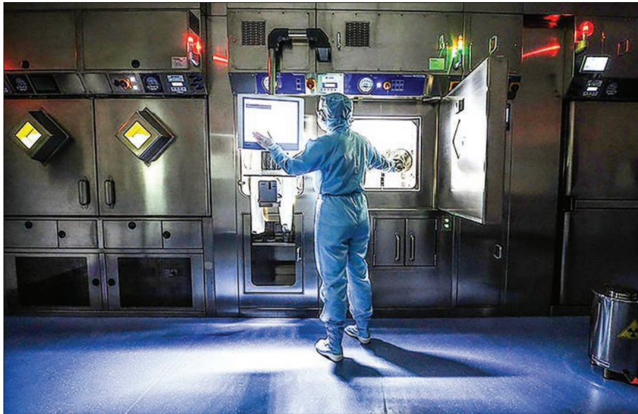
The source described West's policies regarding Moscow as “strategic blindness to Russia and its capabilities”.

The source said that Russia had sent signals to “its uncooperative Western partners” in the past, intended to show them “the futility of their