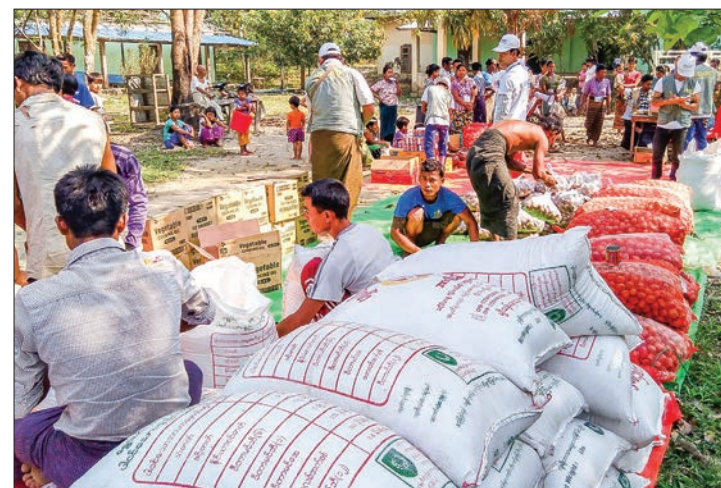
The fifth wave of humanitarian aid arrives in Buthidaung and Maungtaw with youth volunteers.

The fifth batch of youth volunteers will carry out humanitarian assistance programmes in the villages of Buthidaung and Maungtaw townships until 12 March.