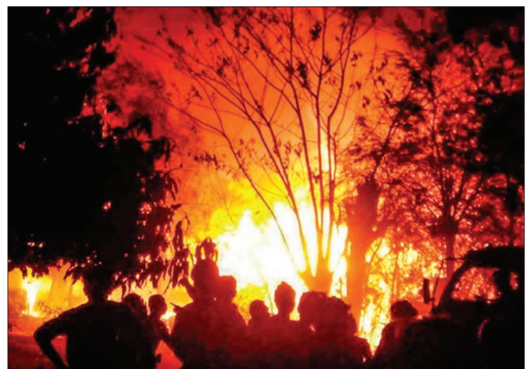
Kitchen fire in Tarpon, Nattalin burned five homes but no casualties.

Charges have been filed against the home owner for violating Section 285 of the Penal Code, which defines fire-related negligence and recklessness.—071