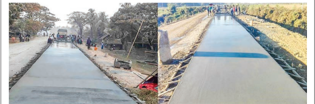
Ongoing construction of concrete road

Pyi – Padaung – Taungup – Kyaukphyu road is now upgrading with the Official Development Assistance (ODA) of Japan International Cooperation Agency (JICA). The project includes upgrading of existing 6 bridges as well as the targeted road section which is 14 miles 4 furlongs in length. In addition, upgrading of existing road with rigid pavement about 4 furlongs and flexible pavement 1 mile 7 furlongs as well as 7 bridges were constructed with the financing of the Government.