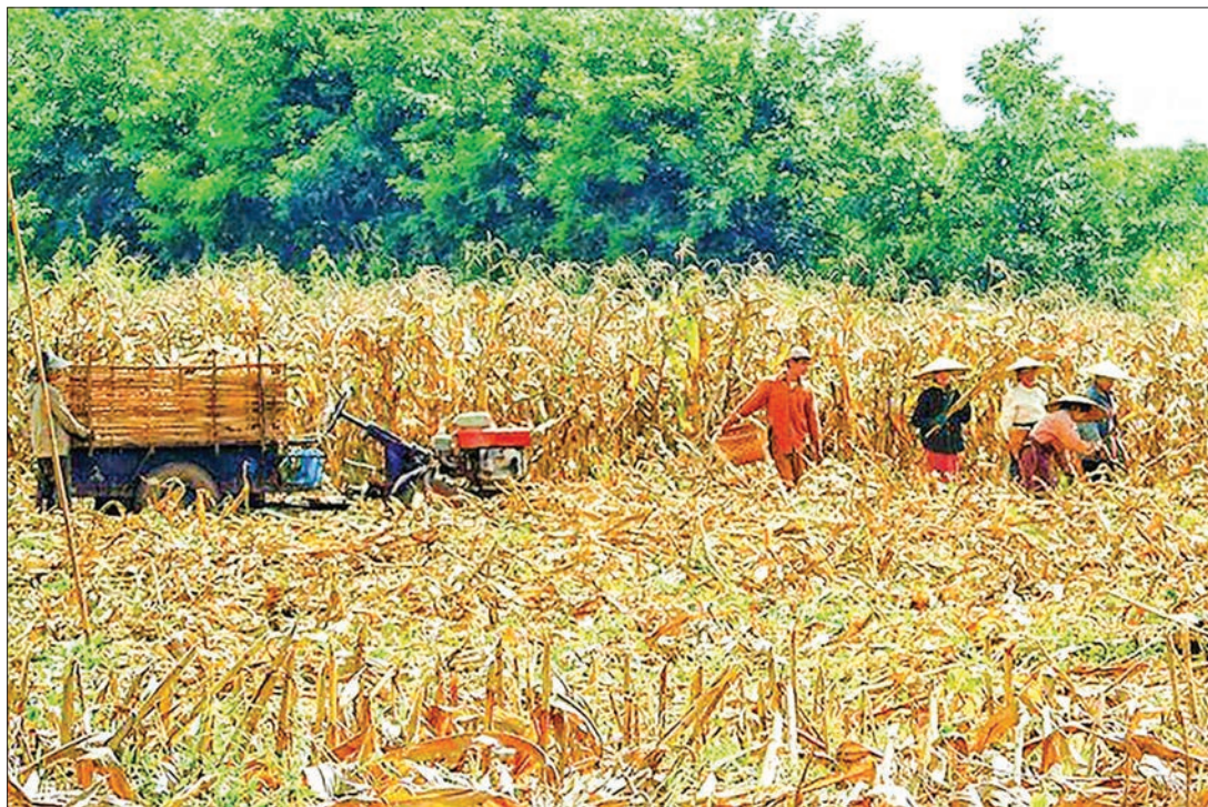
Corn exports up by 300,000 tonnes

mar's corn. It is also exported to Viet Nam, Malaysia, Singapore, the Philippines and Thailand. With high demand from foreign countries, corn fetched the highest price in the market. —GNLM ■