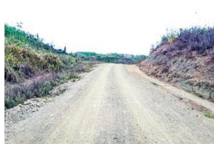
After construction of bituminous road between (53.2km-53.4km)