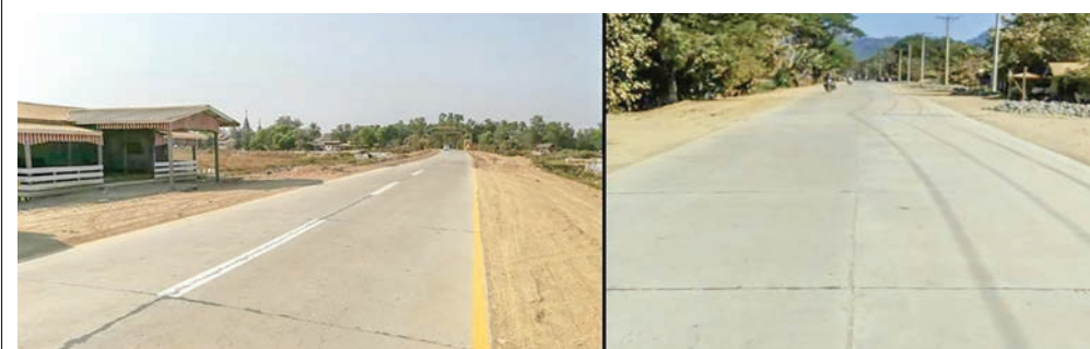
Completion of concrete road