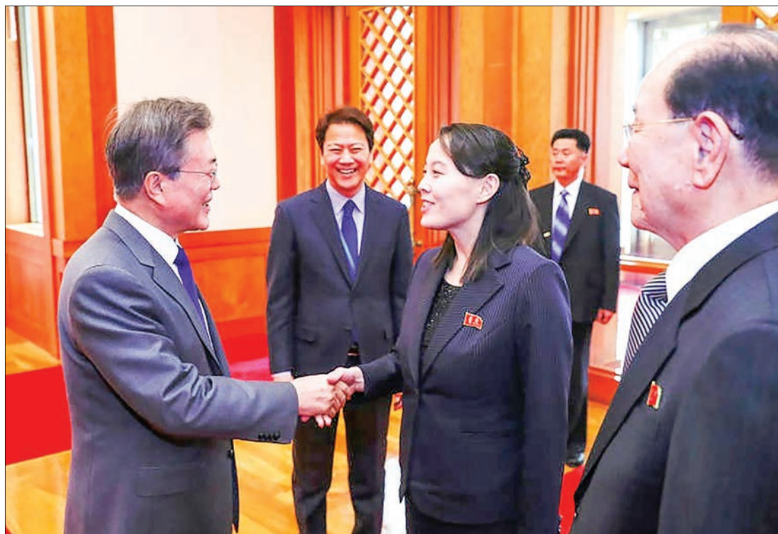
Kim Yo Jong's trip to Seoul marked the first visit to the South by a member of the Kim family since the end of the Korean war.