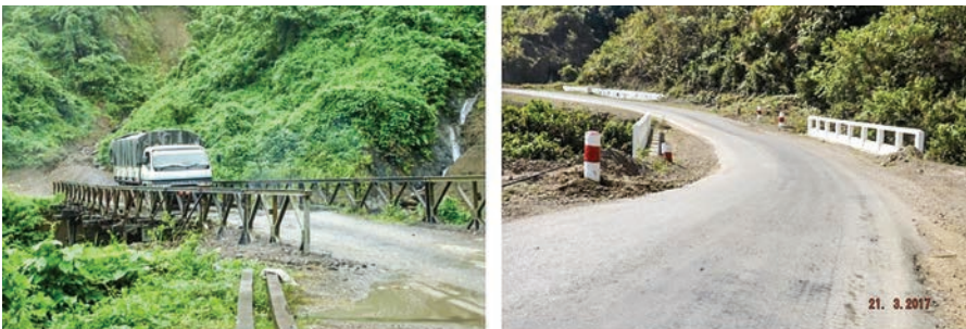
40m length reinforced concrete bridge construction (No.13/7) between 6/7 mile and 7/0 mile at Buthidaung-Maungdaw road