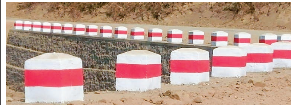
Completion of retaining wall