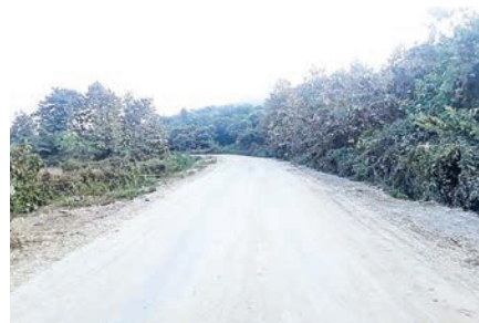
After construction of bituminous road between (53.4km-53.6km)