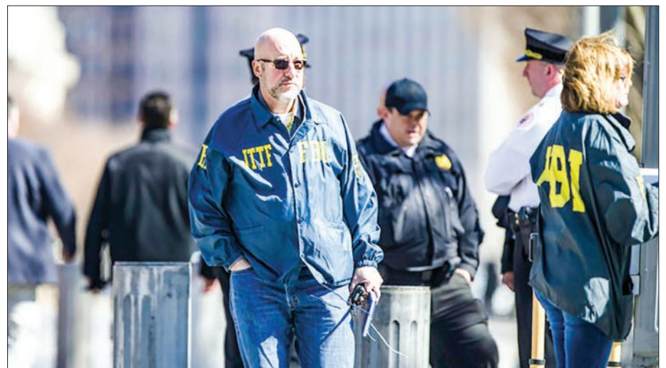
FBI agents, Secret Service officers and local police scoured the area outside the White House after a man fatally shot himself near the presidential residence.

The man's identity is being withheld pending notification of kin, the Secret Service said in a statement. While as many as 100 people — mostly tourists — were on Pennsylvania Avenue in front of the White House at the time, no one else was reported hurt, the Secret Service said. Police and