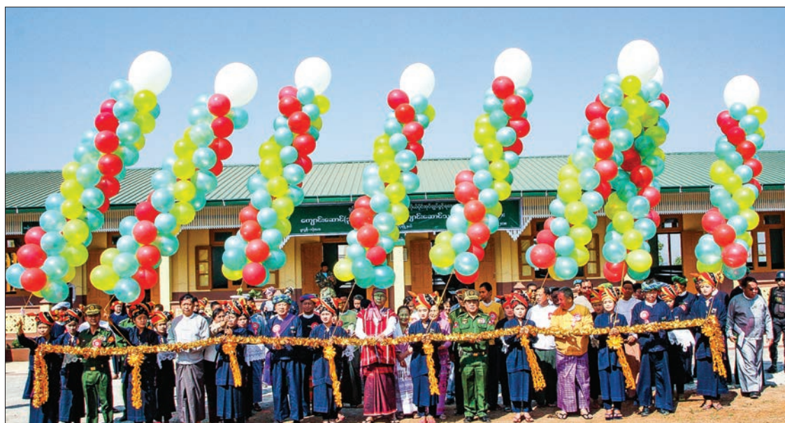
Amyotha Hluttaw Speaker, the Chairman of Nippon Foundation and other high-ranking officials cut the ribbons to open Long Hey school, the 300 th school built in Shan State.