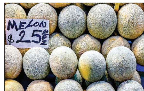
Australians vulnerable to listeriosis have been advised to discard any rockmelon purchased before 1 March.

Listeriosis begins with flu-like symptoms including chills, fever and muscle aches. It can take up to six weeks after consuming contaminated foods for the symptoms to occur.—AFP ■