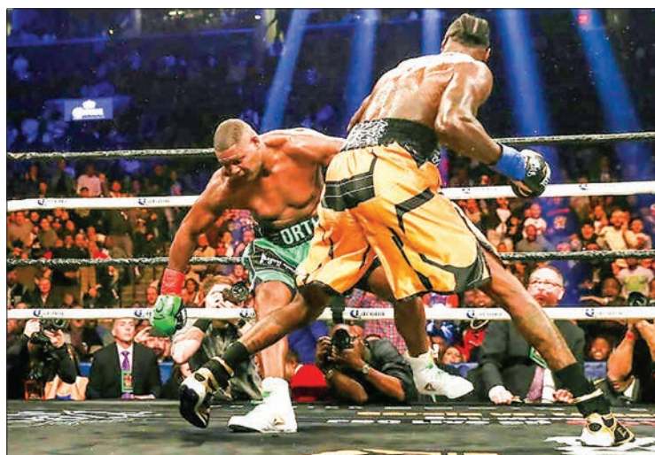
Deontay Wilder (R) knocked down Luis Ortiz three times in the fight, finishing off the challenger with a right uppercut as the referee stopped the fight in the 10th round.

The 32-year-old Wilder improved to 40-0 with 39 knockouts as he made the seventh defence of his heavyweight title. Wilder knocked Ortiz down in the fifth and twice in the final round but Ortiz made him work for the victory at Barclays Center arena in New York. Wilder barely survived