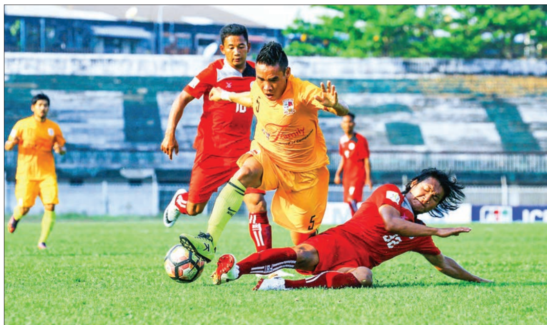
Sagaing intercepts Zwekapin attempt to score in yesterday's MNL match at Aung San Stadium.