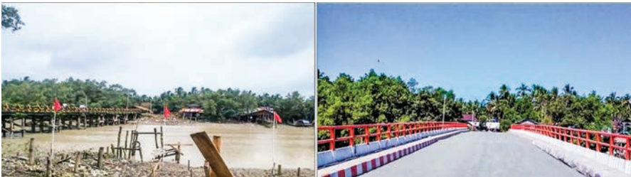
Upgrading from wooden bridge to reinforced concrete bridge within 82km-83.6km (Ohn Creek Bridge) at Manaung island ring road

The progress on the road and bridge sector of Rakhine State for the last two years, can be seen on the following table: