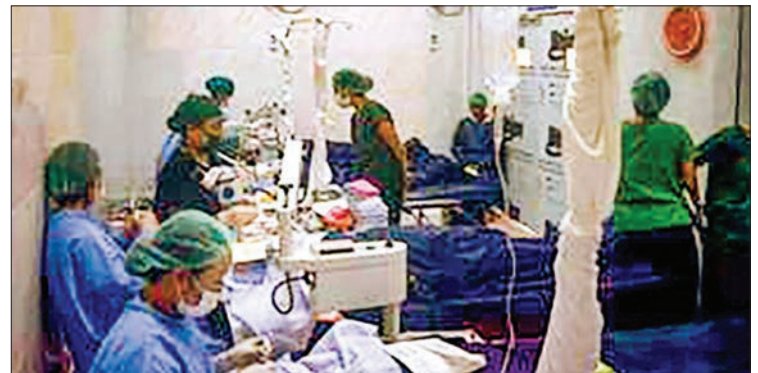
Specialists treating cataract patients in a hospital. According to WHO, cataracts account for 50 per cent of the world's blindness.

The most common eye diseases in the country are cata-