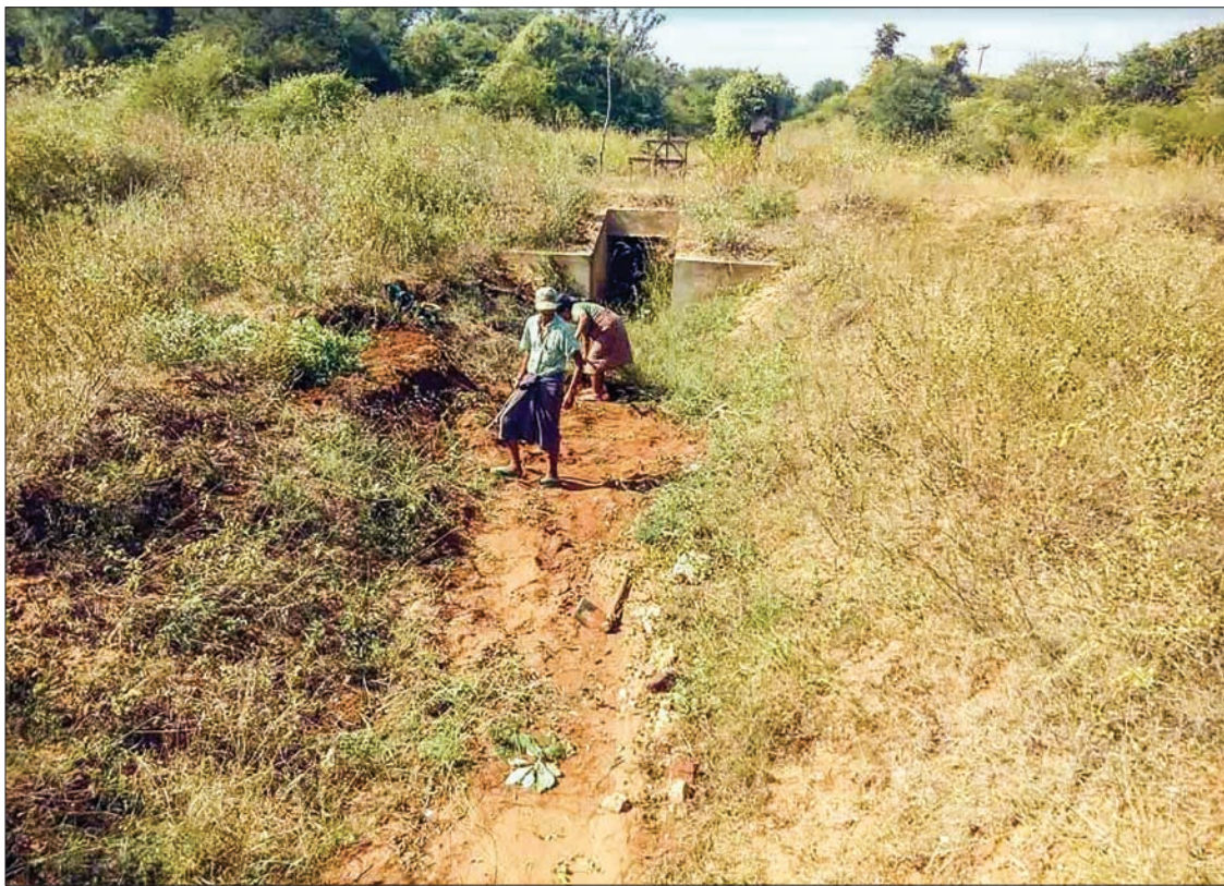
Hunting snakes is not an easy job and people can't do it alone, the job needs two or three people to search and capture snakes.