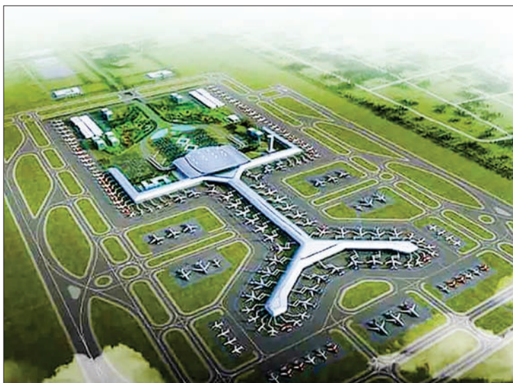
The conceptual design of Hanthawaddy International Airport.