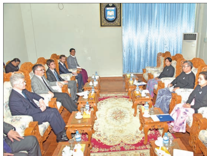
Deputy Attorney-General U Win Myint holds talks with French Ambassador, IRACM delegation in Nay Pyi Taw.

U Win Myint said Myanmar had signed the United Nations Convention against Transnational Organised Crime (UNTOC) and would cooperate with other countries in the region to combat transnational distributors of counterfeit medicine. He said there