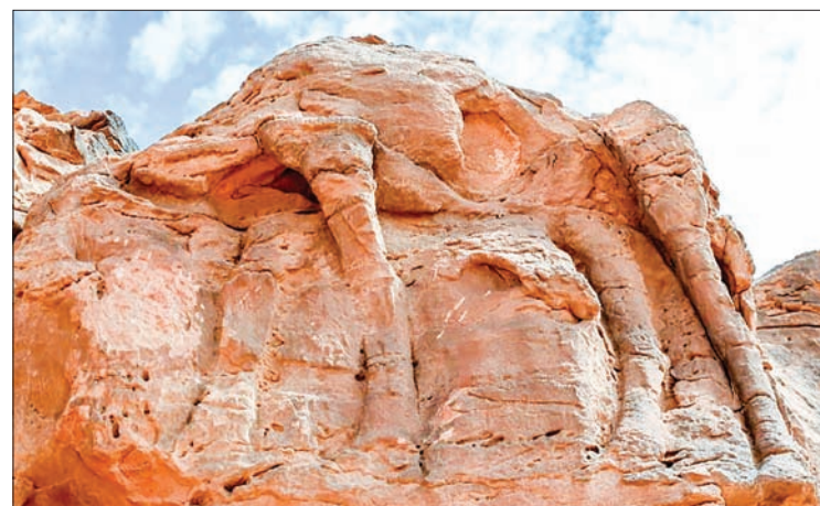
The site of an archaeological discovery north of the city of Sakaka in Saudi Arabia's northwestern Al-Jouf province, with a carved sculpture of a camel's legs seen in the foreground (R).

They also discovered evidence of 46 lakes that used to exist in Saudi Arabia's northern Nefud desert, which experts say has lent credence to the theory that the region swung between periods of desertification and a wetter climate.—AFP ■