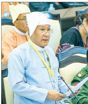
Supreme Court Judge U Myint Aung.

During the meeting, U Aung Kyaw Soe of Kayah State constituency (7) asked whether there was a plan to construct a new State High Court during fiscal year 2018-2019. Supreme Court Judge U Myint Aung said the Kayah State High Court had been renovated in 2011 by the Military Engineer Corp. Also, an extension building to the court was constructed using the Union Supreme Court budget of Ks 50 million in FY 2014-2015, with construction beginning on 16 October 2014 and completed on 28 January 2015. A 40x25 ft. and 12 ft. high township detention center was also built in Loikaw District during FY 2014-2015 and was in use after completion. As