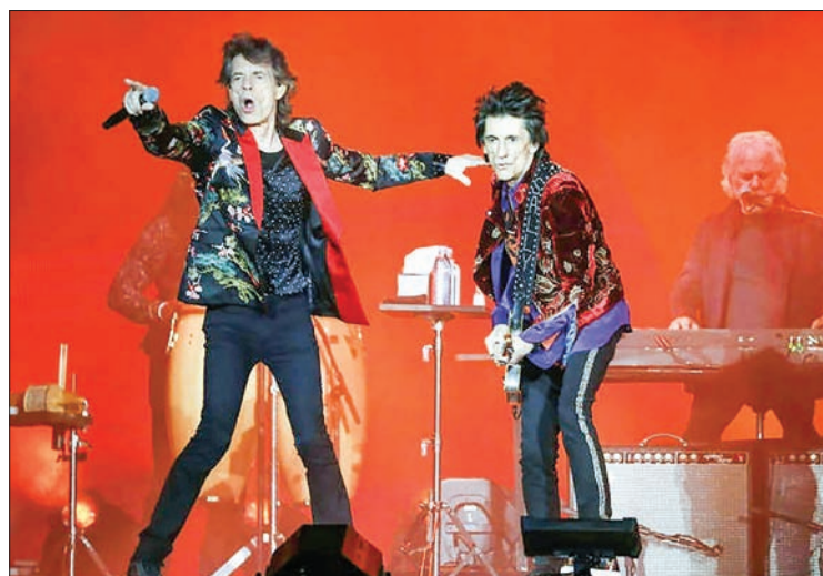
The Rolling Stones ended the first part of their "No Filter" tour in October with a series of sell-out shows in France.