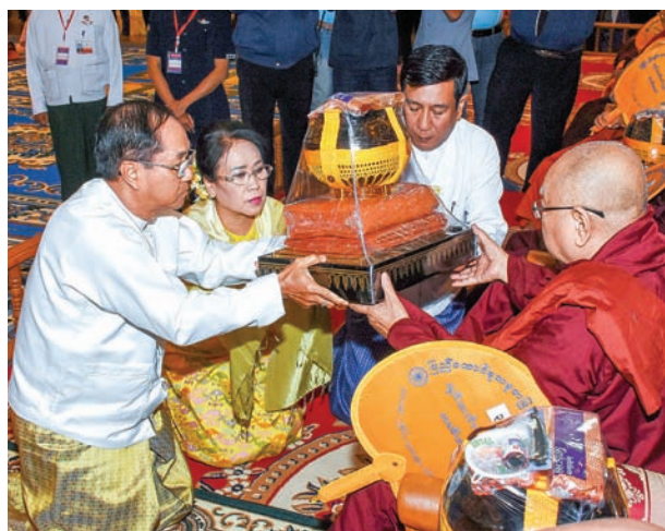
Vice President U Myint Swe and wife present offertory to a Sayadaw.

The ceremony ended with sharing merits gained. A day meal was then offered to Saydaws and nuns.—Myanmar News Agency ■