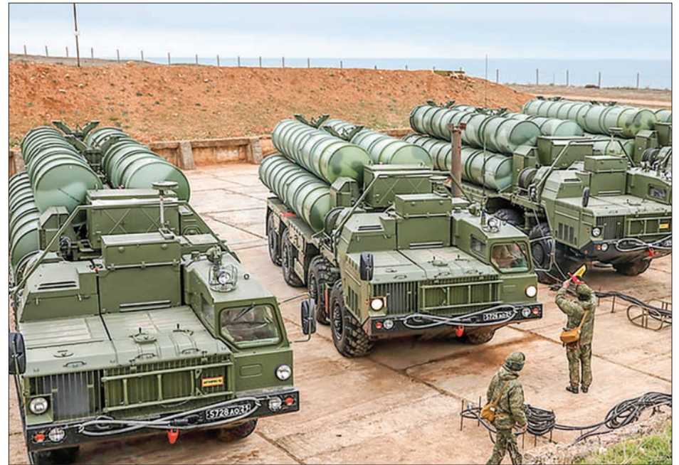
S-400 long-range air defense missile systems.

version currently in service. The press office did not specify, however, how many helicopters with improved combat capabilities and also Su-30SM fighters would be delivered this year. The Fleet's warship stock will also be replenished with new Project 22800 missile-carrying ships. The warships of this Project are armed with attack and air defence weapons, combat control, target detection and designation systems and communications means. Precision missile systems are the backbone of the warship's strike weapons.—Tass ■