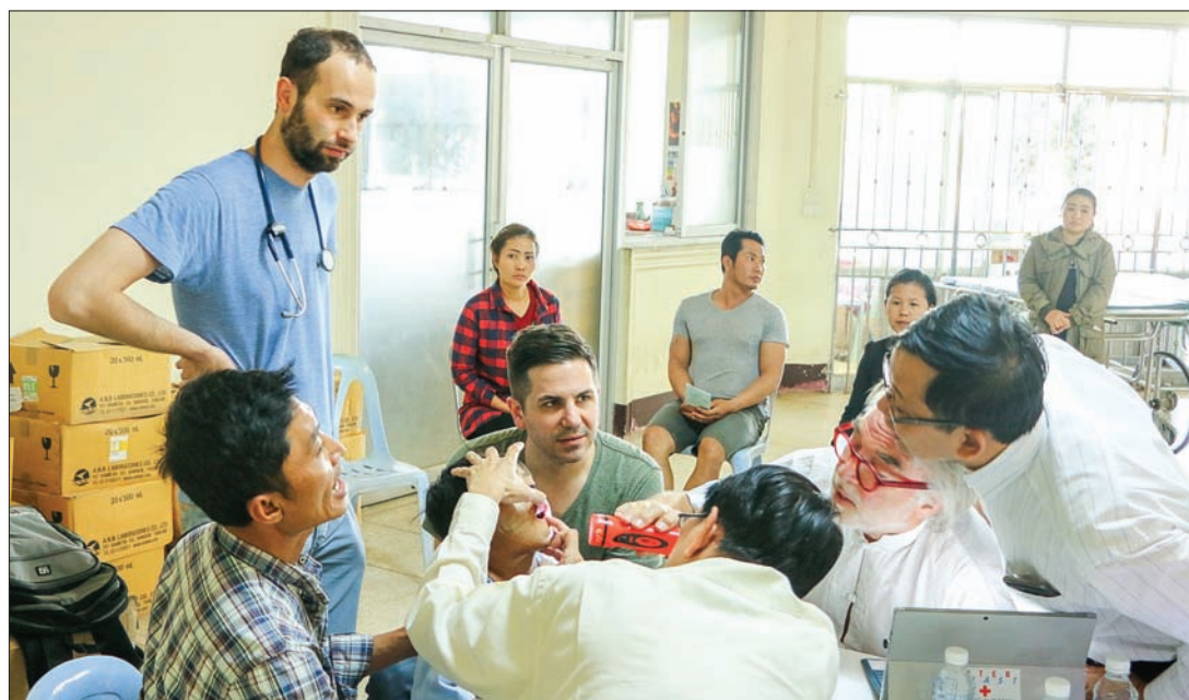
Medical team provides check-up to a patient in Tachelik Township.

A total of 154 patients including 70 patients from Tachelik, 31 patients from Minephyat and 53 patients from Loikaw in Kayah State will receive medical attention. Furthermore, accommo-