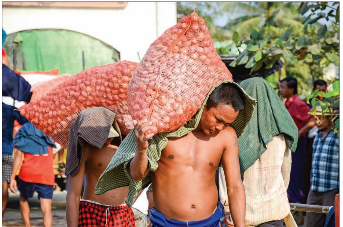
Workers carry bags of onion at Bayinnaung wholesale market in Yangon.

Myanmar has imported the onions from China to decrease the price of local onions in the