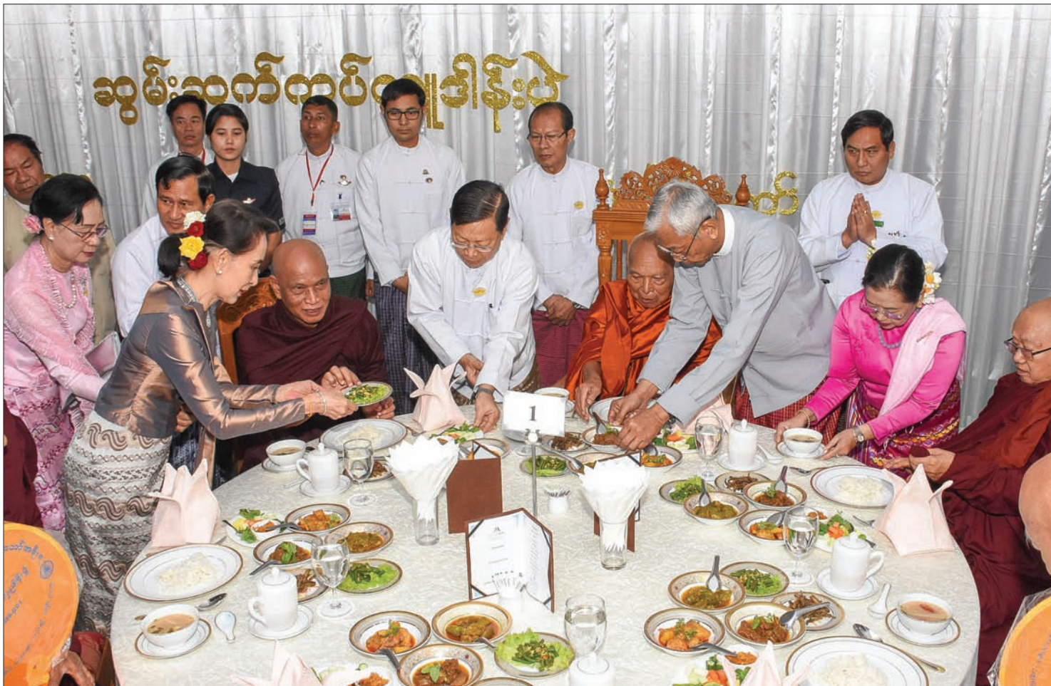
President U Htin Kyaw, fifth from right, First Lady Daw Su Su Lwin, third from right, and State Counsellor Daw Aung San Suu Kyi, fourth from left, offer a midday meal to members of the Sangha in Nay Pyi Taw yesterday, including Sayadaws who will receive religious titles.