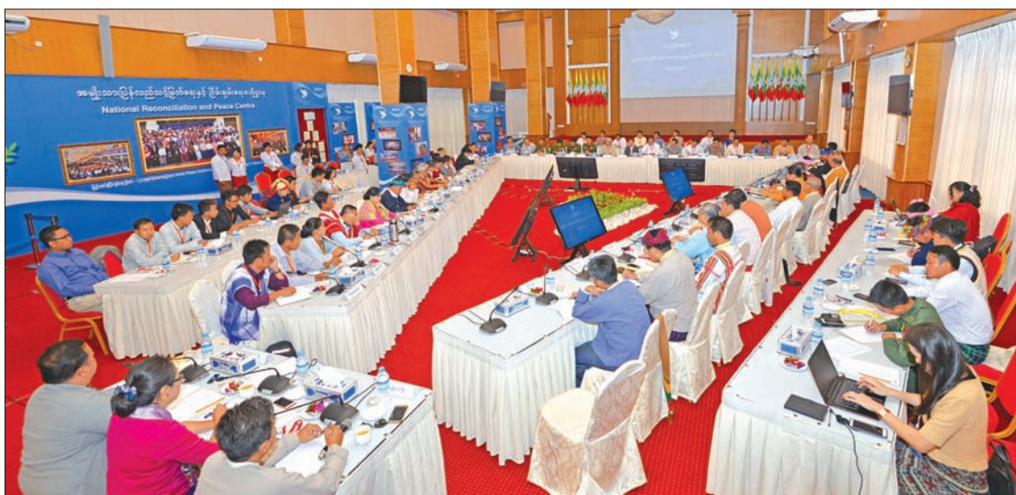
The 14 th Union Peace Dialogue Joint Committee (UPDJC) meeting held in Nay Pyi Taw.

“It is important for political dialogues to continue even if there are differences in our beliefs and views. It is important to meet regularly. The path of meeting and discussions should not be forgotten. We need to make concessions, and give and take to overcome challenges to the