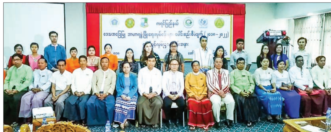
Participants pose for the documentary photo at the launching ceremony of community based nutrition programme in Hpa-an, Kayin State.