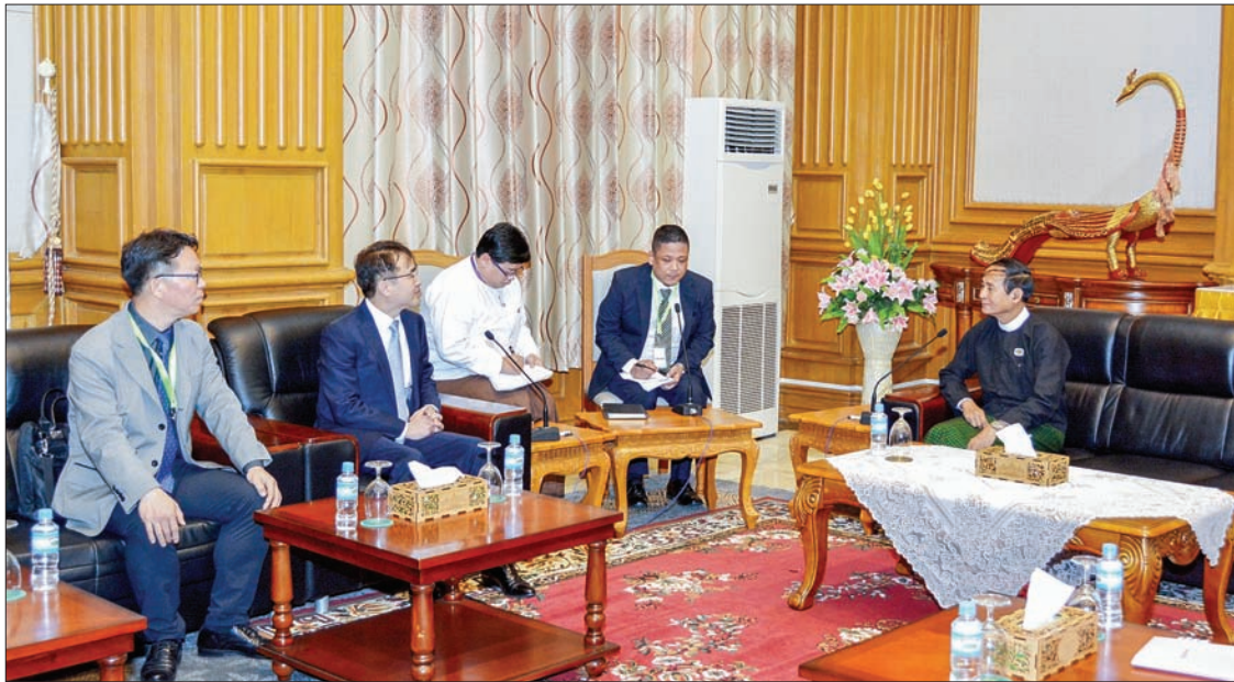
Pyithu Hluttaw Speaker U Win Myint receives South Korean Ambassador Lee Sang-hwa in Nay Pyi Taw.