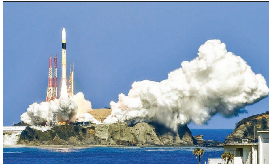
A H-2A rocket carrying an intelligence-gathering satellite successfully takes off from the Tanegashima Space center in Kagoshima Prefecture, southwestern Japan on 27 February, 2018.

The government is aiming to raise the num-