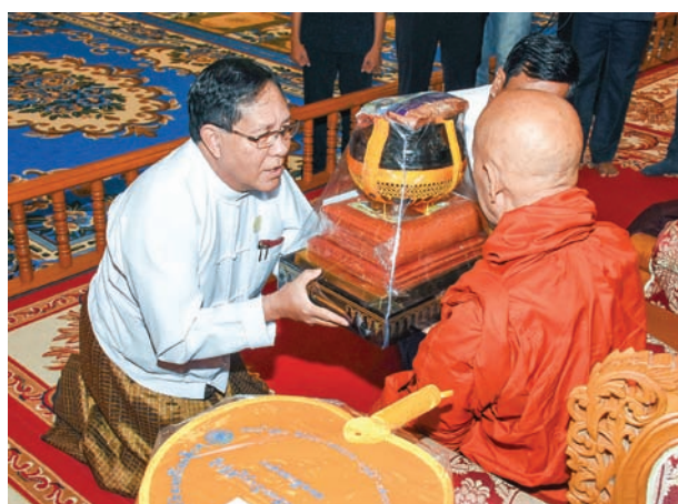
Union Chief-Justice U Htun Htun Oo presents offertory to a Sayadaw.