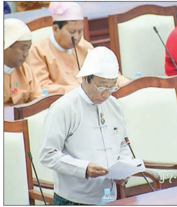
Deputy Minister for Agriculture, Livestock and Irrigation U Hla Kyaw.

U Min Thein of Taungdwingyi constituency then asked if there was a plan to upgrade the Ohn Ne Tan-Kyaukphyutaw inter-villages road that is a bypass road around the Beikthano cultural site. The Deputy Minister replied that the ordinary rough earth road built by the villagers will be maintained to a hardened earth road starting from FY 2018-2019 and Magway Region government had already allocated fund in FY 2019-2020 and the road will be upgraded