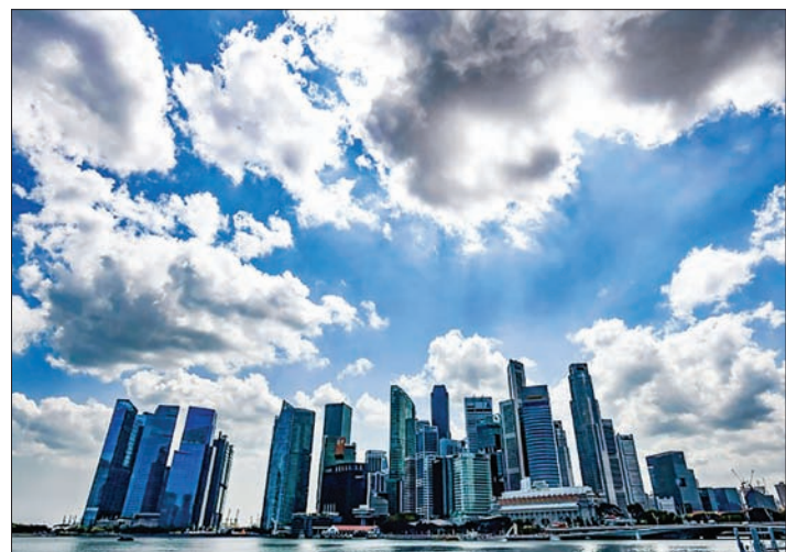
A plan to air a Mandarin version of MasterChef in Singapore has sparked anger.