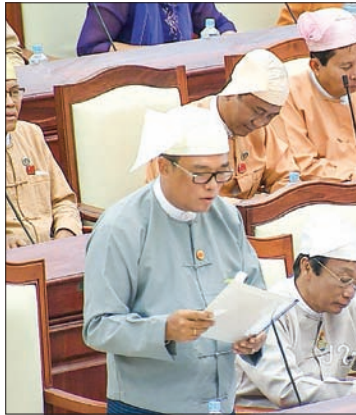
Deputy Minister for Construction U Kyaw Lin. PHOTO: MNA

Responding to a question from U Nay Soe Aung of Wuntho constituency on building a new concrete bridge to replace the Maung Kaw Bridge in Wuntho Township on the Pinlebu-Wuntho-Sinkone road, the Deputy Minister said the bridge is a 115 ft. long R.P.T reinforced concrete bridge that has a 3.66 meter wide one-way road on it. The bridge is on the planned Muse-Namkham-Hti-chaint (Dikyi) -Wuntho-Pinlebu-Phaungpyin-Tamu main road that will connect India, Myanmar and China is planned to be upgraded to a two-way road bridge. Funds to upgrade the bridge will be requested starting from FY 2018-2019 and de-