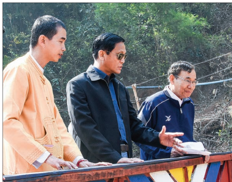
Vice President U Henry Van Thio inspects Shan Yoma elephant conservation camp.

The Vice President commented on successfully implementing the aims of the camps, and how the roads were upgraded into all-weather roads, how