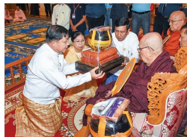
Commander-in-Chief Senior General Min Aung Hlaing and wife present offertory to a Sayadaw.