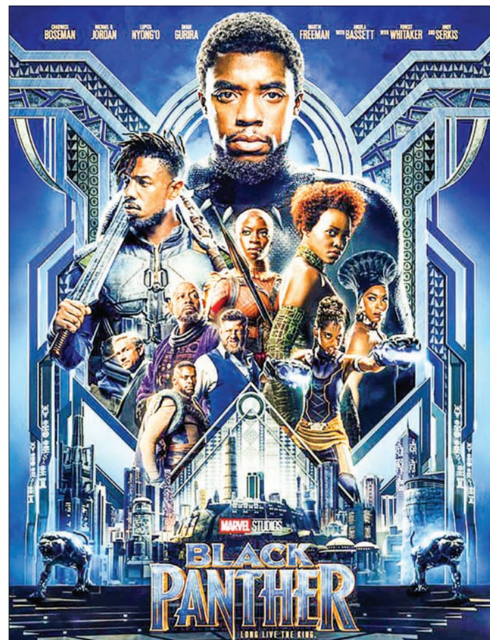
Disney's "Black Panther" has gone straight to the top of the North American box office in its opening weekend.