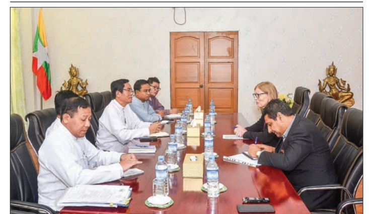
Deputy Minister U Aung Hla Tun meets with Norwegian Ambassador Ms Tone Tinnes in Nay Pyi Taw.

The event was also held in Muse in Shan State.—Myanmar Digital News ■