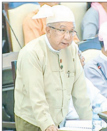
Union Minister for Construction U Han Zaw.

First, U Kyaw Kyaw of Rakhine State constituency (4) raised a question on the plan to upgrade the earthen road up to Balipyin Village on the MraukU-Mahahti concrete road section in Rakhine State, MraukU Township to a gravel road. Union Minister for Construction U Han Zaw replied that the MraukU-Mahahti concrete road was managed by the Ministry of Construction's Department of Rural Development, while the earthen road up to Balipyin Village was built by the local villagers. The Rakhine State government has submitted to the Union Government office to include this road under the list of roads managed by the Ministry of Construction, according to procedure. Meanwhile, the upgradation work on 1 mile and 1 furlong of the 4-mile and 4-furlong earthen road was started in the 2017-2018 fiscal year (FY) period, with the Rakhine State government spending Ks35 million. Some 75 per cent of the work has been completed. Once it becomes a Ministry of Construction-managed road, funds will be allocated every FY and it