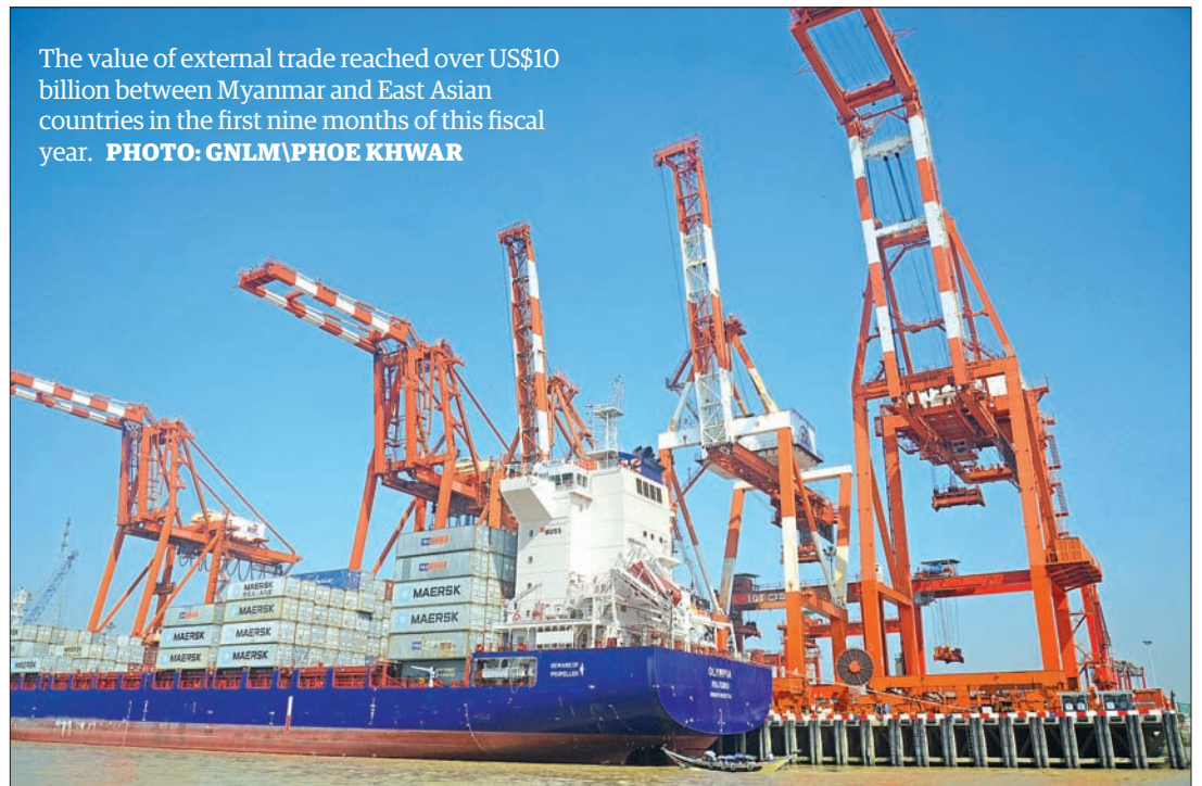
The value of external trade reached over US$10 billion between Myanmar and East Asian countries in the first nine months of this fiscal year.

The government is making sustained efforts to boost the country's international trade transactions by easing some restrictive trade rules, encouraging the private sector and promoting the manufacturing industry. —Swe Nyein ■