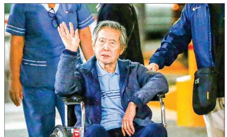
Peru's former president Alberto Fujimori, seen here on January 4, 2018, was ordered to stand trial in a new death squad case.

"Mr Fujimori now has resumed his status as a defendant, and in the case of the pardon, there was no sensible justifica-