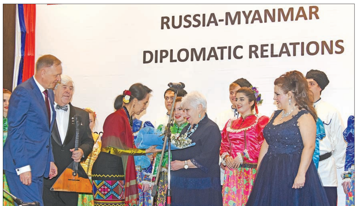
State Counsellor Daw Aung San Suu Kyi attends the 70 th anniversary of Myanmar-Russia diplomatic relations dinner in Nay Pyi Taw.