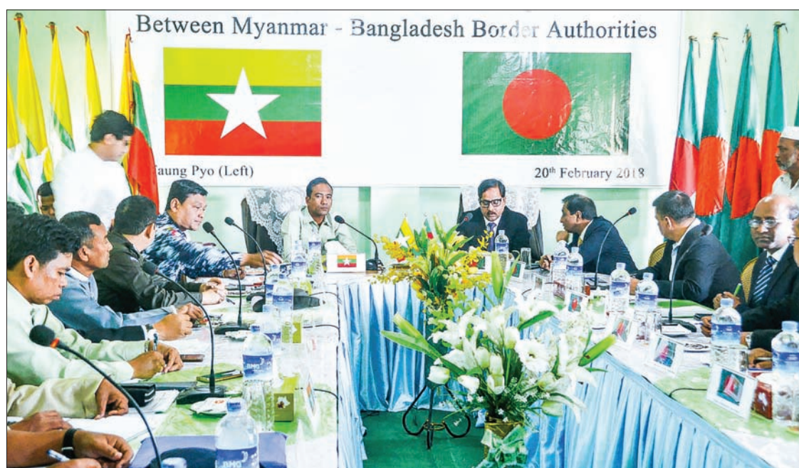
The District Level Meeting between Myanmar - Bangladesh Border Authorities.

They then inspected the Taung Pyo Letwe Reception Centre, after which the Bangladeshi party returned to Bang-