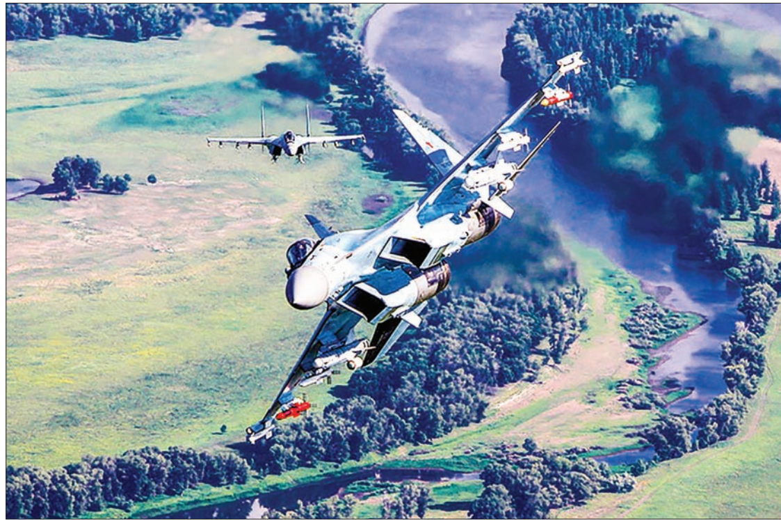
Su-35 is a Russian-made multipurpose generation 4++ super-maneuverable fighter jet.

The work on the one-seat multirole fighter jet as a deriva-