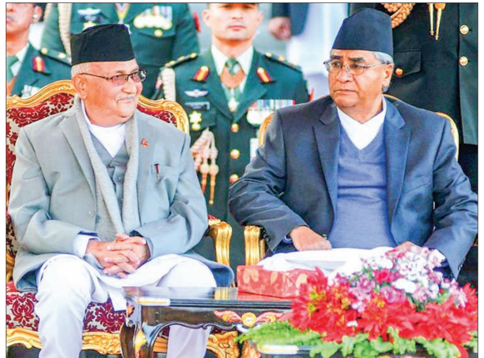
The communist party of new Prime Minister KP Sharma Oli (L) has merged with former Maoist rebels to form a new alliance.

fought government forces in a bitter civil war that claimed more than 16,000 lives and overthrew Nepal's 240-year-old Hindu monarchy, dominated politics for more than two decades. The decade-long conflict ended in a 2006 peace deal that saw guerrilla leader Pushpa Kamal Dahal become Nepal's first post-war prime minister.