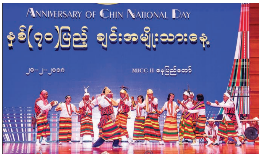
Traditional dance troupe performs Chin ethnic dance.