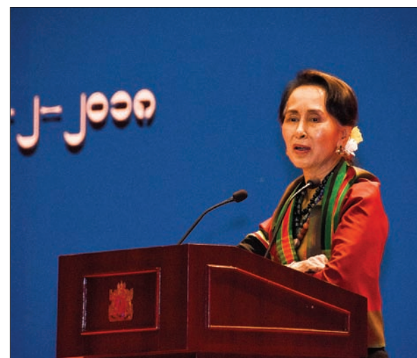
State Counsellor Daw Aung San Suu Kyi.

The celebration began with the song "The Beautiful Chin State" sung by ethnic Chin women.