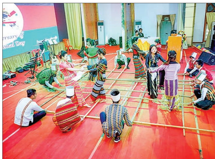
Participants perform at the ceremony to mark the 70 th anniversary of Chin National Day in Sittway, Rakhine State.

The event was also held in Sittway, in Rakhine State. "This