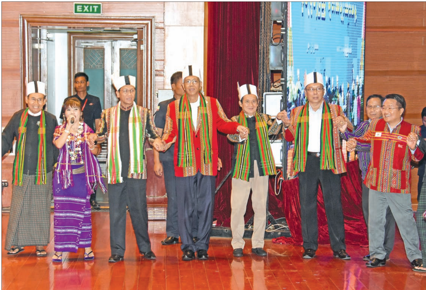
President U Htin Kyaw, centre, Vice President U Henry Van Thio, third from left, Pyithu Hluttaw Speaker U Win Myint, third from Right, Speaker of Amyotha Hluttaw Mahn Win Khaing Than, second from right, at the 70 th anniversary of Chin National Day celebration.