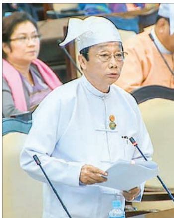
Deputy Minister for Agriculture, Livestock and Irrigation U Hla Kyaw.

Replying to a question posed by Naw Hla Hla Soe of the Yangon region constituency (10) on relocating the Taungthukone-Yodaya market in the Yangon Re-