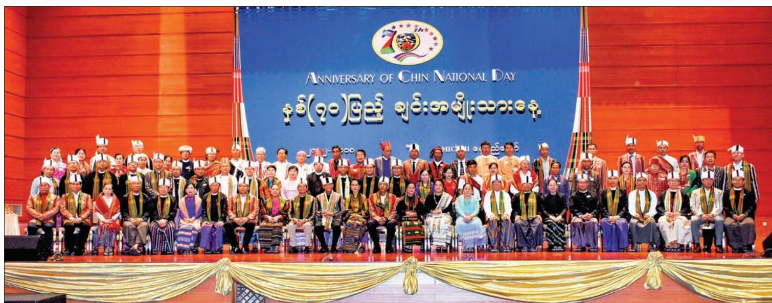
President U Htin Kyaw, First Lady Daw Su Su Lwin, State Counsellor Daw Aung San Suu Kyi, dignitaries and guests pose for the photo at the 70 th Chin National Day held in Nay Pyi Taw.

Chairman of Pyidaungsu Hluttaw's Legal Affairs and Special Cases Assessment Commission Thura U Shwe Mann and wife, Union Ministers, Union Attorney-General, Union Auditor-General, Chairman of the Union Civil Service Board, Chairman of Nay Pyi Taw Council, Governor of the Central Bank of Myanmar, Chairman of the Anti-Corruption Commission, deputy ministers, MPs, departmental heads and Chin ethnic people were also in attendance.