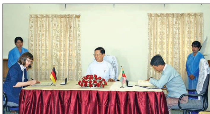
A signing ceremony of MoU between Myanmar and Germany held yesterday.

MYANMAR and Germany yesterday signed a memorandum of understanding on conserving the cultural heritage of Bagan.