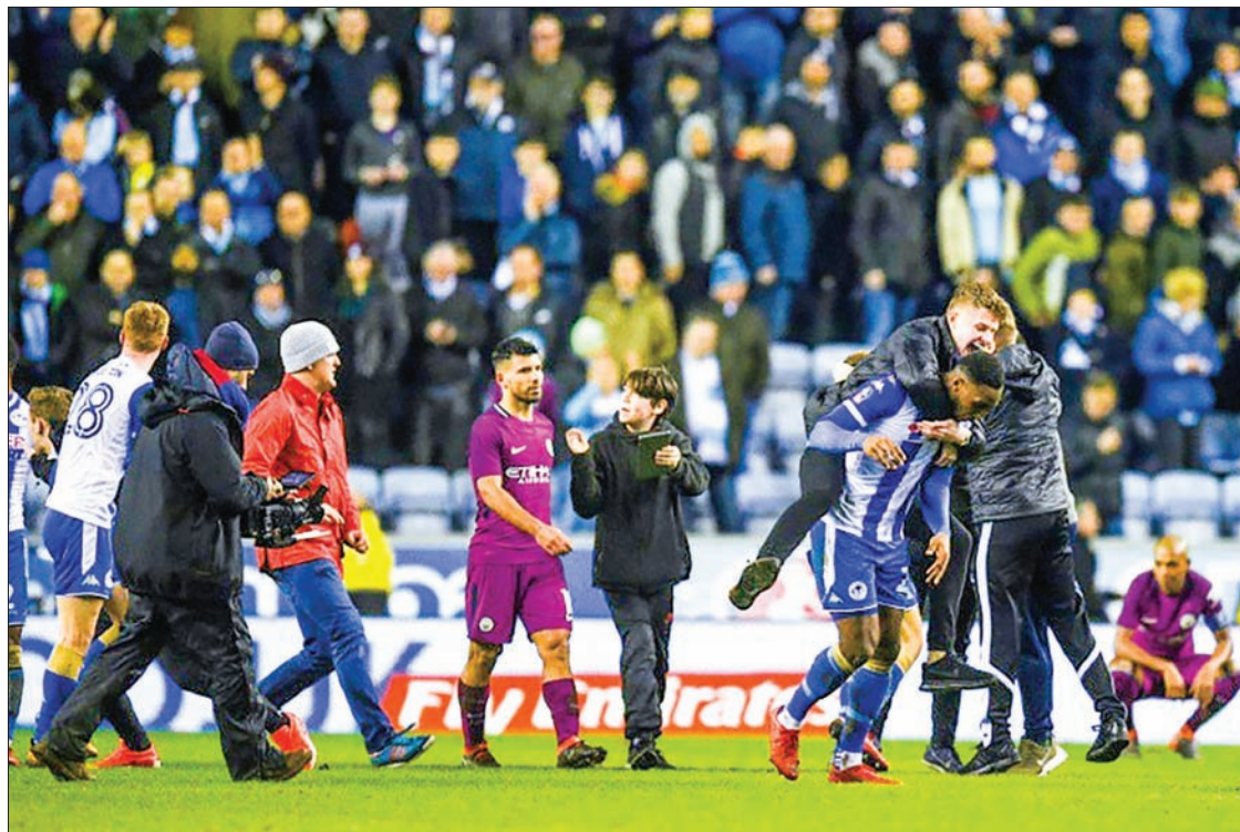
Manchester City’s Argentinian striker Sergio Aguero gets involved in a scuffle with Wigan fans.

The trouble was not over there as a number of home fans taunted the City support and, in