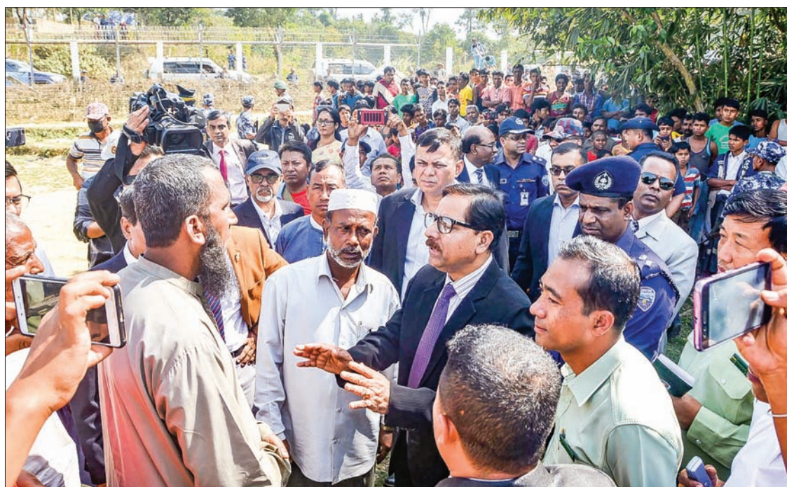
Officials of Bangladesh and Myanmar meeting with the people camping at the Zero Line at the Myanmar-Bangladesh border.