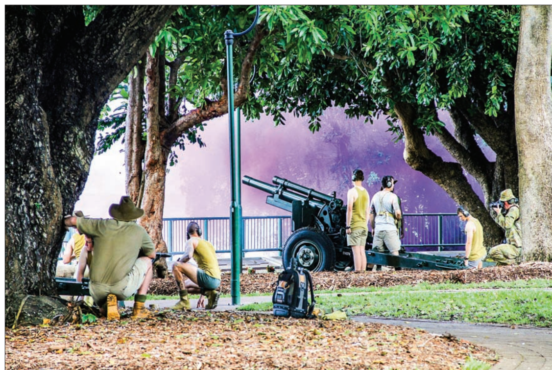
Members of the Australia Army reenact in Darwin on 19 February 2018 the local response to two Japanese air raids on Darwin, which occurred on the same day in 1942. Roughly 250 civilians and servicemen are estimated to have died in the so-called Bombing of Darwin.