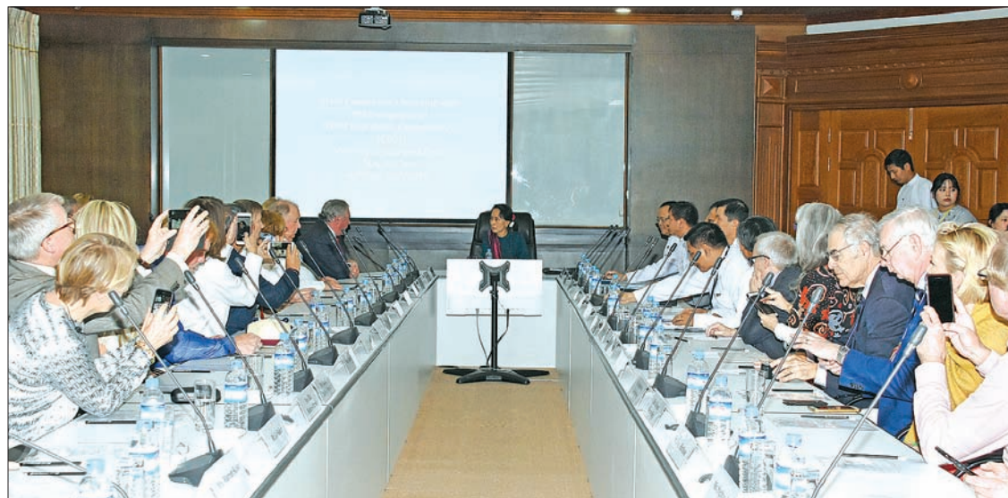
State Counsellor Daw Aung San Suu Kyi meets with international businessmen of Chief Executives Organization (CEO) in Nay Pyi Taw yesterday.

DAW Aung San Suu Kyi, State Counsellor and Union Minister for Foreign Affairs of the Republic of the Union of Myanmar, received the (61) member-delegation of Chief Executives Organization (CEO) which is composed of the international businessmen, at 12:00 hours on 20 th February 2018 at the Ministry of Foreign Affairs in Nay Pyi Taw.