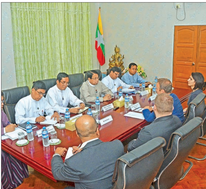
Union Minister Dr Pe Myint holds talks with the Netherlands Ambassador and party in Nay Pyi Taw yesterday.

Also present at the meeting were Deputy Minister U Aung Hla Tun and officials. — Myanmar News Agency ■