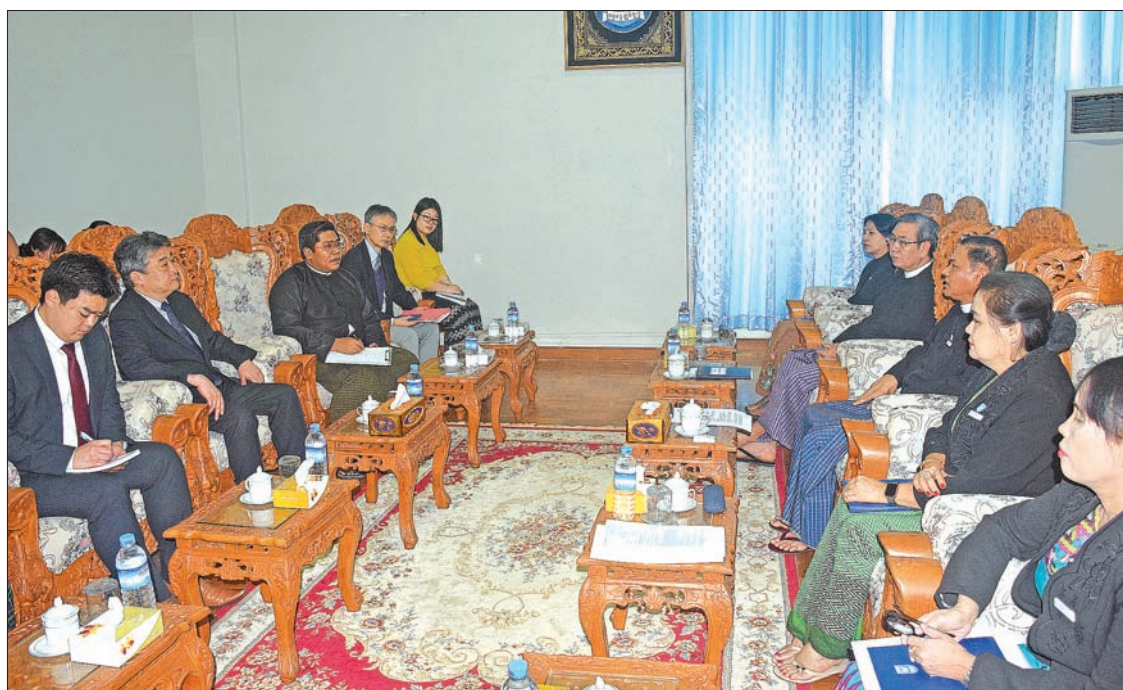
Union Attorney-General U Tun Tun Oo meets with Japan Ministry of Justice, International Cooperation Department Director yesterday.

Indawgyi Lake is one of the largest inland lakes in Southeast Asia. It has a vertical width of 14 miles, a horizontal width of seven miles and an area of almost 100 square miles. It is one of Myanmar’s important bird sanctuaries and home to many endangered species. Therefore, it is a major draw for tourists. — Salai Mang Ngai ■