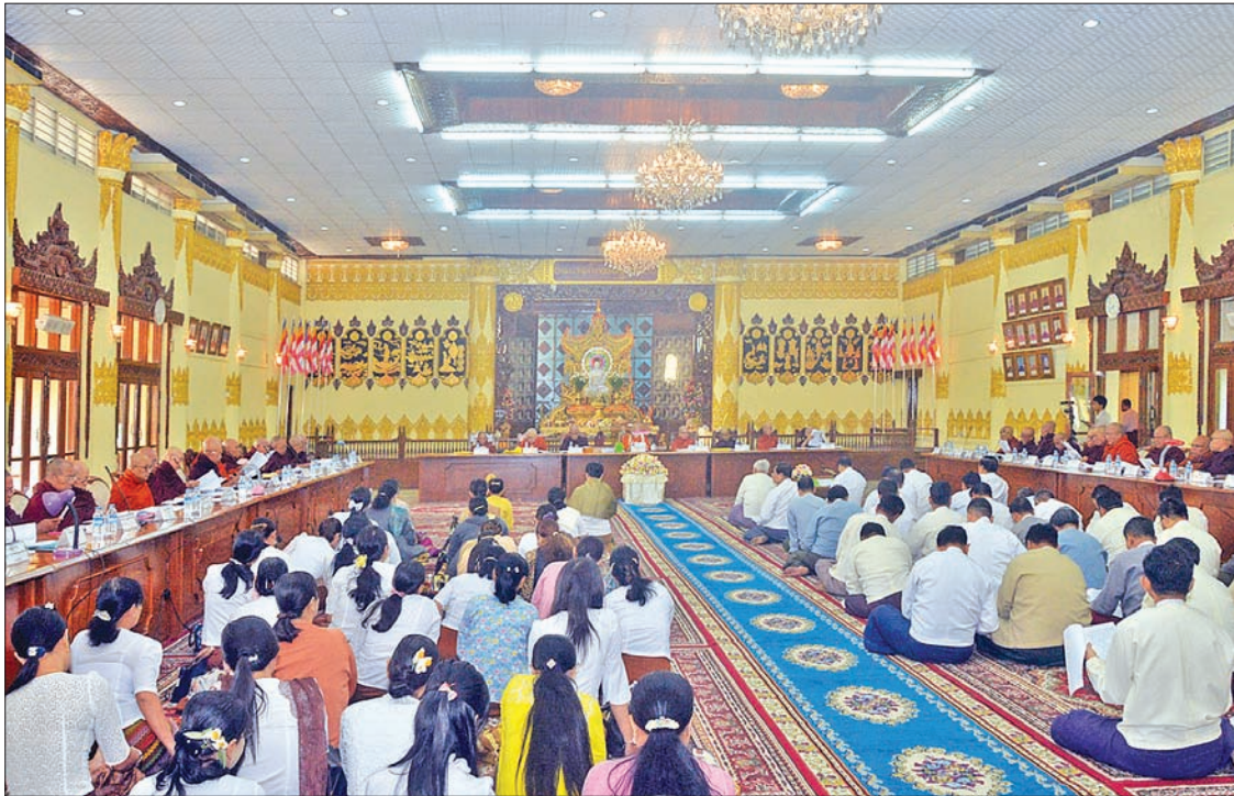
Annual meeting of the 47-member leading committee of the 7 th State Sangha Maha Nayaka Committee held at the Wizaya Mingalar Dhammathabin Hall in Yangon.

The annual meeting of the 47-member leading committee of the 7 th State Sangha Maha Nayaka Committee began at the Wizaya Mingalar Dhammathabin Hall on Kaba Aye Hill in Yangon yesterday.