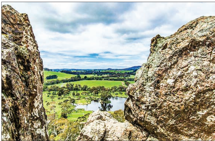
The story of the strange disappearances of three schoolgirls and their governess at a picnic in the remote Australian bush on Valentine's Day 1900 has been reimagined in a six-part TV.

Another cast member, Ruby Rees, said much of the appeal came from the many complex female characters.—AFP ■