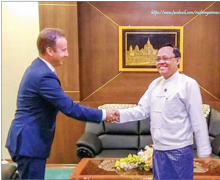
Union Minister U Kyaw Tin shakes hands with Mr. Wouter Jurgens, Ambassador of the Netherlands in Nay Pyi Taw.

Union Minister for International Cooperation U Kyaw Tin discussed topics including promoting bilateral cooperation between Myanmar and the Netherlands and providing assistance for the development of Rakhine State with the Netherlands Ambassador to Myanmar Mr. Wouter Jurgens.