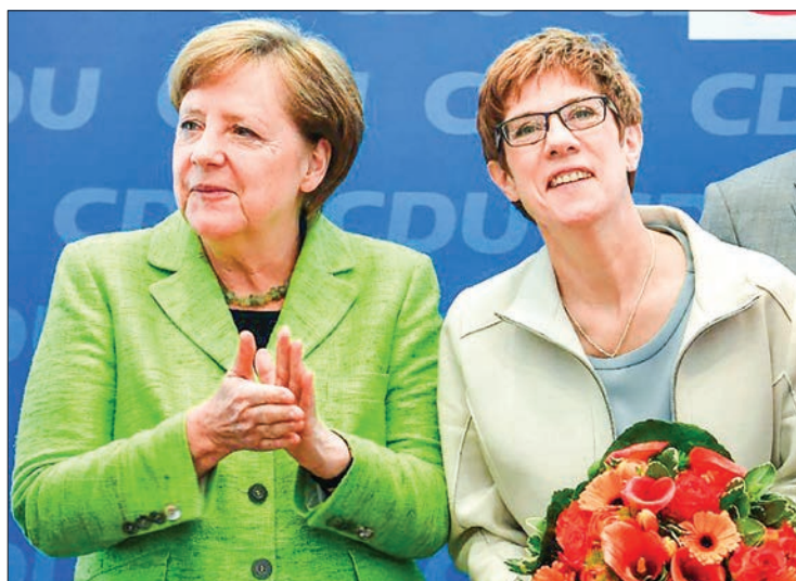
Annegret Kramp-Karrenbauer, dubbed the "Merkel of Saarland" by German media, is expected to be formally appointed to the top role next month.

The change-over comes as Merkel, in power for over 12