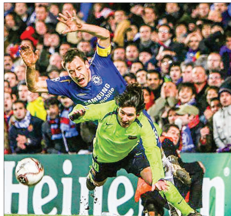
Chelsea's John Terry (L) dives over the ball with Barcelona's Lionel Messi during a Champions League game at Stamford Bridge in London in February 2006.

But the 10 men got the goal that paved the way for Guardiola's men to win the treble when Andres Iniesta fired into the top corner three minutes into stoppage time.