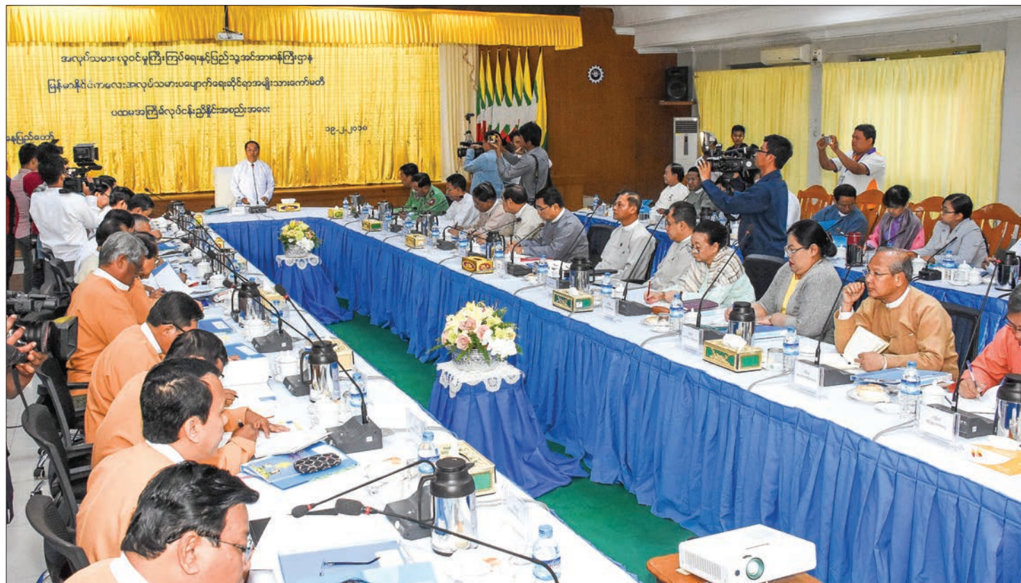
Vice President U Myint Swe addresses the Myanmar National Committee on Child Labour Eradication in Nay Pyi Taw yesterday.