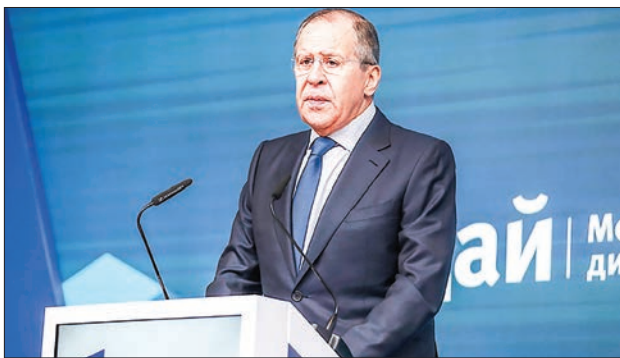
Russian Foreign Minister Sergey Lavrov.

MOSCOW — Russia condemns Tehran's remarks that Israel should be wiped off the map and also believes that solving any regional problems should not be viewed through the prism of a conflict with Iran, Foreign Minister Sergey Lavrov said on Monday. Tensions between Israel and Iran are escalating and there are historical reasons for that, Lavrov said at the opening of the Valdai International Discussion Club's conference "Russia in the Middle East: Playing on All Fields." "We have stated many times that we won't accept the statements that Israel, as