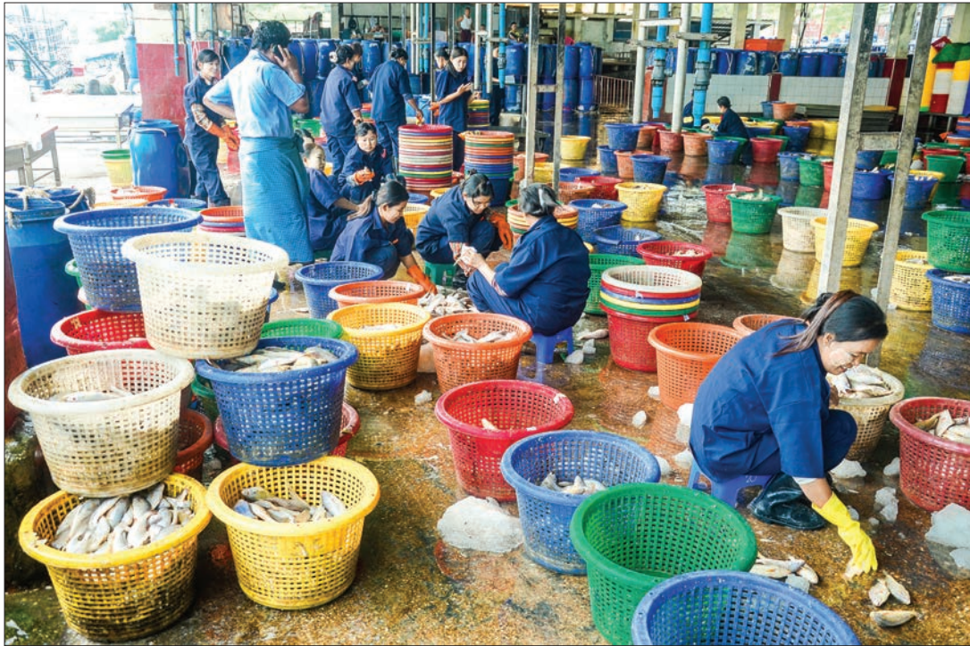
Workers sort fish at Nyaung Tan Jetty in Yangon.