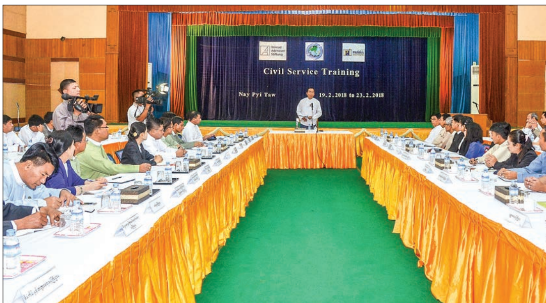
An opening ceremony of Civil Service Training held in Nay Pyi Taw.

The action plan includes four major tasks, such as protection of wild elephants and their pasture lands, solving human-elephant conflicts, prevention of and enforcing action against illegal trading of elephants and their body parts, as well as managing tamed elephants.—GNLM ■