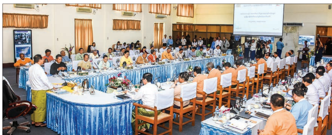
Vice President U Myint Swe delivers the speech at the Small and Medium Enterprises Development Committee meeting in Nay Pyi Taw.

He said the committee has to work hard with the central committee's guidelines for sustainable development of the 99 per cent of the SMEs across the country. He said a holistic way of viewing is needed when addressing the challenges and