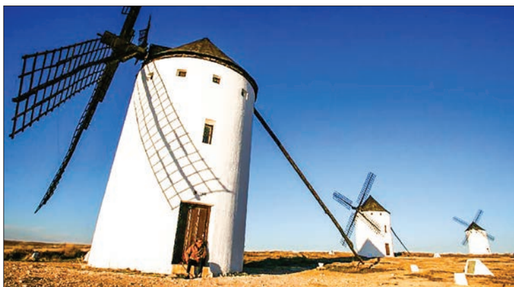
Some of La Mancha's windmills, immortalised in Miguel de Cervantes' masterpiece Don Quixote.