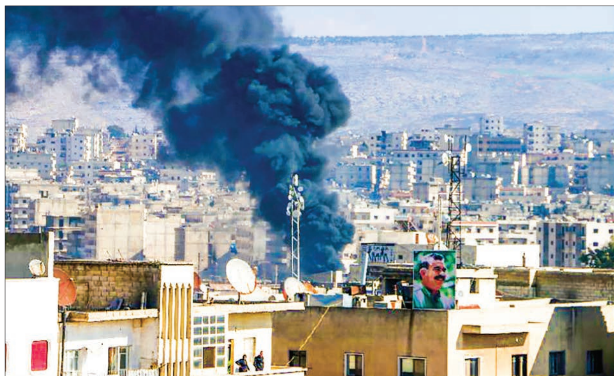
Smoke is seen billowing from the northern Syrian Kurdish town of Afrin where Turkey launched an offensive against the Kurdish People's Protection Units (YPG) militia.

DAMASCUS — Pro-government fighters will enter Syria's Afrin "within hours" to take a stand against a Turkish-led offensive on the enclave, state media reported on Monday.