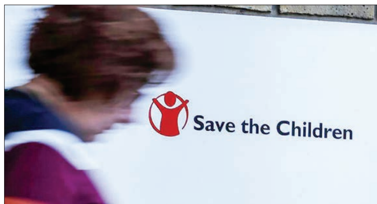
Save the Children is also facing problems after claims a staff member drunkenly harassed a female colleague in 2015.

A senior executive has resigned and the British government has warned it must reform before bidding for any new taxpayer funds. Oxfam has denied trying to cover up the allegations but admitted it could have been