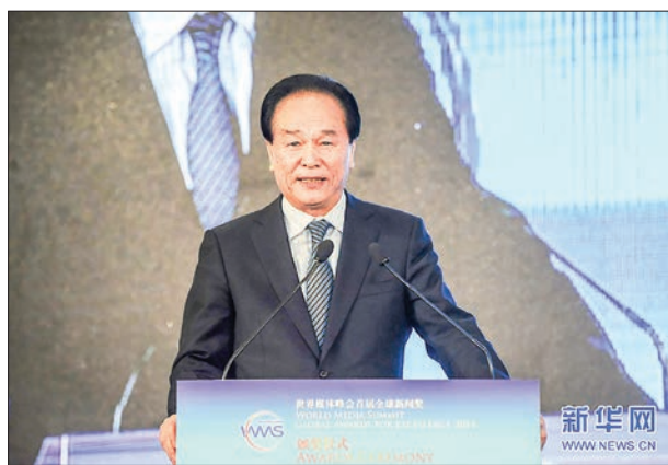
President of Xinhua News Agency Cai Mingzhao.

to improve investigative reporting, report innovative and creative efforts made by the people, and reflect the people's wishes and voices. The article also underscored the importance of truthfulness.