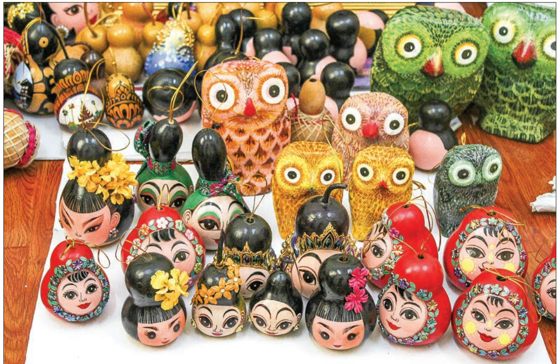
Bottle gourds painted in the Myanmar traditional style displayed at the market.

She bought the gourds at the pagoda festival. A dried bottle gourd is priced from Ks.2000 to 5000 depending on the size and quality. It takes four days to turn out a bottle gourd painted with a beautiful face. She cleans the gourds and makes them dry before