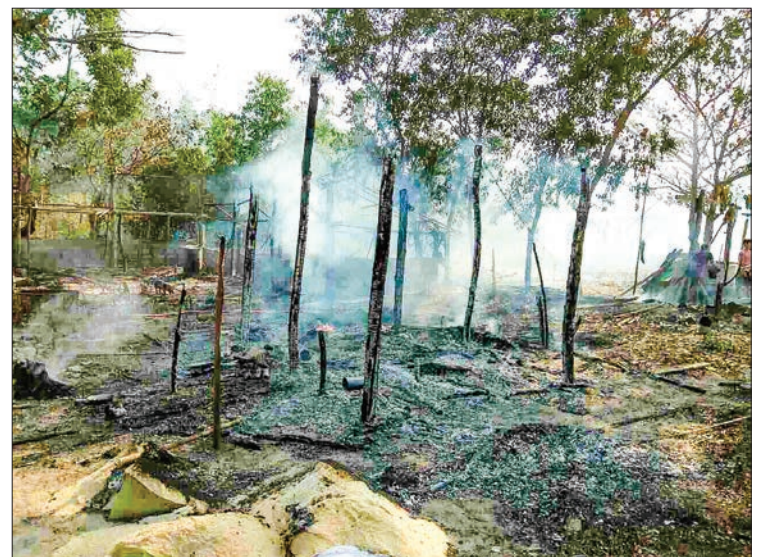
Poultry farms destroyed by fire in Hpa-an Township, Kayin State.

With the assistance of residents, firefighters controlled the blaze by 5.30 p.m. on Saturday. ■