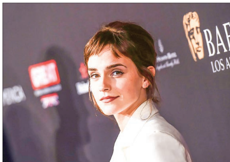
Actress Emma Watson has made a £1 million donation to launch a new British fund to help women facing harassment and abuse at work.

The letter is addressed to "dear sisters" — as was a similar missive signed by Hollywood stars last month — and calls for an international movement to stamp out a culture of abuse exposed by the Harvey Weinstein scandal. The fundraising page for the new fund shows