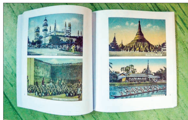
Photographs in “Burmese Photographers” published by Australian Photographer.