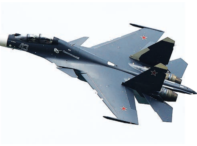
Su-30SM multirole fighter aircraft.