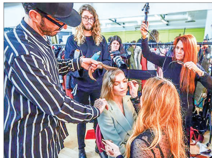
Buyers, journalists, bloggers, fashionistas and other Fashion Week VIPs have flocked to London to view the latest collections.

"Artisanship of leather at its most delicate expression," proclaims the collection's literature.—AFP ■