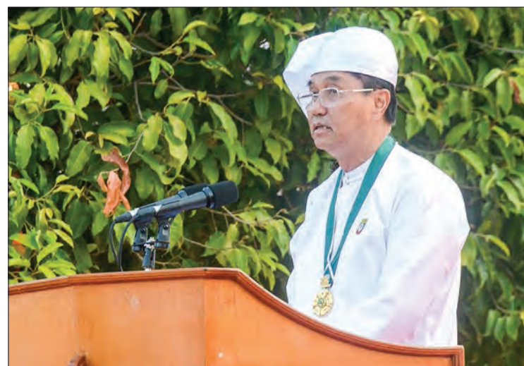
Vice President U Myint Swe reads the message sent from President U Htin Kyaw to 71st Anniversary Union Day celebration.

Afterwards, the Vice-President and those in attendance saluted the state flag, while the