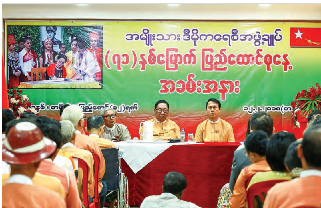
The 71 st Anniversary Union Day ceremony held at the National League for Democracy (NLD) headquarters yesterday.

Afterwards, a four-point 71 st Anniversary Union Day