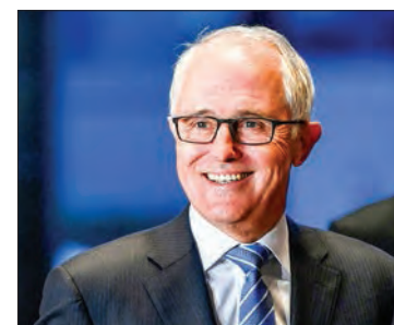
Australian Prime Minister Malcolm Turnbull had long resisted calls for an inquiry, but mounting political pressure forced his hand.

The issue, which China characterizes as a dispute between Washington and Pyongyang, is attracting international attention as a major security concern.—Kyodo News