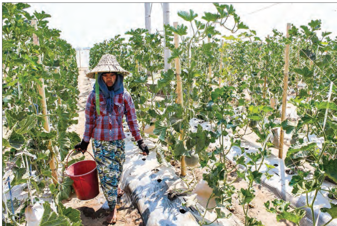
A farmer works in the muskmelon farm in Nay Pyi Taw.