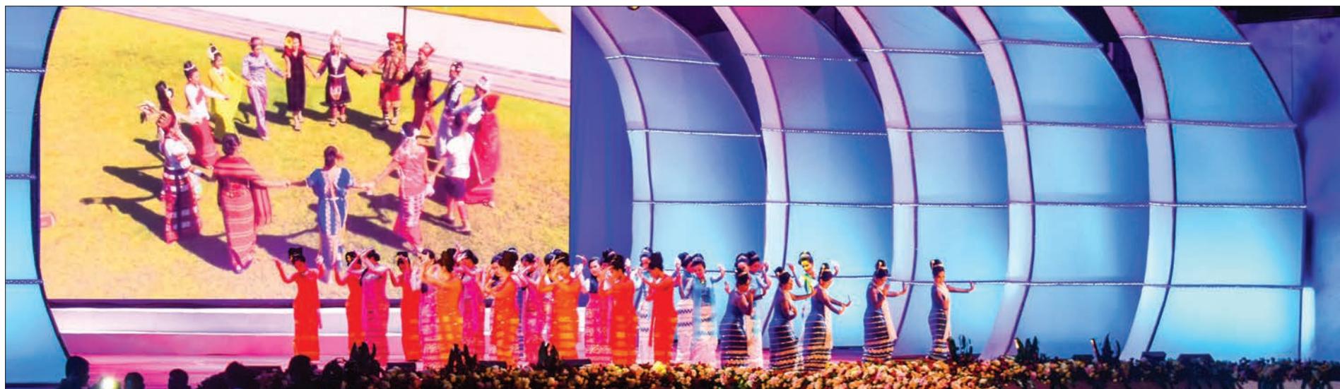
Cultural dance troupe performs at the dinner in commemoration of 71 st Anniversary Union Day in Nay Pyi Taw yesterday.