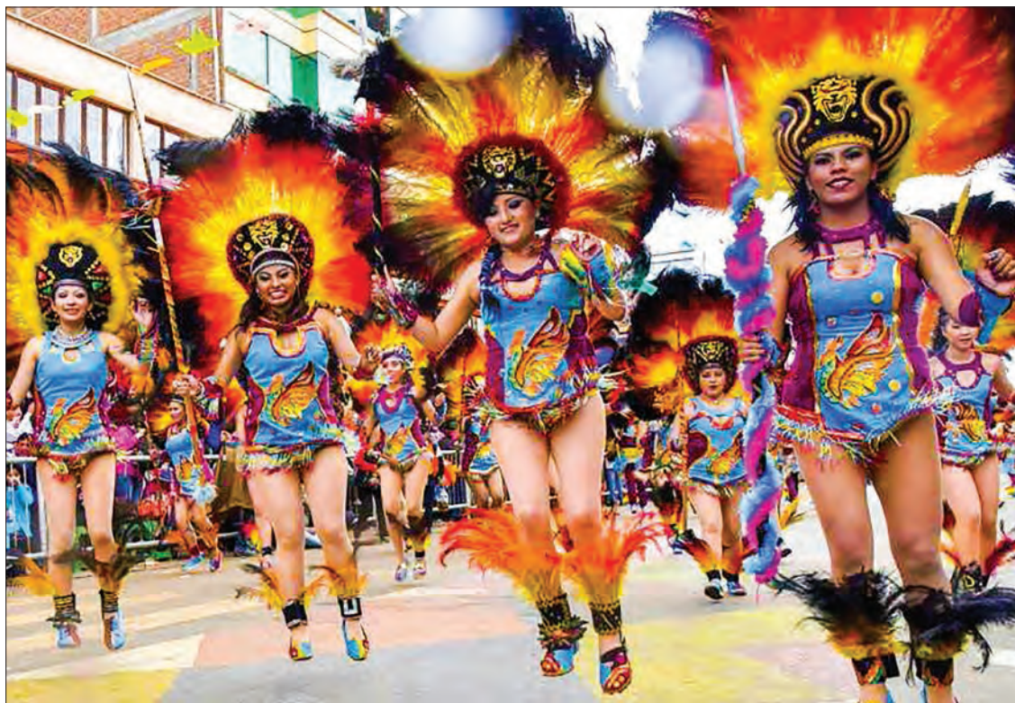
Dancers take part in Oruro Carnival.

In 2001, the UNESCO cultural organization declared the carnival an intangible cultural heritage of humanity.—AFP ■