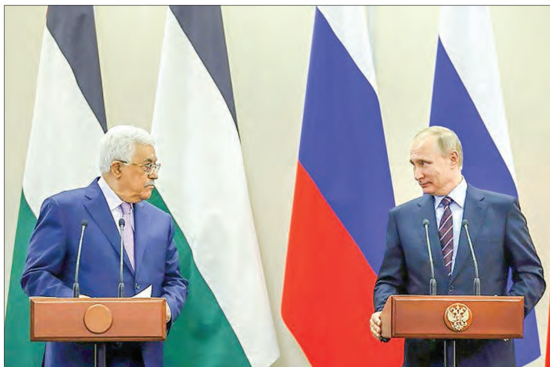
Palestinian leader Mahmud Abbas, pictured here with Vladimir Putin in May 2017, is seeking the Russian president's support following Washington's recognition of Jerusalem as Israel's capital.

The US Ambassador to the UN, Nikki Haley, has accused Abbas of lacking the courage needed to forge a peace deal with Israel.