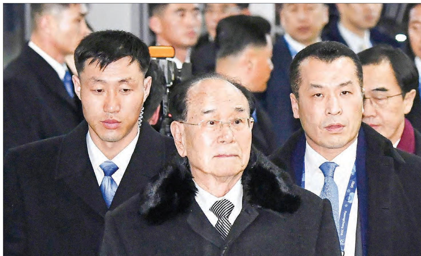
Kim Yong Nam (C), president of the Presidium of the Supreme People's Assembly of North Korea, arrives at Gangneung Station in South Korea on 10 February, 2018, to watch a women's preliminary round ice hockey game between the unified Korean team and Switzerland at the Pyeongchang Winter Olympics.

While it can authorise police to apply for search warrants and witnesses who fail to appear may be arrested, it is not able to order compensation to those affected by any wrongdoings.—AFP