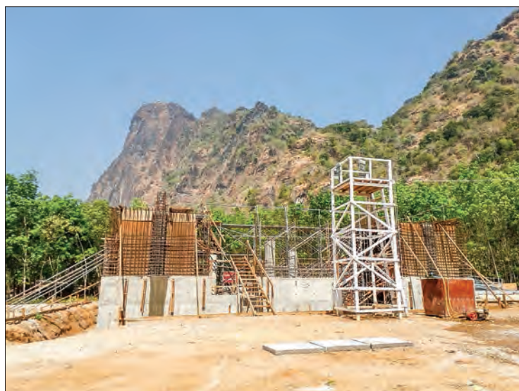
The construction site of Zwekabin cable car project in Kayin State.

He continued that "Zwekabin Mountain is located seven miles south of Hpa-an and is 2,734 feet above sea level.