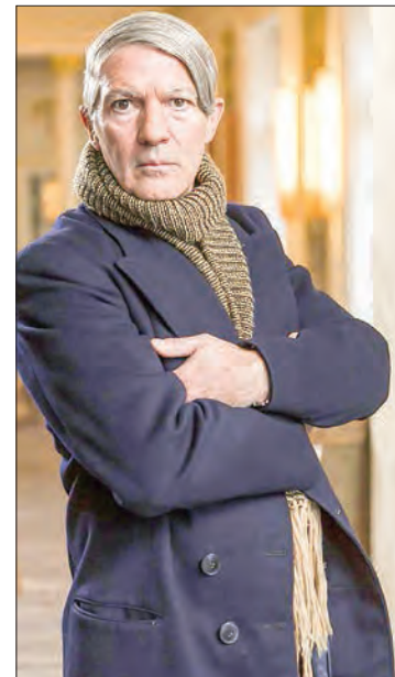
Antonio Banderas as Picasso.

"I cannot compare myself with the most important artist of the 20th century, it would be stupid and ridiculous," said Banderas, who plays the artist in his later years, spending five hours a day in makeup before he steps onto the set.—AFP ■