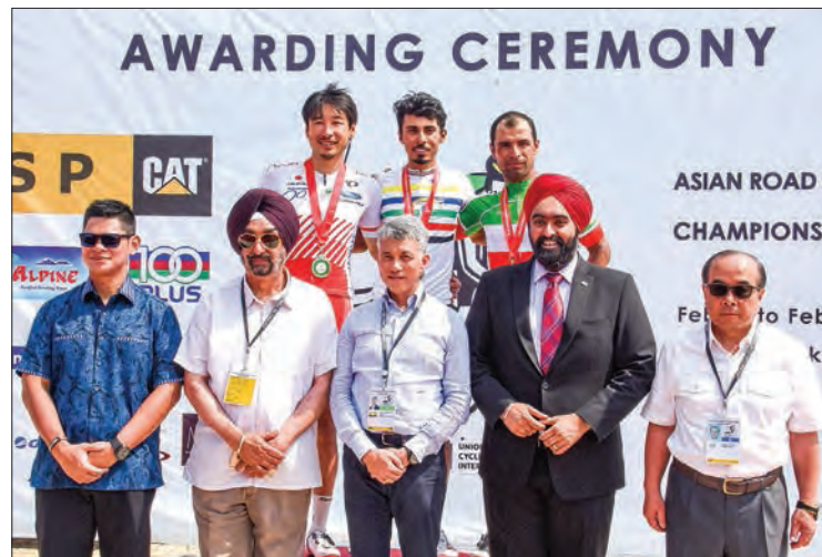
Winners and officials pose for a documentary photo.