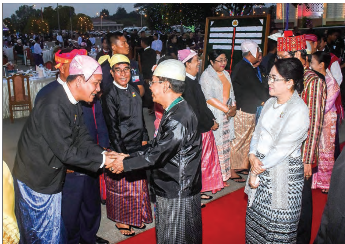
Vice President U Myint Swe greets dignitaries who attend the dinner in commemoration of 71 st Anniversary Union Day.