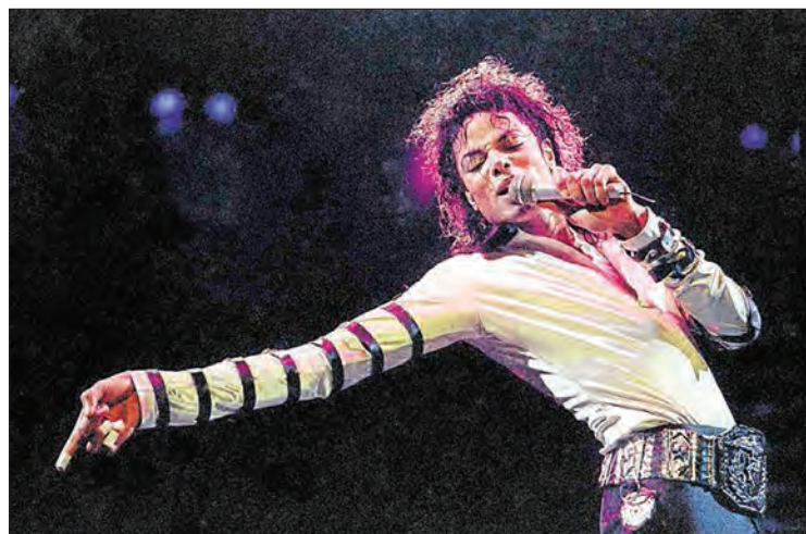
Michael Jackson's own music producer, Quincy Jones, says the late King of Pop plagiarized some of his hits.

"The notes don't lie, man. He was as Machiavellian as they come," the 84-year-old music veteran said. He specifically cited "Billie Jean" — a signature song off the Jones-produced "Thriller,"