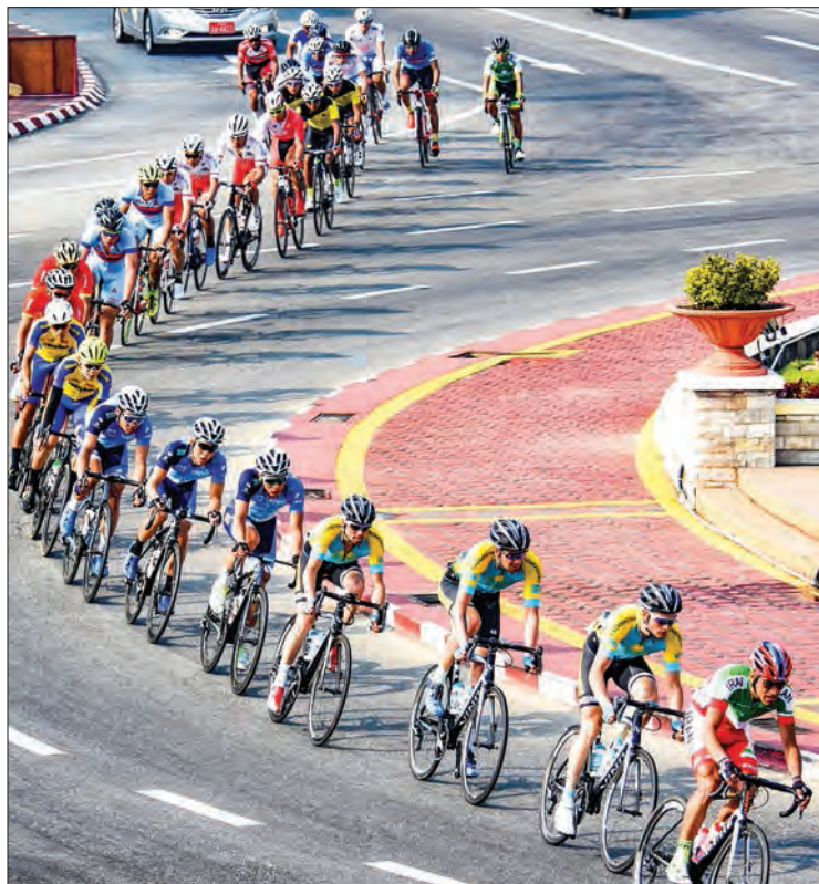
Cyclists compete in the Individual Road Race Men Elite competition at the 2018 Asia Road and Para Cycling Championships.

China came in second with 3 gold and 2 silver medals, while Hong Kong came in third with 2 gold, 5 silver and one bronze medal. ■