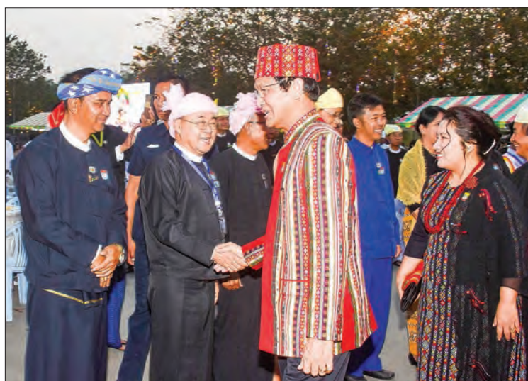
Vice President U Henry Van Thio greets ethnic people who attend the dinner in commemoration of 71 st Anniversary Union Day.