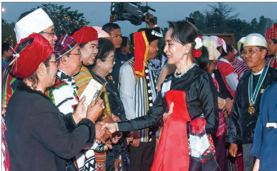
State Counsellor Daw Aung San Suu Kyi greets ethnic people at the dinner in commemoration of the 71 st Anniversary Union Day in Nay Pyi Taw yesterday.

After the dinner, the guests were entertained by artists from the Ministry of Religious Affairs and Culture, Department of Fine Arts and states/regions cultural dance troupes in the City Hall open-air stadium. —Myanmar News Agency ■