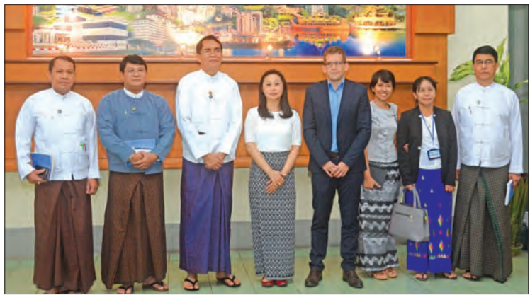
Deputy Minister U Aung Hla Tun (3rd from Left), and officials pose for photo with Ms. Min Jeong Kim, head of UNESCO Office Myanmar. PHOTO: MNA

Hlaing and his delegation attended the Singapore Airshow 2018 at Changi Exhibition Centre and had a look at the military aircraft, helicopters and military cargo aircraft on display. They also watched aerial performances by the 2018 flying display teams at the exhibition.-Myanmar News Agency