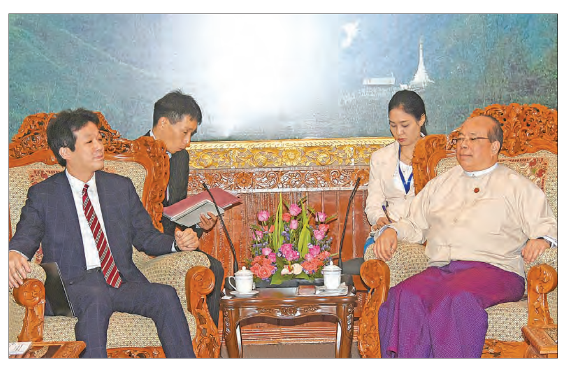
Union Minister for the Office of the Union Government U Thaung Tun meets Special Advisor to the Prime Minister of Japan (National Security) Mr. Kentaro Sonoura in Nay Pyi Taw.

U Thaung Tun, Union Minister for the Office of the Union Government, received Special Advisor to the Prime Minister of Japan (National Security), Mr. Kentaro Sonoura at 11 am