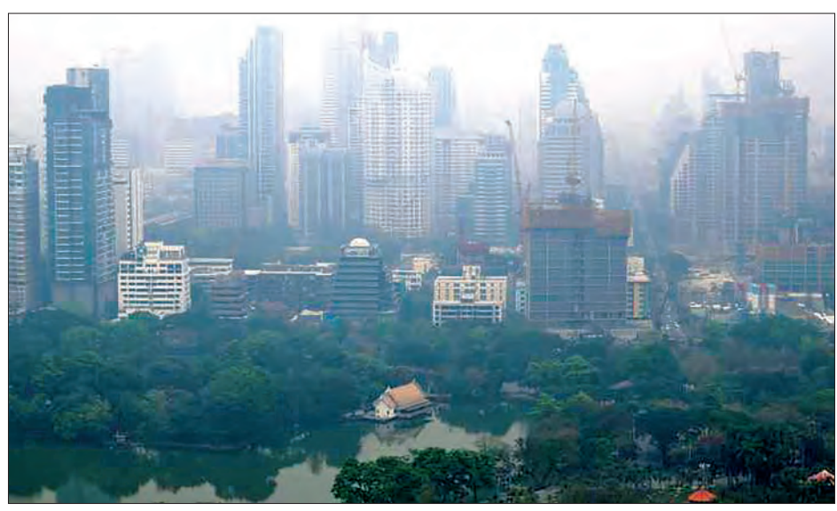
The skyline is seen through morning air pollution in Bangkok, Thailand 08 February 2018.

"We've received information from my daughter's