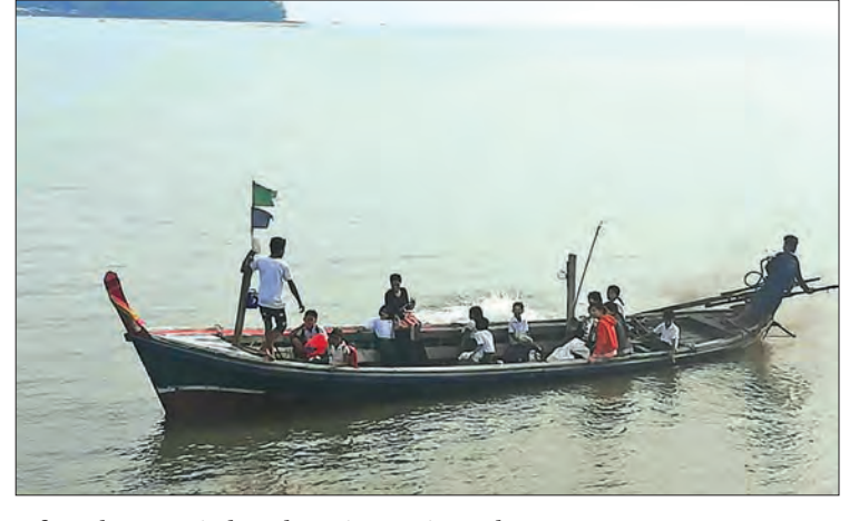
A ferry-boat carried students is seen in Andaman sea yesterday.

Children who live in villages near the sea went to school by ferry boat because some of the villages do not have post-primary schools. Relevant organizations should provide life-jackets, umbrellas and raincoats to those who have a difficult time commuting to school by ferry boat in addition a new school should be opened in Warkyun village that's affiliated according to the voices of the local residents.—Myanmar Digital News ■