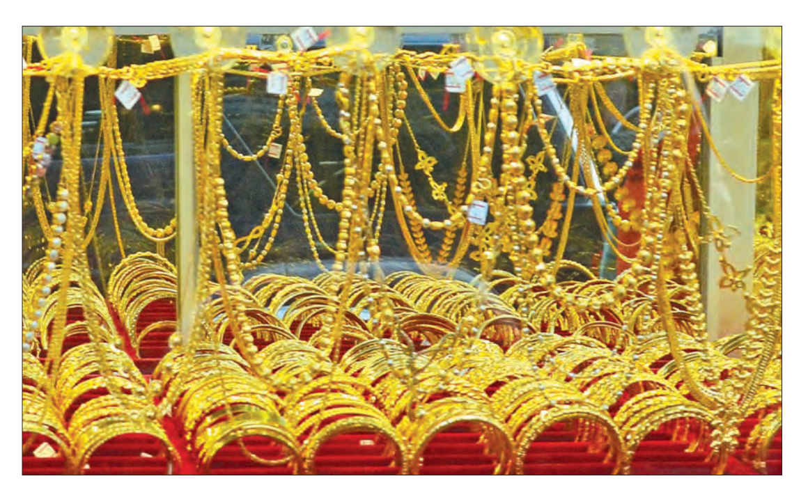
Gold jewellry displayed at a shop in downtown Yangon.