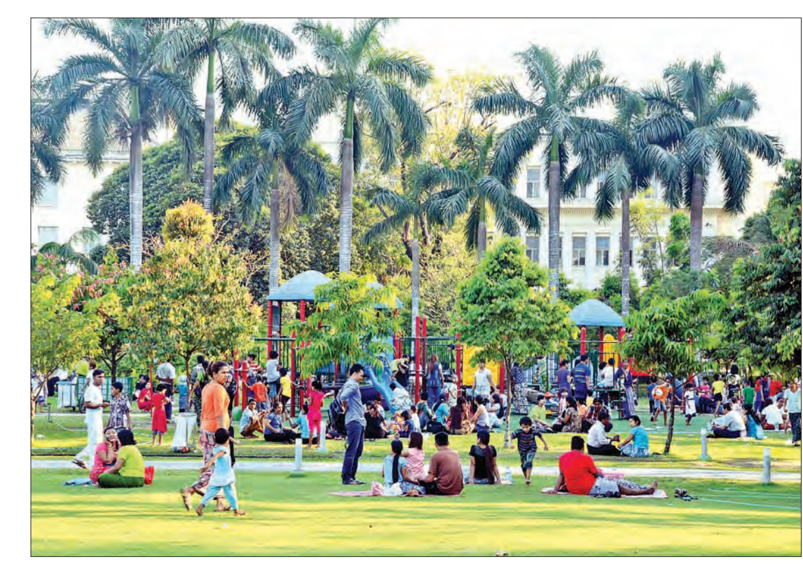
People relaxing on lush green floor at Maha Bandula Park in Yangon.

The major destination for the week is Shwe Sattaw Pagoda and Mawtin Soon Pagoda, and people are showing increased interest with travel packages to Dawei. After the matriculation exams there will be more travelling to Chin and Kachin states, specifically Myitkyina. —Zaw Gyi, Ohnmar Thant, Myat Sandi ■