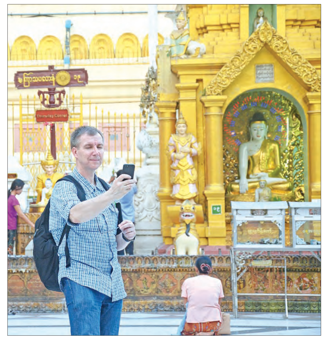
A toursit takes a photo with his smart phone at Shwedagon Pagoda in Yangon.

The entrance fees for the Shwedagon pagoda increased to Ks10,000 on 1 December 2017 from Ks8,000. —GNLM