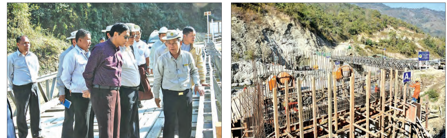
Vice President U Henry Van Thio inspects the construction site of Chichaung Bridge situated on the Kanpetlet-Mindat Road.

the second biggest hydro-electric project in the country. This project will greatly support the development of the country and its people and will be dependable for development of Chin State too. Local people need to understand the efforts made by the government and participate together in it. Only then can the fruits of development will be rapidly achieved", said the Vice President.