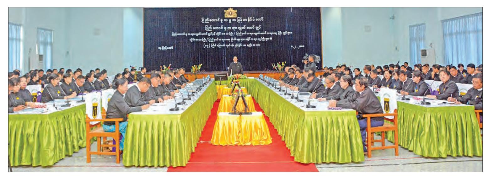
Union Chief Justice U Htun Htun Oo addresses the 14<sup>th</sup> coordination meeting of the Union Supreme Court and states/regions High Courts.

"Freedom of the courts, integrity of the judges, impartial court processes and trust of the people on the courts' effective-