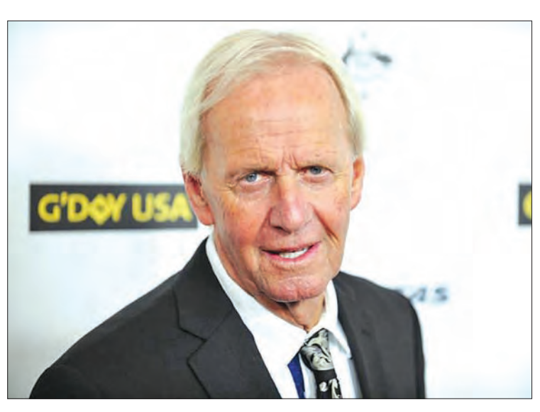
Australian actor Paul Hogan arrives during the G'Day USA Black Tie Gala in Los Angeles, California on 11 January 2014.

The movie was a commercial and critical hit, garnering the Australian actor a Golden Globe Award for best actor and an Acad-