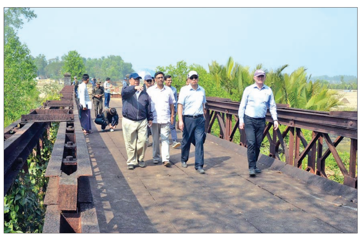
Union Minister U Thaung Tun and ambassadors stroll on the friendship bridge between Myanmar and Bangladesh during their trip to Maungtaw.