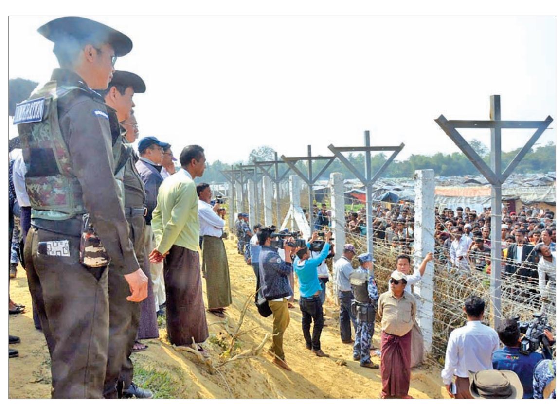
Diplomats and officials meeting with local residents camping at the Zero Line at the border.