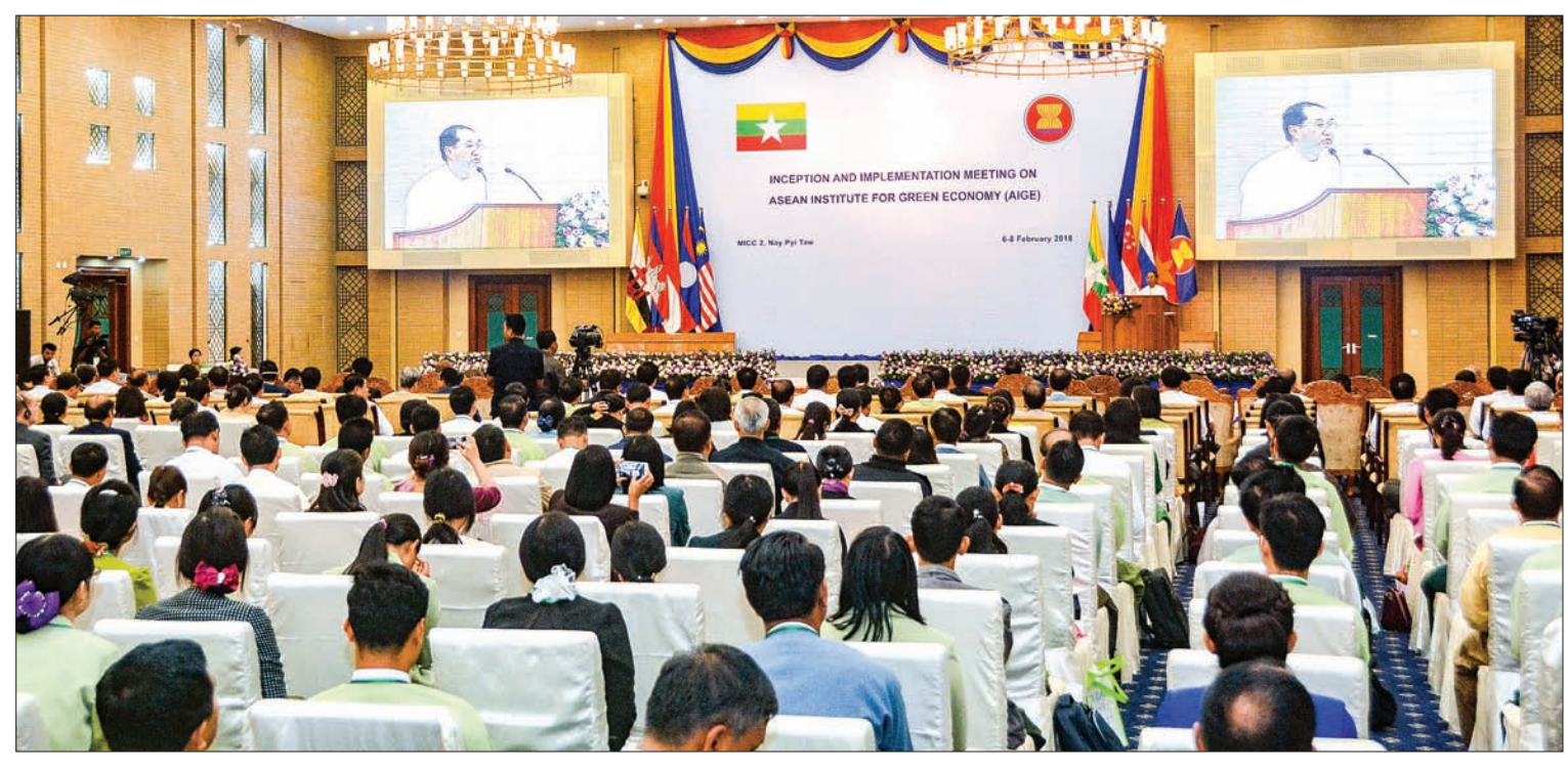
Vice President U Myint Swe delivers the speech at the opening ceremony of the Inception and Implementation Meeting of the ASEAN Institute for a Green Economy at MICC-2 in Nay Pyi Taw yesterday.

As ASEAN member countries increase the implementation processes of sustainable development, AIGE is expected to do more for policies and practices