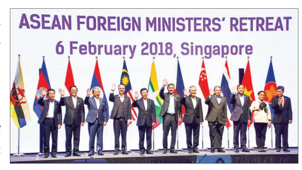
ASEAN foreign ministers pose for a photo in Singapore on 6 February, 2018, as the Association of Southeast Asian Nations discussed issues such as that of Rohingya Muslims in Myanmar.

Besides helping the 10-member Association of Southeast Asian Nations navigate the intensifying showdown between outside powers like the United States and China, the envisioned final statement would be designed to help member nations adapt to rapid technological changes. A draft document was presented to ASEAN foreign ministers at their two-day meeting ending on Tuesday. When it was discussed at a working dinner on Monday night, the ministers all looked to be "supportive," said an ASE-AN official, who declined to