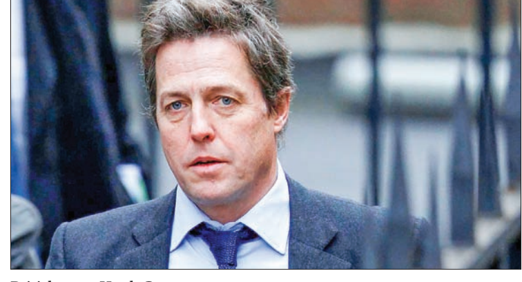
British actor Hugh Grant.

was on the News of the World, a Sunday tabloid owned by Rupert Murdoch which the media mogul shut down at the height of the scandal.