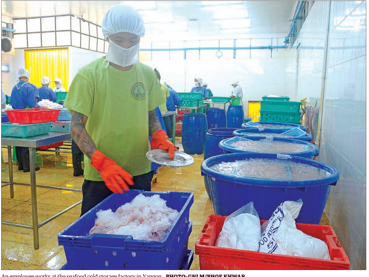
An employee works at the seafood cold storage factory in Yangon.

Myanmar exports its goods via sea and border trade gates. Exports through the sea route fetched some $7.16 billion, while $4.26 billion worth of exports flowed into neighbouring countries via the border trade gates.— Mon Mon