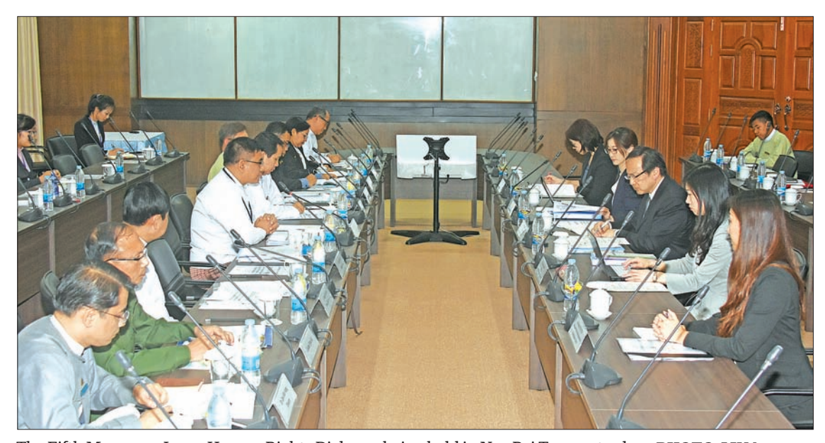
The \ Fifth \ Myanmar-Japan \ Human \ Rights \ Dialogue \ being \ held \ in \ Nay \ Pyi \ Taw \ yesterday. \