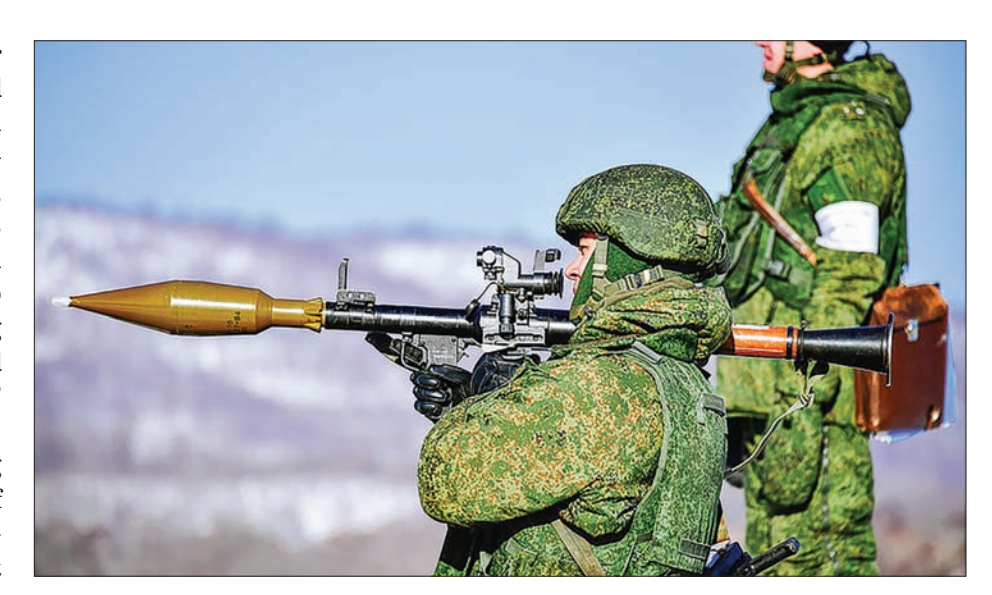
A division that is dealing solely with electronics and non-standard munitions has been set up, the company's chief executive says.

This work is being conducted at the level of creating the technological groundwork, without setting specific tasks, he said.—Tass