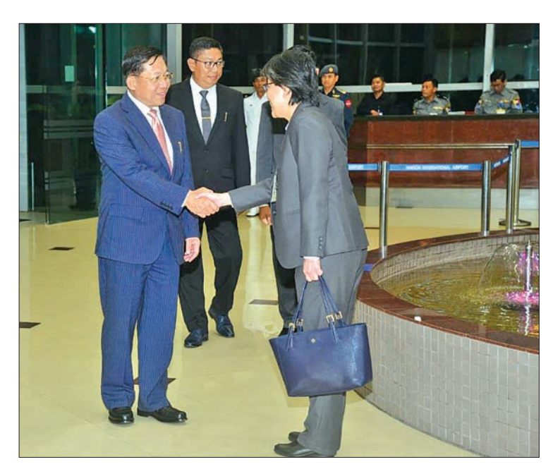
Senior General Min Aung Hlaing is seen off by Singaporean diplomat as he departs for Singapore Airshow 2018.