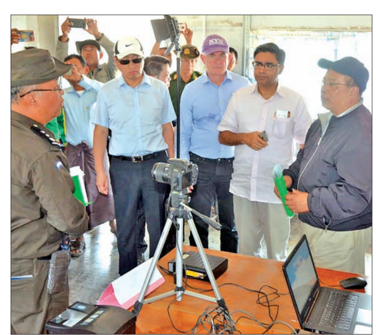
Union Minister U Thaung Tun and diplomats views readiness for scrutinisation at a repatriation camp in Maungtaw.

Myanmar was ready to launch the repatriation of returnees from Bangladesh as of 23 January with two camps and one transit camp established.— Myanmar News Agency ■