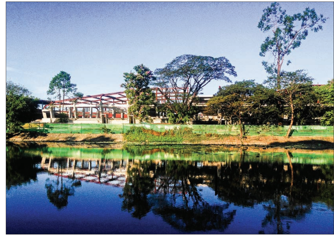
The construction site of the fish aquarium seen at Kandawgyi Lake in Yangon on 22 January. This fish aquarium was started to construct in 2016 and expected to open in April 2018.

Due to limitation of space we are only able to publish "Letter to the Editor" that do not exceed 500 words. Should you submit a text longer than 500 words please be aware that your letter will be