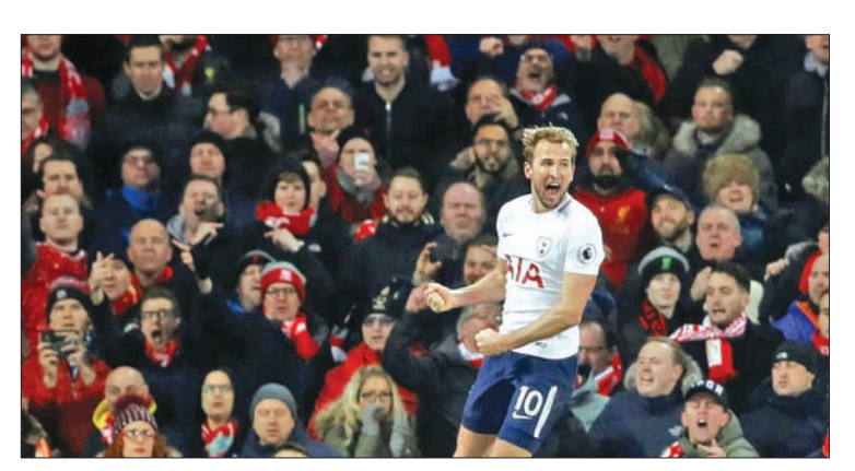
Tottenham's Harry Kane.

LONDON — Tottenham Hotspur striker Harry Kane has dismissed claims that he dived for a penalty made by Liverpool's Virgil van Dijk following Sunday's pulsating 2-2 draw at Anfield.