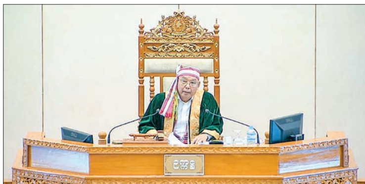
Speaker of Amyotha Hluttaw Mahn Win Khaing Than.

First, U Kyaw Kyaw of Rakhine State constituency (4) questioned the progress of the work and how much longer it would take to complete the Ponnagyun Industrial Zone that has been under implementation for six years, since the first Pyithu Hluttaw took place. Union Minister for Industry U Khin Maung Cho said the industrial zone was earmarked to be constructed on 1,963.74 acres of land along the eastern part of Yangon-Sittway road in Rakhine State, Sittway District, Ponnagyun Township. During the previous government's time, it was designated and permitted as Industry Zone No. (22). Supreme Development Co., Ltd. and Myanmar Kyauk Phyu