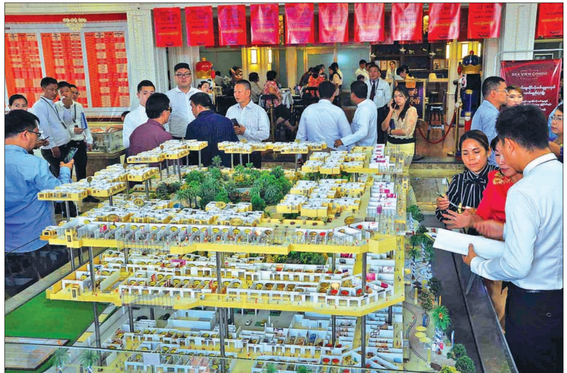
Visitors view model of apartment blocks at sea view condominium sales room in Myeik, Taninthayi Region.

At the project, there are 168 shops in the walking street market and 111 have been sold. The estimated price of a shop is from 40 million to 400 million. The customer can buy on hire purchase because the company is linked to Cen-