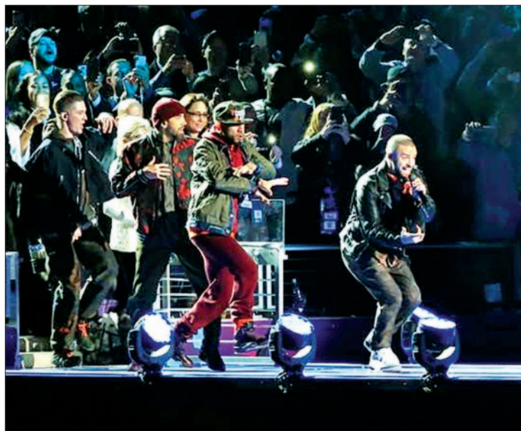
Justin Timberlake performs during half time of Super Bowl LII between the New England Patriots and the Philadelphia Eagles at US Bank Stadium in Minneapolis, MN, USA on 4 February, 2018.

The only major piece of clothing that came off this time