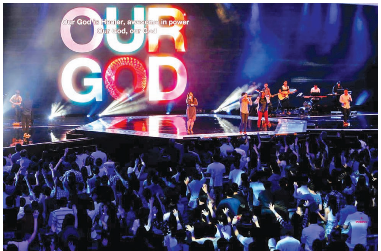
Worshippers attend a church service at the City Harvest Church in Singapore on 1 March, 2014.

The government of Nepal has also been marking 15 th Baisakh as per the Nepali calendar as National Tea day. —Xinhua ■