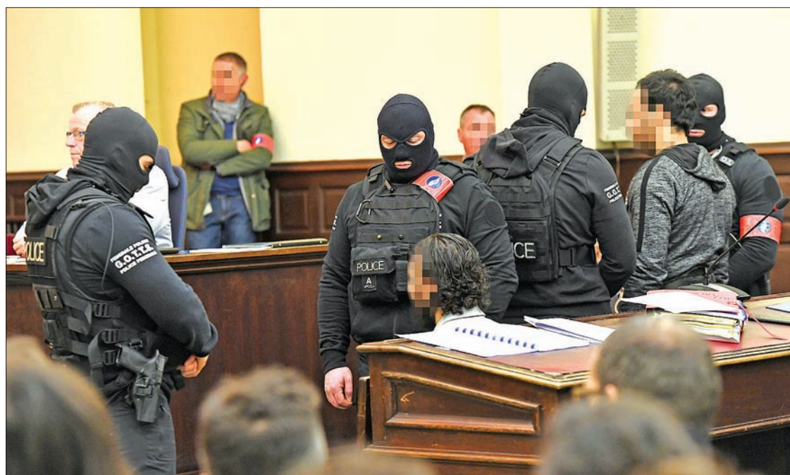
Salah Abdeslam, one of the suspects in the 2015 Islamic State attacks in Paris, appears in court during his trial in Brussels, Belgium on 5 February, 2018.

Citing his right to silence and declaring his Muslim faith, he accused the media of con-