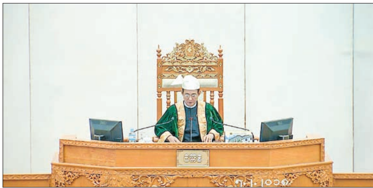
Speaker of Pyithu Hluttaw U Win Myint.

Union Minister U Thein Swe added that according to records, a race census was made by the British government in 1911, 1921 and 1931, prior to independence, and censuses were collected after independence in 1953-1954, 1973 and 1983. According to Part I – Provincial Totals of Races by Religion census report for 1921 and 1931, the name Rohingya was never mentioned.