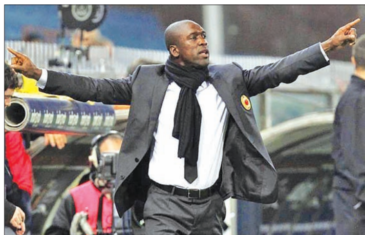
AC Milan’s coach Clarence Seedorf gestures during their Italian Serie A soccer match against Genoa at the Ferraris stadium in Genoa on 7 April, 2014.

Kane duly converted from the spot with virtually the last kick off the game to silence Anfield.—Reuters ■