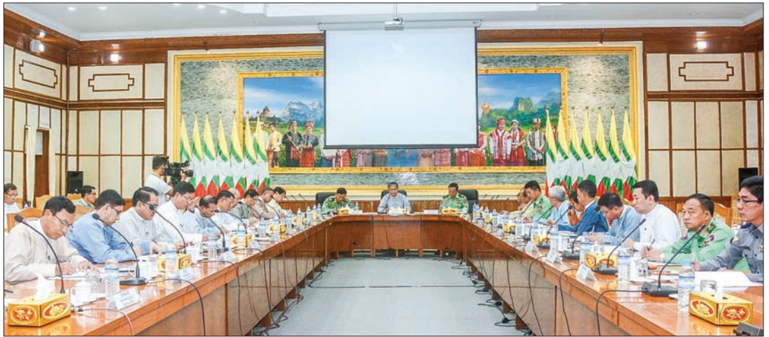
A meeting on holding the Nationwide Ceasefire Agreement signing ceremony for the New Mon State Party and Lahu Democratic Union is held in Nay Pyi Taw yesterday.

cussed the matters relating to boosting the friendship between the two armed forces, exchange on friendly visits of cultural troops and athletic teams, exchange of visits between the naval ships, and strengthening of relations between the two armed forces. —Myanmar News Agency ■