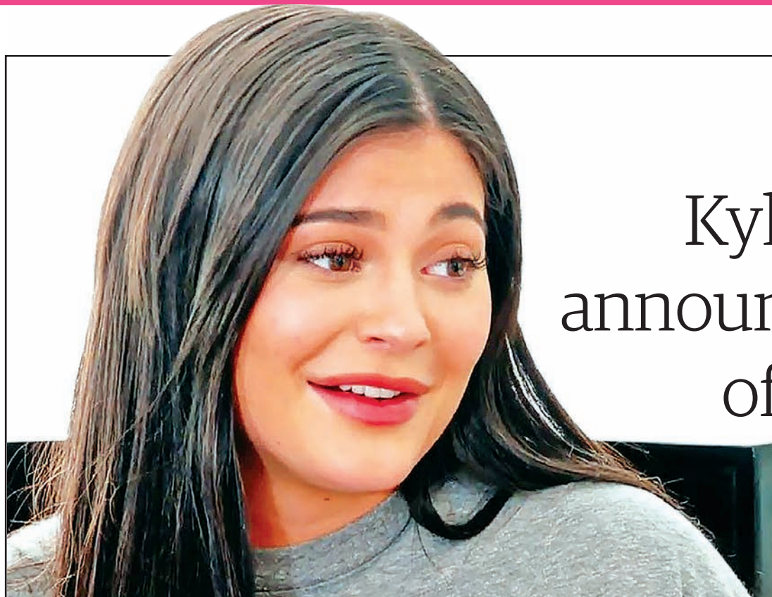
Television personality Kylie Jenner.

"Jumanji," which declined just 32 per cent, is only the 11th title to top $11 million in its seventh weekend. It's the lowest total for a first-place film since the second weekend of "The Hitman's Bodyguard" won the final frame of August. Fox's "Maze Runner: The Death Cure," which won the box office last weekend, finished second with $10.2 million from 3,793 locations. The weekend's sole opener, Helen Mirren's horror-thriller "Winchester," launched in third with $9.3 million at 2,480 venues, topping modest expectations which had been in the $6 million to $8 million range. Overall domestic business was typically modest for a Super Bowl weekend with $92 million overall, according to comScore, as studios remain reluctant to open major titles during the frenzy surrounding the pro football championship. The lowest recent Super Bowl weekend came in at $86 million in 2014, when the third weekend of "Ride Along" led with $12 million. The 2018 box office has remained close to even with last year thanks to "Jumanji," with $1.06 billion through Sunday, down 0.5 per cent from last year at the same point. "Jumanji" gets the MVP box office award for Super Bowl weekend with a stunning late run ascension to the number one spot as 'Maze Runner' adds to its total and 'Winchester' enjoys a bit of counter programming success amidst a sea of Oscar contenders over what is a typically slow moviegoing weekend," said Paul Dergarabedian, senior media analyst with comScore.—Reuters ■