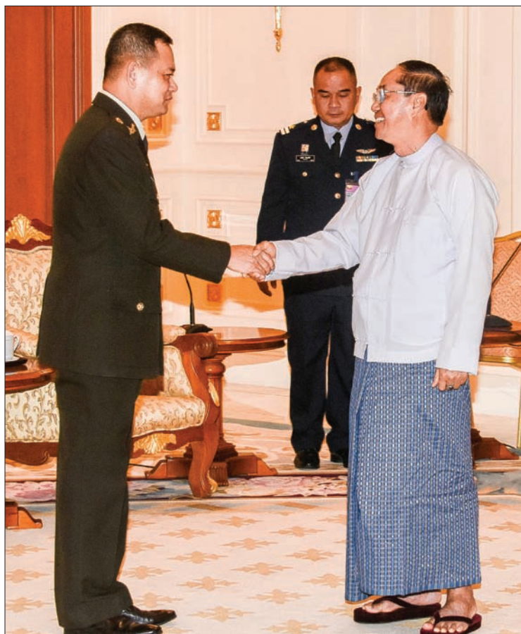
Vice President U Myint Swe shakes hands with Gen. Tarnchaiyan Srisuwan in Nay Pyi Taw.