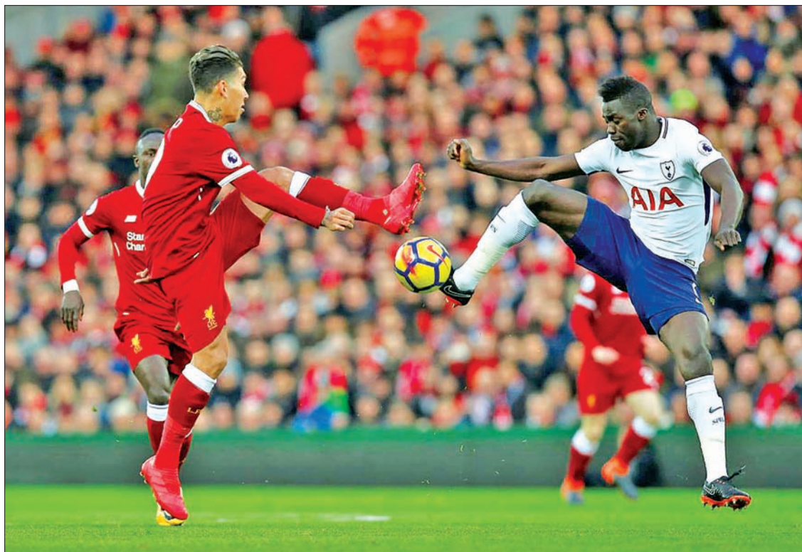
Tottenham’s Davinson Sanchez in action with Liverpool’s Roberto Firmino during the match of Premier League between Liverpool and Tottenham Hotspur at Anfield in Liverpool, Britain on 4 February, 2018.

Kane’s tame penalty was easily saved by Karius after the England striker had been felled in the box before Salah danced his way past two Spurs