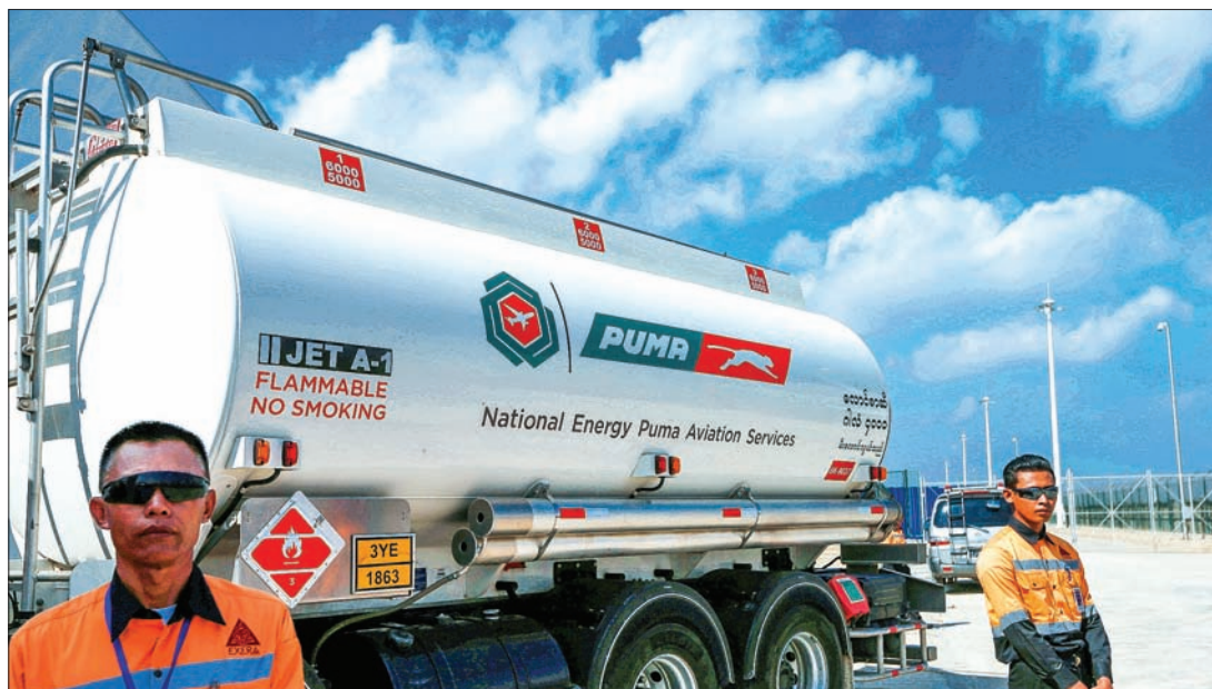
Security guards stand near a tanker carrying aviation fuel during the opening ceremony of Puma Energy fuel storage facility at Myanmar International Terminal Thilawa outside Yangon.