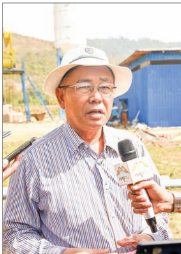
U Aung Kyaw Zan (Minister for Electricity, Industry and Transportation)