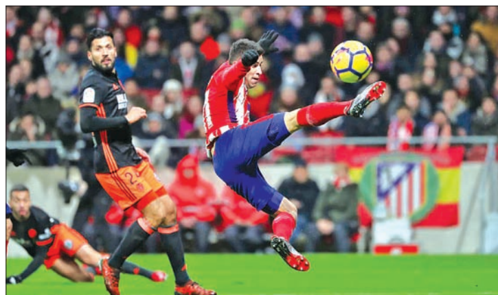
Atletico Madrid’s Angel Correa in action at Wanda Metropolitano in Madrid, Spain on 4 February, 2018.

In a predictably tight game between the second and third-placed clubs at the Wanda Metropolitano few chances were created but Atletico had the upper hand, with Neto tipping away a Saul Niguez piledriver from some distance and then repelling Diego Costa’s header from a corner. Correa broke the deadlock in spectacular fashion in the 59th minute, receiving the ball from Koke and crashing