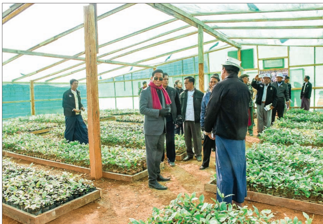
Vice President U Henry Van Thio and officials visit Tikir Village coffee tree nursery.