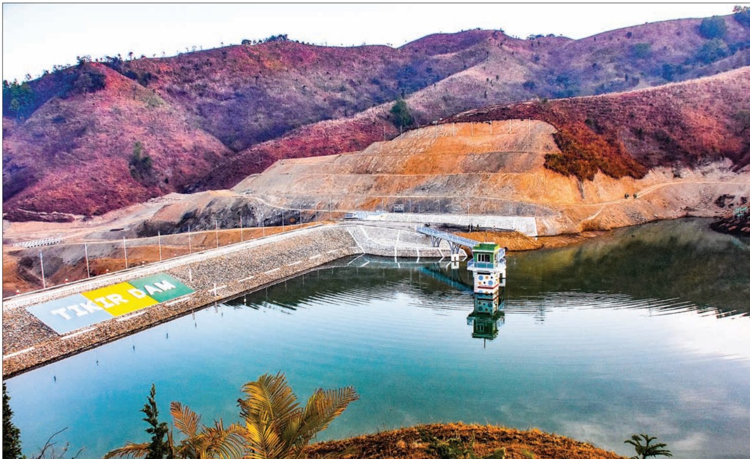
Tikir Dam will irrigate highland farms and produce 50 kilowatts of electricity through a mini-hydroelectric power station.