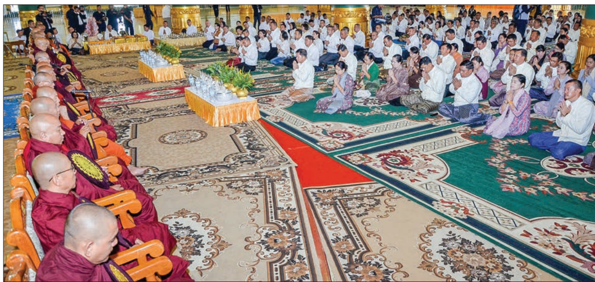
The congregation led by Senior General Min Aung Hlaing and wife attend the ceremony to donate offertories to the Members of the Sangha.