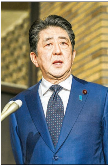
Prime Minister Shinzo Abe meets the press at his office in Tokyo on 2 February, 2018 after holding phone talks with US President Donald Trump.