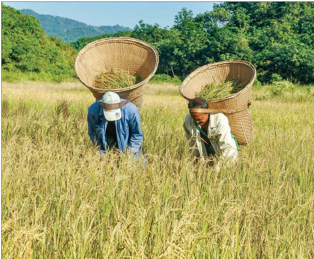
Farmers with woven wicker baskets on their back, harvesting rice in their field.