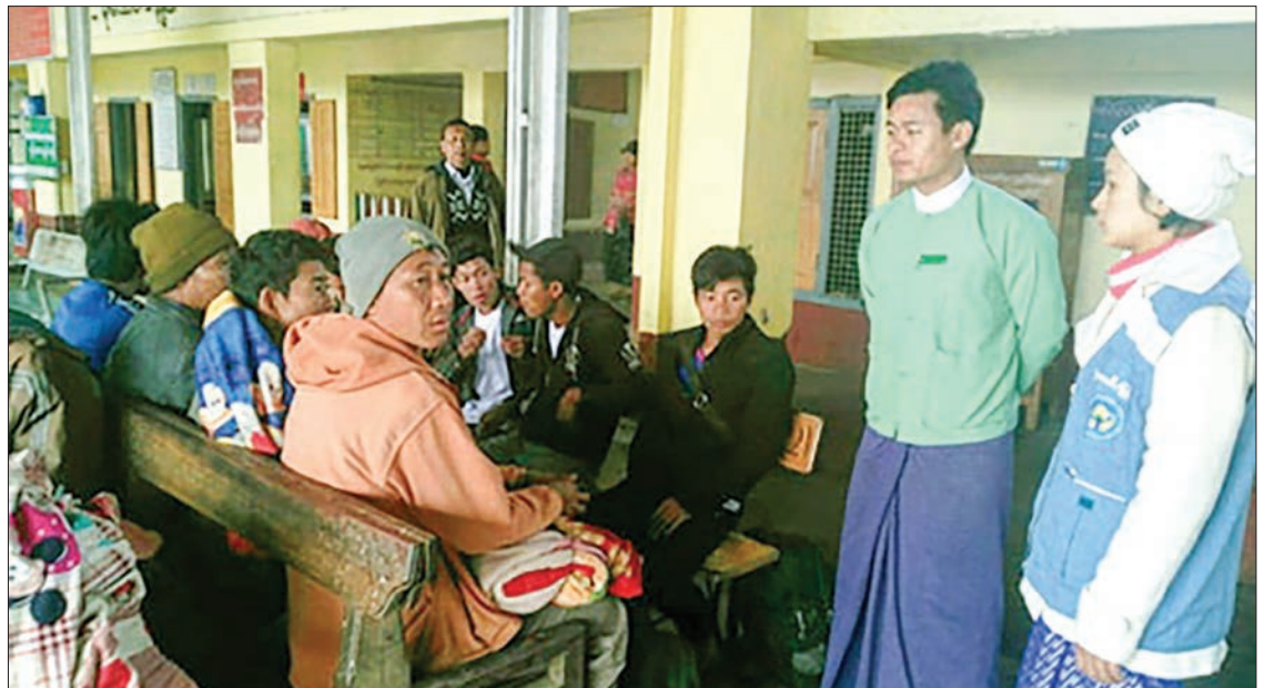
Kachin State authorities see off civilians waiting at the railway station to return home.