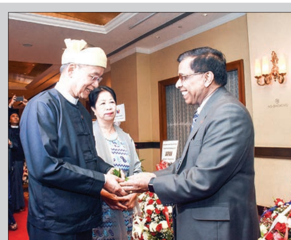
Sri Lanka embassy celebrates Independence Day