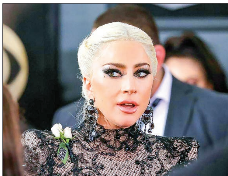
Lady Gaga arrives at the 60th Annual Grammy Awards in New York, NY, U.S., January 28, 2018.

A statement posted on Lady Gaga's Twitter and Instagram pages did not mention fibromyalgia but said the 31-year-old singer decided to cancel the shows after consulting with her medical team. "Unfortunately, Lady Gaga is suffering from severe pain that has materially impacted her ability to perform live," the statement said. In an accompanying statement on social media, Lady Gaga said she was devastated to cancel the shows, which included stops in London, Zurich, Stockholm,