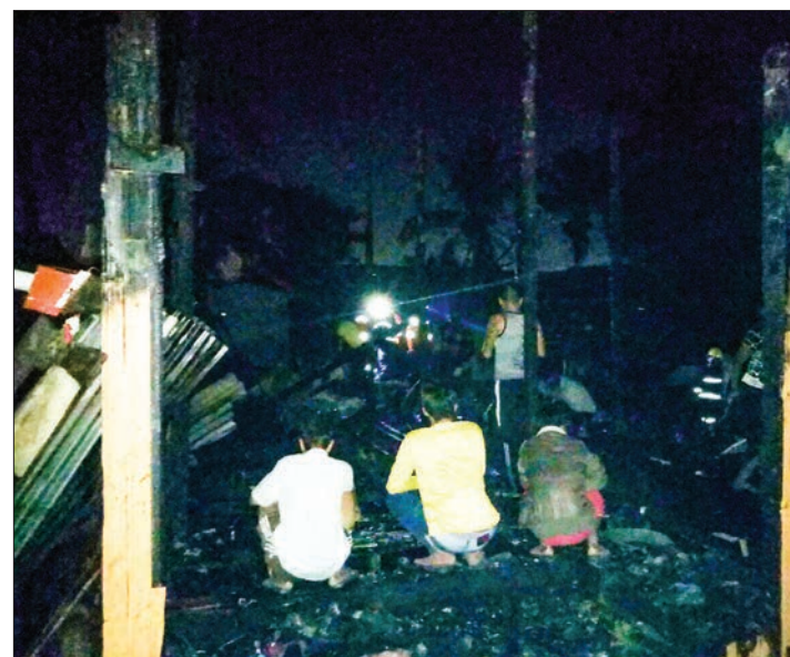
People are seen at the site destroyed by kitchen fire.