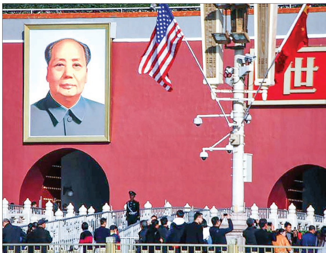
US and China's flags flutter in front of a portrait of late Chinese Chairman Mao Zedong at the Tiananmen gate ahead of the visit by US President Donald Trump to Beijing, China on 8 November, 2017.

The review of US nuclear policy has already riled Russia, which viewed the document as confrontational, and raised fears that it could increase the risk of miscalculation between the two countries. The US military has put countering China and Russia, dubbed “revisionist powers”, at the centre of a new national defence strategy unveiled earlier this month. By expanding its own low-yield nuclear capability, the US would deter Russia from using nuclear weapons, say American officials.