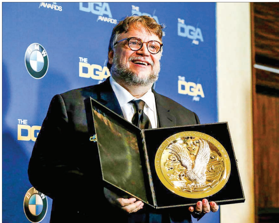
Director Guillermo del Toro holds his award for Outstanding Directorial Achievement in Feature Film for "The Shape of Water" at the 70th Annual DGA Awards in Beverly Hills, California, US on 3 February, 2018.

"The Shape of Water" scored 13 Oscar nominations last month, the most of any 2017 film and just one shy of the all-time record of 14, including best