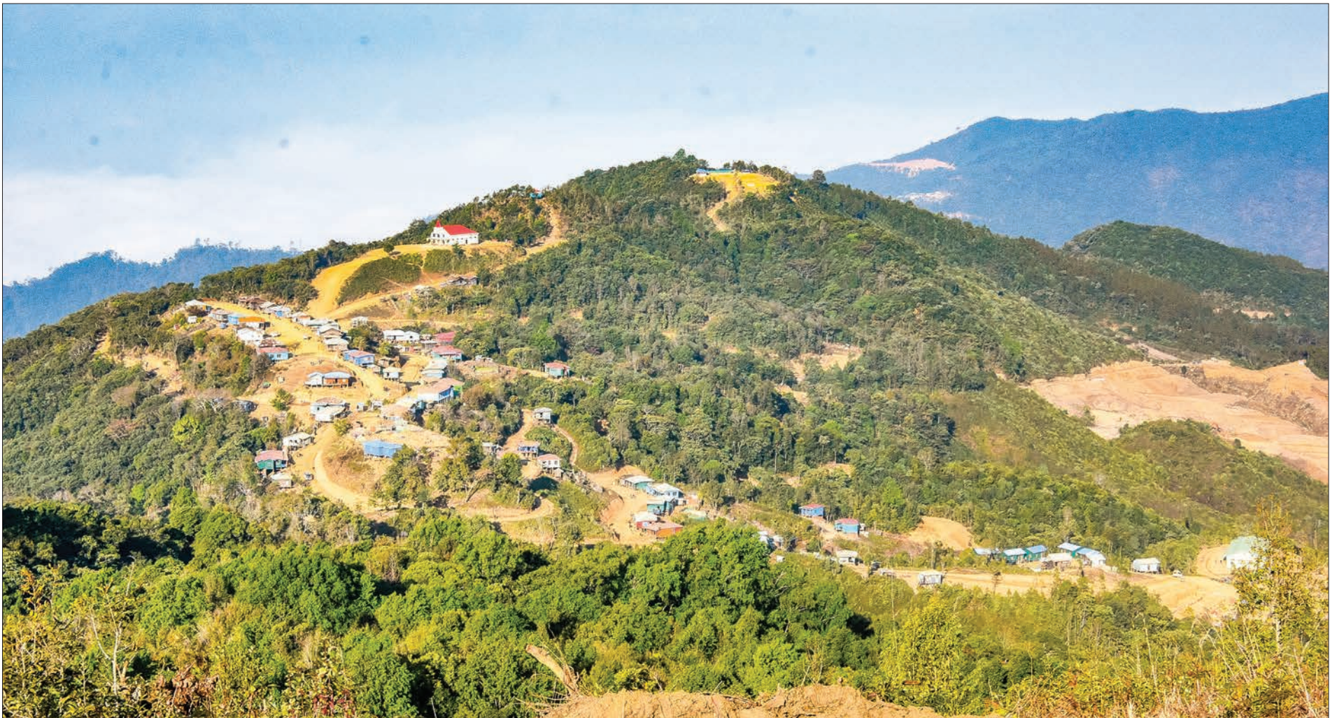
Terrace cultivation and garden would benefit Thikih Village in Htantalan Township in Chin State after reclamation of land is readied for crops.