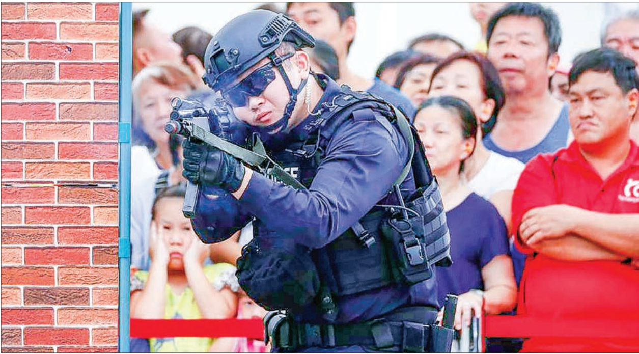
Police take part in a simulated gunmen attack demonstration for the public at a housing estate in Singapore on 10 December 2017.

But this is not some war-ravaged country. It is one of the safest in the world, Singapore. The wealthy island-state has a near-perfect record of keeping its shores free from terror, but as it prepares to host defence ministers from around Southeast Asia this week, it appears to have good reason to have prioritised stopping the spread of militancy in the region. The cosmopolitan financial hub, which was second only to Tokyo in The Economist Intelligence Unit's Safe Cities Index in 2017, says it has been the target of militant plots for years, some stemming from its Muslim-majority