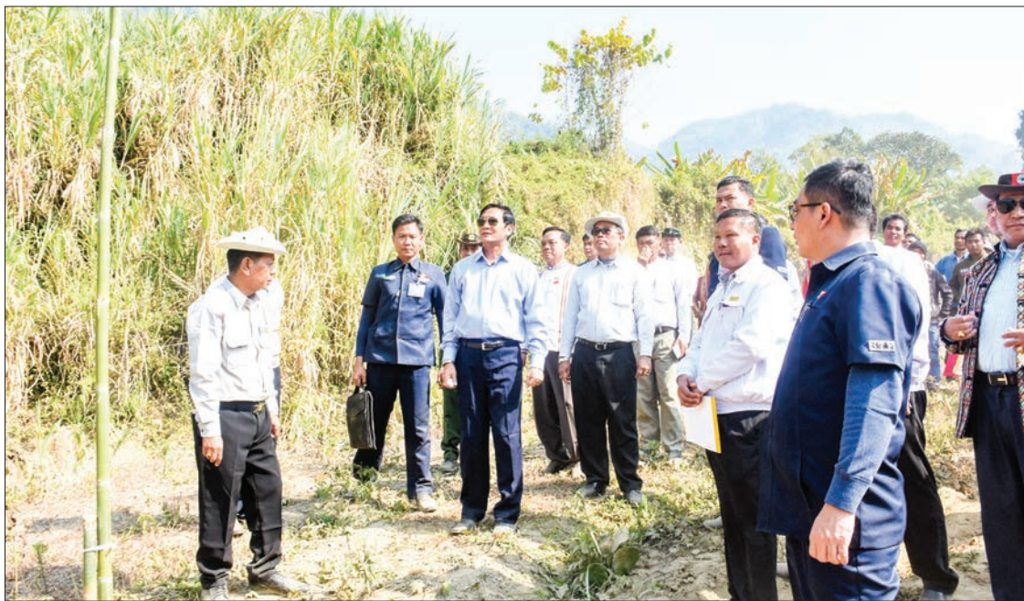
Vice President U Henry Van Thio inspects the site chosen for construction of Bwenu Bridge at the border of India and Myanmar.

The Ministry of Agriculture, Livestock and Irrigation has a plan to reclaim more than 550 acres in the township and so far, more than 370 acres have been reclaimed. They were then entertained with traditional dance performances by local residents. —Myanmar News Agency ■