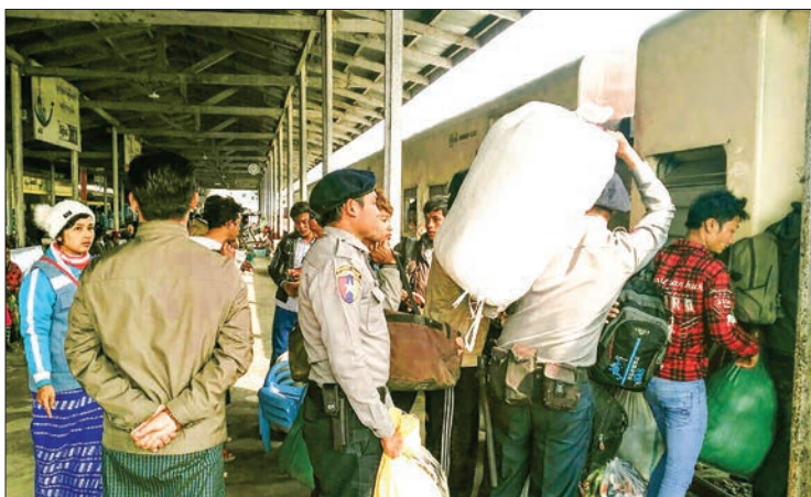
Kachin State authorities help civilians at the railway station as they return home.

PEOPLE who were rescued early this week from conflict zones in Kachin State were sent back home, with assistance from the ministry of social welfare, relief and resettlement.