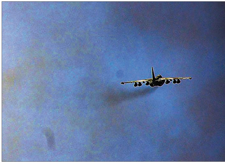
Ejected pilot was killed later by terrorists.

“According to preliminary information, the jet