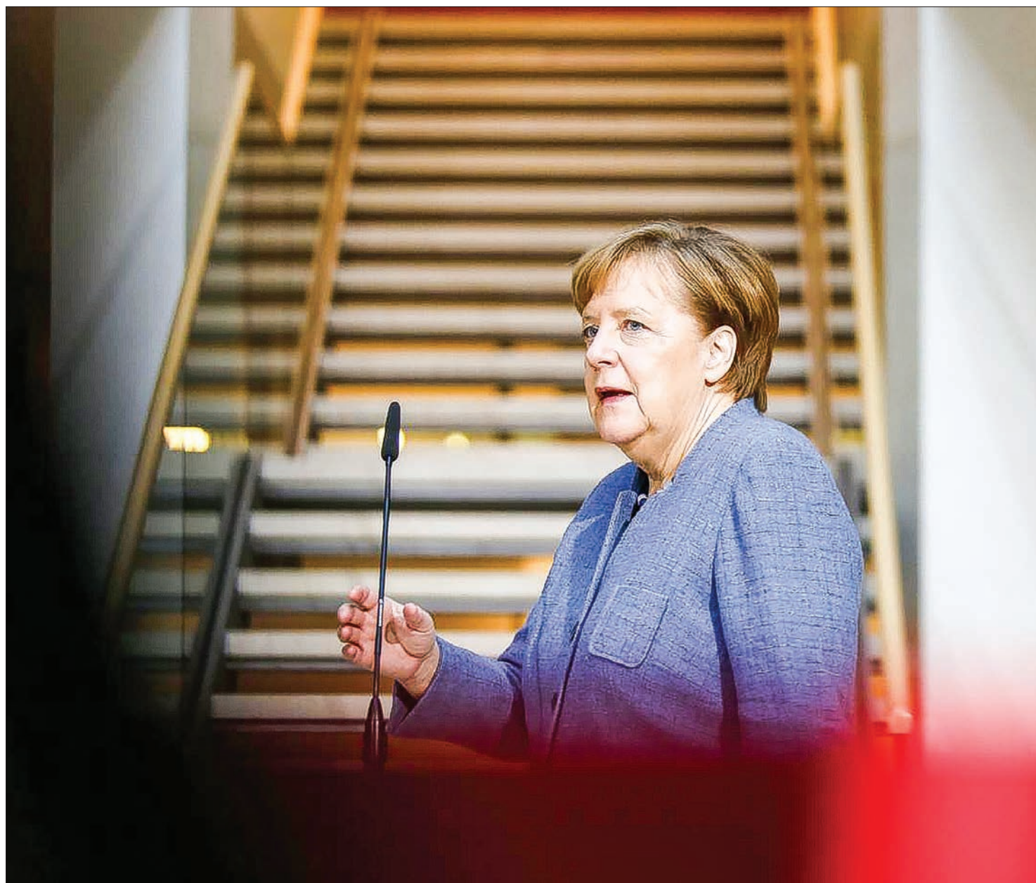
German Chancellor Angela Merkel of the Christian Democratic Union (CDU) arrives for coalition talks at the Social Democratic Party (SPD) headquarters in Berlin, Germany on 4 February, 2018.