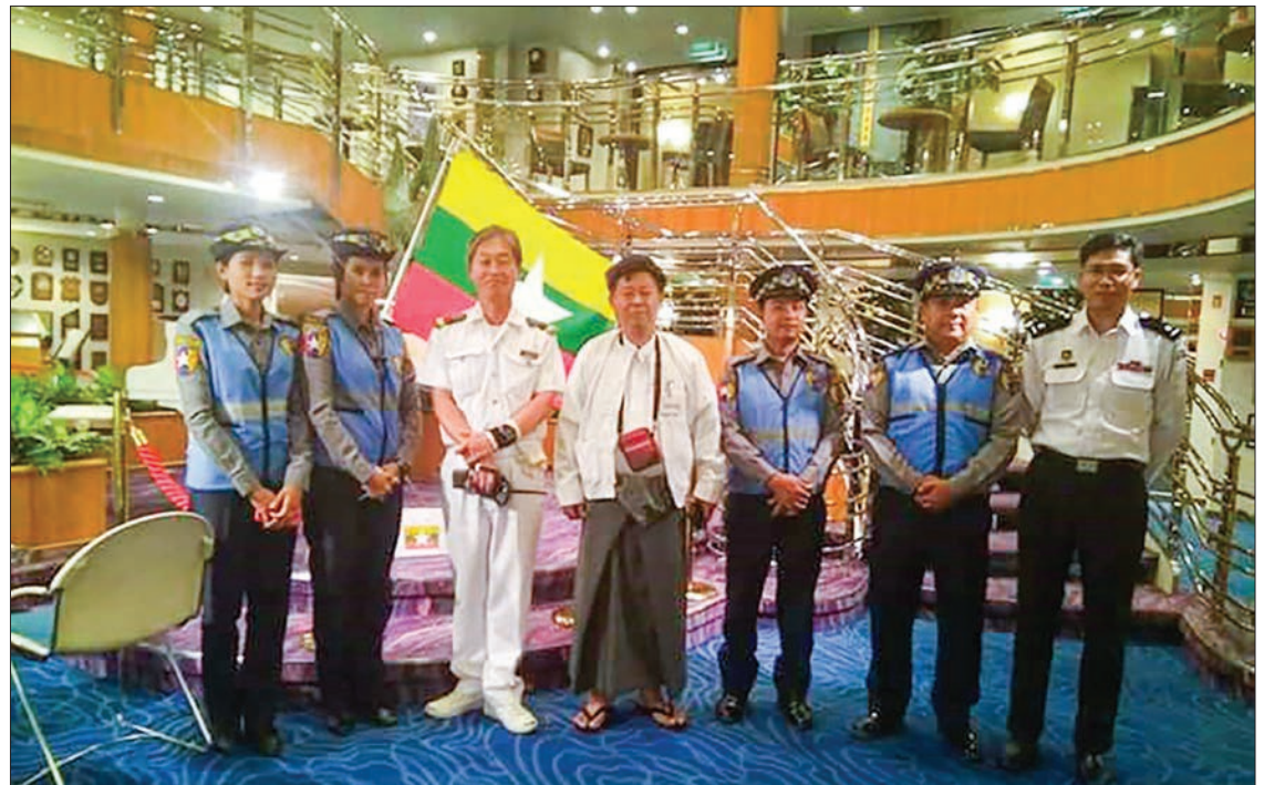
Official from Pacific Venus Cruise and Myanmar tourist Police are seen at the port.

Tourists continue to visit the country via sea, air and cross-borders. Foreigners also enjoy travelling to Myanmar's rivers, such as Ayeyawady and Chindwin, on