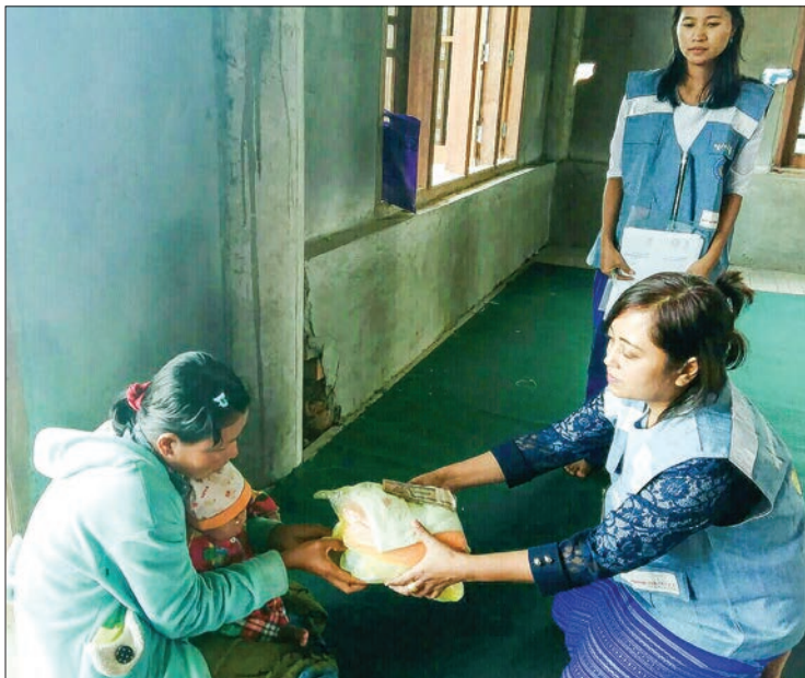
The official from the Ministry of Social Welfare, Relief and Resettlement presents aid to a mother.