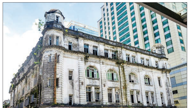
The historic building belonging to Burma Oil Corporation (BOC) during the colonial era is chosen for the new location for the National Library.

The meeting was concluded by the Union Minister and then he inspected the working process. —Myanmar News Agency ■