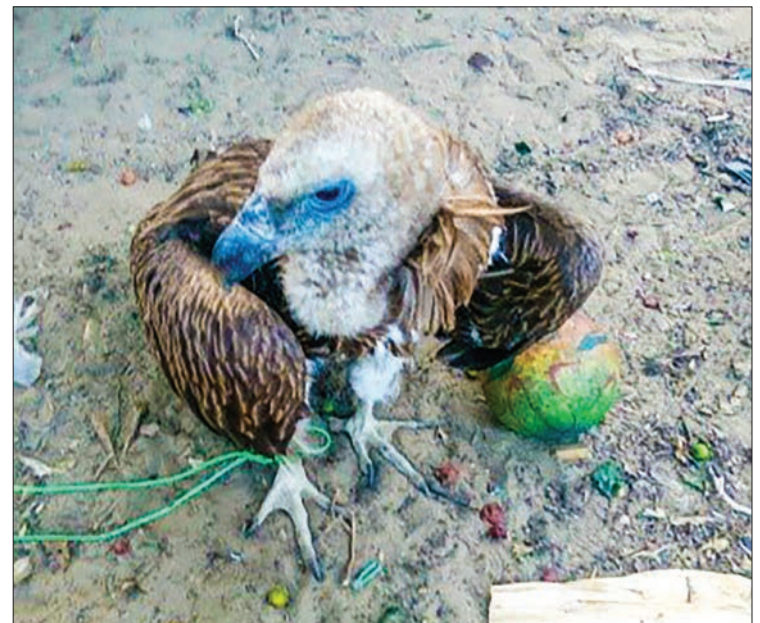
The unidentified bird rescued by fishermen is seen.

Ko Zaw Zaw, one of the two fishermen, said: "We will release the rescued bird back into the wild after it recovers fully from physical fatigue."—Kyaw Thu Hein (Hainggyikyun)