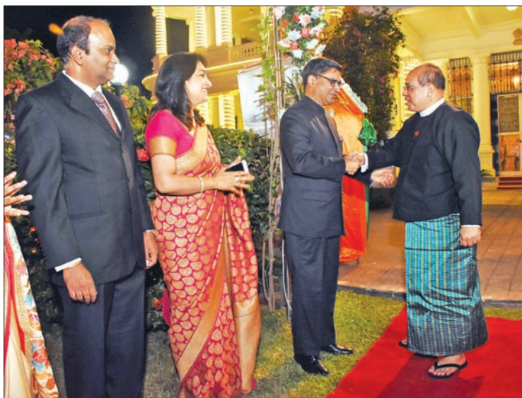
Union Minister U Thaung Tun, right, is welcomed by Indian Ambassador to Myanmar Mr. Vikram Misri, second from right, at the 69 th Republic Day of India celebration in Yangon yesterday.

Also present at the ceremony were Union Minister for Office of the State Counsellor U Kyaw Tint Swe, Lt-Gen Tun Tun Naung, Commander of Yangon Command Maj-Gen Thet Pone, Ambassadors, Military Attaché, Representatives of United Nations, officials and invited guests.—MNA ■