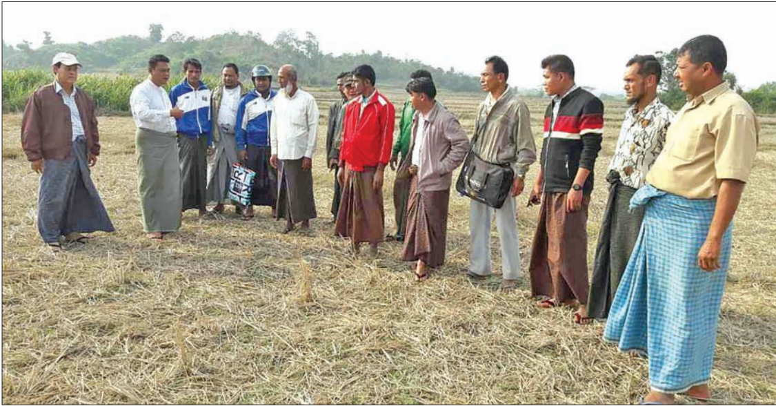
Authorities and local people inspect the mass grave reported in the Associated Press (AP) near Gu Dar Pyin Village in Buthidaung Township yesterday.

The terrorists and villagers had used machetes and homemade arms in the attack, and the security forces