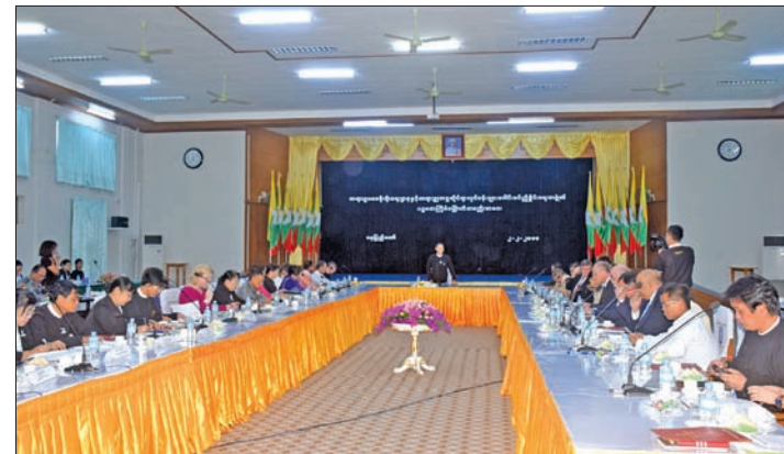
Union Attorney-General U Tun Tun Oo addresses the meeting of the Coordination Body for Rule of Law and Justice Sector.

The 5 th meeting of the Coordination Body for Rule of Law and Justice Sector was held at the meeting hall of the Union Attorney General's office at 11:00 am this morning.