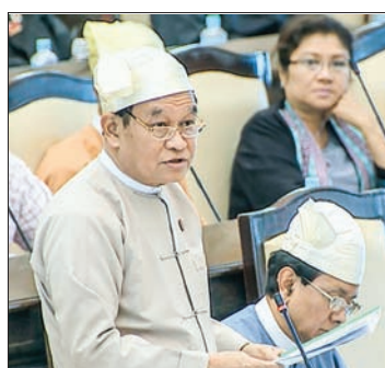
Union Minister for Health and Sports Dr. Myint Htwe.

administrative methods and the second is to take legal action and stop the sales. This is according to the 1997 law. After amending the law in 2018 it was still found to be inadequate and process of amending it again is underway. For imported foods we need labs at the entry point on the border. At the end side, we educate the teachers and students at the school. We need to work together with school health. Ministry of Education is also drawing up plans. We need to educate those who sell to not to look at profit only. The main thing to do here is to educate. We are now advertising in the newspaper. We are also starting in Sagaing Region. All states and regions will be covered one by one. But this could not be done only by FDA. It could not be done the school and the teachers. All need to participate. Education must be provided to the home. FDA will provide the expertise and the lab. Media need to work with us. Media is important. Mainly it is