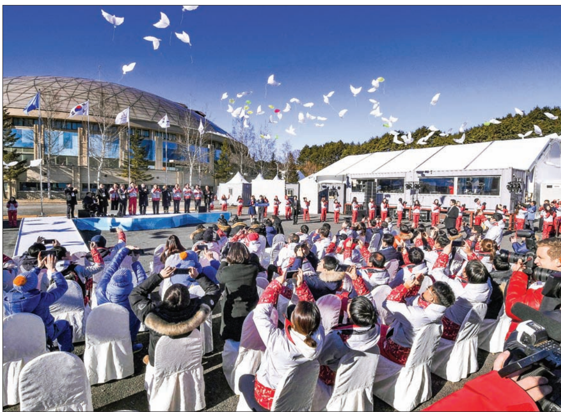
Attendees release pigeon-shaped balloons to celebrate the opening of the athletes' living quarters for the Pyeongchang Olympics in Gangneung, South Korea, on 1 February 2018.

North Korea has since agreed to send athletes, a cheering squad, a taekwondo demonstration team, an art troupe and high-ranking officials to the South. At the games, North and South Korea will march together under one flag in the opening ceremony.