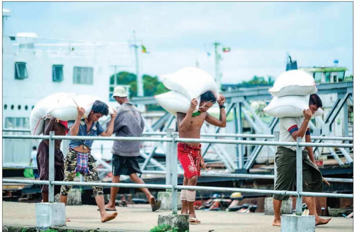
Workers carry bags of rice at a jetty in Yangon.

This forum will include discussions on controlling the rice price; farmers' problems; gaining appropriate profits for rice millers, rice merchants and exporters; and providing assistance by making policies for small and medium enterprises. Those who want to contribute ideas for discussions on these subjects can email MRF at admin@mrf.com.mm or call 01 218266-8/2301128-9. -GNLM ■