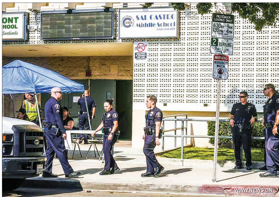
Police officers stand guard outside Salvador Castro Middle School in Los Angeles, the United States on 1 February 2018. Five people were injured, including two students shot, in a classroom shooting Thursday at the Salvador Castro Middle School in the western US city of Los Angeles, local authorities said.

Police officials said the shooting suspect is about 12