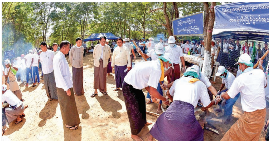
Dr. Pe Myint and Deputy Minister U Aung Hla Tun encourage teams from MRTV and various departments under the Ministry of Information participating in a htamane-making contest in Nay Pyi Taw.

All the contestants and attendees were entertained by Myanmar music and dancing. —Myanmar News Agency ■