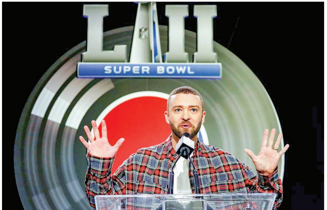
Super Bowl half time entertainer Justin Timberlake gives a news conference about his upcoming performance in Minneapolis, Minnesota, US on 1 February 2018.

Timberlake did not reveal too many details of his upcoming