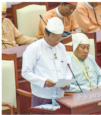
Deputy Minister for Agriculture, Livestock and Irrigation U Hla Kyaw.

Htawara Aung Myay Company was designated as the developer, and the company had purchased farmlands in the planned new town project from farmers through mutual agreement. It had applied to use the farmland, as well as vacant and fallow lands, totalling 123.2 acres