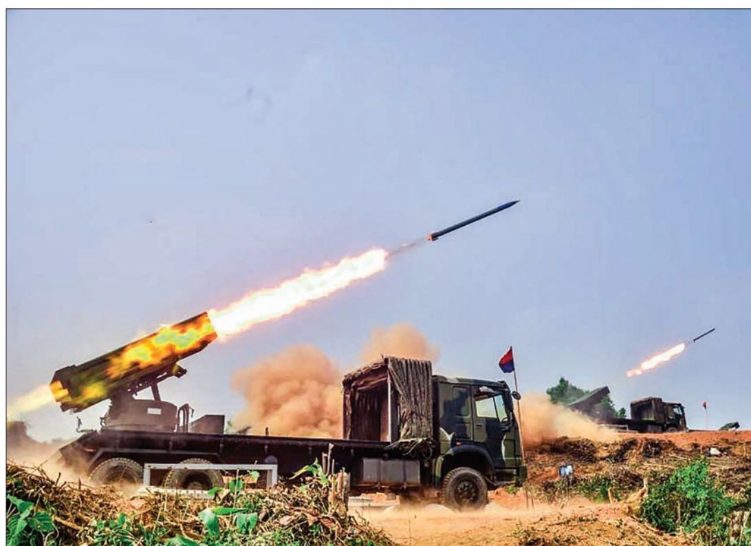
Army fires missiles during the combined military exercise in Patheingyi.

I wish you memorable and enjoyable 70th anniversary celebrations.