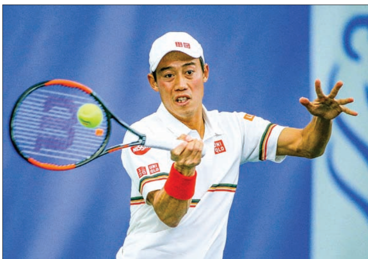
Japanese tennis player Kei Nishikori hits a forehand during his quarterfinal match of an ATP Challenger Tour event in Dallas, Texas, on 1 February 2018 against Dominik Koepfer of Germany.

"I was able to bring my rhythm up bit by bit," Nishikori said. "There were times in the second set where I struggled, but I was able to nail my strokes