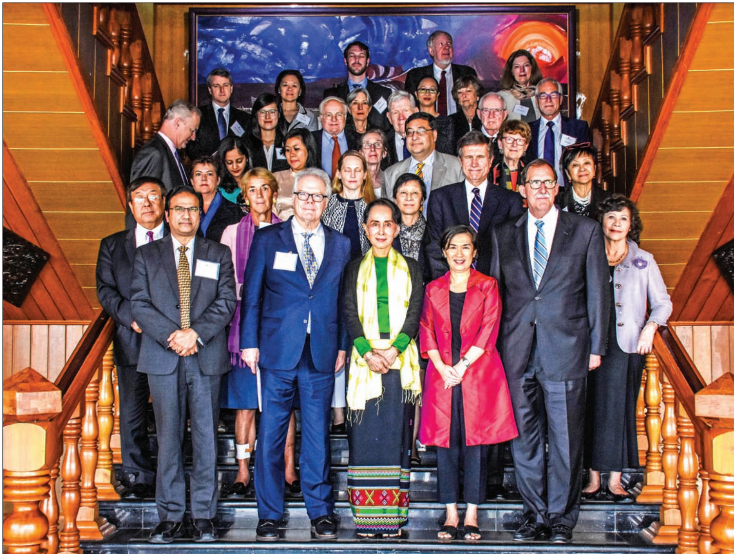
State Counsellor Daw Aung San Suu Kyi, centre, poses for a photo with the Asia Foundation delegation in Nay Pyi Taw yesterday.