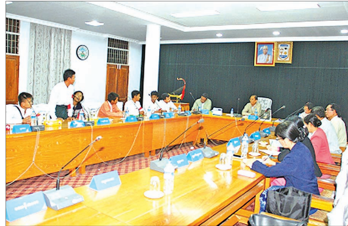
Seven officials of Ministry of Education including the Yadanabon University rector and seven leaders of Ba Ka Ta discuss at the meeting hall (1) in Yadanabon University on 22 January 2018.

While the lectures were in progress in the class rooms, they used the hand held loud speakers and demanded the enhancement