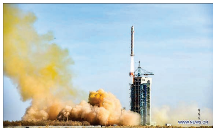
China launches its first seismo-electromagnetic satellite, known as Zhangheng 1 in Chinese, into a sun-synchronous orbit from Jiuquan Satellite Launch Center, in northwest China's Gobi Desert, on 2 February 2018.

Zhangheng 1 will record electromagnetic data associated with earthquakes above 6 magnitude in China and those above 7 magnitude around the world, in a bid to identify patterns in the electromagnetic disturbances in the near-Earth environment,