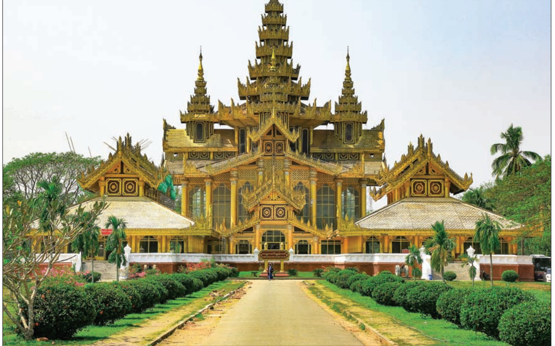
Kanbawzathadi Golden Palace in Bago. Nearly 50 miles away from Yangon.

The Kanbawzathadi Golden Palace was built by King Bayinnaung in 1553, but it was looted and burnt down in 1599 during an armed conflict. Dur-