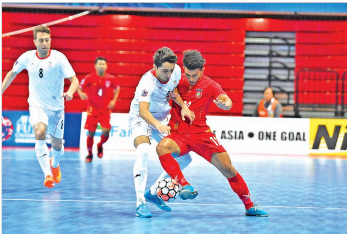
Iran(white) and Myanmar (red) engage in combat for the ball in yesterday's AFC Futsal Championship in Chinese Taipei.