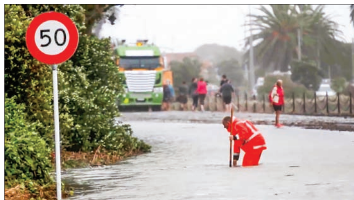
Emergency personnel work on a flooded road in Nelson, after the downgraded Tropical Cyclone Fehi brought heavy rain in New Zealand, in this still image taken from a on 1 February 2018.

New Zealand's weather forecaster MetService said on Friday the storm was moving southeast, providing some relief to the country's west coast, which has been hardest hit by the heavy rain and strong winds. —Reuters ■