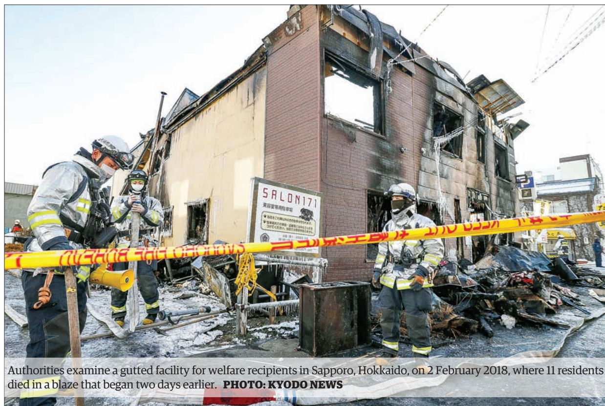
Authorities examine a gutted facility for welfare recipients in Sapporo, Hokkaido, on 2 February 2018, where 11 residents died in a blaze that began two days earlier.