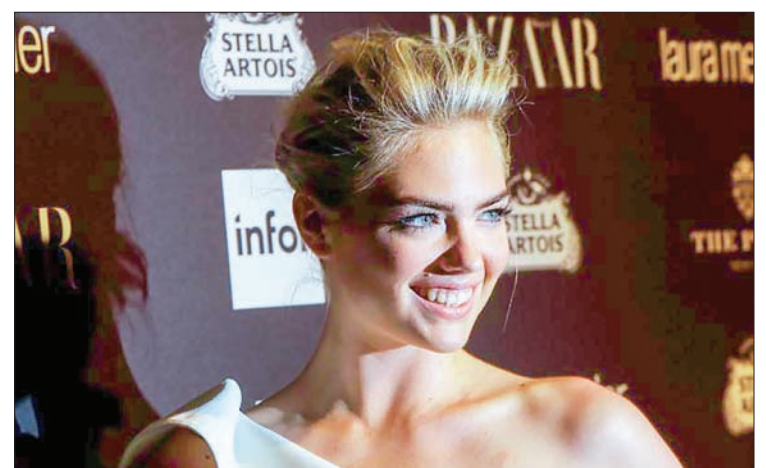
Kate Upton attends Harper's Bazaar's celebration of 'ICONS By Carine Roitfeld' at The Plaza Hotel during New York Fashion Week in Manhattan, New York, US on 9 September 2016.

two women in November 2017, after an entertainment website contacted them. It said the investigation, aided by outside counsel, had so far been unable to corroborate the allegations and the company's board had been unable to determine if they had merit. Marciano has denied the allegations. — Reuters