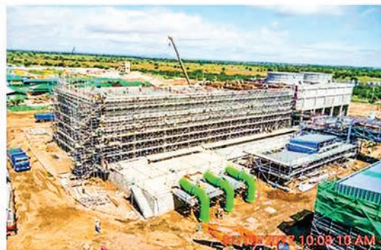
225MW-gas fired power plant project in Myingyan.

A: Myanmar's total electricity consumption rate is 10.877 million, some 4.289 million (38.4 per cent) can get access to electricity and the remaining 6.588 million are still in need of electricity supply. Out of 482 towns, some 350 towns can get access to electricity and the remaining 132 towns are in need of electricity supply. Out of 63,737 villages, some 32,228 villages can get access to electricity and the remaining 31,509 villages are still in need of electricity supply.