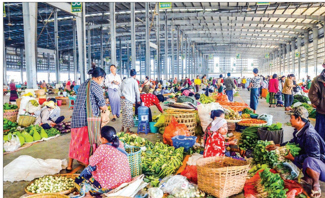
Vendors are seen at Danyingone wholesale fruit, vegetable and flower market in Yangon.

The entire project is expected to be completed by the end of 2019, and there will be more than 9000 stalls in total.—Myanmar Digital News ■