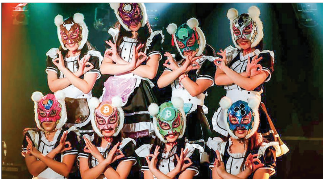
In their debut, the eight "Virtual Currency Girls", or Kasotsuka Shojo in Japanese, cavorted in maid costumes with frilly skirts and full-face professional wrestling-style masks with fuzzy pom-pom ears, extolling the virtues of decentralized digital currencies such as bitcoin.

Dressed in maid costumes and wearing wrestling masks adorned with fuzzy pom-pom ears and cryptocurrency symbols the eight Virtual Currency Girls are a pop music manifestation of the digital currency frenzy that has swept Japan and other parts of