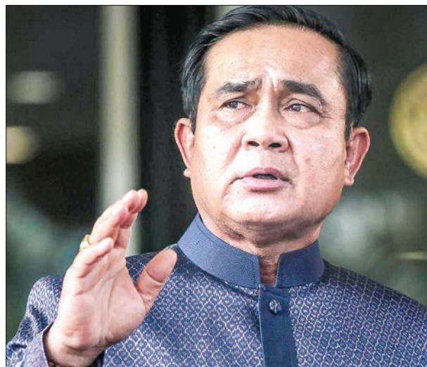
Thailand's Prime Minister Prayuth Chan-ocha.

But last week Thailand's parliamentary body voted to postpone enforcement of a new election law by 90 days, dragging out the timeframe. At the time, the deputy prime minister said parliament's decision could delay the election until 2019.