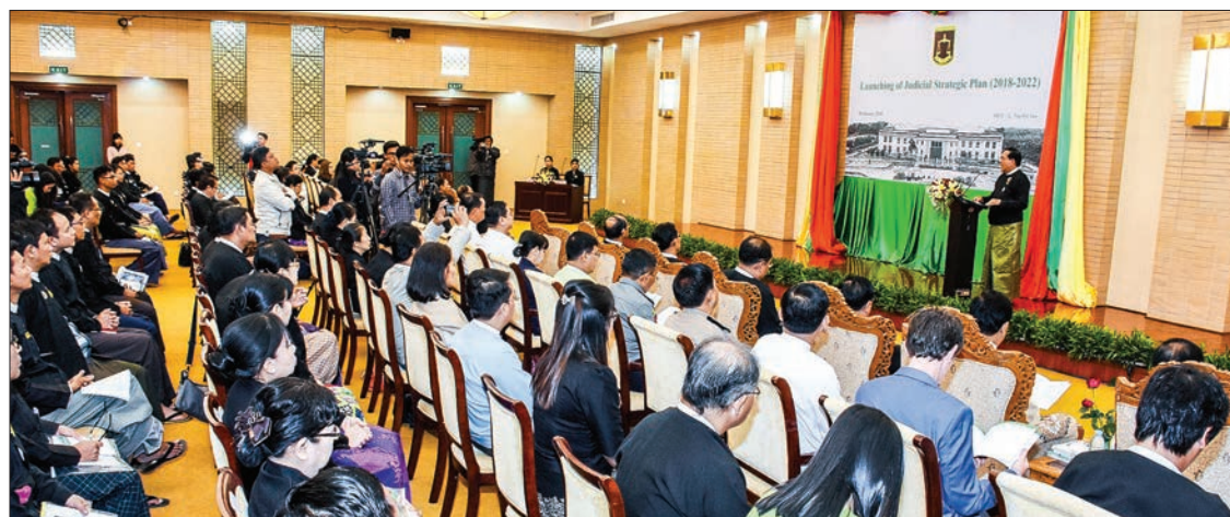
Union Chief Justice U Htun Htun Oo delivers the speech at the ceremony to launch the Judicial Strategic Plan (2018-2022) in Nay Pyi Taw yesterday.

THE Supreme Court of the Union launched its Judicial Strategic Plan (2018-2022) at the Myanmar International Convention Centre II, Nay Pyi Taw, yesterday, addressing changes not only for judges, but also for participants and members of the media.