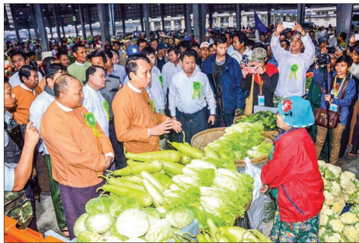
Yangon Region Chief Minister U Phyo Min Thein meets with vegetable sellers at Danyingone wholesale fruit, vegetable and flower market in Yangon.

"The intention to build the new market is to promote the lifestyle of Yangon people. There are two points why a market is successful. The first one is the cleanliness of the market and the availability of car parking. The second point is an operator who is performing to develop the market," Yangon Region Chief Minister U Phyo Min Thein said in the opening ceremony of the market. He added that YCDC will work with operators to manage more than 170 markets in Yangon