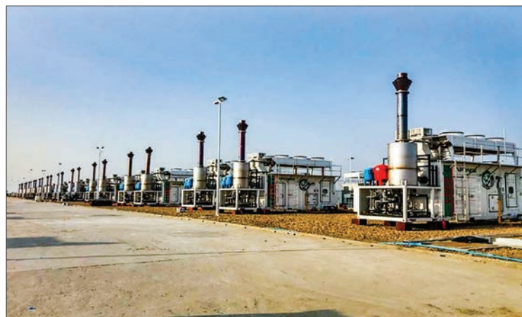
133MW gas fired power plant project in Myingyan.

Q: Could you explain about the process of LNG factories and its operations?