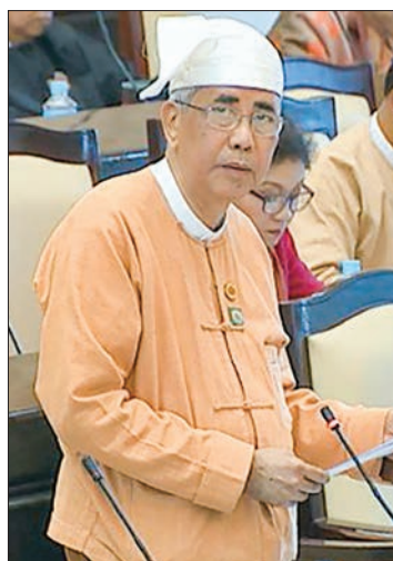
Deputy Minister for Transport and Communications U Kyaw Myo.

There are 17 departments in Mopainglut Town, of which 10 have their own office buildings, while seven do not have them. Some six offices were opened in staff houses. There are 13 departments in Sum Ma Rar Town, of which nine have their own office buildings and four do not. Some three offices were opened in staff houses. Of