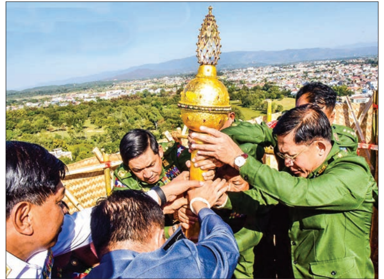
Senior General Min Aung Hlaing installs the diamond orb and pennant-shaped vane atop the Tachilek Shwedagon Pagoda in Tachilek.

The Tatmadaw Commander-in-Chief then presented books and journals to the training school, where were received by the head of the school. ■