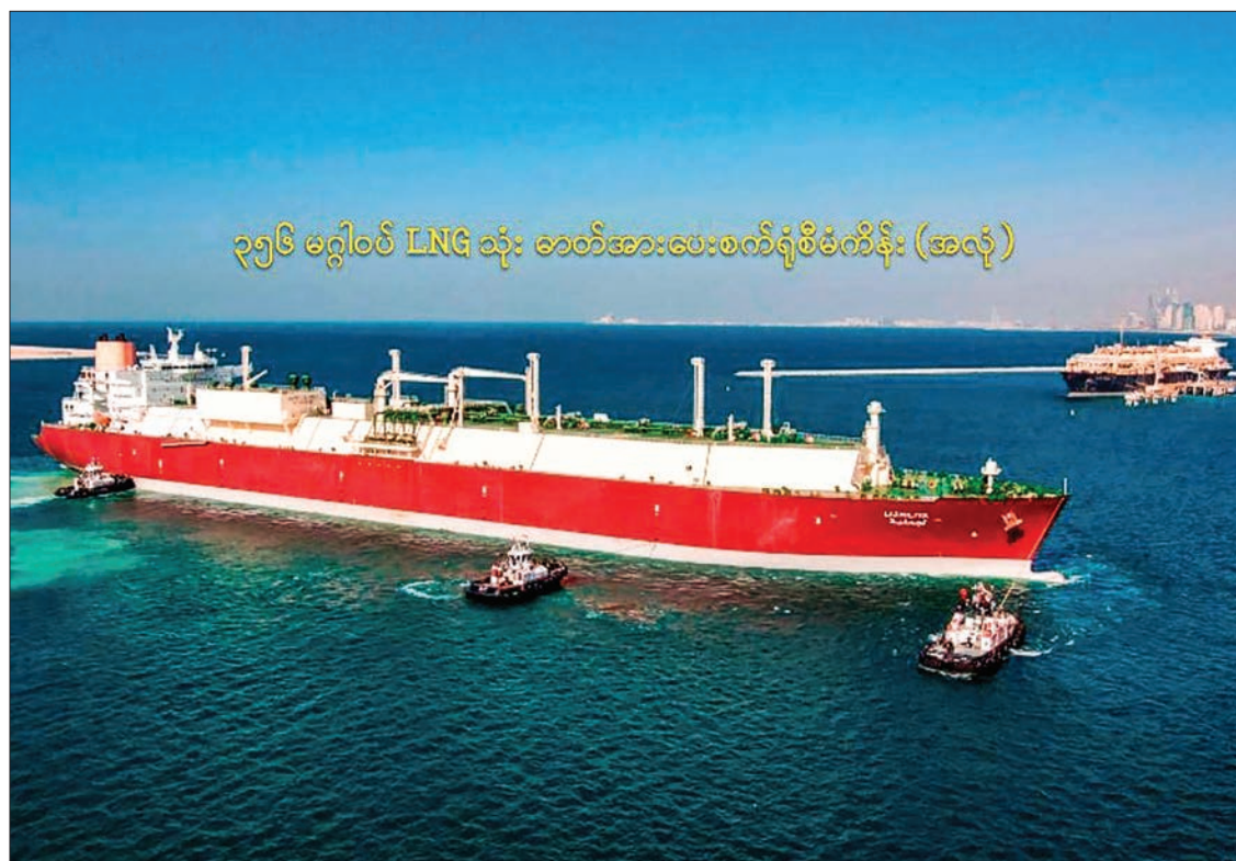
356MW LNG-fired power plant project in Ahlon.

The power supply is the first question asked by foreign and local investors. Today, we can say that we can take responsibility for a reliable power supply by 2020.