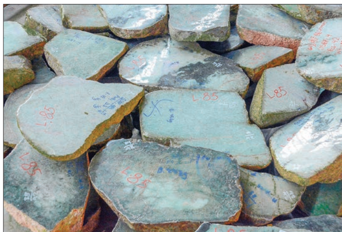
Jade stone.

The country's total exports of mineral products over the past 10 months exceeded $1 billion,