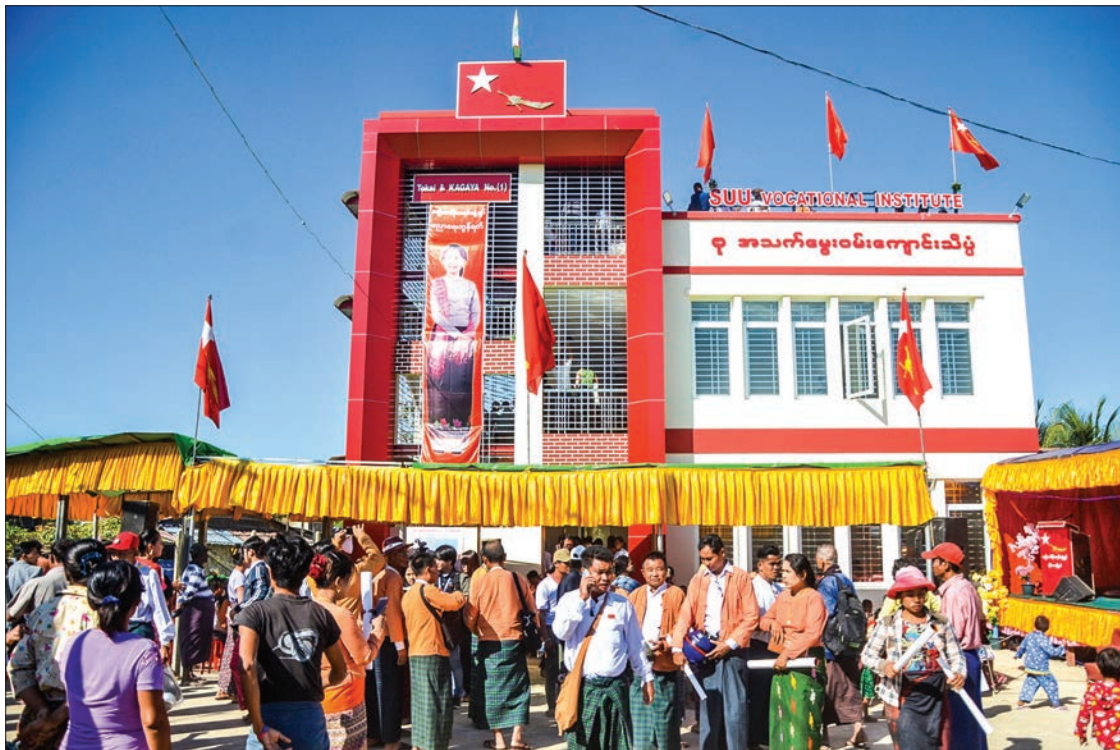
New building at Suu Vocational Institute is opened by the education network of the National League for Democracy in Hlinethaya Township, Yangon.

tive of MPT explained the reason computers were donated to A May Ein (Mother's House) school and Yangon Region Chief Minister gave a speech