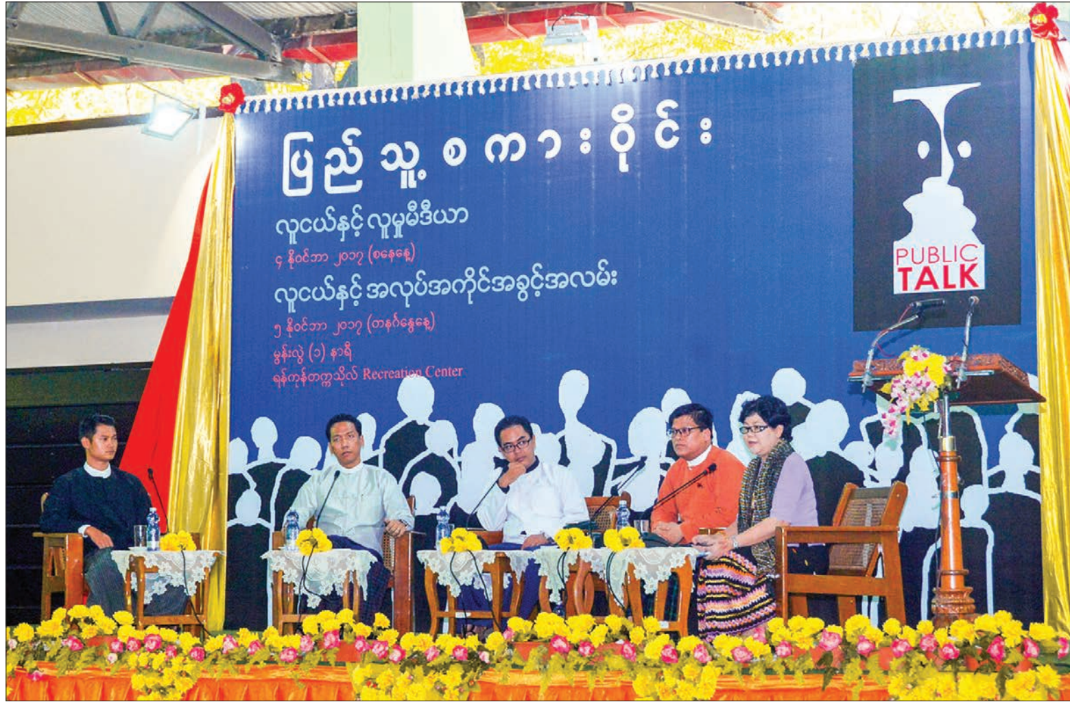
The public talk held in progress at Yangon University Recreation Centre.

Students learning at their respective alma maters need to not only take academic learning, but also to learn to savour the taste of literary treasures including aesthetic literature. No one can deny public libraries as well as school libraries are of great importance. Unadulterated/pure literature which can increase the intellect, encourage the survival of readers and awaken consciousness and awareness is in fact the eternal partner for every individual in leisure hours. Accordingly, I would like to claim that “Lovable literature which will change our present era needs to be selected for sharing the acquired knowledge to other younger minds/youths.”