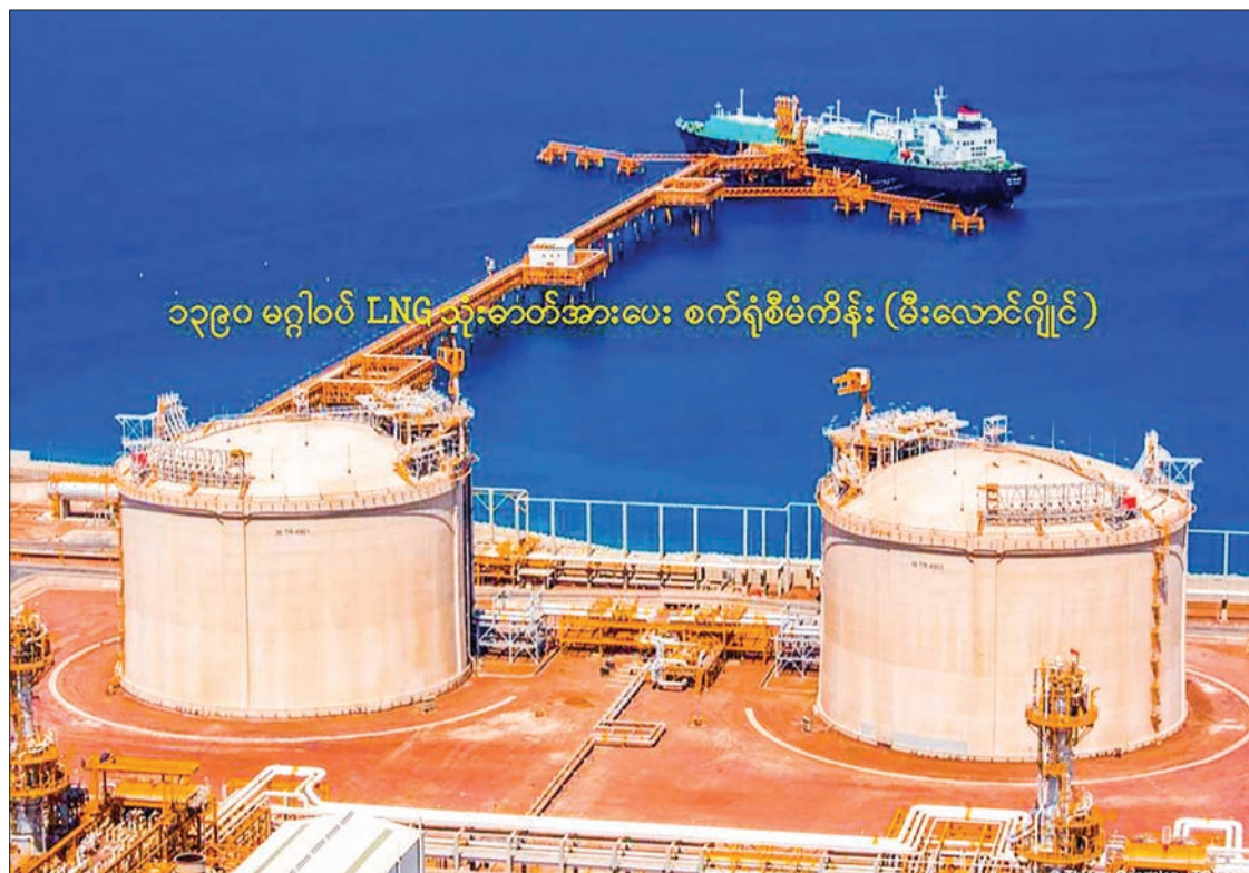
1390 MW-LNG-fired power plant project in Milaunggyaing.

Q: Could you explain about current access to electricity power and power consumption nationwide?