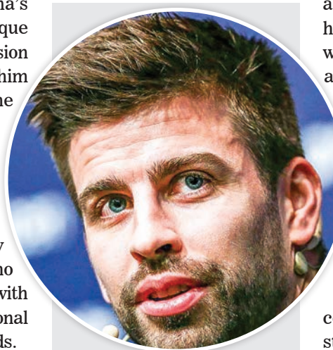
FC Barcelona's soccer player Gerard Pique attends a news conference after he signs a renewal contract at Camp Nou in Barcelona, Spain on 29 January, 2018.

"It's a special day, Gerard Pique is an experienced player,