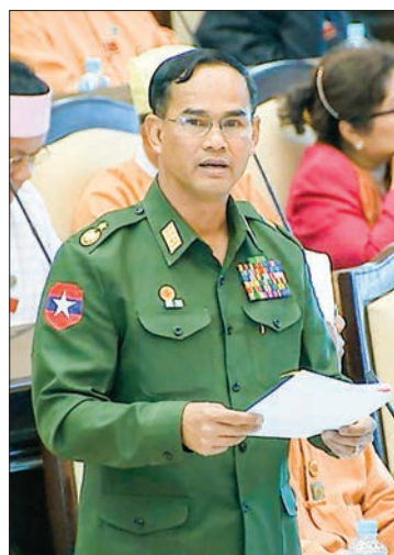
Deputy Minister for Home Affairs Maj-Gen Aung Soe.

First, U Min Naing of Sagaing Region constituency (12) asked about the plan to authorise and assign departments and departmental staff to Mo Paing Lut, Sum Ma Rar, Htanparkway, Donhee and Pansaung sub-townships in Lahe, Leshi and Nanyun townships in the Naga Self-administered Zone, which were being renamed as towns. Deputy Minister for Home Affairs Maj-Gen Aung Soe replied that the Naga Self-administered Zone of the Sagaing Region was formed with Mo Paing Lut sub-township and Sum Ma Rar sub-township in Leshi Township, Htanparkway sub-township in Lahe Township and Donhee sub-township and Pansaung sub-township in Nanyun Township. On 22 May 2014,