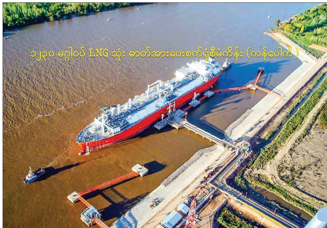
1230-MW LNG-fired power plant project in Kanbauk.

Another thing is that we are going to invest with TTCL Public Company Limited to build