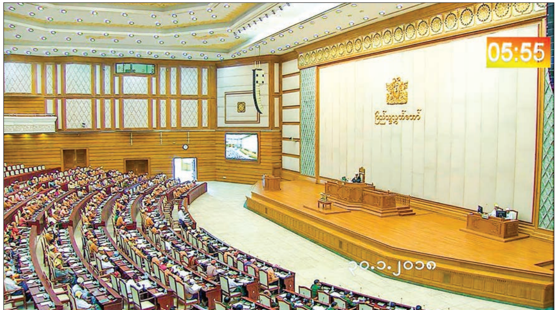
Pyithu Hluttaw is being convened in Nay Pyi Taw.

The government allowed 138 FDIs in the 2016-2017 fiscal year (FY), creating more than 88,000 job opportunities, and 51 local investments, creating more than 10,000 job opportuni-