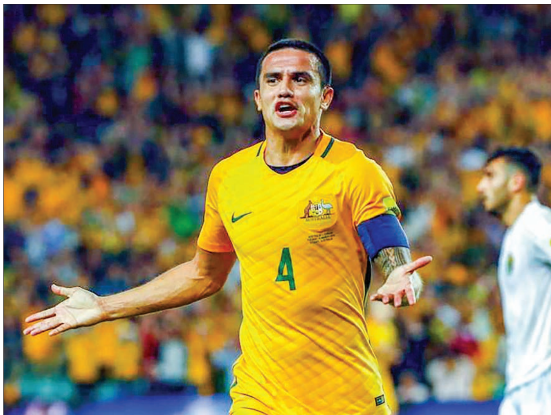
Australia's Tim Cahill.