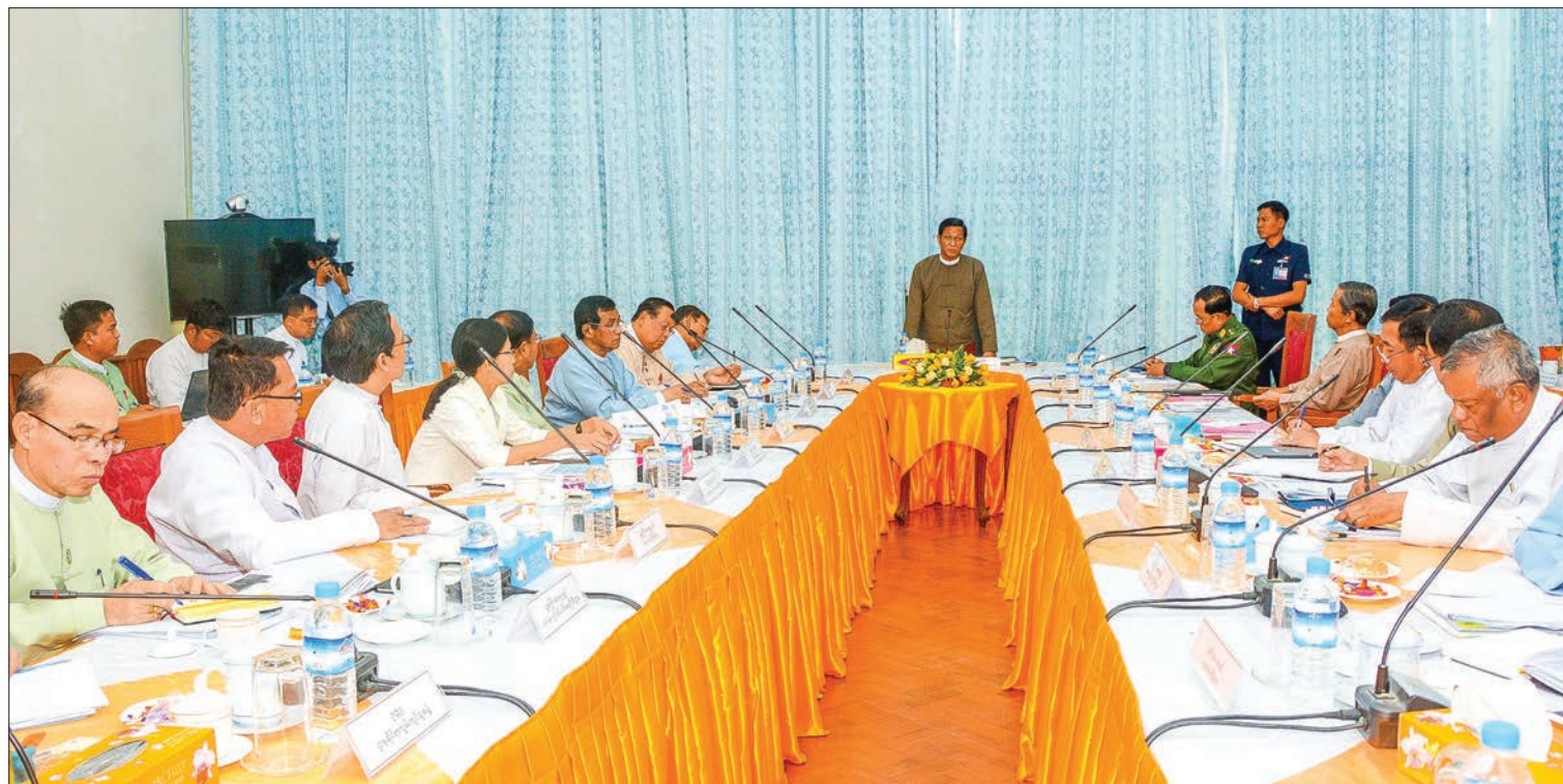
Vice President U Henry Van Thio delivers the speech at the coordination meeting of National Water Resources Committee.

Committee successfully hosted the Third Asia-Pacific Water Summit in 2017. Subject wise discussions were held in the summit and the result of the event was the Yangon Declaration.