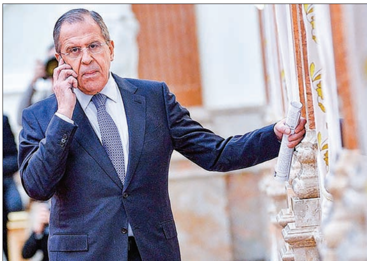
Russian Foreign Minister Sergei Lavrov.

The Syrian National Dialogue Congress is due to take place in the Russian Black Sea resort city of Sochi on 29-30 January. The peace conference is expected to bring together about 1,500 participants from the entire spectrum of Syria's political forces.—Tass ■