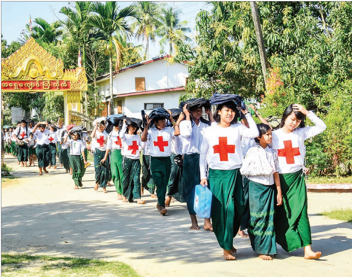
Schoolchildren take part in the first tsunami preparedness drill at Basic Education High School 1 in Kungyangon yesterday.