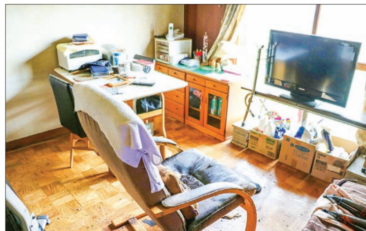
File photo taken in November 2017 in Asahikawa, Hokkaido, shows an apartment room where a 68-year-old man was found dead on a chair alone about a month after his death. More people in Japan are living alone but what is particularly alarming is their identity: mainly men with loose ties to their local communities.

People living alone will make up nearly 40 per cent of all households in 2040, according to a prediction by the same national research institute. Some companies see the rise of elderly people living alone as a unique business opportunity. Venture startup PowerElec based in Nagoya, west of Tokyo, has developed a device already on the market that can gauge power consumption between home appliances, such as television sets, and