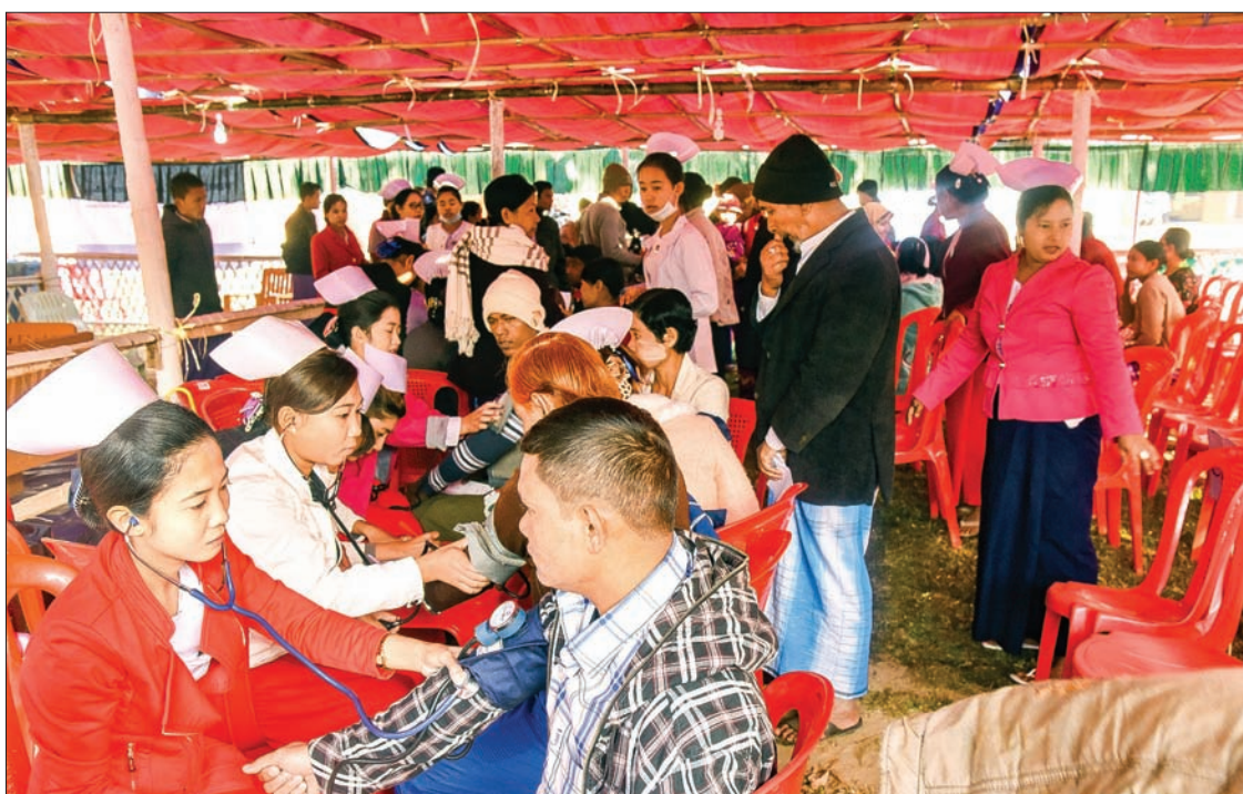
People receive medical check-ups provided by nurses in Buthidaung. PHOTO: AUNG MIN

The government has also arranged accommodation for patients who come from other areas. —Aung Ye Twin/ Ko Min ■