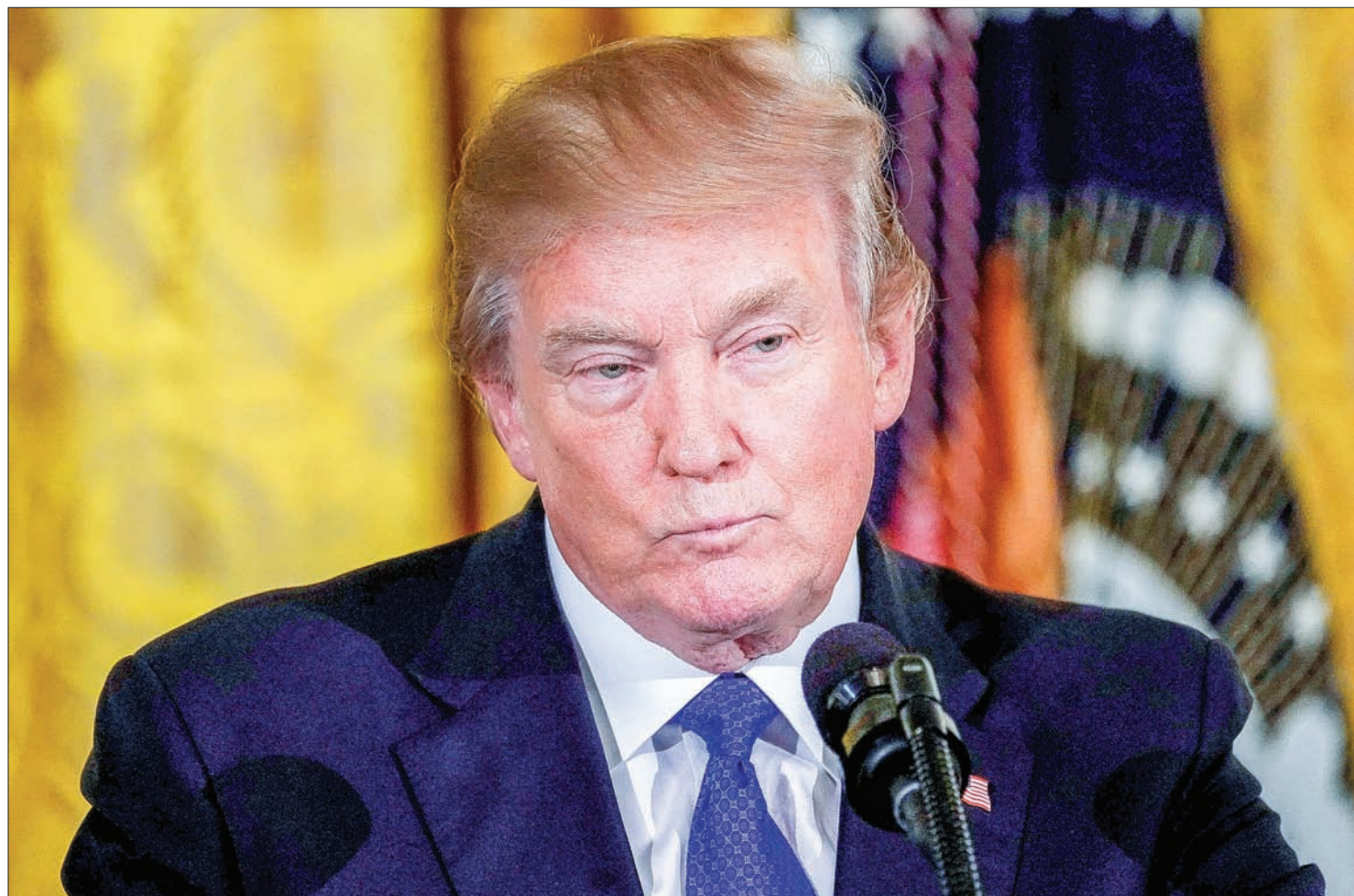
US President Donald Trump.