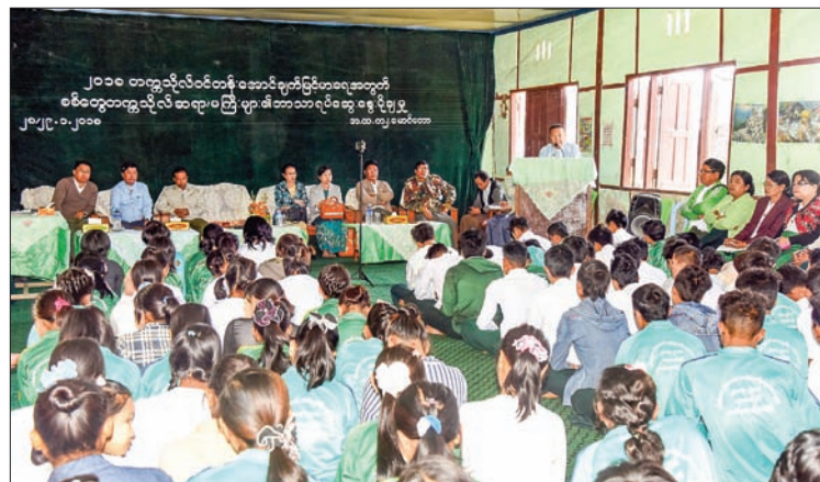
Faculty members meeting with schoolchildren in Maungta.

A SEMINAR was held at B.E.H.S No. (2) in Maungta Township to discuss ways to raise the number of qualified applicants for the 2018 entrance exams.