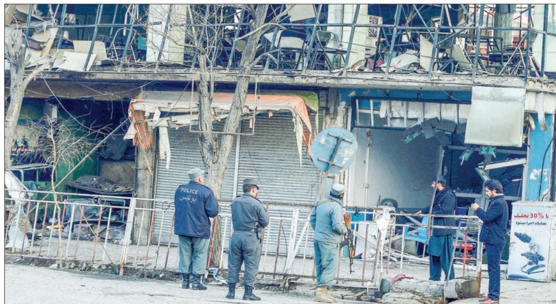
Afghan policemen inspect the site of a bomb attack in Kabul, Afghanistan on 28 January, 2018.

US President Donald Trump, who last year sent more American troops to Afghanistan and ordered an increase in air strikes and other assistance to Afghan forces, said the attack "renews our resolve and that of our Afghan partners".—Reuters ■