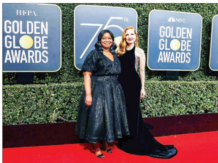
Octavia Spencer, Jessica Chastain pose at 75th Golden Globe Awards - Arrivals - Beverly Hills, California, US on 7 January, 2018.