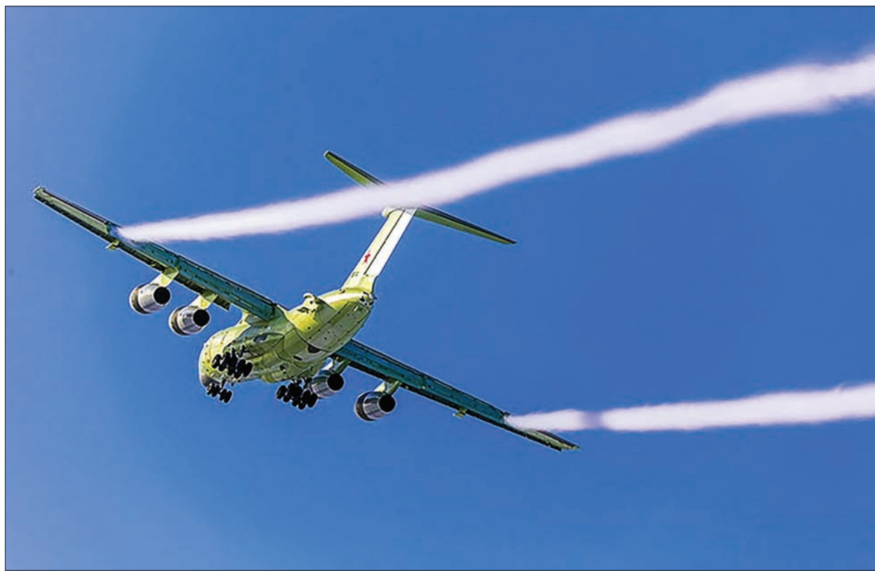
The perspective aerial refueling plane boasts an increased flight range thanks to its four new-generation engines.

"Today the upgraded Il-78M-90A aerial tanker performed its first flight, which lasted 35 minutes. The new plane differs from its predecessor by its modified wing, new engines and the control system, and also has a large lifting capacity and a big volume of fuel carried aboard. The plane has been developed for Russia's Aerospace