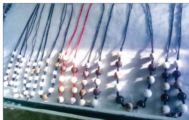
Beads made of fossilized sal trees.

On display at the museum will be high grade sal trees, one hundred and fifty-foot tall petrified wood, bracelet, beads, necklaces, and cultural items made of petrified wood from Pyu Era. Different assortment of petrified woods with varying size, color, shape and purity, various sizes of well polished petrified woods, petrified wood products and other