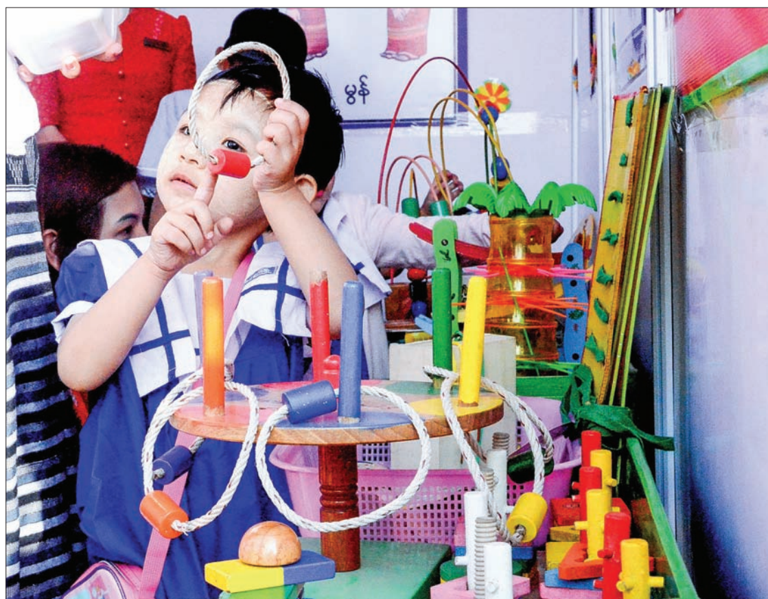
A child plays at the Children's Literature Festival in North Okkalapa Township.