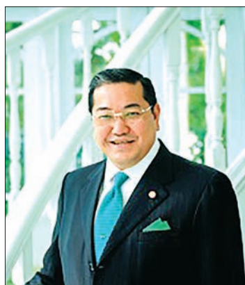
H.E. Dr. Surakiart Sathirathai.

We have seen the step by step preparation of accepting the returnees. The papers have been sent to the Bangladeshi side; they have even prepared a biometric registration for the returnees. I