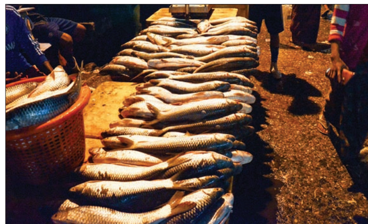
Fish stacked on display at a market for sale.

According to a research conducted by the Central Statistical Organization in 2015, 98 per cent of more than 120,000 registered businesses are SMEs. In the employment sector, of the 21.9 million workers, 83 per cent are working in unregistered SMEs. ■