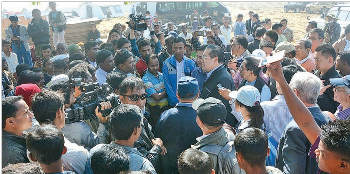
H.E. Prof. Dr. Surakiart Sathirathai meets people from Muslim Community during his visit to Maungtau.

We commend the Myanmar government in committing to