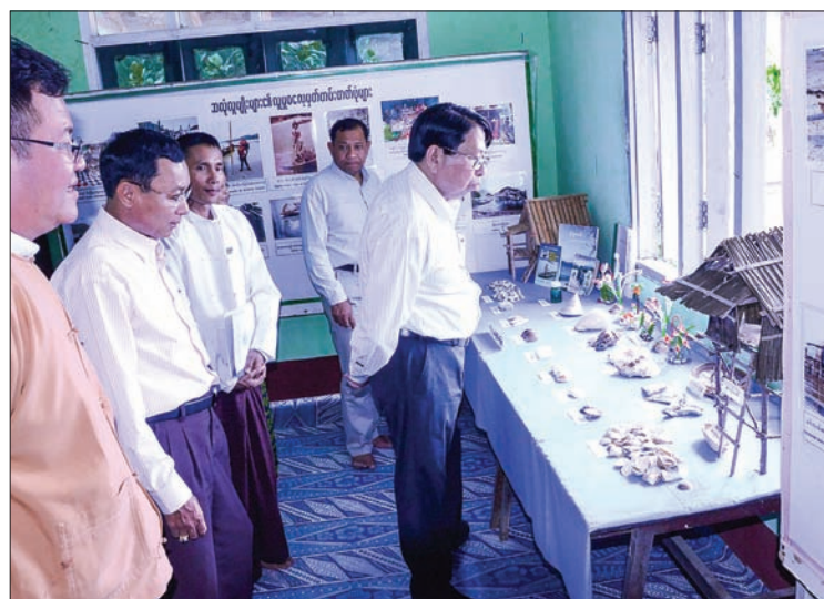
Union Minister Dr. Pe Myint visits the mini-museum at Kawthoung IPRD office.

Additionally, the union minister donated 50 set-top boxes, which were accepted by Myeik District Deputy Commissioner U Lin Ko Ko, for the use of Myeik Township. The group also visited the Zewazoe bird nest production on strand road in Myeik, Bayintnaung Hill and Bayintnaung Cape in Kawthoung Township. —Myanmar News Agency ■