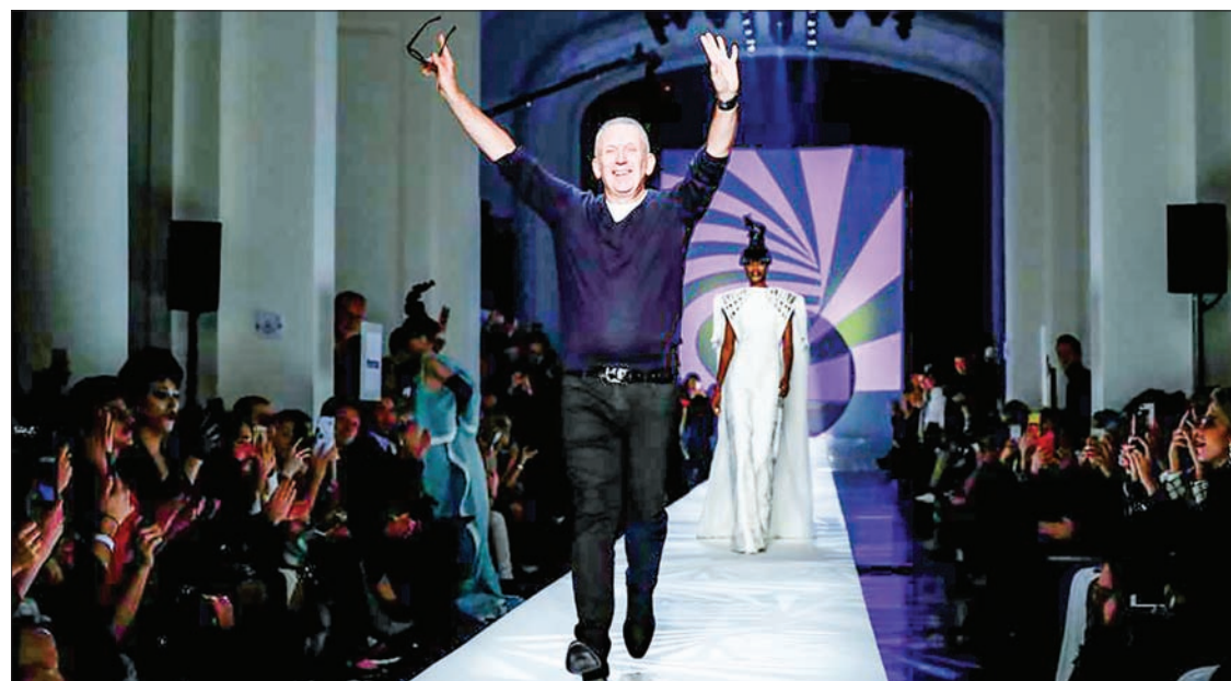
French designer Jean Paul Gaultier appears at the end of his Haute Couture Spring-Summer 2018 fashion collection in Paris, France on 24 January, 2018.

Gaultier, 65, stopped producing ready-to-wear collections in 2014 to focus on his haute couture line and perfumes. His brand is owned by Spanish perfume group Puig. The couturier, known for his irreverent and playful style, is preparing a musical stage production, the Jean Paul Gaultier Fashion Freak Show, which is billed as a pop extravaganza showcasing eccentric characters and episodes from his life. The show, which will run from October to December at the Folies Bergeres music hall in Paris, will feature new Gaultier designs as well as some referencing his most famed creations, such a conical bra worn by singer Madonna on tour in 1990. —Reuters ■