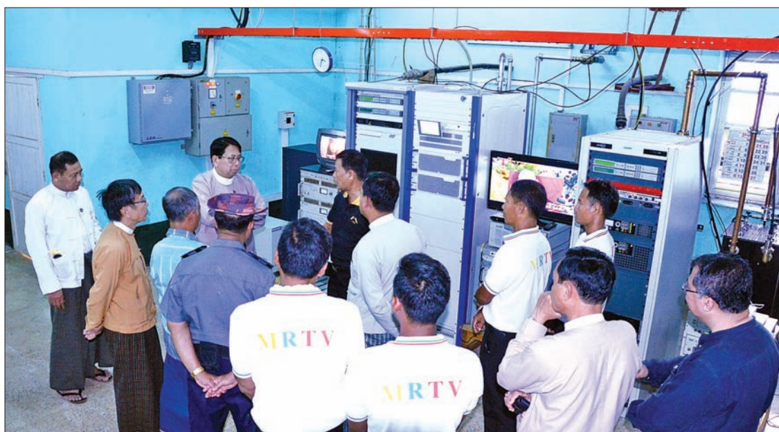
Union Minister Dr Pe Myint inspects MRTV sub-transmitting station in Launglon Township.

Union Minister for Information Dr Pe Myint inspected the offices of the Information and Public Relations Department (IPRD) in Dawei Town and the Myanmar Radio and Television (MRTV) sub-transmitting station in Launglon Township.