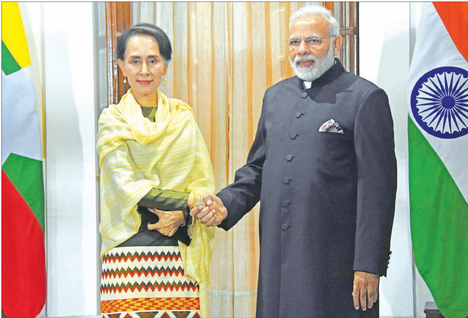
State Counsellor Daw Aung San Suu Kyi, left, meets Narendra Modi, the Prime Minister of India, in New Delhi on Wednesday.

STATE Counsellor Daw Aung San Suu Kyi met Mr. Narendra Modi, Prime Minister of India, at Hyderabad House, the state guest house, in New Delhi on Wednesday evening.