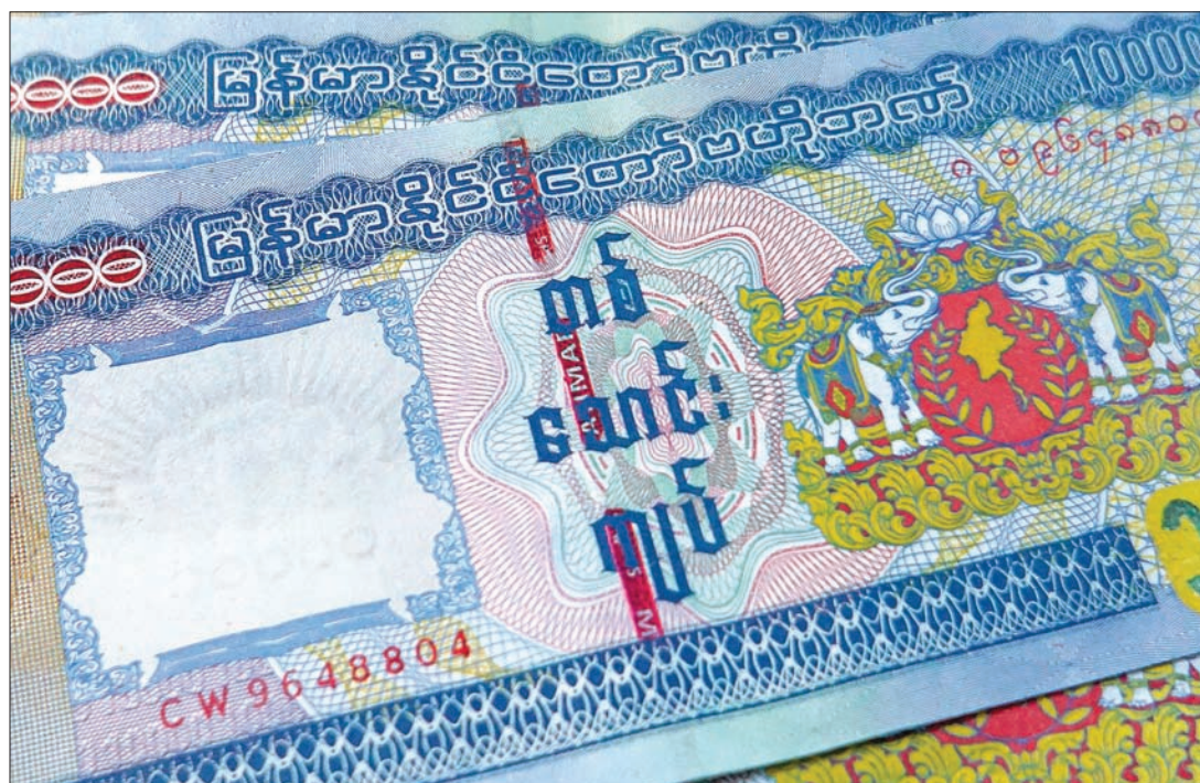
Myanmar's ten thousand kyat notes.