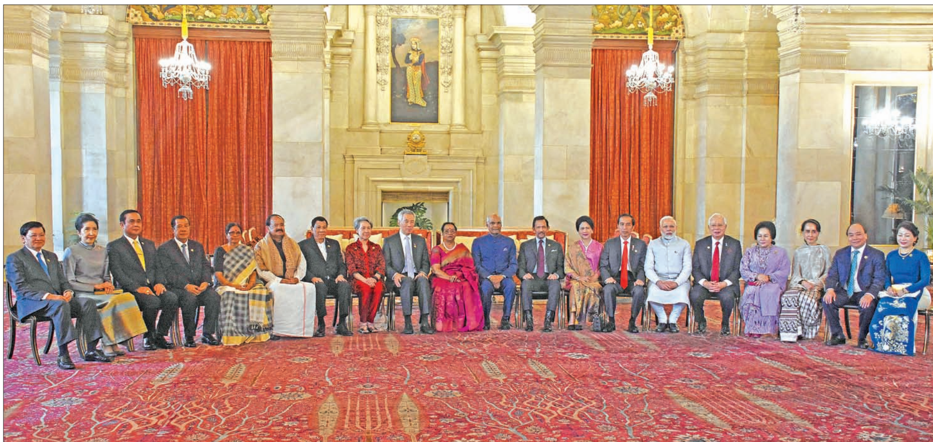
State Counsellor Daw Aung San Suu Kyi poses for a documentary photo together with Indian Prime Minister Narendra Modi and ASEAN leaders in New Delhi.