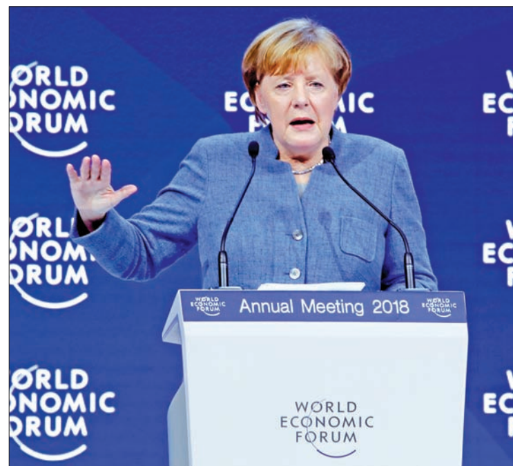
German Chancellor Angela Merkel.

However, he added that he was happy with the current level. "Where the dollar is is not a concern of mine."—Reuters ■