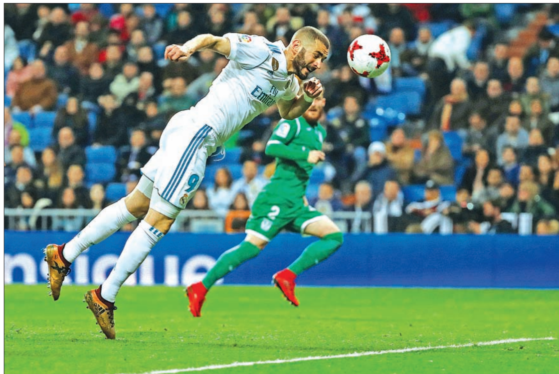
Real Madrid's Karim Benzema in action at Quarter Final Second Leg of Spanish King's Cup at Santiago Bernabeu in Madrid, Spain on 24 January, 2018.

The visitors were deservedly level on aggregate after half an hour as a mishap between Achraf Hakimi and Nacho allowed Javier Eraso the space to produce a stunning finish from outside the box. Beavue sent a volley into the side netting on the stroke of halftime as a shell-shocked Real were jeered off the pitch at the break. That appeared to bring about a reaction from the home side and Karim Benzema produced a neat finish from an acute angle immediately after the restart to put Zinedine Zidane's