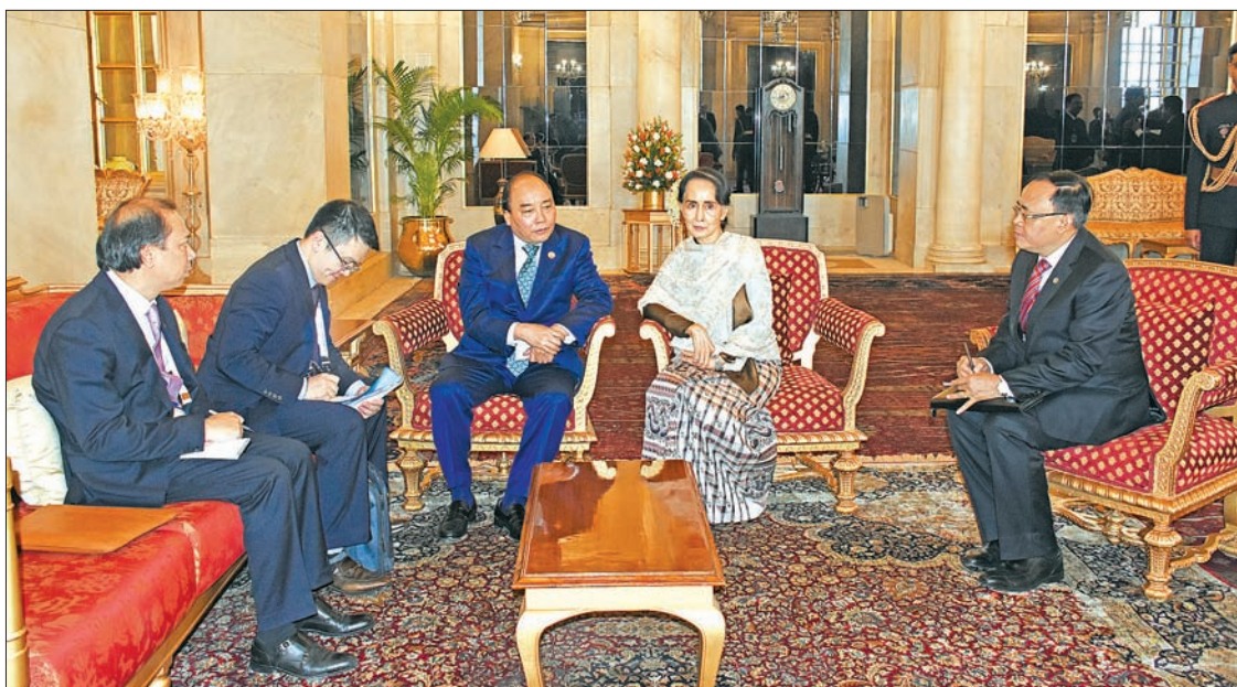
State Counsellor Daw Aung San Suu Kyi holds talks with Vietnamese Prime Minister Nguyen Xuan Phuc at the Presidential Palace of India in New Delhi.

At the luncheon, the Indian Prime Minister and ASEAN Chairman Lee Hsien Loong raised a toast together with the other leaders.—GNLM ■