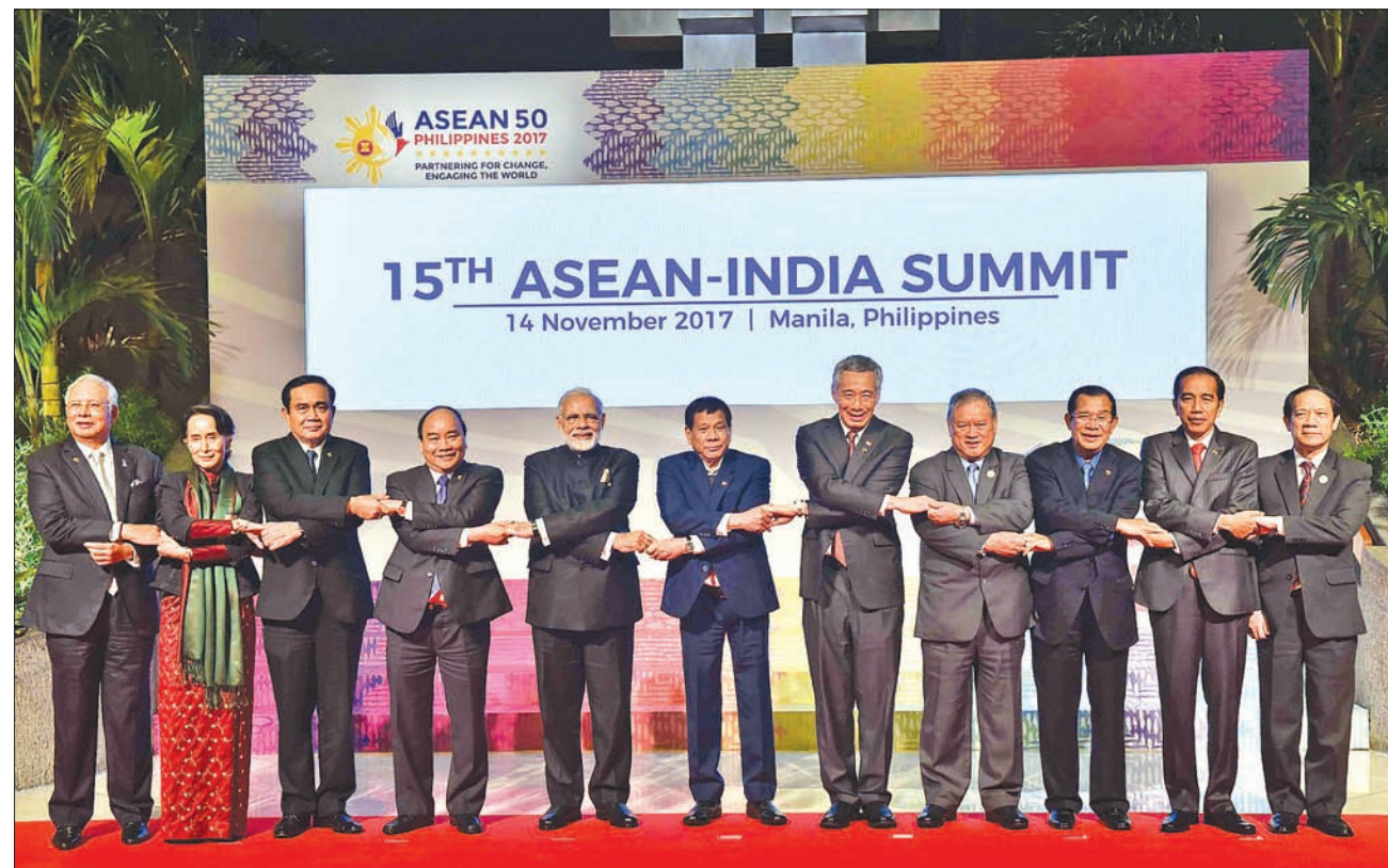
Narendra Modi, Prime Minister of India (5 th left), and ASEAN leaders pose during a family photo in Manila on 14 November, 2017.

More than two decades ago, India opened itself to the world with tectonic changes. And, with instincts honed over centuries of interaction, it turned naturally to the East. Thus began a new journey of India's reintegration with the East. For India, most of our major partners and markets – from ASEAN and East Asia to North America – lie to the East. And, Southeast Asia and ASEAN, our neighbours by land and sea,