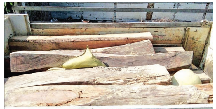
Illegal teak seized on Monywa-Homalin Road, Mawlaik.

On the same day, the team seized 14 Tamalan teak logs 2.5338 ton, worth Ks 1,013,520, from a vehicle driven by Aung Moe Oo with Aung Kyaw Lin onboard, at milepost 35/7 on Monywa- Homalin Road.—Mawlike Thalay ■