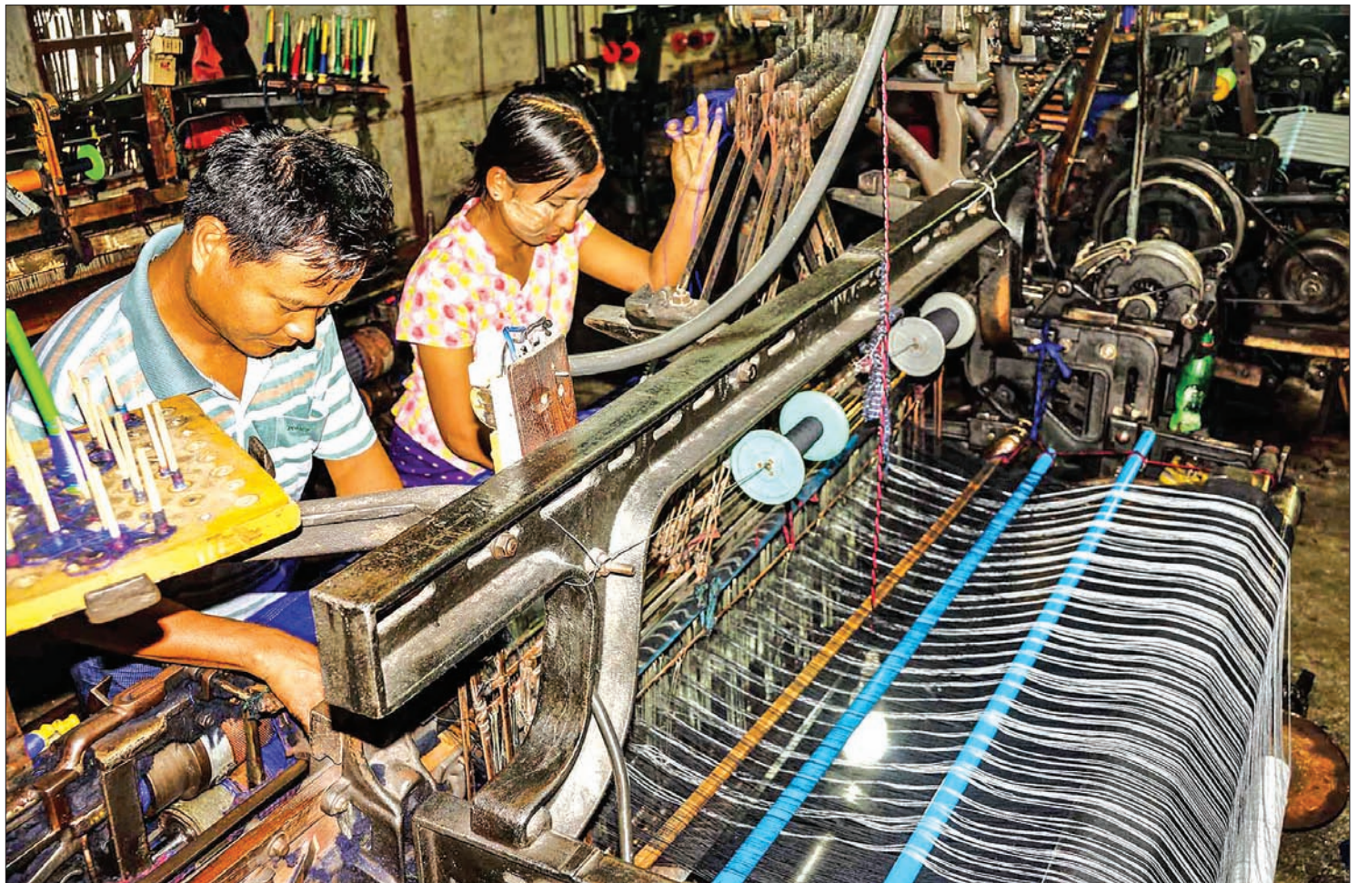
Two workers check the quality of a production of textiles rolling out from a weaving machine in Meiktila, Mandalay Region.

Due to limitation of space we are only able to publish "Letter to the Editor" that do not exceed 500 words. Should you submit a text longer than 500 words please be aware that your letter will be edited.