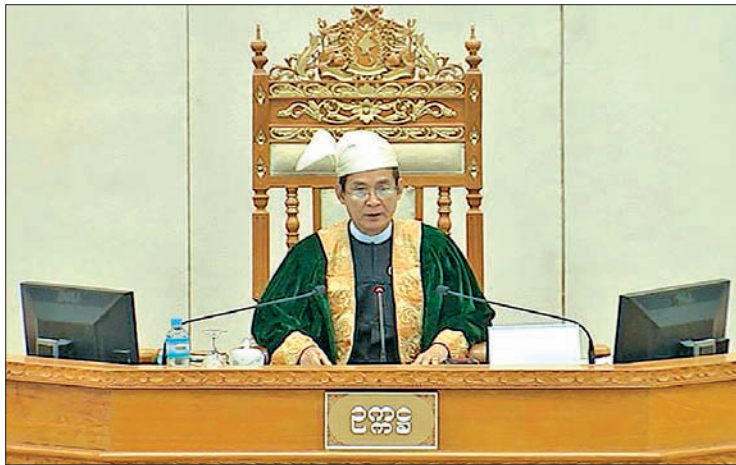
Speaker of Pyithu Hluttaw U Win Myint.