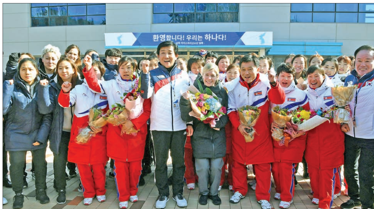
North Korean women's ice hockey players arrive at the South Korea's national training centre on 25 January, 2018 in Jincheon, South Korea.

Another security analyst, who declined to be named, said a “pact was better than not having a pact” but added that entrenched mistrust between nations, and between different counter-terrorism agencies within nations, had to be overcome for it to be effective. —Reuters ■