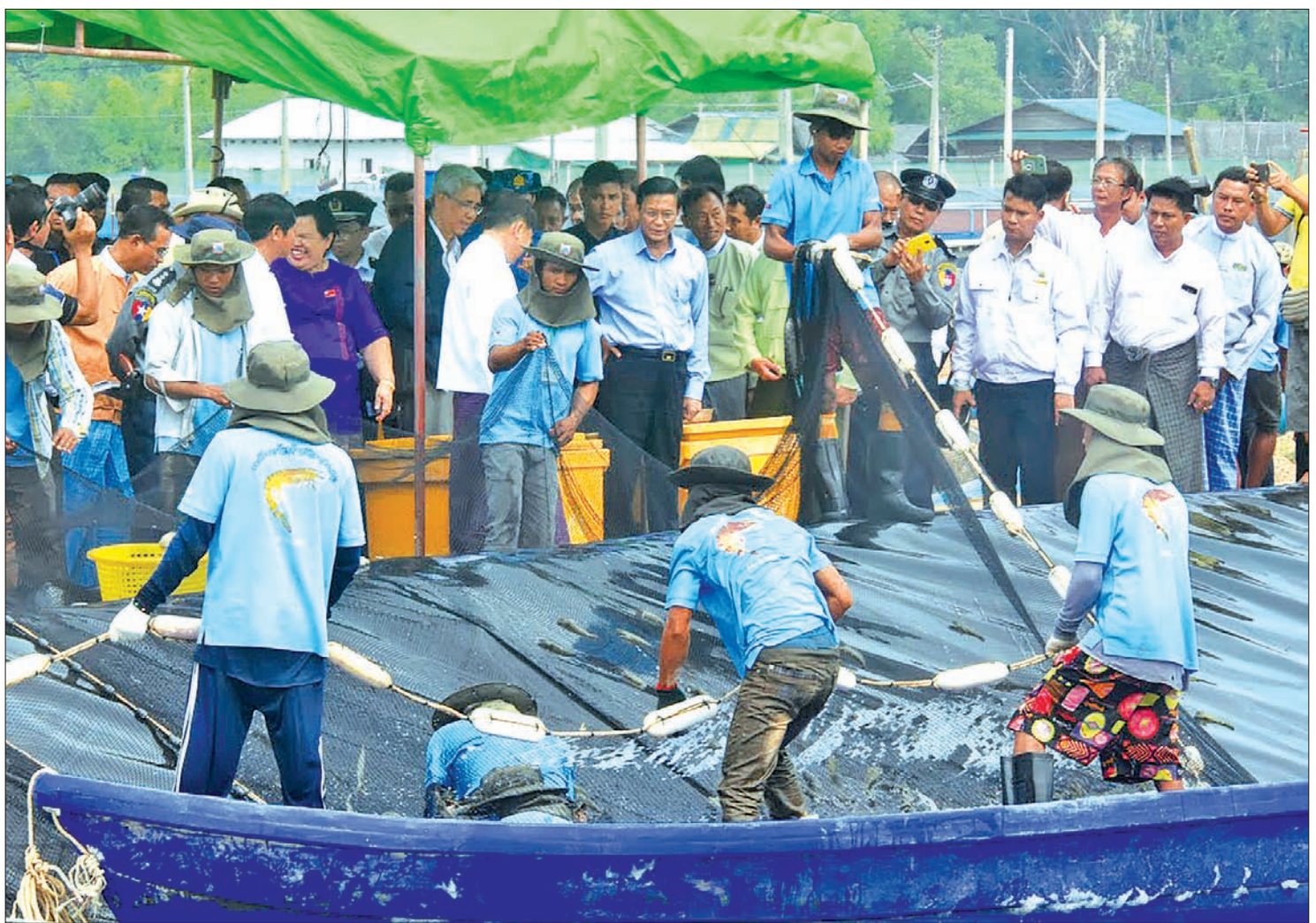
Vice President U Henry Van Thio visits seawater prawn breeding plant in Myeik, Taninthayi Region.

Recently, the price of local sunflower oil was Ks 4,300 per viss in the local oil market, while sunflower oil imported from abroad was selling for Ks 9,000 to Ks 12,000 for four viss.—GNLM■