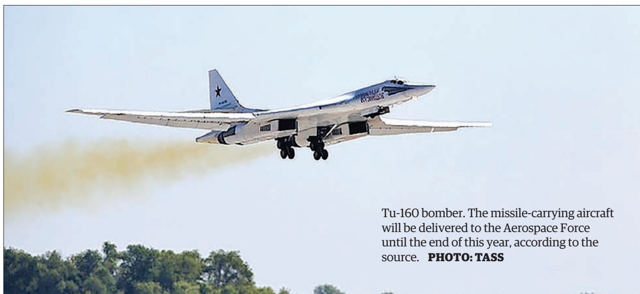
Tu-160 bomber. The missile-carrying aircraft will be delivered to the Aerospace Force until the end of this year, according to the source.