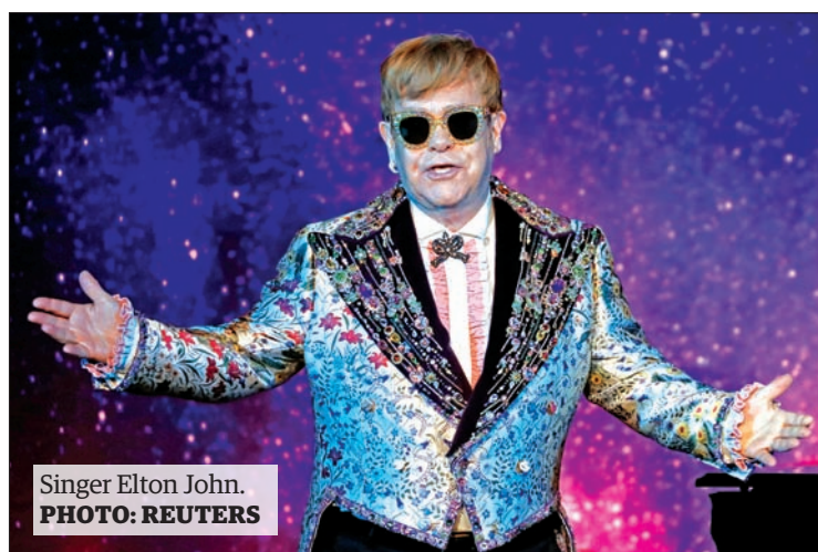
Singer Elton John.

“It will be a wonderful way to thank people,” he said. “It’s a way of going out with a bang.