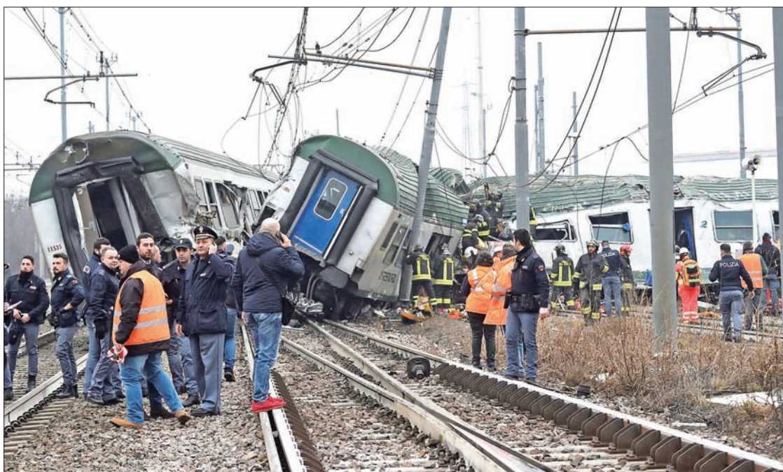
Rescue workers and police officers stand near derailed trains in Pioltello, on the outskirts of Milan, Italy on 25 January, 2018.

Television footage showed fire brigades trying to free people trapped inside the wagons of the train, which were bent by the impact.