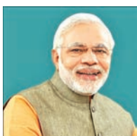
By Narendra Modi, Prime Minister of India

TODAY, 1.25 billion Indians will have the honour to host ten esteemed guests – leaders of ASEAN nations – at India's Republic Day celebrations in our capital, New Delhi. Yesterday, I had the privilege to host the ASEAN leaders for the Commemorative Summit to mark 25 years of ASEAN-India Partnership. Their presence with us is an unprecedented gesture of goodwill from ASEAN nations. Responding to this, on a winter morning, India has come out to greet them in a warm embrace of friendship.