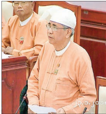
Deputy Minister for Transport and Communications U Kyaw Myo.

urement of the farmlands affected by the Minbu-An railroad section in Minbu (Saku) Township were made, and based on the confirmation by the Magway Region farmland management group, a compensation award of Ks72.933 million for 31.66 acres in the Kanyay village tract, Minbu Township, was made in the 2016-2017 fiscal year. The assessment and measurement of the remaining farmlands in the four affected village tracts are being made, and once the