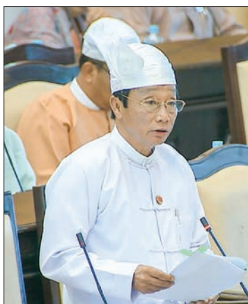
Deputy Minister for Agriculture, Livestock and Irrigation U Hla Kyaw.

During the meeting, a question by U Myint Naing of Rakhaing State constituency (5) on the plan to distribute piped water to five wards in the town of Kyauktaw Township was answered by Deputy Minister for Agriculture, Livestock and Irrigation U Hla Kyaw. The piped water that is being distributed to five wards in the town is supplied from Shaukchaung Dam, and according to a test conducted by the irrigation department, the water contains iron, manganese, aluminium and slurry. The water from Shaukchaung Dam flows directly to a water collection tank and two settling tanks. More slurry entered the water when the water from the dam was directly distributed