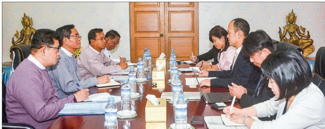
U Aung Hla Tun, Deputy Minister for Information holds talks with Japan MIC delegation.

building I-11 in Nay Pyi Taw, yesterday morning. During the meeting, they discussed bilateral relations and co-operation between the two countries, trade and investments.— Myanmar News Agency ■