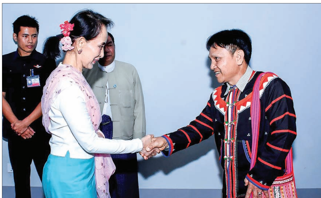
Daw Aung San Suu Kyi welcomes Kya Khun Sar, Chairman of Lahu Democratic Union.

New Mon State Party and Lau Democratic Union 23 January 2018, Nay Pyi Taw