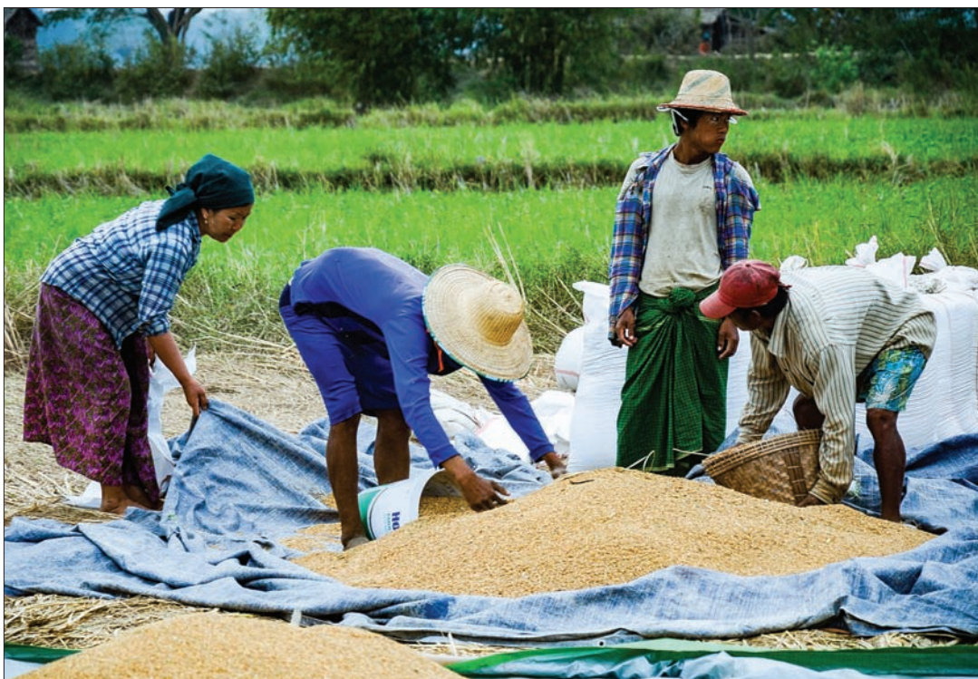
Farmers work as they harvest paddy at a village in Kangyidauk, Ayeyawady.

“Fuel prices are not stable even in the international markets. This affects the local fuel market. Experts predict that fuel prices are expected to increase in the domestic market, as fuel prices usually rise in the high season,” a retailer said.—GNLM ■