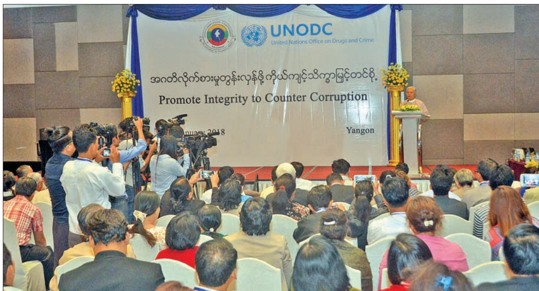
Chairman of the Anti-Corruption Commission U Aung Kyi delivers the speech at the 2 nd day of the paper reading on anti-corruption held in Yangon.

on “Reduction in Corruption in Jail,” and U Win Myint Than read a paper on “Overtaking Singapore.”