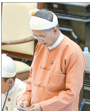
Union Minister for Hotels and Tourism U Ohn Maung.

In the past, the settling tanks were cleaned and chlorinated once every three months but will now be cleaned every month to enable the distribution of clean water. Water will be collected in the collection tanks during the night, and it will be allowed to settle for six hours before being distributed in the daytime. Extension works will be conducted in the 2018-2019 fiscal year with funds from the state government, replied the deputy minister, together with a reply from the Ra-