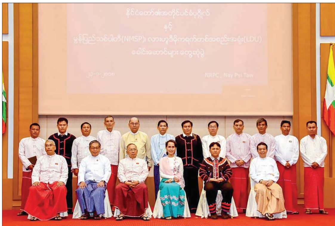
State Counsellor Daw Aung San Suu Kyi poses for documentary photo together with delegations of the New Mon State Party (NMSP) and the Lahu Democratic Union and officials.

Also present at yesterday's meetings were the Union Minister for the State Counsellor's Office U Kyaw Tint Swe, Peace Commission Chairman