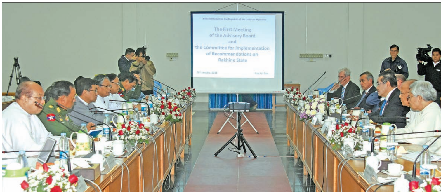
First meeting of the Advisory Board and the committee for implementation of the recommendations on Rakhine State held in Nay Pyi Taw yesterday.

Minister for Office of the State Counsellor U Kyaw Tint Swe said the stability, peace and development in Rakhine State depends not only on the people of Myanmar but the entire human society, especially the two societies in Rakhine State. With regard to the events in Rakhine State, the country had formed an inquiry commission, led by Vice President U Myint Swe, and an advisory commission on Rakhine State, led by former UN Secretary-General Kofi Annan.