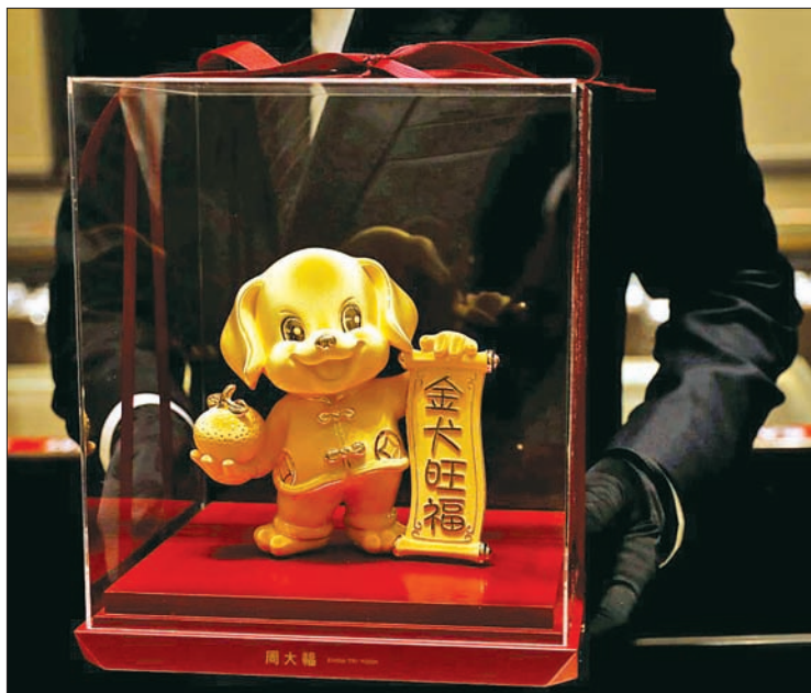
A staff poses with a dog-shaped gold figurine, at Chow Tai Fook Jewellery store ahead of the Lunar Year of the Dog in Hong Kong, China on 14 December, 2017.

million people of various backgrounds each month, she said. "One of the considerations we take in when we work on decoration concepts for Pavilion KL is to create something highly experiential... and also to be socially accepting (for) all," she said. Twelve