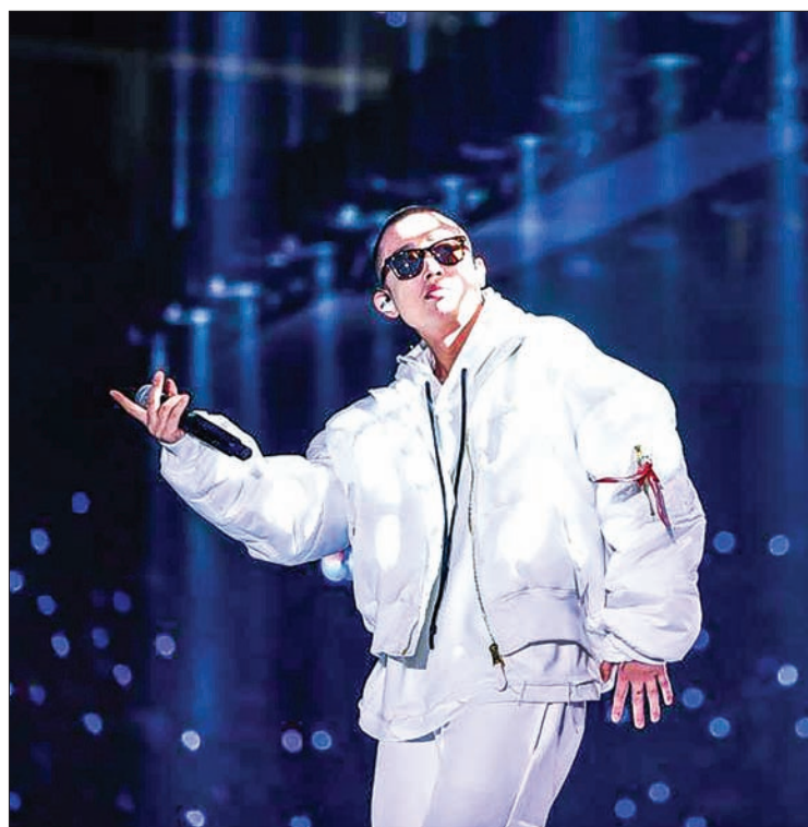
Chinese rap singer Zhou Yan, better known by his stage name GAI, performs during a New Year concert in Guangzhou, Guangdong province, China on 31 December, 2017.

when PG One was forced to apologize for lewd lyrics, which critics said were insulting to women and encouraged the use of recreational drugs.