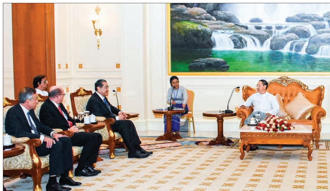
Vice President U Myint Swe holds talks with Prof. Dr. Surakiart Sathirathai, Chairman of the Advisory Board for the Committee for Implementation of the Recommendation on Rakhine State.