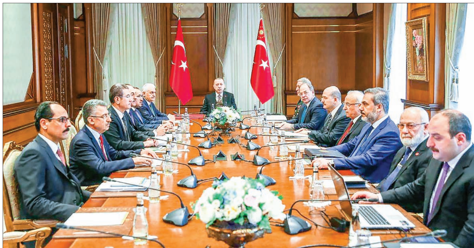
Turkish President Tayyip Erdogan chairs a security meeting in Ankara, Turkey on 23 January, 2018.

"Whether it is Manbij, Afrin, the east of the Euphrates or even threats from northern Iraq, it doesn't matter," Cavusoglu said. "If there are terrorists on the other side of our borders, this is a threat for us." —Reuters ■