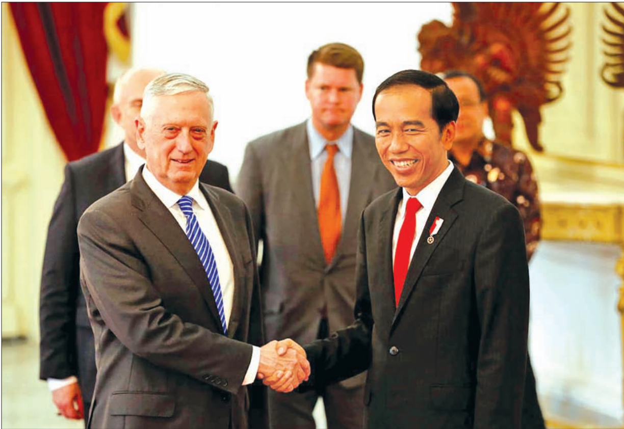
US Secretary of Defence Jim Mattis (L) shakes hands with Indonesia's President Joko Widodo during his visit to the presidential palace in Jakarta, Indonesia on 23 January, 2018.