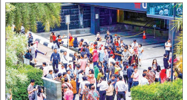
Office workers leave a building following an earthquake in Jakarta, Indonesia on 23 January, 2018.

In December, a quake of 6.5 magnitude killed at least three people when it hit Java, Indonesia's most densely populated island, at a depth of 92 km (57 miles), and buildings in Jakarta swayed for several seconds. Tuesday's quake was at a depth of 44 km (27 miles). The World Bank reckons natural disasters cost Indonesia 0.3 per cent of its GDP annually, but a 2015 report on disaster risk management prepared by Indonesia's government said a major earthquake, occurring once every 250 years, could cause losses in excess of $30 billion, or 3 per cent of GDP. —Reuters