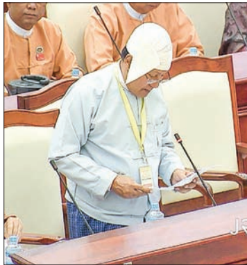
Union Supreme Court Judge U Myint Aung.

Responding to a question raised by U Win Win of Minbu constituency on the plan to pay compensation to owners of farm-