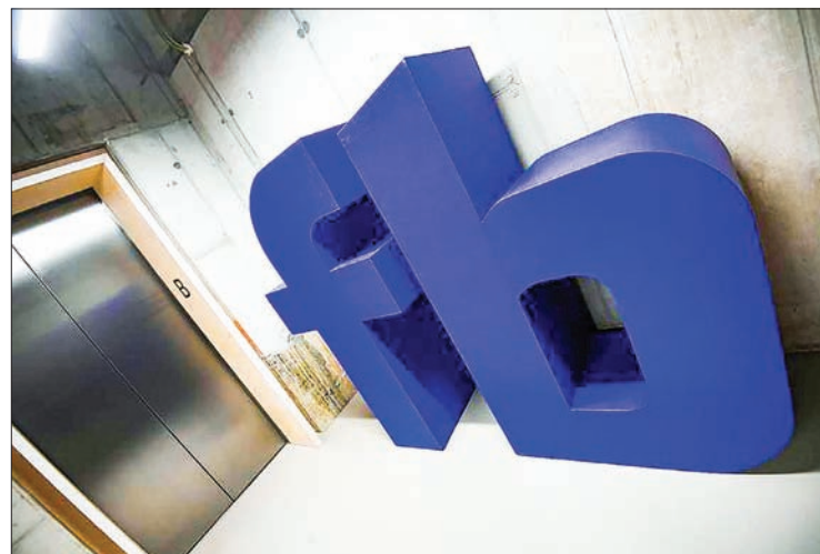
A giant logo is seen at Facebook’s headquarters in London, Britain on 4 December, 2017.

Another test of social media’s role in elections lies ahead in March, when Italy votes in a national election already marked by claims of fake news spreading on Facebook. —Reuters ■