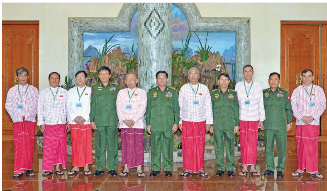
Senior General Min Aung Hlaing poses for a documentary photo together with New Mon State Party (NMSP) delegation in Nay Pyi Taw.

and the Tatmadaw is ready to cooperate”, Senior General Min Aung Hlaing said.