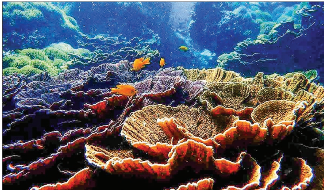
Coral reefs seen in Mergui Archipelago, Taninthayi Region.

of marine resources plays an essential role in implementing eco-tourism in the country, he added.