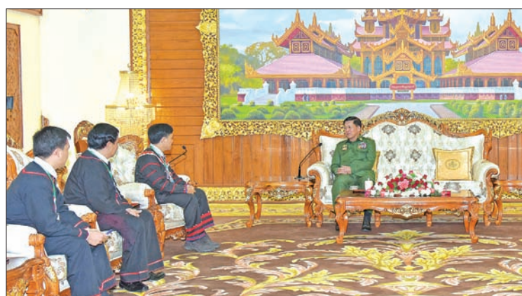
Senior General Min Aung Hlaing meets with Lahu Democratic Union delegation led by Chairman Kya Khun Sar.

“The NMSP joining with the Government and the Tatmadaw on the peace path will bring more opportunities for regional development. Removing suspicions and walking on the peace path will make the country develop more. People will also be welcoming this with much joy. The biggest desire of the Tatmadaw is stability, peace and development of the country