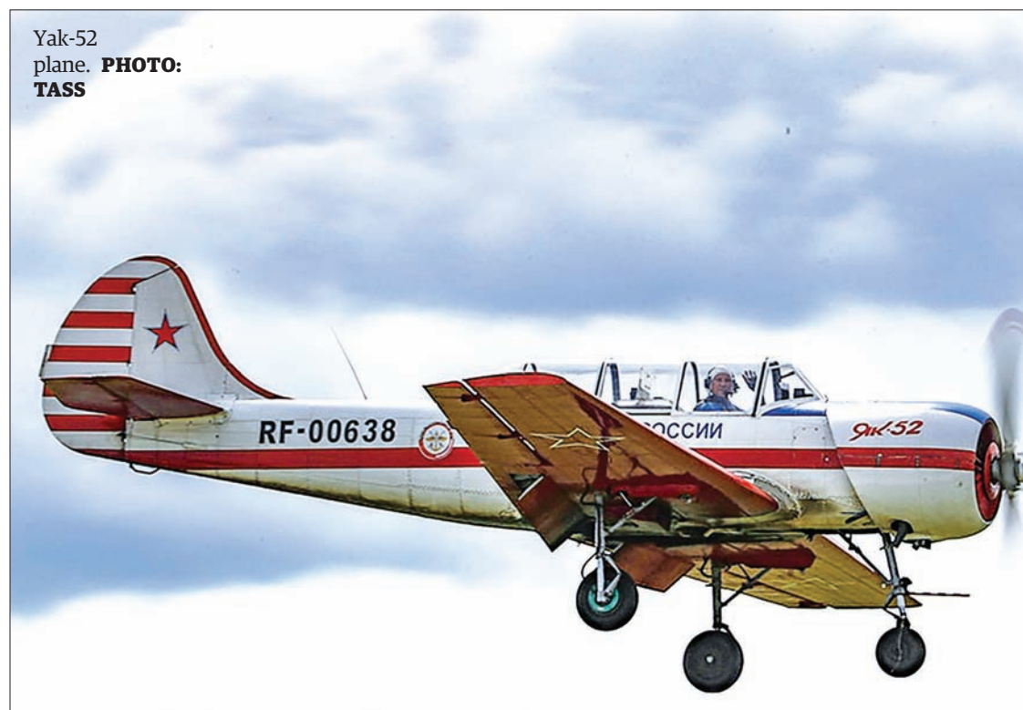
Yak-52 plane.

NOVOSIBIRSK — An aircraft engine fully made of aluminum has been developed at the Novosibirsk State Technical University. This is the first engine of this kind in the world, the Novosibirsk Region Ministry of Education, Science and Innovation Policy said on Tuesday.