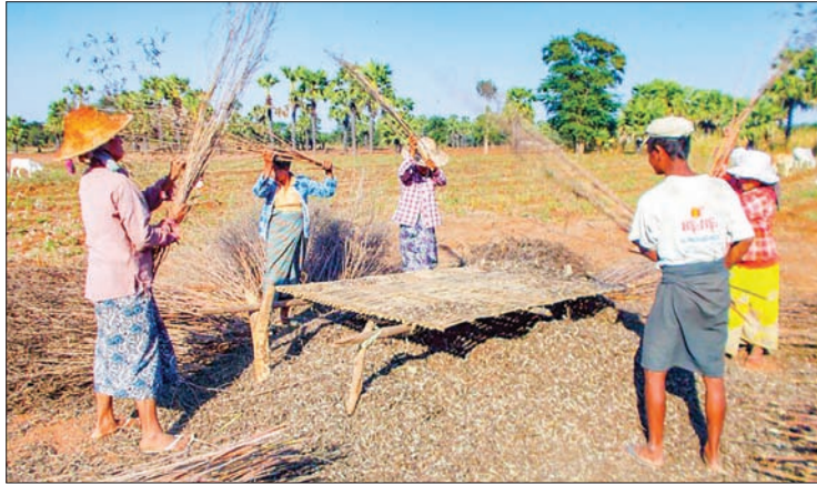
Farmers harvest pea on a farm in Mandalay Region.

A basket of pigeon peas fetches slightly more than Ks13,000 if the peas are pure. The inferior pea variety brings in only Ks10,000, while the cultivation cost is above Ks100,000. When the price declines, farmers cannot cover the harvesting cost, U Aung Aung, a farmer from Kyaukpadaung Township, told Myanmar Alinn. An acre produces only 10 baskets of pigeon peas. Some 75 to 90 baskets enter the depots in the towns daily. Freshly produced pigeon peas fetch Ks13,000 to Ks13,500 per basket, whereas the prices of old stock range from Ks11,000 to Ks11,600 per basket.