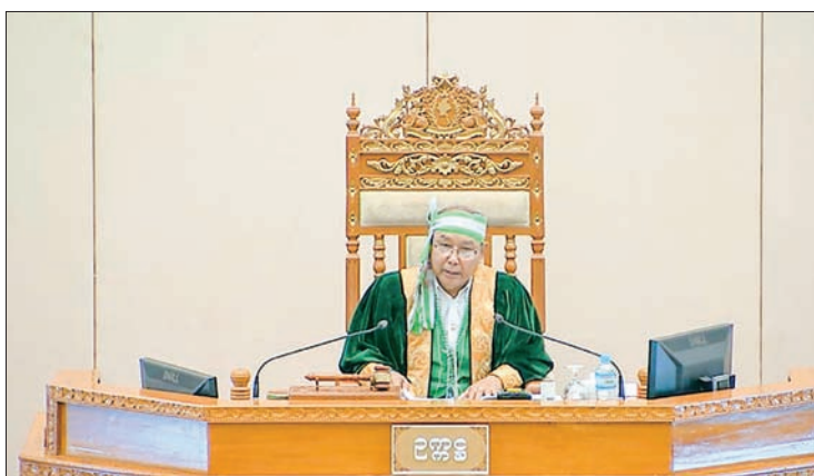
Speaker of Amyotha Hluttaw Mahn Win Khaing Than.

include the English curriculum of the proposed motion such as teaching system and assessment system (examination) that is according to the four skills assessment system. Therefore, the motion is believed to be the same as the national education strategic plan that is being implemented.