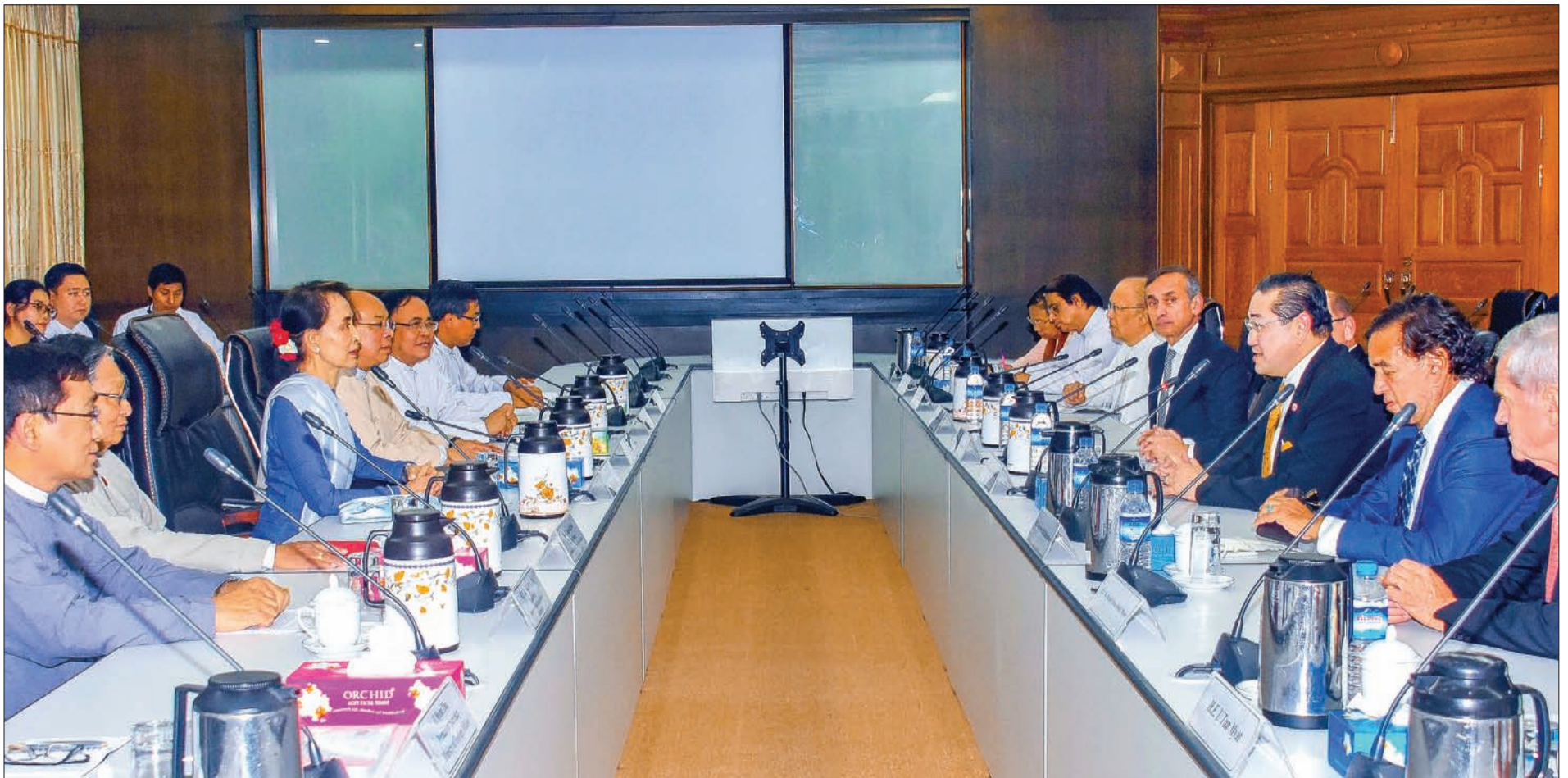
Daw Aung San Suu Kyi holds talks with Advisory Board for the Committee for Implementation of the Recommendations on Rakhine State.