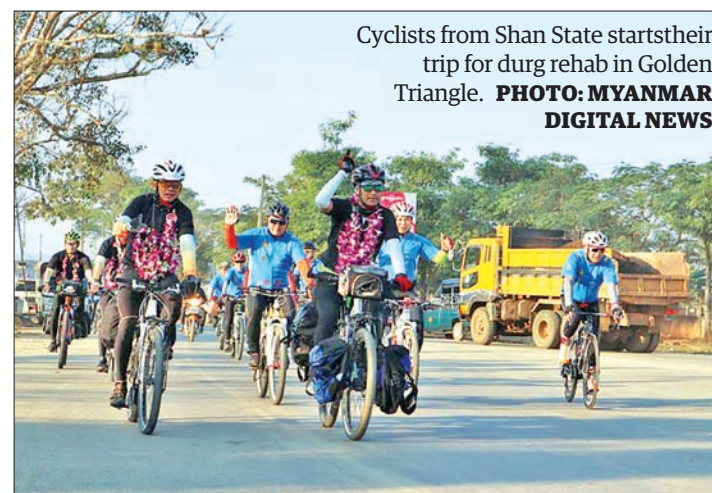
Cyclists from Shan State start their trip for drug rehab in Golden Triangle.

Lahu ethnic people welcomed their traditional new year with paying respects to elders, traditional dance and a new feast.