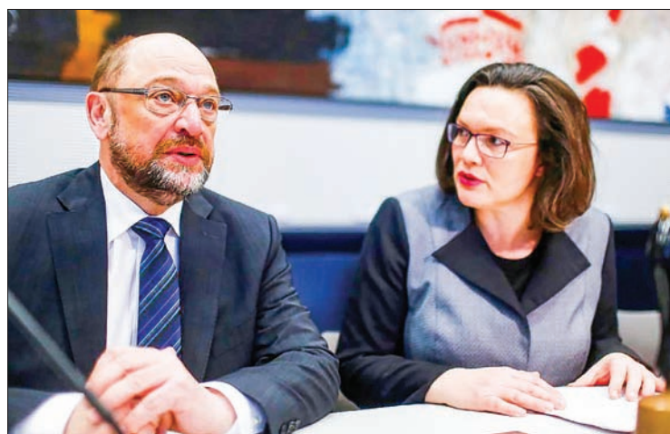
Germany’s Social Democratic Party (SPD) leader Martin Schulz and SPD parliamentary group leader Andrea Nahles attend a parliamentary group meeting in Berlin, Germany on 22 January, 2018.

He said the SPD wanted to add a “hardship provision” to an agreement on immigration