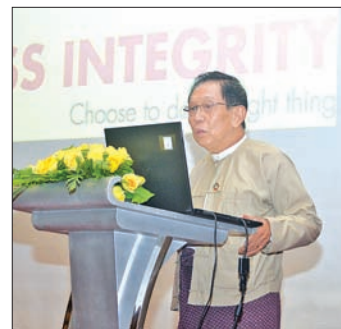
Economist Dr Aung Tun Thet.

The cooperation will be among all level of organizations