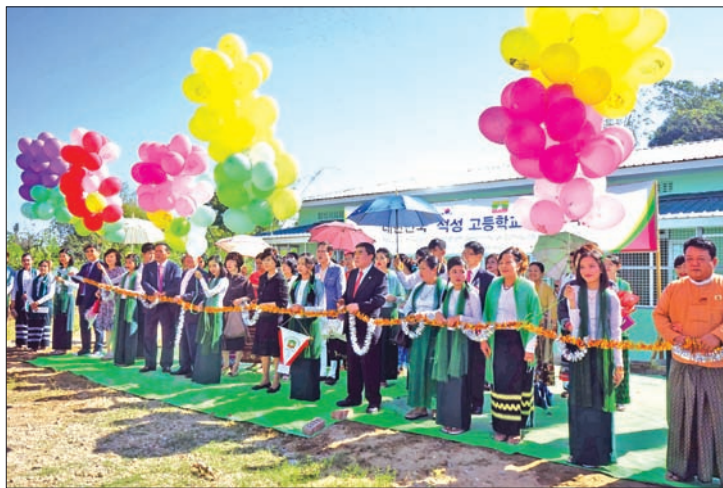
An opening ceremony of extension school takes place in Thanlyin Township, Yangon Region yesterday.