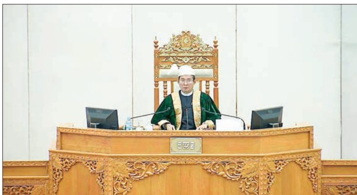
Speaker of Pyithu Hluttaw U Win Myint.

Next, Nay Pyi Taw Council member U Aung Myin Htun responded to a question raised by U Zaw Min Thein of Laymyethna constituency on a plan to collect town entry fees in more appropriate ways. He said that in coordination with the governments of the states, Rakhine and Kayah states were no longer collecting town entry fees. The Kachin State government is issuing an instruction to stop the collection of the town entry fee, while the Taninthayi region government will stop collecting it in the 2018-2019 fiscal year. The remaining states and regions have no plans to stop collecting it, stated U Aung Myin Htun.