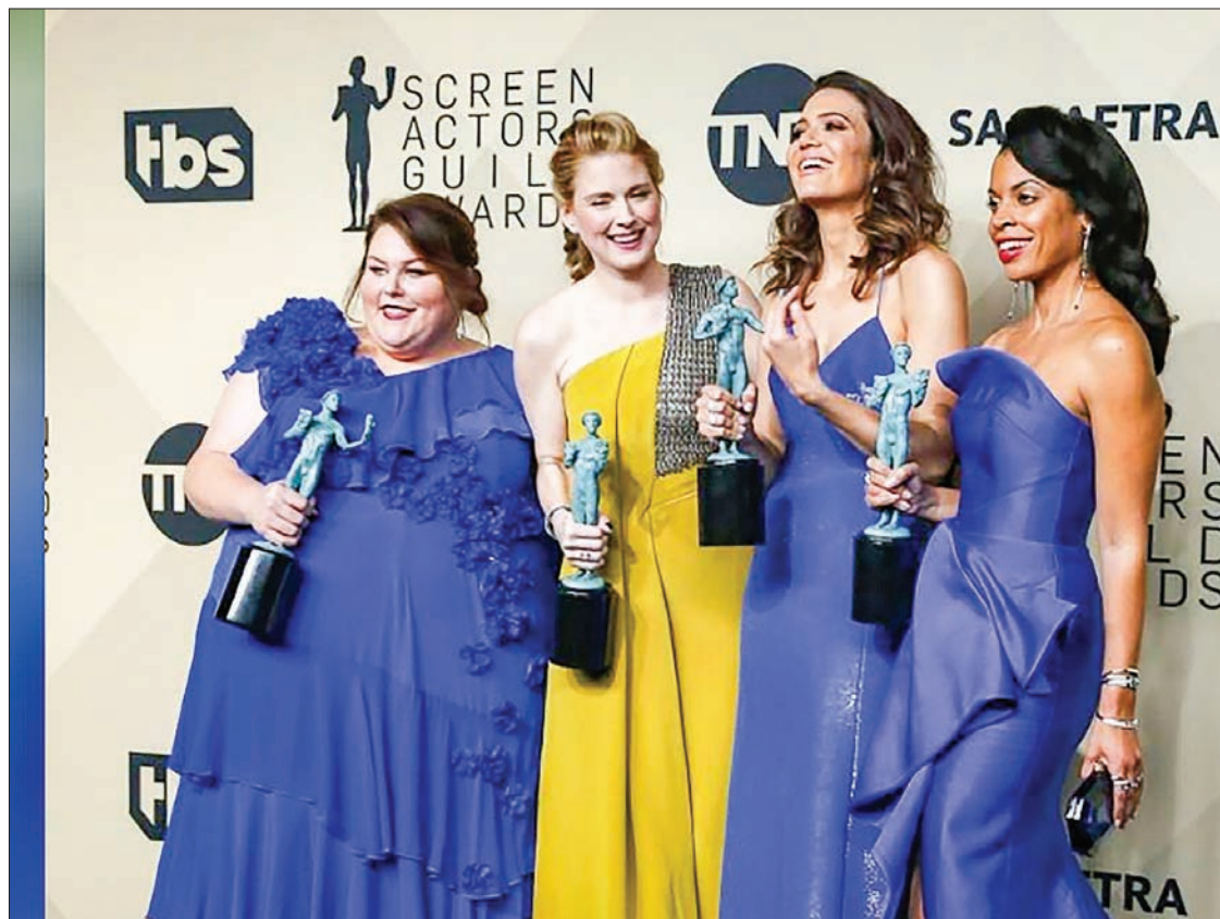
Frances McDormand (C), who won the award for Outstanding Performance by a Female Actor in a Leading Role, and the cast of “Three Billboards Outside Ebbing, Missouri” pose backstage with their awards for Outstanding Cast in a Motion Picture at 24th Screen Actors Guild Awards in Photo Room in Los Angeles, California, US on 21 January, 2018.

Host Kristen Bell said women were having a “watershed moment.”