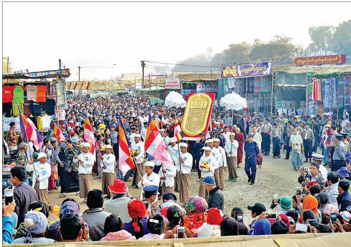
Opening ceremony of Mann Shwesettaw Pagoda Festival held in Minbu Township, Magway Region. The festival of Mann Shwesettaw Pagoda takes place every summer.

Pilgrims can visit Mann Shwesettaw all year round because the bridge, named Hlaytin on the three mile road has been completely built, with the help of donations from people. The opening ceremony was crowded with guests from different places—Myanmar Digital News ■