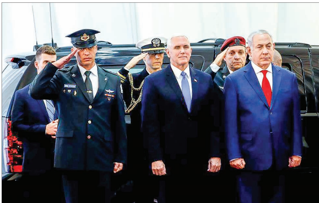
US Vice President Mike Pence (C) stands next to Israeli Prime Minister Benjamin Netanyahu (R) during a formal reception ceremony at the Prime Minister's office in Jerusalem on 22 January, 2018.