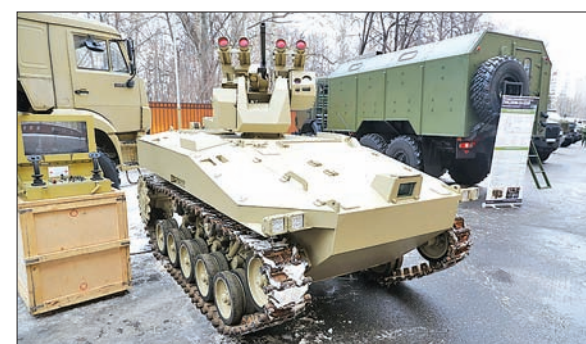
The vehicle's tracked platform can carry 7.62 mm and 12.7 mm machine guns.

The robotic system can develop a speed of up to 40 km/h. The vehicle can operate within a radius of 10 km in a remote control mode and clear visibility.—Tass ■