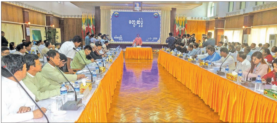
Rakhine State Chief Minister U Nyi Pu discusses matters relating to riots in Yathedaung and Mrauk U in Rakhine with state ministers, CSOs and officials.