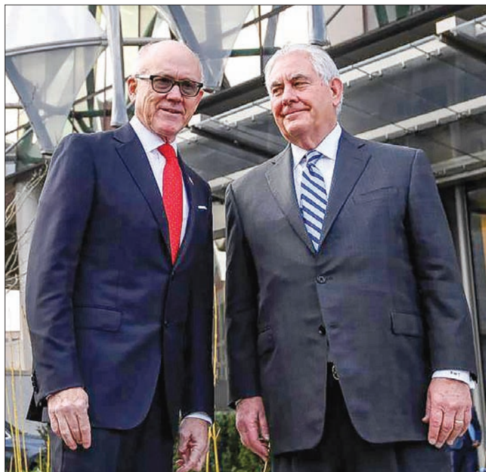
US Secretary of State Rex Tillerson and Woody Johnson, US ambassador to Britain stand outside the new US embassy in London on 22 January, 2018.

The American flag was this month removed from Grosvenor Square where the US embassy has been based since 1938 with the area known as “Little America” during World War Two, when the square also housed the military headquarters of General Dwight D Eisenhower. The new embassy is a veritable fortress set back at least 100 feet (30 metres) from surrounding buildings — mostly newly-erected high-rise residential blocks- and incorpo-