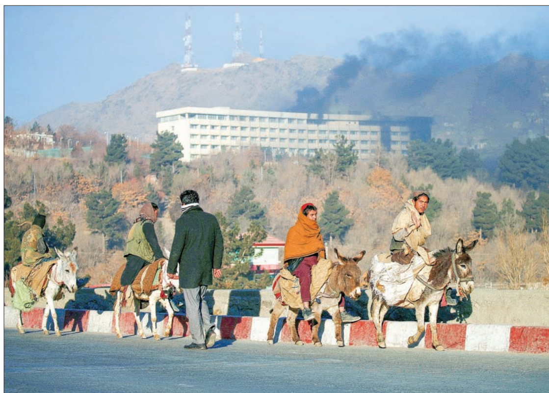
Smoke rises from the Intercontinental Hotel during an attack in Kabul, Afghanistan on 21 January, 2018.

Many of the victims were Ukrainian air crew of Kam Air and their deaths may raise questions over the willingness of foreign technical specialists to continue to work for Afghan