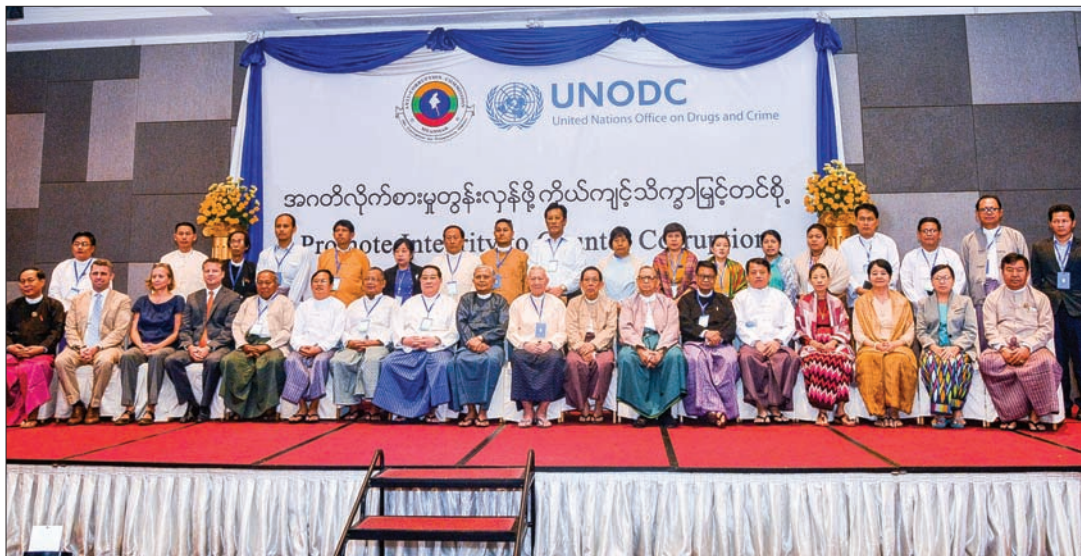
Participants pose for a documentary photo at the paper reading on anti-corruption jointly organised by the Anti-Corruption Commission and UNODC.

The commission’s aim, he said, is to lift the moral standards of citizens while they are still young. “Corruption should be regarded as our common enemy, which we must try to wipe out in our society”, he said. — Ye Ye Myint and Nandar Win ■