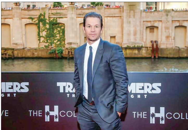
Actor Mark Wahlberg.

“Transformers: The Last Knight,” the latest in the action franchise based on toys that change from robots to vehicles, earned nine nominations, including worst picture and worst acting nods for many