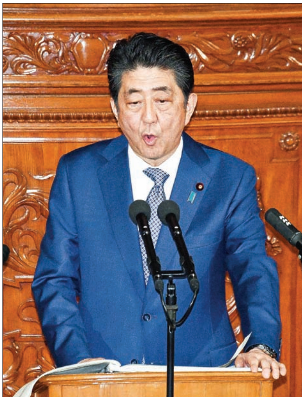
Japanese Prime Minister Shinzo Abe delivers a policy speech during a plenary session of the House of Representatives in Tokyo on 22 January, 2018, the first day of the year's ordinary parliamentary session.

parties to put forward concrete plans and advance debate to move toward realizing a first-ever amendment to the Constitution, which took effect in 1947.