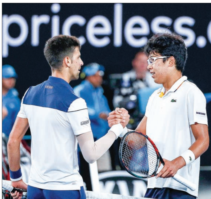
Chung Hyeon of South Korea shakes hands with Novak Djokovic of Serbia after Chung won their match in Melbourne, Australia on 22 January, 2018.

Chung moved 4-1 ahead in the second set but again Djokovic recovered, only to falter when serving at 5-6, netting a forehand on set point after Chung had shown incredible defensive skills to stay alive in the rally. Again Djokovic battled back from a break down in the third set to force a tiebreak but Chung refused to let the 30-year-old Serb off the hook. Chung hooked a mind-boggling forehand winner past Djokovic to take a 5-3 lead in the tiebreak and when Djokovic netted a return it brought up three match points.—Reuters ■