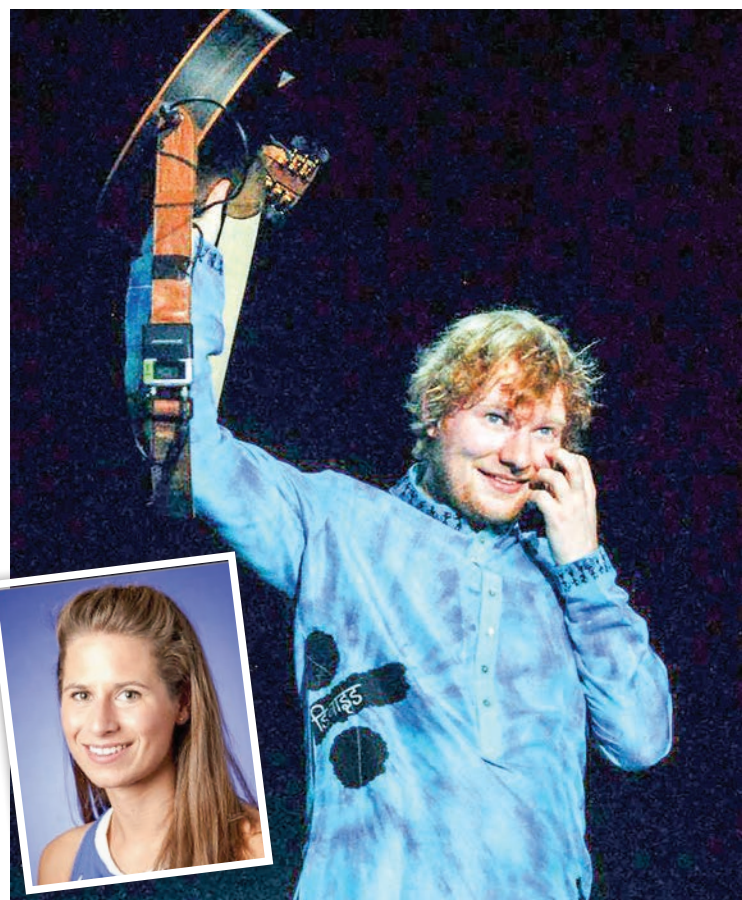
Ed Sheeran performs during the 2017 Jingle Ball at Madison Square Garden in New York, US, on 8 December, 2017.