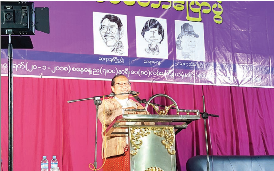
Famous poet and author Nyi Minn Nyo.