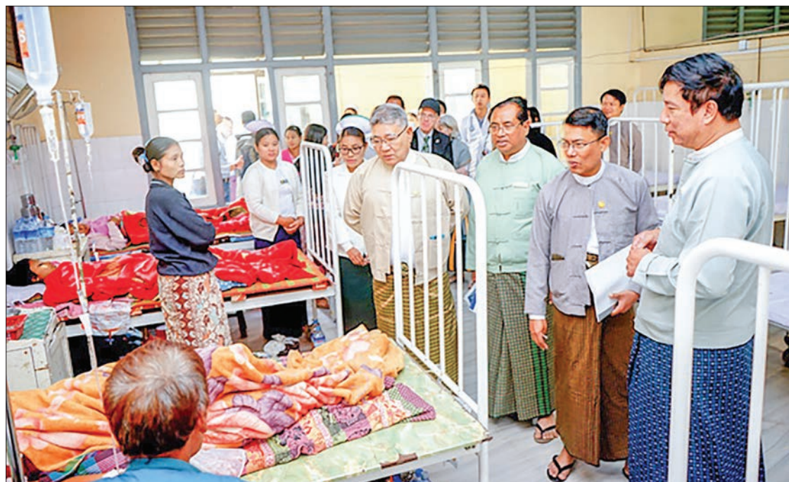
Officials inspecting a healthcare services for returnees.

medical check-ups of the returnees to determine if they are suffering from any infectious diseases. The vaccination programme for them will depend on the kind of vaccine they were given in Bangladesh. The teams will give each person 11 kinds of vaccinations. They will also measure the height, weight and health condition of the returnees.