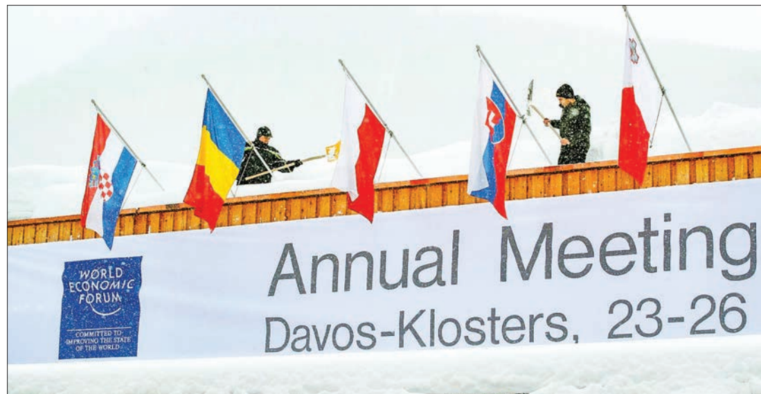
Workers shovel snow from the roof of the congress centre, the venue of the upcoming World Economic Forum (WEF) in the Swiss mountain resort of Davos, Switzerland, on 18 January 2018.

"Not all geopolitical threats are threats to financial markets," Axel Weber, the chairman of Swiss bank UBS and former president of the German Bundesbank told Reuters. "But I agree that