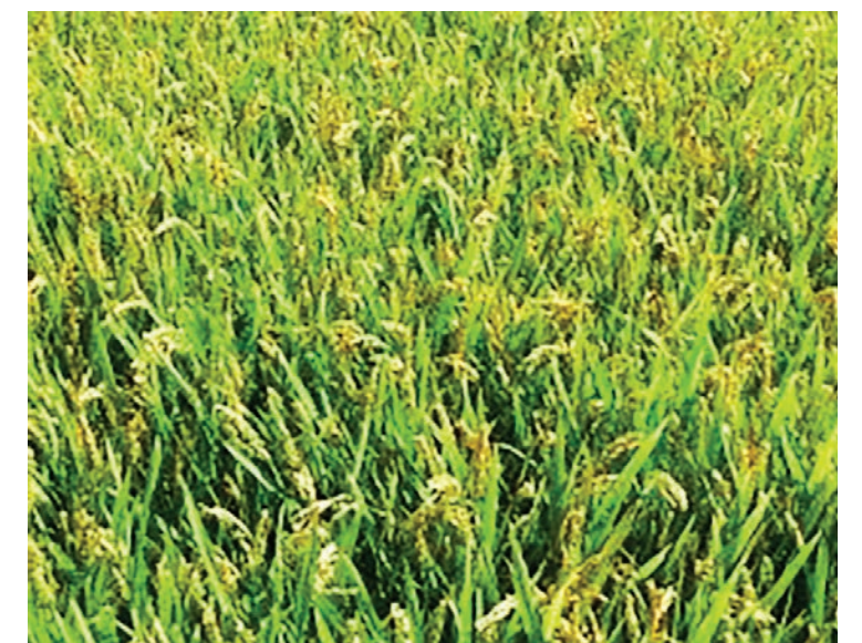
Levelling rice fields reduces the amount of water used in cultivation.