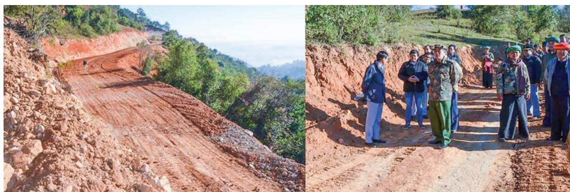
Deputy Minister Maj-Gen Than Htut inspects 4 mile stretch of road from Lwetaung to Nyaungchin.

Later, they inspected construction of the 4.4-mile Lwetaung-Kapatain-Nyaungchin(South)-Nyaungchin(East) earthen road.—Myanmar News Agency ■