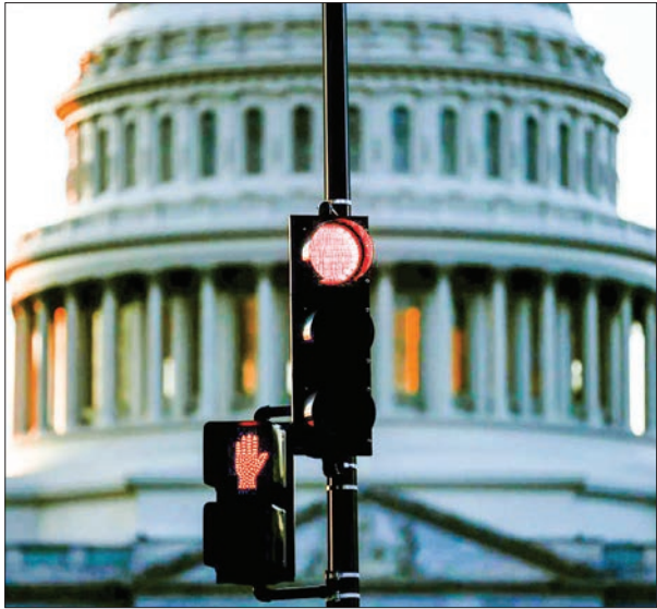
A traffic light shines red after President Donald Trump and the US Congress failed to reach a deal on funding for federal agencies in Washington, US, on 20 January 2018.

locked in a standoff with Democrats. Republicans, who have a slim Senate majority, said they would not negotiate on immigration until the government was reopened. Democrats say short-term spending legislation must include protections for young undocumented immigrants known as “Dreamers.” —Reuters ■