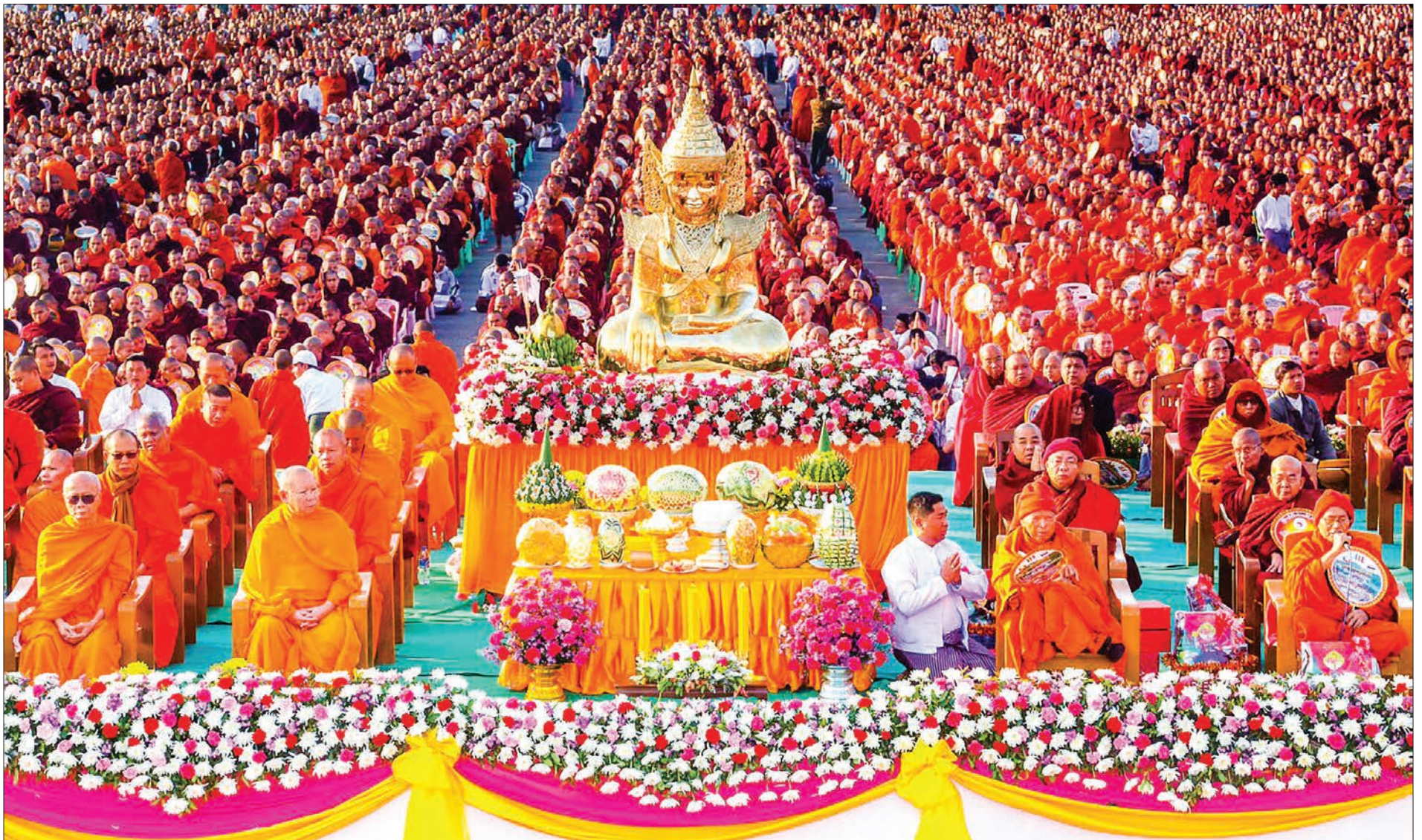
Mandalay hosts a grand religious ceremony where well-wishers from Myanmar and Thailand donate provisions to 20,000 members of the Sangha.