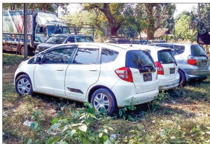
Three Honda Fit cars were confiscated from local men when they could not show ownership.

During the operation, police firstly arrested Naing Myo Win, 25, who was driving a Honha Fit with number plat YGN7D/7482 near Aung Thitsa Restaurant on Yangon-Hpa-an Road. They then seized the 31-year-old Ye Win Tun (also known as Nay Myo Khine), driver of a car with number plat YGN3H/1950 near Sanpya Hospital on Yangon-Mawlamyine