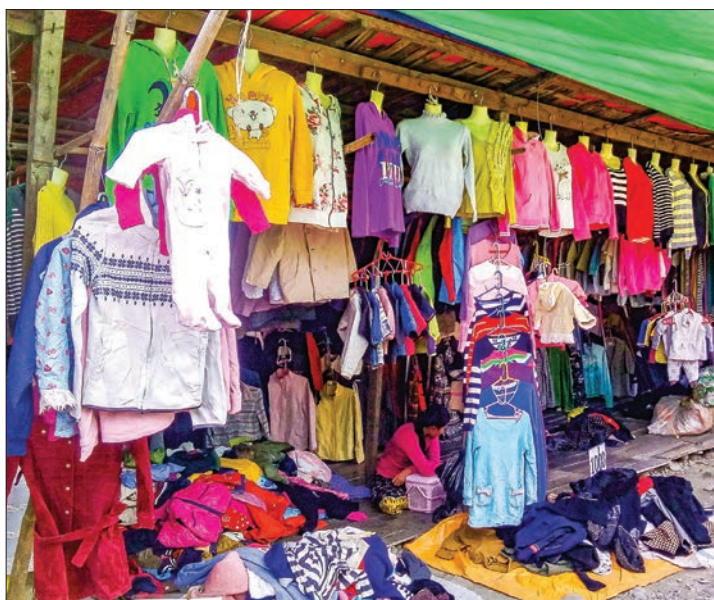
Sales for coats, jackets, hats and other cold-weather gear have been on the rise this winter season.

Second-hand clothes are also highly in demand because of their cheap prices. Among the various kinds of warm coats available, residents are choosing leather jackets, bomber jackets and fur coats, rather than cotton ones, said sellers.