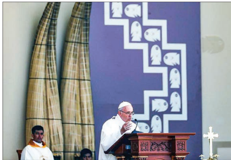
Pope Francis celebrates a mass at Huanchaco beach in Trujillo, Peru, on 20 January 2018.

Trujillo, capital of the region of La Libertad, was hit by major floods after six landslides in less than a week at the beginning of