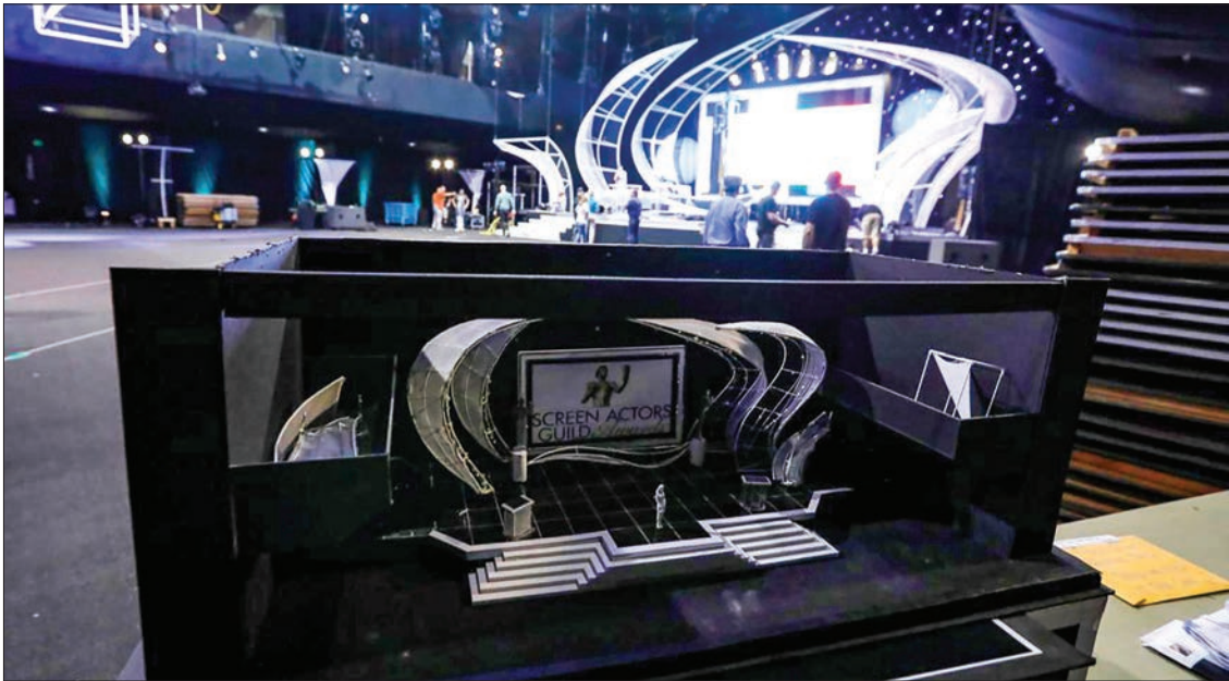
A scale model of the stage is pictured during a media opportunity in preparations for the 24 th Annual Screen Actors Guild Awards at Shrine Auditorium in Los Angeles, California, US, on 18 January 2018.