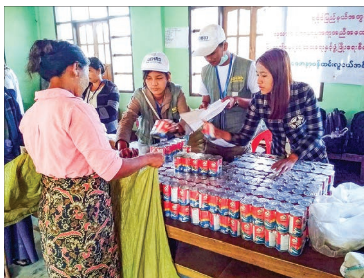
File photo shows the scene of young social workers providing foodstuff to the local ethnic people.

The social workers had divided into two groups to assist the townships respectively. U Than Kyaw Htay said future tasks will include delivering