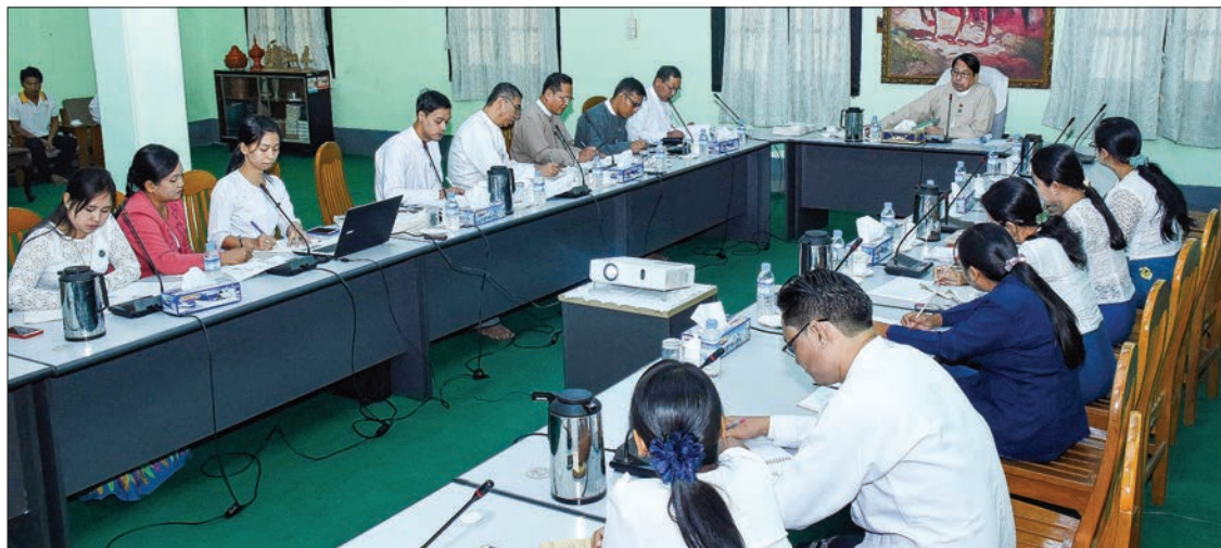
Union Minister Dr. Pe Myint leads a workshop on promoting community IPRD libraries.

Union Minister for Information Dr. Pe Myint attended a workshop at the Department of Printing and Publications on Theinphyu Street in Yangon yesterday.