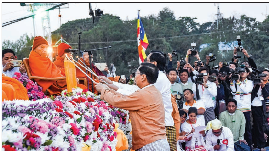
Dignitaries offering candle lights at the ceremony to offer provisions to monks.

The Deputy Speaker, the union ministers, the chief