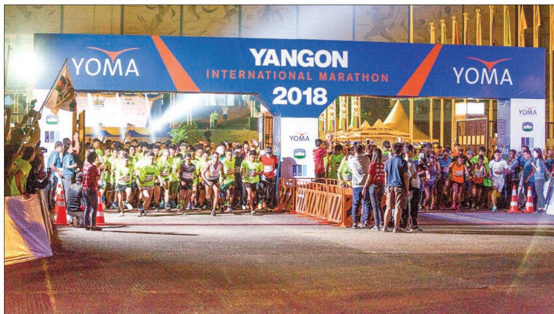
Participants of the Yoma Yangon International Marathon 2018 charge out the gate just before sunrise.

Runners were filled with eagerness as they took to the streets for the marathon and were encouraged on by the public across Yangon, as well as at the start and finish line at Thuwunna National Indoor Stadium.