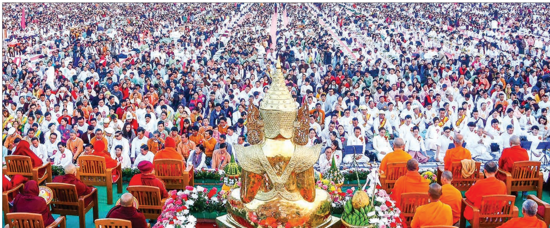
An auspicious and grand religious ceremony to offer provisions to members of the Sangha in progress in Mandalay.