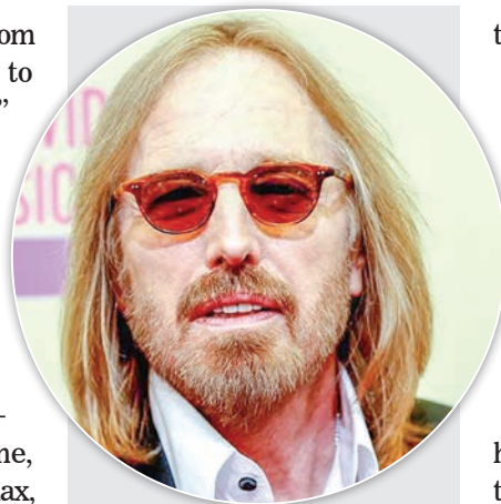
Musician Tom Petty arrives for the 2012 MTV Video Music Awards in Los Angeles, on 6 September, 2012.