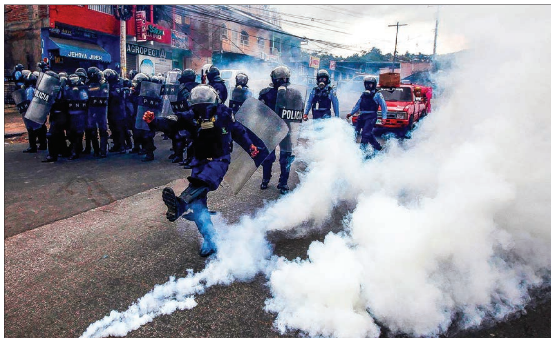
A riot policeman kicks a tear gas canister to demonstrators, during a protest against the re-election of Honduras' President Juan Orlando Hernandez in Tegucigalpa Honduras, on 20 January 2018.

"If they move us from one spot, we have to move to another. We need to be permanently mobilized to keep up the pressure and prevent the dictator from installing himself." —Reuters ■