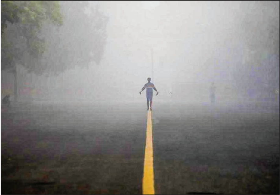
A man walks along a road on a smoggy winter morning in New Delhi, on 21 December 2017.

India’s government is in favor of imposing a wider ban on the import of petcoke, according to a government affidavit filed with its top court in December, a ruling on which is expected next month. —Reuters ■