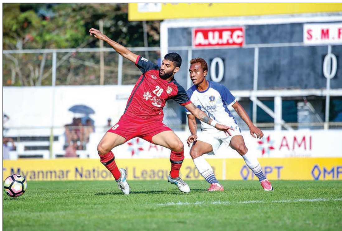
Ayeyawady (red) and Southern Myanmar (white) engage in fierce combat.

liam from Southern Myanmar touched the ball into the net to equalize the scores.