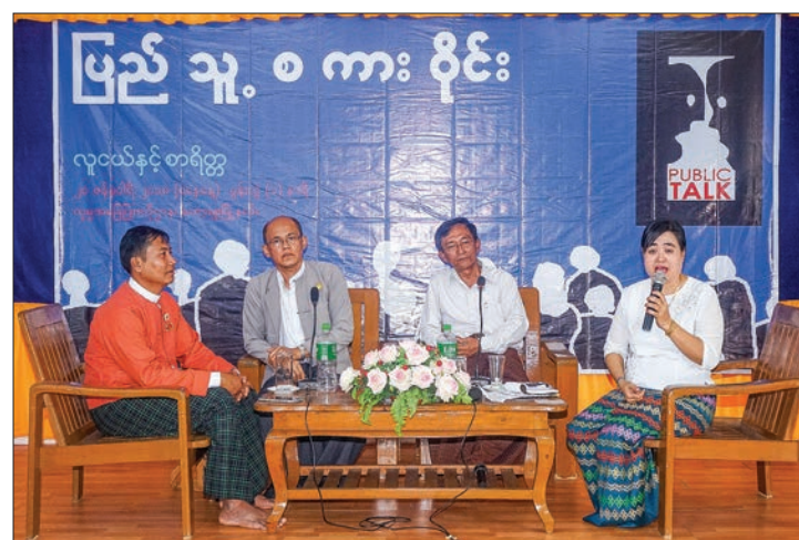
A public talk to promote and develop character was held in Kawhmu Township.