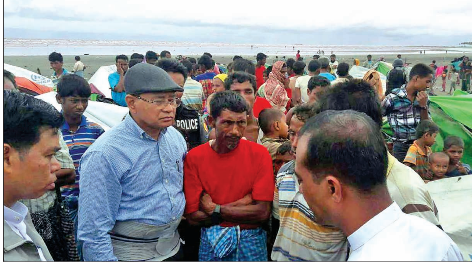
Members of the Myanmar National Human Rights Commission (MNHRC) meet ethnic Mro people in Aungthabyay Village in Maungtaw Township, Rakhine State yesterday.

In the year 2017, MNHRC made talk shows on sharing educational knowledge in 15 townships including Puta-O, Machanbaw, Kawlin, Wuntho, Maiyaung and Maisat. In the National Defense University as well, subjects on human rights had already been conducted to high-ranking Tatmadaw officials for four times. Similarly, for three times.