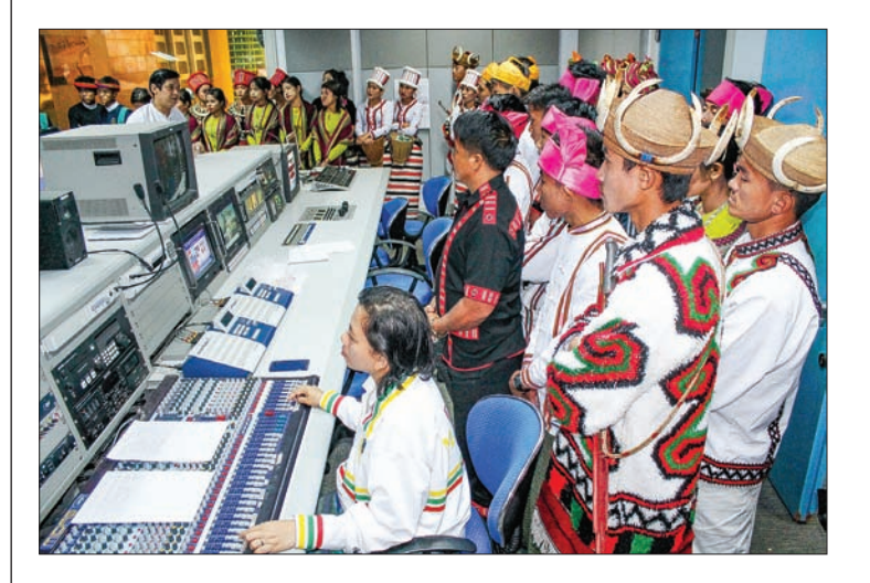
Ethnic members visit Myanma Radio and Television office yesterday.

A 100-member delegation, including youths from Kachin and Shan states, the Wa Self-Administered Division and the Pa-O Self-Administered Zone, visited the Pyithu Hluttaw and Amyotha Hluttaw yesterday morning.