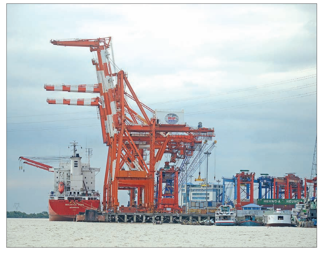
Trade via the sea route brought in $18.1 billion.