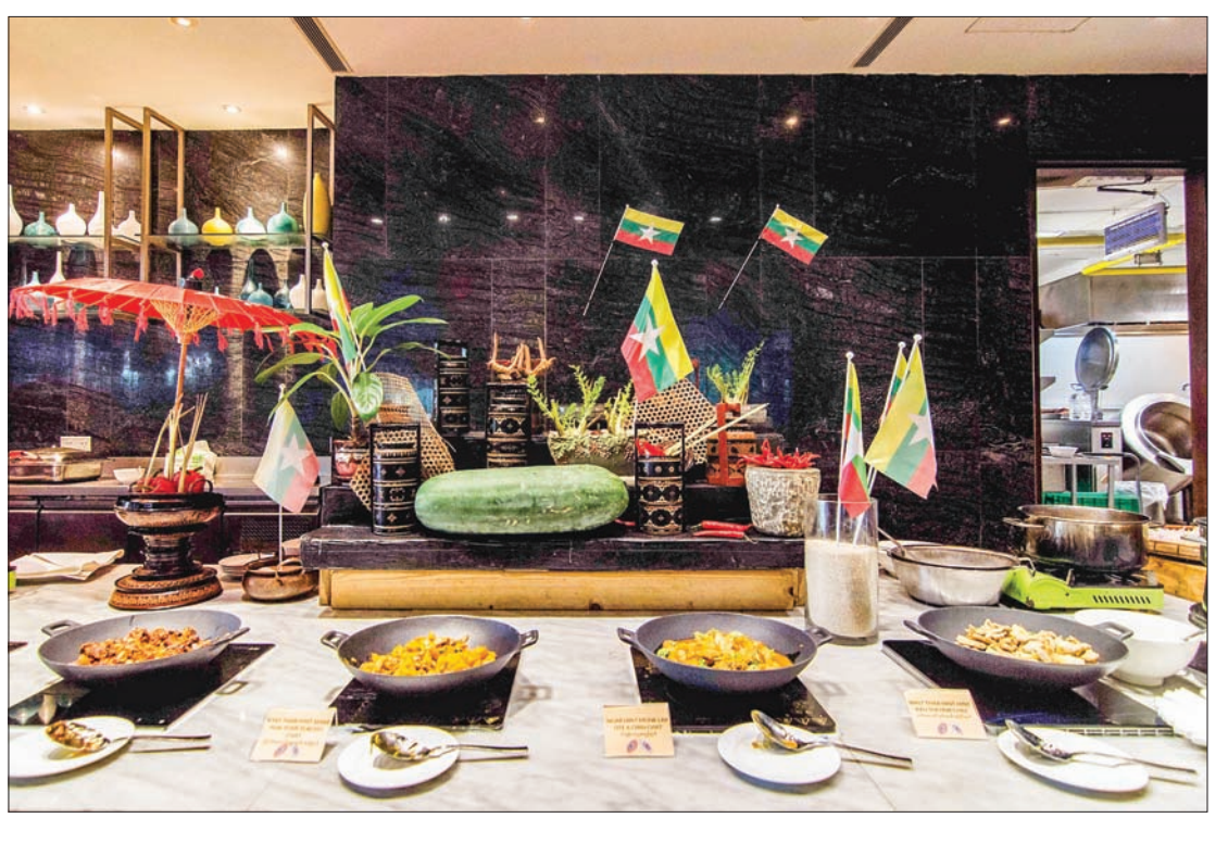
First Myanmar Food Festival hosted by Sedona Hotel in Yangon till 31 January.

SEDONA Hotel Yangon is hosting its first ever Myanmar Food Festival at its D'Cuisine restaurant, offering a buffet spread of more than 40 popular Myanmar dishes.