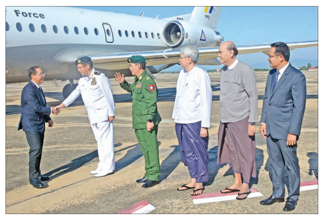
Vice President U Myint Swe arrives at Nay Pyi Taw International Airport after attending 2<sup>nd</sup> LMC Leader's meeting held in Phnom Penh, Cambodia yesterday.

MLC was initiated on 13 November, 2014, at the Asean-China summit meeting held in Nay Pyi Taw for cooperation among the Mekong-Lancang region countries for sustainable develop-