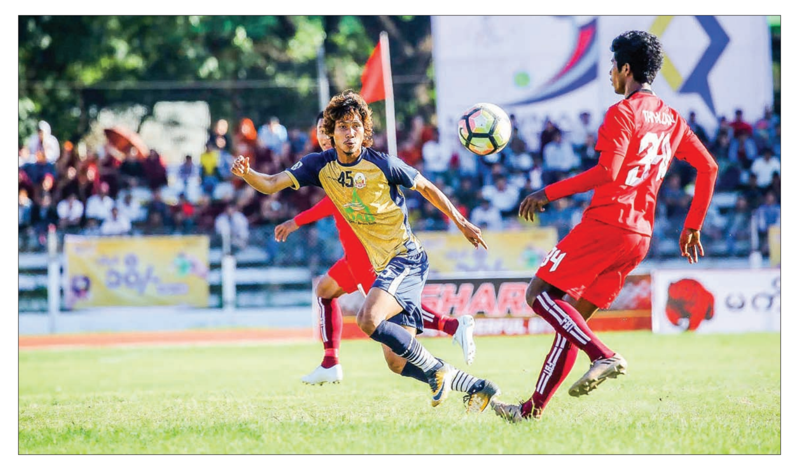
Sagaing player poised to shoot the ball at yesterday's match in Monywa Stadium.

In the opening match of MPT Myanmar National League 2018, Sagaing United played to a scoreless draw yesterday against Rakhine United at Monywa stadium, Sagaing's home Stadium.