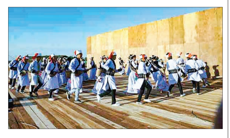
People perfoming traditional dance. Lisu traditional Khawshi New Year festival will be held in Putao, Kachin.

Traditional culture booths and other booths will be displayed at the festival and a lucky draw programme will also be organised.—District IPRD (Putao)