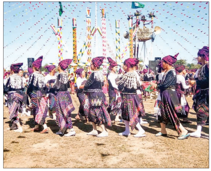
Kachin ethnic people celebrate their 70<sup>th</sup> Kachin State Day in Hpakhant Township in Mohnyin District, Kachin State.

TO celebrate the 70<sup>th</sup> Kachin State Day, a Manaw festival was held at Kaung Yar Village, Karmine Town, Hpakhant Township, in the Mohnyin District, Kachin State, on Wednesday.