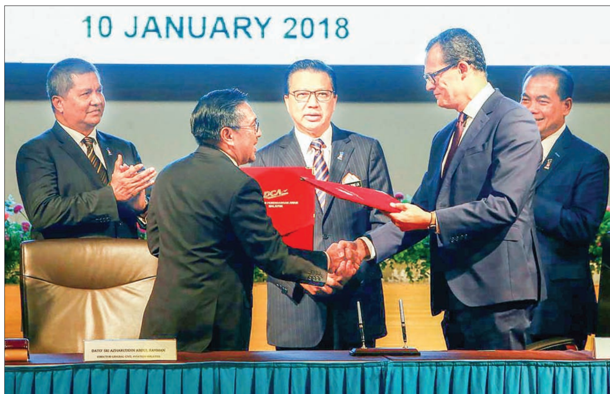
Civil Aviation Malaysia's Director General Azharuddin Abdul Rahman and Ocean Infinity's CEO Oliver Plunkett exchange documents, witnessed by Malaysia's Transport Minister Liow Tiong Lai, during the MH370 search operations signing ceremony between Malaysia's government and Ocean Infinity, in Putrajaya, Malaysia on 10 January, 2018.

Malaysian Transport Minister Liow Tiong Lai said a Houston-based pri-