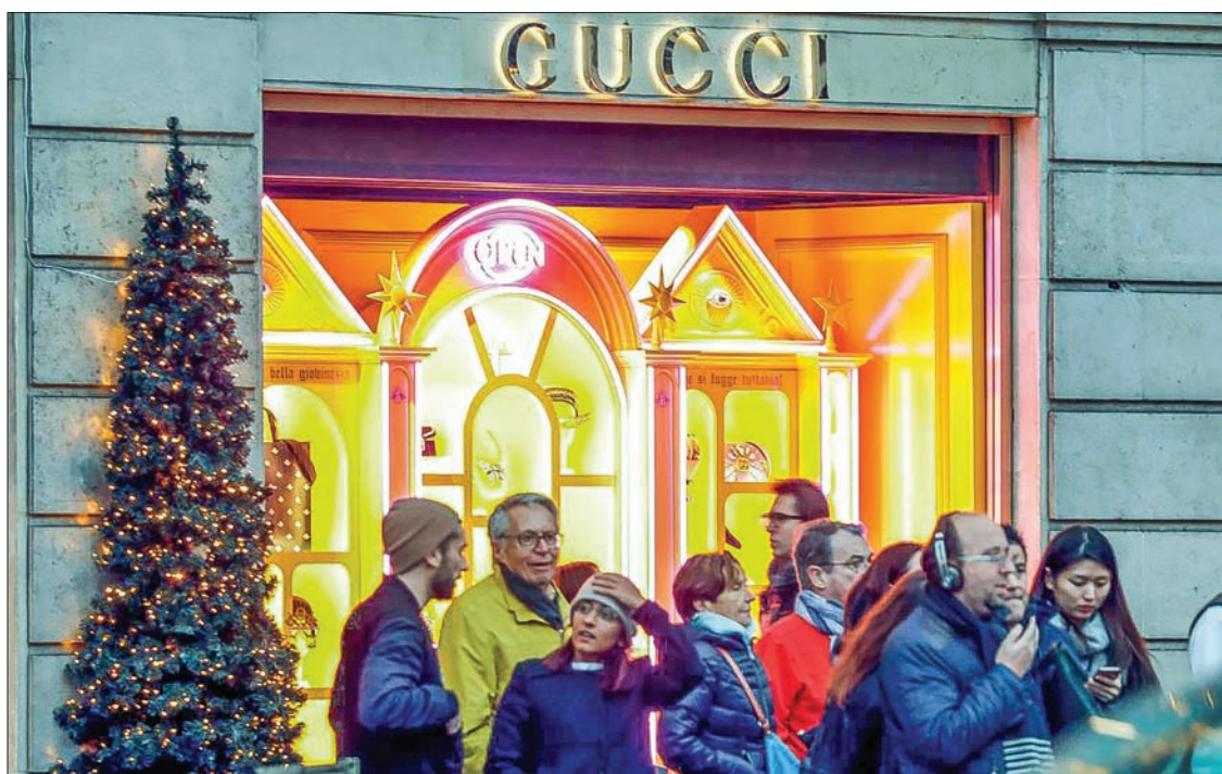
A Gucci sign is seen outside a shop in Paris, France on 18 December, 2017.