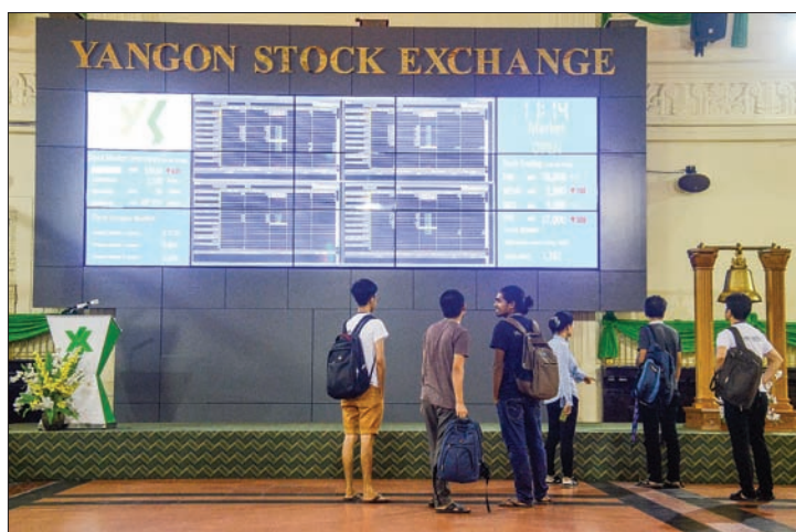
Share prices of YSX companies are also in decline.

The share prices of the listed companies are also decreasing. The price of a single share of FMI dropped from Ks14,000 on 2 January, 2017, to Ks12,000 on 10 January, 2018. The share price of MTSH decreased from Ks4,500 on 2 January, 2017, to Ks2,950 on 10 January, 2018.