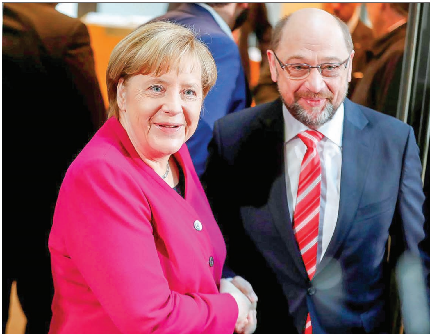
Leader of the Christian Democratic Union (CDU) and the acting German Chancellor Angela Merkel and Social Democratic Party (SPD) leader Martin Schulz shakes hands before exploratory talks about forming a new coalition government at the SPD headquarters in Berlin, Germany on 7 January, 2018.