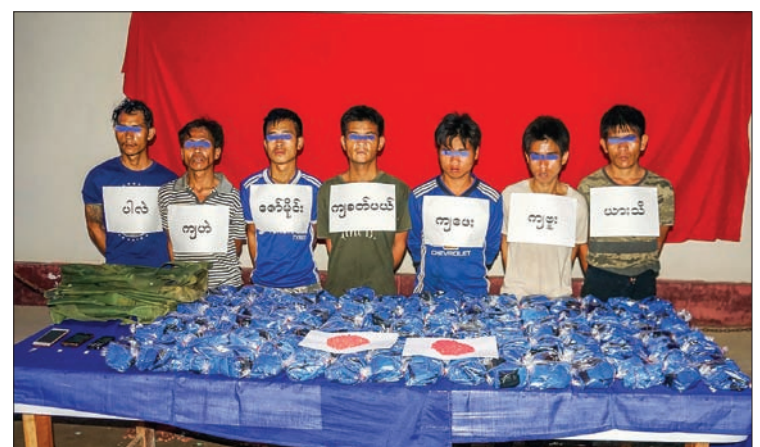
Seven suspects are seen together with confiscated drugs and weapons.

They have been charged with the narcotics drug and psychotropic substance law by the local police department, according to a source from the Information and Public Relations Department.—Myanmar Digital News ■