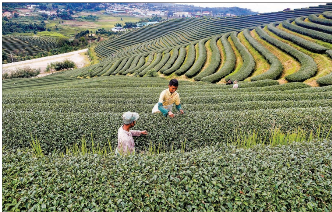
Farmers harvest tea leaves at Mong Mao in north east Myanmar.