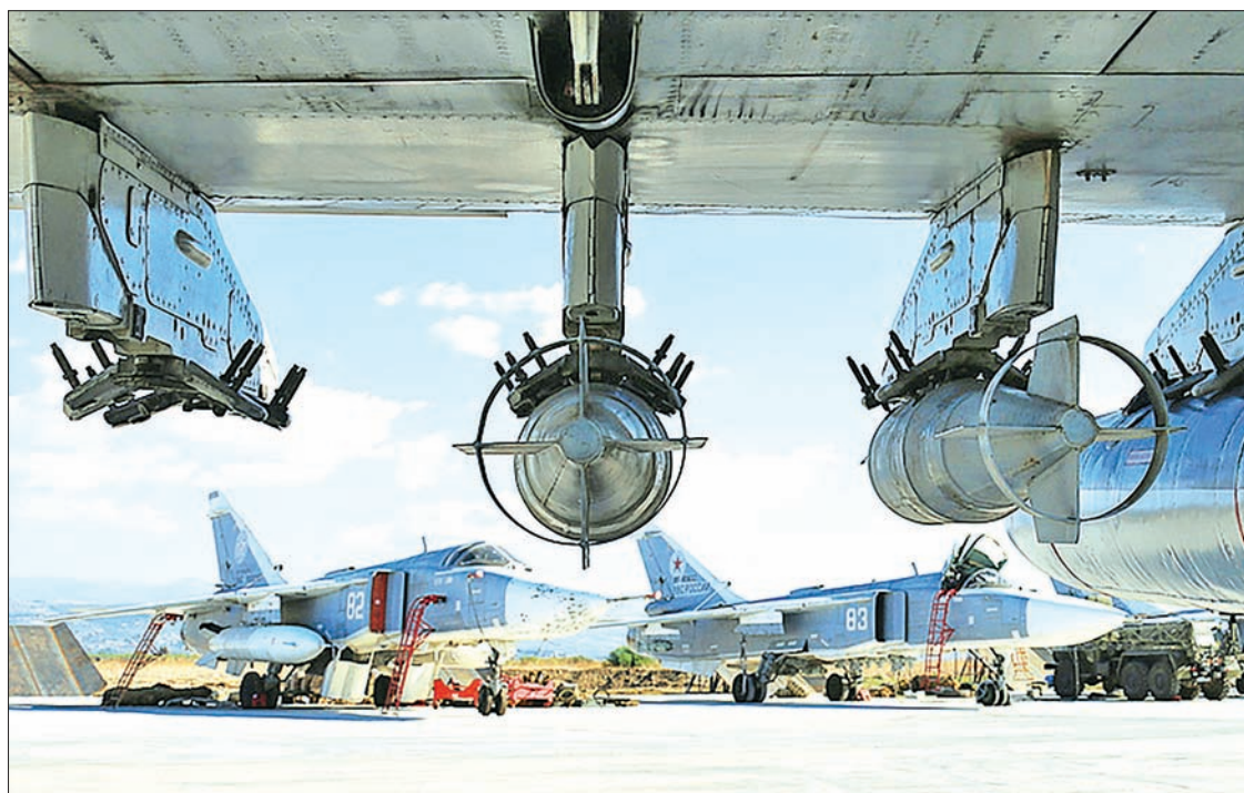
Hmeymim air base.

"All of the drones forced to land by our radio-electronic warfare means and the debris of the