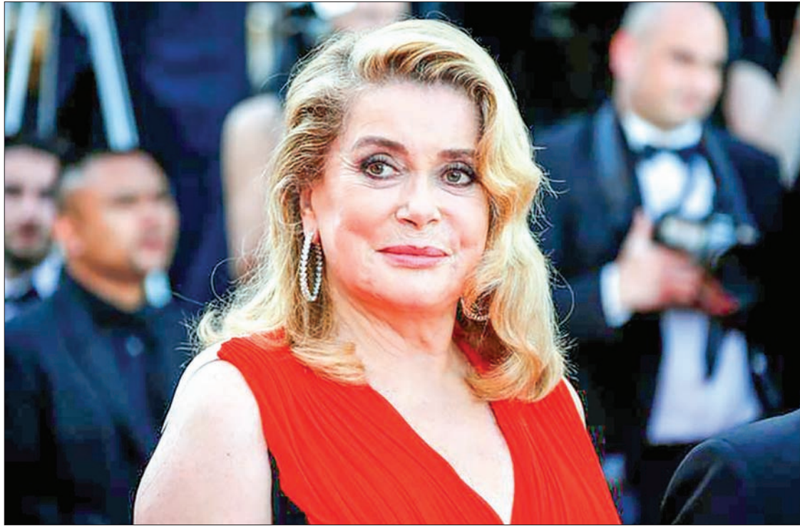
Actress Catherine Deneuve.

The man's right to "pester" a woman was an essential part