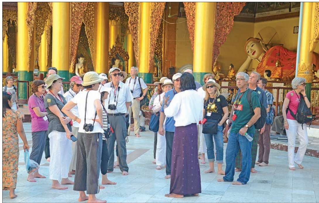
A tour guide conducts tourists around the Shwedagon Pagoda.

Due to limitation of space we are only able to publish "Letter to the Editor" that do not exceed 500 words. Should you submit a text longer than 500 words please be aware that your letter will be edited.