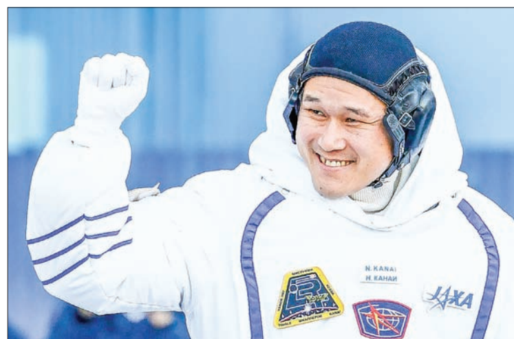
Members of the International Space Station expedition 54/55, Norishige Kanai of the Japan Aerospace Exploration Agency (JAXA) during the send-off ceremony after checking their space suits before the launch of the Soyuz MS-07 spacecraft at the Baikonur cosmodrome, in Kazakhstan on 17 December 2017.

But a bit over a day later — and in the wake of a flurry of news stories — he apologized, saying that he'd measured himself after his captain raised questions about the apparent growth and he had stretched only 2 cm from his Earth-bound height. —Reuters ■