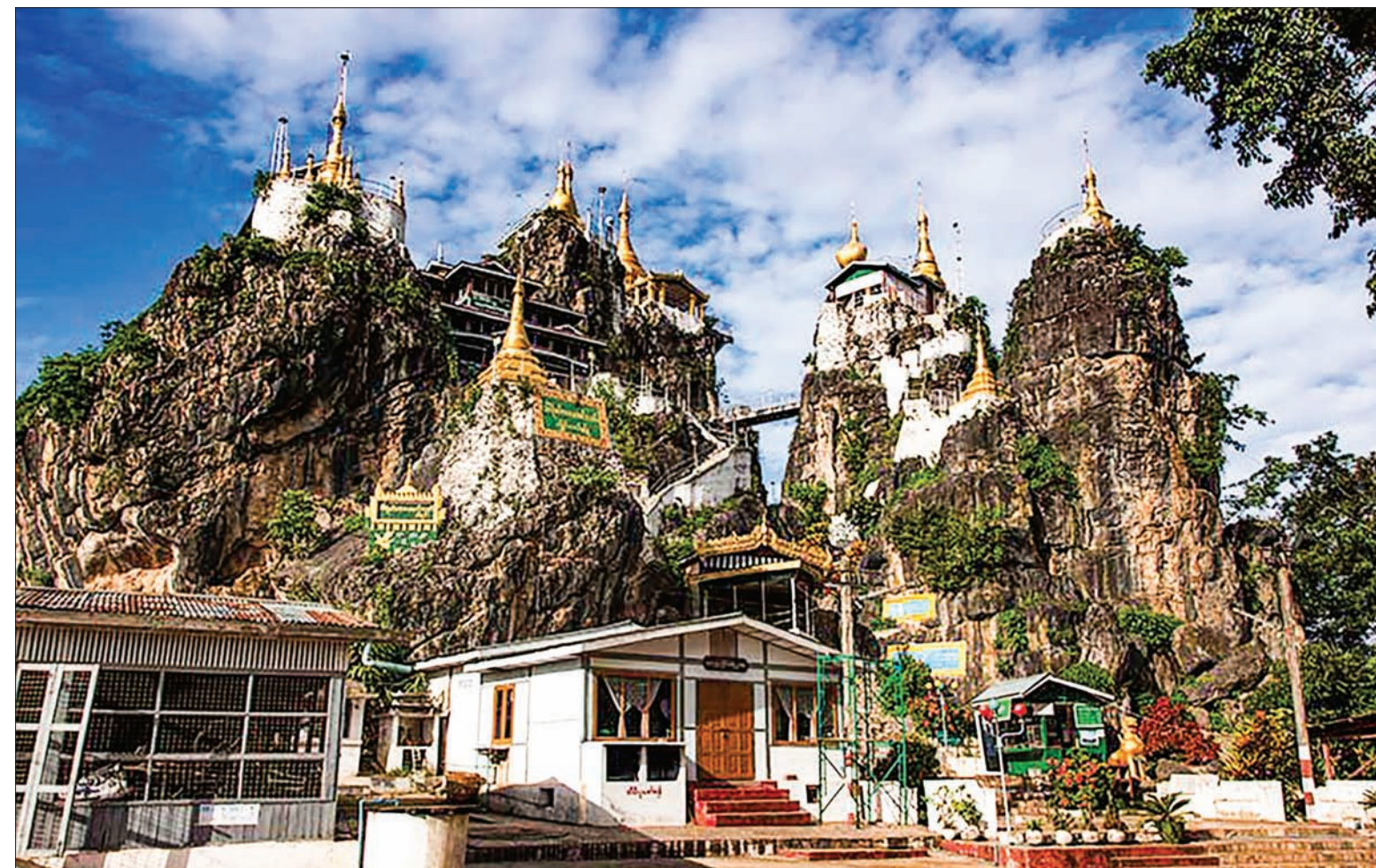
Taung Kwe Pagoda in Loikaw, Kayah State.

Looking back into the past history, leaders from Kayah State took part in the struggles against the British Imperialists for the nationwide liberation including the hilly regions where national ethnic