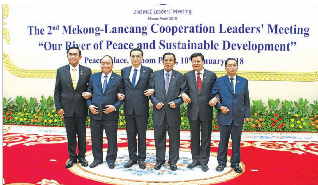
(L-R) Thailand's Prime Minister Prayut Chan-ocha, Viet Nam's Prime Minister Nguyen Xuan Phuc, Chinese Premier Li Keqiang, Cambodia's Prime Minister Hun Sen, Laos' Prime Minister Thongloun Sisoulith and Myanmar's Vice President U Myint Swe pose for a photo yesterday during the second Mekong-Lancang Cooperation leaders meeting in Phnom Penh, Cambodia.

At the meeting, they discussed matters relating to boosting bilateral relations. — Myanmar News Agency ■