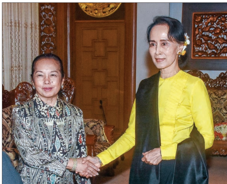
State Counsellor Daw Aung San Suu Kyi welcomes Hon. Gloria Macapagal-Arroyo, former president of the Philippines.