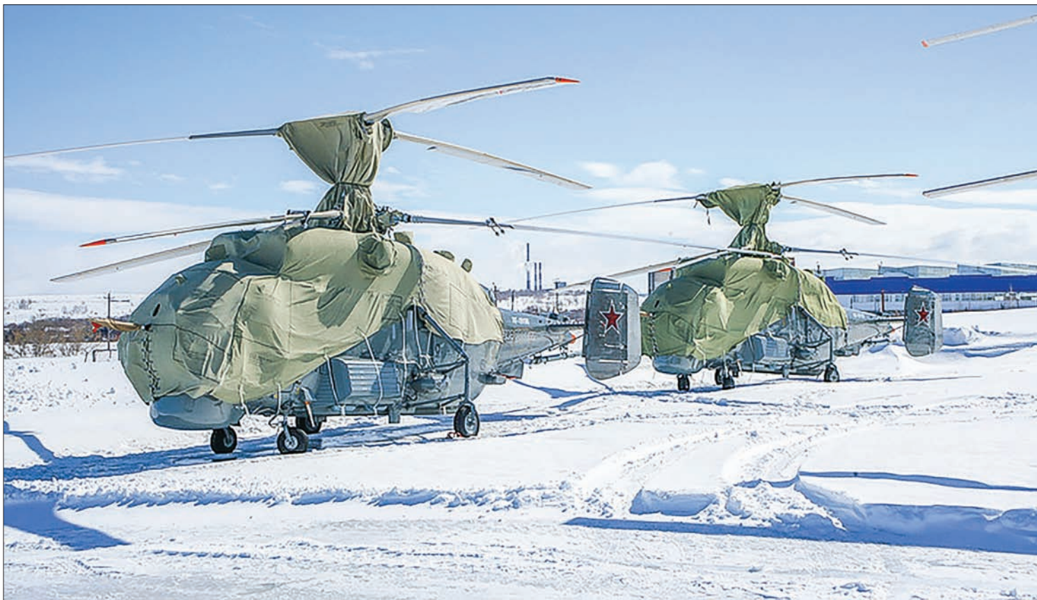
The first of the delivered helicopters was already dispatched to its Baltic Fleet home base.