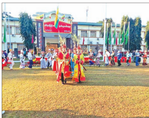
Kachin ethnic people perform at Kachin State Day celebration. PHOTO: WIN NAING

The ceremony covers mini-marathon, tennis, cycling, volleyball and other sports meets. — Win Naing-Kachin Land/ Myanmar Digital News