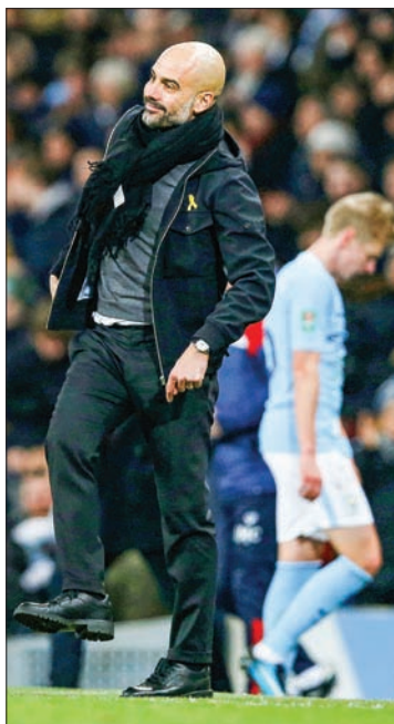
Manchester City manager Pep Guardiola.

We'll take an awful lot from it and learn a lot. It is not over. It will be an interesting game at Ashton Gate. “The away goal was very important. We tried to