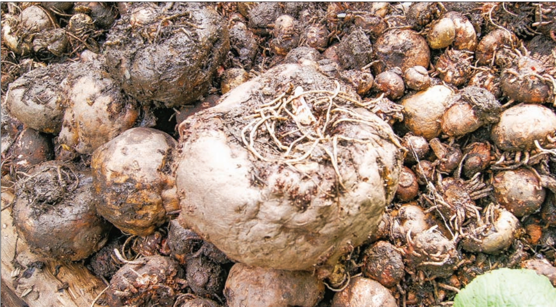
Elephant foot yam.