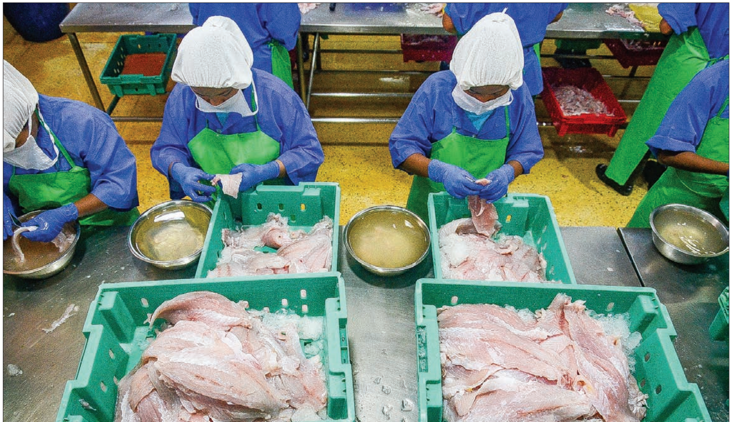
Workers sort fish at a cold storage factory.

Due to limitation of space we are only able to publish "Letter to the Editor" that do not exceed 500 words. Should you submit a text longer than 500 words please be aware that your letter will be edited.