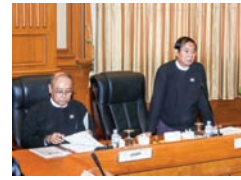
NATIONAL Coordination meeting held to discuss second Hluttaw seventh regular session PAGE-10