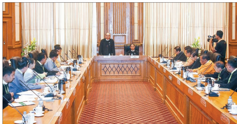
Speaker U Win Myint (Right) and Speaker Mahn Win Khaing Than (Left) chair the meeting of Myanmar Parliamentary Union (MPU).

ulous country, China, surpassed its imports. Rice, various kinds of peas, sesame seeds, corn, vegetables and fruits, dried tea leaves, fishery products, rubber, minerals and animal products are exported to China, whereas machinery, plastic raw materials, consumer products and electronic tools flow into Myanmar.—Mon Mon