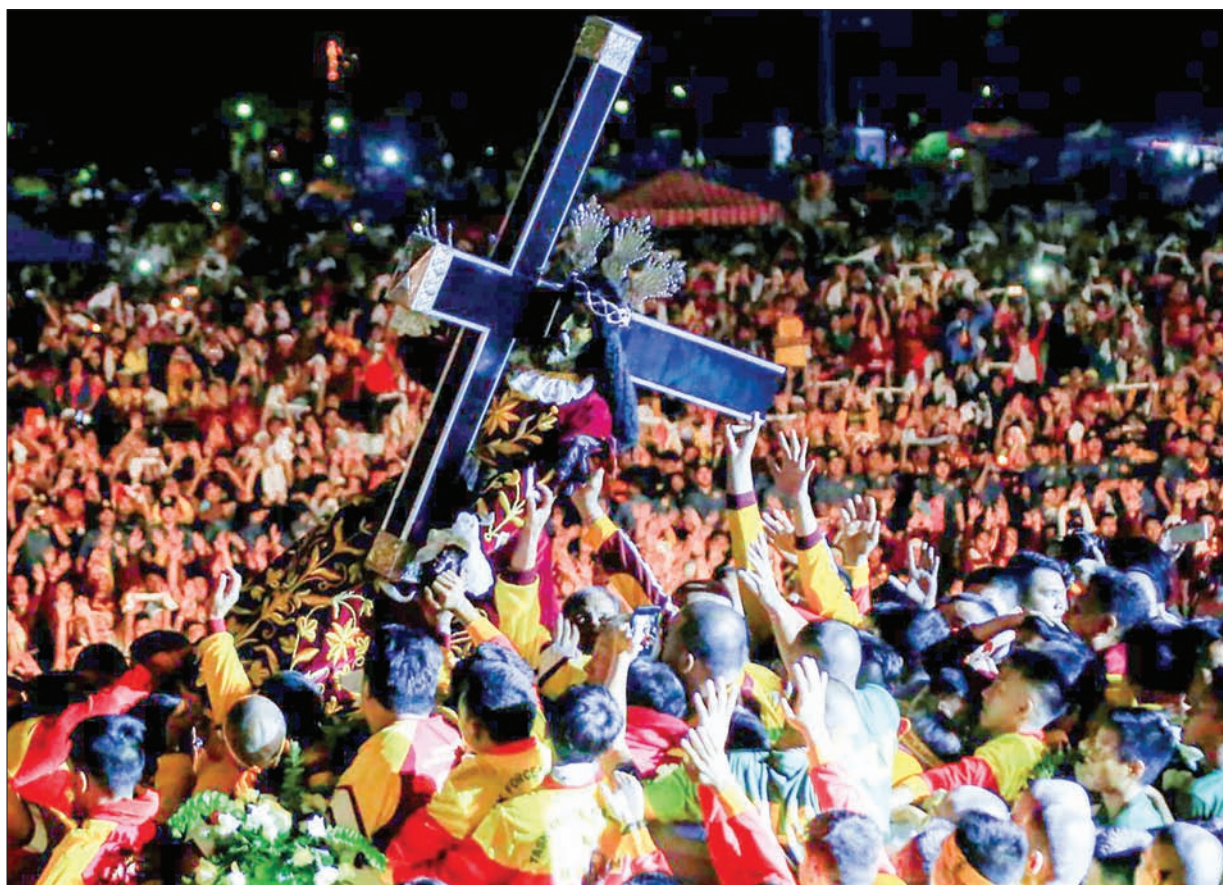
Devotees try to reach the unbalanced image of the Black Nazarene during an annual procession at Luneta grandstand, Metro Manila, Philippines on 9 January, 2018.