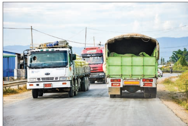
Trucks are seen near the 105-Mile Muse Border Trade Zone in northern Shan State.

As of October this FY, bilateral trade value with Myanmar's main partner China via the sea route