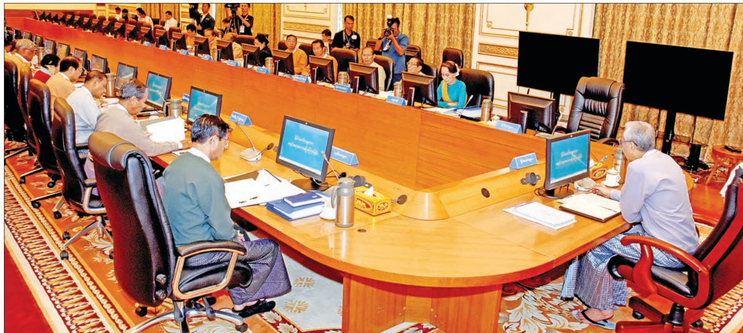
President U Htin Kyaw delivers the speech at the meeting of the Finance Commission 1/2018 at the Presidential Palace.

Spending frameworks according to the Medium-Term Fiscal Framework for union-level