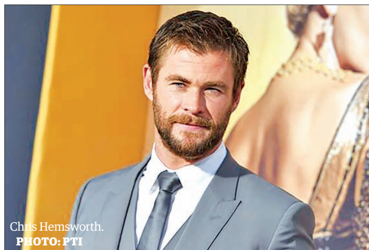
Chris Hemsworth.

Hemsworth, who last appeared in the Taika Waititi-directed “Thor: Ragnarok”, said he has rediscovered his passion for the role. “Two or three films ago I was like ‘okay, a couple more’. I was enjoying it but I was like... I felt a little restricted. And after this last experience with Taika, and actually these last two ‘Avengers’, I feel like we’ve reinvented that character a number of times — even in these next two, he evolves again, and you don’t get that opportunity often in a franchise. “So I definitely feel a renewed sense of excitement and enthusiasm, and more so than ever, I think,” Hemsworth said.—PTI ■