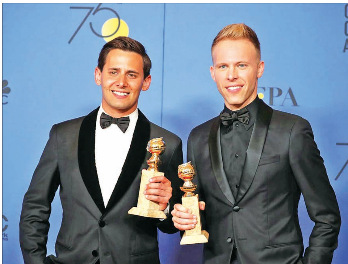
Benj Pasek and Justin Paul hold the awards they won for Best Original Song - Motion Picture for “This Is Me” from the film “The Greatest Showman,” at the 75 th Golden Globe Awards in Beverly Hills, California, US on 7 January, 2018.

No new entries made the top 10 of the Billboard 200 chart this week. —Reuters ■