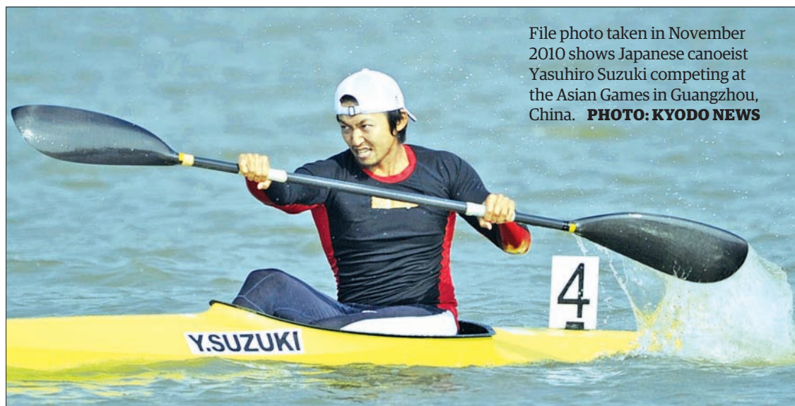
File photo taken in November 2010 shows Japanese canoeist Yasuhiro Suzuki competing at the Asian Games in Guangzhou, China.

Adelaide hosted the Australian Open 14 times between its inception in 1905, when it was known as the Australasian Championships. It permanently moved to Melbourne in 1972.—Reuters ■