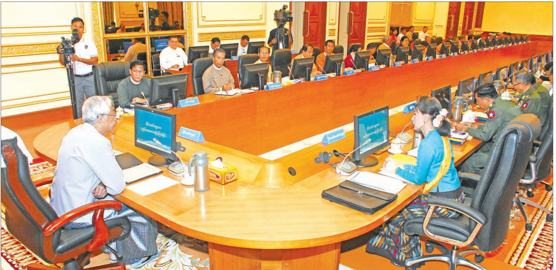
President U Htin Kyaw, who is also the chairman of the National Planning Commission, said yesterday that the National Planning Bill for the six-month transition period for the new fiscal year should maintain the current needs of the people, sustain development and stay within the budget allowed by the government.