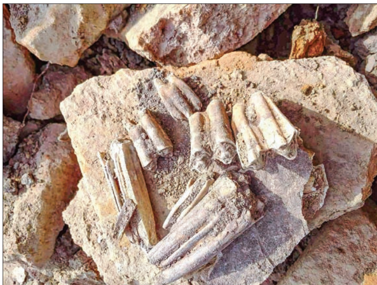
Ancient bone.

Officials from the Department of Archaeology went and checked the region on 8 December and said the building might be from Innwa and early Konebaung era.