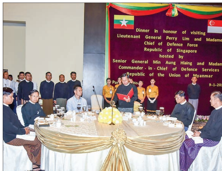
Senior General Min Aung Hlaing delivers an opening speech at the dinner in honour of Chief of Defence Force of Singapore Armed Forces.