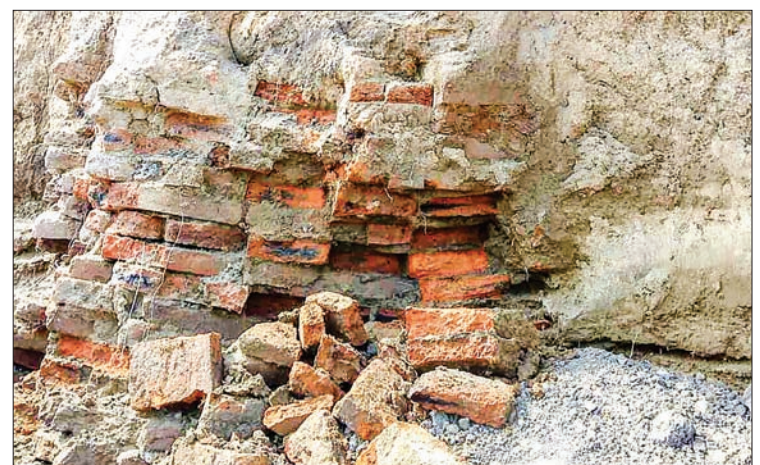
Ancient building found in Wundwin are from Innwa and early Konebaung era.

of brick came out is an area where Ywar Haung Gone village once existed, and a pagoda south of the river was toppled and destroyed in the past,” said U San Yin, a villager from Nabegone Village.—Min Htet Aung (Sub-printing House) ■