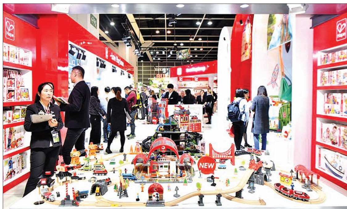
People visit the 44 th Hong Kong Toys and Games Fair in Hong Kong, south China on 8 January, 2018. The 4-day event started at Hong Kong Convention and Exhibition Center on Monday.