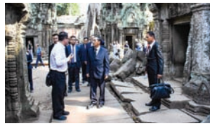
NATIONAL Vice President U Myint Swe arrives in Cambodia PAGE-2