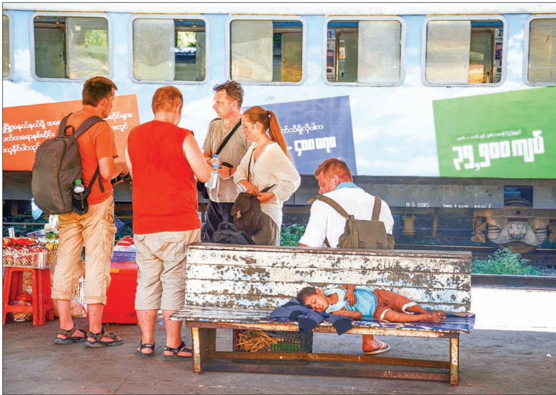
Foreign passengers seen at Yangon Railways Station.