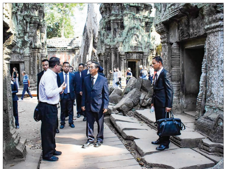
Vice President U Myint Swe looks around the Ta Prohm Temple in Phnom Penh, Cambodia.

They received a Guard of Honour on arrival at the airport by Mr. Sun Chanthol, Minister for Public Works and Transport and officials. He also visited Ta Prohm Temple in Phnom Penh.—Myanmar News Agency ■