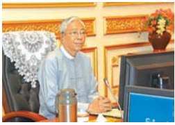
NATIONAL Finance Commission meets in Nay Pyi Taw PAGE-3