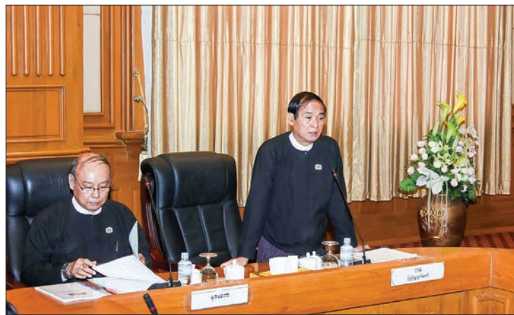
Pyithu Hluttaw Speaker U Win Myint discusses for second Hluttaw seventh regular session at the coordinating meeting.

At the next Hluttaw meeting, the adoption of the budget estimate for the Union from April to September 2018, the bill on the 2018 Budget of the Union