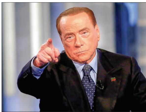
Italy's former Prime Minister Silvio Berlusconi.