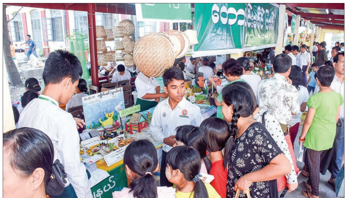
Onlookers observe a booth with cutout images at the second day of the literary festival.