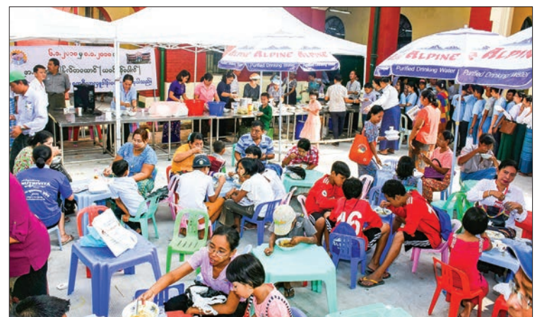
Children visiting the Literature Festival enjoying free food.

Other generous donors included the St. Paul School's alumni, who offered mote hingar, custard bread, gelatin juice and shwe yin aye (a liquid-based desert). The National League