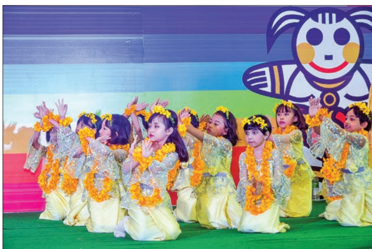
Young children dancing at the festival.