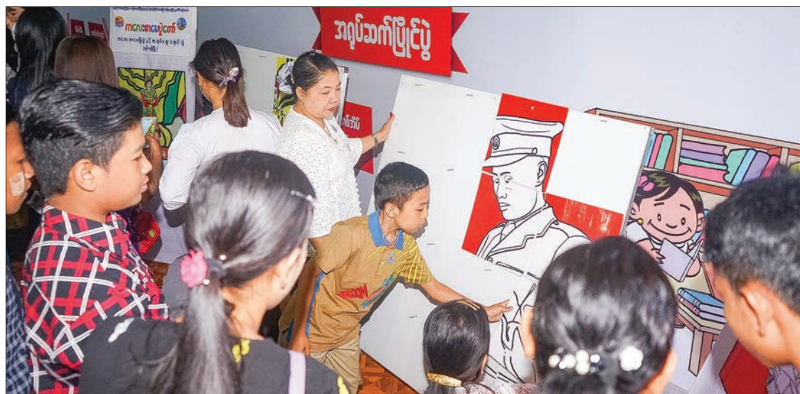
Children enjoying a games at Literature Festival in Yangon.