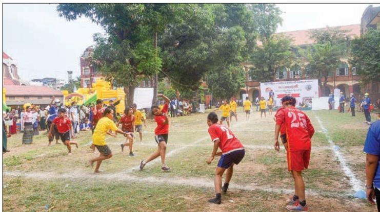
Children taking part in Htote Si Htoe (border-crossing game) at the festival.