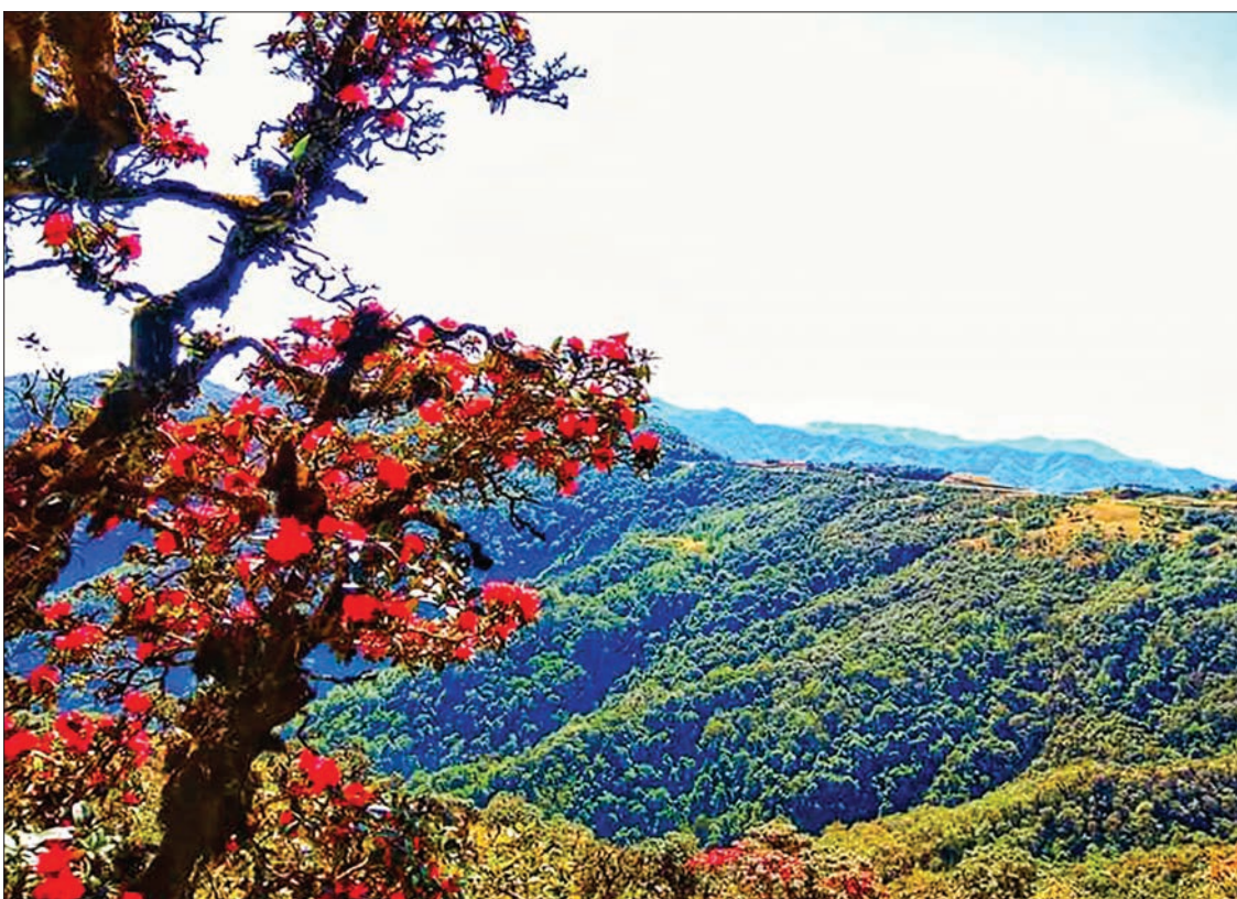
File photo shows natural beauty of Chin State.

U Hlaing Aung noted that even though the Forestry Department has put up signs warning against the chopping down of trees, daily incidents of branches or entire trees being chopped down are common. Youths from Mindat and Kanpalet towns have been hanging signs in many urban and rural areas, calling for the preservation of the natural environment.—Zoe Haysar ■