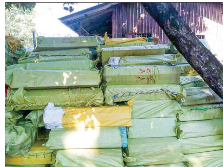
The confiscated teak timber is estimated to weigh around 12,376 tonnes.

To prevent illegal logging and transport of hard woods, the forest department collaborates with the police, ward and township administrative offices and members of the public.—Win Naing (Kachinmye) ■