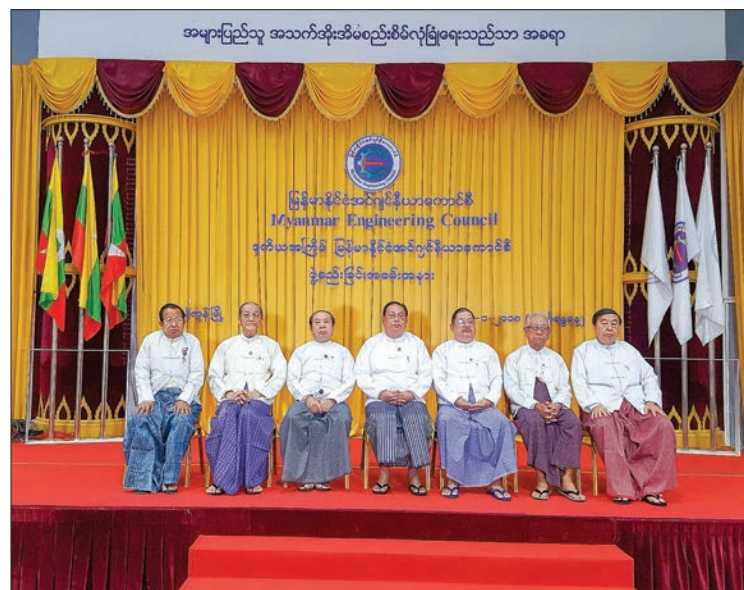
Union Minister U Win Khaing, and responsible officials pose for documentary photo.