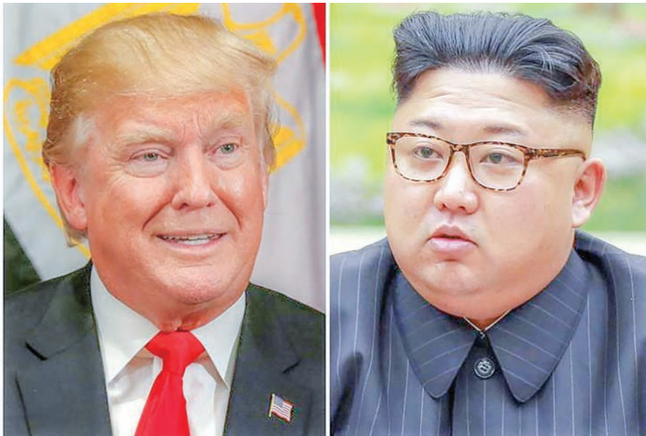
A combination photo shows US President Donald Trump in New York, US, on 21 September 2017 and North Korean leader Kim Jong Un in this undated photo released by North Korea's Korean Central News Agency (KCNA) in Pyongyang, on 4 September 2017.

Earlier this week Trump dismissed Kim's taunt that the North Ko-