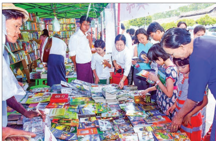
Children and adults alike browse through the book stalls at the festival.