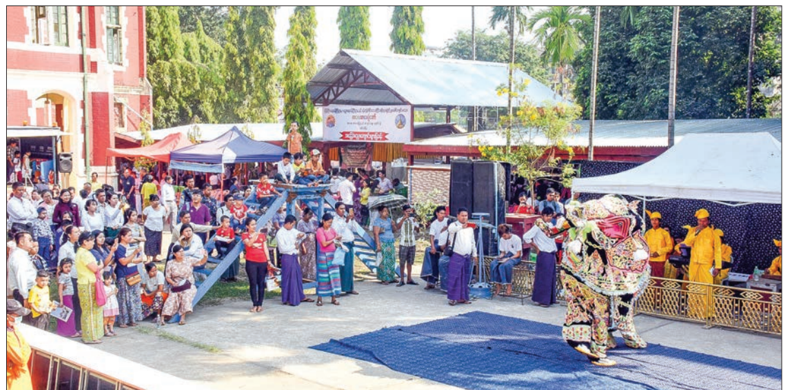
Visitors of the literary festival were entertained with a traditional dance performance.

Further, a person in charge of the programmes said, "Our entertainment programmes provide knowledge about the benefits of reading and doing physical exercises in the traditional way. We guarantee more efforts in the coming festivals." The literati also held talks on the creation of cartoon characters, books for children and school library development. The entertainment programmes begin at 9.30 am and end at 8 pm daily. ■