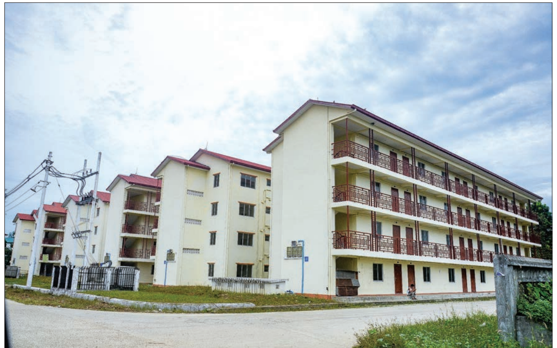
Low-cost housing project at Dagon Seikkan Township.

Previously, those who had deposited 30 per cent of the apartment's value as down payment, have a regular income and could afford to make the monthly payment, were entitled to apply to buy the low-cost apartments, developed by the Rural and Housing Development Department under the Construction Ministry. The