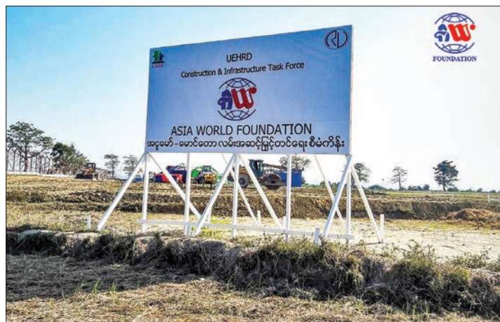
A billboard shows the area where the Asia World Foundation road project will be undertaken.

In line with task force's objectives, AWF has taken the lead to rapidly organize its resources and donations to contribute its infrastructure and construction