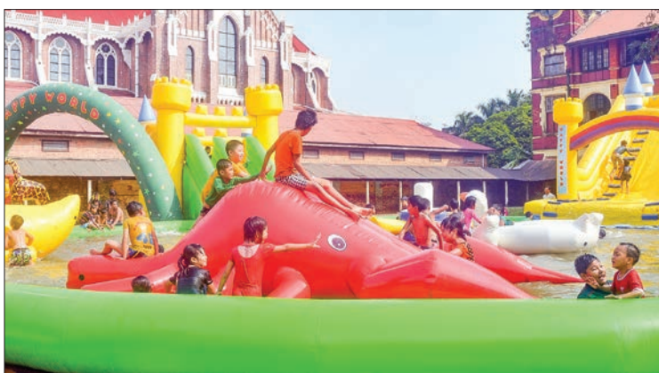
An indoor swimming pool for kids at the festival.