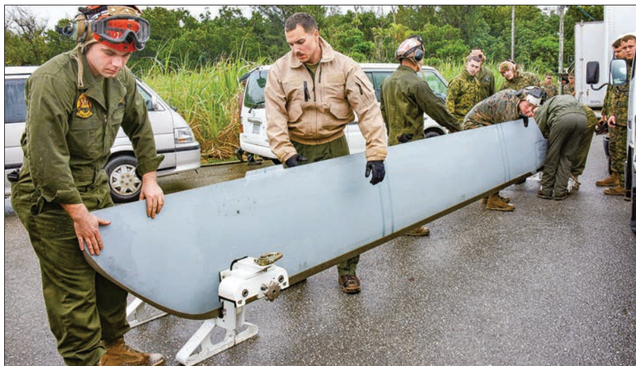
US servicemen move part of a UH1 military transport helicopter in Uruma, Okinawa Prefecture, on 7 January 2018, after the chopper made an emergency landing on a beach the previous day.

The incident is the latest in a series of accidents and mishaps involving US military aircraft stationed in the southern prefecture of Okinawa, which hosts the bulk of US military forces in Japan. The helicopter that made the emergency landing belongs to US Marine Corps Air Station Futenma on the main island of Okinawa.—Kyodo News ■