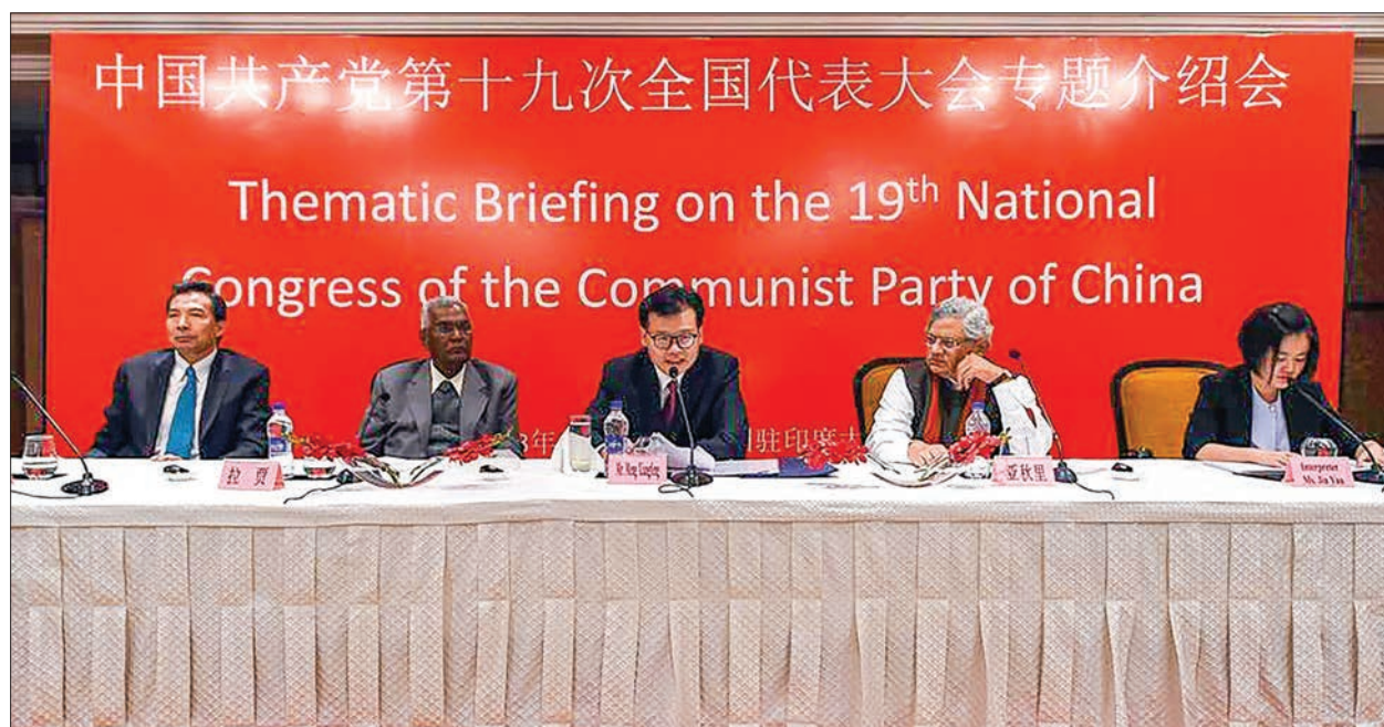
Meng Xiangfeng (C), deputy director of the General Office of the Central Committee of the Communist Party of China (CPC), introduces the 19 th CPC National Congress held in October 2017, in New Delhi, India, on 6 January 2018.

The India side spoke highly of the achievements and significance of the CPC congress, saying they were ready to join hands with China to further cooperation of mutual benefit, and promote healthy and steady development of bilateral ties, so as to contribute to peace, stability, development and prosperity in the region and the whole world.—Xinhua ■