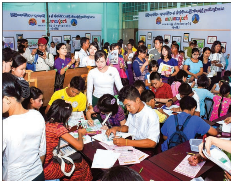
Children and youths compete in a drawing and colouring competition.