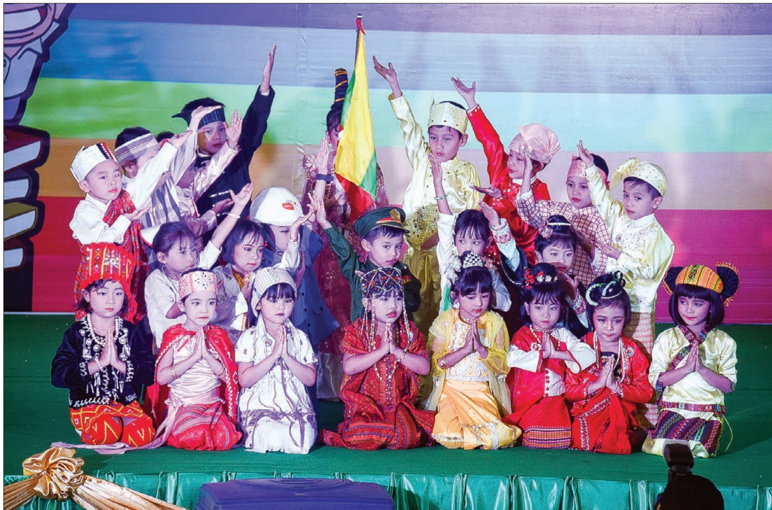
Children performed songs and dances for the audience on the second day of the Children's Literature Festival.