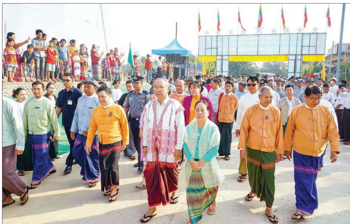
Amyotha Hluttaw Speaker Mahn Win Khaing Than opens new concrete road in Myawady on 7 January 2018. PHOTO: HTEIN LINN AUNG (IPRD)

The concrete road, built at a cost of MM Ks26.15 million, is 22 feet wide and 570 feet long.—Htein Linn Aung (IPRD) ■