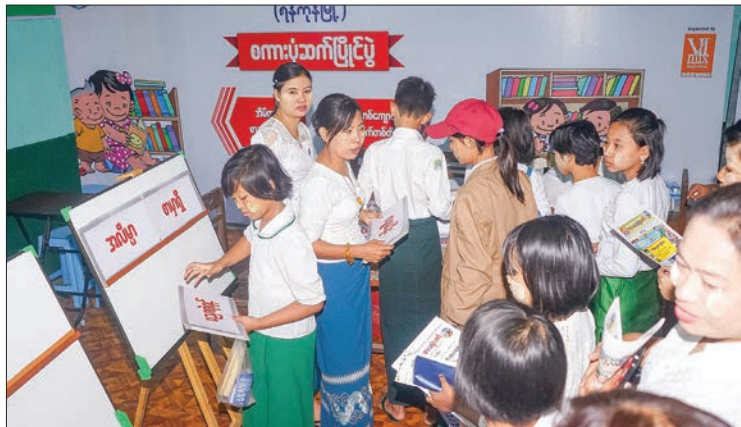
Children participated in games and activities at the festival.