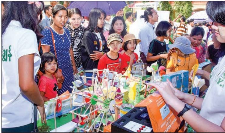
Visitors observe a booth of a private high school.