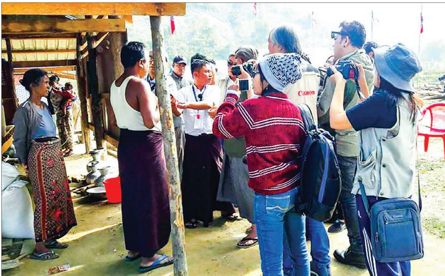
Members of the media group interviewing locals in Maungtaw Township in Rakhine State.