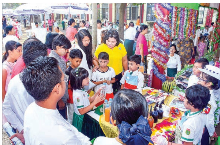
Students at the second day of the Children's Literature Festival look through the book stalls.