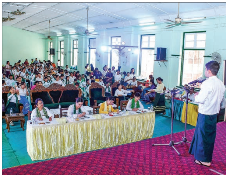
Students participate in a story telling competition at the festival.