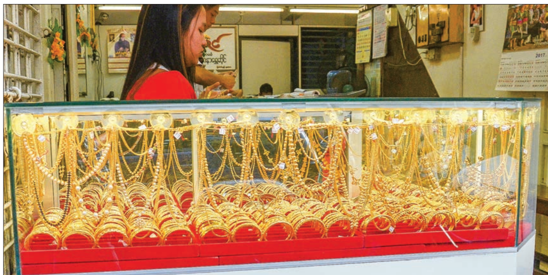
The high price of global gold prices have caused domestic gold prices to soar up.