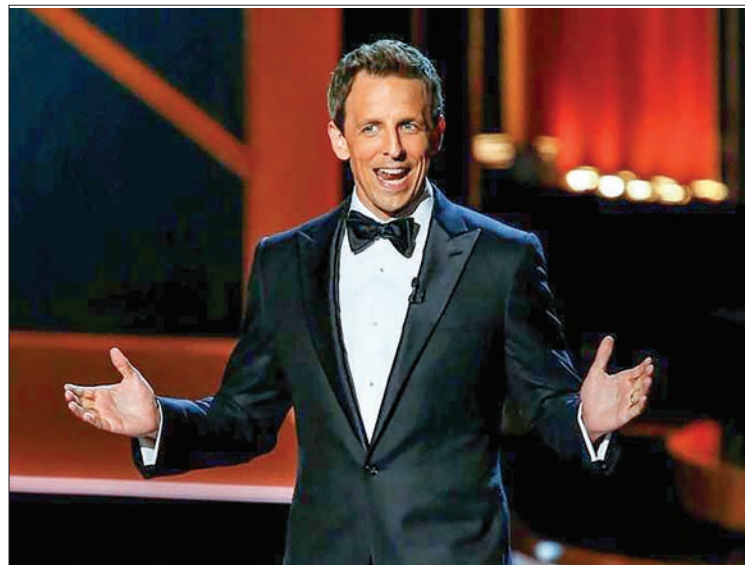
Host Seth Meyers speaks onstage during the 66th Primetime Emmy Awards in Los Angeles, California, US, in 2014.