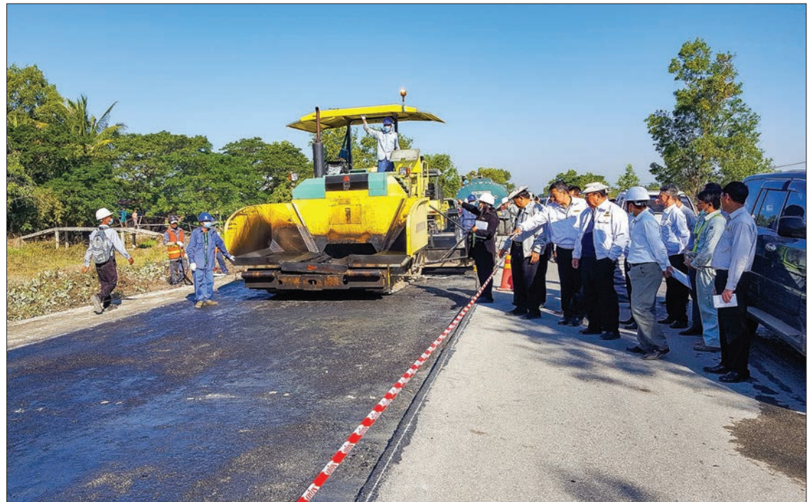
Union Minister U Win Khaing inspects upgrading of Maubin-Kyaiklat-Pyapon road in Ayeyawady Region.

At noon, Union Minister and his group inspected the upgrading of concrete road between mileposts 16/7 and 17/1 on Pyapon – Bogale