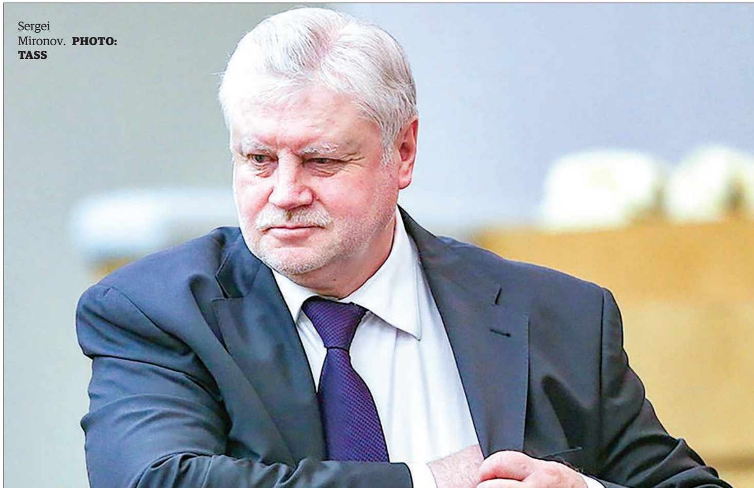
Sergei Mironov.

Russia's Lavrov says timing of Putin-Trump meeting not yet discussed – RIA