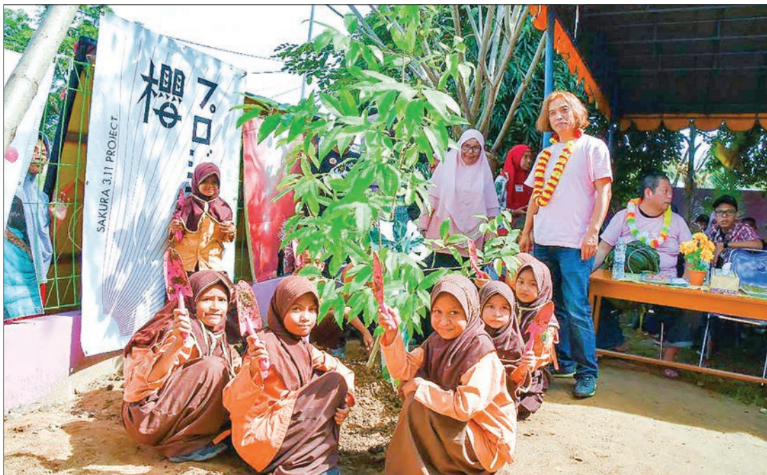
Japanese artist Takashi Murakami (standing) poses with local students after planting Jeumpa tree in Banda Aceh, Indonesia on 22 December, 2017.

BANDA ACEH, (Indonesia) — A group of colorfully dressed girls performed an energetic traditional welcome dance for Japanese artist Takashi Murakami, who was visiting their elementary school in Banda Aceh, the capital of Indonesia's westernmost province of Aceh, for a tree-planting event on Friday morning.