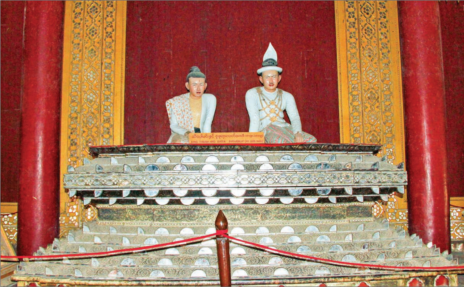
The statue of King Thibaw and Queen Suphayalat seen at Mandalay Royal Palace.

It will reach exactly 70 years that our country gained its Independence it lost. It is similar to a life-span of a human being. In the country we have only a few people who had met the colonial