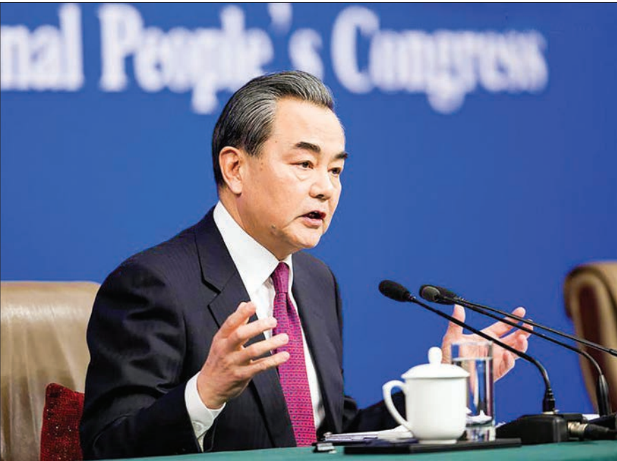
Chinese Foreign Minister Wang Yi.