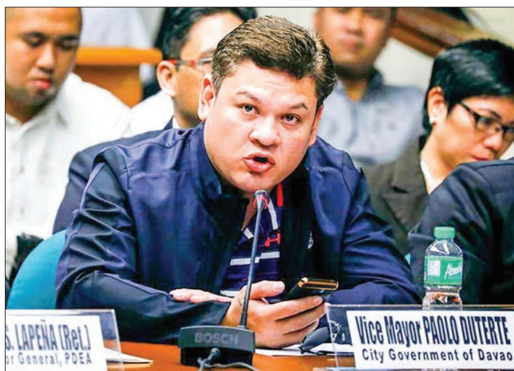
Paolo Duterte, Davao's Vice Mayor and son of President Rodrigo Duterte, testifies at a Senate hearing on drug smuggling in Pasay, Metro Manila, Philippines on 7 September, 2017.

Paolo testified at a senate investigation in September into a seized shipment of around $125 million worth of narcotics from China after opponents of the president, who has instigated a fierce crackdown on the drugs trade, said they believe his