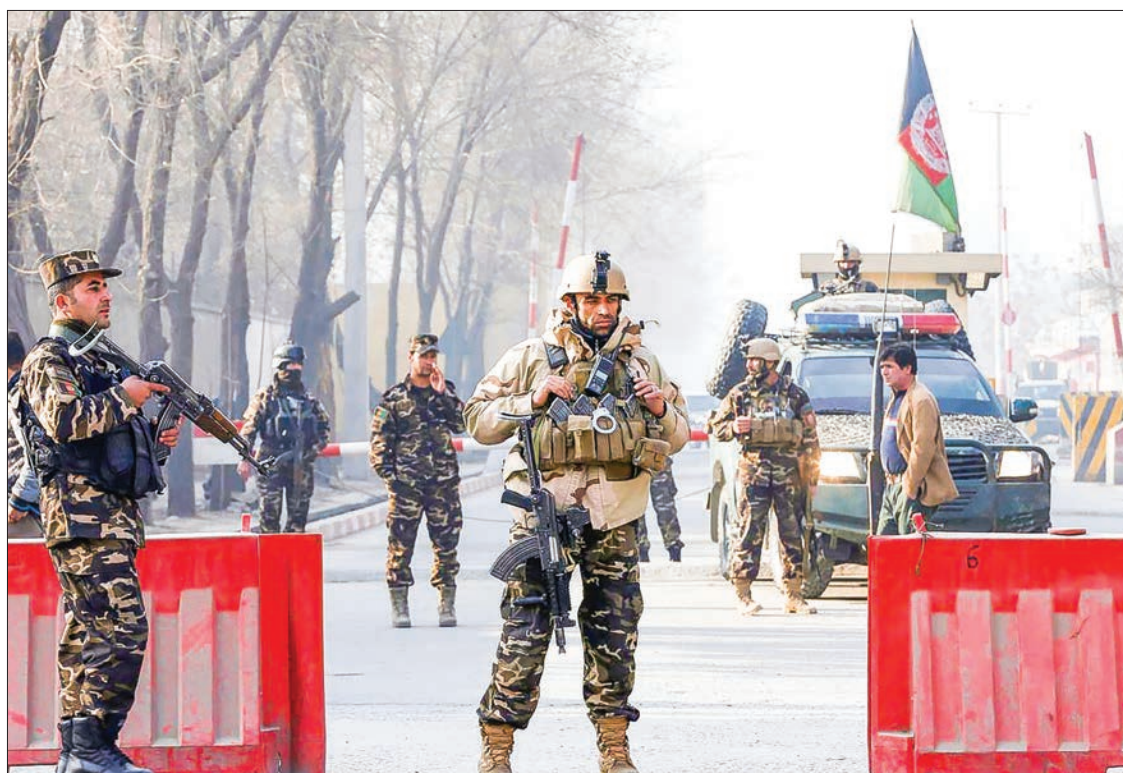
Afghan security forces keep watch at a check point close to a compound of Afghanistan's national intelligence agency in Kabul, Afghanistan on 25 December, 2017.

But there remains considerable uncertainty about how the group operates and the exact nature of its connections with Islamic State in Iraq and Syria. —Reuters ■