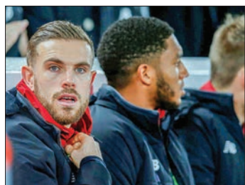
Liverpool's Jordan Henderson.

LONDON—Liverpool midfielder Jordan Henderson will miss Tuesday's Premier League game against Swansea City due to a hamstring injury, manager Juergen Klopp has said. Henderson, 27, was replaced by James Milner in the early stages of Friday's 3-3 draw with Arsenal and Klopp is concerned