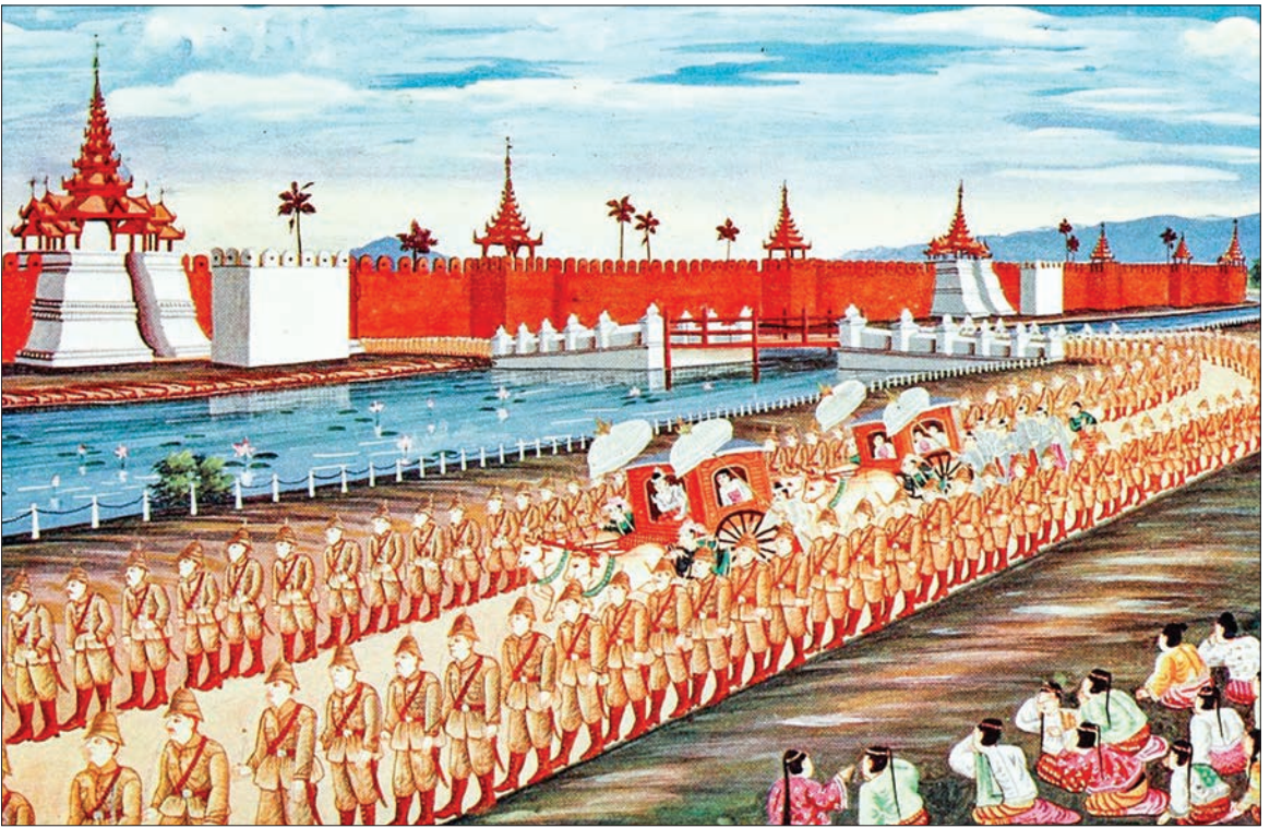
Saya Chone's "King Thibaw Leaving Mandalay".

The British Imperialists staged the Second Anglo-Burma War on 5 April 1852 without prior notice, announcing that they had occupied the Lower Myanmar King 20th December 1852. The British targeted to expel Myanmar King out of the country, to make the whole Myanmar populace live under their strict control and to get rid of Myanmar Kingdom and Myanmar nationalities out of the world atlas. On the wrong pretext