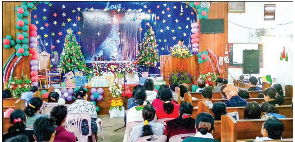
Christians pray at Asho Chin Baptist Church in Pyinmana, Nay Pyi Taw yesterday.

The Christian followers also listened to the sermons and prayers of the Reverends and Fathers.