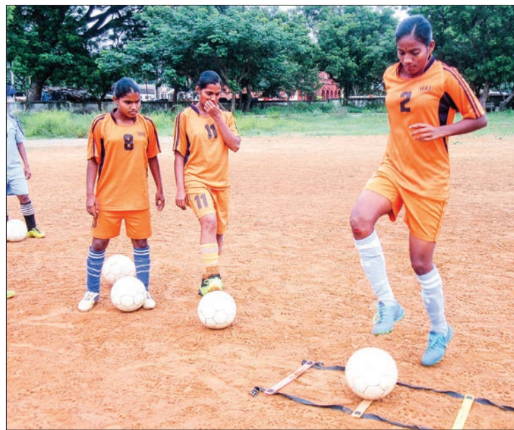
Photo taken in Cuddalore, India on December 21, 2017 shows players practicing for the tournament in Madhya Pradesh.

And there were others around Cuddalore who also stepped up to take care of the 33 girls.—Kyodo News ■