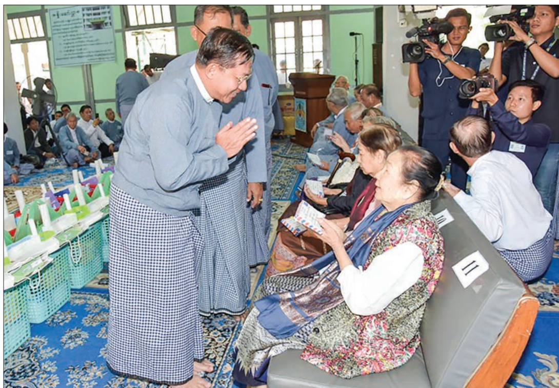
Senior General Min Aung Hlaing presents gifts to the teacher in person.