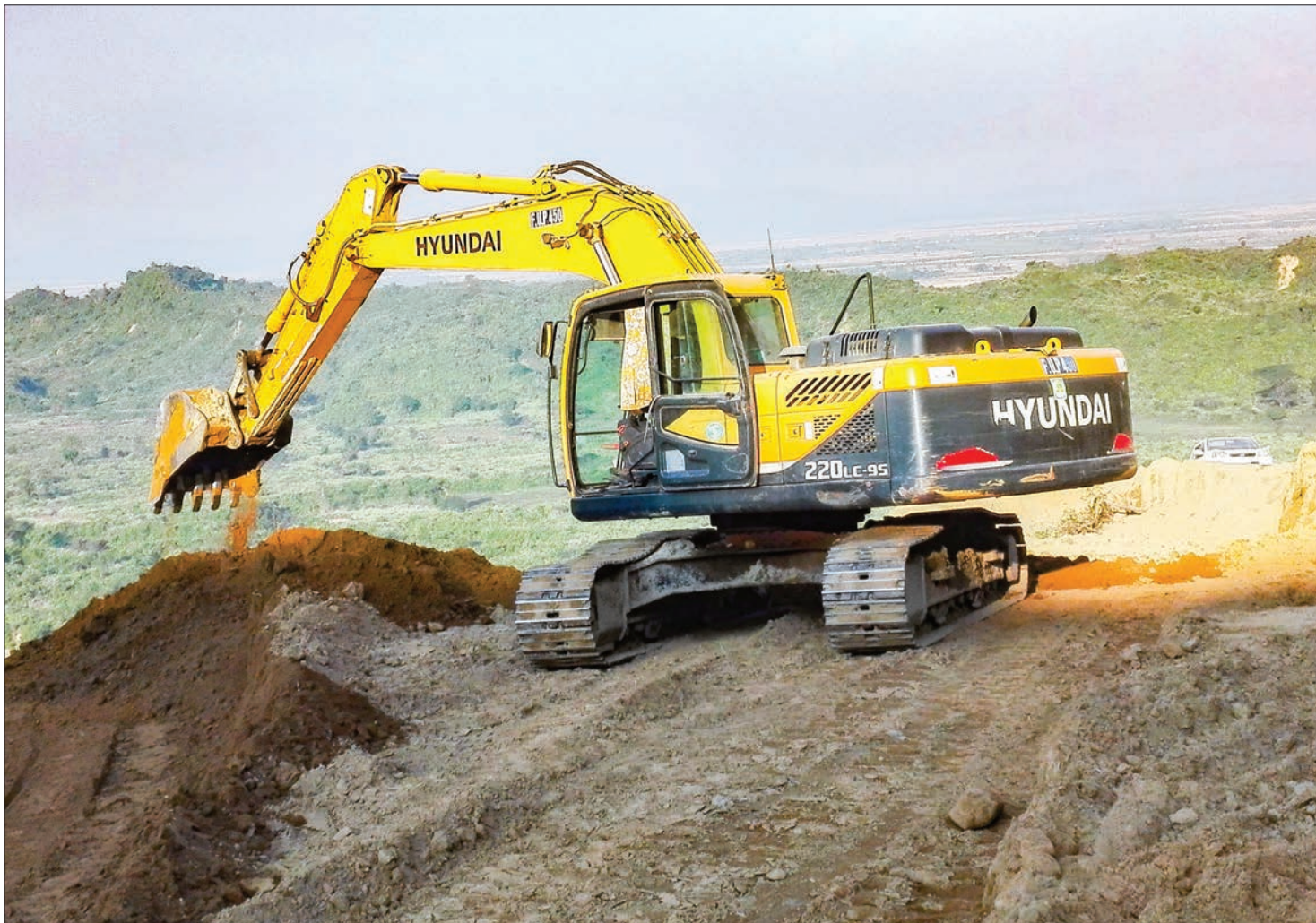
The backhoe working on the road construction in Maungtau, Rakhine State.