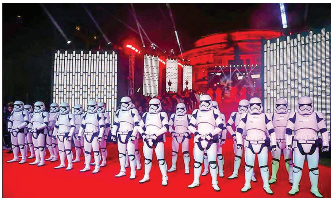
Actors dressed as storm troopers stand in formation at the European Premiere of 'Star Wars: The Last Jedi', at the Royal Albert Hall in central London, Britain on 12 December, 2017.

Directed by Rian Johnson, the eighth installment in the "Star Wars" saga follows Rey as she