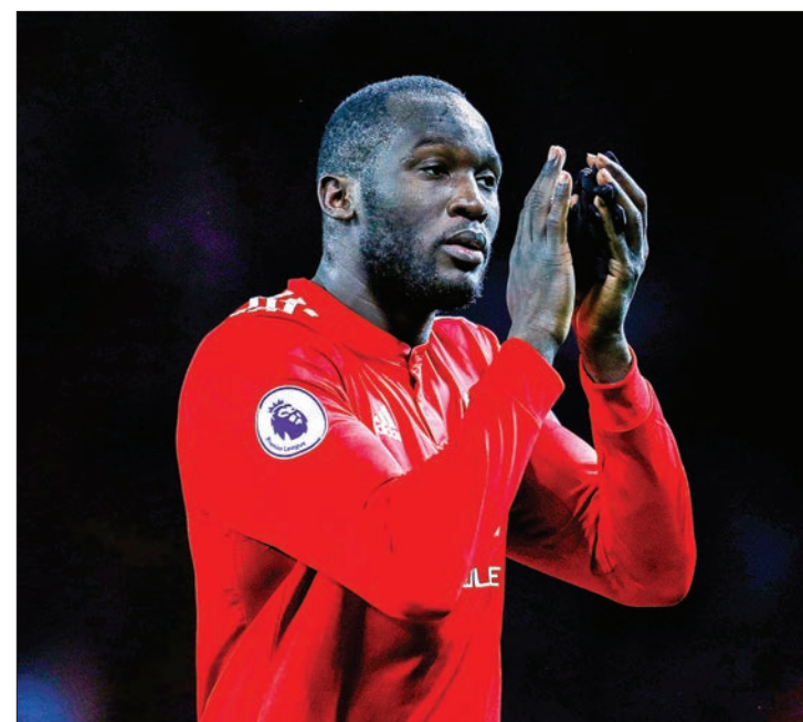
Manchester United's Romelu Lukaku.

On Saturday, the striker fulfilled an unfamiliar role, with no other player at the King Power Stadium creating