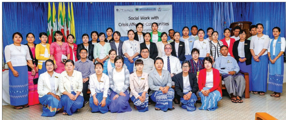
Union Minister Dr Win Myat Aye and attendees pose for a documentary photo.

The Union Minister said conflicts are occurring in many countries of the world and conflicts are threatening our country. This is a country where differences exist but were being united and exist as a union. If the problems are resolved with union spirit, there'll be harmony among all and successes will be achieved. It is easy to achieve harmony if it is based on union spirit. There are problems that