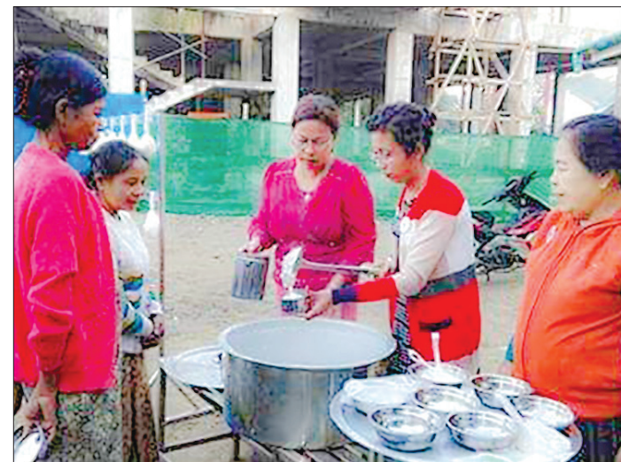
Donors are donating breakfast for patients in Sittway People's Hospital.