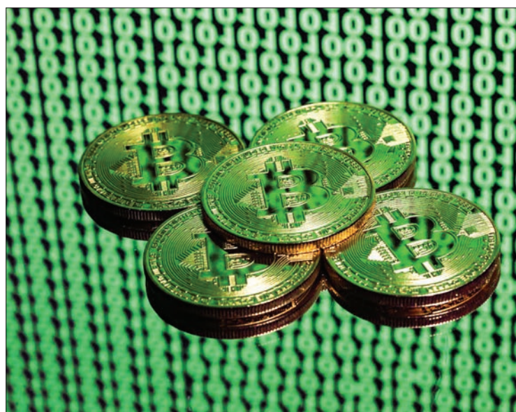
Tokens of the virtual currency Bitcoin are seen placed on a monitor that displays binary digits in this illustration picture on 8 December, 2017.

He said he hopes she will promote easing capital gains taxes and focus on regulatory enforcement.—Reuters ■