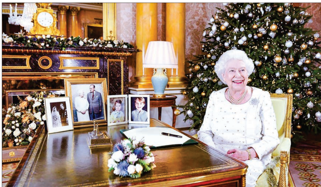
Britain's Queen Elizabeth is seen sitting at a desk in the 1844 Room after recording her Christmas Day broadcast to the Commonwealth, in Buckingham Palace, in this undated photograph received in London, Britain on 24 December, 2017.