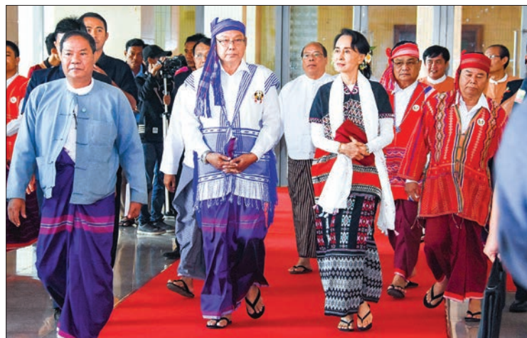
Daw Aung San Suu Kyi and Speaker Mahn Win Khaing Than arrive to attend the Kayin New Year Day Celebration.