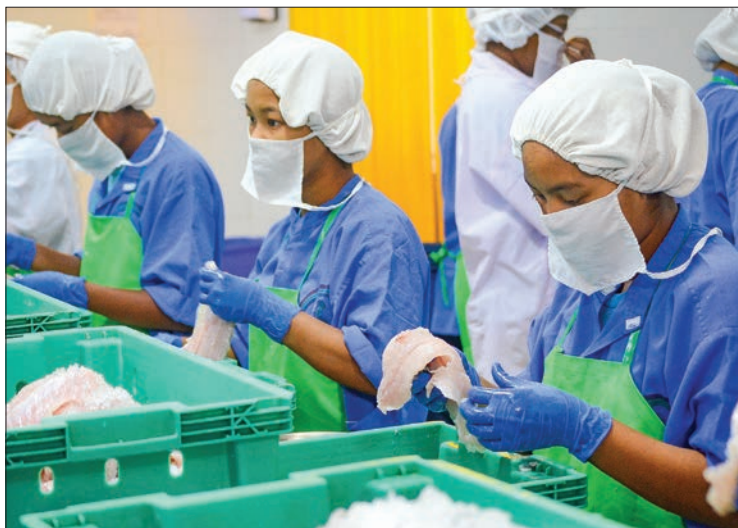
Labourers processing fish for export at a marine product factory.

attained the highest income of over US$650million in 2012-2013 FY and thereafter, the value of fishery export gradually declined due to erratic weather and scarcity of fish resource caused by illegal fishing methods.