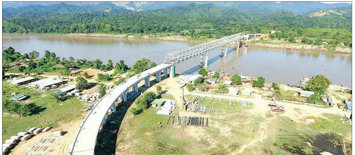
An aerial view of the bridge across the Chindwin River in Khamti.

Initiated since late 2016, the new project is expected to be finalized by March, said U Myo Khine, one of assistant directors of the Bridge Department. The region government funded Ks19.6 billion to the construction of bridge. Upon completion of the project, socio-economic development of local villages in the upper Sagaing Region and Naga area would be improved. The new bridge will be 809.5-meter long and will include 8.5-meter wide motor road and one-meter wide platforms. The bridge