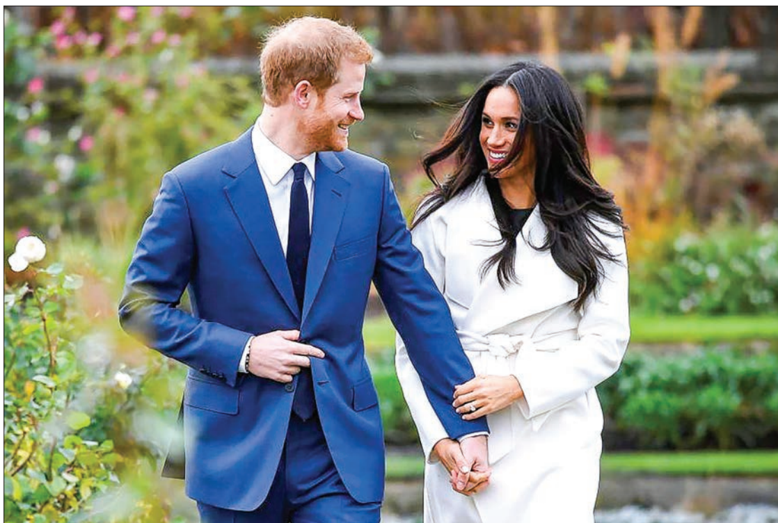
Britain's Prince Harry poses with Meghan Markle in the Sunken Garden of Kensington Palace, London, Britain on 27 November, 2017.

On Wednesday, Kensington Palace announced Markle would join the queen and other senior Windsors for their family Christmas celebrations at her Sandringham estate in eastern England in what commentators said was a break with royal protocol under which such an invitation would normally only be extended to Markle after the wedding. — Reuters ■