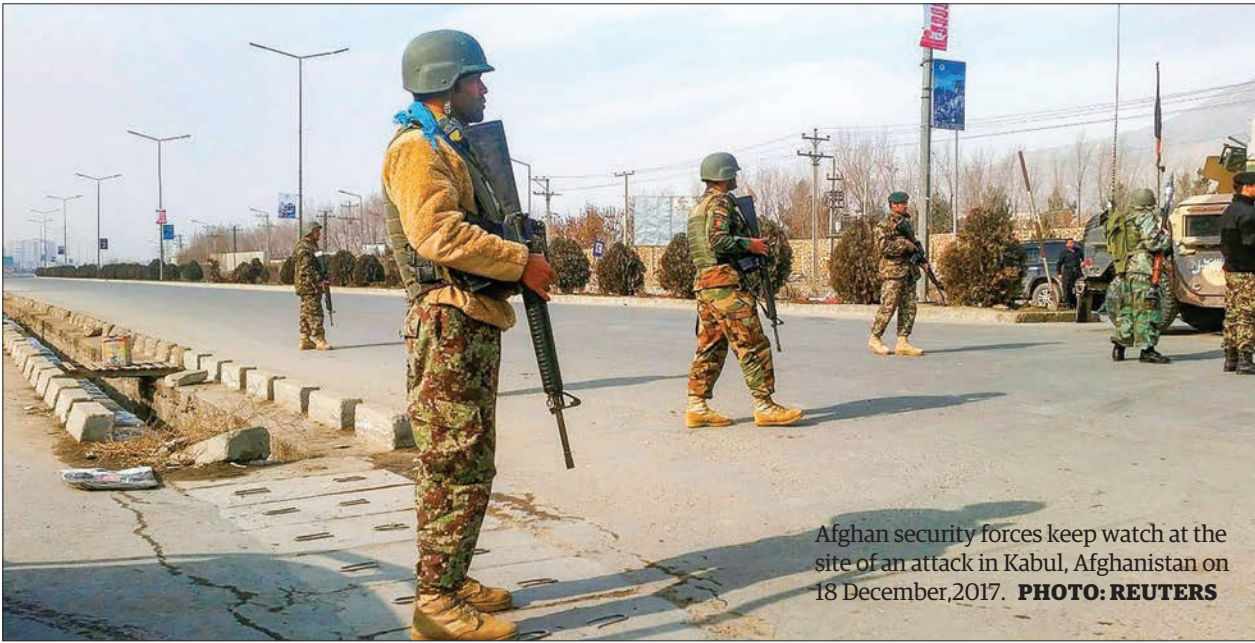
Afghan security forces keep watch at the site of an attack in Kabul, Afghanistan on 18 December, 2017.