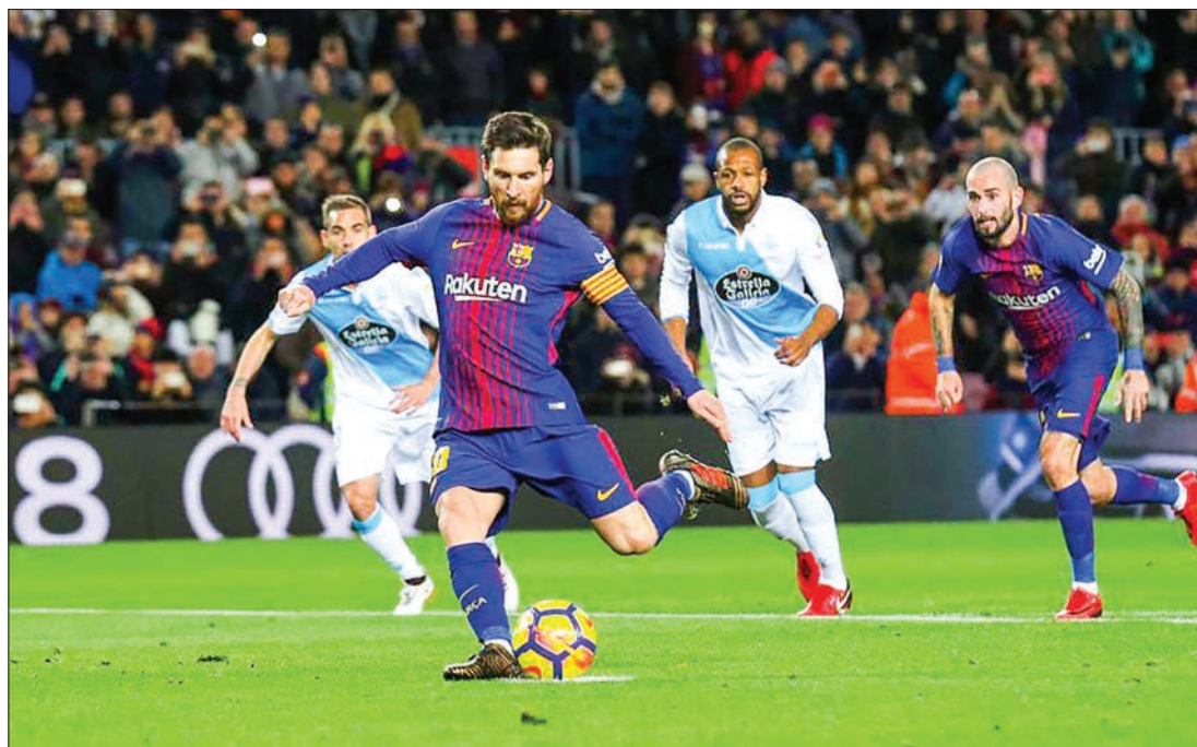
Barcelona's Lionel Messi misses a penalty during the match of La Liga Santander between FC Barcelona and Deportivo de La Coruna at Camp Nou in Barcelona, Spain on 17 December, 2017.