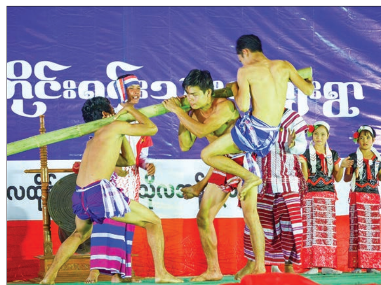
Kayin nationals perform to mark Kayin New Year Festival at National Races Village.