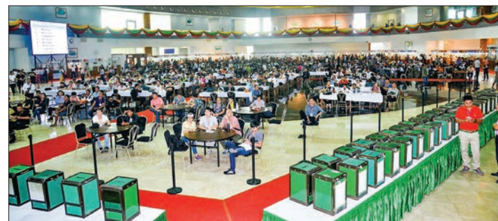
Merchants are seen during the 7 th day of the 2017 Mid-Year Myanmar Jade and Gems Emporium in Nay Pyi Taw.

At the 2017 Mid-Year Myanmar Jade and Gems Emporium, 2659 Jade lots at the price of 165.323 million euros have been sold under an open tender system on 18 December. The schedule for the sales of lots includes 19 December jade lot no. 3451 to 4600, on 20 December jade lot no. 4601 to 5750, on 21 December jade lot no. 5751 to 6685, will be sold under an open tender system. This emporium will be held till 21 December; it was learnt.—Myanmar Digital News ■