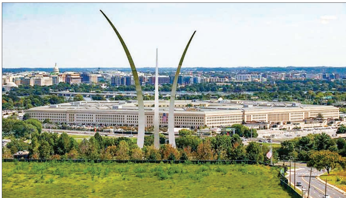
The Pentagon is shown with the Air Force Memorial in the foreground in Arlington, Virginia, US, on 11 September, 2017.