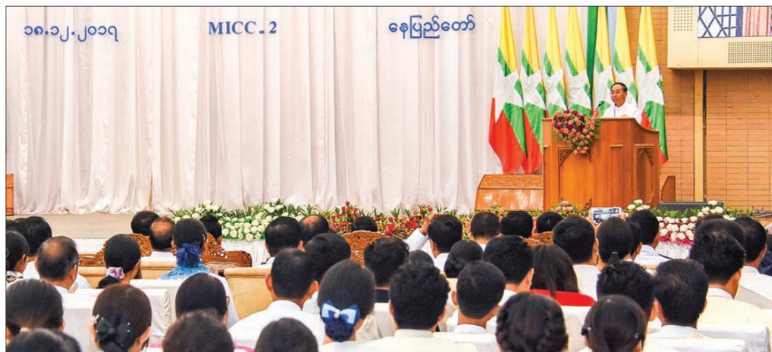
Vice President U Myint Swe delivers the speech at the International Migrants Day 2017.

Regional countries and international organizations are cooperating internationally on the matter of migrant workers.