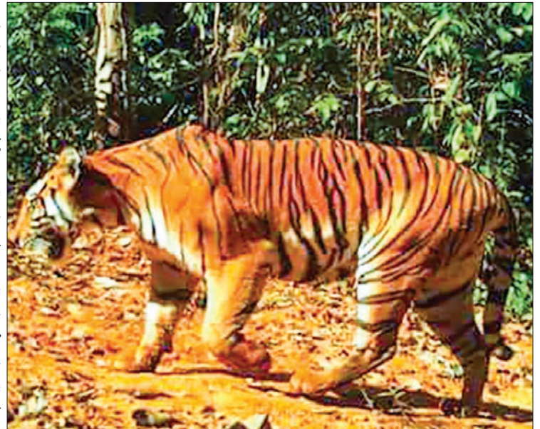
The photo of tiger captured by camera.

The authorities will raise awareness about wildlife conservation in Hugaung Tiger Reserve and Khakaborazi National Park to attract people for activities for Community Based Natural Resource Management (CBNRM). –Myo Win Tun (Monywa)