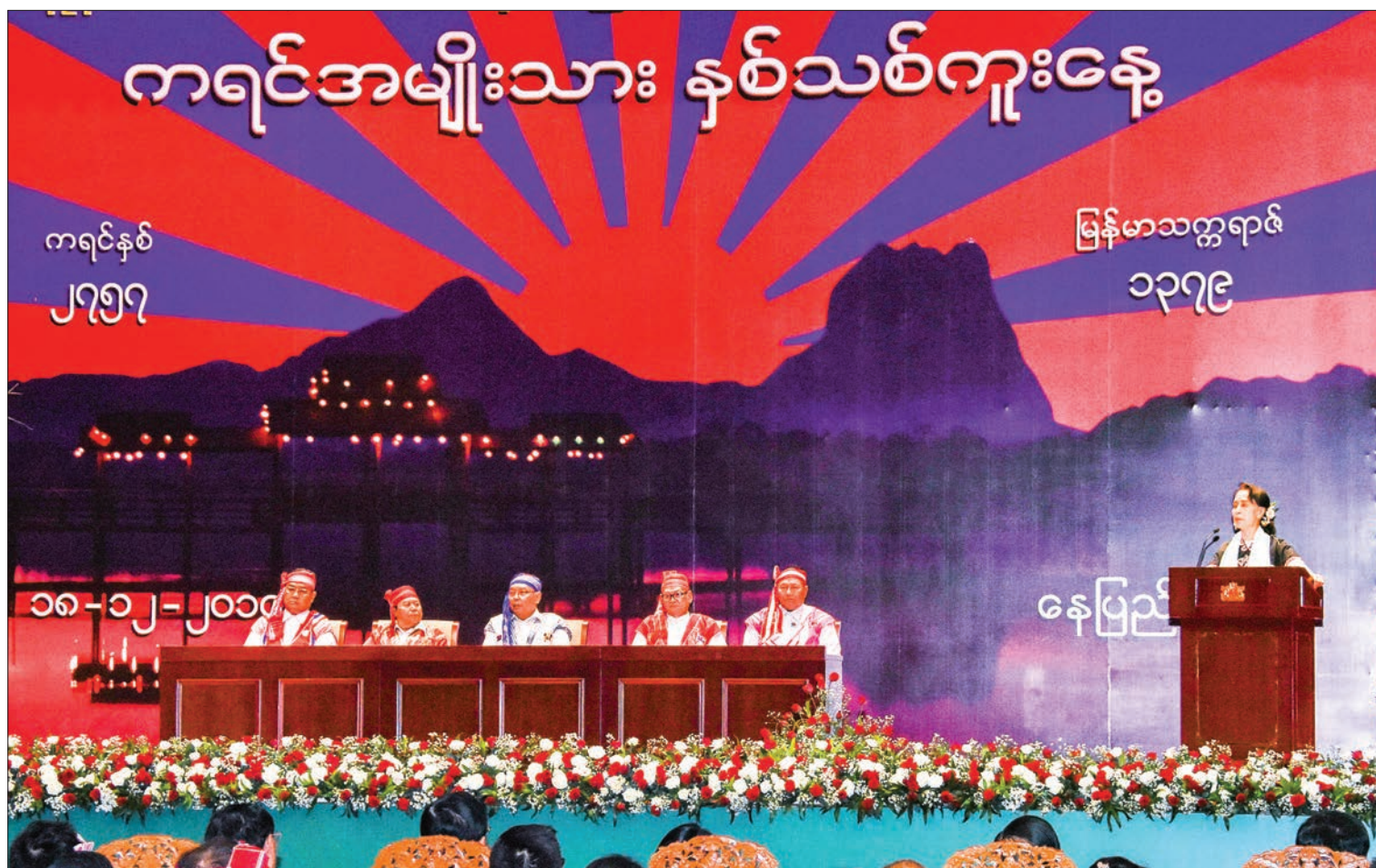
State Counsellor Daw Aung San Suu Kyi addresses the celebration of Kayin New Year Day at the MICC II in Nay Pyi Taw.