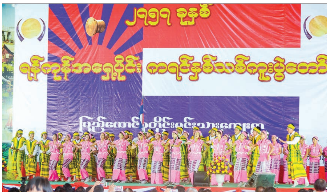
Kayin dance troupe performs at the National Races Village in Yangon.

After the ceremony, traditional festivals were continued followed by Kayin traditional lunch. The ceremony and festivals were attended by State Hluttaw Speaker, Deputy Speaker, state government ministers, southeast command commander and high ranking officials from the civil and military, Taiwan, China, Japan, Thailand, Myanmar and other business persons who were attending the Kayin State Investment Forum, representatives of regional peace organisations and Kayin ethnic nationals.—GNLM