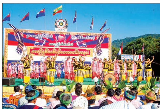
Kayin New Year celebrations in Thaton.