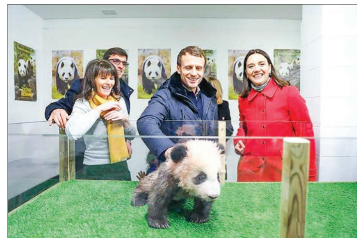
French President Emmanuel Macron (C, Front) reacts with the panda cub Yuan Meng at Beauval zoo in Saint-Aignan, central France, on 16 December 2017. French President Emmanuel Macron on Saturday visited Yuan Meng, the country’s first-ever panda cub, while he was celebrating his 40 th birthday with family at Beauval zoo, the zoo said in a statement.