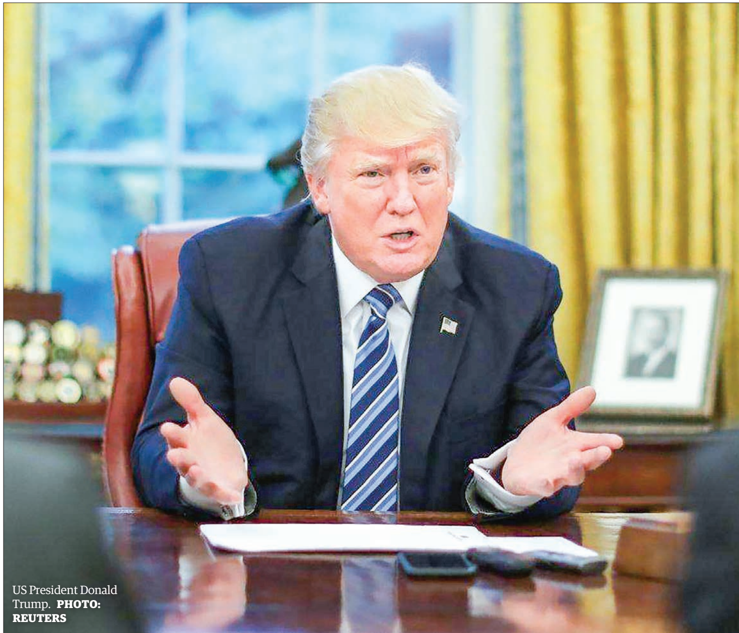
US President Donald Trump.

HONG KONG – Hong Kong stocks closed up 202.30 points, or 0.70 percent, to 29,050.41 points on Monday. The benchmark Hang Seng Index traded between 28,821.19 and 29,143.33. Turnover totaled 92.08 billion Hong Kong dollars (about 11.78 billion US dollars). —Xinhua ■