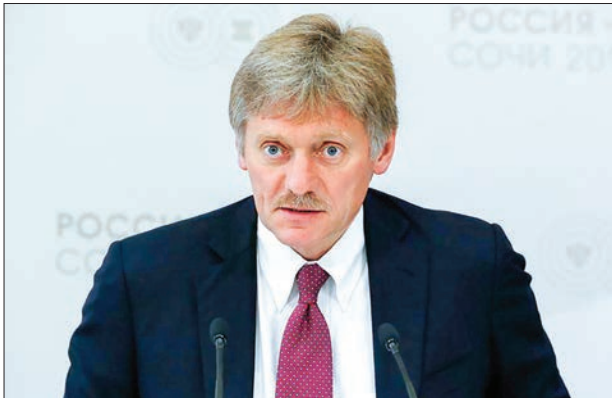
Kremlin spokesman Dmitry Peskov.

MOSCOW—A US tip-off about a planned attack in St Petersburg helped save many lives and Russia and the United States should try to cooperate in the same way in future, Kremlin spokesman Dmitry Peskov said on Monday.