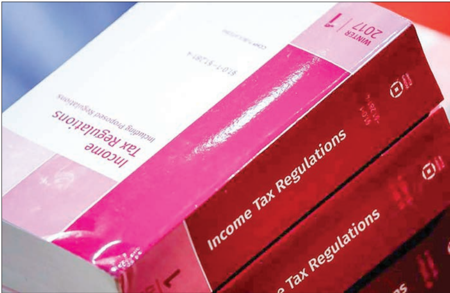
Copies of tax legislation are seen during a markup on the “Tax Cuts and Jobs Act” on Capitol Hill in Washington, US on 15 November, 2017.

The legislation would cut the corporate income tax rate to 21 per cent from 35 per cent but offer a mixed bag for individuals, including middle-class workers, by roughly doubling a standard deduction that does not require itemization, but eliminating or scaling back other popular itemized deductions and exemptions.—Reuters ■