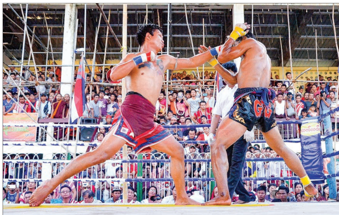
Traditional fighters take part in the Letwai challenge fight marking the Kayin New Year Festival at the Myanmar Railways Football Playing Ground in Insein, Yangon.