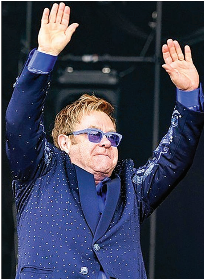
British singer and composer Elton John.

The Elton John AIDS Foundation was founded in 1992 to finance AIDS programs. On Thursday, the singer performed in the Russian capital. During the concert Elton John, in particular, noted that his foundation and Russia's Health Ministry had agreed on a closer partnership in order to fight AIDS in Russia.—Tass ■