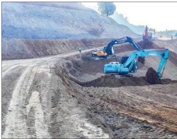
Road work in Maungtaw.