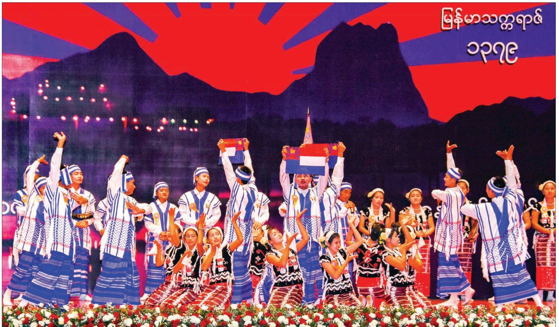
Kayin dance troupe performs a traditional dance at the Kayin New Year Day celebration in Nay Pyi Taw yesterday .