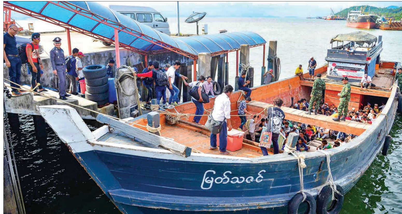
Myanmar migrant workers cross the border between Thailand and Myanmar by boat near the Thai port city of Ranong on 3 July.

During the period of the project, existing human trafficking protection law is being amended in accord with the present situations. At the same time, a national-level