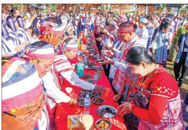
Kayin New Year celebrations in Hpa-an, Kayin State.