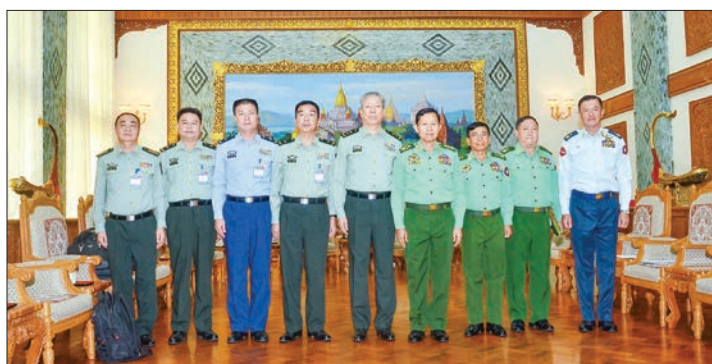
Vice Senior General Soe Win poses for a photo together with Chinese PLA Southern Theater Command delegation.