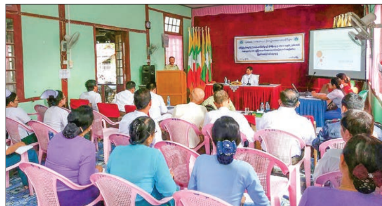
Township-level discussion held on providing monetary assistance to expectant mothers and infants under two held in Rakhine State.

Under the programme, the Provision of Monetary Aids to Expectant Mothers and Infants under two will begin in January 2018, with K 15000 for every mother and infant as a first payment, followed by the paying of K 45000 every three months.—Win Min Soe [IPRD]