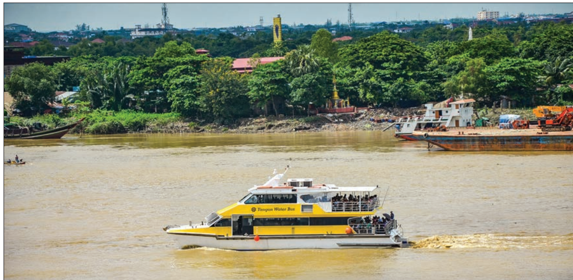
A Yangon water bus is moving along Yangon River in Yangon. Because of the arrival of the new Yangon Water Buses, the transportation system to ease traffic problem.

The company will announce new schedules after