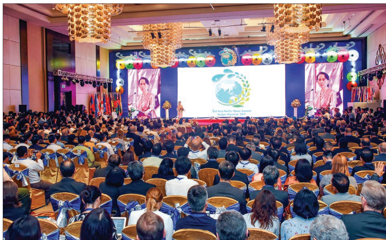
State Counsellor Daw Aung San Suu Kyi addresses the 3 rd Asia-Pacific Water Summit in Yangon.

Myanmar is drafting the overarching Myanmar National Water Law with