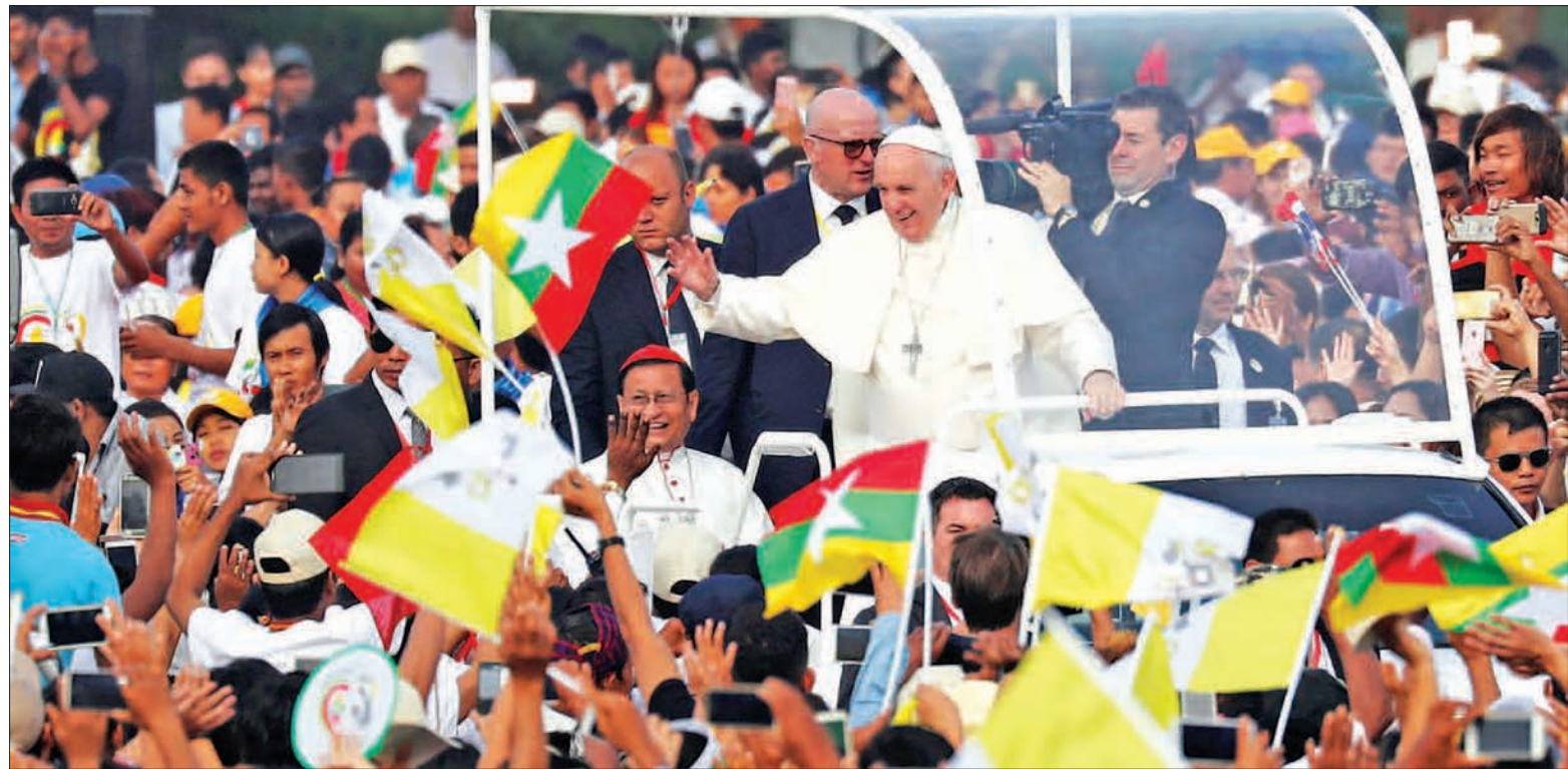
Pope Francis waves to Catholic Christians as he arrives to lead a mass at Kyite Ka San Stadium in Yangon on 29, November 2017.

Some media are shaping that there are events of committing genocides in Myanmar, like 1994 Rwandan genocide. That is why