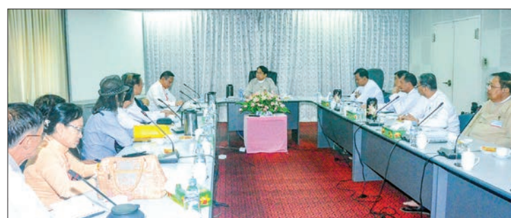
Union Minister Dr Pe Myint meets election commission members from the Myanmar Music Asiyone Central Committee executive committee, at the meeting hall of MRTV on Pyay Road in Yangon.

The Union Minister offered advice concerning the systematic formation of the music association, and recommended having adequate staff working at the committee, keeping proper financial records and cooperating in some cases, followed by suggestions from those present at the meeting. —MNA ■