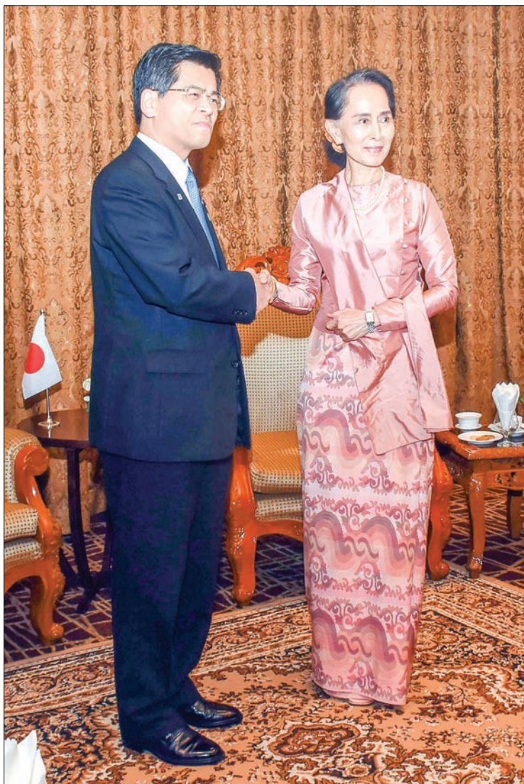
State Counsellor Daw Aung San Suu Kyi greets Japan Minister of Land, Infrastructure, Transport and Tourism Mr. Keiichi Ishii.

Present at the meeting were Union Ministers U Kyaw Tin, U Thant Sin Maung, Dr. Win Myat Aye, U Ohn Maung, Yangon Region Chief Minister U Phyo Min Thein, ambassadors and embassy staff from the respective countries.—Myanmar News Agency