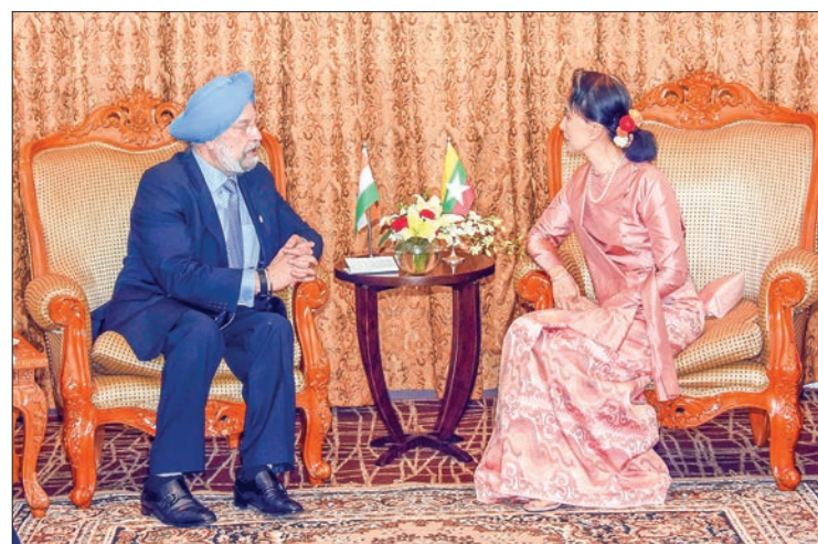
State Counsellor Daw Aung San Suu Kyi holds talks with India Minister of State and Housing and Urban Affairs Hardeep Singh Puri in Yangon on 11 December 2017.