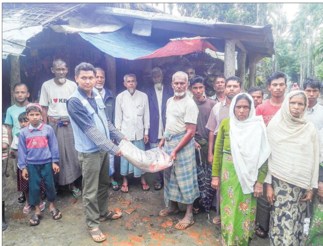
Villagers in Maungtaw accept aid from the Indian Government.