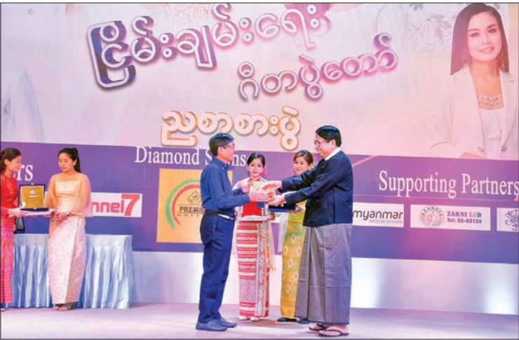
Union Minister Dr Pe Myint presents a certificate of honor to main sponsor of the festival.