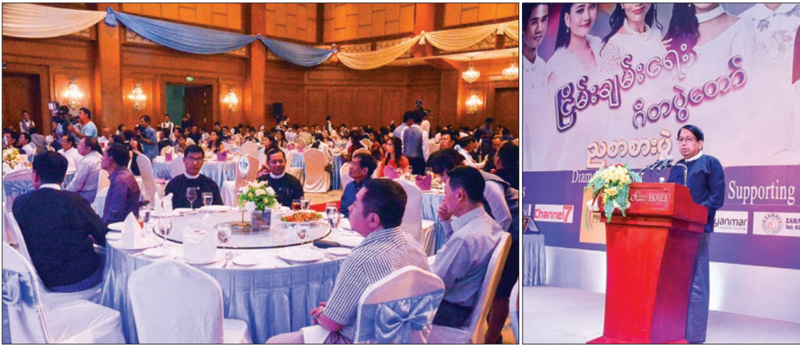
Union Minister for Information Dr Pe Myint delivers the speech at the Peace Music Festival dinner hosted by the Ministry of Information.