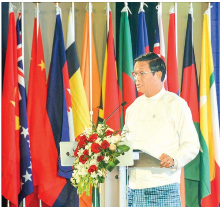
Vice President U Henry Van Thio addresses 3 rd Asia-Pacific Water Summit.

He further called for ensuring the passing of water leadership to the next generation, together with improved water resources. Capacity Building is essential to overcome such challenges comfortably, and building strategic alliances to improve the water sector