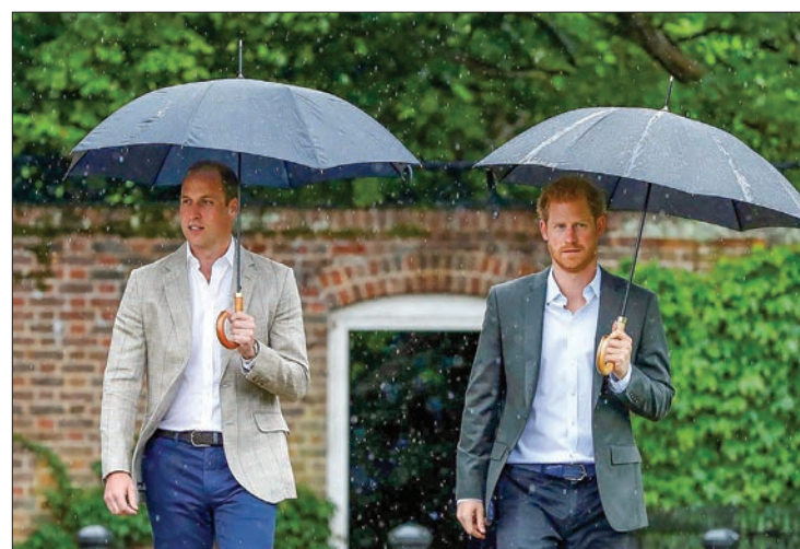
Britain's Prince William, Duke of Cambridge and Prince Harry visit the White Garden in Kensington Palace in London, Britain August 30, 2017.

Diana, the first wife of the heir-to-the-throne Prince Charles, was killed when the limousine carrying her and her