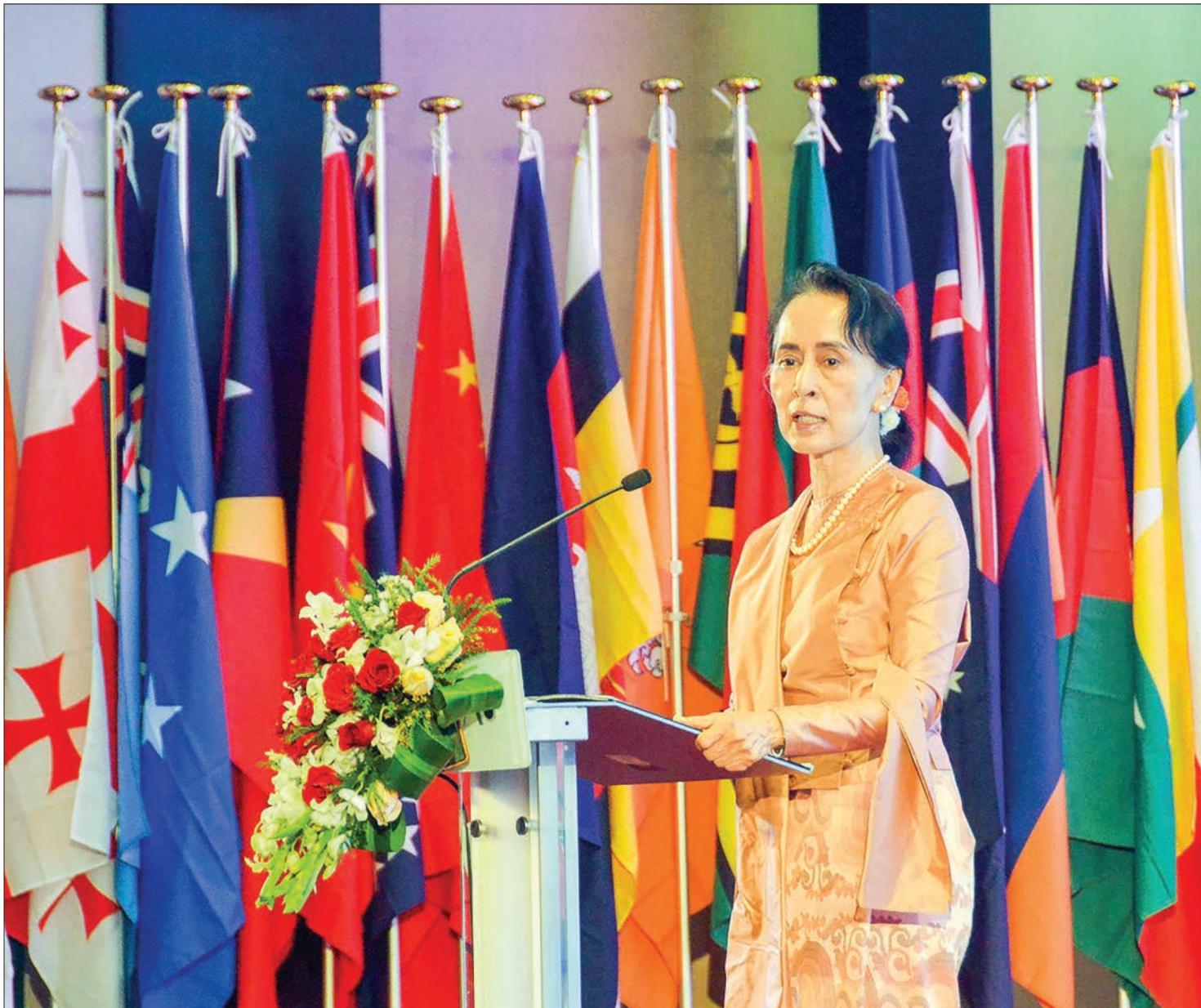
State Counsellor Daw Aung San Suu Kyi delivers the opening speech at the 3 rd Asia-Pacific Water Summit in Yangon.