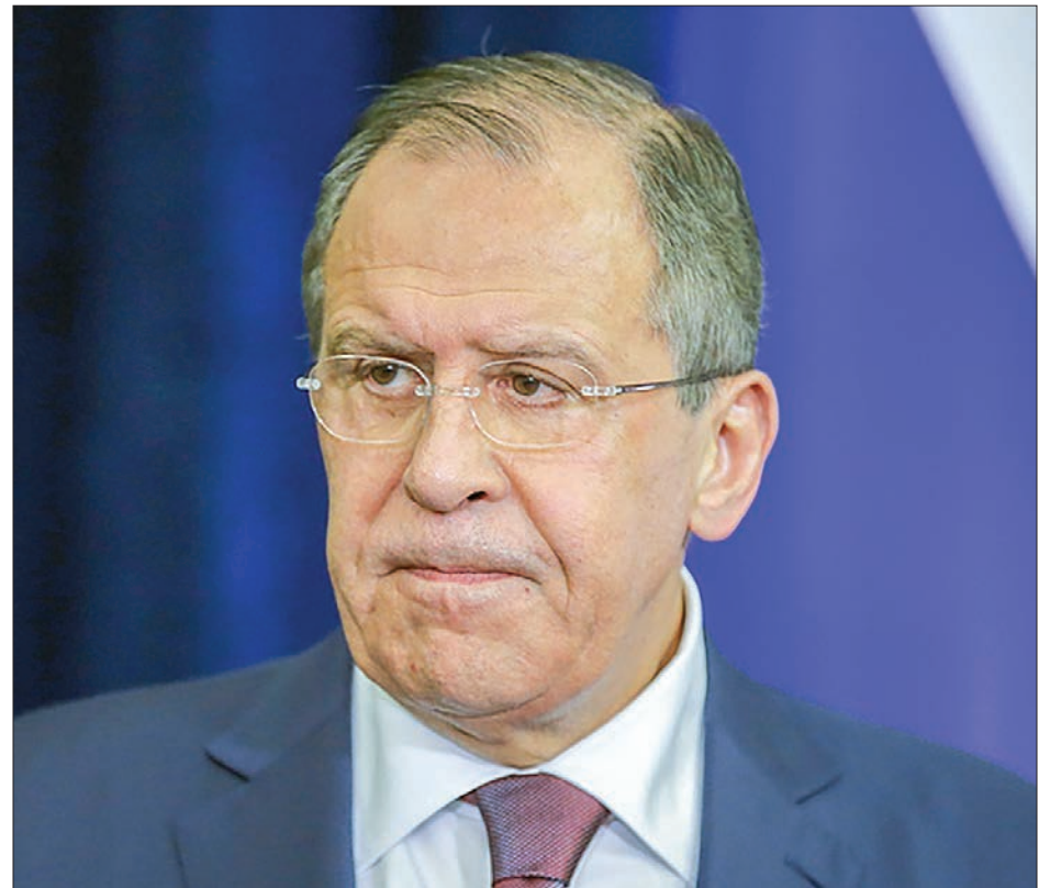
Russian Foreign Minister Sergey Lavrov.