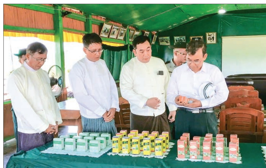
Union Minister U Ohn Win inspects liquid chemical fertilizers.

The Union Minister also said the company needs to find a market for thinning out timber that will soon be produced in the plantation. The forestry department will then grant permits to open a saw mill to produce