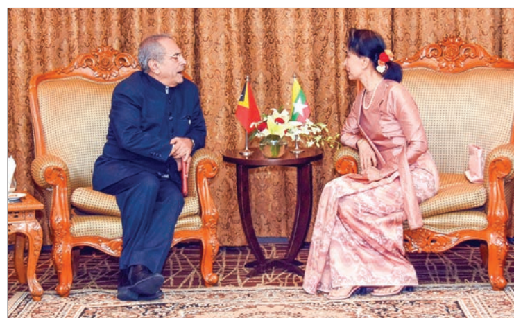
State Counsellor Daw Aung San Suu Kyi holds talks with Timor-Leste's Senior Minister and National Security Advisor, Former President Mr. Jose Ramos-Horta in Yangon on 11 December 2017.