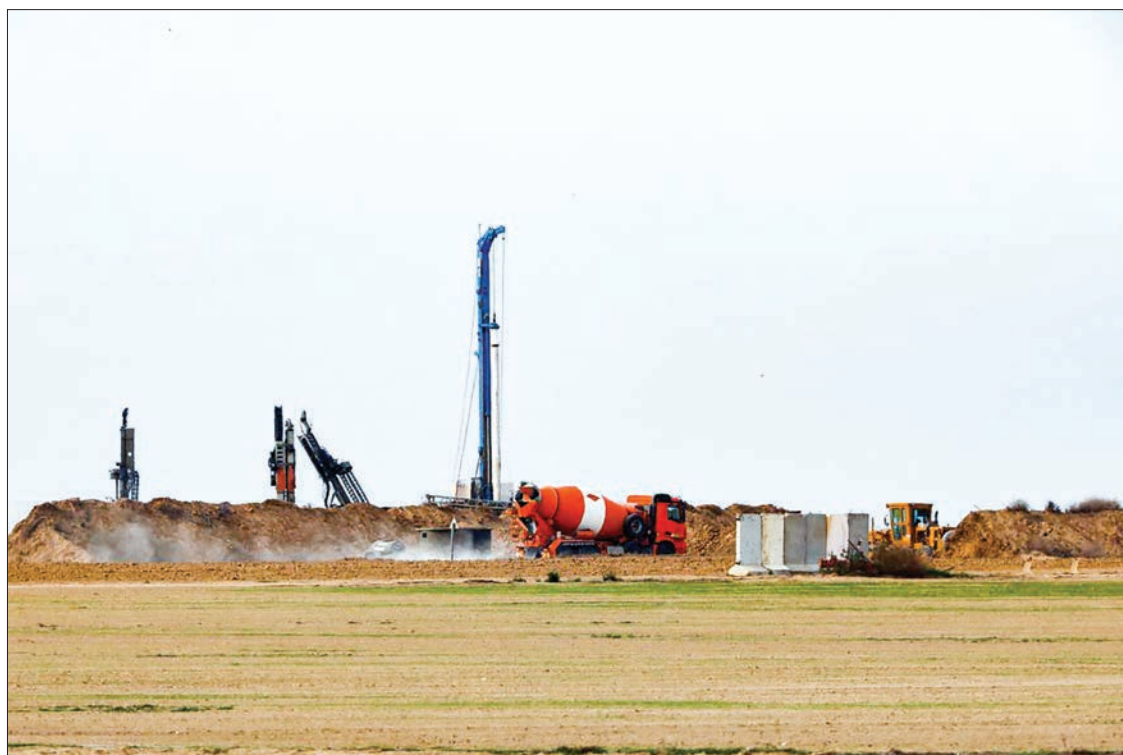
A drill (C) is seen as it works on what the Israeli forces said was a “significant” cross-border attack tunnel from the Gaza Strip, which was being dug by the enclave’s dominant Islamist group, Hamas, near Israel’s border with the Gaza Strip on 10 December, 2017.

best of our knowledge” there were no such casualties on Sunday, though he added that