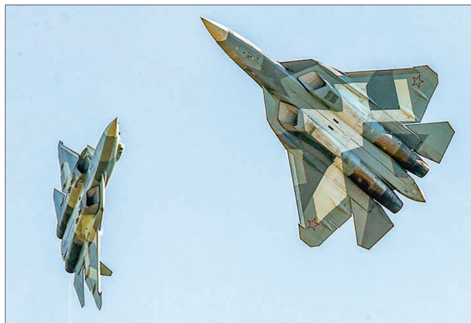
Su-57 fighter jets.

stage engine. It was reported in August that Russia’s T-50 (PAK FA) fifth-generation fighter jet had received the serial index of Su-57. The experimental design work on the most advanced fighter jet should be completed in 2019 and its deliveries to the troops should begin at that time. As United Aircraft Corporation CEO Slyusar said, the pre-production batch will consist of 12 such planes.—Tass ■