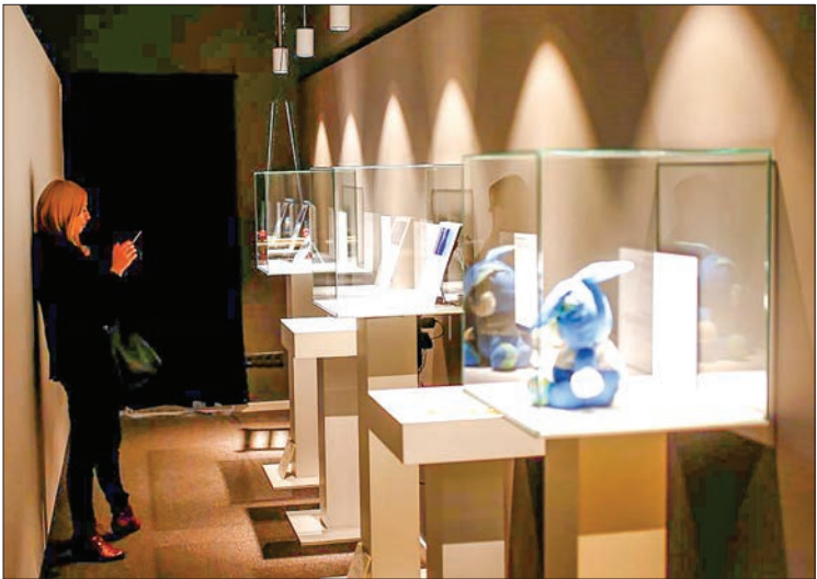
A visitor takes pictures at the exhibition in the Bosnian War Childhood museum exhibition in Zenica, Bosnia and Herzegovina on 7 December, 2017.

The Bosnian 1992-95 war was Europe’s bloodiest since World War Two. The museum has collected more than 4,000 exhibits donated by children who endured it, and over 150 hours of a video archive of oral history interviews. Halilovic said the items from other conflicts could be put on display next year.—Reuters