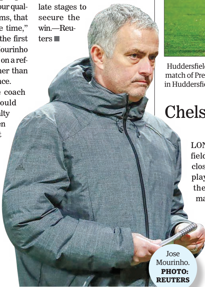
Jose Mourinho.

“But I have also to say that I feel sorry for Michael Oliver because I think he had a good game, I would say very good game, assistants the same. I think they came with the intention to make the perfect work which they almost did,” he said. Mourinho said he had not expected to lose to City without United’s rivals scoring quality goals. “I think when you see Manchester City play, you expect Manchester City to score great goals not to score two disgraceful goals,” he said. Both came from set pieces and were helped by defensive misfortune. “They are the last goals you expect to concede against a quality team like Manchester City, two very bad goals.... with rebound(s). (They were) incredible lucky or unlucky, depending on (your) perspective,” he said, before noting City’s keeper Ederson had to make a double save in the late stages to secure the win.—Reuters ■