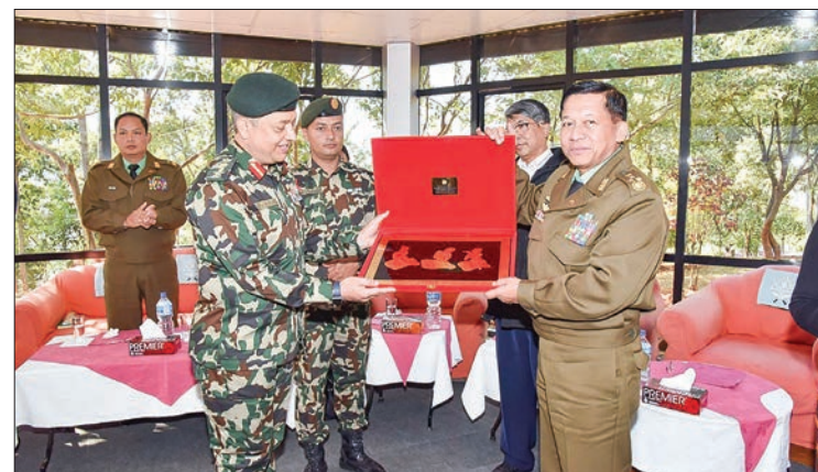
Senior General Min Aung Hlaing gives a souvenir to Army staff of the Nepali Army.