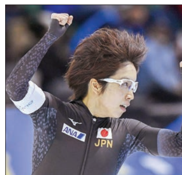
Japan’s Nao Kodaira reacts after winning a World Cup women’s 1,000-meter race in a new world record of 1 minute, 12.09 seconds in Salt Lake City, Utah, on 10 December, 2017.

“The energy built up inside me, and I was able to concentrate on my own thoughts. I was able to devote myself.”