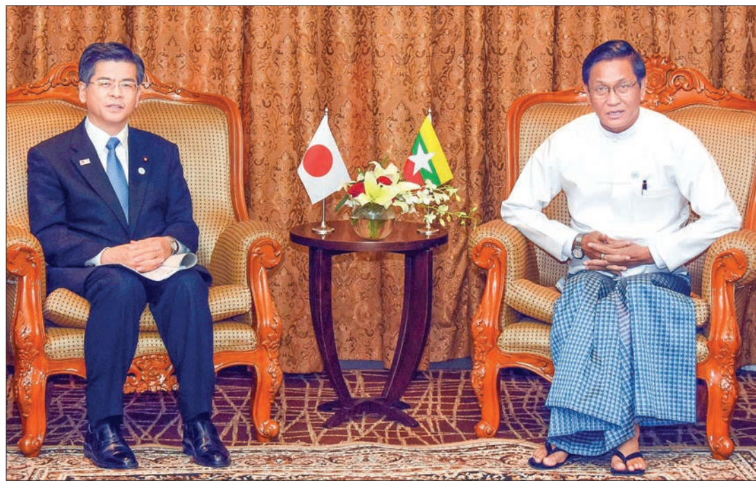
Vice President U Henry Van Thio holds talks with Japanese Minister Mr. Keiichi Ishii at Sedona Hotel in Yangon yesterday.

(The full text of the speech of Vice President U Henry Van Thio is available at www.globalnewlightofmyanmar.com )