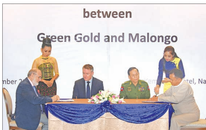
Officials sign the MoU at the ceremony between Malongo Coffee Company and farmers.

Also present at the meeting were Lt-Gen Ye Aung, Union Minister U Ohn Win, Naing Thet Lwin, Deputy Minister Maj-Gen Aung Soe, departmental heads and officials.—Myanmar News Agency ■