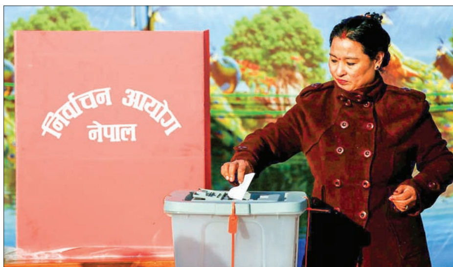
A woman casts her vote during the parliamentary and provincial elections in Bhaktapur, Nepal on 7 December 2017.

Officials said more than 200,000 soldiers and police had been deployed to maintain security at polling centres after one person was killed and dozens wounded in a series of small blasts in the run-up to the polls. "Hundreds of activists, including from a splinter group of Maoists opposed to the election,