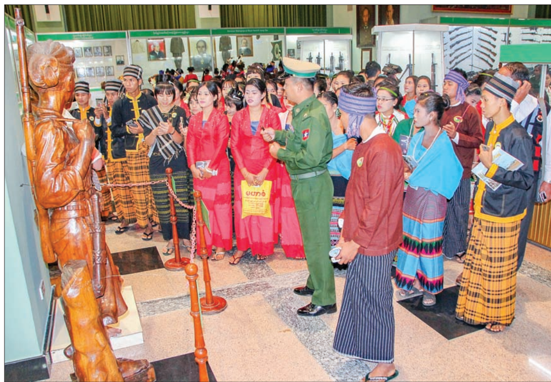
An army official explaining the history of the Tatmadaw in the museum.

The event was attended by Pyithu Hluttaw Deputy Speaker U T Khun Myat, Union Minister for Religious Affairs Thura U Aung Ko, officials from Pyithu Hluttaw office and Ministry of Religious Affairs and Culture. — Myanmar News Agency ■