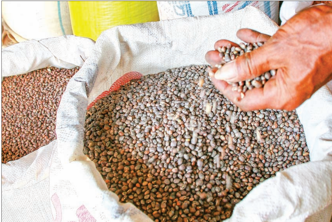
Pulses export income down to US$343 million as of November in this fiscal year than previous year.