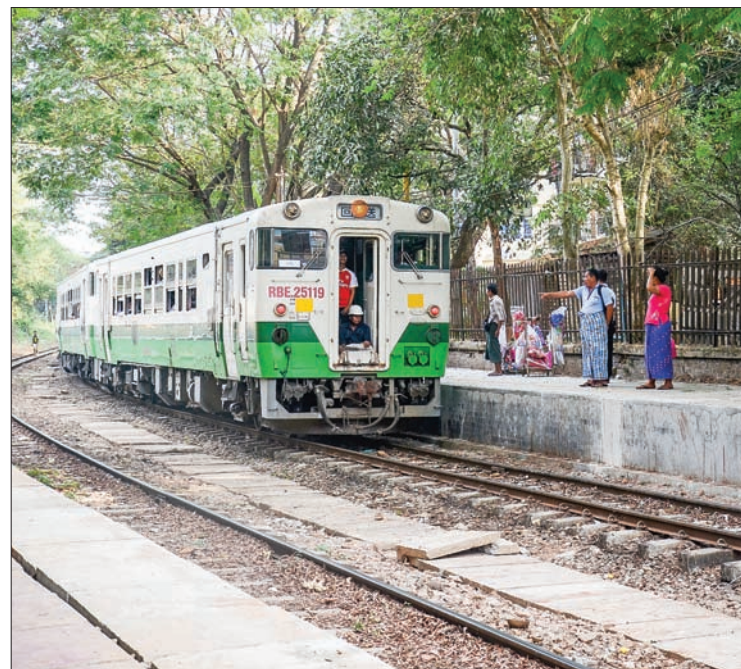
The Yangon circular trains will run one circuit in only 1 hour and 5 minutes instead of three hours.

The MR has already upgraded Lanmadaw, Shan road, Ahlon, Pan Hlaing and Hantawaddy stations. The Pyay railway station and platform is being upgraded. Other stations will be upgraded in 2018.—GNLM