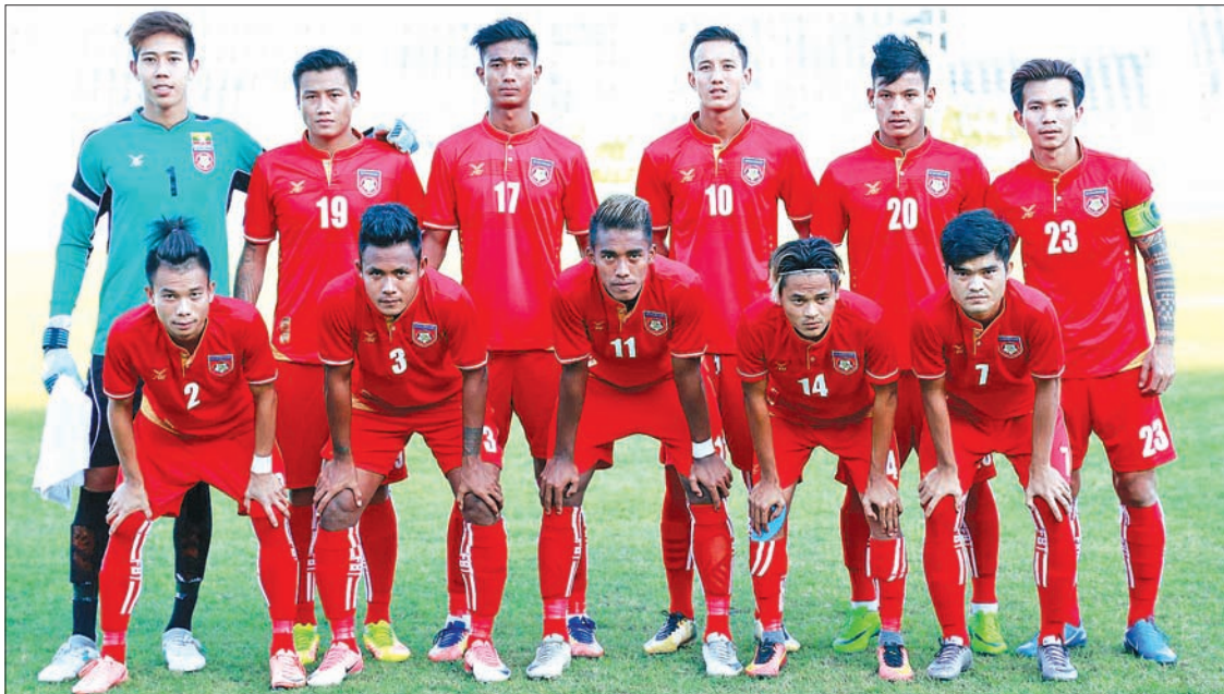
Myanmar U-23 national football team seen at a friendly match against MNL All-Star team in Thuwunna Stadium on 4 December.

Myanmar U-23 will face Vietnam on 11 December. ■