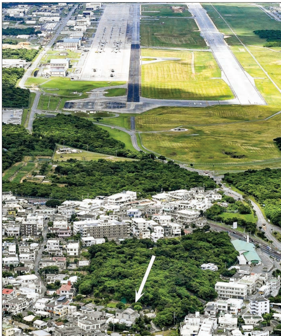
The arrow in this file photo taken on 24 July 2017, indicates the location of a nursery school in Ginowan in Japan's southernmost island prefecture of Okinawa.

did indeed drop from a US aircraft. According to the nursery school, about 50 children were playing in its grounds while eight toddlers and two caregivers were inside the building when they heard a loud sound indicating something had fallen. "I'm appalled to think what would have happened if it had instead fallen just a little bit from where it did," said Take Nago, the 78-year-old chief caregiver at the facility. The Japanese and US governments have been pushing a plan for the relocation of the Futenma base from Ginowan to the less populated Henoko coastal district of Nago, also in Okinawa Prefecture. The relocation is intended to remove the dangers posed by the Futenma base. But Onaga and many other people in Okinawa, which hosts the bulk of US military facilities in Japan, want the Futenma base to be removed from the prefecture altogether. —Kyodo News ■