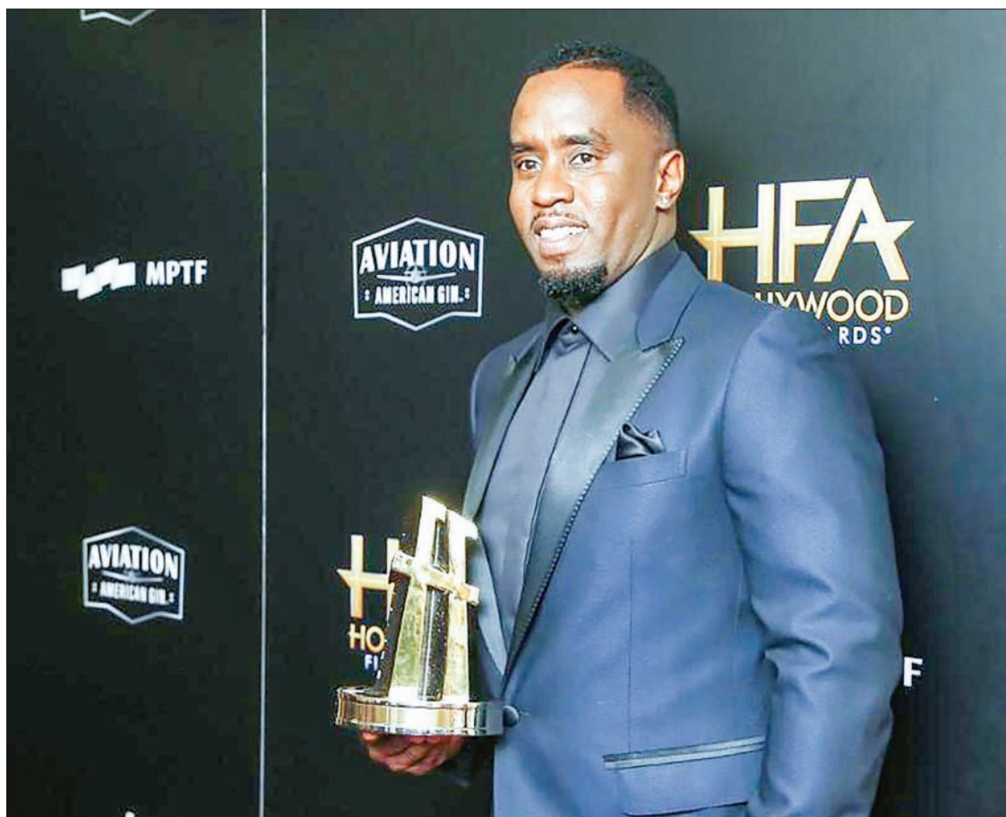
Sean Combs with his Hollywood Documentary Award for ‘Can’t Stop, Won’t Stop: A Bad Boy Story’, Beverly Hills, California, US, on 5 November 2017.

Forbes compiled the list after estimating pre-tax income for the 12 months from June 2016 to 2017 based on interviews with managers, agents, lawyers, interviews and data from Pollstar, the Recording Industry Association of America and tracking firm Nielsen. Last year’s top two artists - Taylor Swift, and British boy band One Direction - both slipped out of the top 10 this year. Swift did not tour this year and released her latest album in November, while One Direction are on hiatus as its members pursue solo careers. —Reuters ■