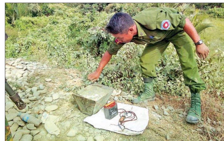
Local policeman deactivates suspect bomb found on Yangon-Sittway Road near Mrauk-U.

THE local police force found two suspected bombs under a bridge between milepost 112/6 and milepost 112/7 on the Yangon-Sittway Road near Mrauk-U at 11:30 am yesterday while they were on patrol. According to the initial news, the local police force removed the suspected bombs and the motor road was temporarily closed.— Myanmar Digital News ■