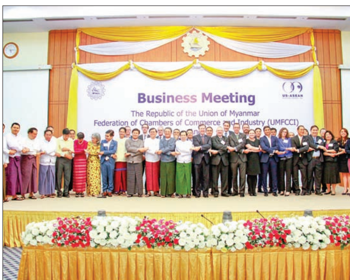
Deputy Governors, CBM Director-General, US-ASEAN Business Council representatives pose a commemorative photo.

Myanmar, development information and data, financial services affairs with other banks, development of commerce and investment, insurance, paying money to foreign countries, development of electronic banking services in Myanmar, Financial Tech (Fin Tech) to be used in the Myanmar bank sector and tasks being carried out to develop the Myanmar financial sector and capital market— Myanmar News Agency ■