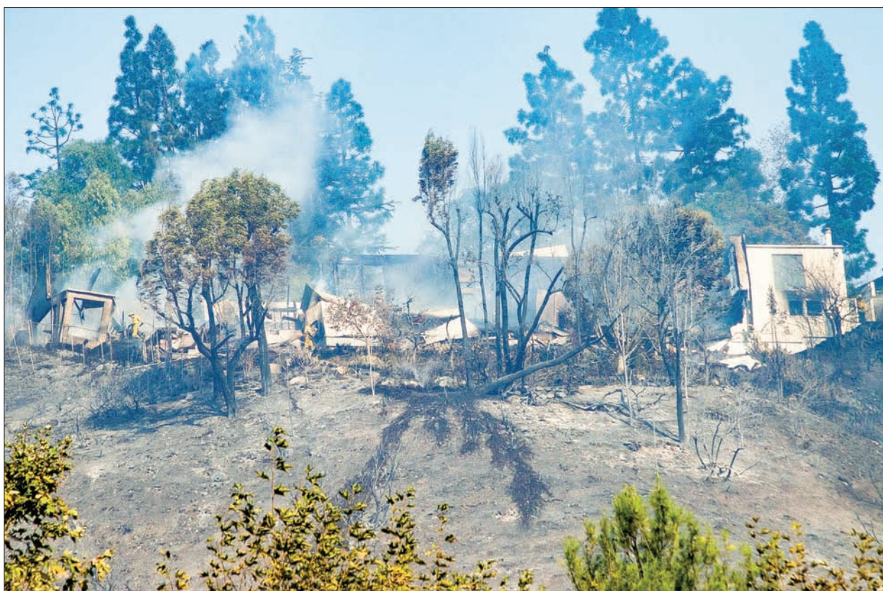
Smoke rises from a home damaged by the Skirball fire near the Bel Air neighbourhood on the west side of Los Angeles, California, US, on 6 December 2017.

"We are expecting some extreme wind behavior this evening," Los Angeles County Fire Chief