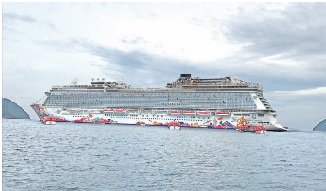
Genting Dream Star Cruise visited Katyinkwa Island in Myeik Archipelago on 27 November and then proceeded to Singapore on 6 December.

The tourists who were on board on the cruise are from 25 countries. They visited Katyinkwa Island through the Phuket jetty in Thailand. The Genting Dream Star Cruise then proceeded to Singapore on 6 December, it is learnt. —Ministry of Hotels and Tourism ■