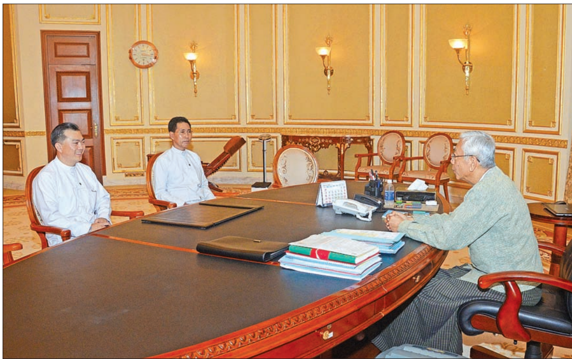
President U Htin Kyaw gives policy guidance to Ambassadors U Kyaw Zeya and U Myo Tint at the Presidential Palace in Nay Pyi Taw.

AT the invitation of His Excellency Mr. Shinzo ABE, Prime Minister of Japan, U Htin Kyaw, President of the Republic of the Union of Myanmar will pay an official visit to Japan in the near future to strengthen bilateral relations and to attend the Universal Health Coverage (UHC) Forum 2017 to be held in Tokyo.—Myanmar News Agency ■