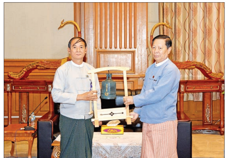
Pyithu Hluttaw Speaker U Win Myint (left) receives a United Nations Peace Bell replica.

In the afternoon, they also visited the Zoological Garden, Planetarium and Safari Park in Nay Pyi Taw. —Myanmar News Agency ■