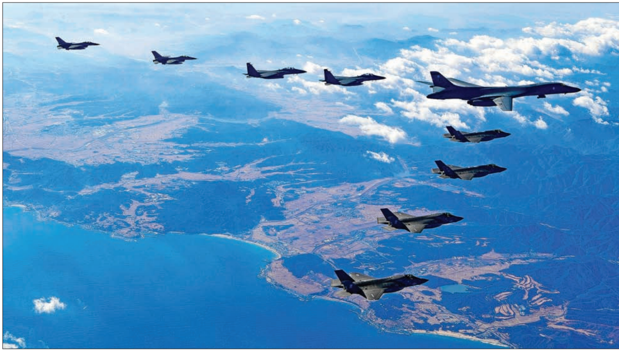
US Air Force B-1B bomber flies in formation during a joint aerial drill called 'Vigilant Ace' between US and South Korea, South Korea on 6 December 2017.

Asked about the bomber's flight, China's Foreign