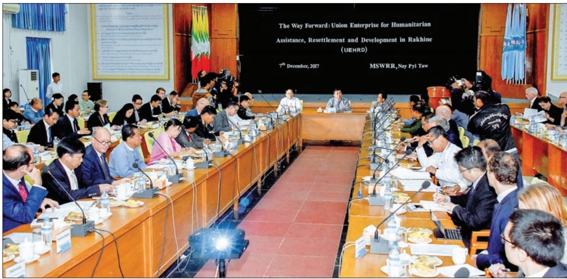
Union Enterprise for Humanitarian Assistance, Resettlement and Development in Rakhine -UEHRD clarifies its projects and efforts to diplomats and INGOs.