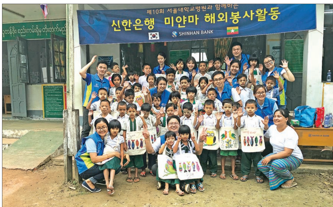
Medical professionals from Seoul University and Shinhan Bank philanthropists provide free health care programme to children at Yangon Children's Hospital and Yankin Children's Hospital.

In the previous programmes in 2016, 49 children received free medical care and surgery. ■