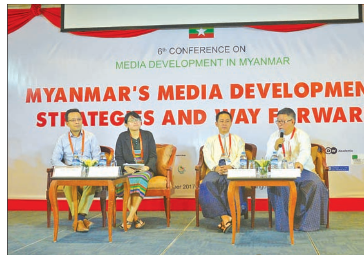
The roundtable discussion titled “Media plurality and sustainability”.