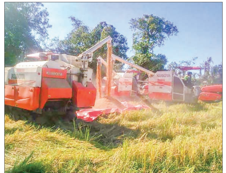
Farmers harvest rice using machine in a paddy field.

A further 352 acres in Phonenar, Lanmadaw, Daungtawyo, Kardi, Saphothar, Ahpoukwa and Garpu villages from Kyauktaw township were harvested from 8 November to 6 December while 282 acres in Chinkharlein and Khotone villages from Yathittaung township was harvested from 8 November to 6 December. And 96 acres in Thapyuchaung village from Buthidaung township was harvested from 10 November to 6 December, it is learnt.—Myanmar News Agency ■