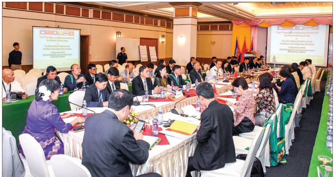
Officials from Department of Traditional Medicine held 8th meeting for traditional medicine of Mekong region countries at Novotel Hotel in Yangon on 20 November 2017.

In the evening, dinner was hosted to the representatives by the Department of Traditional Medicine, Ministry of Health and Sports at Karaweik Palace Hotel.