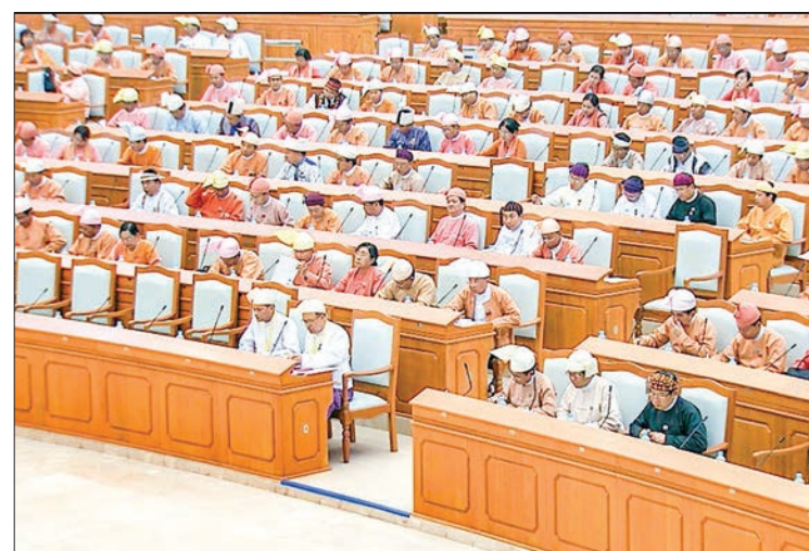
MPs of Pyidaungsu Hluttaw attend the meeting.