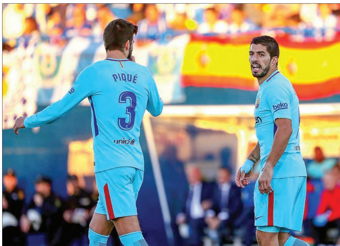
Barcelona's Luis Suarez celebrates with Gerard Pique after scoring their second goal during the match against Leganes at Butarque Municipal Stadium in Leganes, Spain on 18 November, 2017.

If the appeal is unsuccessful, Barcelona will have to rely on their only two fit centre-backs — Thomas Vermaelen and Samuel Umtiti — as they try to maintain their four-point lead at the top of the standings when they visit Valencia on Sunday.—Reuters ■