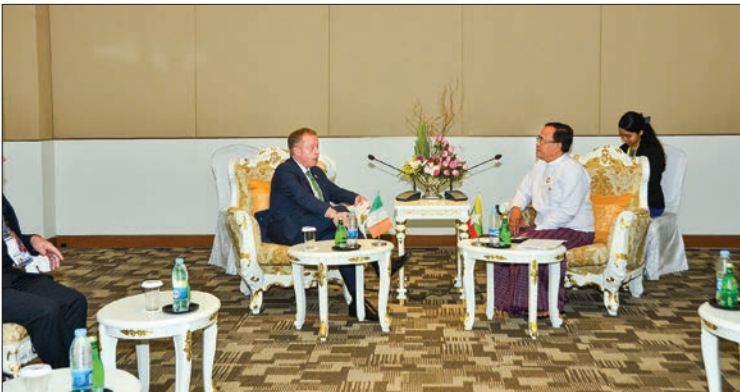
Minister of State for Foreign Affairs U Kyaw Tin meets Ireland Minister of State for Foreign Affairs Mr. Ciaran Cannon in Nay Pyi Taw.

Yesterday, Minister of State for Foreign Affairs U Kyaw Tin separately received in MICC-I heads of partner countries of Asia-Europe Meeting (ASEM) who were attending 13th ASEM Foreign Ministers Meeting. Minister of State for Foreign Affairs U Kyaw Tin received Department of Foreign Affairs and Trade Deputy Secretary H.E. Mr. Gary Quinlan and party at 12:35 p.m., Italy Ministry of Foreign Affairs and International Cooperation Undersecretary of State H.E. Mr. Benedetto Della Vedova and party at 1:20 p.m., Ireland