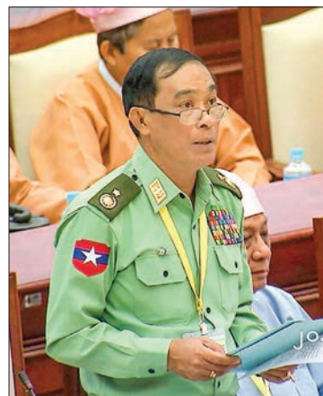
Deputy Minister for Border Affairs Maj-Gen Than Htut