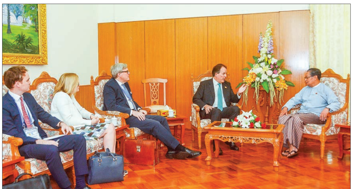
Union Minister for the office of the State Counsellor U Kyaw Tint Swe holds talks with Minister of State for Foreign and Commonwealth Office of Britain in Nay Pyi Taw on 20 November.

Present at the meeting were officials from the Ministry of the Office of the State Counsellor and the Ministry of Foreign Affairs of Myanmar as well as British Ambassador to Myanmar H.E. Mr. Andrew Patrick and officials from the Foreign and Commonwealth Office of Britain.—Myanmar News Agency ■