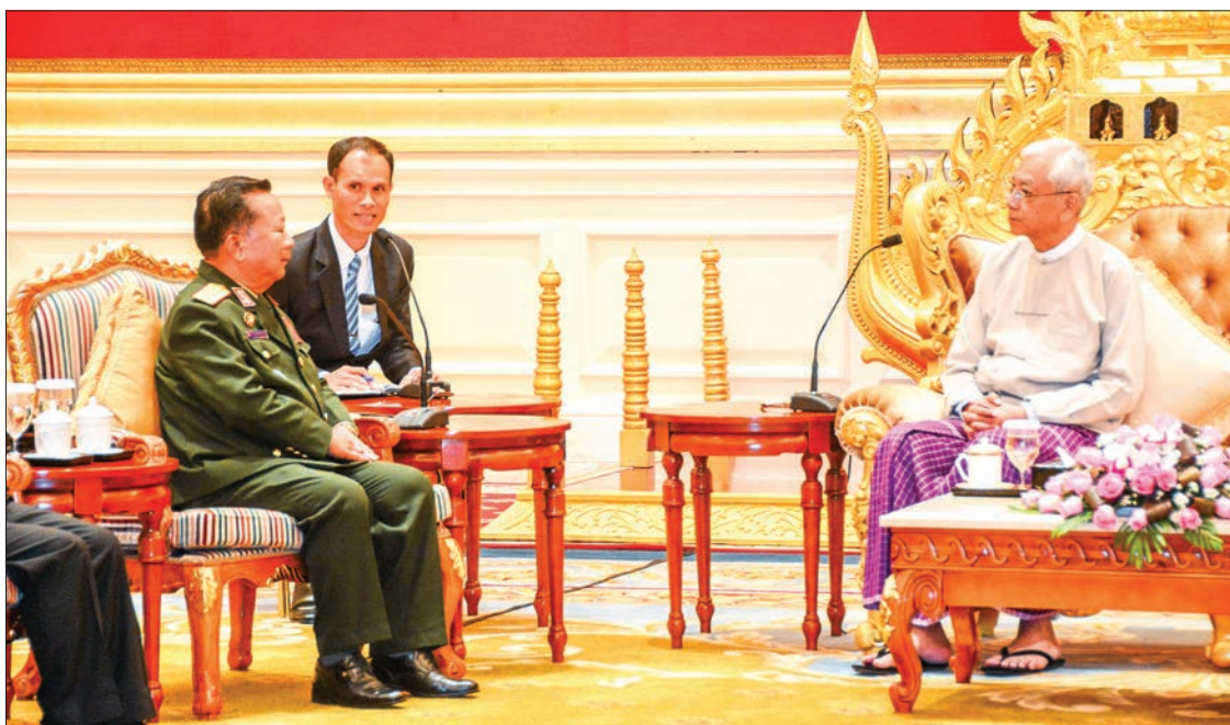
President U Htin Kyaw holds talks with Deputy Defence Minister of Laos Lt. Gen Chansamone Chanyalath at the presidential palace in Nay Pyi Taw on 20 November 2017.

Senior General Min Aung Hlaing, Union Minister Lt Gen Sein Win, Deputy Minister U Min Thu, Lao Ambassador to Myanmar and other responsible officials also attended the meeting.—Myanmar News Agency ■