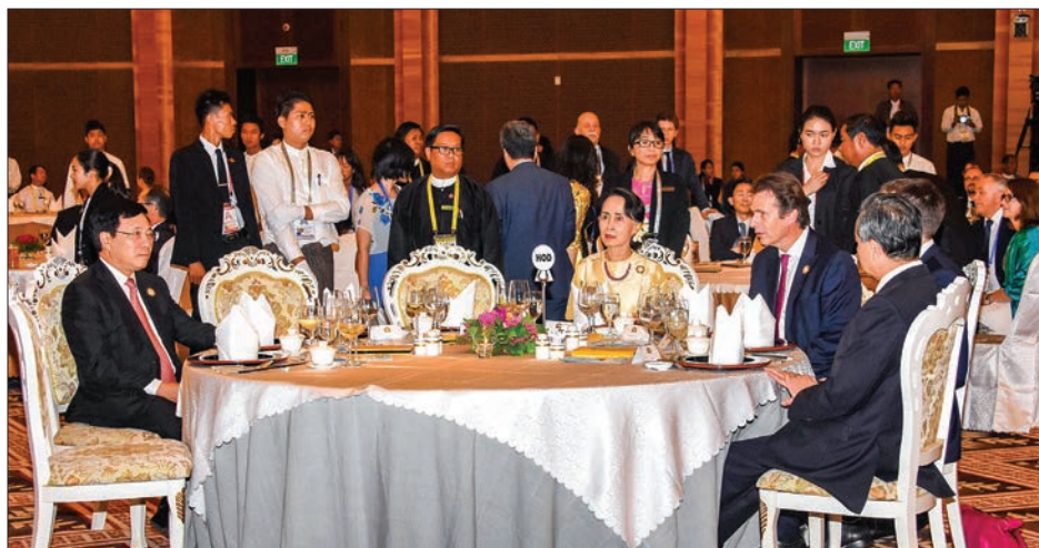
State Counsellor Daw Aung San Suu Kyi attends a dinner in honour of participants of the 13 th ASEM Foreign Ministers' Meeting on 20 November.