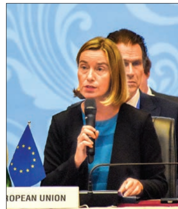
Mrs. Federica Mogherini, Vice Chairperson of the European Commission

EU wants to reform global multilateral institutions as a pillar of prosperity and security for