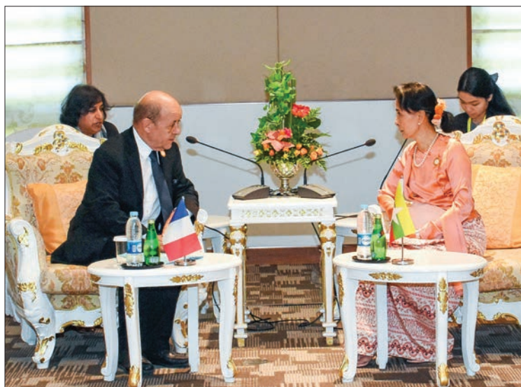
State Counsellor Daw Aung San Suu Kyi holds talks with Mr. Jean Yves Drian, Minister for Europe and Foreign Affairs of French.