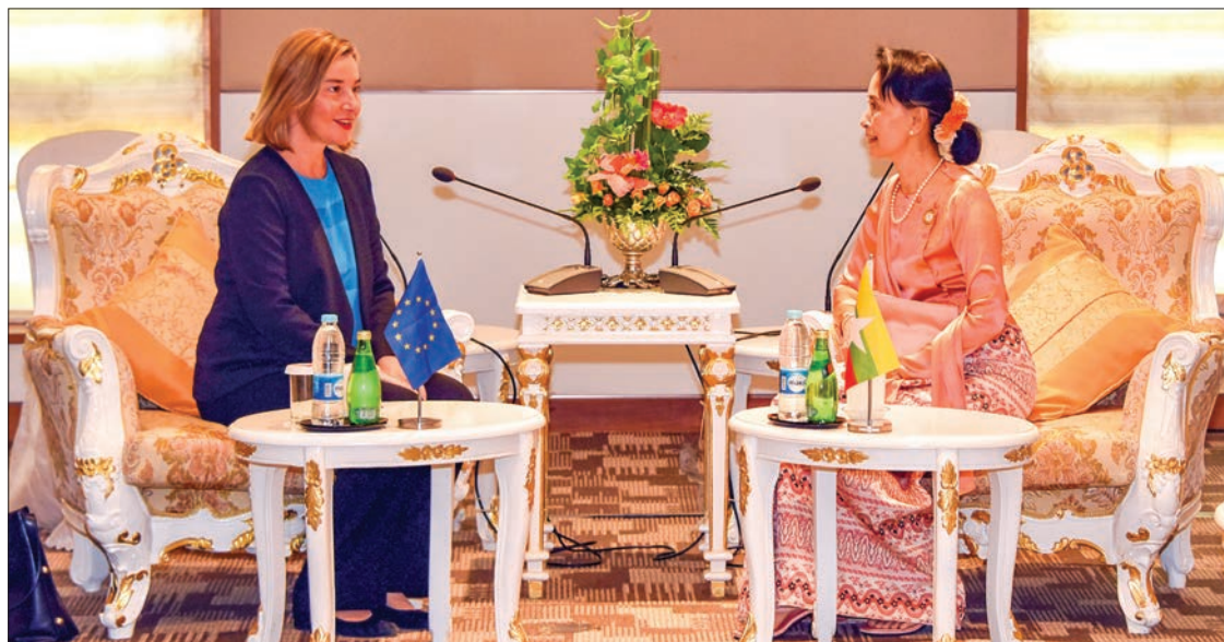
State Counsellor Daw Aung San Suu Kyi receives EU Commission Vice President Mrs. Federica Mogherini.