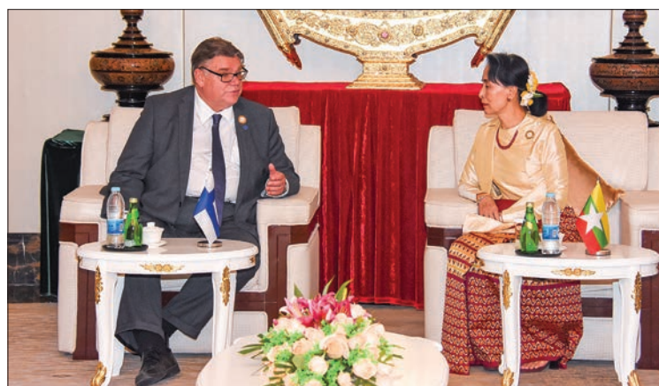
State Counsellor Daw Aung San Suu Kyi holds talks with Finland Foreign Minister Mr. Timo Juhani Soini.