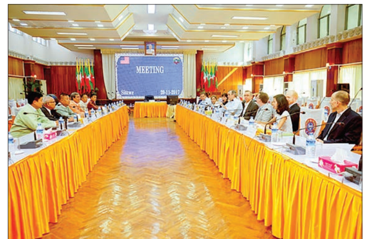
Rakhine State Chief Minister U Nyi Pu holds talks with a delegation led by Senator Jeff Merkley and US Ambassador Mr Scot Marciel in Sittway.

The delegation led by Senator Jeff Merkley met with responsible officials from Arakan National Party and Wun Let Foundation and Islamists town-elders and Islamist women at Aung Mingalar ward of Sittway. —Tin Tun (IPRD) ■