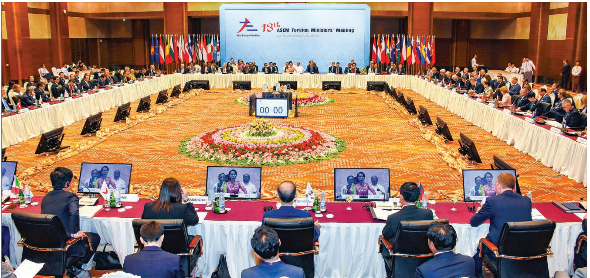
State Counsellor Daw Aung San Suu Kyi addresses the 13 th ASEM Foreign Ministers' Meeting in Nay Pyi Taw on 20 November.