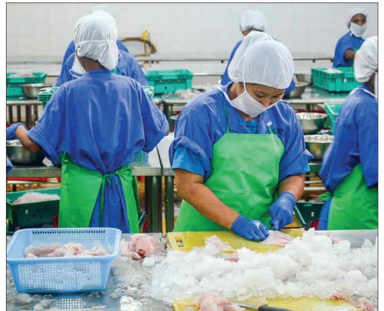
Workers work at a fish factory in Yangon.

Fisheries export revenues were $536 million in FY 2013-