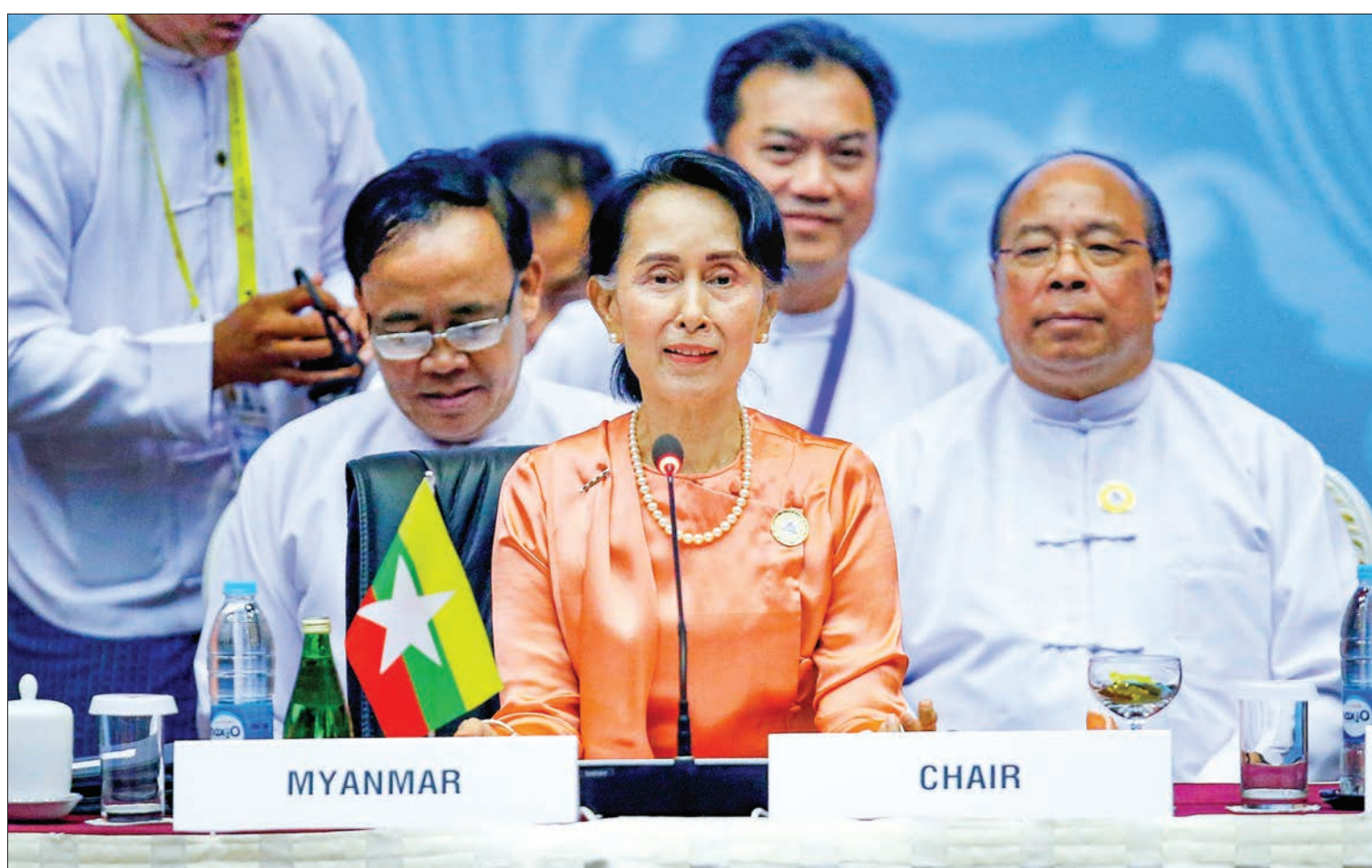
State Counsellor Daw Aung San Suu Kyi addresses the 13 th ASEM Foreign Ministers' Meeting in Nay Pyi Taw on 20 November.

"All countries even the developed and powerful have to cope with constraints and difficulties. I believe that if policy makers develop a true understanding of each other's constraints and difficulties, the process of addressing global