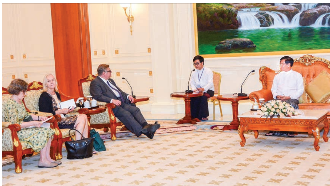
Vice President U Henry Van Thio holds talks with Finland Foreign Minister H.E. Mr. Timo Juhani Soini at the Presidential Palace in Nay Pyi Taw on 20 November.