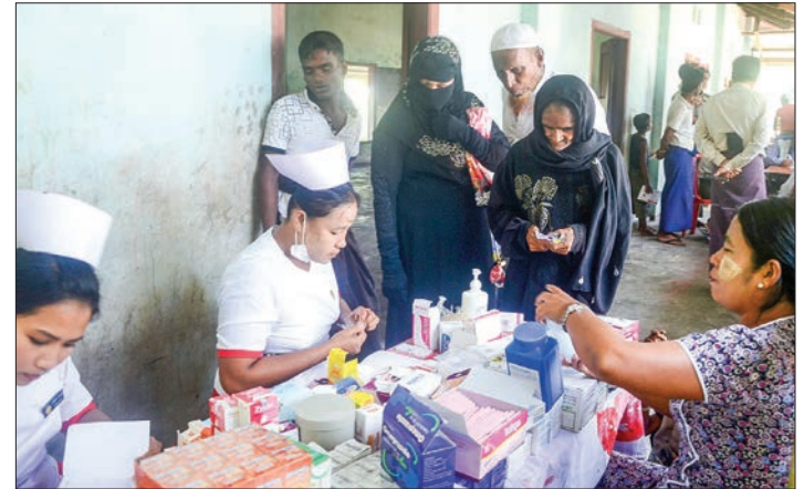
Nurses giving medical care and vaccinating children for prevent Encephalitis to Islamists in Pan Taw Pyin village.

Over 200 children were vaccinated against encephalitis, with more than 170 were