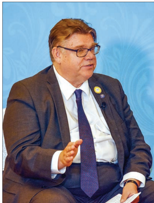
Finland Foreign Affairs Minister Timo Soini speaks during the interview with Myanmar News Agency.

Q: How should Myanmar seek out to utilize private sector funding offered by Finland?