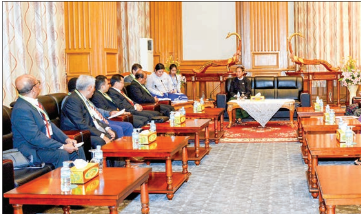
Pyithu Hluttaw Speaker U Win Myint holds talks with Lt. Gen (Han) Dr Nano Sampono in Nay Pyi Taw.

PYITHU Hluttaw Speaker U Win Myint received a delegation led by Deputy Speaker of Indonesian regional representative council of Lt. Gen (Han) Dr Nano Sampono at the guest room of the Hluttaw building yesterday afternoon.