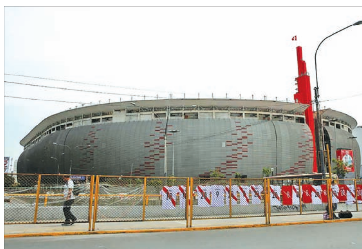
Street vendors sell Peru's national soccer T-shirts in front of National stadium in Lima, Peru, on 9 November 2017.

A small presence of police officers was needed to clear a path for the team and their management staff, who are under immense pressure to take the side to their first World Cup fi-