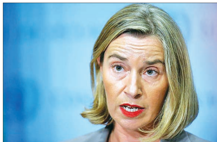
European Union Foreign Affairs Chief Federica Mogherini gives her remarks after attending a meeting of the parties to the Iran nuclear deal during the 72 nd United Nations General Assembly at UN headquarters in New York, US, on 20 September 2017.

Trump broke early with the “Pivot to Asia” of the Obama administration, worrying some traditional allies that he would allow China to extend its increasing dominance. —Reuters ■