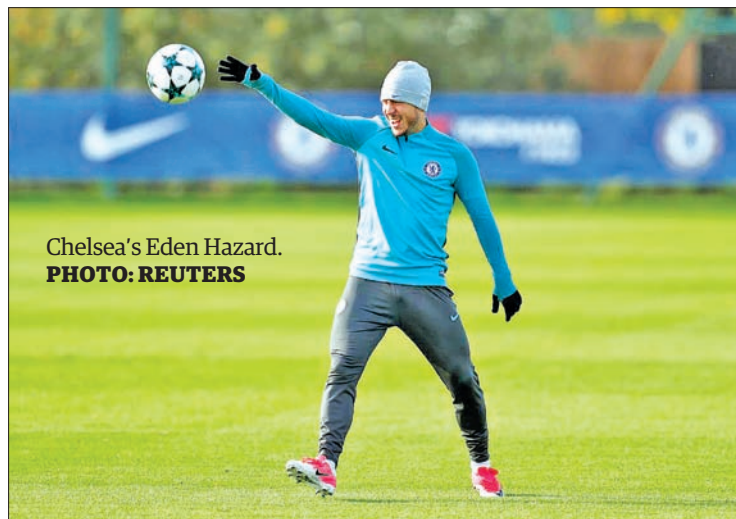
Chelsea's Eden Hazard.

“Everyone knows the respect I have for Zidane as a player, but also as a manager. He was my idol,” Hazard told Belgian TV channel RTL. “I do not know what will happen in the future. However, for sure, to play under Zidane would be a dream.