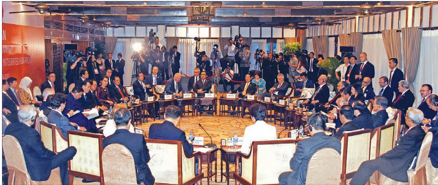
State Counsellor Daw Aung San Suu Kyi attends the informal meeting titled Partnering for New Dynamism for a Comprehensively Connected and Integrated Asia-Pacific in Danang, Viet Nam on 10 November 2017.

APEC was established 28 years ago with the aim of developing the region's economic sector. Globalisation, changing