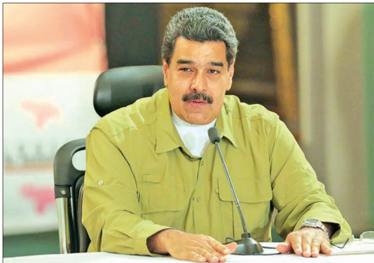
Venezuela's President Nicolas Maduro speaks during a meeting with ministers in Caracas, Venezuela, on 6 November 2017.

"We have developed relations in Latin America so that in the company of friendly countries and governments, we can facilitate the conditions for a presidential election," Julio Borges, president of the opposition-led National Assembly, told