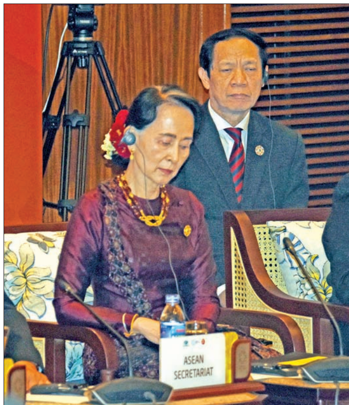
State Counsellor Daw Aung San Suu Kyi delivers a statement at the ASEAN-APEC Leaders Informal Dialogue in Da Nang, Viet Nam on 10 November.

We have been striving to build an ASEAN Community, which is deeply