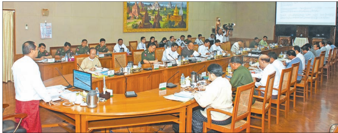
Vice President U Myint Swe addresses the second coordination meeting of the 70 th Independence Day committee in Nay Pyi Taw on 10 November 2017.

The five national objectives are: to safeguard and protect the non-disintegration of the Union and the non-disintegration of the National Solidarity and Perpetuation of Sovereignty by all ethnic people; to work hard for emergence of a constitution which meets the democratic norms and can guarantee a democratic federal union; to make more efforts for implementation of the peace process; to reach the goal of "eternal peace" through political dialogue through cooperation among all national races of the Union with the Union