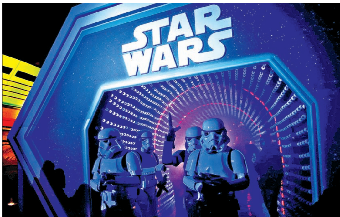
Characters of Star Wars take part in an event held for the release of the film "Star Wars: The Force Awakens" in Disneyland Paris in Marne-la-Vallée, France on 17 December, 2015.