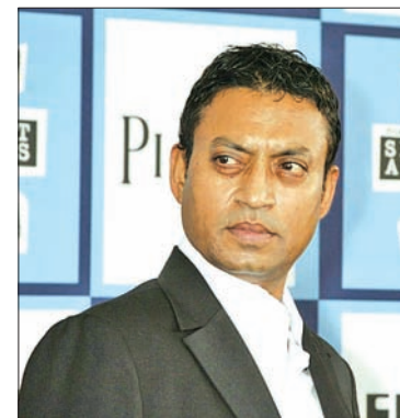
Irrfan Khan.

"His sensibility, his passion, his sense of love and society is deep. I was moved with his