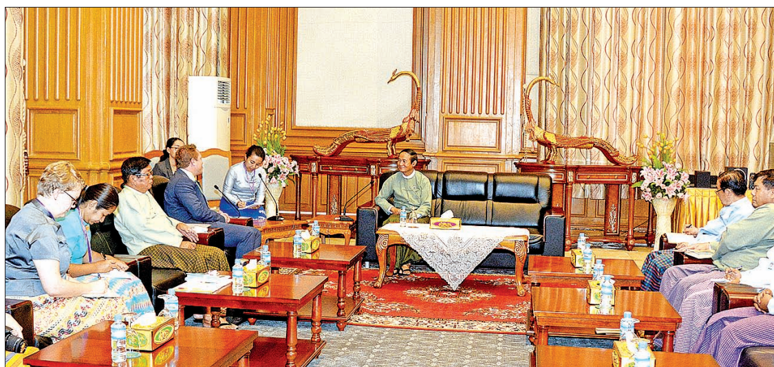
Speaker U Win Myint holds talk with Hanns Seidel Foundation (HSF).