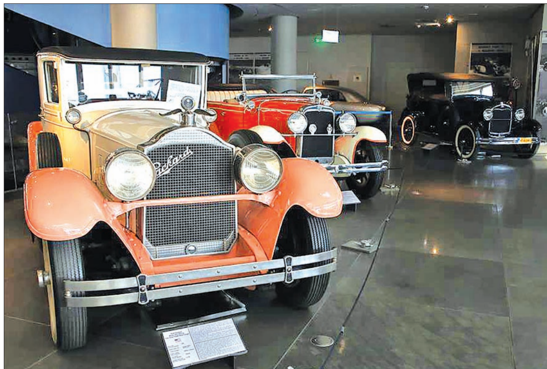
Classic cars are exhibited at the Motor Museum in Athens, capital of Greece, on 9 November, 2017. The Motor Museum collects 110 car models covering a history from the late 1800s to the end of the 20 th century.

“The idea behind the museum belongs to Theodoros Charagionis, founder of the museum. Everything started