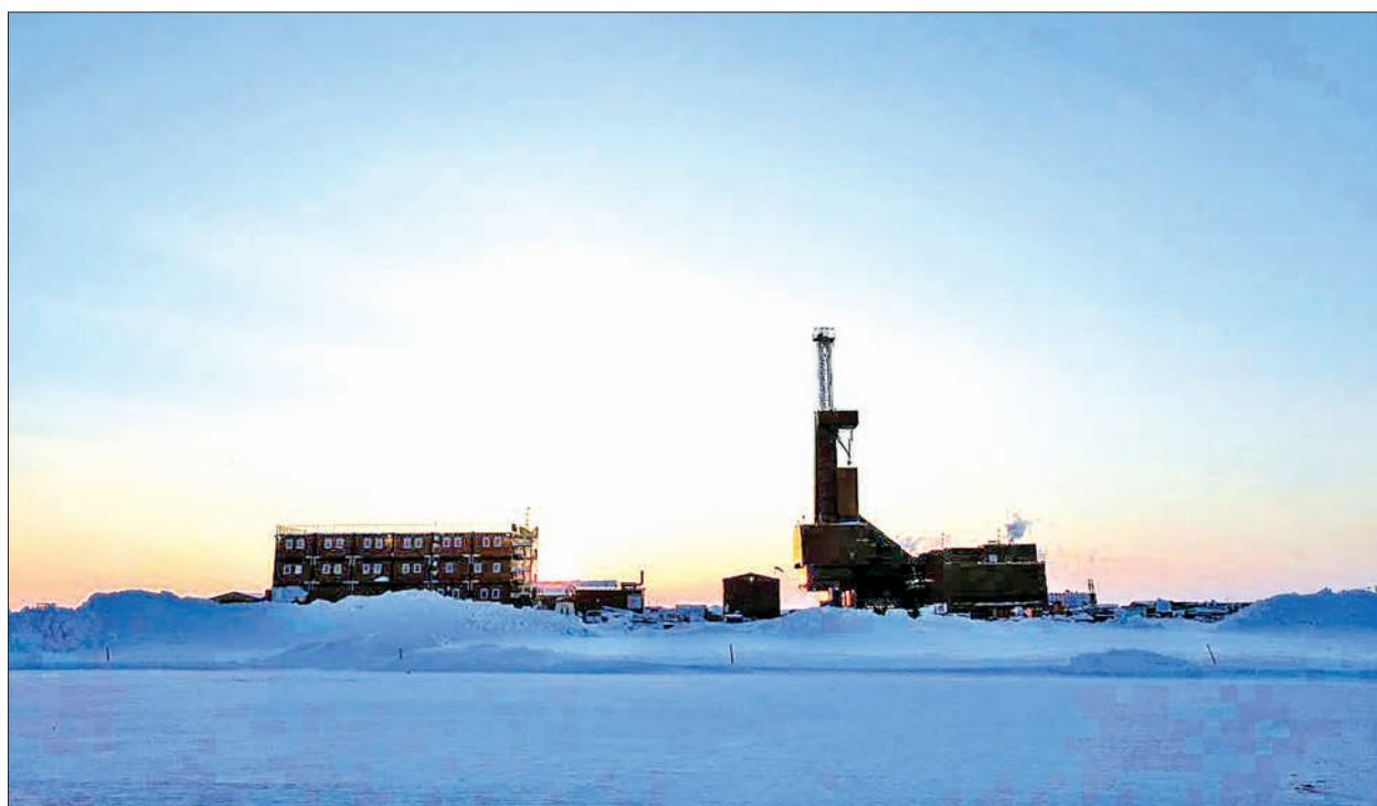
The sun sets behind an oil drilling rig in Prudhoe Bay, Alaska in 2011.

Murkowski, a Republican, introduced legislation on Wednesday that would create an oil and gas ex-