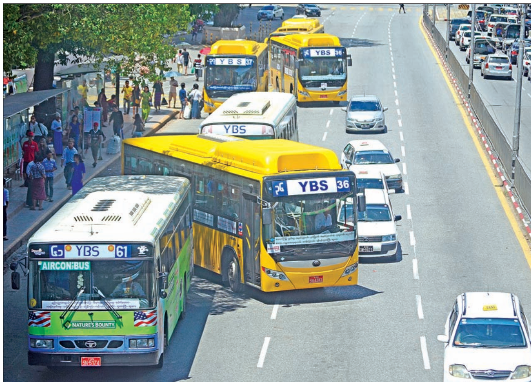
YBS buses seen in downtown Yangon.

Under the new arrangement, Golden Yangon City Co. (JYCT) will manage the operations of bus line Nos. 1, 9 and 16, while the No. 33 bus line will be under the management of Tran Link Co. Bus line Nos. 22 and 41