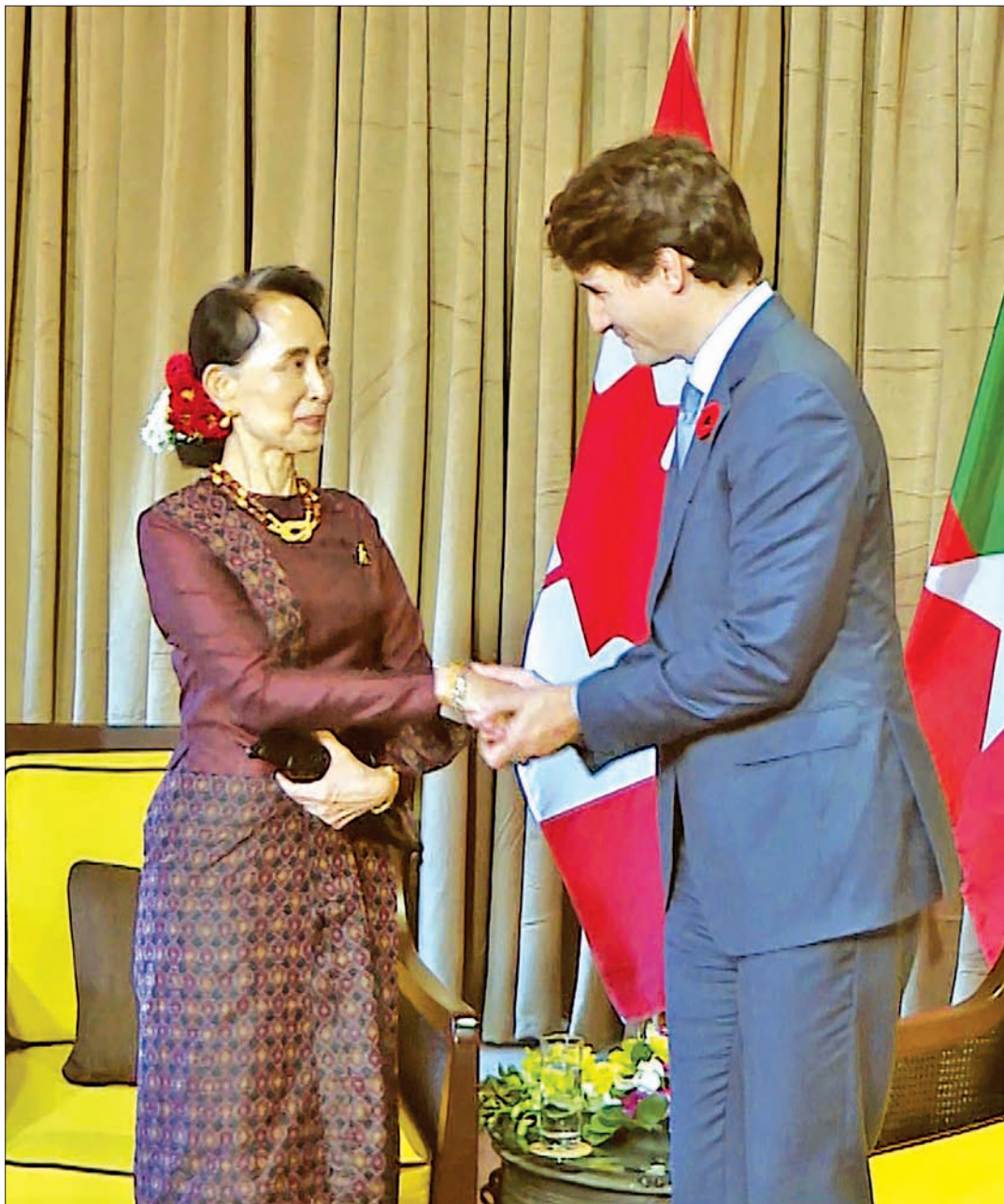
State Counsellor Daw Aung San Suu Kyi greets Mr. Justin Trudeau, the Prime Minister of Canada, at the Furama Resort in Da Nang, Viet Nam yesterday.

State Counsellor Daw Aung San Suu Kyi previously met with Mr. Justin Trudeau on 8 June in Ottawa, Canada and discussed bilateral cooperation.—Myanmar News Agency ■