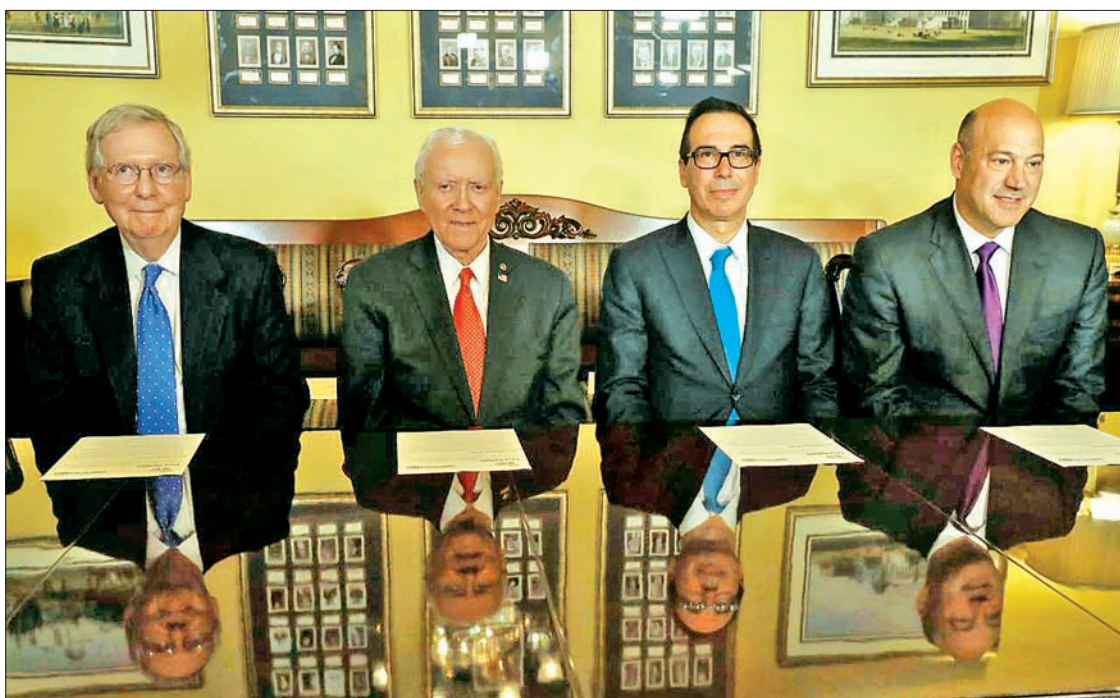
(L-R) Senate Majority Leader Mitch McConnell, Sen. Orrin Hatch, Treasury Secretary Steve Mnuchin and Director of the National Economic Council Gary Cohn introduce the Republican tax reform plan at the US Capitol in Washington, US, on 9 November 2017.

Despite an insistence by Republicans that their goal is