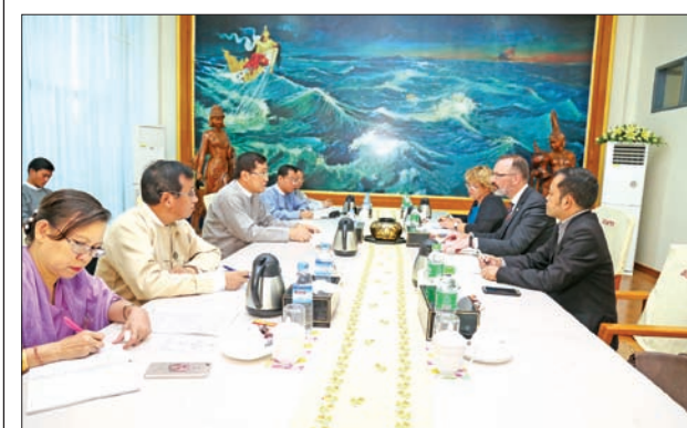
Union Minister Dr. Win Myat Aye holds talks with Minister Counsellor of the Embassy of Sweden to Myanmar Mr. Johan Hallenborg in Nay Pyi Taw.

itarian aids and support by UEHRD, starting youth policy plan implemented by youth volunteers from Myanmar across Rakhine State, negotiating processes of bilateral agreement between Myanmar and Bangladesh to repatriate Bangali, promulgated existing law for the resettlement, building the better social system according to the disaster management law and current implementing processes of social and economic development in the Rakhine State performed by Myanmar business associations.—MNA ■