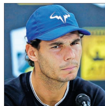
Spain's Rafael Nadal.

cause I’m having a great season with one event to go. I am here to try my best.”