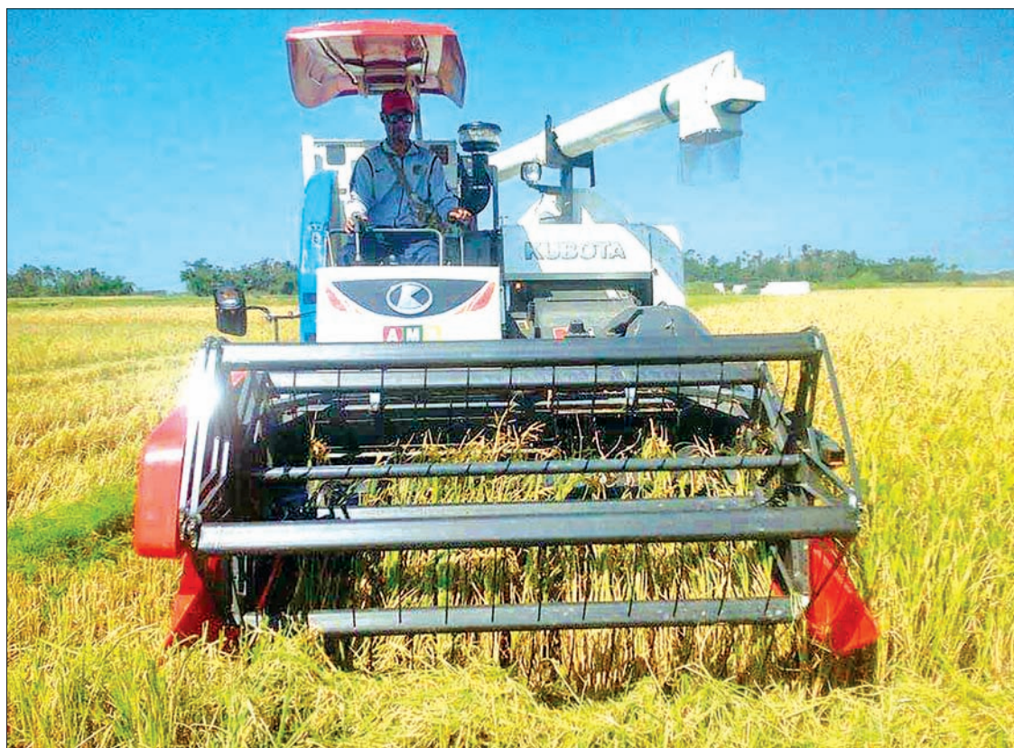
A worker harvests rice with the harvester in Maungtaw.

The Maungtaw region is an area where rice is planted extensively, and every year AMD