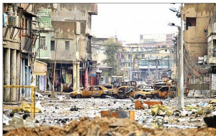
Cars burnt and destroyed by clashes are seen on a street during a battle between Iraqi forces and Islamic State militants, in Mosul, Iraq, on 16 March 2017.

It said the UN had recorded 461 civilian deaths from air strikes during the most intensive phase of the battle, from 19 February.—Reuters ■