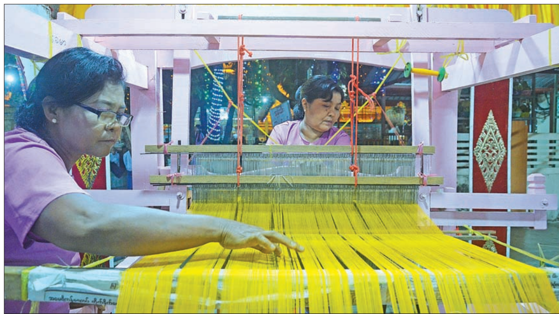
Women weaving at the Mathoe robe weaving contest with participation of religious associations at Shwedagon Pagoda on 2 November 2017.

THE 33rd Mathoe robe weaving contests took place at famous pagodas yesterday, including Shwedagon Pagoda in Yangon, with the participation of nine religious associations.