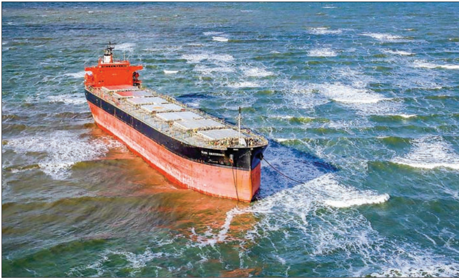
A handout picture provided 30 October 2017 by the German Central Command for Maritime Emergencies (Havariekommando) shows the Panama-flagged bulk carrier Glory Amsterdam which ran aground off the coast of Langeoog island in northern Germany.

BERLIN — A rescue team freed the grounded freighter “Glory Amsterdam” from a sandbar near the North Sea island of Langeoog and ruled out an oil leak, German authorities said on Thursday. Two large towing ships pulled the freighter to deep water and 16,000 tons of ballast water were pumped out of it, said Simone Starke, spokeswoman for Germany’s Central Command for Maritime Emergencies. Environmental and fishery groups warned of dire consequences to the Wadden Sea, a UNESCO World Heritage site, if the ship began leaking 1,800 tonnes of heavy oil and 140 tonnes of marine diesel on board but there was no damage to the hull, authorities said. “No leaking was