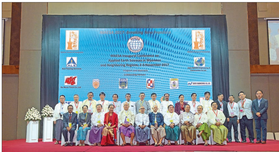
Foreign and local geologists, lecturers, officials from the Department of Meteorology and Hydrology and MEC pose for a documentary photo at the Breaking New Frontiers Conference.

"Capacity building relating to geology and earth science needs to be established for young people. This event also aims to encourage science