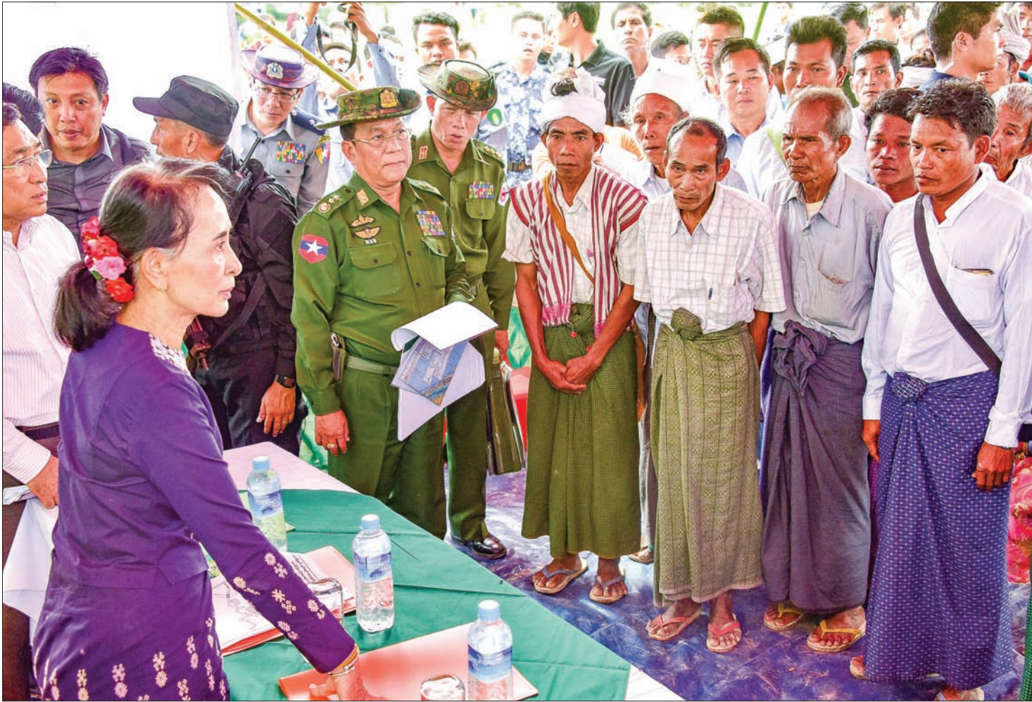
State Counsellor Daw Aung San Suu Kyi meets with Mro ethnic people from Khonhtaing Village in Maungtau yesterday.