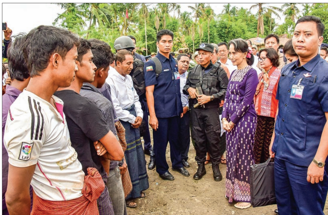
State Counsellor Daw Aung San Suu Kyi meets with Muslim residents from Pandawpyin Village in Maungtaung Township, Rakhine State, on 2 November 2017.