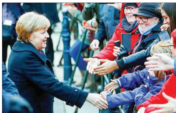
German Chancellor Angela Merkel shakes hands after the 500 th anniversary of the Reformation in front of the Castle Church in Wittenberg, Germany, on 31 October 2017.