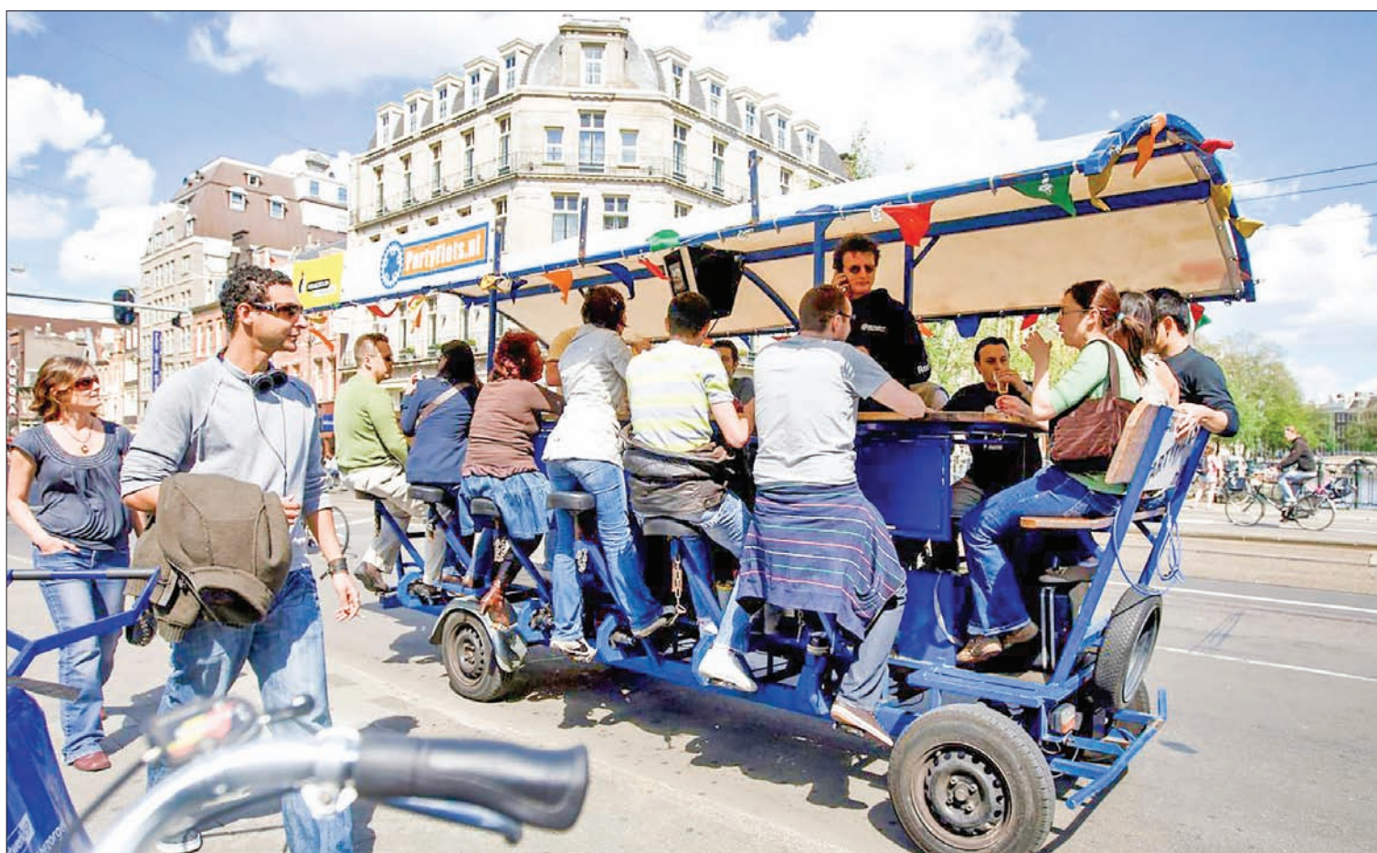
Tourists cycle as they drink beer and sing karaoke on a beer bike in Amsterdam in 2009.

Amsterdam is well known for its “red light” district with brothels and “coffee shops” selling marijuana, but the millions of annual visitors have long been a nuisance for residents.—Reuters ■