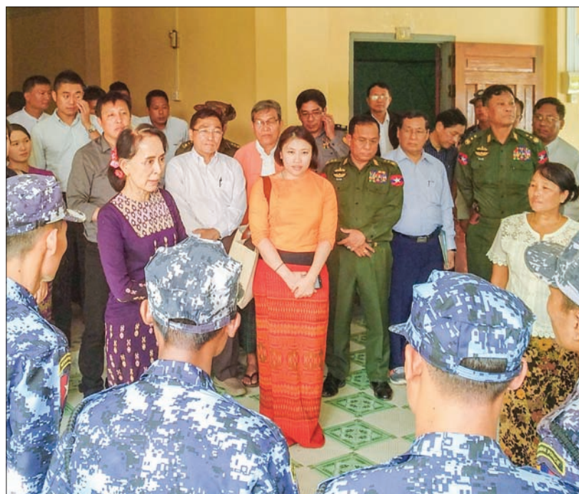
State Counsellor Daw Aung San Suu Kyi talks to border guard forces in Maungtaung, Rakhine State, on 2 November 2017.