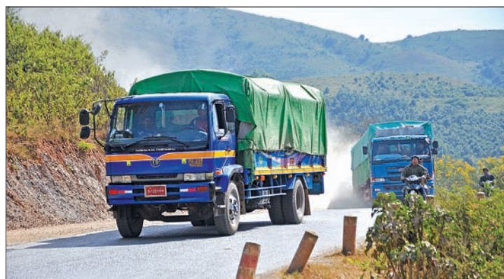
A file photo shows trucks run near 105-mile Muse border Trade Zone, northern Shan State.

The border trade values with ITCs as of 20 October this FY were over Ks1 billion in Tamu, over Ks16 million in Muse, Ks801 million in Tachilek, over Ks56 million in Lweje, over Ks4 million in Chinshwehaw, over Ks446 million in Kawthoung, over Ks434 million in Reed, over Ks1.13 billion in Mawtaung and Ks111 million in Keng