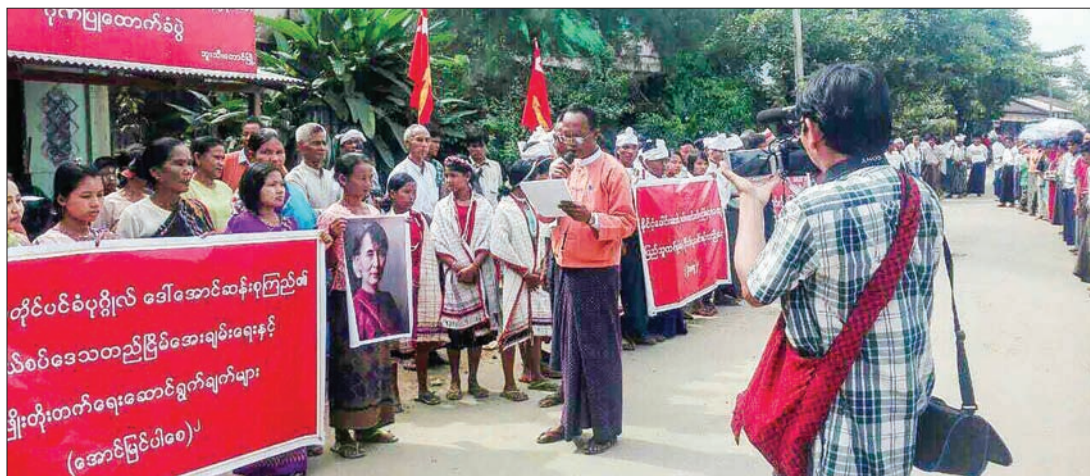
Local people take part in the rally in support of the State Counsellor's leadership.

She has pledged to allow the return of refugees who can prove they were residents of Myanmar. Daw Aung San Suu Kyi's spokesman voiced fears on Tuesday that Bangladesh could be stalling on the accord to first get millions of dollars of international aid money, an accusation a senior Bangladesh home ministry official has denied. —Myanmar News Agency ■