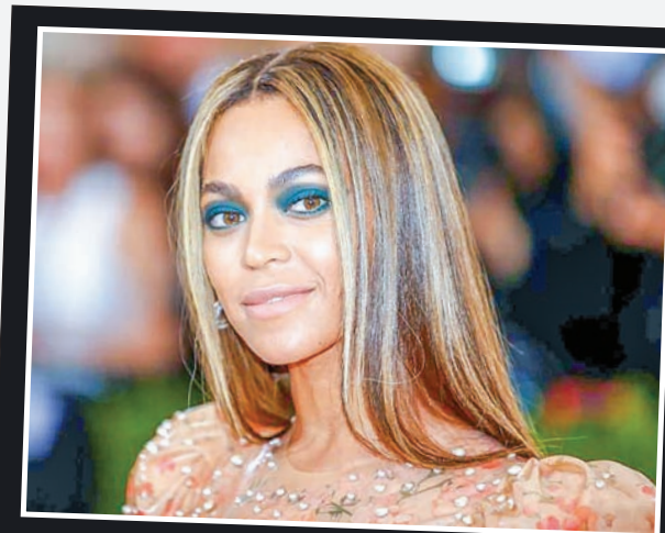
Singer-Songwriter Beyonce.

LOS ANGELES — Beyonce, actor James Earl Jones and comedian John Oliver are joining the cast of Walt Disney's new live-action film version of the "The Lion King", the studio said.