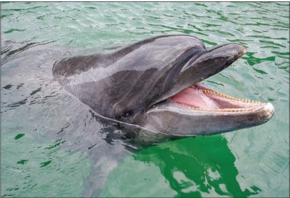
Supplied photo taken in October 2017 shows female bottlenose dolphin Nana, who died at an estimated age of 45-47 at Shimoda Aquarium in Shizuoka Prefecture on 31 October after around 43 years in human care, the longest in Japan, according to the facility operator.

said it will halt car shipments and production at all six of its car assembly plants in Japan, having found that invalid inspections had continued at most of the plants even after the misconduct surfaced in September. Nissan said it will finish reviewing its safety inspection processes at the remaining three plants by Friday. To prevent further misconduct, the automaker said it will carry out final inspections of their new vehicles in an isolated, enclosed area, which only certified inspectors are allowed to enter. Nissan also said it will conduct external audits once a week to check such inspections are held appropriately for the time being.—Kyodo News ■