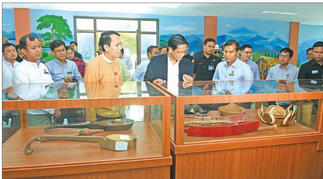
Vice President U Henry Van Thio and officials look at the displays of ethnic utensils at the Union National Races Village in Thakayta in Yangon.

lage was established with a view to strengthening national solidarity and union spirit by arranging for visitors to be able to study traditions and customs of the national races who have been living for ages in a place. Especially it is aimed at national consolidation. Matters on the Union National Races Village were discussed in the meetings of the ethnic, public service and management com-