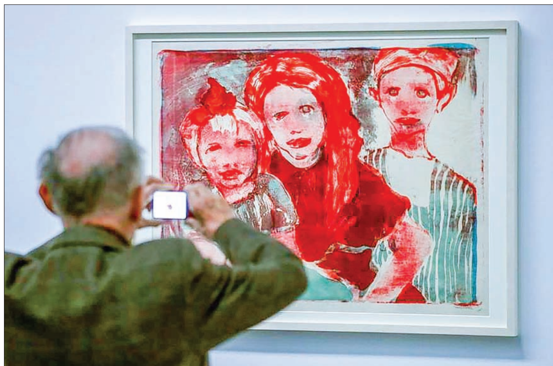
A man takes a picture of the lithograph “Fischerkinder” from 1926 by late German artist Emil Nolde during a media preview of the exhibition “Dossier Gurlitt: Degenerated Art confiscated and sold” at the Kunstmuseum in Bern, Switzerland, on 1 November 2017.

Its exhibition “Degenerate Art - Confiscated and Sold” is composed mainly of drawings, lithographs and paintings confiscated by the Nazis from museums and acquired by Hildebrand Gurlitt. “For the most part we know exactly when the works were confiscated, from which