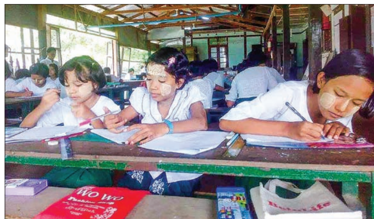
Students are seen at a school in Maungtaung Township.

An essay competition about the 97th national day was held at the Maungtaung Township education department yesterday morning. There are about 80,000 students in Maungtaung Township and 60,000 students in Buthidaung Township. ■