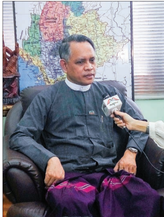
DICA Director General U Aung Naing Oo speaks during the interview with Myanmar News Agency.

A. The announcement of related rules and notifications immediately followed the enactment of the investment law on 18 October 2016. While the announcements were made, reforms were conducted at the same time to increase investment. Noticeable result was the investment amount reaching more than US$4.1 billion between 1 April and the end September in this fiscal year after the investment proposals were permitted and approved. This year's target was $6 billion, and