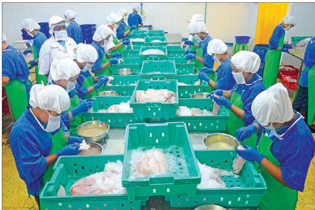
Workers processing fish to export at a marine product factory.