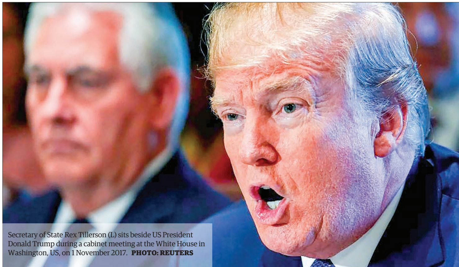
Secretary of State Rex Tillerson (L) sits beside US President Donald Trump during a cabinet meeting at the White House in Washington, US, on 1 November 2017.

WASHINGTON — President Donald Trump on Wednesday seized on the deadly New York City truck attack to step up demands for stricter US immigration laws, asking Congress to end a visa programme that let the Uzbek suspect into the country and saying he might send him to Guantanamo Bay.