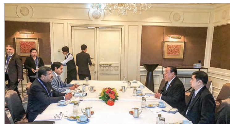
Union Minister U Win Khaing holds the sideline meeting with Indian counterpart Mr Shri Dharmendra Pradhan at the 7th Asian Ministerial Energy Roundtable.