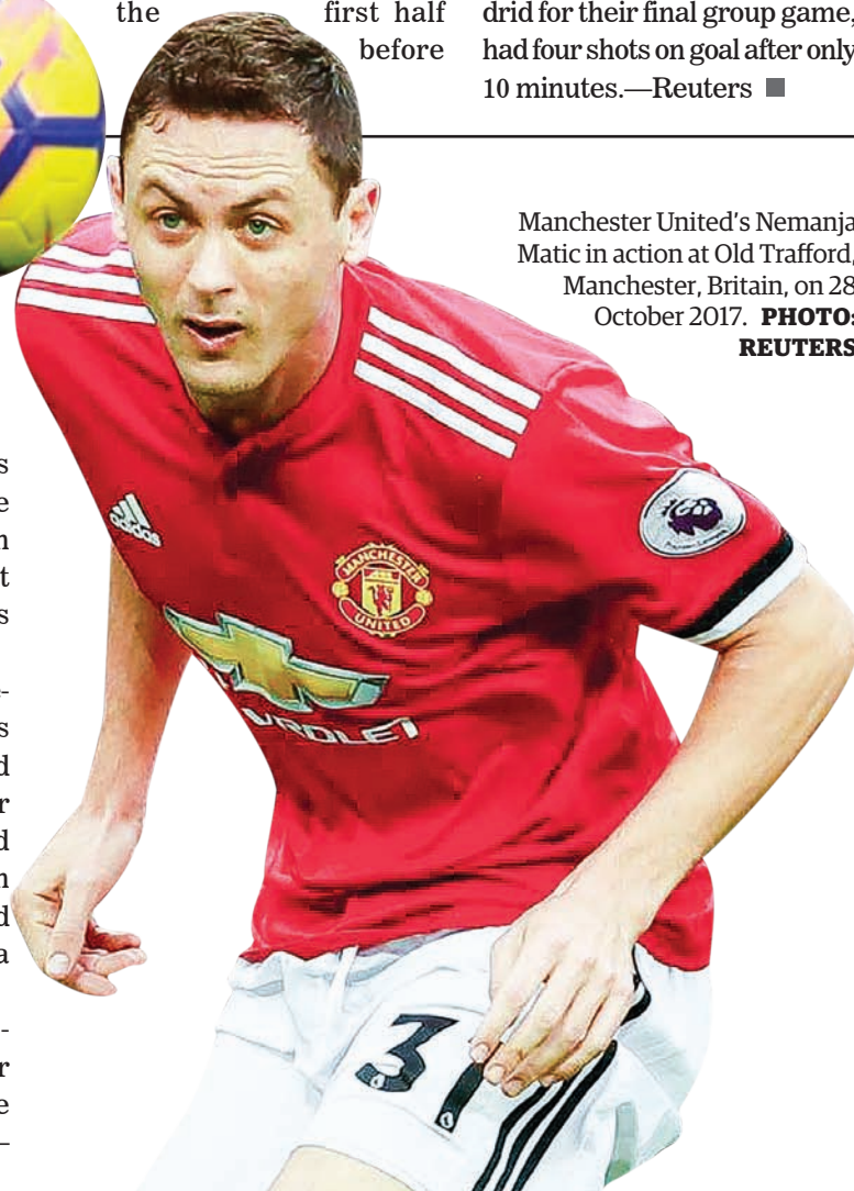
Manchester United's Nemanja Matic in action at Old Trafford, Manchester, Britain, on 28 October 2017.