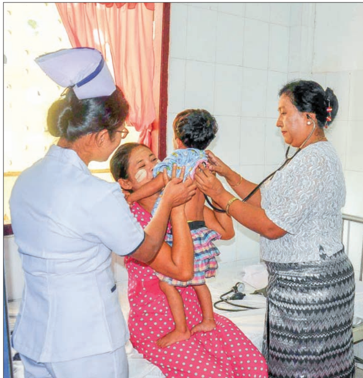
Doctor provide medical check-ups to a patient at the Buthidaung People's Hospital.

FREE healthcare services are being provided to patients of the Mro, Khami, and Daignet ethnic groups as well as Hindus and Muslims at Buthidaung People's Hospital in Rakhine State.