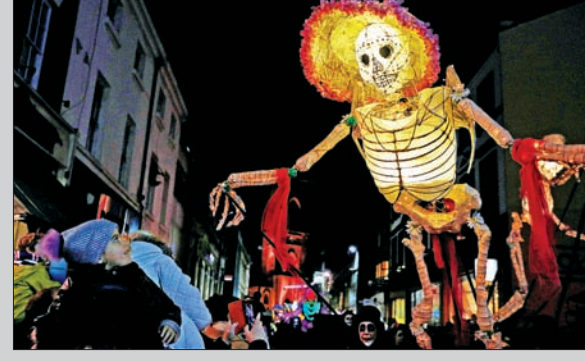
A child looks at a skeleton themed lantern during a Halloween lantern carnival in Liverpool, Britain, on 29 October 2017.

ago and is celebrated on 31 October, a day on which it is believed that ghosts of the dead retuned to