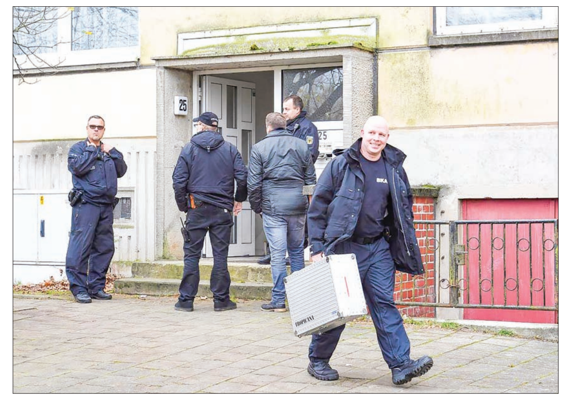
Police in front of a residential building in Schwerin, Germany on 31 October, 2017, after German police arrested a 19-year-old Syrian suspected of planning an Islamist-motivated bomb attack in Germany.

"According to the findings so far, Yamen A made the decision no later than July 2017 to detonate an explosive device in Germany in order to kill and injure as many people as possible," the prosecutor's office said in a statement. "As a result, he began to procure components and chemicals needed to make an explosive device. Whether the