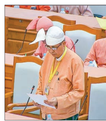
U Kyaw Myo, Deputy Minister for Transport and Communications.

time when the country needs to vigorously build infrastructure in the country. It is needed to carry out socio-economic development of the people, hence the need to acquire open season closely related in performing the tasks of purchasing and building of the Union, Region and State Governments. In changing financial years, conditions likely to occur at the very early stage will be able to be solved in many ways. But in the long run, it will result in sustainable good effects. As regards to the change of the financial year, process to be performed will be carried out between the Union Government and Hluttaw. There will be occur-