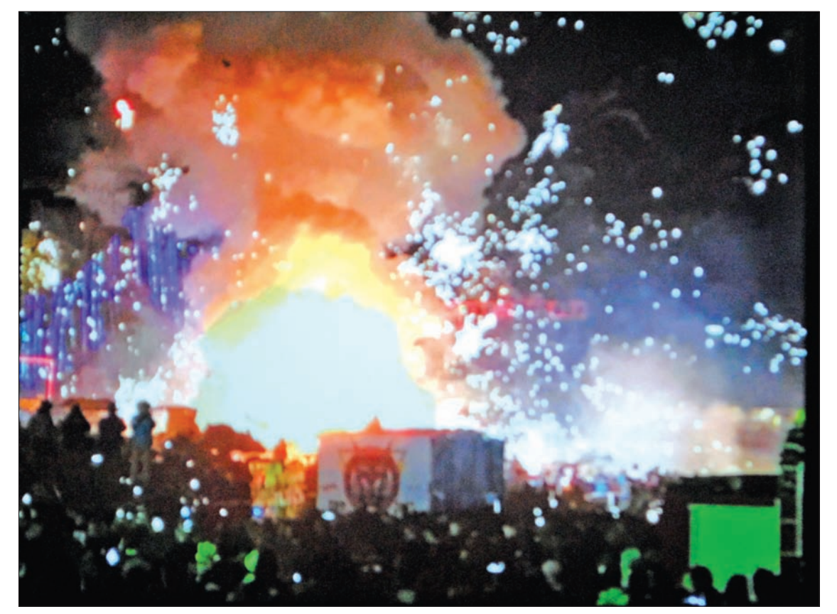
Seven injured people due to a falling balloon during Taunggyi balloon festival.

Taunggyi's popular annual balloon festival and