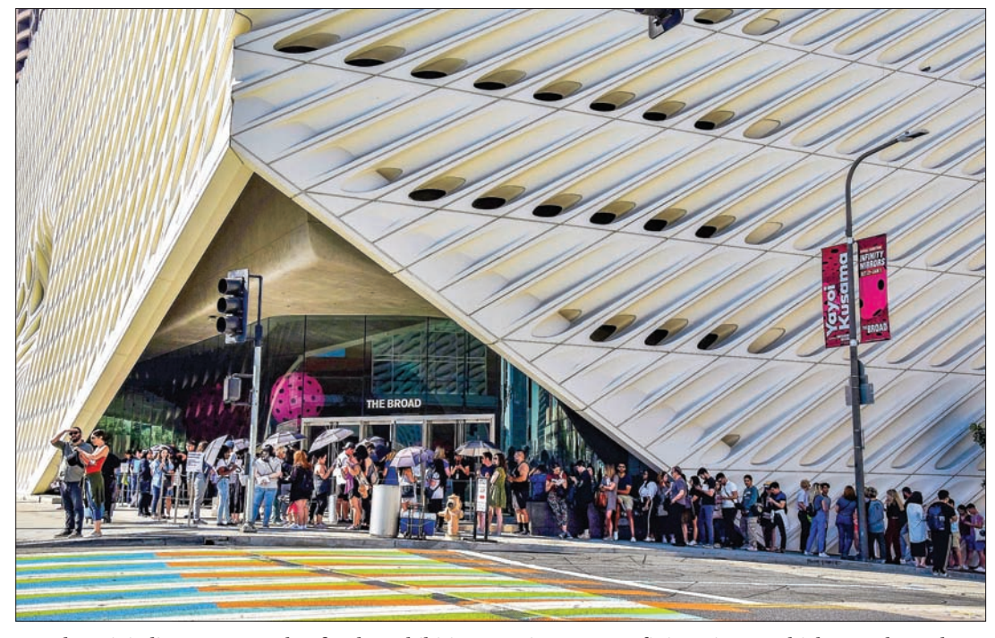
People wait in line on 27 October for the exhibition Yayoi Kusama: Infinity Mirrors, which runs through 1 January at The Broad contemporary museum in Los Angeles.

The Broad subsequently released 40,000 additional tickets on 2 October. Those also sold out within hours. The museum then announced that about 50,000 standby tickets would be made available throughout the entire exhibit's run. Admission to The Broad's permanent galleries is free. But for this special exhibit, advance tickets sold for $25, while standby tickets are $30.—Kyodo News ■