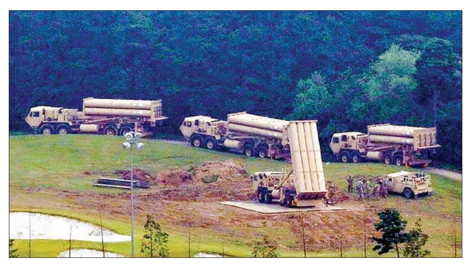
Terminal High Altitude Area Defence (THAAD) interceptors are seen as they arrive at Seongju, South Korea on 7 September, 2017.

South Korea's President Moon Jae-in will hold a summit meeting with China's President Xi Jinping on the sidelines of an upcoming summit of Asia-Pacific Economic Cooperation (APEC) countries in Viet Nam on 10-11 November, a Blue House official said in a separate briefing on Tuesday. In a coordinated statement, China's foreign ministry said the two countries have agreed to get their relations back onto a normal track "at an early date". South Korea recognises China's concerns on the