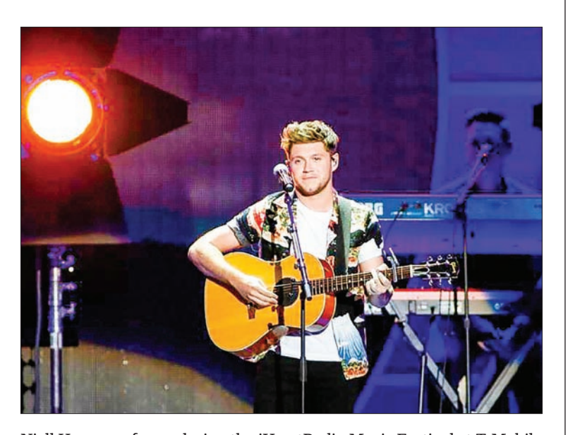
Niall Horan performs during the iHeartRadio Music Festival at T-Mobile Arena in Las Vegas, Nevada US on 23 September, 2017.

New debuts in the top ten of the Billboard 200 album chart this week included rappers Future and Young Thug's collaborative album "Super Slimey" at No