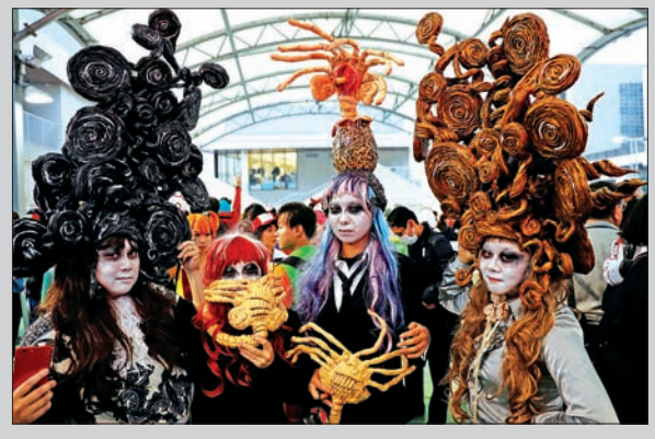
Participants in costumes pose during a Halloween event in Kawasaki, south of Tokyo, Japan on 29 October 2017.