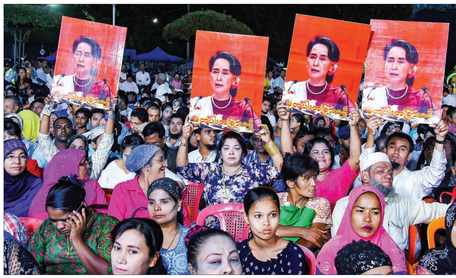
Muslim residents in Yangon hold portraits of Daw Aung San Suu Kyi as they participate in the interfaith rally.

Officials and representatives from all religions held candles, and prayed for peace.