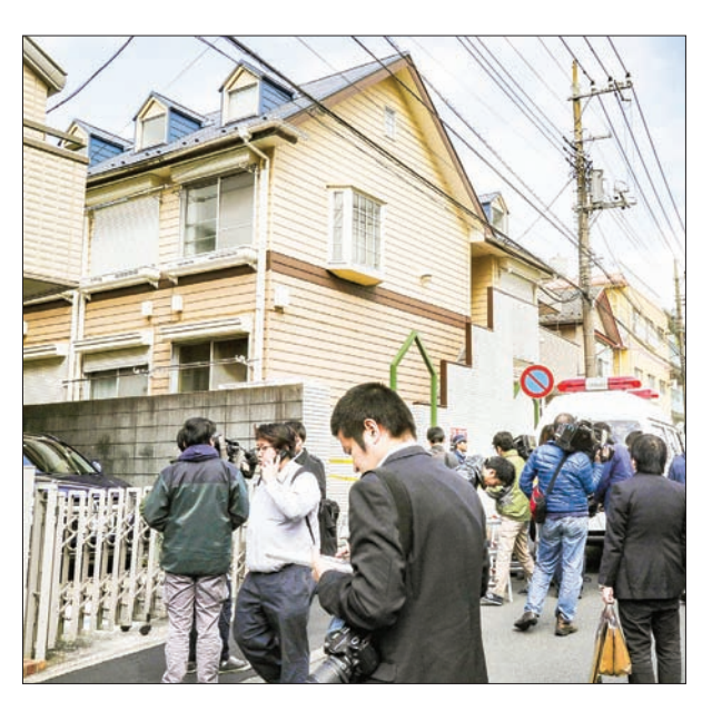
Reporters gather in front of an apartment house in Zama, Kanagawa Prefecture on 31 October, 2017 where police found nine bodies in one of its units.

According to the Metropolitan Police Department, Shiraishi told investigators he killed the woman soon after they first met. The body parts, found inside cold-storage containers and tool boxes, apparently belonged