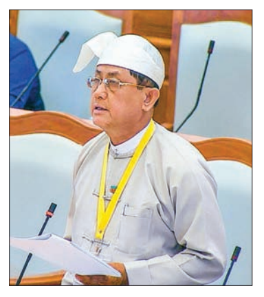
U Maung Maung Win, Deputy Minister for Planning and Finance.

And, U Maung Maung Win, Deputy Minister for Planning and Finance clarified, "The major cause of changing Myanmar's financial year is that now is the