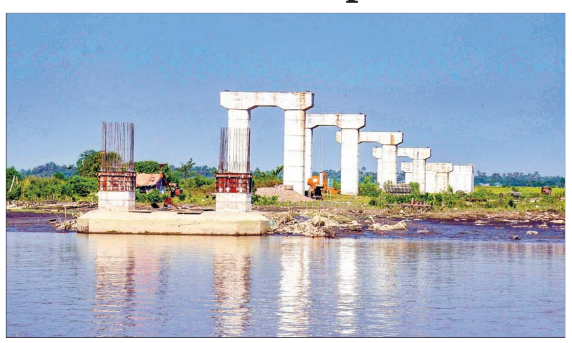
The construction of Kyetsin river bridge seen in Rakhine State.

FIFTY-FOUR per cent of the Kyetsin River Bridge construction that began in 2014 is complete, officials said yesterday.