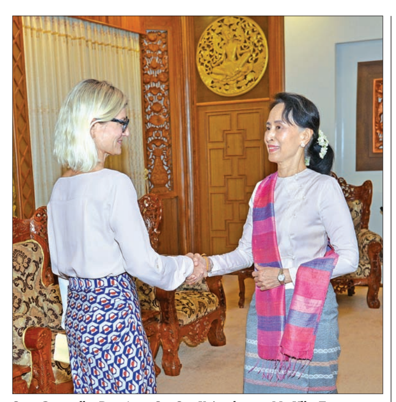
State Counsellor Daw Aung San Suu Kyi welcomes Ms. Ulha Toernaes, Minister for Development Cooperation of Denmark.

1 NOVEMBER 2017 THE GLOBAL NEW LIGHT OF MYANMAR NATIONAL 3