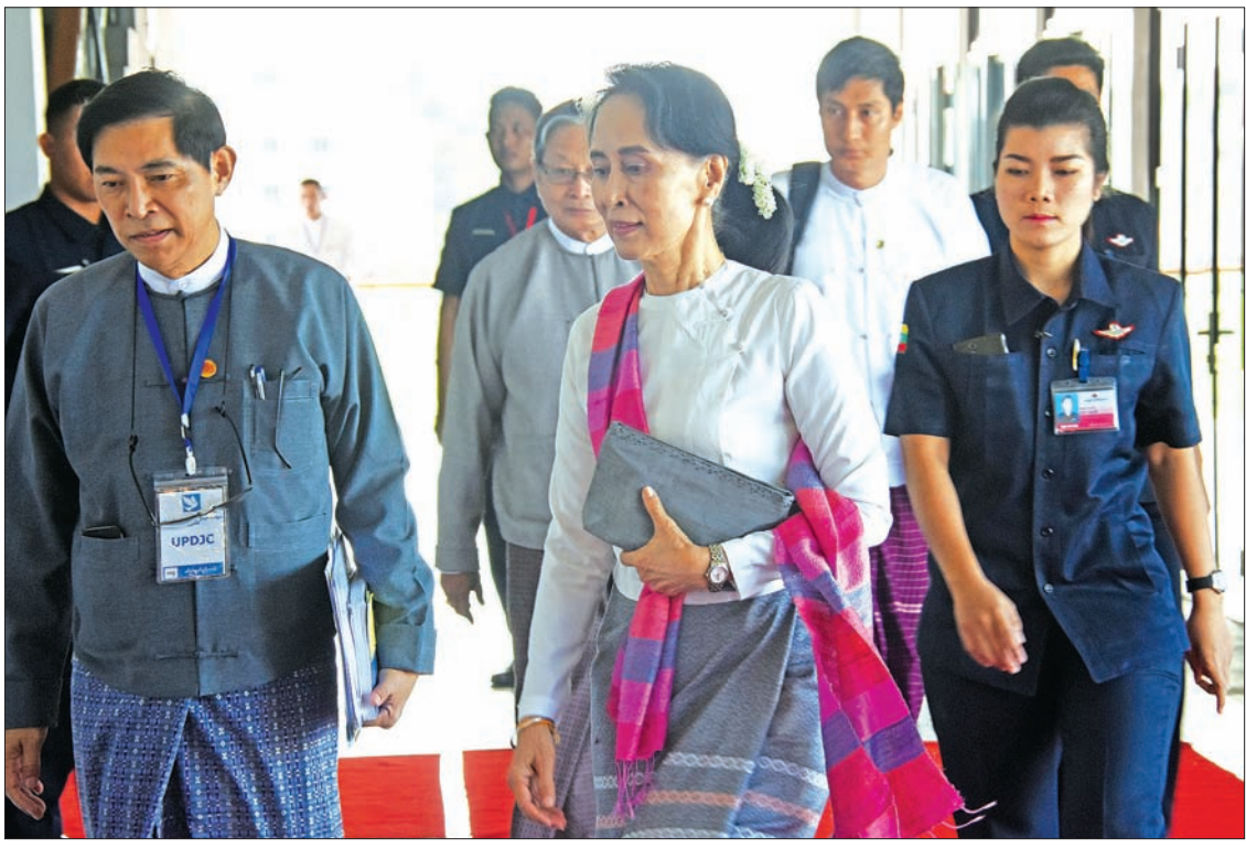
State Counsellor Daw Aung San Suu Kyi arrives to attend the 12<sup>th</sup> meeting of the Union Peace Dialogue Joint Committee in Nay Pyi Taw, on 31 October 2017.

During the meeting, they exchanged views on matters relating to Denmark's assistance to Myanmar as well as challenges and needs occurring in Rakhine State.—Myanmar News Agency